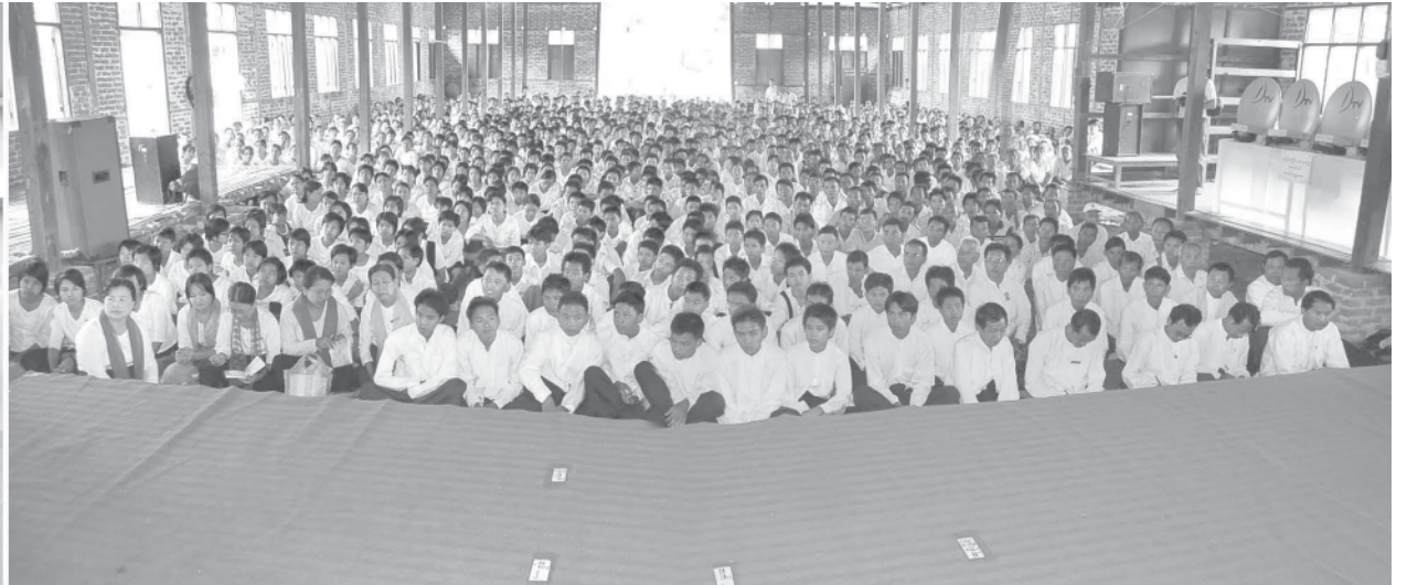
Minister Brig-Gen Kyaw Hsan addresses the ceremony to present prizes to distinction-winning students of Pale Township in matriculation examination of 2008-2009 academic year.

logical studies, he said, calling on students to study hard in technological subjects to become reliable and responsible citizens. Self-reliant village libraries are being set up in compliance with the guidance of the