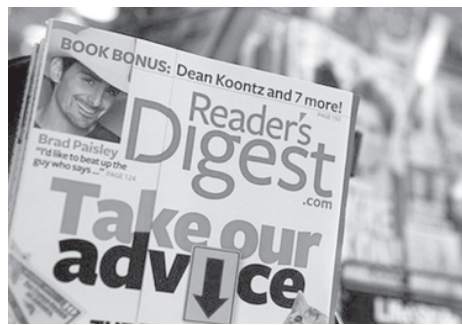
A copy of Reader's Digest magazine is displayed on a rack at a grocery store on 17 Aug, 2009 in San Anselmo, California. Reader's Digest, publisher of the monthly magazine which claims the largest circulation in the world, filed for bankruptcy protection on Monday in an agreement with its major lenders.