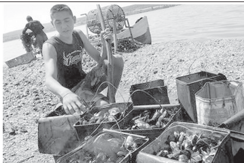
Bulgarian collect sea mussels near a heavy industry area where the mussel collecting is against the law in the Black Sea town of Varna, east of the Bulgarian capital Sofia, on 24 Aug, 2009.