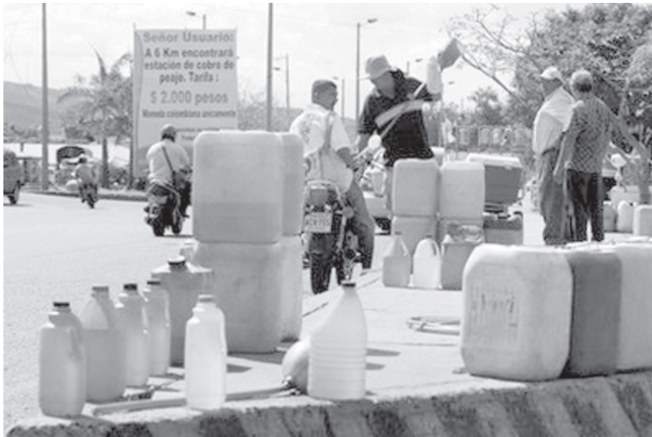
Colombians fill up a motorbike with smuggled gasoline in Cucuta, Colombia, on the border with Venezuela. In Venezuela the price of oil is 50 times cheaper than in Colombia, and due to the crisis between both countries, Colombians started smuggling along the border. Venezuela will not renew a recently-expired deal that provided Colombia gasoline at cut-rate prices.