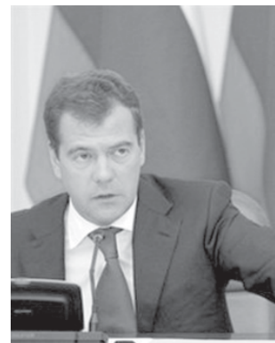
Russian President Dmitry Medvedev, pictured, arrived in Mongolia on Tuesday for a two-day visit focused on sealing a series of investment deals including one on a joint venture in uranium mining.—INTERNET

ULAN BATOR, 25 Aug—Russian President Dmitry Medvedev arrived in Mongolia on Tuesday for a two-day visit focused on sealing a series of investment deals including one on a joint venture in uranium mining.