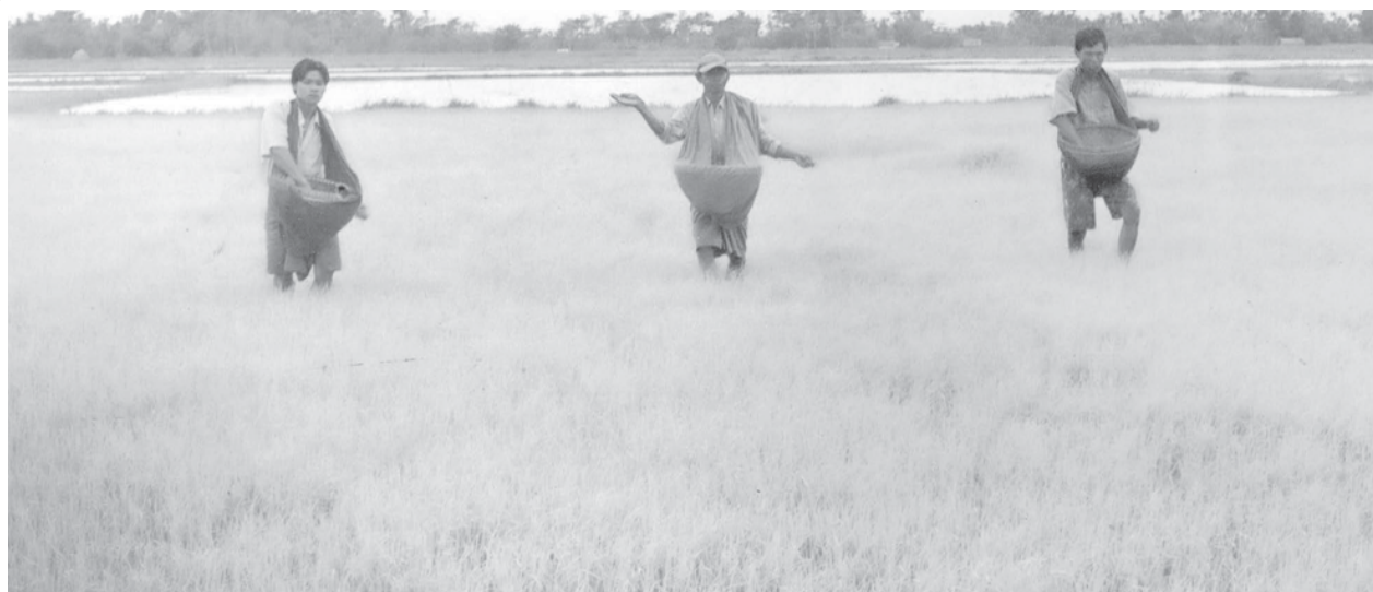
Broadcasting of fertilizer at the farmlands in Betuk Village of Labutta Township.