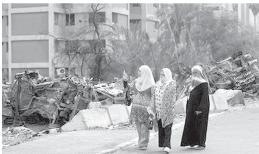
Iraqi women walk past destroyed vehicles still strewn on a street in central Baghdad, four days after a truck bombing targeted the foreign ministry building, on 23 Aug, 2009. At least 10 people were killed and 19 wounded, including women and children, when bombs exploded on two buses near Iraq's southern city of Kut on Monday, a police officer told AFP.