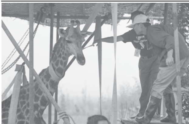
Staff workers prepare to do transfusion for Feifei, a sick female giraffe, at Hefei Wildlife Park in Hefei, capital of east China's Anhui Province, on 24 Aug, 2009. Feifei, a two-year-old giraffe from Africa, received treatment as it infected hypoglycemia and parasitosis.