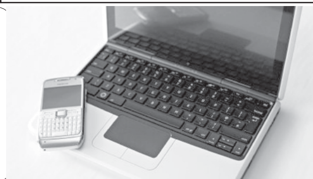
Nokia's new netbook computer, the Booklet 3G, is seen next to a Nokia handset at corporate headquarters in Helsinki on 24 Aug, 2009.

However, exports, the driving force of the German economy, were down 1.2 percent compared to the first quarter and imports slumped by 5.1 percent.