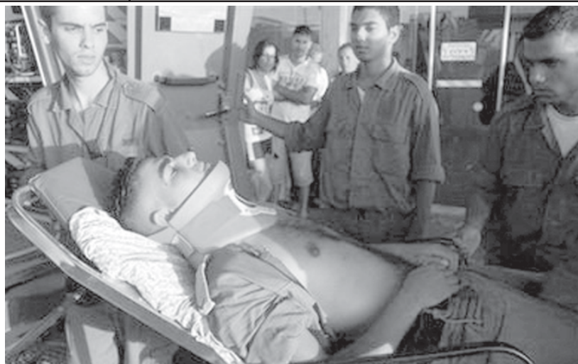
A lightly wounded Israeli soldier is taken for treatment at Barzilai hospital in Ashkelon in southern Israel after mortars were fired by Palestinian militants from the Gaza Strip, on 24 Aug, 2009. At least two Palestinians and two Israelis have been injured in violence on the Gaza-Israel border.

The unexpected intrusion by US helicopters spread fear among the local residents, NNI said.