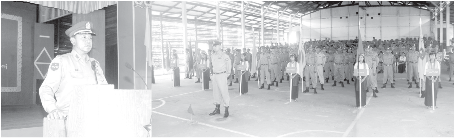
Commander of Mingaladon Airbase delivers address at opening of 17th Commander-in-Chief (Air)'s Shield Boxing Championship.

The championship will be held up to 28 August.—MNA