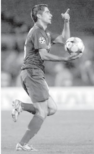
Brazilian defender Sylvinho

MANCHESTER, 25 Aug—Big-spending Manchester City have signed veteran