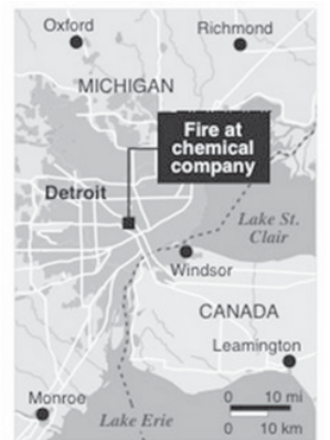
Map locates Detroit chemical plant fire.