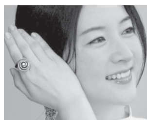
South Korea's actress Lee Young-ae

SEOUL, 25 Aug—South Korean actress Lee Young-ae, leader of Hanryu, or the Korean wave, has married a South Korean businessman in the United States, her legal consultant said on Tuesday.