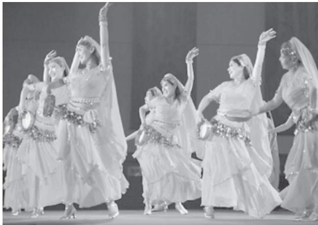
The dancing group from Haidian district performs attractive dancing of Xinjiang Uygur ethnic group during a dancing competition held by Niujie Street in Beijing, China, on 25 Aug, 2009. 12 dancing groups from the districts of Xuanwu, Xicheng, Haidian and Miyun attended the final contest Tuesday.