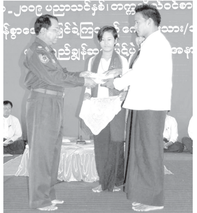
Minister Brig-Gen Kyaw Hsan presents prize to a five-distinction-winner of Pale Township in matriculation examination of 2008-2009 academic year.

He presented gifts to the outstanding students. In the 2008-2009 academic year, Pale Township saw one six-distinction winner, one five-distinction