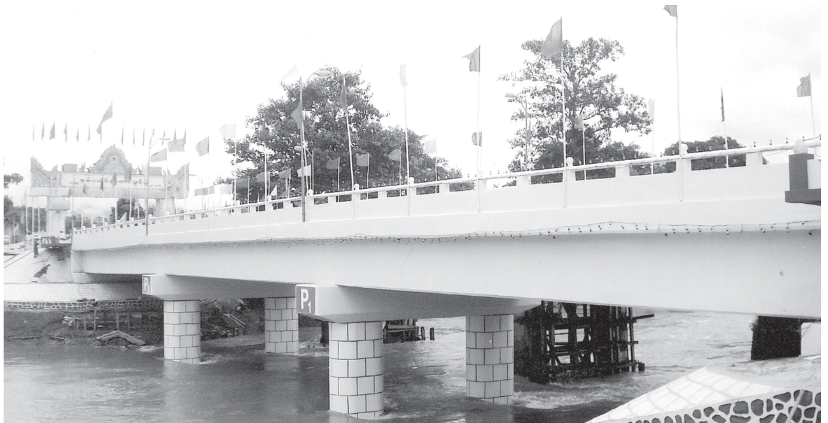
Newly constructed Nampaung Bridge across Nampaung River in Nampaung Village, Lashio Township.

The commander made a speech on the occasion. Next, the deputy minister briefed the com-