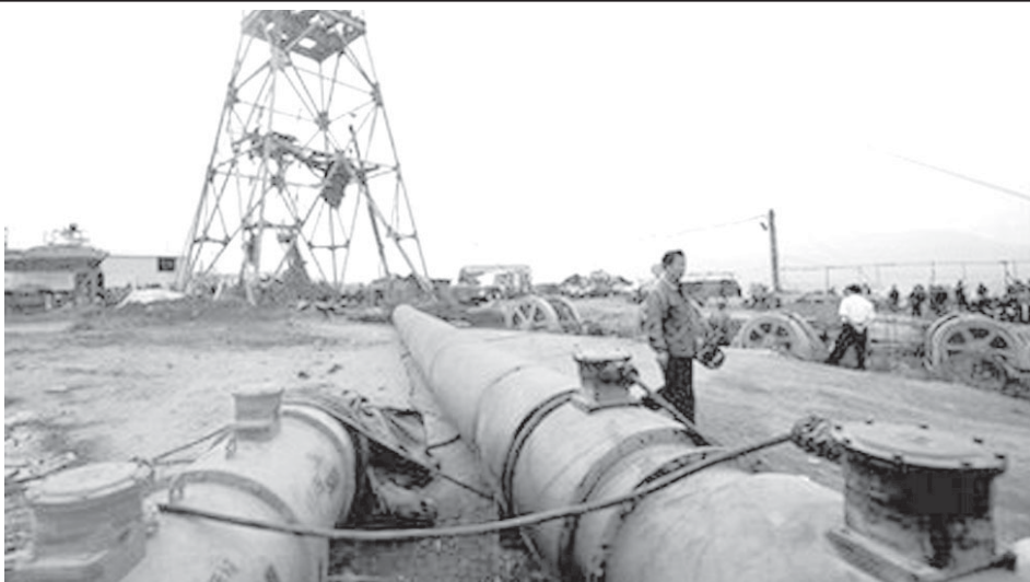
A man walks past a pipe sending fresh air into a pit of a coal mine operated by the Xinguang Coal Industry Co in Heshun County, north China’s Shanxi Province, on 25 Aug, 2009.