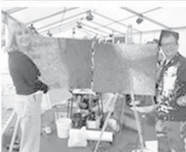
On 28 August 2005, as part of the Edinburgh Fringe Festival, Rolf Harris brought together 120 artists at The Mound, Edinburgh, beside the National Galleries of Scotland, to recreate Leonardo Da Vinci's Mona Lisa on a 9-metres x 6-metre canvas.