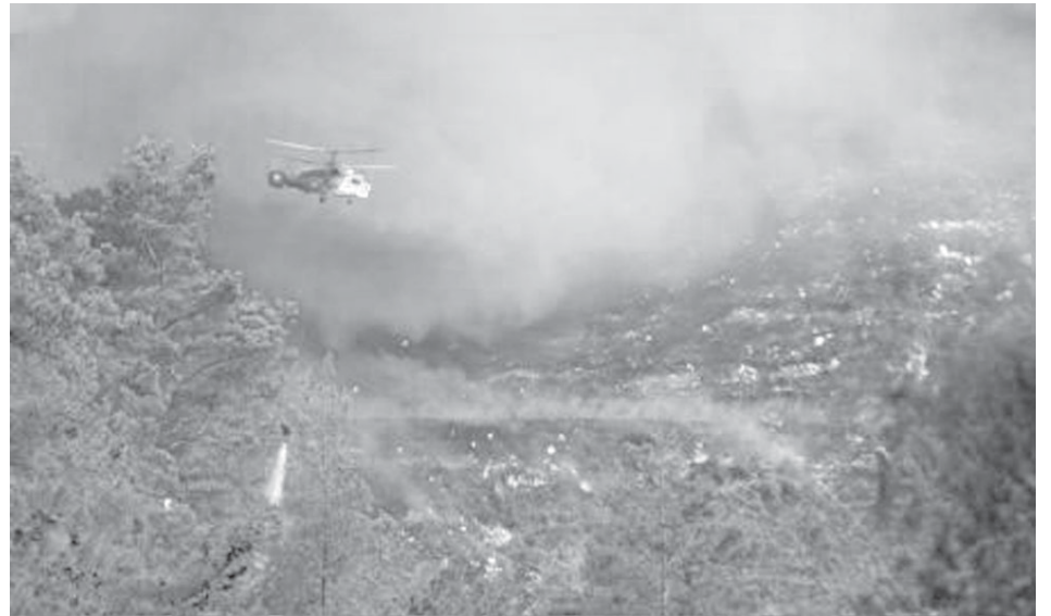
A water bomber sprays water to extinguish fire in Antalya, Turkey, on 24 August, 2009. As many as 150 hectares of forest have been affected so far by the raging fire in Antalya. —XINHUA