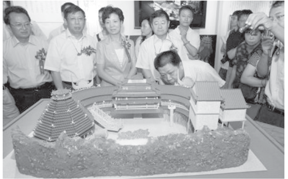
Guests visit model of the Guizhou pavilion for the 2010 Shanghai World Expo, in Shanghai, east China, on 24 Aug, 2009. The promotion week of Guizhou of the Shanghai World Expo kicked off here on Monday.