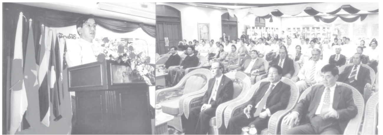
Minister U Nyan Win addresses the Mekong-Japan Friendship Exchange for 2009 and Photo Exhibition for Myanmar Tourism Promotion.

YANGON, 25 Aug— Organized by the Ministry of Foreign Affairs, a ceremony to commemorate the Mekong-Japan Friendship Exchange for 2009 and a Photo Exhibition for Myanmar Tourism Promotion was held at the Chatrium Hotel in Natmauk Street on 24 August. Present on the occasion were Minister for Foreign Affairs U Nyan Win, Deputy Minister for Hotels and Tourism Brig-Gen Aye Myint Kyu, Japanese Ambassador Mr. Yasuaki Nogawa, Ambassadors and their spouses from the Mekong, ASEAN and neighbouring countries,