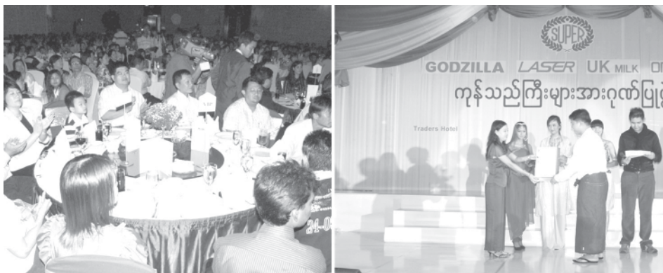
Ceremony to honour wholesale sellers of Super Coffee Mix in progress.