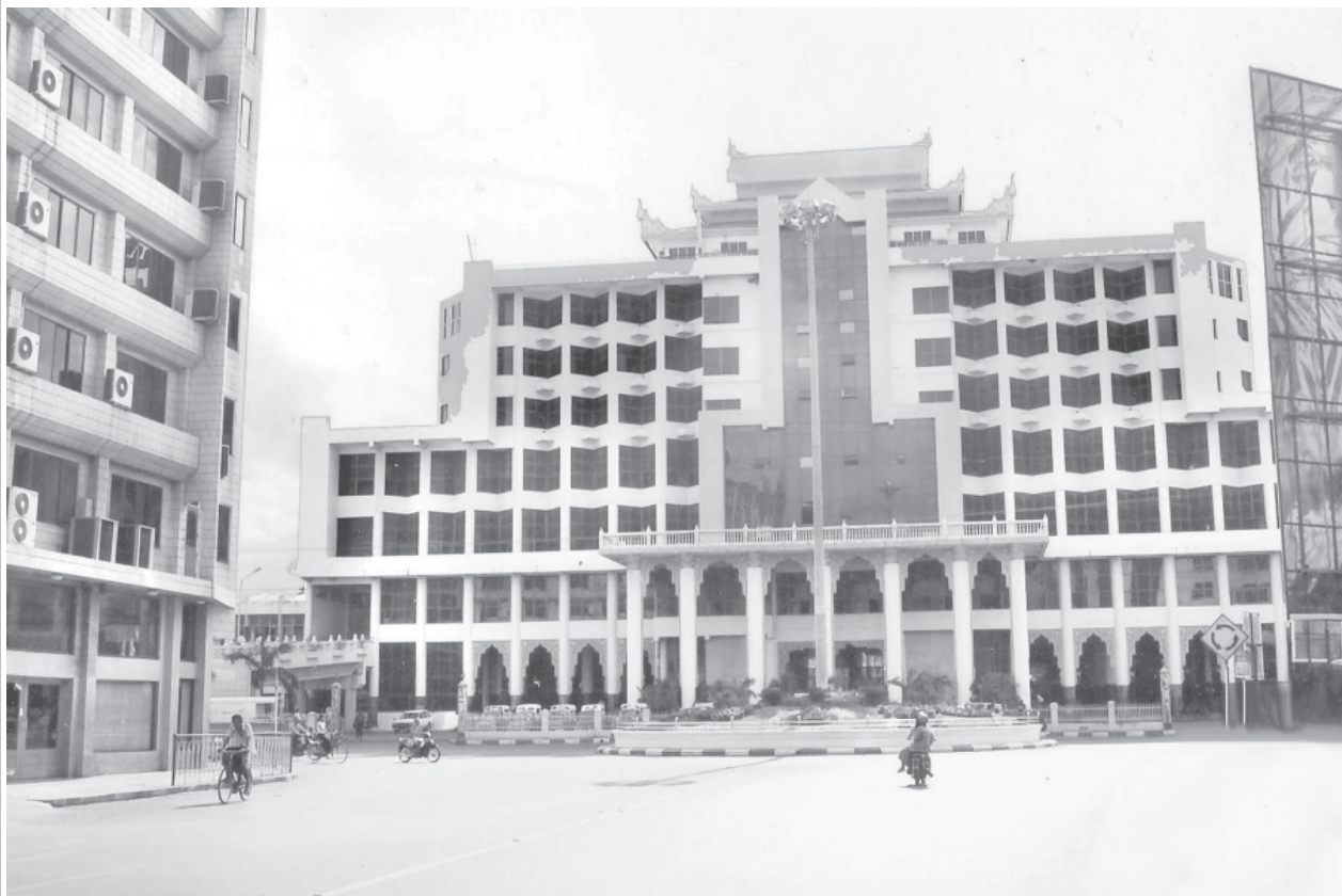
Mandalay Central Railway Station.

Article: Myint Maung Soe; Photos: Myo Min Thein (Mayangon)