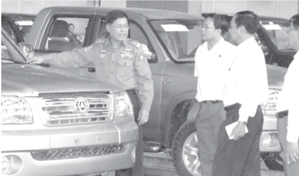
Minister Vice-Admiral Soe Thein inspects cars manufactured by No.2 Automobile Factory (Htonebo).—MNA

NAY PYI TAW, 24 Aug—Minister for Industry-2 Vice-Admiral Soe Thein, on 22 August, visited No.2 Automobile Factory (Htonebo) where he inspected assembly shop, paint shop, press shop, machine shop and piston production shop