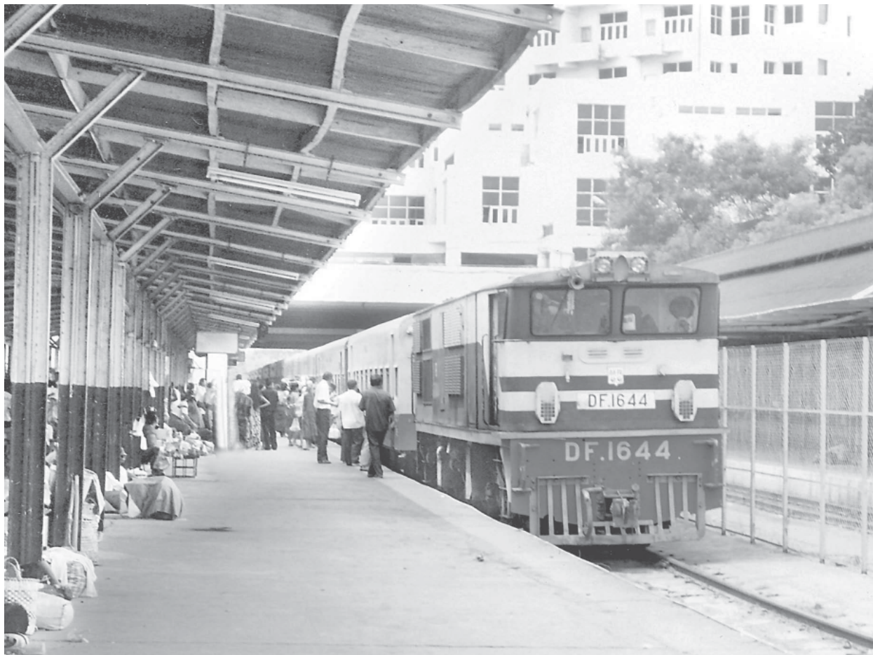
An express train seen before departure from Mandalay Central Railway Station to Myitkyina.