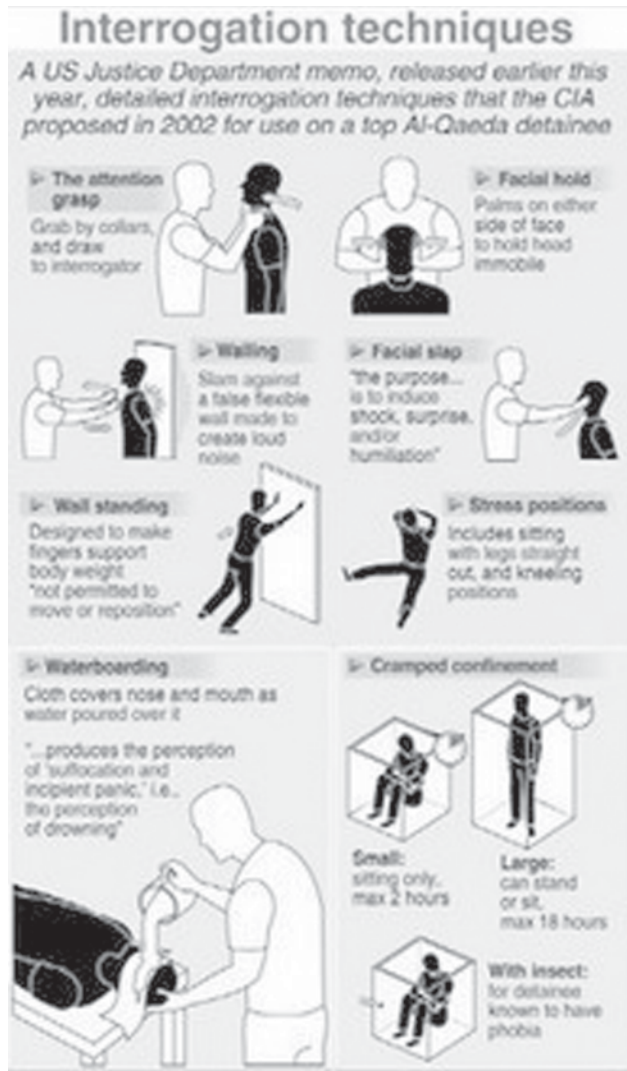
Graphic showing interrogation techniques that have been detailed by the CIA, and made public in a US Justice Department memo that was released in April.