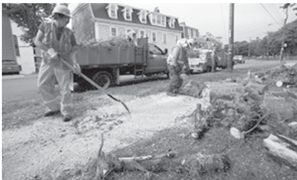
St John's municipal workers clean up following Tropical Storm Bill which blew into St John's early on 24 Aug, 2009. There were only minor damages from the high winds as Bill quickly passed over the Avalon Peninsula.—INTERNET

“We have a programme in China to promote agroforestry linked to the government policies. The government has a land composition programme which encourages farmers to plant trees on farms for the benefits of farmers,” Xu told Xinhua on the sidelines of the second World Congress on Agroforestry in Nairobi.— Xinhua