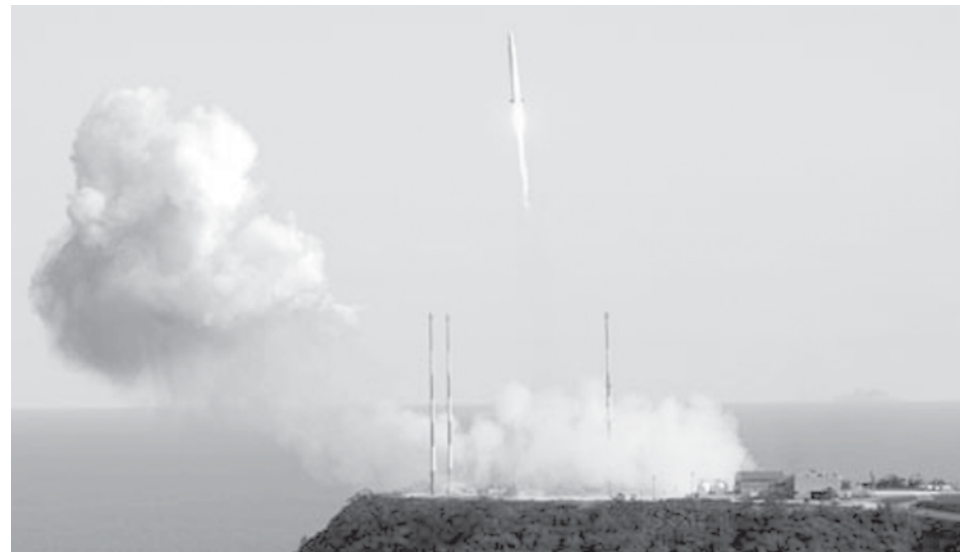
The Korea Space Launch Vehicle-1 (KSLV-1) is launched from its launch pad at the Naro Space Center in southern South Korea, on 25 Aug, 2009. South Korea's satellite seems to have not entered its target orbit after successfully separating from its carrier rocket, South Korea's science minister said Tuesday.—INTERNET

Boeing refused to hand the code over once the mistake was noticed, citing intellectual property rights.— Internet