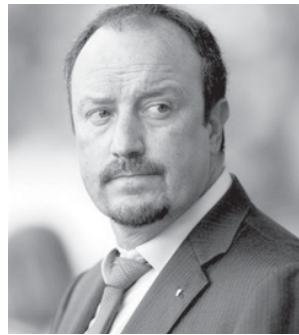
Liverpool's Spanish manager Rafael Benitez

Benitez lost key midfielder Xabi Alonso to Real Madrid in the summer and has only managed to bring in