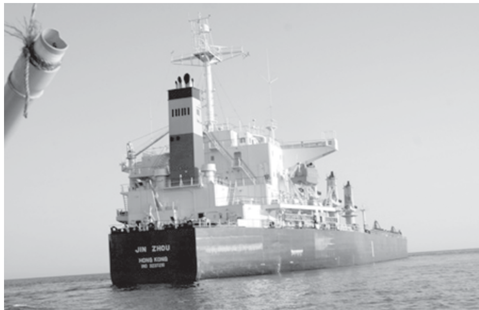
Chinese Hong Kong freighter Jin Zhou berthes at the port of Karistos, Greece, on 5 Aug 2009. The cargo freighter of Jin Zhou clashed with a Greek freighter on 4 Aug, with both slightly damaged in the accident.