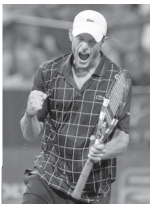
Andy Roddick celebrates a point in the final game against Sam Querrey during day 4 of the Legg Mason Tennis Classic at the William HOG. FitzGerald Tennis Center, on 6 August, in Washington, DC.

Roddick became the 36th Open-Era player to reach 500 match triumphs and the fourth active player at the mark, the ninth-year professional joining Federer with 657, Spain's Carlos Moya on 573 and Australian Lleyton Hewitt with 511.