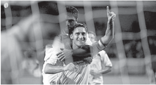
Roma's Francesco Totti celebrates after scoring a goal during the return leg of the third round qualifying match for the UEFA football Europe League game KAA Gent vs AS Roma.

Galatasaray of Turkey, coached by former Barcelona boss Frank Rijkaard, crushed Israel's Maccabi Netanya 6-1 for a 10-1 aggregate with Congo striker Shabani Nonda grabbing a hat-trick. Veteran striker Francesco Totti, who scored twice in the first leg, also claimed a hat-trick as AS Roma beat AA Gent 7-1 in Belgium for a 10-2 aggregate. —Internet