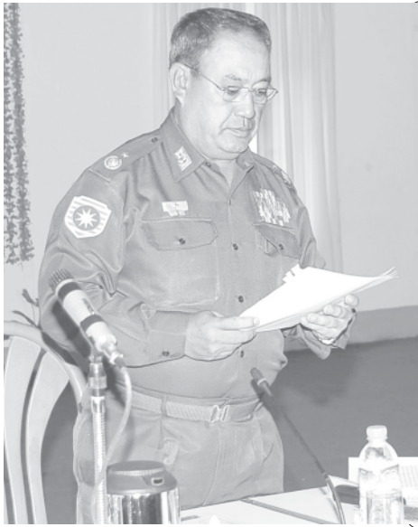
Minister for Home Affairs Maj-Gen Maung Oo.