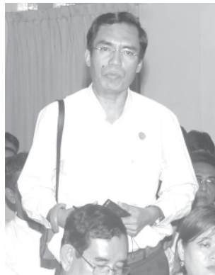
U Aung Hla Tun (Reuters News Agency)

YANGON, 7 Aug—The following are the questions raised by the attendees and answers given by Chief of the Myanmar Police Force in the press conference on clarification of measures for State security and the rule of law.