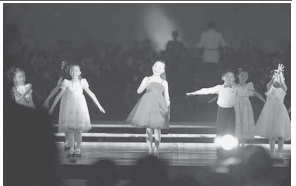
Some children perform with the symphony 'You and Me', the theme song of Beijing Olympics, in a musical concert at Beijing Olympic Forest Park to commemorate the first anniversary of Beijing 2008 Olympic Games in Beijing, capital of China, on 6 Aug, 2009.