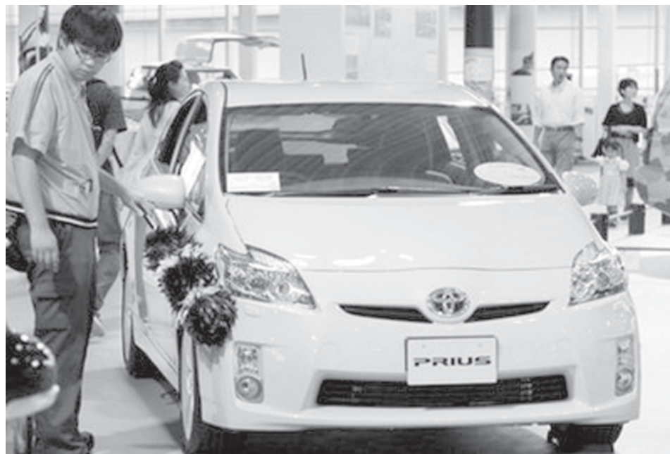
A worker dusts a Japanese auto giant Toyota Motor's hybrid Prius at the company's showroom in Tokyo. Nissan's upcoming all-electric car could outsell hybrids like Toyota's Prius even though it can't drive more than about 100 miles (160 kilometers) without stopping to recharge, a senior executive said.