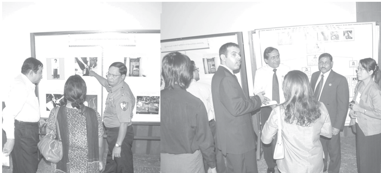
Diplomats, journalists and guests viewing documentary photos.