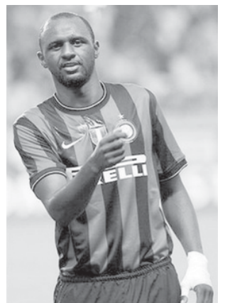
Arsenal former captain Patrick Vieira.