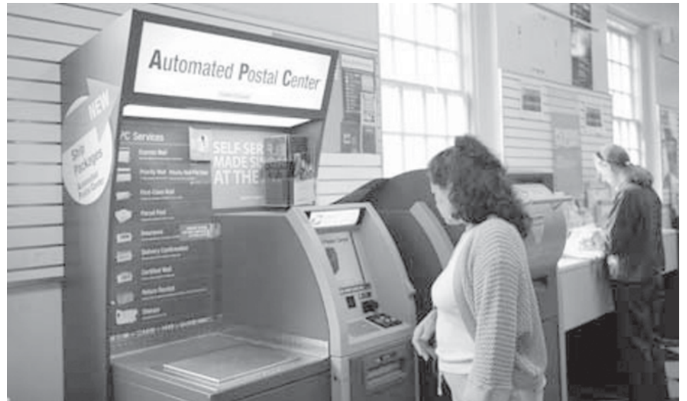
People walk past a post office in New York, the United States, on 6 Aug, 2009. The US Postal Service (USPS) has been struggling with a sharp decline in mail volume as people and businesses switch to e-mail both for personal contact and bill paying. USPS is planning to close several hundreds of post offices, the latest cost-cutting step for its scrambling to deal with a projected 7 billion USD deficit this fiscal year and larger losses in 2010.