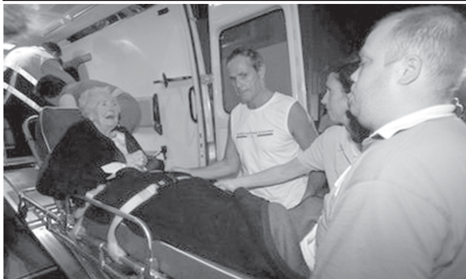
Injured residents of a retirement home are evacuated in Melle, Belgium, on 6 Aug, 2009. A fire has raged through a retirement home close to Brussels. A city alderman says nine people are dead and three more in critical condition.