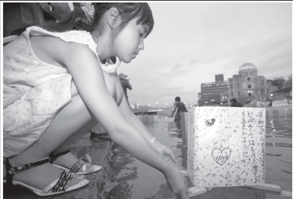
A little girl releases a lantern on the Motoyasu river, beside the Atomic Bomb Dome (R) in Hiroshima, Japan, 6 Aug, 2009, to mark the 64th anniversary of the atomic bomb blast in Hiroshima.