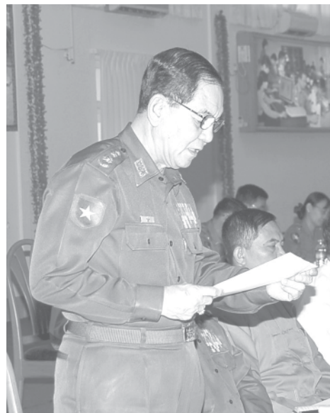
Minister for Progress of Border Areas and National Races and Develop- ment Affairs Col Thein Nyunt.

Works such as cultivation, breeding and creation of other job opportunities to earn a living, better transport for competitiveness of the products in market, promotion of health and education knowledge and extended construction of infrastructures of such sectors, and promotion of convictions of "As the threat of Drug is concerned with everybody, We will have to drive it out from the land" are to be implemented from all aspects for poppy growers so as to dissuade them from cultivating poppy and help improve socioeconomic life and raise the earnings of family. Cooperation with regional and international organizations is a must while effective utilization of own resources is instrumental in doing so.