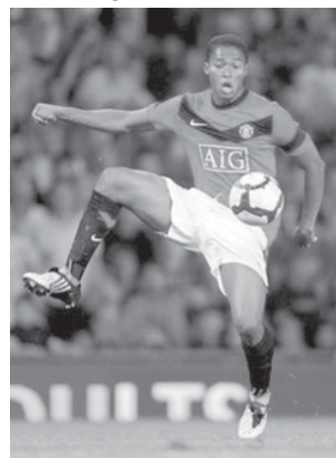
Manchester United's Antonio Valencia.