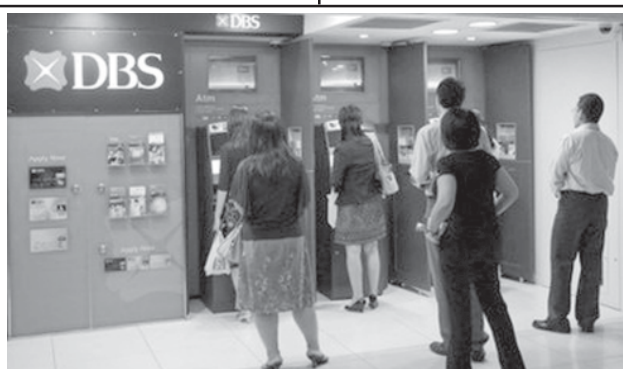
People queue at Development Bank of Singapore (DBS) automated teller machines to withdraw money in Singapore. DBS Group said on Friday net profit fell 15 percent in the June quarter from a year ago, beating expectations but analysts voiced concern over growing non-performing loans.