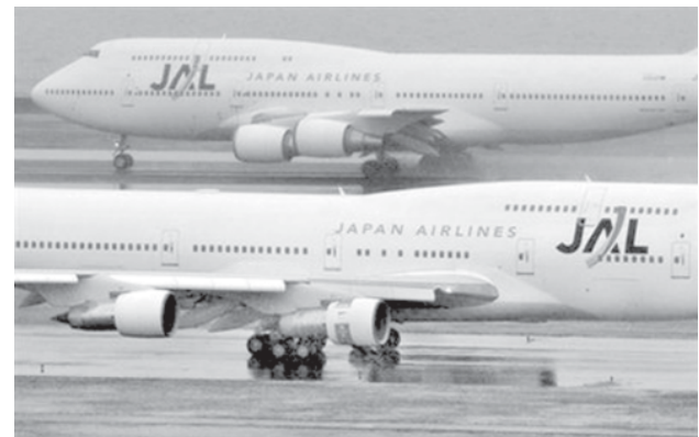
Japan Airlines (JAL) planes taxi at Haneda Airport in Tokyo. Japan Airlines, Asia's biggest carrier, announced Friday a net loss of 99.04 billion yen (1.0 billion dollars) for the fiscal first quarter, blaming the global economic downturn and swine flu.

JAL, which is in the midst of a massive restructuring, said income fell across both domestic and international routes, as well as its shipping business. The company said the losses came despite lower outlays for fuel and wages, in part because of lower income from fuel surcharges during the period.— Internet