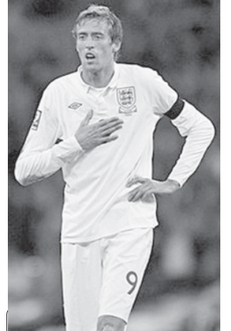
Peter Crouch.