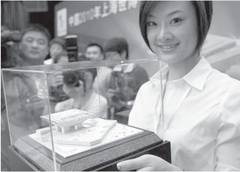
An employee presents a gold model of "China Pavilion" in Shanghai, east China, on 6 Aug, 2009. The first gold model of "China Pavilion" of Shanghai 2010 World Expo was issued here on Thursday.