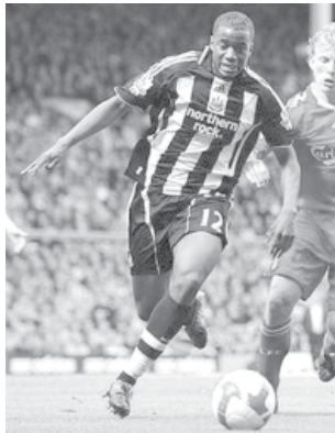
Newcastle centre-back Sebastien Bassong

Spurs boss Harry Redknapp made an eight million pound bid for Bassong on Thursday after learning that centre-backs Michael Dawson,