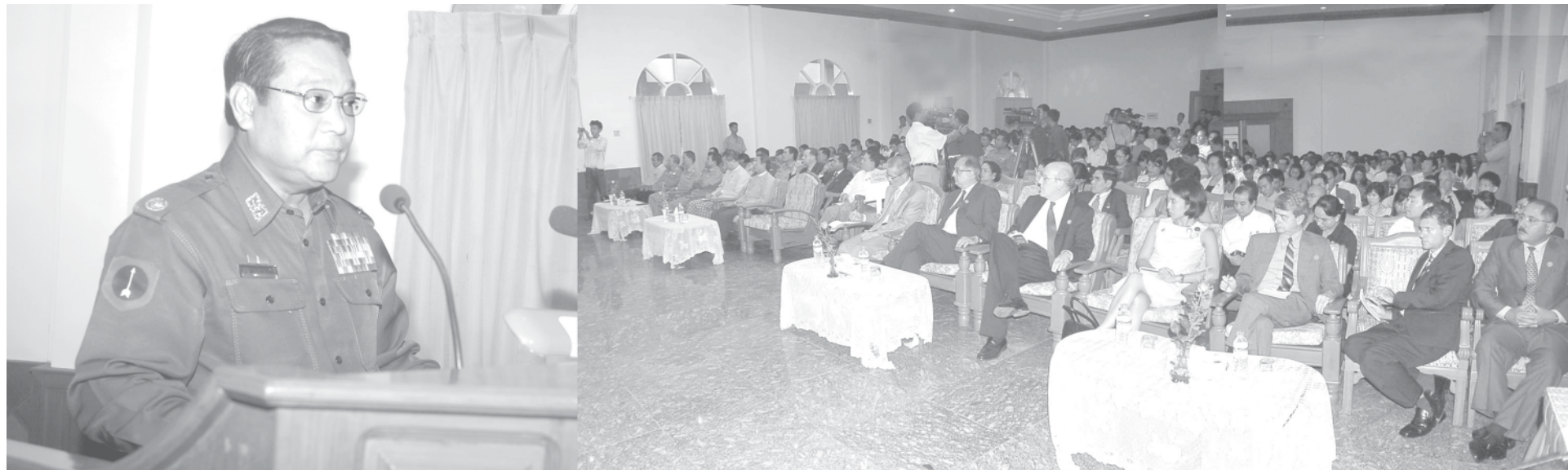
Chief of Myanmar Police Force Brig-Gen Khin Yi clarifies measures for State security and the rule of law at press conference.—MNA