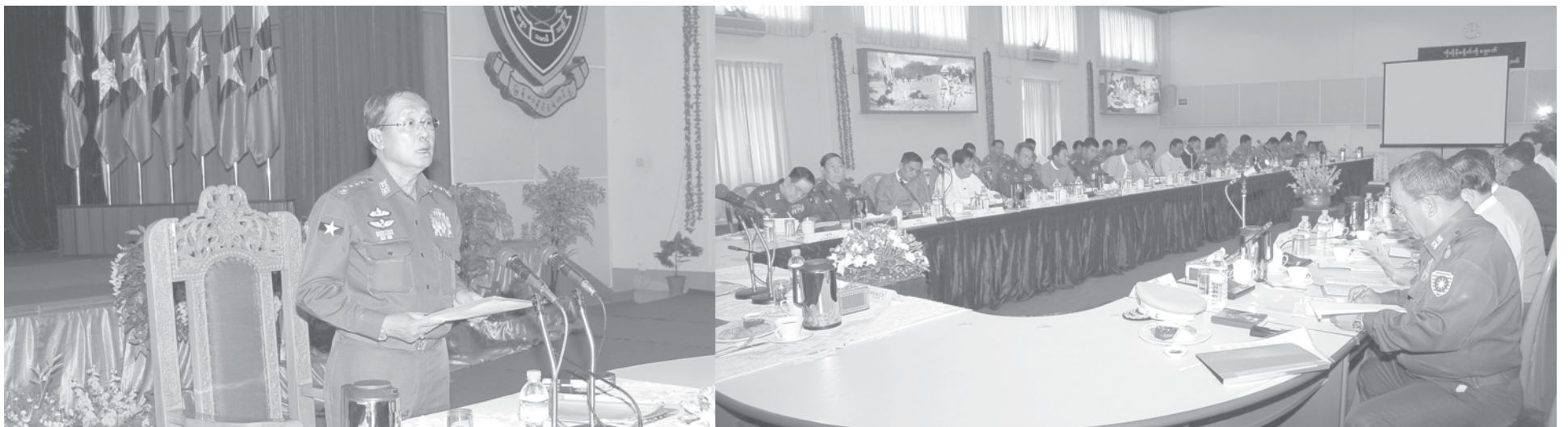
Secretary-1 General Thiha Thura Tin Aung Myint Oo addresses meeting (1/2009) of CCDAC.—MNA

Vice-chairmen Minister for Progress of Border Areas and National Races and Development Affairs Col Thein Nyunt and Minister for Foreign Affairs U Nyan Win, (See page 7)