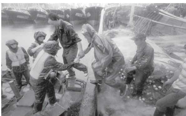
Soldiers help fishermen go to safe zone in the rain in Taizhou City, east China's Zhejiang Province, 6 Aug, 2009.—XINHUA

Waves as high as 6 meters were already hitting the coastal area on Friday, and the provincial meteorological observatory said they could reach up to 9 meters as the typhoon came closer.—Xinhua