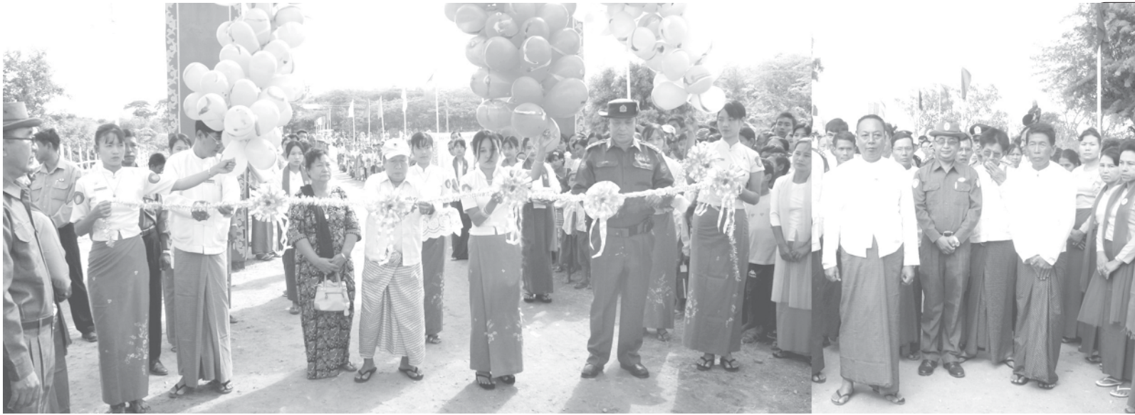
Minister Maj-Gen Khin Aung Myint attends opening ceremony of concrete bridge at Kyutawwa village in Pyawbwe Township.—MNA