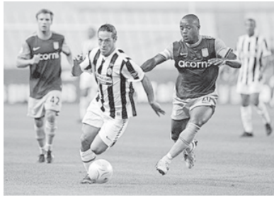
Aston Villa's Nigel Reo-Coker (R) vies with Juventus's Mauro Camoranesi during the final of the Peace Cup Andalusia football match at Olympic's stadium in Seville. Aston Villa overcame Italian giants Juventus to win the Peace Cup on 4-3 penalties.