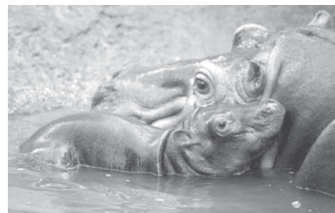
A 12-day-old Nile hippopotamus plays with its mother, Chombi, at Malaysia's National Zoo in Kuala Lumpur on 29 July, 2009. The baby hippopotamus has not been given a name.