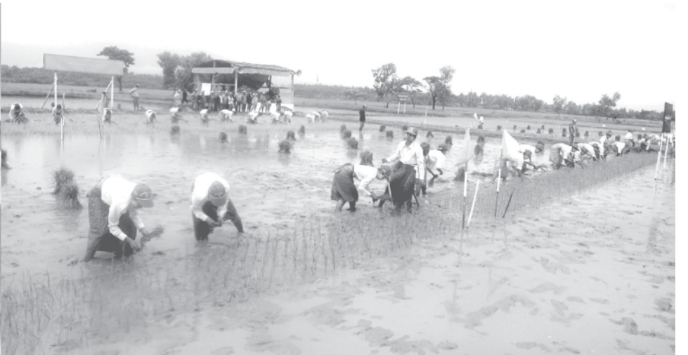
Lt-Gen Ko Ko of Ministry of Defence views transplanted skills contest in Ayeyawady Division.—MNA