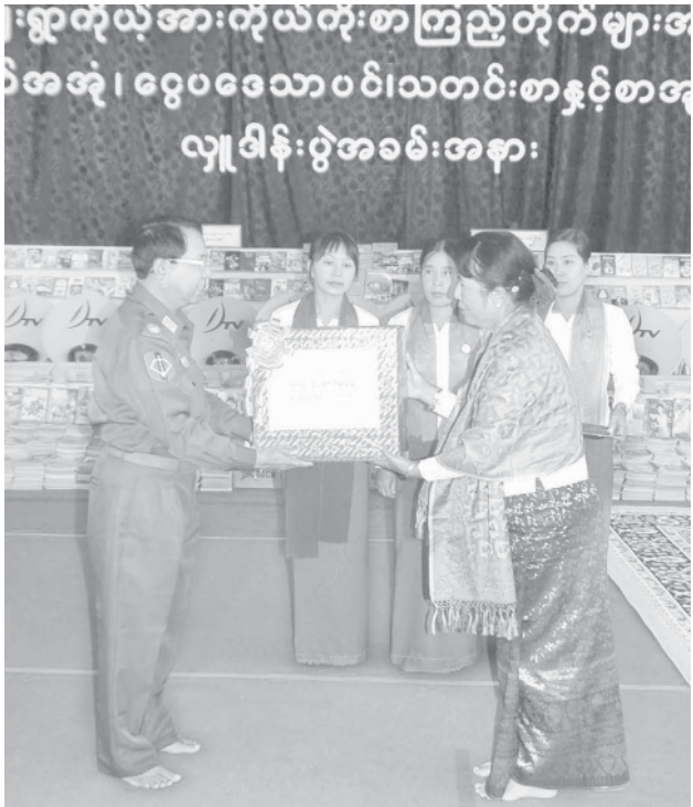
Minister Brig-Gen Kyaw Hsan presents cash, publications, DTH system receivers for self-reliant libraries.