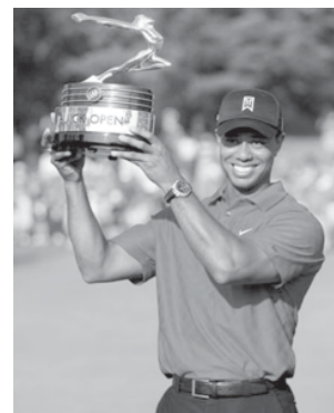
Tiger Woods holds up the championship trophy after winning the Buick Open PGA golf tournament at Warwick Hills in Grand Blanc, Michigan on 2 Aug, 2009.

four to take the sole lead and he doubled his lead with a short birdie putt on number seven.—INTERNET