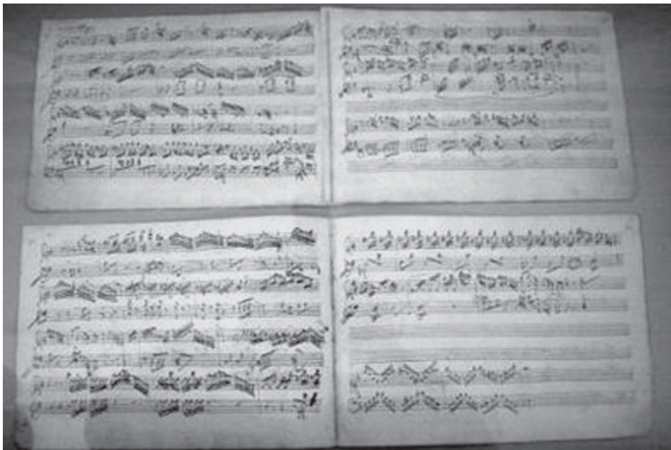
Two newly discovered pieces of music by Wolfgang Amadeus Mozart are seen for the first time in public in a house where the master composer once lived, in Salzburg on 2 Aug, 2009.