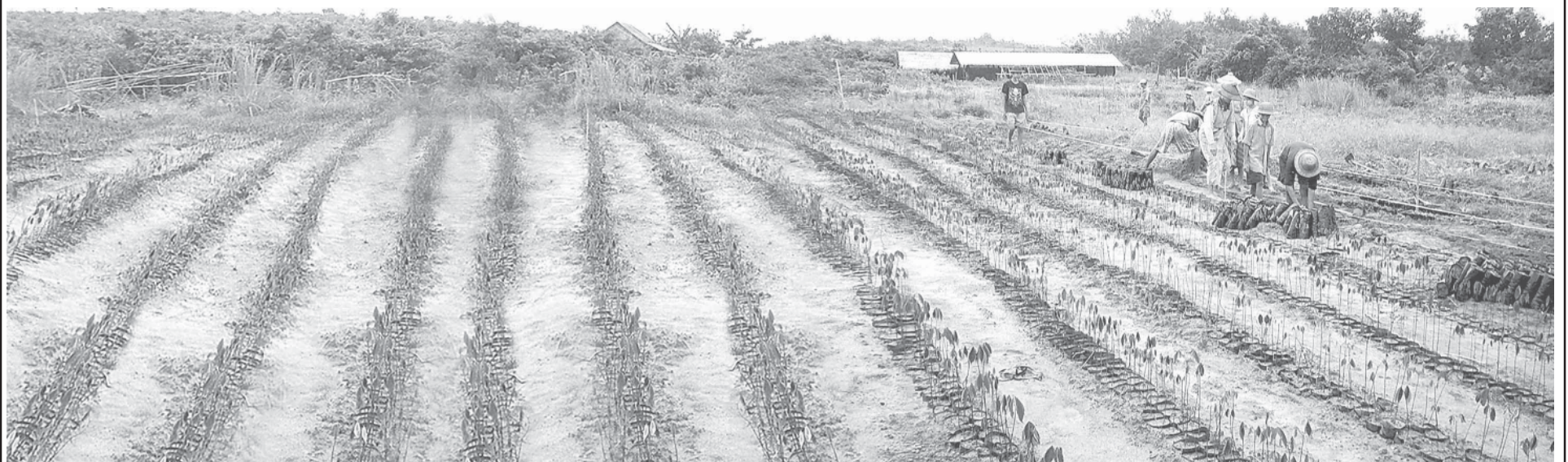
The Ministry of Industry-1 receives orders for rubber grafts in Shwegyin Township.