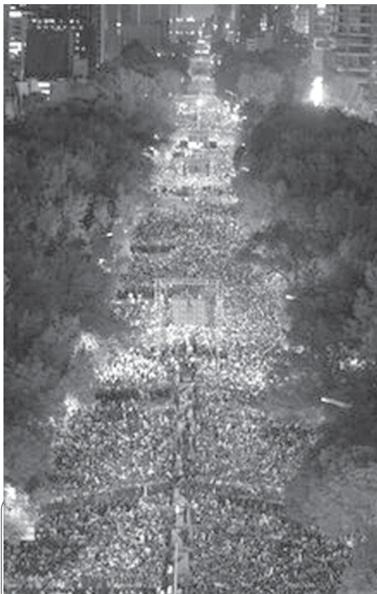
Thousands of young people wait for the beginning of a free concert at the Angel of Independence in Mexico City, on 2 Aug, 2009.