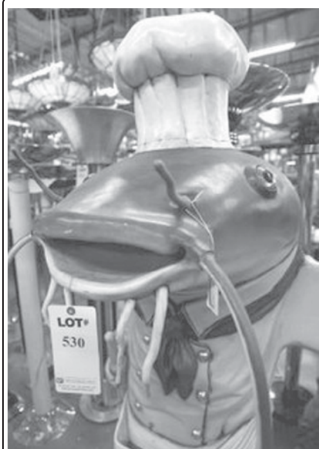
An auction tag placed on a catfish sculpture is on display at 20th Century Props in North Hollywood, California. Hollywood's second-largest prop house is going out of business with its owner saying he has fallen victim to film and TV production leaving California for other US states that lure producers with tax incentives and fewer restrictions.

Floods in northwestern Qinghai province and southern Guangxi province have damaged some roads and disrupted traffic.— Internet