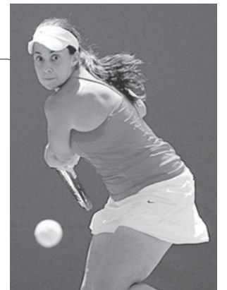
Marion Bartoli of France returns a shot to Venus Williams during the first set of their final match of the Bank of the West Classic in Stanford, California. Bartoli upset Williams 6-2, 5-7, 6-4.

Venus again," said the Frenchwoman, "I have a lot of good memories from Wimbledon." Bartoli lost the title match here a year ago to Canadian Aleksandra Wozniak. She was unable to beat Williams in straight sets while leading a set and 5-4, failing to serve out the victory. Bartoli will move up two spots in the rankings to 12th on Monday after claiming her second title of 2009 and the fifth of her career.