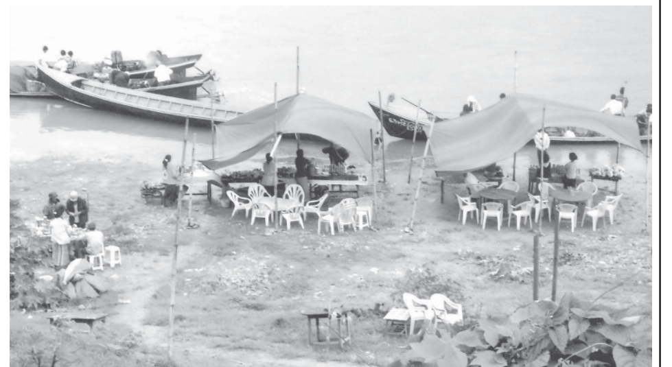
Restaurants and lodging houses with country styles in the confluence.