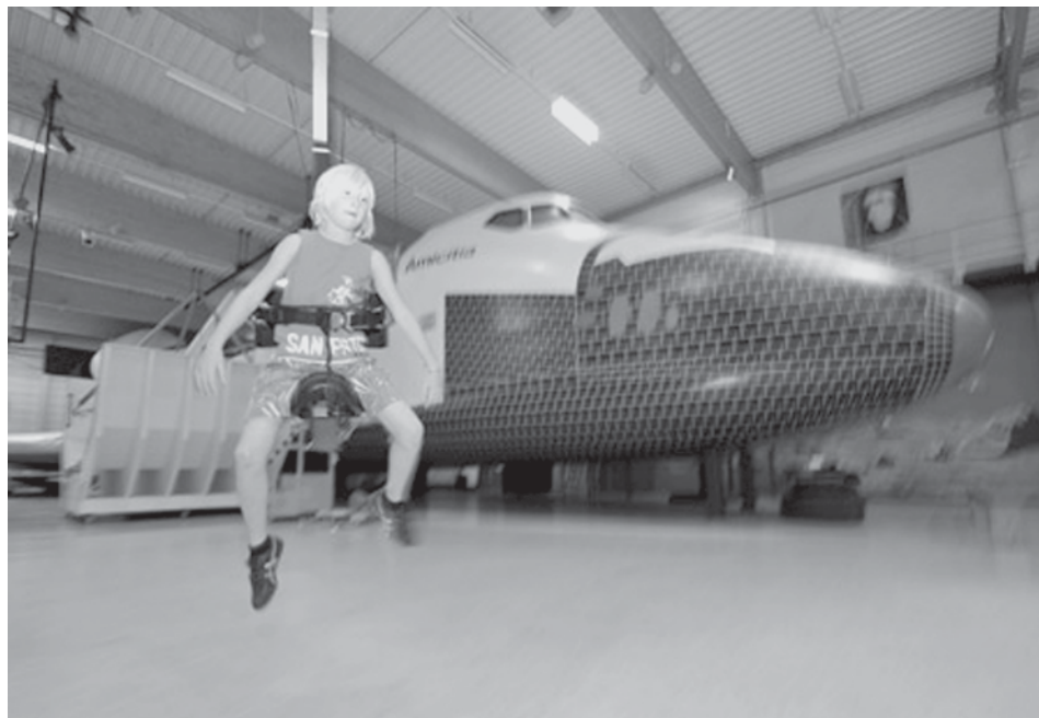
A child experiences moon walking at the Euro Space Centre in Luxembourg Province, some 130 kilometres southeast of Brussels, capital of Belgium, on 1 Aug, 2009.