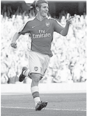
Arsenal's English midfielder Jack Wilshere celebrates scoring the third goal against Rangers during the Emirates Cup competition at the Emirates Stadium in London. Arsenal won 3-0.

LONDON, 3 Aug—Arsenal manager Arsene Wenger attempted to put a lid on the growing hype surrounding teenage striker Jack Wilshere after the 17-year-old produced a sensational display against Rangers. Wilshere scored the opening goal in the 3-0 win over the Scottish champions which gave the Londoners the Emirates Cup and was a danger all afternoon, a timely display in front of watching England coach Fabio Capello.