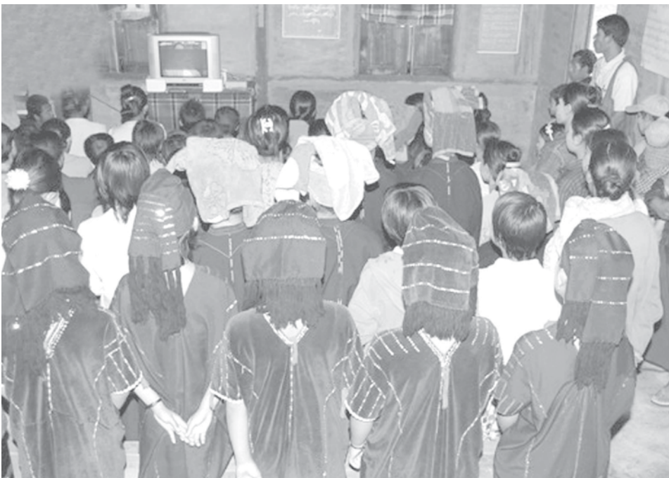
Locals watch MRTV-3 and MRTV-4 programmes with DTH system receiver in Pyinnya Gonyaung self-reliant library of Innge village in Pintaya Township.