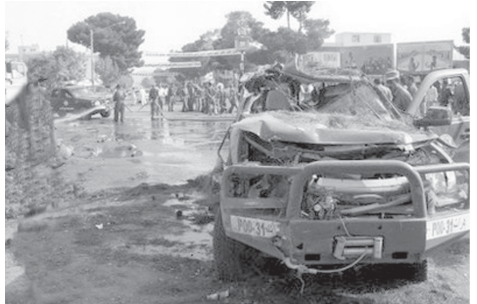
The site of a bomb blast in Herat. A bomb targeting Afghan police guards exploded in the heart of Afghanistan's western city of Herat.