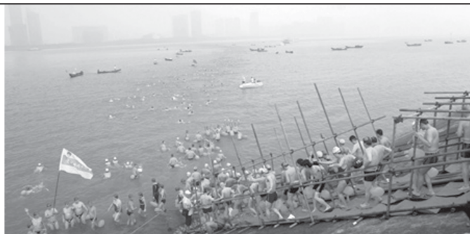
Swimmers take water and prepare to cross over the Qiantang River in Hangzhou, capital of east China's Zhejiang Province, on 2 August, 2009. A total of 1300 swimmers took part in the activity of crossing over the Qiantang River on Sunday.

The study, published in the journal Sleep , modeled Parkinson's-associated dementia in genetically altered fruit flies. The researchers not only found a single night of sleep loss causes long-lasting disruptions in the flies' cognitive abilities comparable to aspects of Parkinson's-associated dementia, but they are able to block this effect by feeding the flies large doses of the spice curcumin. "Clinical trials of curcumin to reduce risk of Parkinson's disease are a future possibility, but for now we are using the flies to learn how curcumin works," study author Dr James Galvin of Washington University in St Louis said in a statement. "This should help us find other compounds that can mimic curcumin's protective effects but are more specific."—Internet