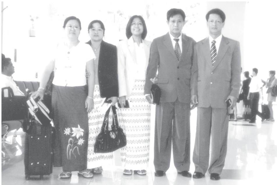
Myanmar delegation members seen at Yangon International Airport before their departure for Thailand to attend ASEAN Collaboration on Sericulture Research and Development.