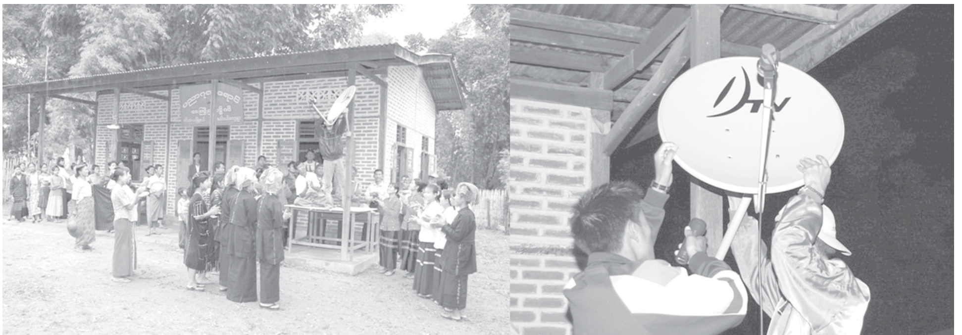
Installation of DTH system receiver in Pyinnya Gonyaung self-reliant library in progress.—MNA