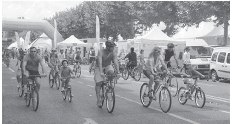
People take part in an activity named "Slowup" alongside the Lake of Geneva in Geneva, Switzerland, on 2 Aug, 2009. People could ride or walk on the 26-km-long road alongside the Lake of Geneva on Sunday, while the passage of motor vehicles was forbidden on the road. The activity aimed at improving the awareness of environment protection.—INTERNET