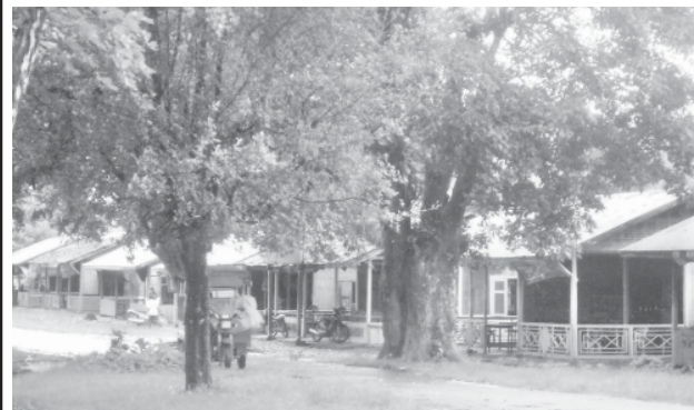
Some food stalls at a port in the confluence of the Maykha and Malikha rivers.

that the fine road was coping with a stream of traffic especially motorcycles. It is very convenient for local people to travel between the two townships due to the