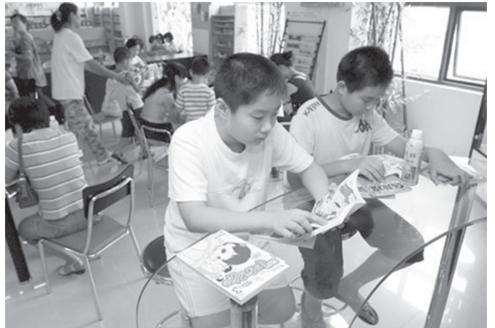
Children read books in a book bar in Fuzhou, southeast China's Fujian Province, on 2 Aug, 2009. Students are enjoying their summer vacation in China.