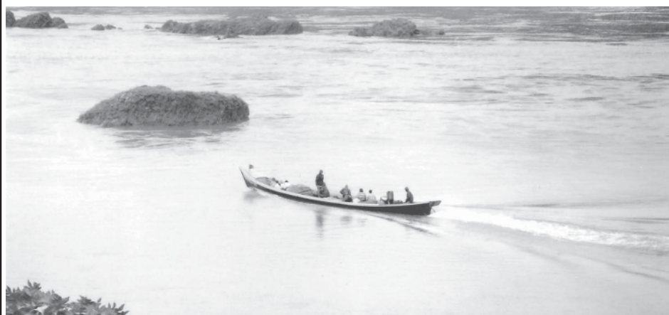
A motorized boat moving downstream the Maykha River.