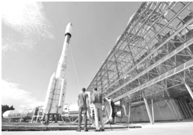
Two visitors look at the miniature of rocket Ariane 4 made by European Space Agency, at the Euro Space Centre in Luxembourg Province, some 130 kilometers southeast of Brussels, capital of Belgium, on 1 Aug, 2009.