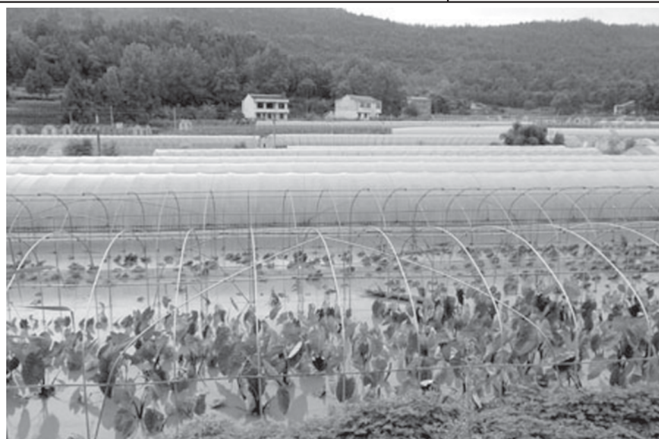
Greenhouses for vegetables were in flood in Changlin township of Xichong county, southwest China's Sichuan Province, on 1 Aug, 2009. Xichong county had been suffering from rainstorm since Friday, which had damaged crops and vegetables badly.—XINHUA

Tourists enjoy the scenery on sand hills in Wuhai City, north China's Inner Mongolia Autonomous Region, on 2 Aug, 2009.—XINHUA