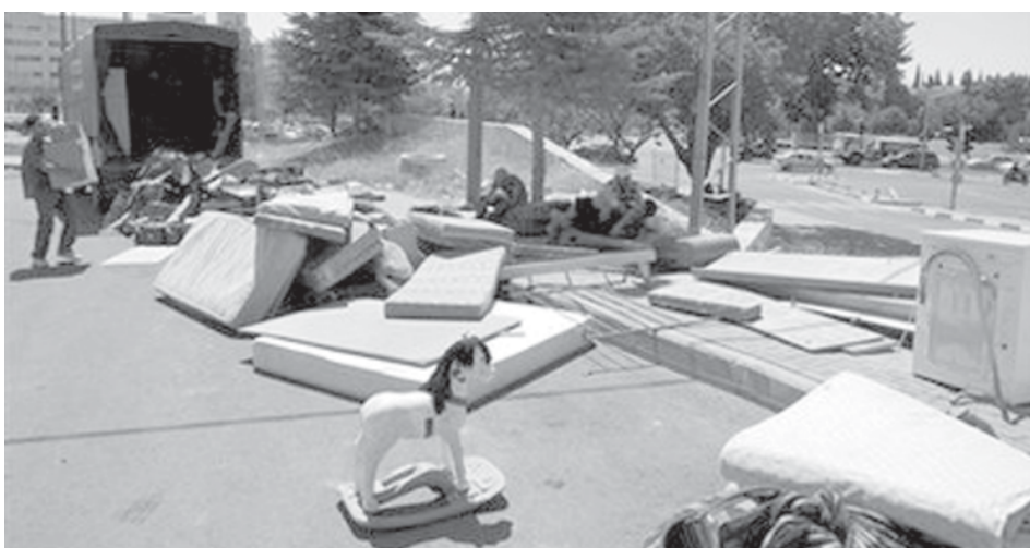
Israeli workers unload the belongings of a Palestinian family in a street after they were evicted from their house in the east Jerusalem neighbourhood of Sheikh Jarrah, on 2 Aug, 2009.

No charges have yet been laid against the accused employees, but China has told the Australian government it has "sufficient evidence" that they stole state secrets.