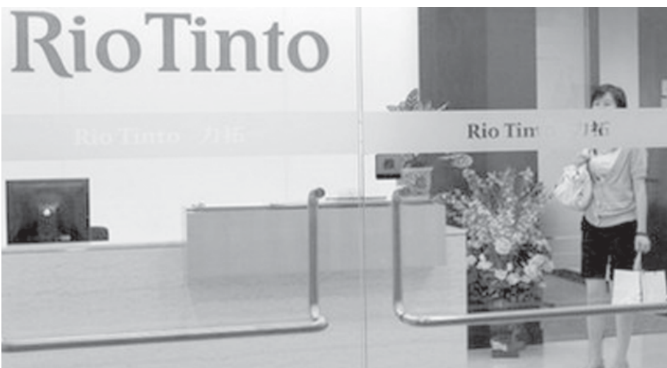
Offices of miner Rio Tinto in Shanghai. A top Chinese official has called on Canberra to respect China's legal system, saying a mining executive held in Shanghai would have broken Australian law if his alleged crimes had occurred here.