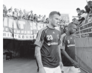
David Beckham of the Los Angeles Galaxy walks onto the pitch for a warm up before a friendly match against FC Barcelona at the Rose Bowl in Pasadena, California.

after two clashes with abusive football fans just days apart, he's ready to turn the other cheek and walk away if it happens again.