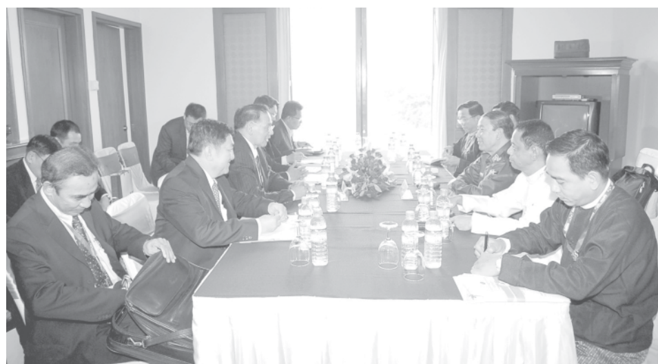
Minister Brig-Gen Lun Thi receives Minister for Energy Mr Wannarat Channukul and party of Thailand.—MNA