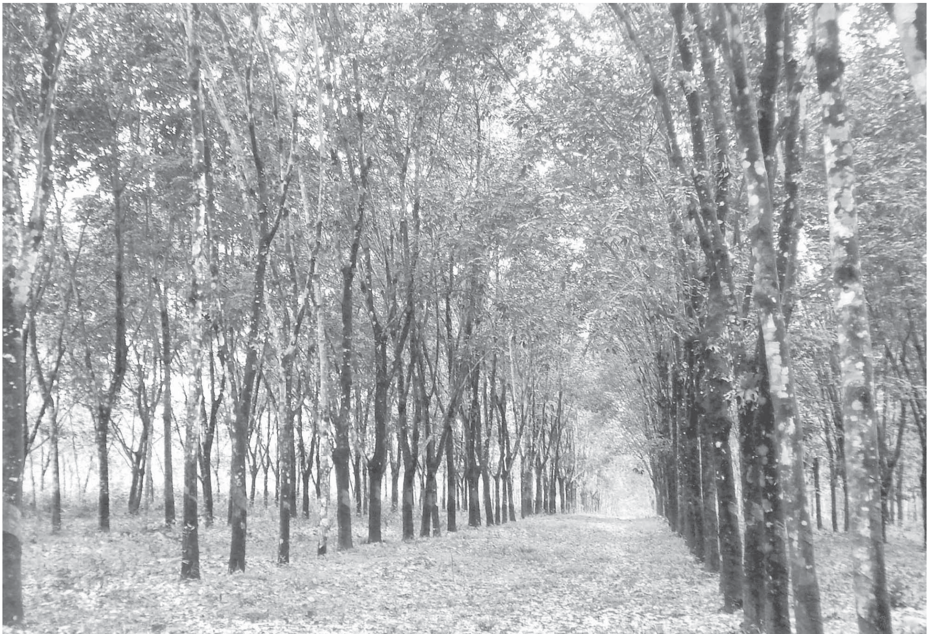
A rubber farm in Chedawyar Village, Shwegyin Township, Bago Division.