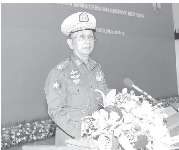
Prime Minister General Thein Sein delivers an address at the opening ceremony of 27th ASEAN Ministers on Energy Meeting.

NAY PYI TAW, 29 July—Prime Minister of the Union of Myanmar General Thein Sein delivered an address at the opening ceremony of the Twenty-Seventh ASEAN Ministers on Energy Meeting at the convocation hall of Mandalay University in Mandalay this morning.