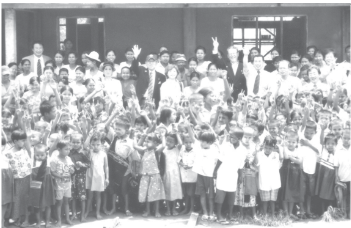
Donors and students have documentary photo taken in front of the new school building of Padaukmyaing Education Primary School in Hlegu Township.