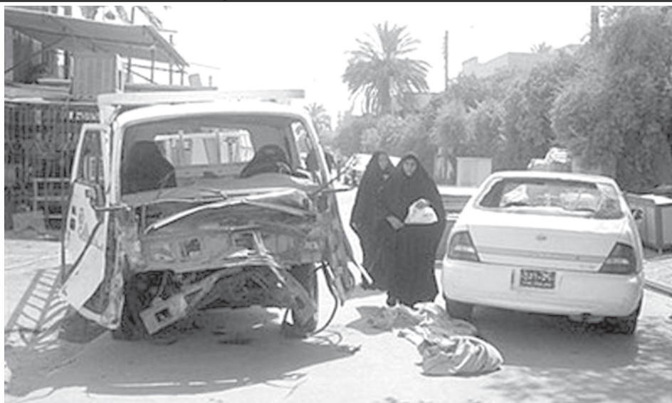
Two Iraqi women walk past damaged vehicles following an overnight explosion in central Baghdad. Ten people were killed and 42 others were injured in bomb attacks across Baghdad on Tuesday, police said.