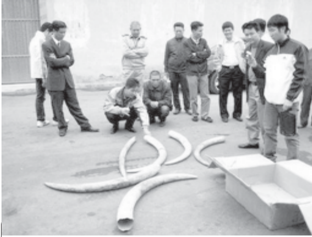
Vietnamese officials inspect illegal elephant tusks found in a shipment in March from Tanzania.

Media reported on Wednesday that customs officials had uncovered 200kg of tusks in Hai