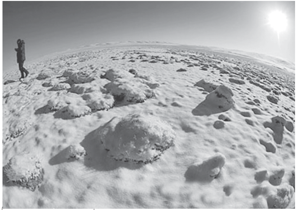
A tourist walks by a wetland at the source of the Yangtze River on the Qinghai-Tibet Plateau in this undated file photo.—INTERNET

The melt can reduce water in the lower reaches of the Yangtze River, dry up lakes and trigger desertification, said Xin. He said the rising temperatures in the area due to continuing global warm were the major cause of the glacier melt.— Internet