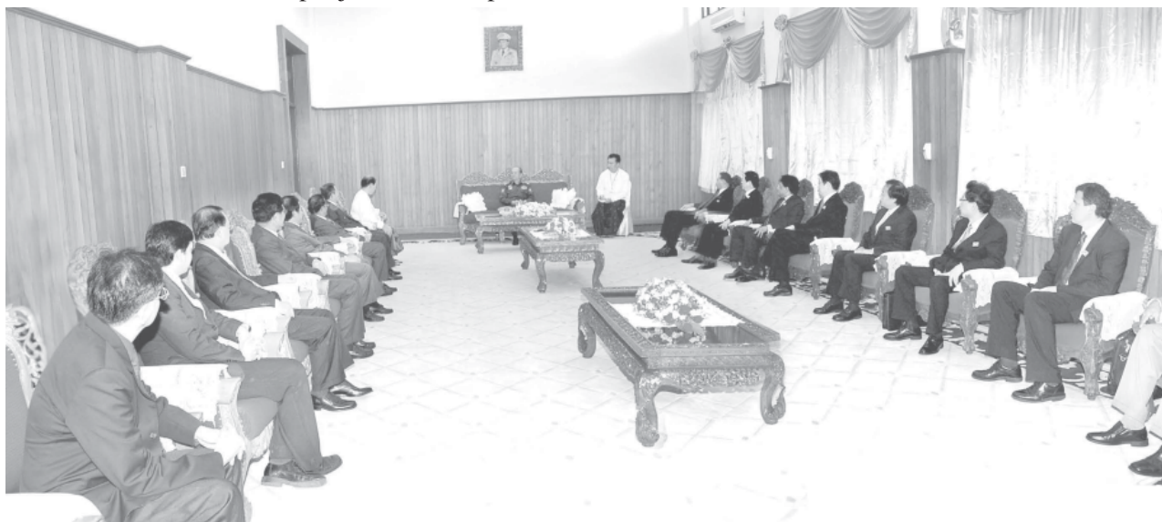
Prime Minister General Thein Sein receives energy ministers and deputy energy ministers from ASEAN Countries, China, Japan, ROK, India and Australia and Deputy Secretary-General of ASEAN Secretariat.

The Theme of this event is "Securing ASEAN's Energy Future Towards Prosperity and Sustainability".