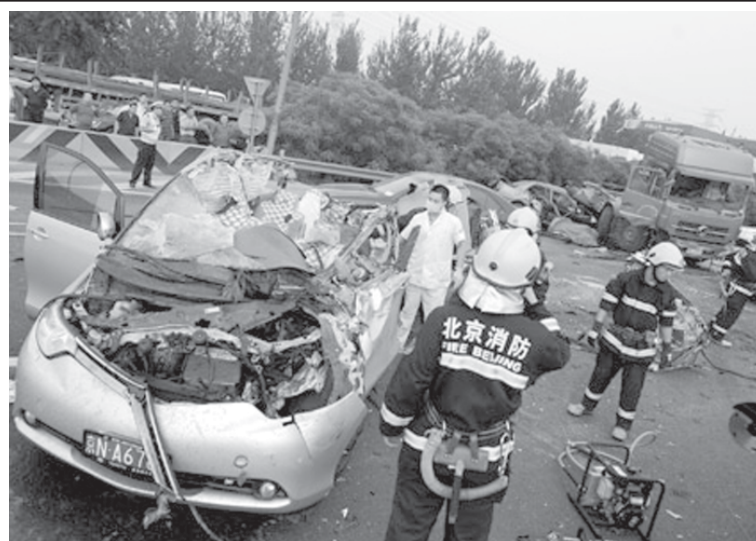
Rescuers work at the scene where a truck overturned and collided with three cars in the opposite direction on the east Ring Road No. 5 in Beijing, capital of China, on 28 July, 2009.