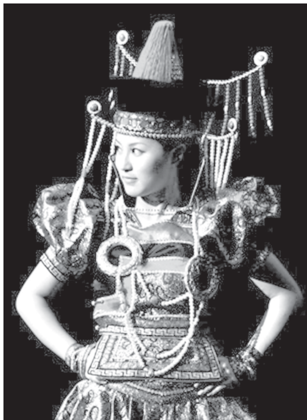
Models present traditional costumes of the Mongolian ethnic group at the grassland cultural festival in Hohhot, capital of north China's Inner Mongolia Autonomous Region on 15 July 2009.