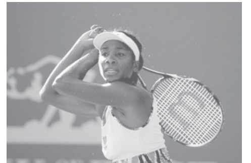
Second seeded American Venus Williams

In other matches, Daniela Hantuchova of Slovakia outlasted Aleksandra Wozniak 6-4, 4-6, 7-5. The