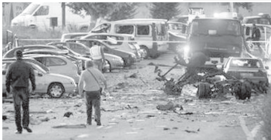
Investigators walk through debris and damaged vehicles outside a civil guard barracks after a car bomb exploded in the northern Spanish city of Burgos, early 29 July, 2009.