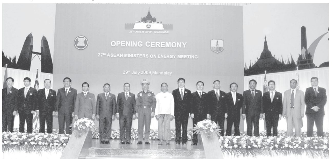
Prime Minister General Thein Sein together with Deputy Secretary-General Mr Pushpanathan Sundram of ASEAN Secretariat, energy ministers, deputy energy ministers and officials from ASEAN Countries, China, Japan, ROK, India and Australia have documentary photo taken at the opening ceremony of the 27 th ASEAN Ministers on Energy Meeting.—MNA

Pushpanathan Sundram of the ASEAN Secretariat, energy ministers and deputy energy ministers of ASEAN countries, PRC, Japan, ROK, India and