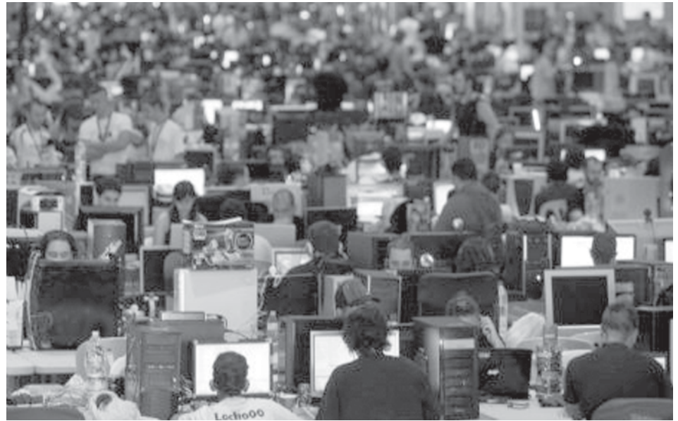
People surf the web during the annual “Campus Party” Internet users gathering in Valencia on 28 July, 2009. “Campus Party” is a thirteen-year-old event where people from several countries share experiences related to computers and communications. More than 6,000 Internet users turned their computers on at mid-night to kick off this year’s week-long gathering.

Radioiodines, affecting the thyroids in children and adolescent survivors of nuclear reactor accidents.