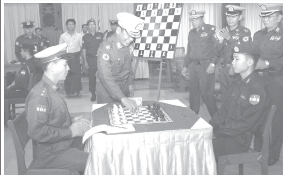
Commander of Yangon Command Maj-Gen Win Myint opens Commander's Shield chess contest of Yangon Command held on 29 July.