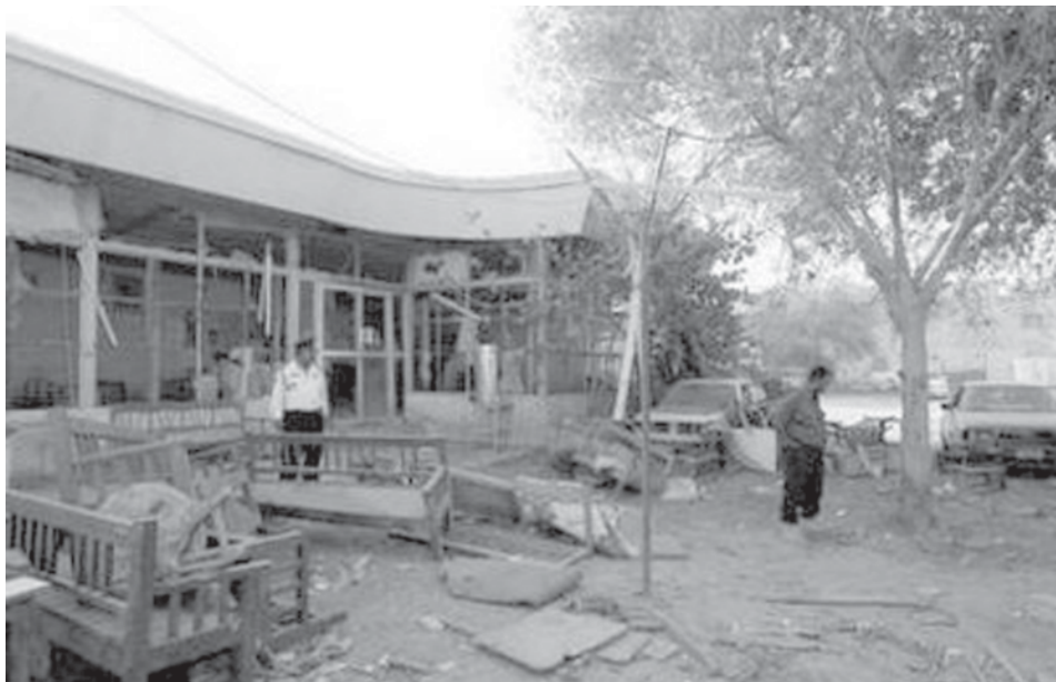
A general view after a blast at a cafe in Kesra district, Baghdad on 29 July, 2009. A bomb planted in the cafe killed two people and wounded 15 others in Baghdad's central Kesra district, police said.