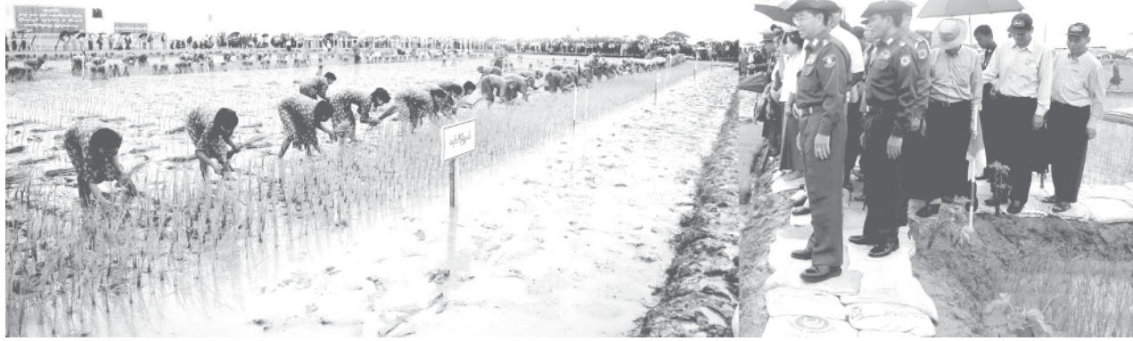
Lt-Gen Myint Swe of Ministry of Defence views Yangon Division level paddy transplanting contest.