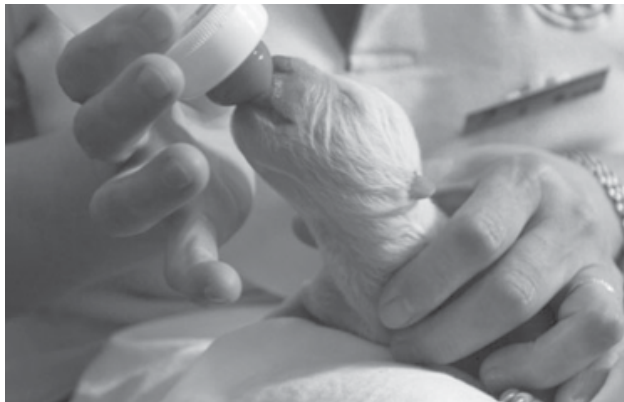
A keeper feeds a polar bear cub in Laohutan Ocean Park in Dalian of northeast China's Liaoning Province, on 29 July, 2009. Two polar bear cubs, one female and one male, were born in Laohutan Ocean Park.