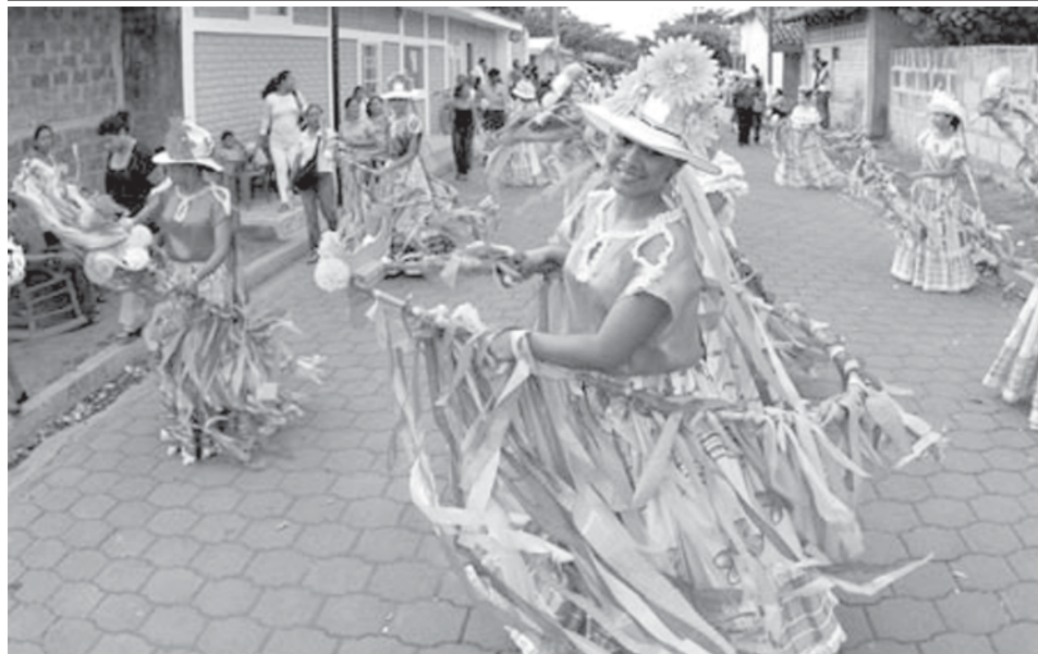
People perform local dance during the carnival held to revive the cyclone-torn town of Nagarote, Nicaragua, on 27 July, 2009.

In its 2008 first half, the company reported a net profit of 733 million euros but finished the year with a net loss of 343 million euros as the economic crisis decimated auto sales. PSA said it was maintaining its forecast for a 12 percent fall in the European vehicle market this year, with “the beginning of a recovery seen towards the end of 2010.”