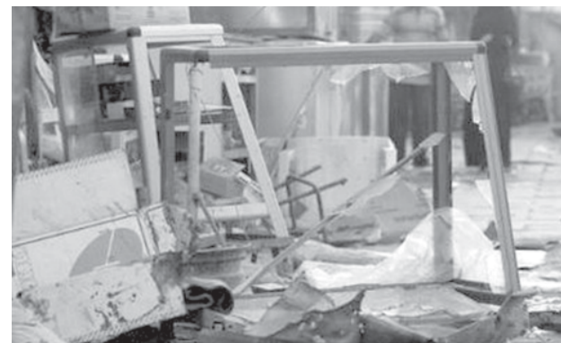
Debris and broken glass are seen at the site of a bomb attack in New Baghdad District, eastern Baghdad on 29 July, 2009. A bomb hidden on a motorcycle killed eight people and wounded 13 others in eastern Baghdad's district of New Baghdad, police said.