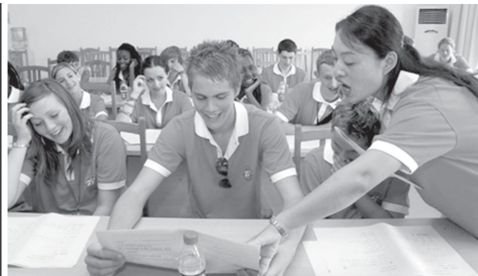
The British students learn Chinese language as they attend the Sino-British Sports and Culture Summer Camp held in Haimen City of east China's Jiangsu Province, on 28 July, 2009.

Light, sweet crude for September delivery fell 1.15 US dollars, or 1.7 percent, to settle at 67.23 dollars a barrel on the New York Mercantile Exchange.