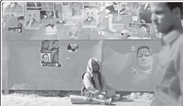
An Afghan beggar one of the victims of Afghan war begs in front of posters of presidential and provincial council candidates in Kabul, Afghanistan recently.

The military alliance says the clash happened in Zabul province on Tuesday but gave few details. It said six civilians were treated at a NATO base but one died. It said it is investigating the incident. The issue of civilian casualties has been a constant source of friction between President Hamid Karzai and the US military commanders. Soon after assuming command of NATO and US forces last month, Gen Stanley McChrystal ordered troops to limit the use of airstrikes to prevent civilian casualties.—Internet