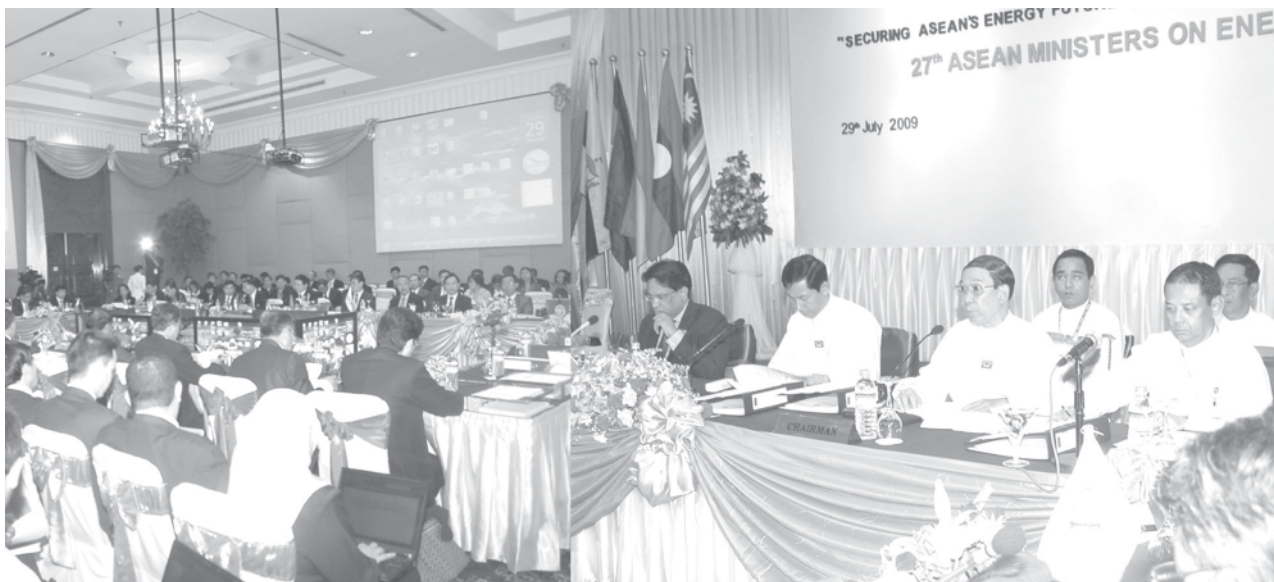
Minister for Energy Brig-Gen Lun Thi makes an opening speech at the 27th ASEAN Ministers on Energy Meeting.