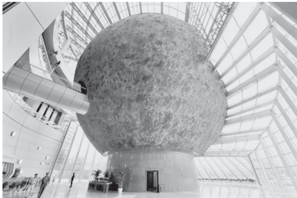
The photo taken on 27 July, 2009 shows the globe-shaped "Museum of Space Discovery" in the newly-built Science Museum of Zhejiang Province. The West Lake Cultural Plaza, consisting of the new Zhejiang Science Museum with over 300 items on show and Zhejiang Natural History Museum with over 130,000 items on show, will be open to the public on 29 July.