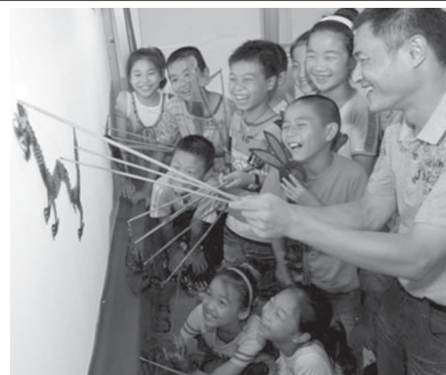
The children watch shadow play in the Central Primary School of Xieqiao Township in Haining City of east China's Zhejiang Province, on 28 July, 2009.

Shares of US Steel Corp shares fell 2.2 percent to 40.35 dollars after the company said it expected all of its business sectors to operate in the red in the third quarter.