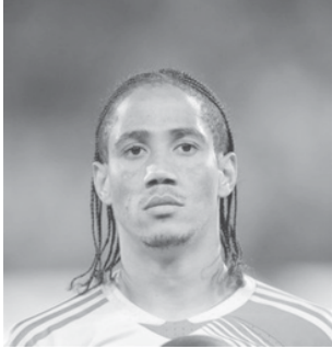
South Africa midfielder Steven Pienaar pictured before the Fifa Confederations Cup match between Spain and South Africa at the Free State Stadium in Bloemfontein, South Africa, in June.