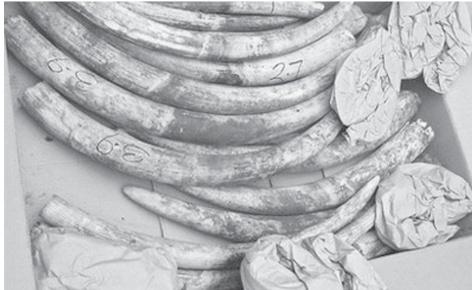
A file photo shows confiscated elephant tusks at Hai Phong, Vietnam, from a previous seizure by customs officials in March. Vietnamese authorities have uncovered 200kg of elephant ivory tusks illegally imported from Kenya.