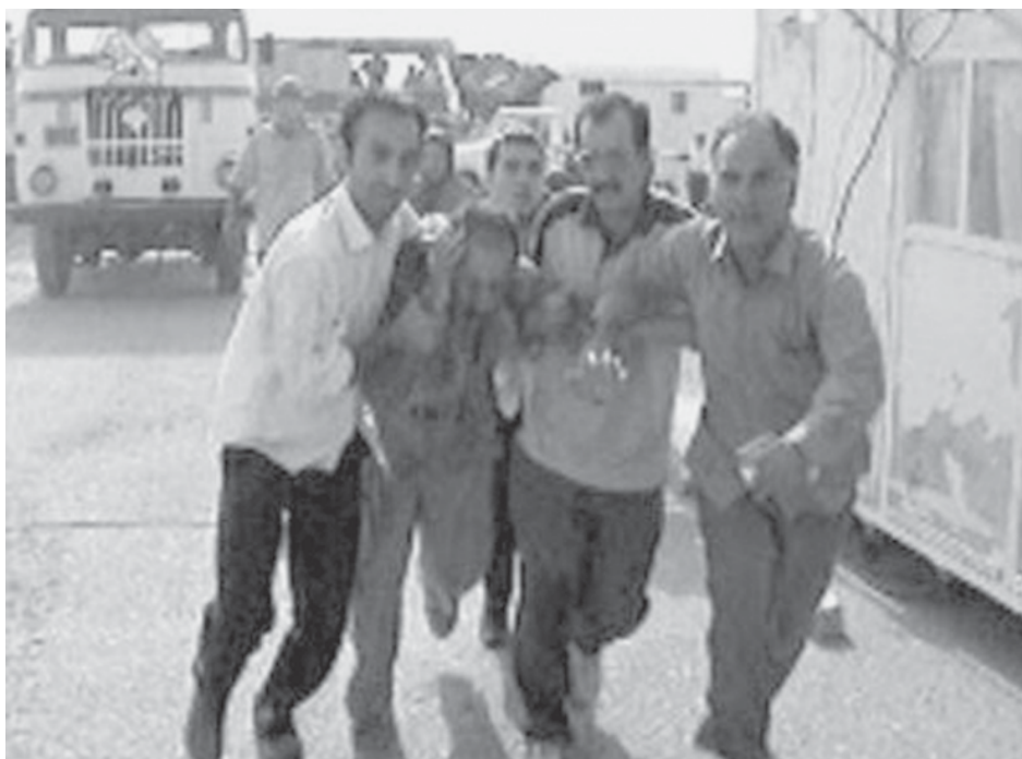
A video grab shows what seems to be an injured man being assisted by residents after a confrontation with Iraqi security forces in Ashraf on 28 July, 2009.