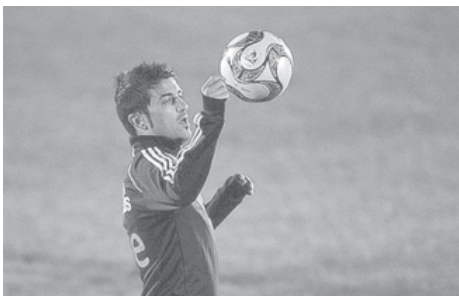
Spanish national football team's forward David Villa

MADRID, 29 July—Spanish international striker David Villa, a long-time target of both Real Madrid and Barcelona, said on Tuesday he was happy to stay at Valencia.