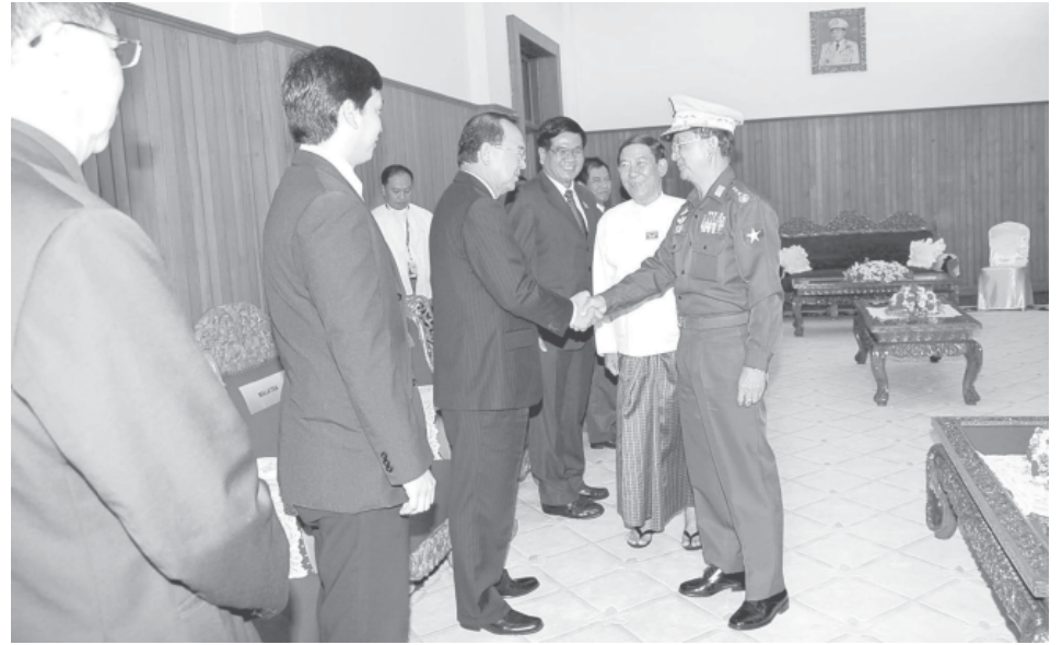
Prime Minister General Thein Sein cordially greets energy ministers and deputy energy ministers from ASEAN Countries, China, Japan, ROK, India and Australia and Deputy Secretary-General of ASEAN Secretariat.—MNA

Myanmar will do its utmost endeavours to cooperate with other ASEAN member countries as well as ASEAN+3 and EAS countries in its efforts for energy security, climate change issues and