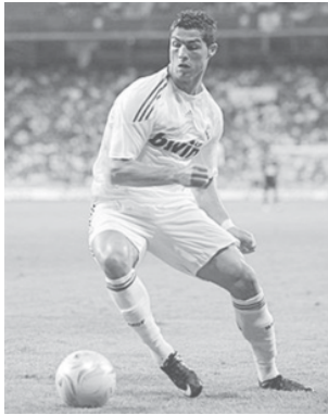
Real Madrid's Cristiano Ronaldo kicks the ball during a Peace Cup match against Liga de Quito at Santiago Bernabeu stadium in Madrid. Real Madrid won 4-2.

MADRID, 29 July—The world's most expensive footballer Cristiano Ronaldo got off the mark for his club Real Madrid here on Tuesday as they ran out 4-2 winners over Ecuadorian side Liga de Quito in the Peace Cup.