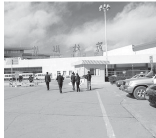
This file photo shows the Gongkar Airport in Lhasa, capital of southwest China's Tibet Autonomous Region.

CA4122 will leave at 7 am everyday from the Beijing Capital International Airport, and arrive at the Lhasa Gonggar Airport at 10:50 am.—Xinhua