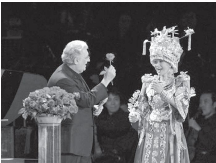
Spanish tenor Placido Domingo (L) presents a flower to Song Zuying, a famous Chinese singer, during the "Beijing Bird's Nest Summer Concert" at the National Stadium, or the "Bird's Nest", in Beijing, on 30 June, 2009.