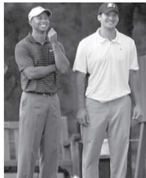
Tiger Woods, left, and Dallas Cowboys quarterback Tony Romo, right, talk on the 17th tee during the pro-am for the AT&T National golf tournament at Congressional Country Club, on 1 July, 2009, in Bethesda, Md.