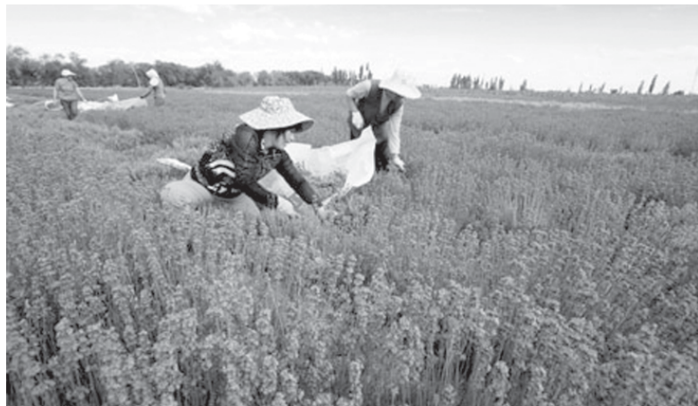
Farmers reap lavender flowers in Huocheng County of Ili, northwest China's Xinjiang Uygur Autonomous Region, China, on 30 June, 2009. Nearly 20,000 mu (1333 hectares) of lavender bloomed in the valley of the Ili River at present.