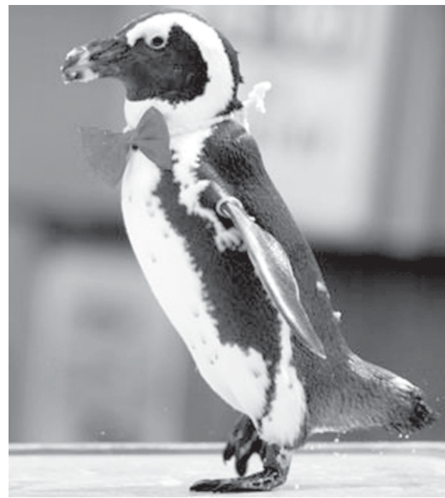
A cravatted penguin performs in front of visitors at Sunshine International Aquarium in Tokyo, capital of Japan, on 29 June, 2009. Performance of penguins here give visitors an agreeable mood in the hot summer.

In terms of the annual pass, the fee will be up 67 HK dollars to 695 HK dollars for adults and 37 HK dollars up to 350 HK dollars for children. Meanwhile, children younger than three years old and elders aged above 65 will still have free access to the park.—Xinhua