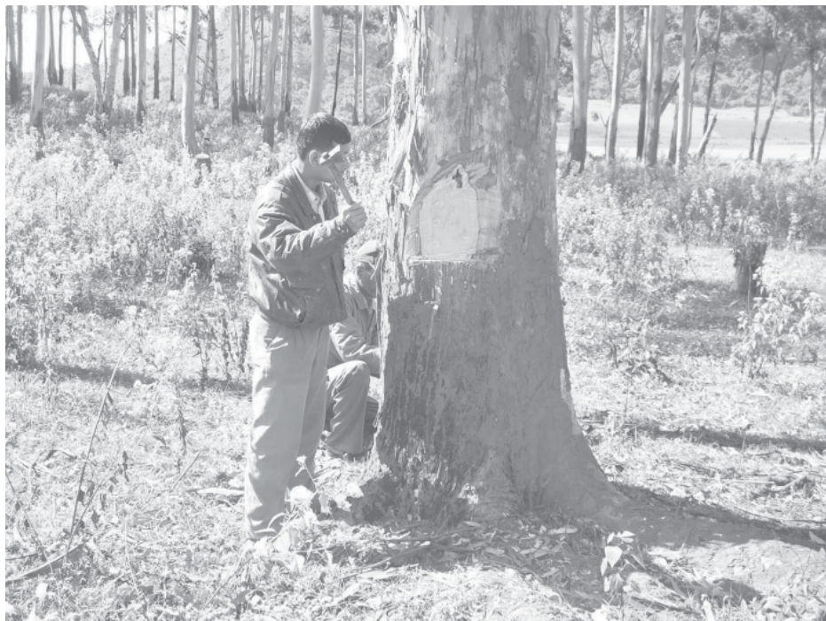
A worker preparing to cut down a eucalyptus tree near Pinhmi Village, Aungban Township.

Moreover, it is a fast-growing tree and it can be used for multipurpose. So, we grow eucalyptus on a large scale in monsoon tree-planting ceremonies. And we encourage rural people to grow eucalyptus trees beside their houses and farms, and along the village roads. Our