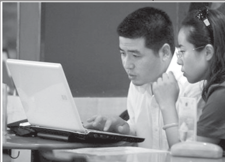
People use a laptop computer at a wireless cafe in Beijing. Chinese authorities insisted an Internet filtering programme will go ahead despite a last-minute decision this week to postpone making it mandatory on new PCs, state media said.

After taking office in January, the Obama Administration agreed to review the report to see what more could be released. However, due to political reasons, the report's release has been delayed from time to time.—MNA/Xinhua