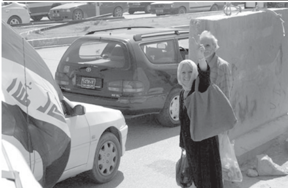
An old woman makes a victory gesture to Iraqi army in Baghdad, capital of Iraq, on 1 July, 2009, the first day of US combat troops withdrawing from major cities in Iraq.