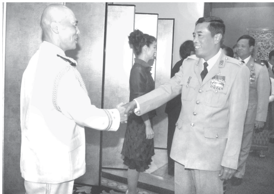
Brig-Gen Hla Myint Shwe of Ministry of Defence being welcomed by Japanese Defence Attaché to the Union of Myanmar Colonel Mitsuji Saratani at the reception to mark Japan Self-Defence Forces Day on 2 July.

local people at Kyunchaung Village. On 29 June morning, the minister visited Basic Education High School No (1) in Kungyangon. MNA