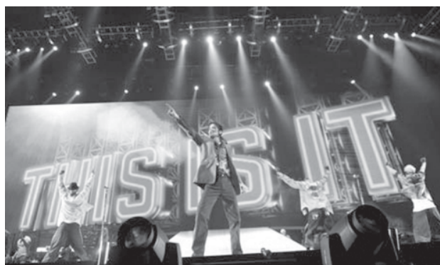
Pop star Michael Jackson rehearses for his planned shows in London at the Staples Center in Los Angeles, California in this handout photo taken on 23 June, 2009 and released on 29 June, 2009. Jackson, 50, died suddenly of cardiac arrest at his rented Los Angeles home on 25 June, just a few weeks before the planned string of 50 comeback concerts in London.—XINHUA

Alcantara, which is located at Maranon in Amazon state, has the broadest launch angle in the world because it is very close to the Equator, a factor that dramatically reduces launching costs, according to the minister. There are currently three rocket launching pads at the base.—Xinhua