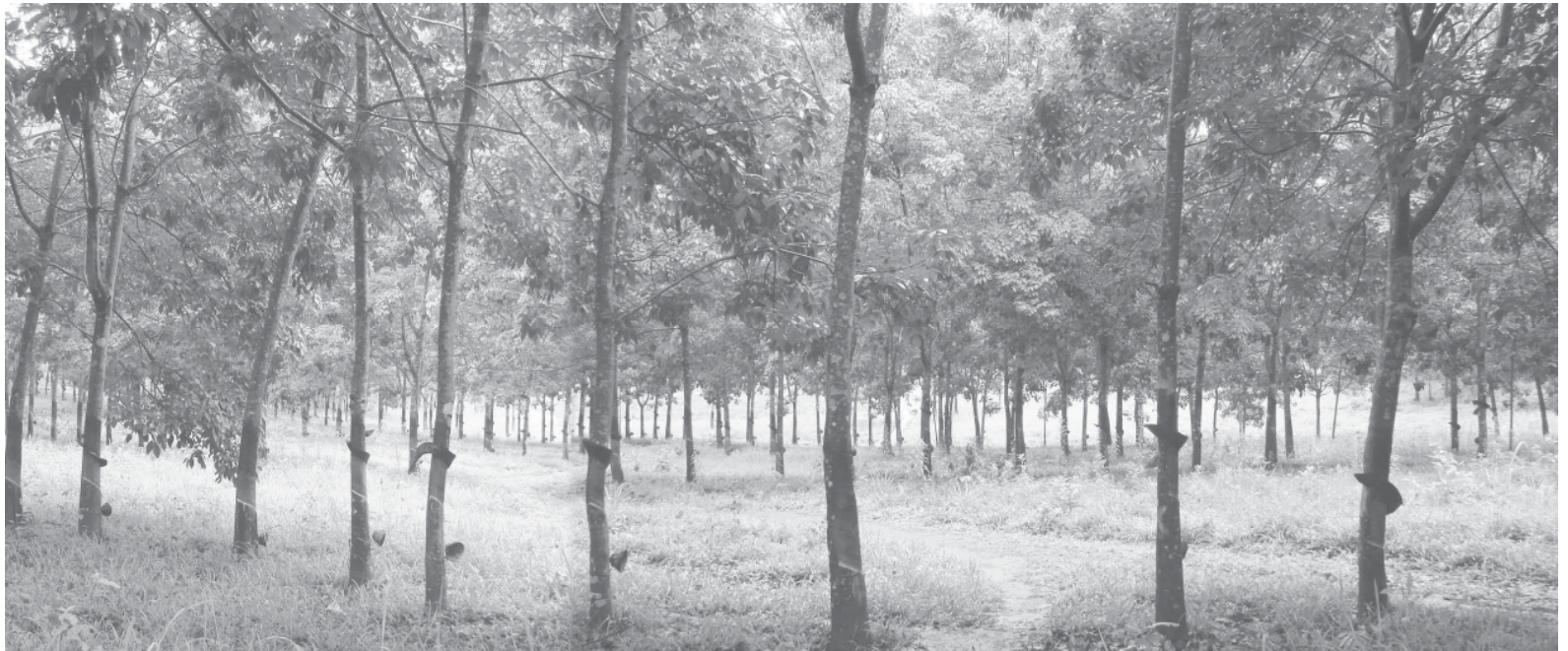
Shwe Phyu Rubber Farm in Yankhwe Village, Kengtung.

Upon arrival at the office of the manager of the Myanma Perennial Crops Enterprise Shan State (East) in Naungkon (See page 10)