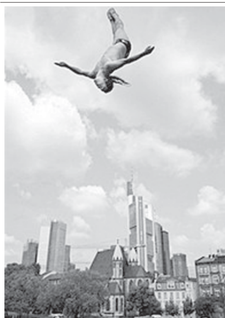
Colombian cliff diver Orlando Duque dives off the pedestrian bridge "Eiserner Steg" in the western German city of Frankfurt.

Other cases include an indebted Spanish builder who kidnapped his bank manager at gunpoint and the head of a construction firm who threatened to set himself on fire unless debts he was owed were paid.