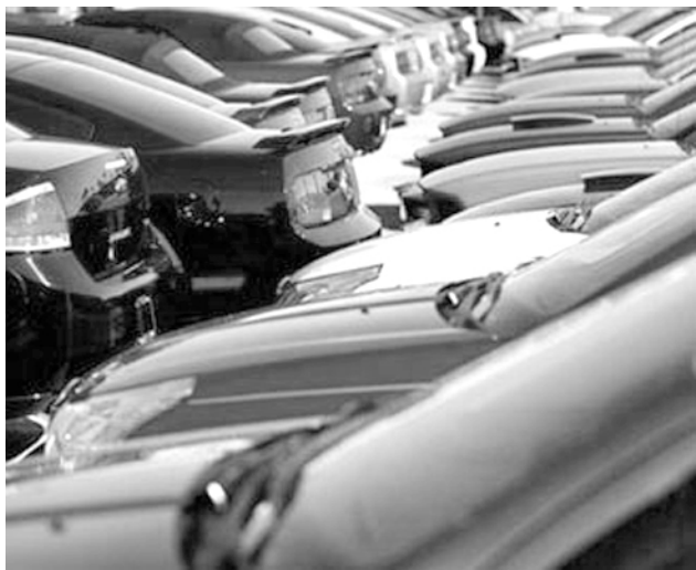
Cars are pictured at a Ford dealership in Miami, Florida. Automakers have welcomed a 28 percent drop in US auto sales in June as a sign that the badly hit industry was stabilizing and expressed hope that a government-funded "cash for clunkers" program would drive vehicle sales in July.