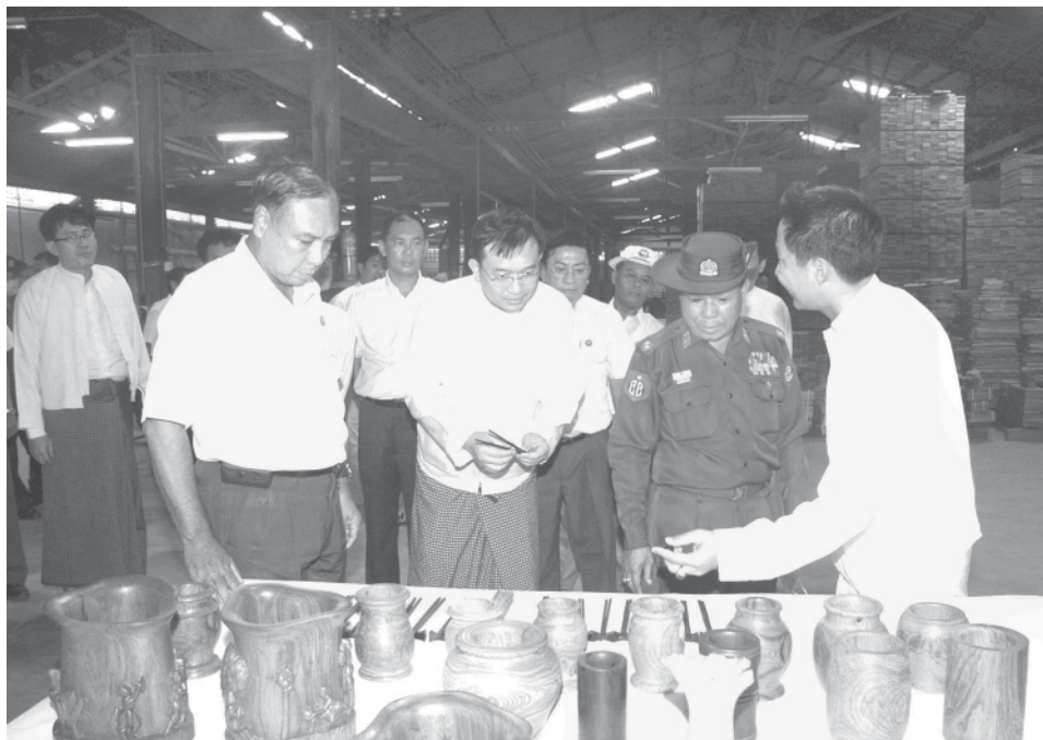
Minister Brig-Gen Thein Aung inspects Myitwa saw mill in Mandalay Industrial Zone.—MNA

YANGON, 2 July—Minister for Forestry Brig-Gen Thein Aung on 29 June inspected growing of 20 Eucalyptus plants each for 235 houses in Gwabintaw Village of Myinmu Township, cultivation of 500 Eucalyptus plants on one acre plot of village fuel wood plantation. The minister also viewed growing of 1,500 Eucalyptus plants in Pegadoe Village and gave necessary instructions. At the charcoal briquette factory of No. 103 Saw Mill in Amarapura, the minister looked into production process of briquettes. Officials conducted the minister round the factory. The minister inspected the State-owned and private-run finished wood factories in Mandalay. MNA