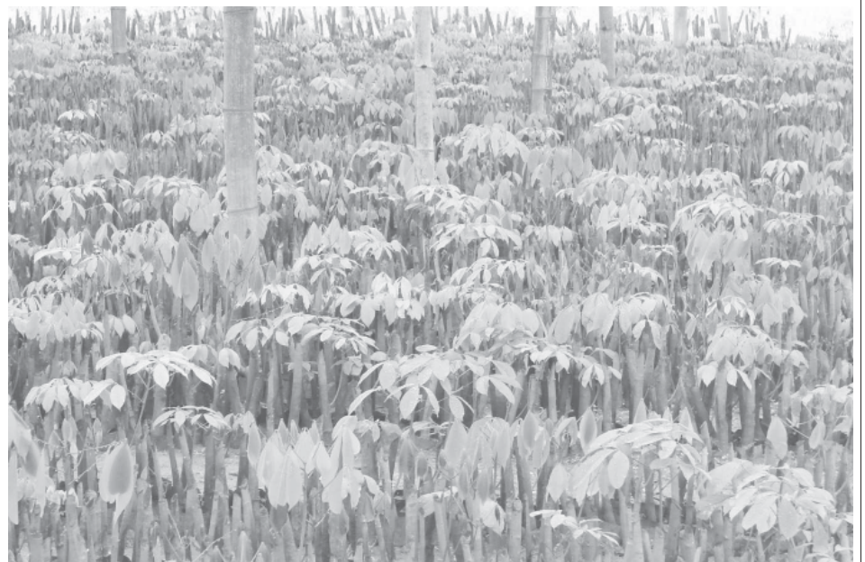
Rubber plants thrive in Shwe Phyu Rubber Farm.

Latex can be tapped from a rubber plant for over 30 years. Trunks of old rubber plants can be used to produce steamed rubber timber. Furniture made of steamed rubber timber is of high quality,