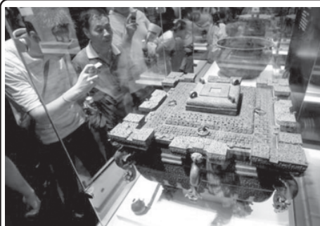
Local citizens watch the National Treasures — Exposition of Cultural Relics under Collection of the National Museum of China, in the Liaoning Provincial Museum in Shenyang, northeast China's Liaoning Province. The exposition, which is open to the public gratis and will last until on 31 August, presents a total of 78 pieces of national treasure-level cultural relics dated back from the paleolithic period to the Tang Dynasty (618-907), of which the top-notch cultural relics accounting for 72 percent of the total exhibits.

Austrian Airlines is Austria's largest airline with its principal hub in Vienna. It is a full-service air carrier. Its subsidiaries include Lauda Air and Tyrolean Airways. Lufthansa plans to pay 366 million euros (516 million US dollars) to buy 41.56 percent stake of Austrian Airlines now owned by the Austrian government.