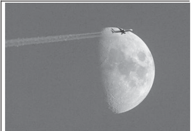
A British Airways passenger jet flies past the waxing moon over Zurich on 30 June, 2009.