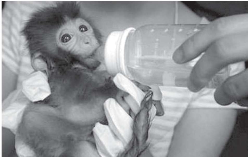
A baby macaque is fed water at a wildlife aid centre in Wuhan, Hubei Province on 1 July, 2009. The centre has been taking care of the macaque since its mother died of intestinal infarction five days after giving birth, according to China Daily.