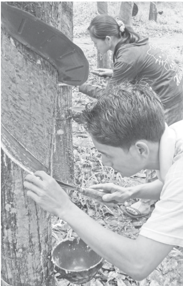
Workers tapping latex from rubber plants.

enterprise was set up in Shan State (East) in 1994-95 financial year. Then we demonstrated trial farms and explained the benefits of the rubber farming to