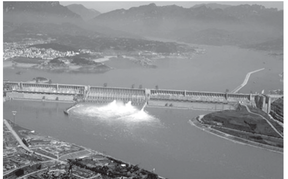
Photo taken on 1 July, 2009 shows the Three Gorges Dam opening two deep-holes and a trash way hole for sluicing the mounting flood water, in Yichang, central China's Hubei Province. The Three Gorges Reservoir has high influx of flooded water along with the arrival of Yangtze River's main flood season with recent days' persistent rainfalls.

Visitors watch a novel model of drone aircraft, during the National Exposition on Geographic Information Applications and Maps, which opens at the Beijing Exhibition Center in Beijing, on 1 July, 2009.