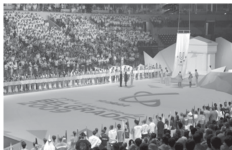
The flag of International University Sports Federation (FISU) is raised during the opening ceremony of the 25th universiade in Belgrade, capital of Serbia, on 1 July, 2009.

BELGRADE, 2 July — The 2009 Summer Universiade officially raised its curtain Wednesday with a spectacular opening ceremony. An hour before the