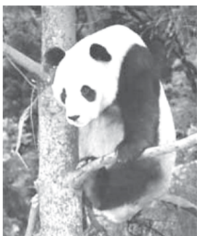
Giant pandas in China's Wolong Nature Preserve