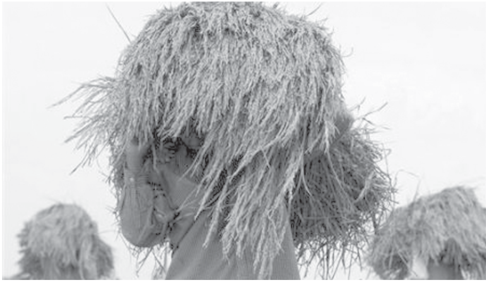
Farmers carry paddy stalks during a harvest at a field in Deli Serdang district of the Indonesia's North Sumatra province June 30, 2009. Indonesia's statistics bureau has projected 2009 unmilled rice output to rise 1.13 percent to 60.93 million tonnes, or the equivalent of around 38 million tonnes of milled rice.