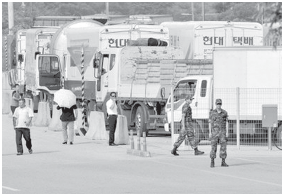
SKorean vehicles headed for the Kaesong Industrial Complex, are seen at a check point of the inter-Korean transit office in Paju, on 2 July.