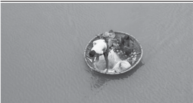
A fisherman and his wife fish in the waters of Vembanad Lake in the southern Indian city of Kochi on 30 Jun, 2009.