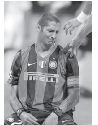
World Cup winning centre-back Marco Materazzi.

Materazzi, who was a bit-part player for Jose Mourinho last season, will be almost 39 by the time his deal runs out." Now I can write it because it's written on a contract, I'll be nerazzurro for life,"