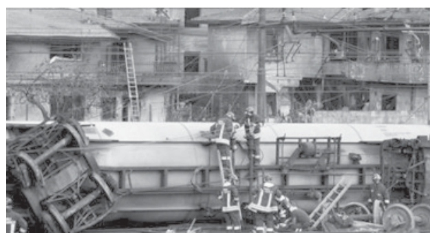
Rescue workers work near a rail tanker car lying on its side after a derailment and explosion in Viareggio, about 350 km north of Rome on 30 June, 2009. At least 14 people were killed and 50 injured overnight in Italy.