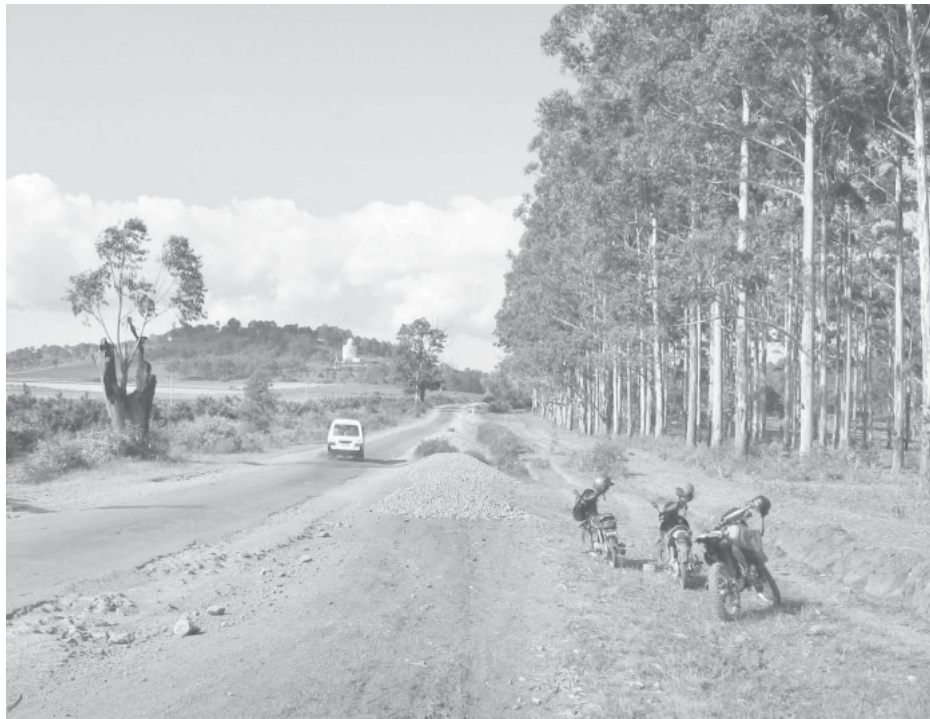
Eucalyptus trees are nurtured along roads in Shan State (South).

PyinOoLwin District. So far, we have set up 188,263 acres of eucalyptus plantations. We grow eucalyptus for re-greening arid regions, conservation of watershed areas, and forming wind-breaking tree rows for farmlands and beekeeping farms in seaside regions.