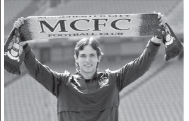
Manchester City's new signing Paraguay striker Roque Santa Cruz is pictured during a photocall in Manchester.

But City manager Mark Hughes is hoping to invest a total of 50 million pounds (83 million dollars) to secure the services of Barcelona's Eto'o and Argentina's Tevez, who is available for 25 million pounds (41 million dollars) after his two-year loan at neighbours Manchester United expired. — Internet