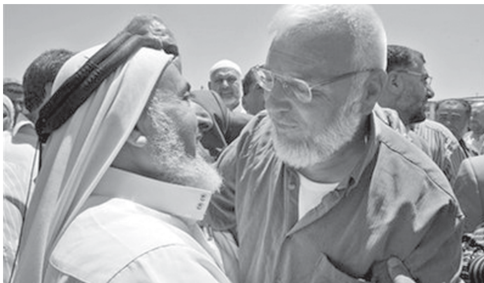
Palestinian parliament speaker Abdel Aziz Duaik, right, is greeted by a relative at the DCO checkpoint in the West Bank city of Tulkarem, after his release from an Israeli prison, on 23 June, 2009.