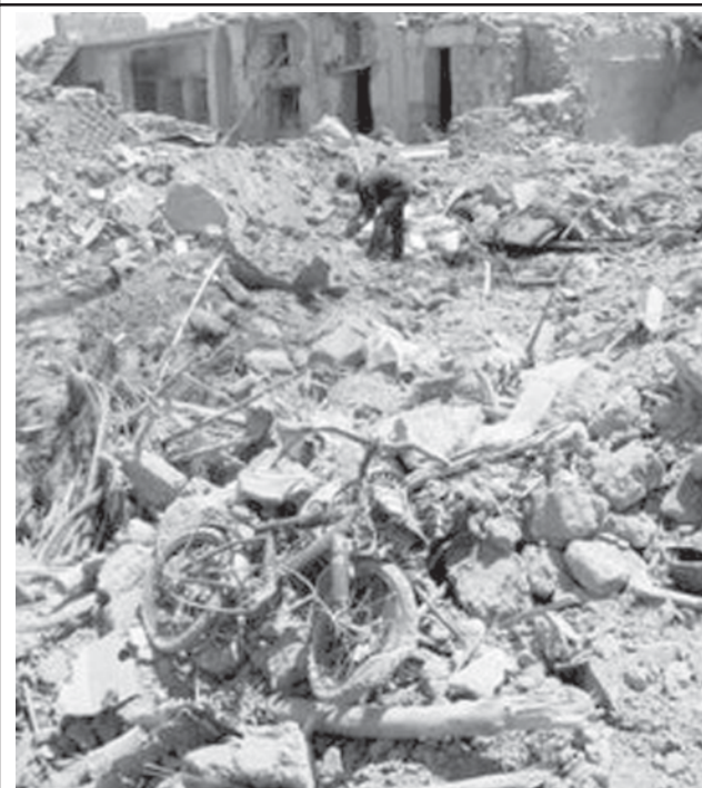
A resident searches for belongings amid the ruins of his house after a suicide bomb attack in Kirkuk, 250 km (155 miles) north of Baghdad, on 21 June, 2009.

In Thi Qar province, a little to the north of Basra snakes are leaving their holes because of the drought in the marshes. The families said that tens of snakes attack their farms and they are obliged to guard their homes and animals day and night to protect them from the onslaught of yet another enemy. The medical centers in these areas also lack the simplest means to take care of those besieged people. There was no anti-venom. No one asks after them. No one really cares.