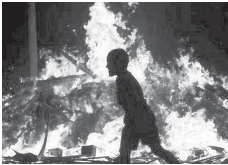
A child walks past a bonfire during San Juan night in Paredes, northern Spain early 24 June, 2009. —INTERNET

Myanmar Motion Picture Enterprise No. 28, Kokkine Yeiktha Street, Bahan Township