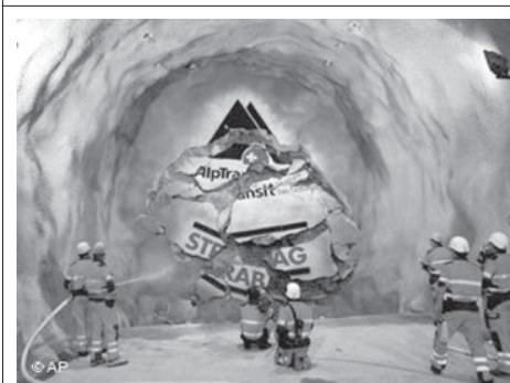
Six months ahead of schedule, a further step has been taken towards completion of the Gotthard Base Tunnel in Switzerland. The section between Erstfeld and Amsteg was opened up. Scheduled to open in 2017, the rail tunnel will be the longest in the world.