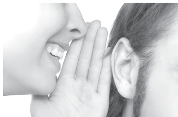
We humans prefer to be addressed in our right ear.