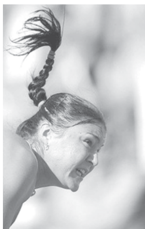
World number one Dinara Safina, seen here in May 2009, admits she needs to free herself of her fear of losing if she is to finally clinch an elusive Grand Slam title.

Safina, the beaten finalist in Australia and at Roland Garros this year, shrugged off a knee injury on Court One.—Internet