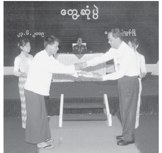
Minister for Education Dr Chan Nyein receives documents related to schools handed over by responsible persons of construction companies.—MNA

The Prime Minister and party inspected construction of streets and planting shady trees wind breakers and kitchen booths, library and