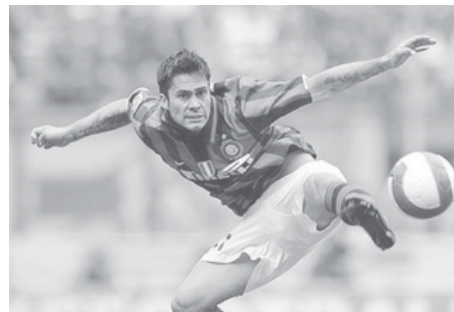
Italian champions' Inter Milan's Chilean international striker Luis Jimenez

LONDON, 24 June—Italian champions' Inter Milan's Chilean international striker Luis Jimenez was snapped up on loan by English Premier League side West Ham on Tuesday.