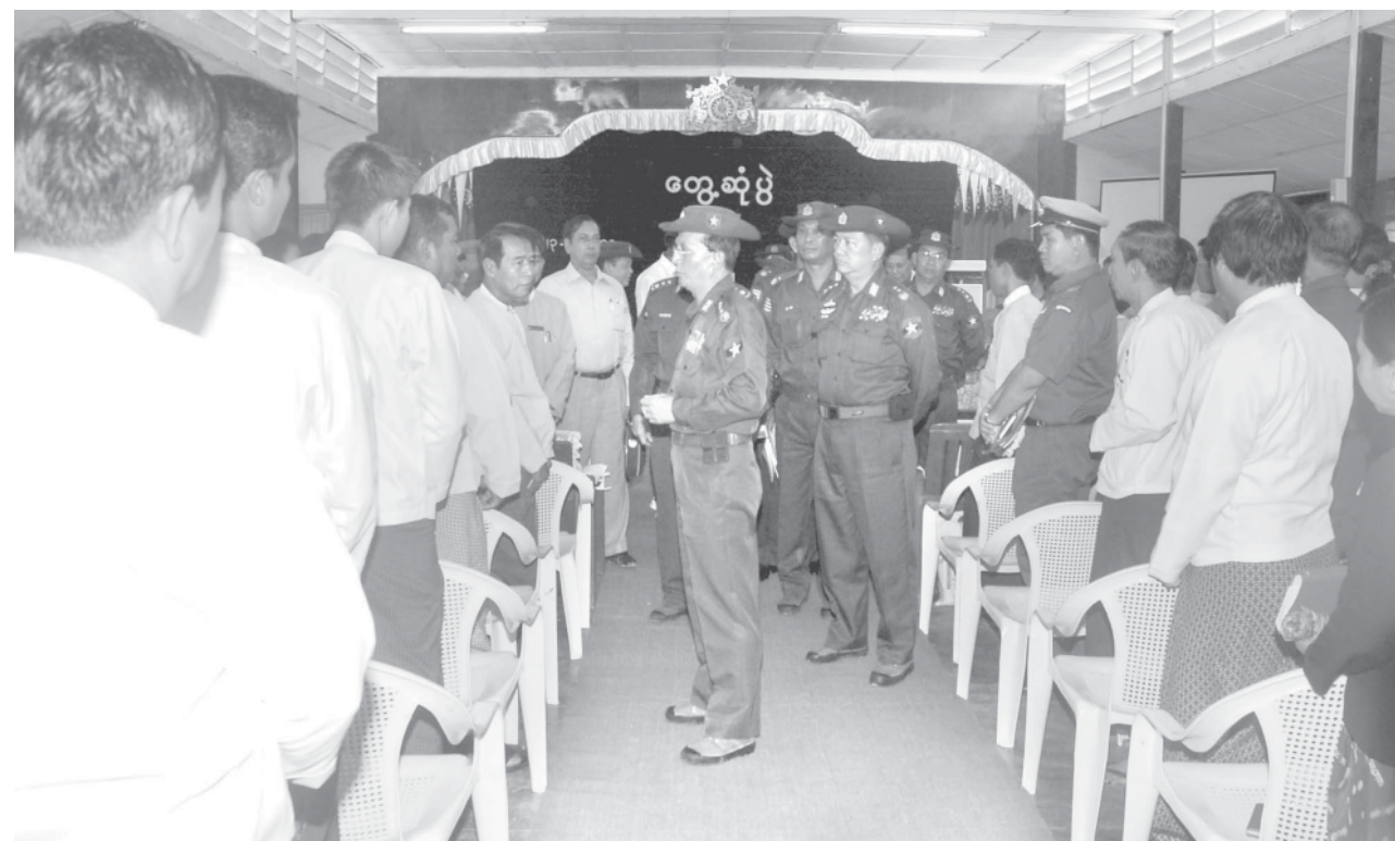
Prime Minister General Thein Sein cordially greets people who attend ceremony to hand over 41 newly-built Basic Education Schools and two monasteries in Mawlamyinegyun Township.—MNA

education schools and two monasteries in Mawlamyinegyun Township.