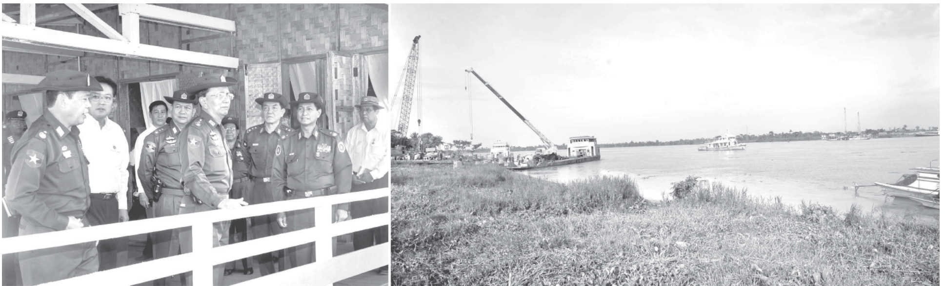
Prime Minister General Thein Sein inspects Yazudaing No. 1 Bridge project in Mawlamyinegyun Township.—MNA

Prime Minister General Thein Sein inspects reconstruction tasks in Mawlamyinegyun Township