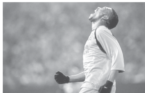
English Under-20 international striker Daniel Sturridge

Manchester City manager Mark Hughes had been earnest in his efforts to keep Sturridge but was reluctant to agree to his wage demands.—Internet