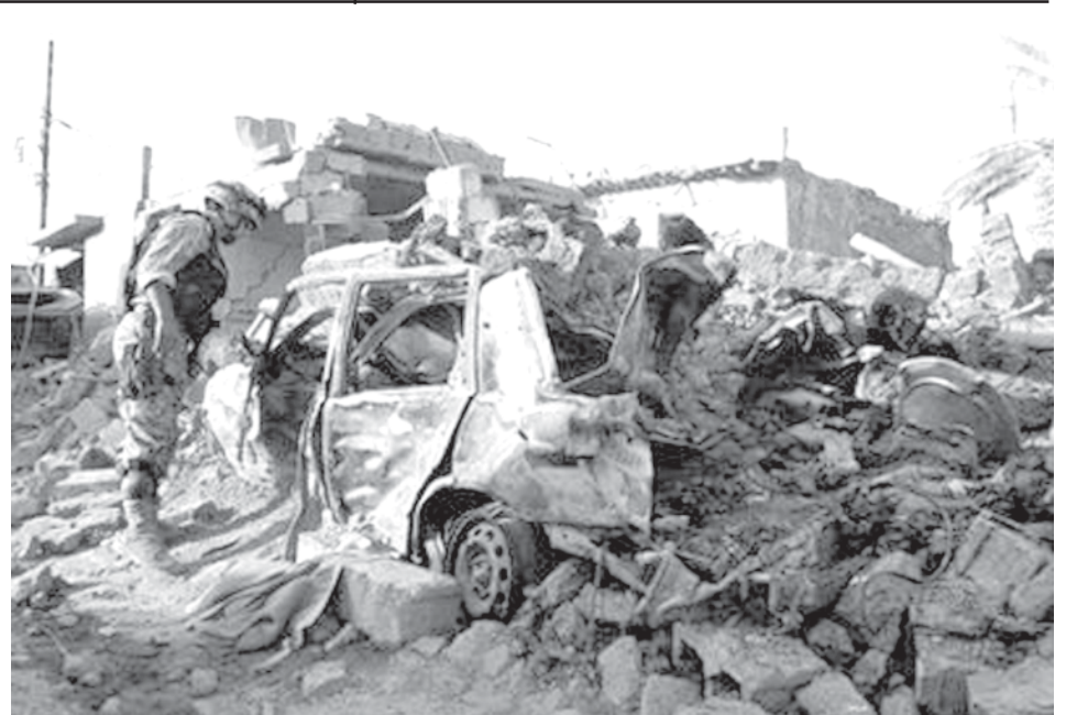
An Iraqi policeman surveys the damage from a truck bomb that exploded the day before in the northern Iraqi city of Kirkuk. Residents of the town hit by Iraq's bloodiest attack in 16 months were searched for their loved ones after a massive truck bombing killed 72 people and destroyed dozens of houses.