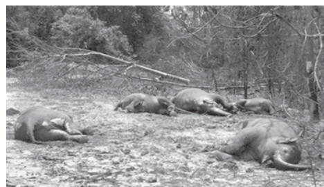
In this Wednesday, 1 March, 2006 file photo, five wild elephants lie on the jungle floor after they were found poisoned to death near Mahato village, about 300 kilometres (180 miles) north of Pekanbaru, the capital of Riau Province.

The killing is the result of a "conflict between humans and elephants," said Syamsidar, who like many Indonesians goes by a single name. "The forest is in critical condition due to the illegal logging, slash-and-burn farming practices and plantations."