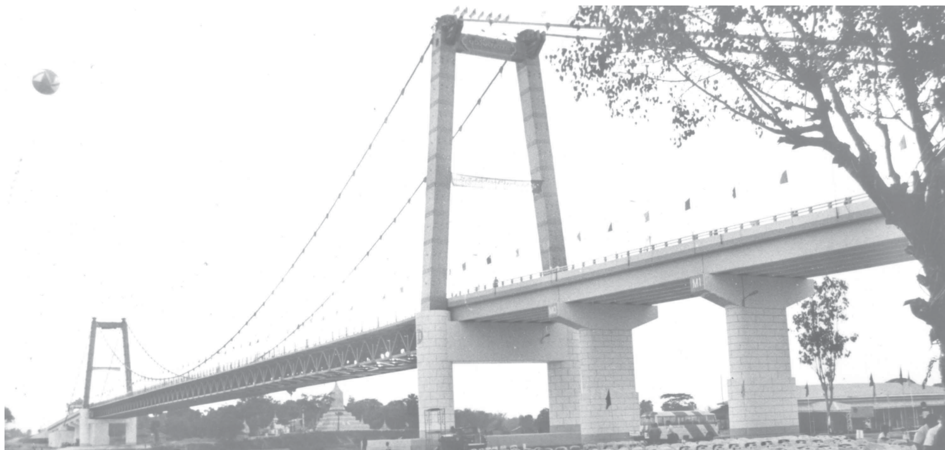
Pathein Bridge inaugurated on 22 November 2004 lies over Ngawun River in Pathein Township, Ayeyawady Division.