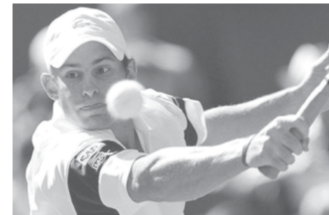
US Andy Roddick returns a backhand to France's Jeremy Chardy during their first round match of the 2009 Wimbledon tennis championships at the All England Club. Roddick won 6-3, 7-6 (7/3), 4-6, 6-3.