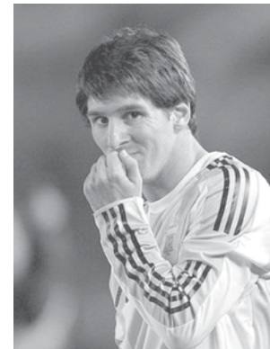
Barcelona star Lionel Messi

million, followed by Liverpool's Spanish striker Fernando Torres at 67 million. The study cited Barcelona's European Champions League victory, and Messi's goal in the final, for his leap to number one in the media rankings over last year's winner Ronaldo.—Internet