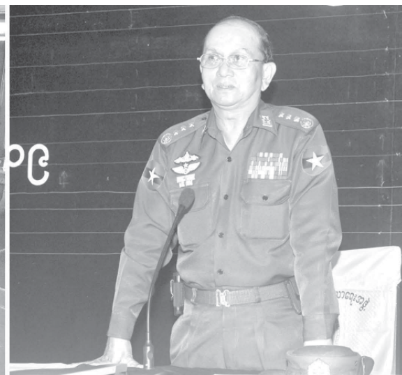
Prime Minister General Thein Sein delivers a speech at a ceremony to hand over 41 newly-built Basic Education Schools and two monasteries in Mawlamyinegyun Township.—MNA