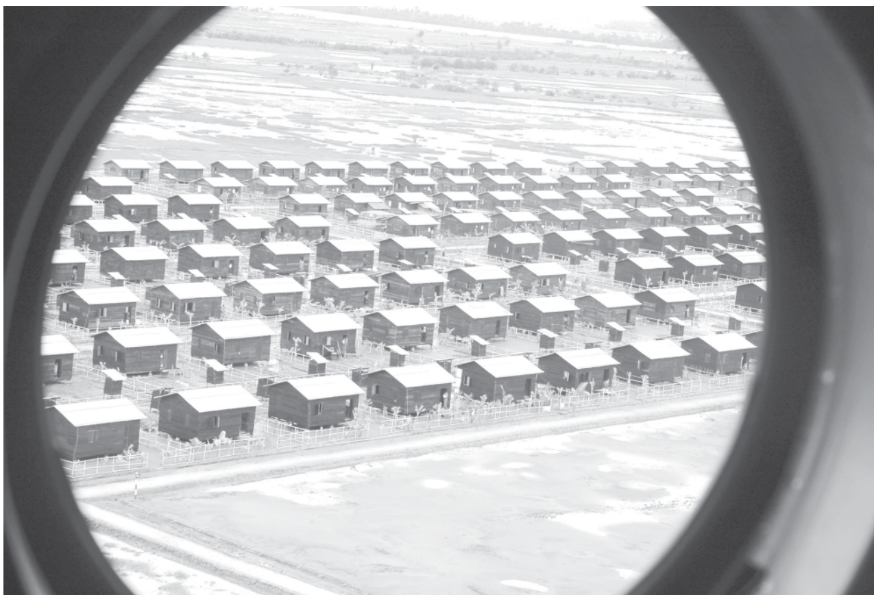
A bird eye's view of Danichaung Model village in Kyatshar Village-tract, Mawlamyinegyun Township.