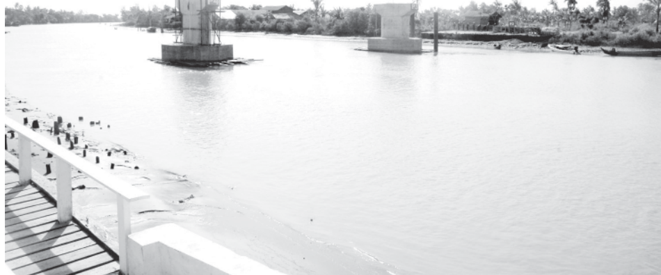
Prime Minister General Thein Sein inspects progress in construction of Yazudaing Bridge No. 2 in Mawlamyinegyun Township.—MNA

Chief Engineer U Tint Lwin of Bridge Construction Project Special Group(1) reported to the Prime Minister on progress in construction of Yazudaing Bridge No (1) and Minister for Construction Maj-Gen Khin Maung Myint and Deputy Minister Brig-Gen