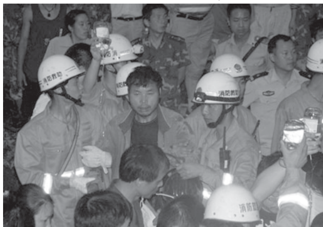
A trapped worker is helped out of a flooded gold mine in Tianzhu County of Qiandongnan Autonomous Prefecture of Miao and Dong Nationalities, southwest China's Guizhou Province, on 23 June, 2009.

The contracts seek to improve automatic production systems, build transport lines and production platforms, expand gas collection centers and set up new gas centers. Only domestic companies are allowed to participate in the bidding for gas collection centers and new gas centers. The 50,000-square-kilometre basin, which spans the three Mexican states of Tamaulipas, Nuevo Leon and Coahuila, produced 1.5 billion cubic metres of gas a day in May, up around 10 percent from a year earlier.— Internet