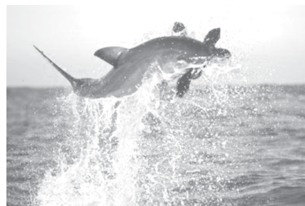
Spatial patterns of shark predation were not random and that smaller sharks had more dispersed prey search patterns and lower kill success rates than larger sharks.—INTERNET