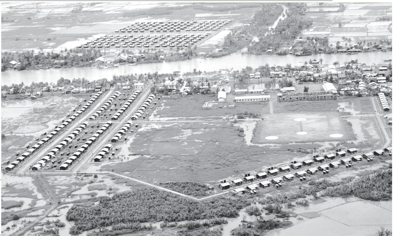
Photo shows houses in neat rows at Hlinephone village, Mawlamyinegyun Township.

NAY PYI TAW, 24 June—Chairman of Natural Disaster Preparedness Central Committee Prime Minister General Thein Sein who was in Patheingyi, Ayeyawady Division, accompanied by Lt-Gen Ko Ko of the Ministry of Defence, Chairman of Ayeyawady Division Peace and Development Council Commander of South-West Command Maj-Gen Kyaw Swe, the ministers, the deputy minister, the director-general of the Government (See page 8)