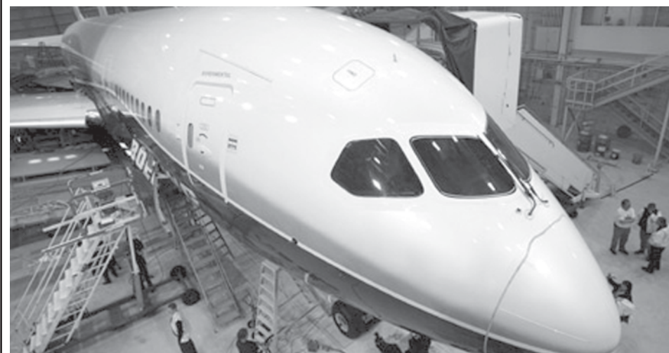
The Boeing company's first 787 Dreamliner is readied for its first test flight, scheduled for June, at the Boeing company's Everett, Washington plant, on 30 April, 2009.