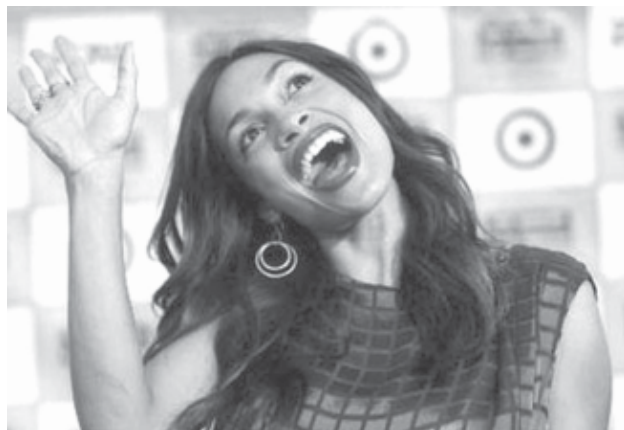
Actress Rosario Dawson waves at the premiere of the movie "Public Enemies" at the Mann Village theatre in Westwood, California on 23 June, 2009. The movie opens in the US on 1 July.