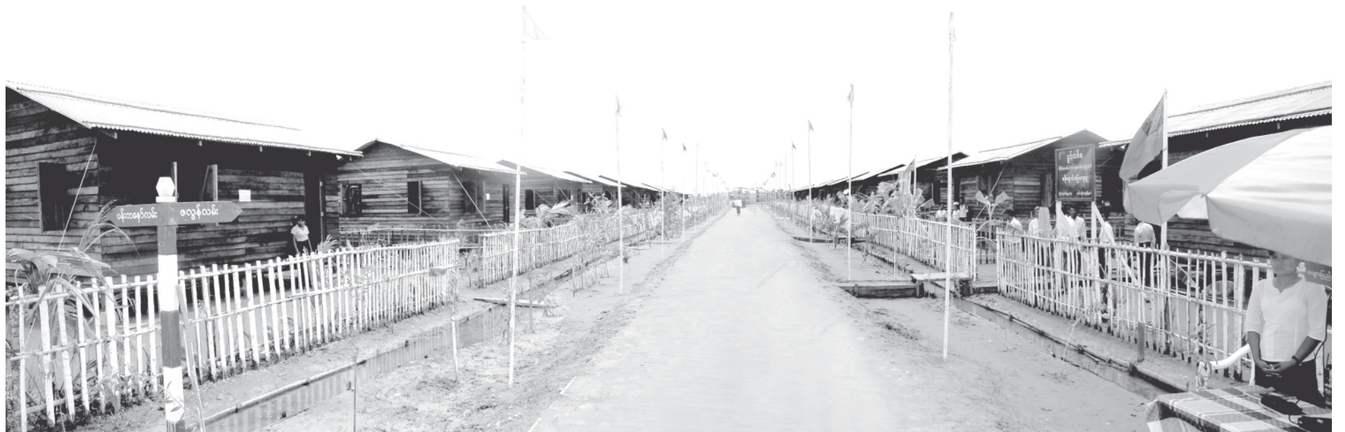
Photo shows Danichaung Model village, Kyatshar village-tract in Mawlamyinegyun Township.