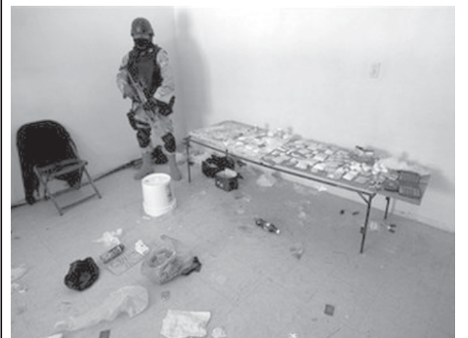
A Mexican soldier stands next to seized drugs found in a store at the crafts market in Tijuana, Mexico, on 23 June, 2009.