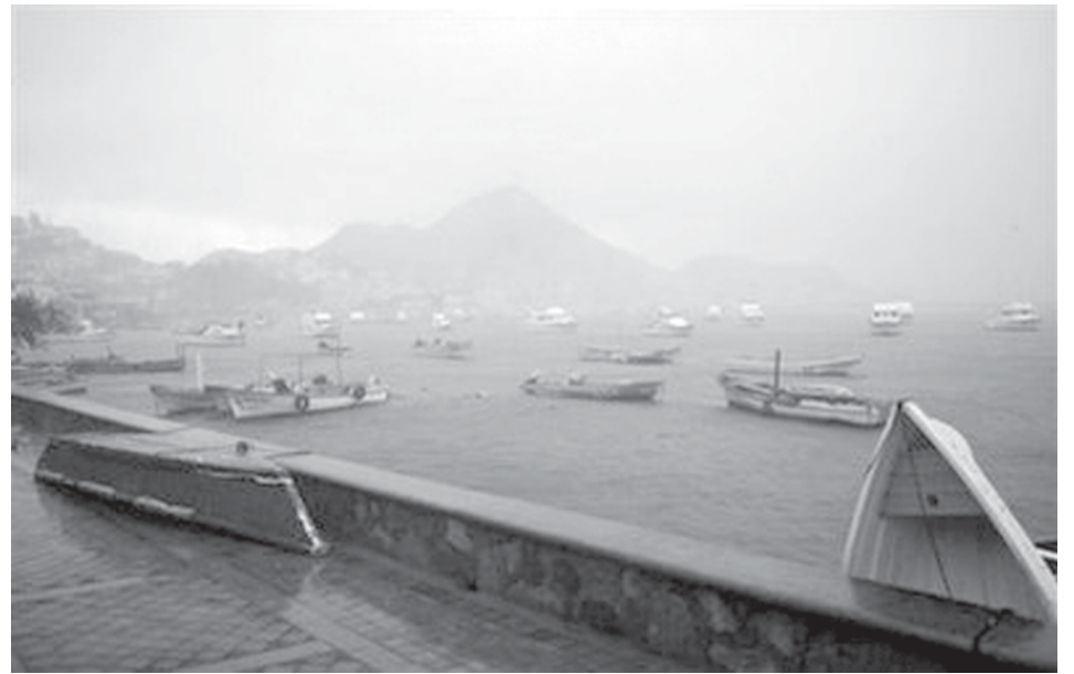
Boats are seen moored as hurricane Andres arrives in the Pacific resort city of Manzanillo, Mexico on 23 June, 2009. Andres strengthened into the Pacific season's first hurricane as it flooded homes, toppled trees and killed at least one person on its way up Mexico's southwestern coast.