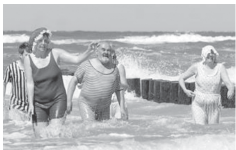
People wearing historical bathing costumes at the Heiligendamm beach resort on the Baltic Sea in northern Germany. The annual event recalls the bathing tradition in the oldest German seaside resort dating back to the 19th century.