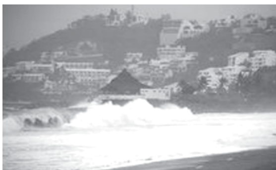
Mexico - A weakening Tropical Storm Andres was heading out to sea on Wednesday after flooding homes and killing at least one person on Mexico's southwestern coast, but forecasters warned the storm could still brush the tip of Baja California.

"Talks will specifically focus on exchanging views on the Middle East, primarily on the Arab-Israeli peace process," a senior Kremlin official told reporters. Egypt's state-owned Al-Ahram newspaper said Medvedev and Egyptian President Hosni Mubarak would "discuss efforts to revive the peace process in the Middle East and achieve a lasting peace based on two states".