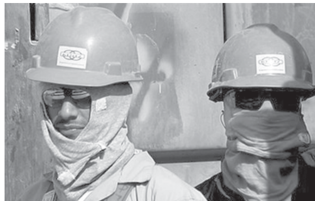
File photo shows Asian workers at Saudi Aramco's Al-Khuraish facility covering their faces from the dust and blazing sun.