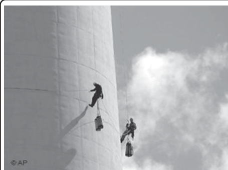
Industrial climbers remove the mounting parts of an advertising banner from the TV tower in Berlin. At a height of 368 metres, it's Europe's tallest building.