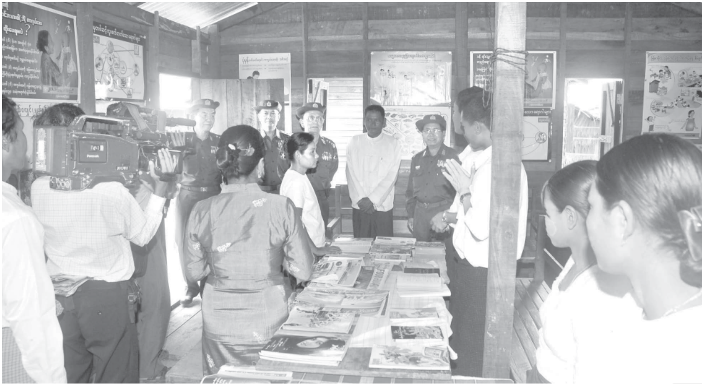
Prime Minister General Thein Sein views local people reading at Pwinthitsa self-reliant library in Danichaung Model village in Mawlamyinegyun Township. MNA

Kyaikpi is 180 feet long. The motorway of the bridge is 20 feet wide one-way lane flanked by one-two-foot wide pedestrian lane on each side. The clearance of the bridge is 180 feet wide and 20 feet high and the bridge can withstand 60-ton loads.