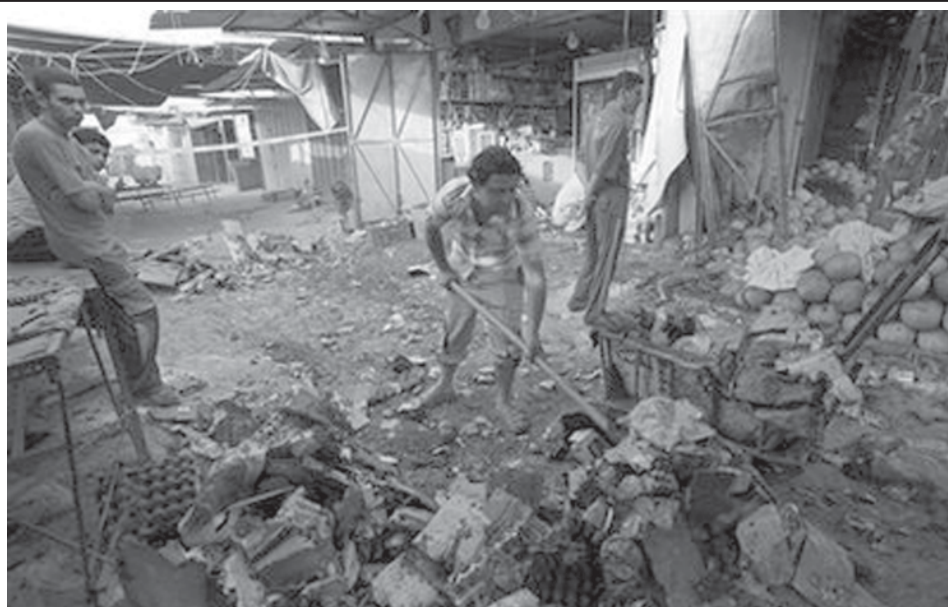
Iraqi shop owners clear debris a day after a parked motorcycle loaded with explosives blew up in a market at Husseinia, north east of Baghdad, Iraq, on 23 June, 2009.

Dan McNorton, a spokesperson of UN Strategic Communication, while talking with Xinhua , said "no UN or UNHCR staff were killed in Jauzjan this morning."