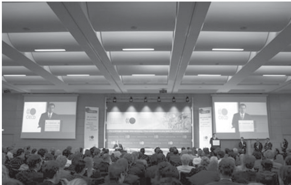
Prime Minister of the Republic of Korea (ROK) Han Seung-soo addresses the opening ceremony of the Organization for Economic Cooperation and Development (OECD) Forum 2009 in Paris, capital of France, on 23 June, 2009.