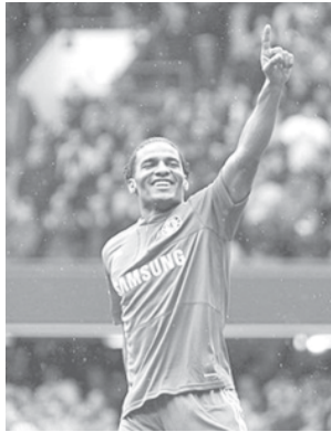
Chelsea's French international midfielder Florent Malouda

LONDON, 24 June—Chelsea's French international midfielder Florent Malouda signed on Tuesday a four-year contract extension with the FA Cup winners.