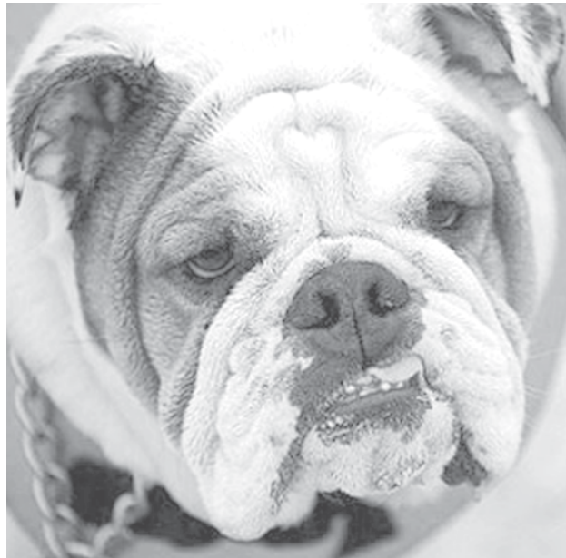
A dog attends the 4th Annual Loews Coronado Bay Resort Surf Dog Competition in Imperial Beach, California.

In 1976 he was appointed spokesman for then secretary-general Kurt Waldheim of Austria. He performed the same role for Waldheim's successor, Peruvian Javier Perez de Cuellar and — for one year — for Boutros Boutros Ghali of Egypt, who followed Perez de Cuellar.— MNA/Reuters