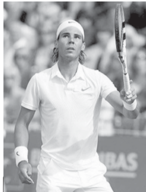
Rafael Nadal of Spain switches end during an exhibition match against Lleyton Hewitt of Australia at The Hurlingham Club in West London, England. Nadal lost 6-4, 6-3.

Nadal is suffering from tendonitis in both knees which saw him fade to a stunning defeat in the French Open fourth round by eventual finalist Robin Soderling of Sweden.