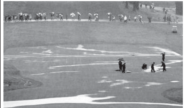
Spectators leave the course as grounds crew squeegee water off the 18th fairway during first round play in the US Open golf championship on the Black Course at Bethpage State Park in Farmingdale, New York, on 18 June, 2009.—INTERNET

They were the unlucky ones, this group of morning starters that included Tiger Woods. Now, wet, tired and sick of sitting around the locker room, they were beginning to realize just how unlucky they might really be.— Internet