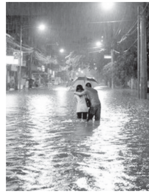
File photo shows floodwaters submerging a street in suburban Manila in the Philippines.

world's poorest live in our region, and they are the most severely and disproportionately affected by climate change," he said on Friday.