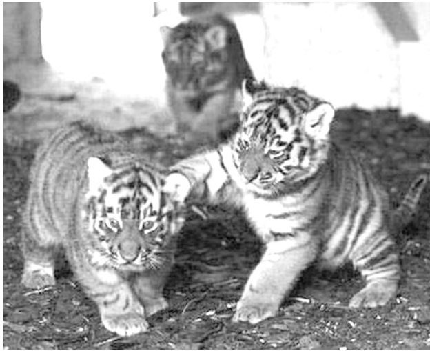
Five-week-old Amur tiger cubs play with each other at the Highland Wildlife Park near Kingussie, Scotland, on 16 June, 2009. Their parents Sasha and Yuri, have now bred nine cubs in total with the last three born on 11 May, 2009. Amur tigers, previously known as Siberian tigers, were renamed in the 1990's as they are now only found the Amur River valley in Russia, and no longer in Siberia, hence their new name.