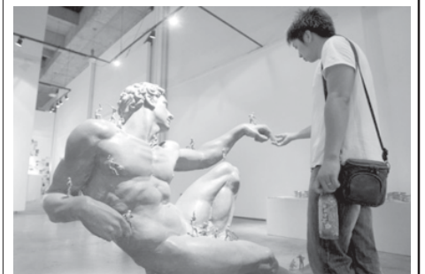
A visitor views a sculpture named ‘Create Adam’ at an exhibition for graduates of China Academy of Art in Hangzhou, capital of southeast China’s Zhejiang Province.

The university and licensee Quantum Electro Opto Systems in Melaka, Malaysia, reported the fabrication and testing of the new high-speed light-emitting transistor and the new “tilted-charge” light-emitting diode.