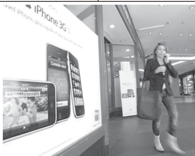
A woman exits a shop where Apple iPhone 3GS are on sale in Paris, on 19 June, 2009. The new iPhone sports a faster processor, longer battery life, an internal compass, a video camera and a photo camera with better resolution and auto-focus.