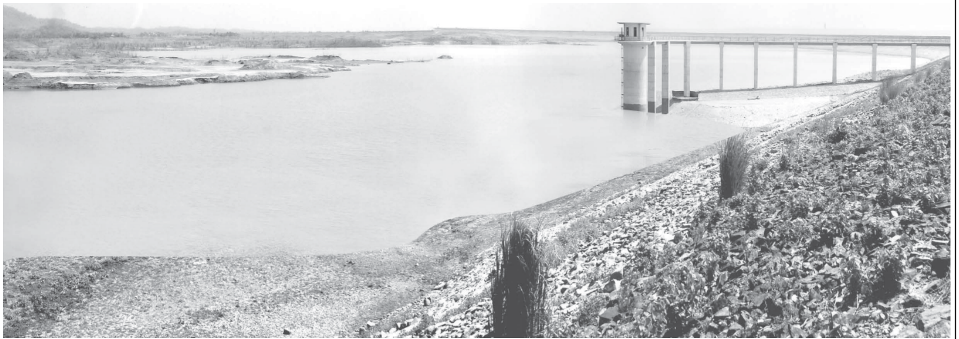
Kunchaung Dam near Tatkon Village, Kyangin Township, Hinthada District, Ayeyawady Division.

When asked about the irrigation system, he said that then the dam had irrigated sufficiently the summer paddy fields in the two townships; that irrigation water was supplied earlier to summer paddy fields than last year, and 16,000 more acre feet of water could be supplied to the farms; that they carried out maintenance work to the dam. (See page 10)