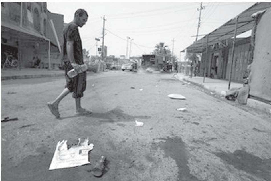
File photo shows an Iraqi man walks across the blood stained street where three US soldiers and four Iraqis were killed in a blast in Dora neighbourhood in Baghdad, Iraq.