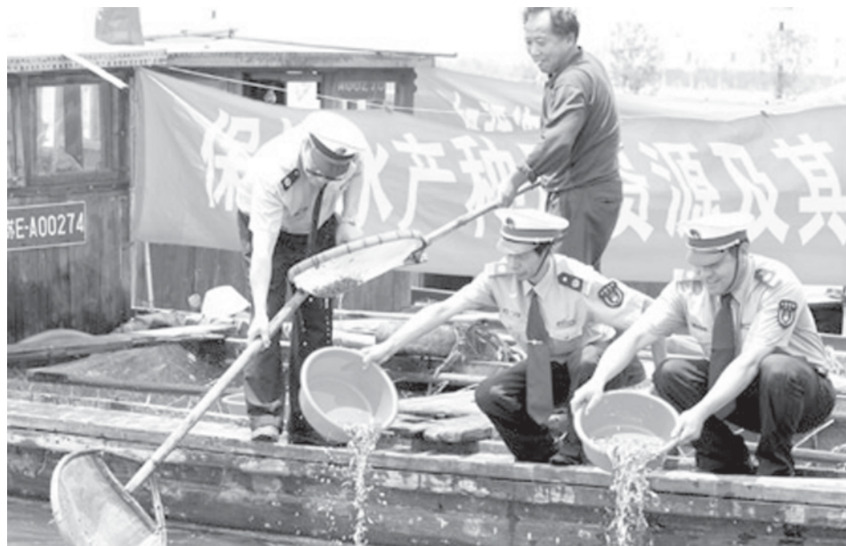
The pupils release fish fry into the water by the Chunshen Lake in Suzhou City of east China's Jiangsu Province, on 18 June, 2009. More than 10 million fish fry were released into the rivers and lakes within the city area of Suzhou on Thursday to improve the city's ecological environment.