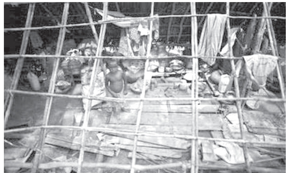
A boy stands inside a temporary shelter made by his parents as the family has been displaced from their land by a tidal wave caused by cyclone Aila in Shatkhira, on 19 June, 2009.