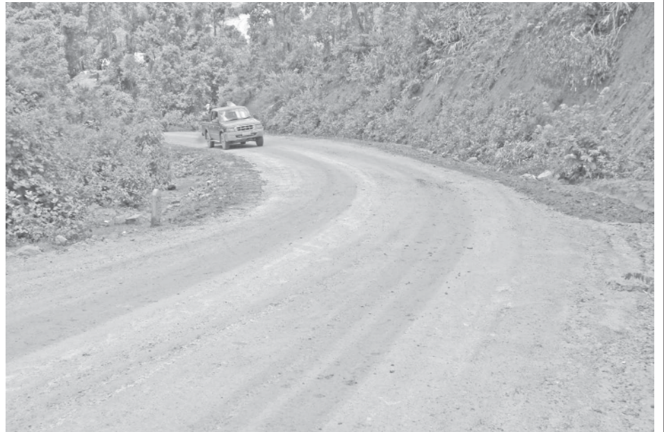
Photo shows better condition of Kengtung-Monghsat Road.

In the past, the travellers spent four-five nights on their trips along 281-mile Kengtung-Taunggyi Road due to poor transport. A few number of buses of the bus lines could not realize the transport schedules of the buses regularly. At