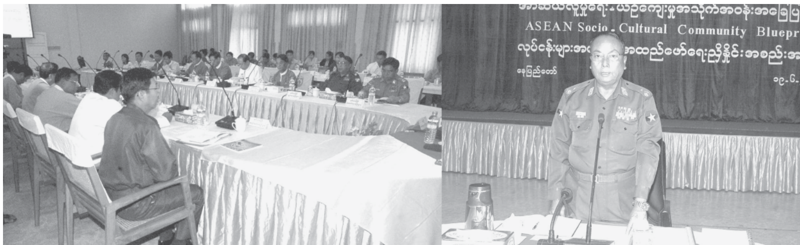
Minister Maj-Gen Khin Aung Myint delivers an address at coordination meeting for implementation of Socio-Cultural Community Blueprint.—MNA

Afterwards, the minister also inspected intravenous injection, infusion ingestion, antibiotic injection and production of anti-rabies vaccines through tissue culture divisions and gave necessary instructions.—MNA