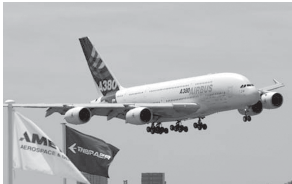
An Airbus A380 aeroplane is seen during the 48th international Paris Air Show at Le Bourget airport in Paris, France, on 17 June, 2009. Airbus held a celebrating ceremony here on Wednesday.