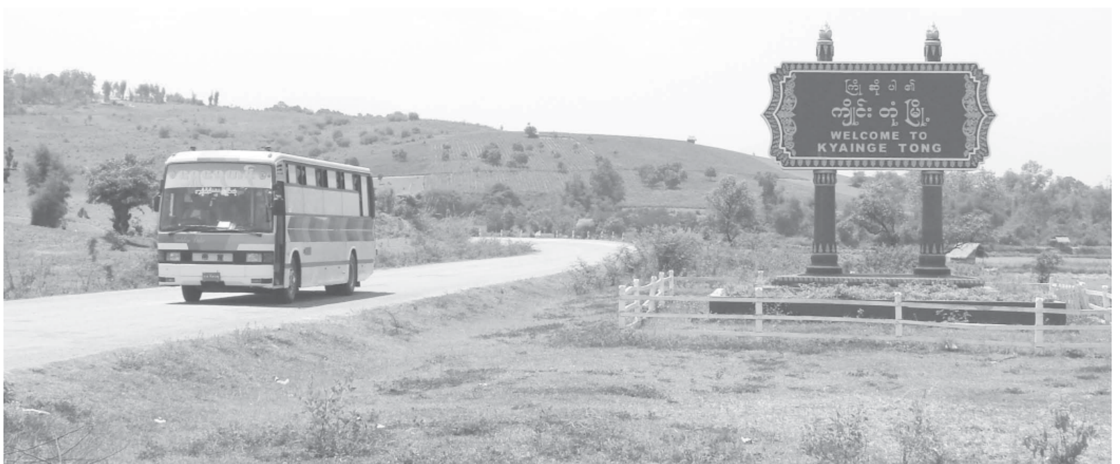
A highway bus leaving for Tachilek seen at exit of Kengtung.