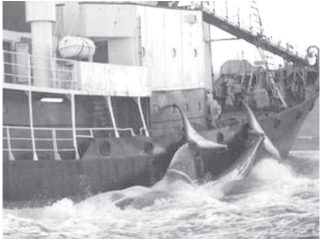
A whaleship brings two fin whales to base in Hvalfjordur, Iceland, on 19 June, 2009 as the fin whale season started on Thursday. Japan and Norway are giving large subsidies to their whaling industries, which have become unprofitable due to rising costs and declining demand for whale meat, the WWF said on Friday.