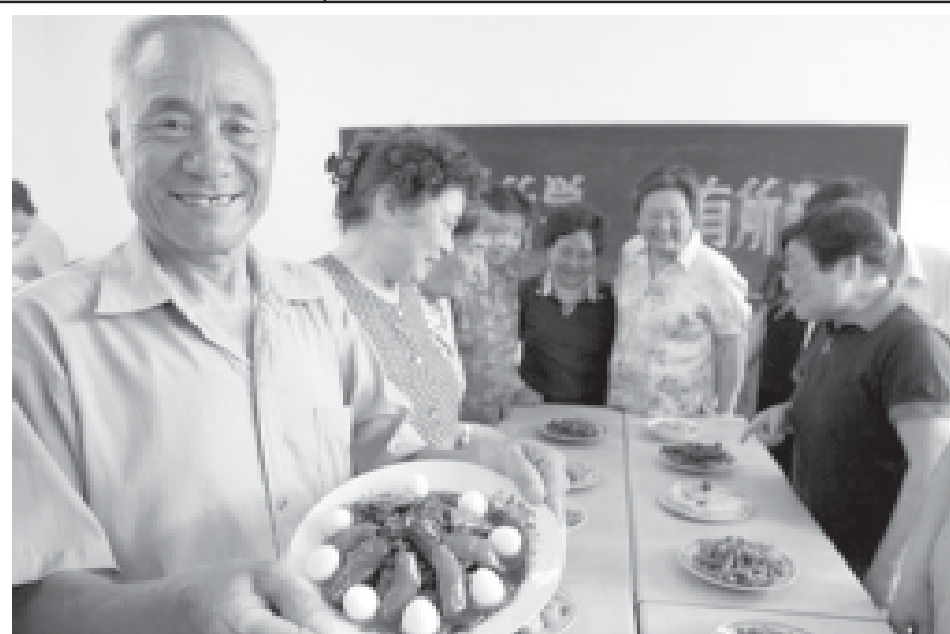
A senior citizen shows a dish at the Senior Citizens University of Jinchang District in Suzhou, east China's Jiangsu Province, on 15 June, 2009. Elders in the area put on their cooking skills to show their happy life.