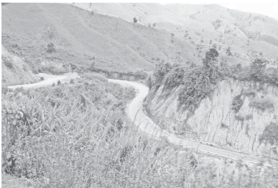
Kengtung-Taunggyi Road seen on hilly area.

to ensuring traffic safety as the main task because there are about 1500 vehicles in the region."