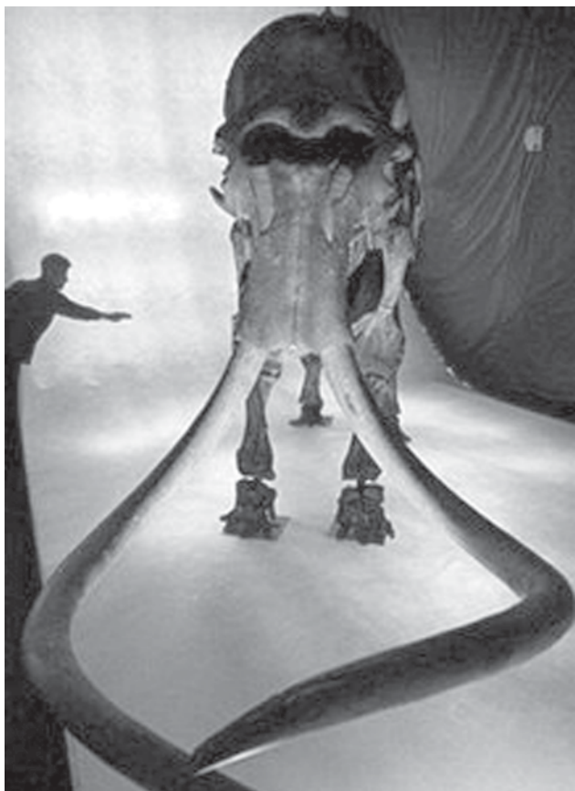
A woman works on an exhibit at a mammoth show. Woolly mammoths survived in Britain until 14,000 years ago, around 6,000 years longer than previously thought, according to a study released on Thursday.—INTERNET

"Although pregnant women typically reduce their working hours or workloads at the end of the pregnancy, our results suggest that reducing job strain and working hours in the initial stages of pregnancy may be beneficial among women with stressful full-time jobs," the researchers concluded.— Internet