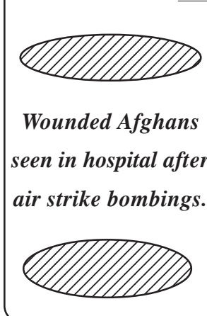
Wounded Afghans seen in hospital after air strike bombings.