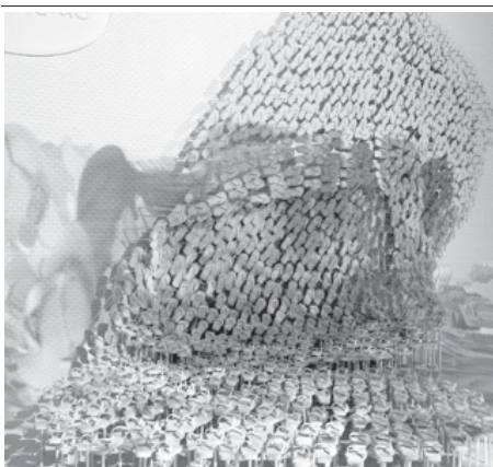
Hundreds of Havaianas slippers are used to form a slipper-shape artwork in the Ibirapuera Park in Sao Paulo, Brazil. Havaianas, the most famous Brazilian slipper brand, gets more and more popularity in the world these years and has been selected into the gift package of Academy Award for 4 times.