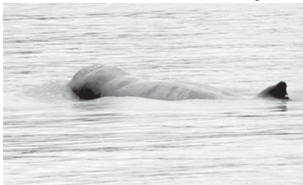
File photo of a dolphin in the Mekong river, northeast of Phnom Penh. Pollution in southeast Asia’s Mekong River has pushed freshwater dolphins in Cambodia and Laos to the brink of extinction, an international conservation group said.

The man, who was to be fingerprinted and interviewed by Border Agency officers, is expected to be deported, the Sun said.