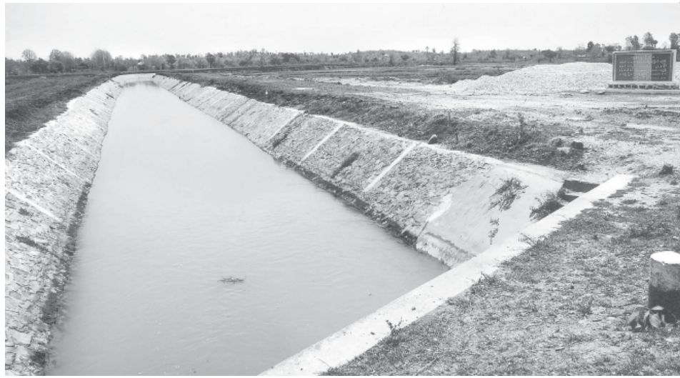
The main canal of Kunchaung Dam near Kyangin-Myanaung Road.