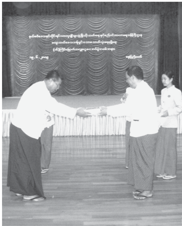
Minister for Education Dr Chan Nyein accepts cash donation of a wellwisher.

only in arid regions but also in other States and Divisions where water is scarce. Clean water can be supplied to 34 townships in Sagaing Division, 25 townships in Magway Division and 23 townships in Mandalay Division, totalling 82, he added. Sagaing, Tamu, (See page 8)