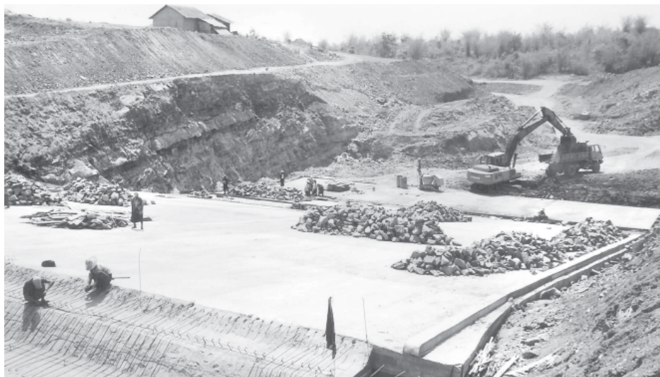
The 220 feet long and 100 feet wide spillway is under construction.