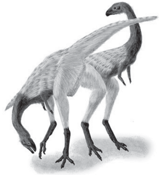
Undated file photo shows a recovery image of Limusaurus.