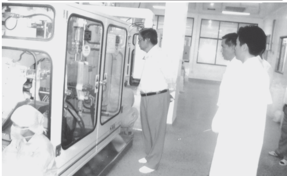
Minister U Aung Thaung visits Myanmar Pharmaceutical Factory (Yangon).—INDUSTRY-1

YANGON, 19 June—Minister for Industry-1 U Aung Thaung arrived at Myanmar Pharmaceutical Factory (Yangon) under