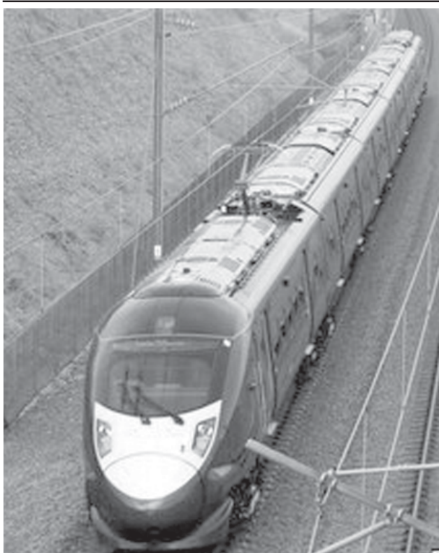
The new 140mph trains will run between London and Kent.—INTERNET

The services are expected to cut Ashford to London journey times from 80 minutes to 37 minutes. Ebbsfleet to London will take 17 minutes. The trains, which have 338 seats and can carry up to 508 people, will provide the "javelin" service to take spectators from St Pancras to the 2012 Olympics site at Stratford in east London in just seven minutes.—Internet