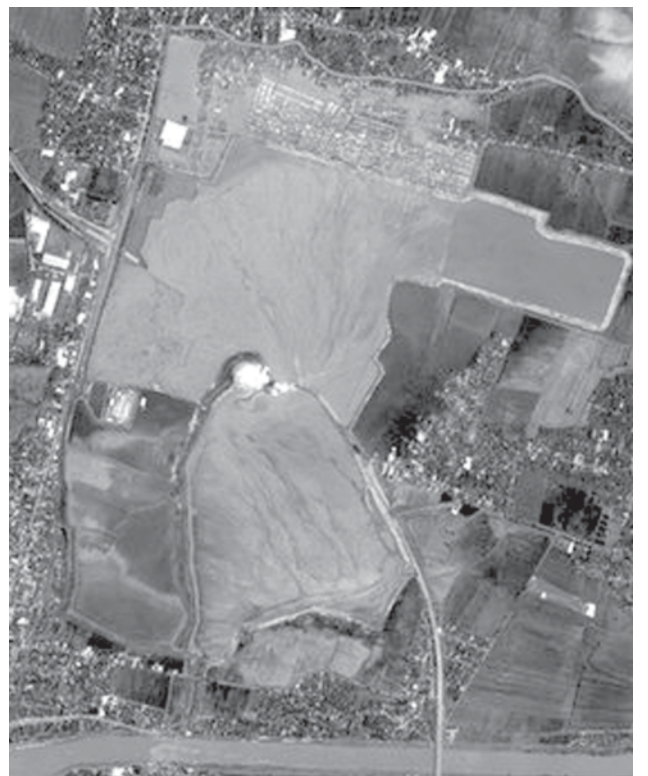
File satellite picture shows the "mud volcano" and its surrounding area in Sidoarjo, East Java. Indonesia's devastating 'mud volcano' could keep spewing for the next 30 years, filling the equivalent of 50 Olympic-size swimming pools every day, a top Australian expert warned.