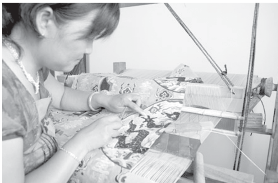
A brocade embroideress puts the final embellishment to the restituted ceremonial robes for the royalty of the Ming Dynasty (1368-1644), in Suzhou City, east China's Jiangsu Province, on 17 June, 2009.