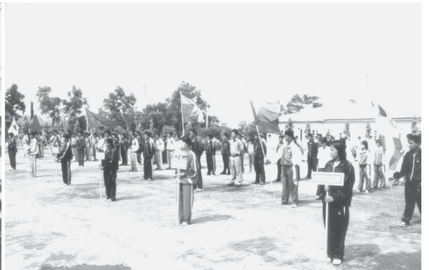
Minister for Sports Brig-Gen Thura Aye Myint delivers an opening address at 10 th Inter-State/Division Shooting Contest 2009.