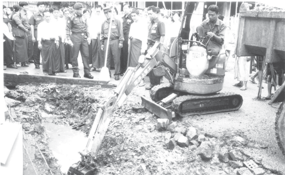
Yangon Mayor Brig-Gen Aung Thein Lin inspects dredging drain in Motelatsaunggon Ward in Sangyoung Township.—MNA

Next, the mayor visited Kyaikkasan creek on Hanthawadi Road in No. 6 ward, South Okkalapa Township in which he inspected dredging the creek, and gave necessary instructions to officials.—MNA