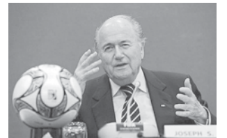
FIFA president Sepp Blatter.

"It's definitely time to kick off now, not only in terms of the organisation in South Africa, but in terms of making sure they can deliver and will deliver," said Blatter, a year ahead of the first African World Cup. "That's why this Confederations Cup, one year before the big event, is crucial. It's very important for FIFA but also for the participating