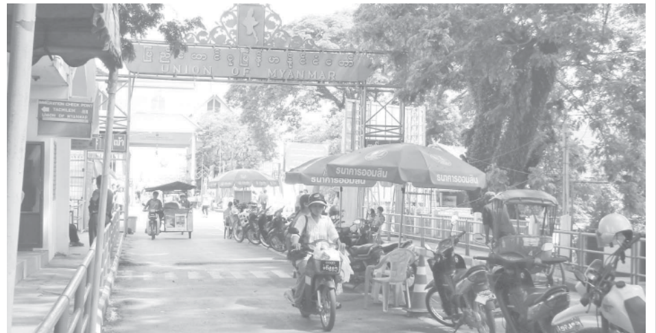
No. 1 Friendship Bridge in Tachilek.

In the education sector, Tachilek District opened with four Basic Education High Schools, three Basic Education Middle Schools and 56 Basic Education Primary Schools and a total of 17,179 students were admitted to