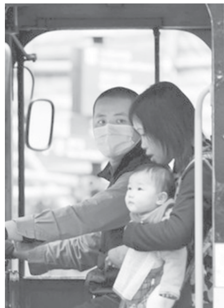
A tram driver wearing a protective mask looks at a mother and child in Hong Kong where authorities have ordered all primary schools in the city to be closed for two weeks after the first cluster of local swine flu cases was found. — INTERNET

"Given the global situation, (for) Hong Kong to have its own local cases is simply inevitable," Tsang said. "I believe the fellow citizens and the government have done all we can in postponing the arrival of the first indigenous case." — Internet