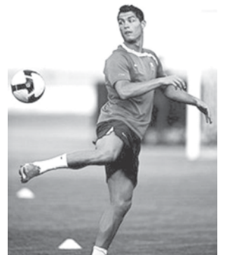
Cristiano Ronaldo.

However sports daily AS reported Wednesday that Perez had decided to pay 89 million euros (124 million dollars) for the 2008