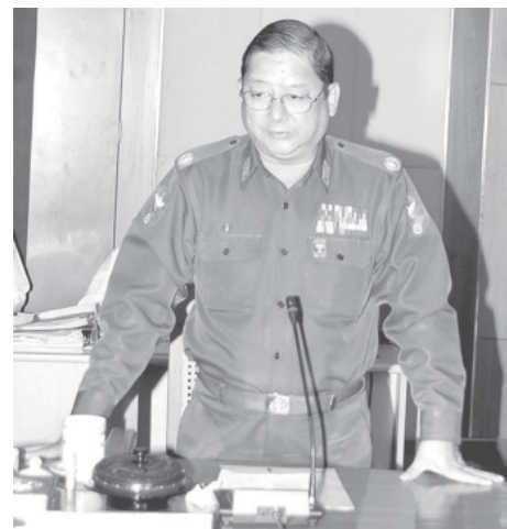
Electric Power No. 2 Deputy Minister Brig-Gen Win Myint participates in discussions.