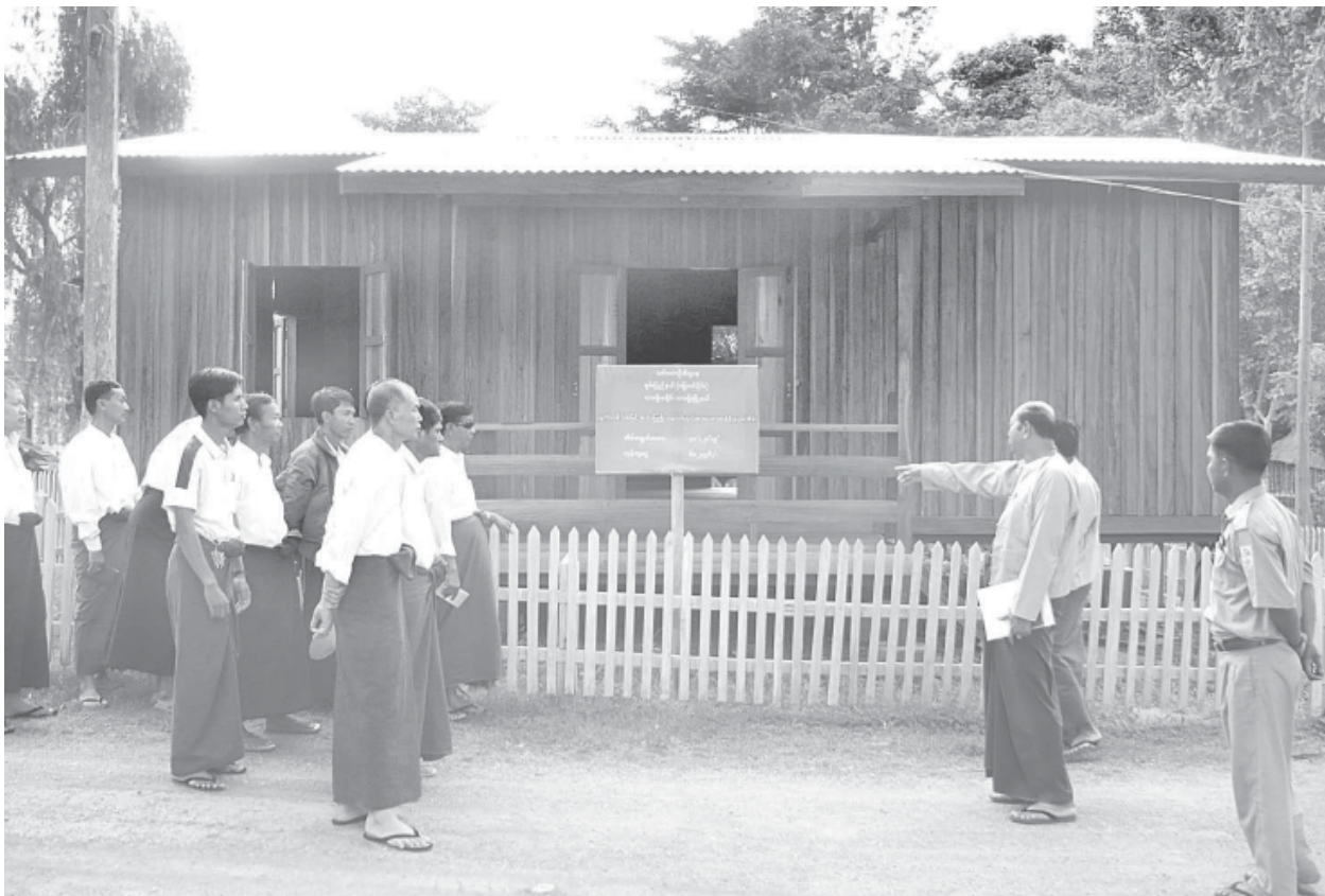
A rural house built of eucalyptus wood in Yaykantaung nursery in Lashio.

"We added 250 acres of teak to the natural forests in 2008-2009, and we have a target to grow 600 more acres of teak in the forests in 2009-2010. We reproduced trees in