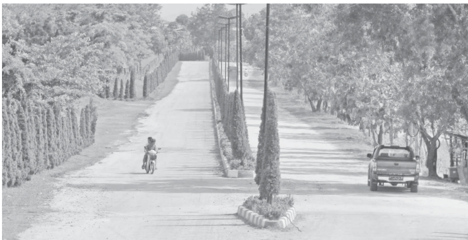
The road to Golf Club in Tachilek decorated with landscapes on traffic islands.