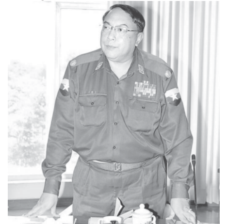
Chairman of Textbook Publishing Subcommittee Education Deputy Minister Brig-Gen Aung Myo Min makes discussions.—MNA