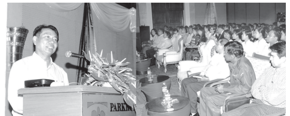
Deputy Minister Brig-Gen Aye Myint Kyu delivers an address at ceremony to introduce new Online Visa on Arrival.—MNA

Tourism Online Services Provider designed to expedite arrival visa and other services for promotion of Myanmar's tourism industry. Those responsible answered the queries raised by the guests. The deputy minister gave concluding remarks.—MNA