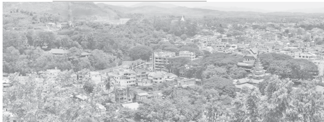
Photo shows an aerial view of developing Tachilek.