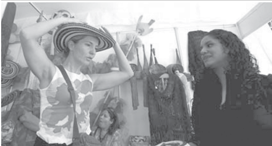
A woman tries on a Mexican hat during a culture festival in Mexico City, capital of Mexico, on 8 June, 2009. A cultural festival was held here until 14 June by local government to revitalize the tourism in the city.