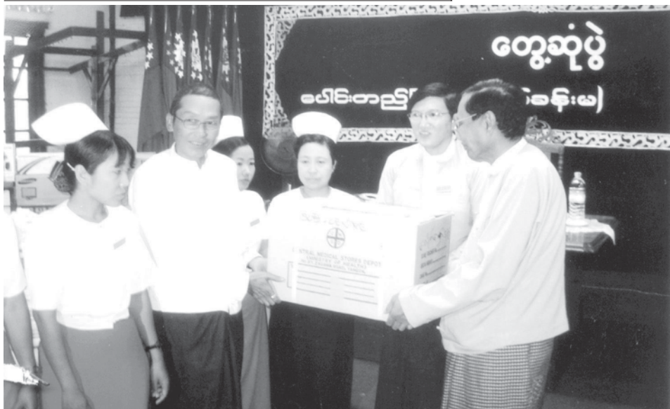
Deputy Health Minister Dr Mya Oo presents medicines to health care centres and rural health care centres in Paungde Township through officials.

We would like to call on all the national races of the Union to work hand in hand with the government in its drive to wipe out the danger of narcotic drugs from our soil once and for all.