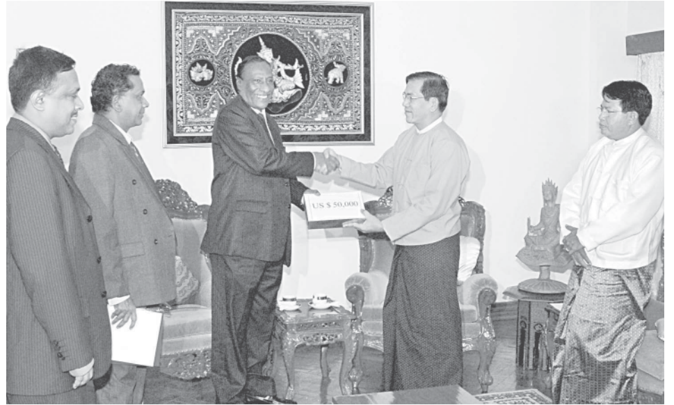
Minister U Nyan Win hands over US $ 50,000 on behalf of the Government of the Union of Myanmar to Mr Newton Gunaratna, Ambassador of Sri Lanka.

The ceremony was attended by Minister for Foreign Affairs U Nyan Win, the director-general, the deputy director-general and officials from the Ministry of Foreign Affairs, Ambassador Mr Newton Gunaratna and officials from the