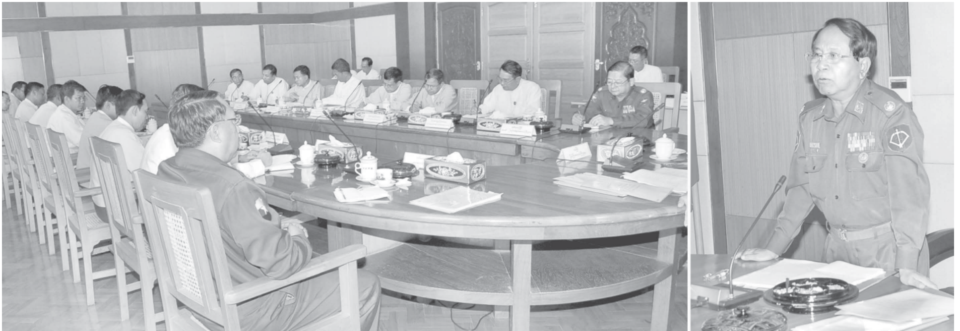
Information Minister Brig-Gen Kyaw Hsan delivers an address at School Textbooks Printing and Publishing Committee meeting 1/2009.—MNA

NAY PYI TAW, 11 June—The School Textbook Printing and Publishing Committee held the coordination meeting No. 1/2009 at the hall of the Ministry of Information, here, yesterday afternoon, with an address by Chairman of the Committee Minister for Information Brig-Gen Kyaw Hsan.