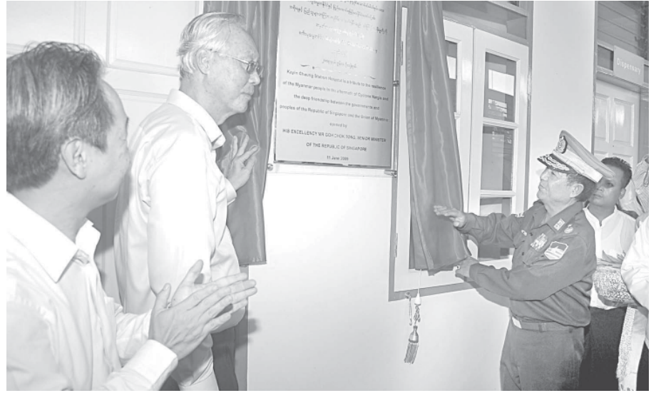
Minister Maj-Gen Maung Maung Swe and Singaporean Senior Minister Mr. Goh Chok Tong formally open bronze plaque of Kayinchaung Station Hospital of Kayinchaung Model Village in Twantay Township.—MNA