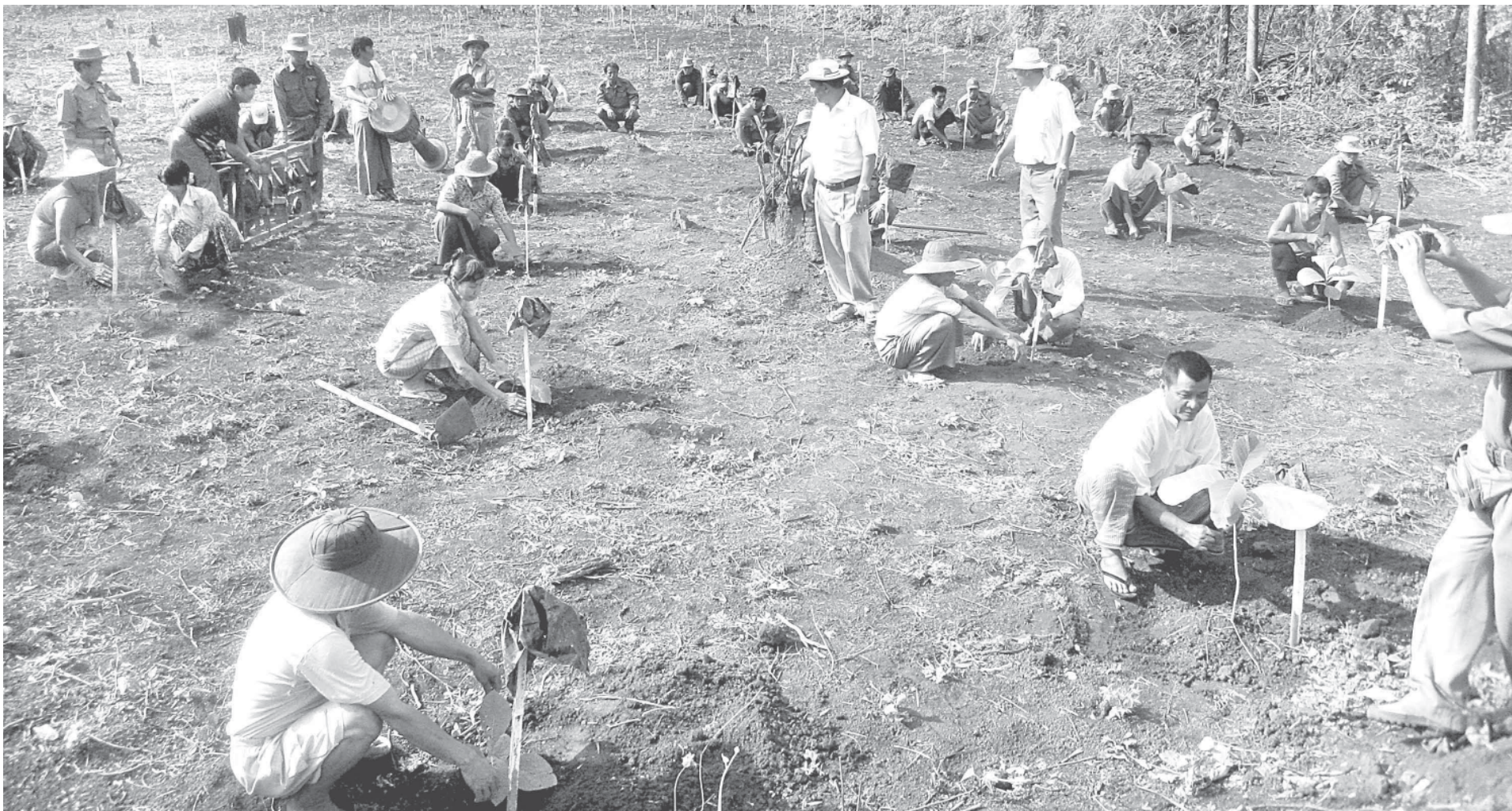
Local people of Nawngkhio Township in Shan State (North) grow teak saplings at the rate of three units a household.

established to hit the target; and that more than 17 million saplings of various species would be (See page 9)