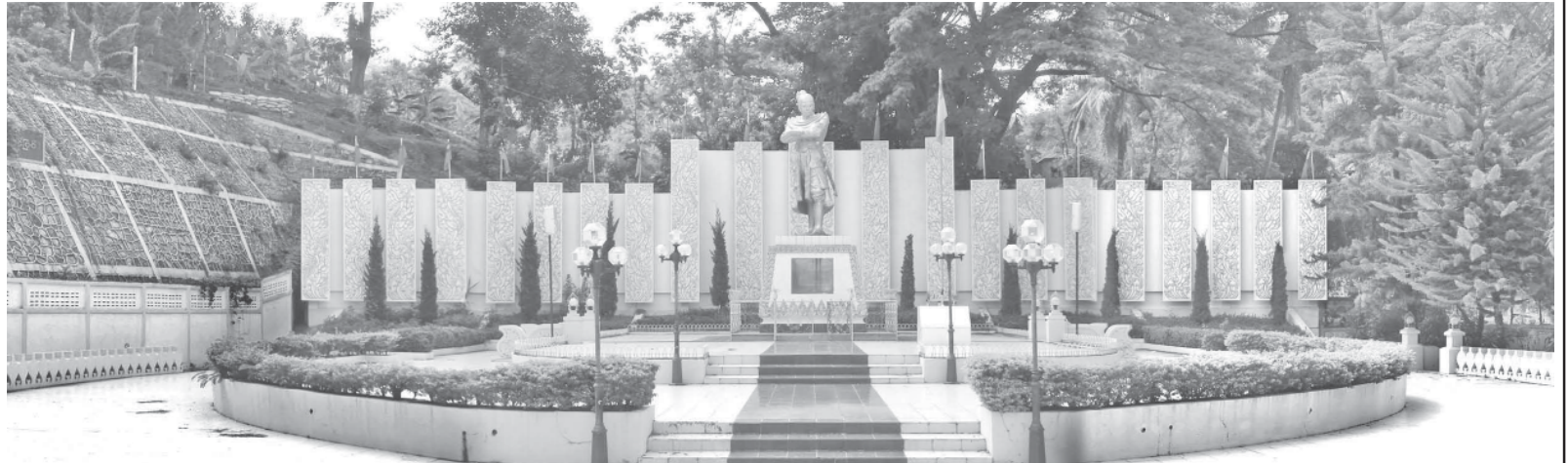
The statue of King Bayintnaung who established the Second Myanmar Empire seen at the park in downtown Tachilek.