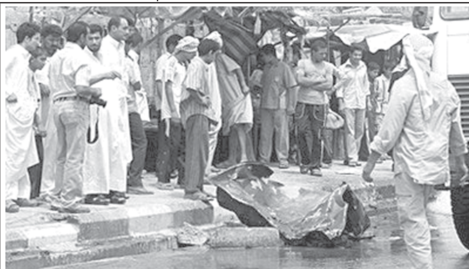
Iraqis gather at the site of a car bomb blast in the southern city of Nasiriyah. A car bomb exploded in a market in a southern Iraqi town on Wednesday.

Ghaddafi's visit to Rome is the product of 40 years of hard-spun diplomatic negotiations. It follows the signature in August 2008 of the Treaty on Friendship, Partnership and Cooperation between Italy and Libya which officially put an end to the long-lasting colonial dispute by granting material compensation to Libya and launching a strategic economic and anti-immigration partnership.