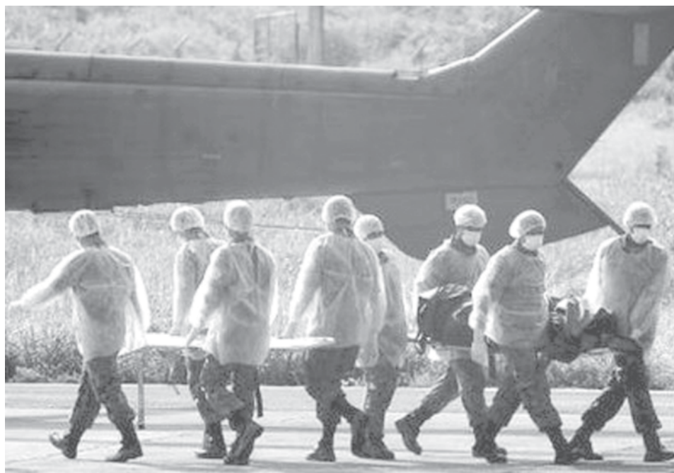
Members of the Brazilian Air Force carry the body of a victim of Air France Flight 447 that went missing en route from Rio to Paris, at a base in Fernando de Noronha island on 11 June, 2009. All 228 people aboard Air France flight AF 447 from Rio de Janeiro to Paris are believed to have died when the Airbus A330 aircraft crashed into the ocean after flying into stormy weather more than a week ago. Brazilian military search teams have recovered 41 bodies from the sea and moved some of them to the archipelago of Fernando de Noronha off Brazil's northeastern coast, which is being used as a base for the search operations.