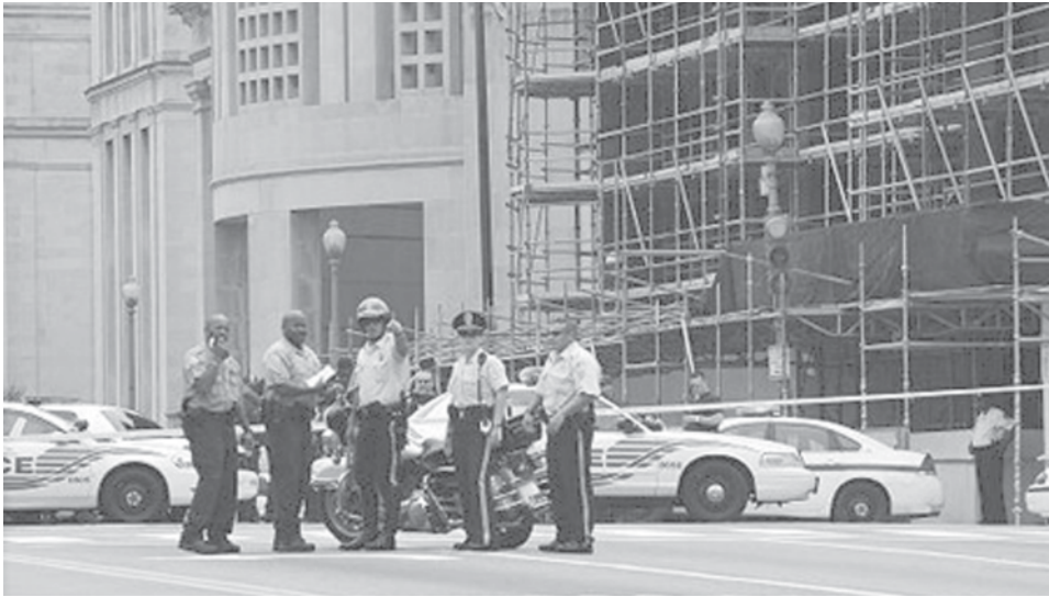
Washington, DC, police officers block the street leading to the main entrance of the Holocaust Museum (C), in Washington, DC, after a shooting. A lone gunman said to have links to white supremacist groups opened fire on Wednesday inside the Holocaust Memorial Museum here, fatally wounding a security guard before being shot himself.