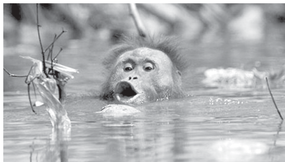
An orangutan swimming through the waters of the Rungan River, in Central Borneo, Indonesia. Destruction of their natural habitat forced these huge apes to take to water. The rising worldwide demand for palm oil used to make bio-diesel fuel has led to mass deforestation in areas like Borneo.