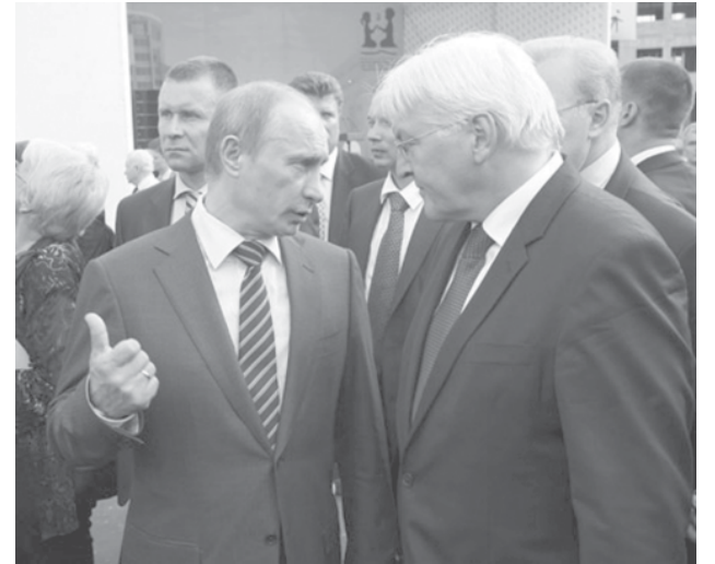
Russian Prime Minister Vladimir Putin (L) speaks with German Foreign Minister Frank-Walter Steinmeier in Moscow on 10 June, 2009.

"If those who made the atomic bomb and used it are ready to abandon it, and if, as I hope, other powers that possess them (weapons) officially or unofficially are ready to do the same, we will heartily welcome and promote this process," said Putin.