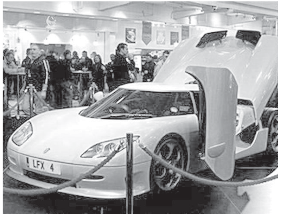
The Swedish Koenigsegg CCR is seen at the MPH '05 car show at Earls Court in London. Swedish sports car maker Koenigsegg is to buy Saab Automobile from US giant General Motors with support from Norwegian investors, a broadcaster reported on Thursday.—INTERNET

Receipts from shipment of petroleum products fell 44 per cent to 52.66 million dollars, while sales of cathodes also declined by 37.2 per cent to 63.42 million dollars.—MNA/Xinhua