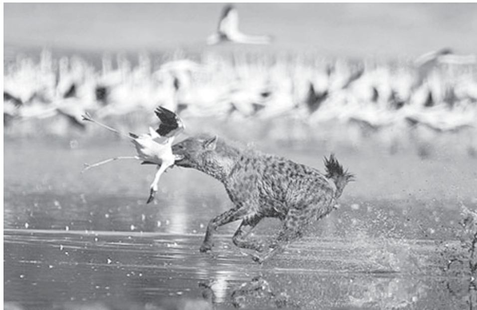
The hyena shows plucks one unlucky bird straight from the air as it desperately tries to take flight.