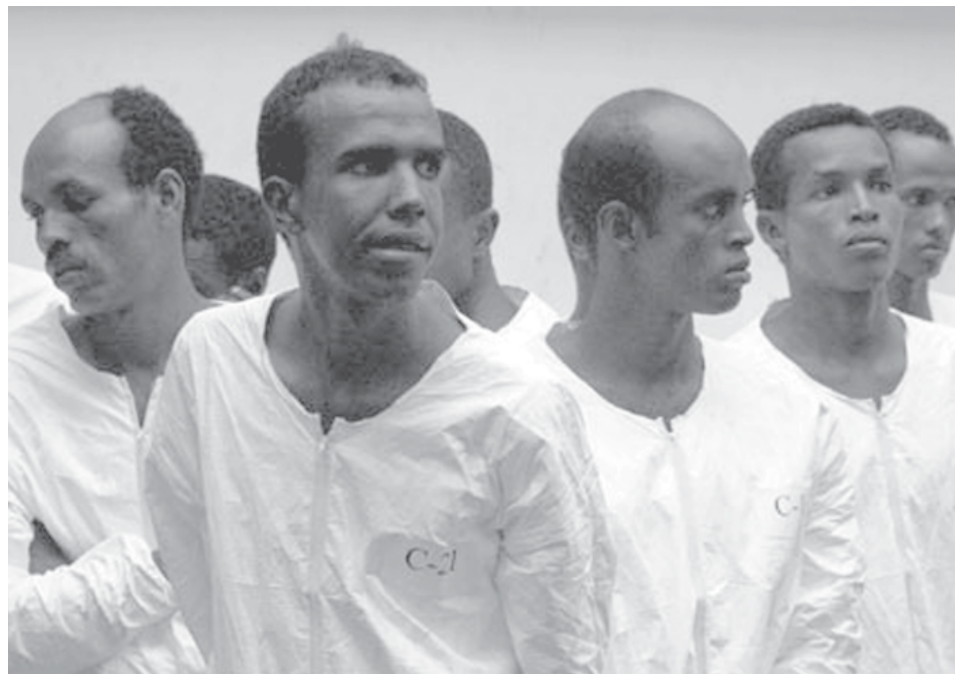
Some suspected Somali pirates are seen in Mombasa, city of east Kenya, on 10 June, 2009. US Navy handed over 17 suspected Somali pirates to Kenyan authorities on Wednesday against the backdrop of foreign warships stepping up naval patrols off the coast of Somalia.