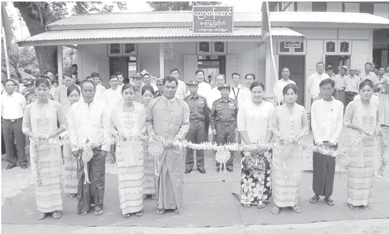
Commander Maj-Gen Myint Soe and Minister Brig-Gen Kyaw Hsan attend the opening ceremony of Pynnya Tazaung Library in Hsinmyay village, Sagaing Township.—MNA

Local well-wishers Thudhamma manizawtadara U Soe Naing and wife Daw Aye Aye