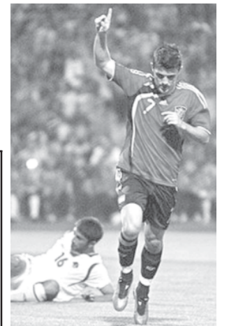
David Villa (R) of Spain celebrates during their friendly football match against Azerbaijan in Baku. Spain won 6-0.

On the other side of the draw, World Cup holders Italy come face to face with defending Confederations Cup champions Brazil, and potentially dangerous 'dark horses' Egypt and the United States lurk in the background.—Internet