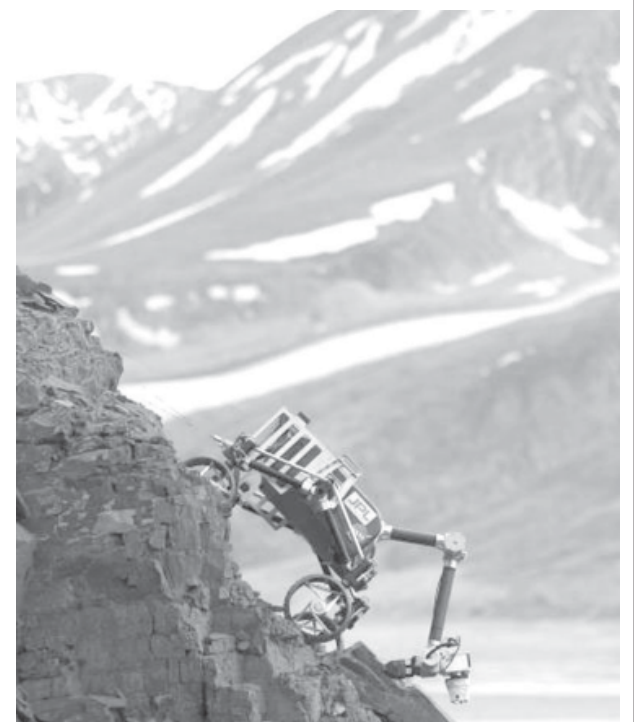
Testing of next generation rovers onboard the Arctic Mars Analogue Svalbard Expedition.