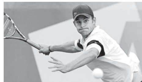
US tennis player Andy Roddick reaches to hit a forehand during the singles game against Kristof Vliegen of Belgium during the first round match at The AEGON Championships tennis tournament at Queen's Club in west London. Roddick won the match 6-1, 6-4.

"I think we've won eight of these between us. You'd expect to see that sort of match a little bit further on in the tournament, especially this one," Roddick said.