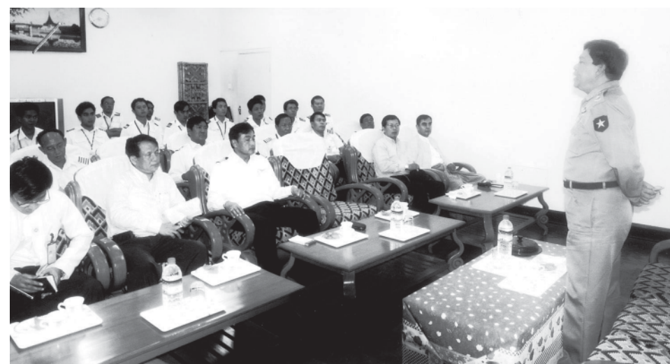
Deputy Minister Col Nyan Tun Aung makes speech in meeting with senior pilots and pilots from Myanma Airway.