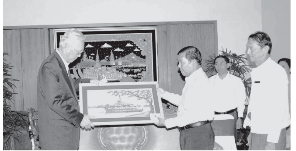
Commander of Central Command Maj-Gen Tin Ngwe and Senior Minister Mr Goh Chok Tong of the Republic of Singapore exchange gifts at Sedona Hotel.

On arrival at Heho Airport in Shan State (South) at 10.45 am, the Singaporean Senior Minister and party were welcomed by Chairman of Shan State PDC Commander of Eastern Command Brig-Gen Ya Pyae and departmental