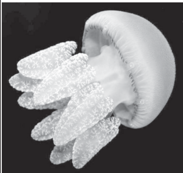
The numbers of jellyfish, like this 'Catostylus', appear to be on the increase due to a combination of pollution, overfishing and climate change.

BRISBANE, 10 June— problem of major increases in jellyfish numbers, which appears to be