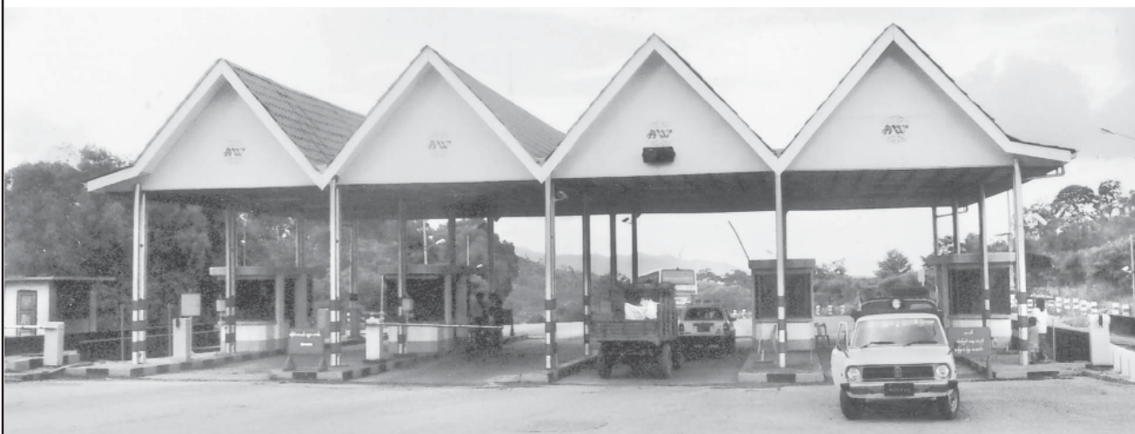
A toll gate at the exit of Lashio.

vehicle, K 500 for 3 tons to 5 tons vehicle, K 1,000 for 5 tons to 10 tons vehicle and K 2,000 for 10 tons to 20 tons vehicle."