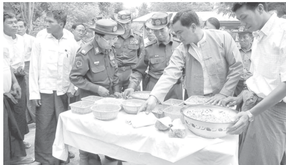
Commander Maj-Gen Myint Soe and Minister Brig-Gen Kyaw Hsan view jade beads produced by local people in Daungma village, Sagaing Township.—MNA