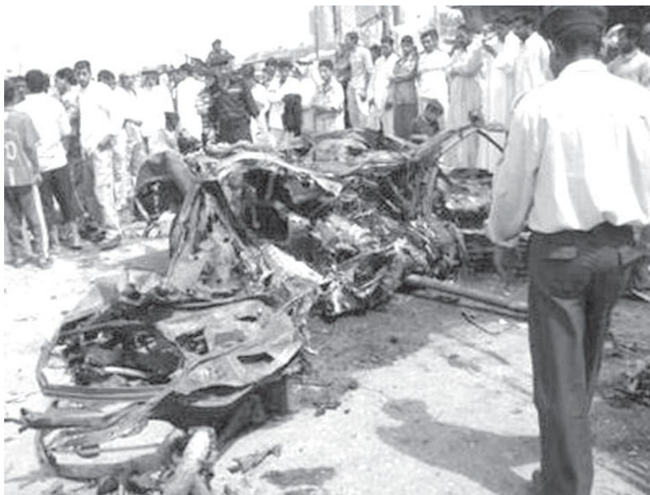
Residents and policemen gather near the wreckage of a vehicle used in a car bomb attack in Nassariya on 10 June, 2009. The car bomb ripped through a crowded market in southern Iraq on Wednesday, killing at least 32 people, and wounding 70, officials said.

BAGHDAD, 10 June—A car bomb ripped through a crowded market in southern Iraq on Wednesday, killing at least 32 people, and wounding 70, officials said.