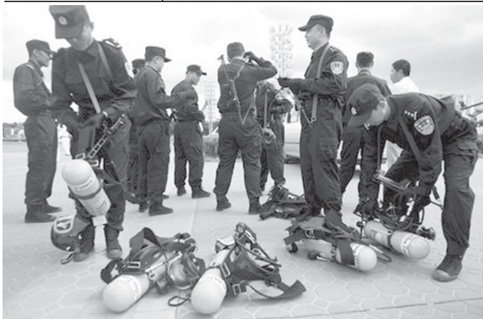
Members of the special police put on gas masks during an anti-terrorism drill in Hohhot, capital of north China's Inner Mongolia Autonomous Region, on 9 June, 2009.