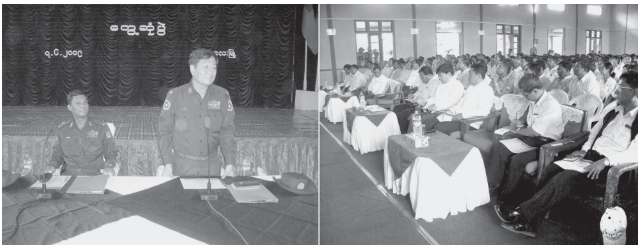
Minister Brig-Gen Tin Naing Thein delivers an address at a ceremony to disburse agricultural loans to farmers in Ayeyawady Division.

YANGON, 10 June — Chairman of Ayeyawady Division Peace and Development Council Commander of South-West Command Maj-Gen Kyaw Swe and Minister for Commerce Brig-Gen Tin Naing Thein attended a ceremony to disburse agricultural loans to farmers held in Mawlamyinegyun, Ayeyawady Division on 7 June.