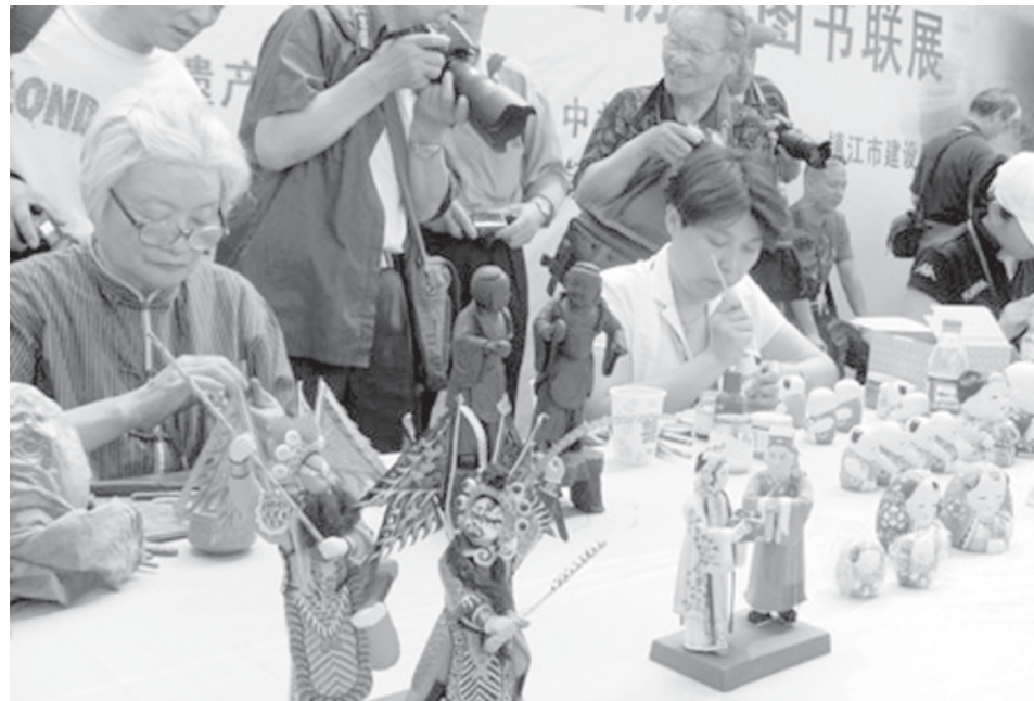
Two handicraftswomen display their skills in molding the Huishan clay-figurines, during the Traditional Chinese Folk Stunts Show, on the Xijindu Ancient Street of Zhenjiang City, east China's Jiangsu Province, on 7 June, 2009.