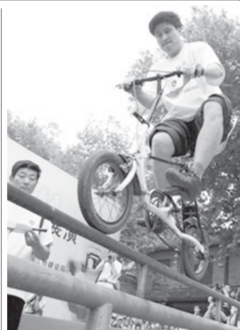
A folk stunt performer shows acrobatic skill of riding bicycle on the steel tube, during the Traditional Chinese Folk Stunts Show, on the Xijindu Ancient Street of Zhenjiang City, east China’s Jiangsu Province, on 7 June, 2009. The folk artists from around the country put on myriad of traditional Chinese folk stunt shows, to mark the 4th Cultural Heritage Day of the country, which falls on 13 June.