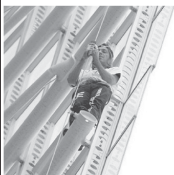
Alain Robert, stops to use cellphone as he climbs the exterior of the Royal Bank of Scotland building in Sydney, Australia. The French climber, known as the “Spider-Man”, has scaled over 70 skyscrapers worldwide including the Petronas Towers in Malaysia, Taipei 101, Chicago.