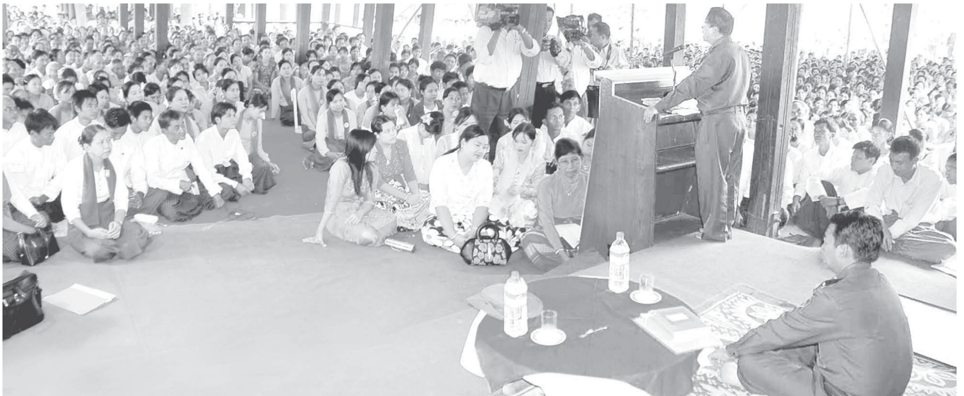
Minister for Information Brig-Gen Kyaw Hsan makes a speech in meeting with local people from 24 Villages in Daungma Village, Sagaing Township.

NAY PYI TAW, 10 June—Chairman of Sagaing Division Peace and Development Council Commander of North-West Command Maj-Gen Myint Soe and