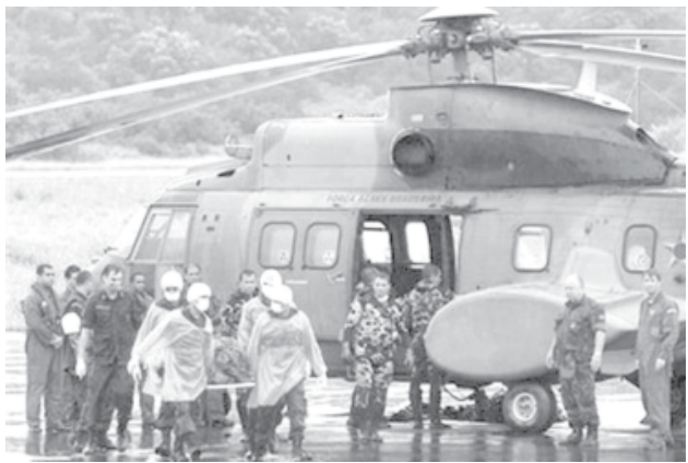
Brazilian Air Force personnel unload the body of a passenger from an Air France plane which crashed in the Atlantic on 9 June, 2009. A French nuclear submarine launched a high-tech undersea sweep on Wednesday to track down the black boxes missing after an Air France flight plunged into the Atlantic.