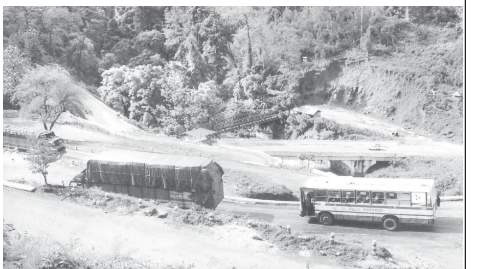
The motor road zig-zags near Goktwin Bridge in Nawngkhio Township.

He said, "Asia World Company is giving services for secure and smooth transportation from Mandalay to Muse. The company has been undertaking maintenance services for the road since 1996. A total of 11 toll gates were opened along the road from Mandalay to Muse. The company assigns each maintenance team per 12 miles. The toll gates levy the service fee as K 100 for one ton