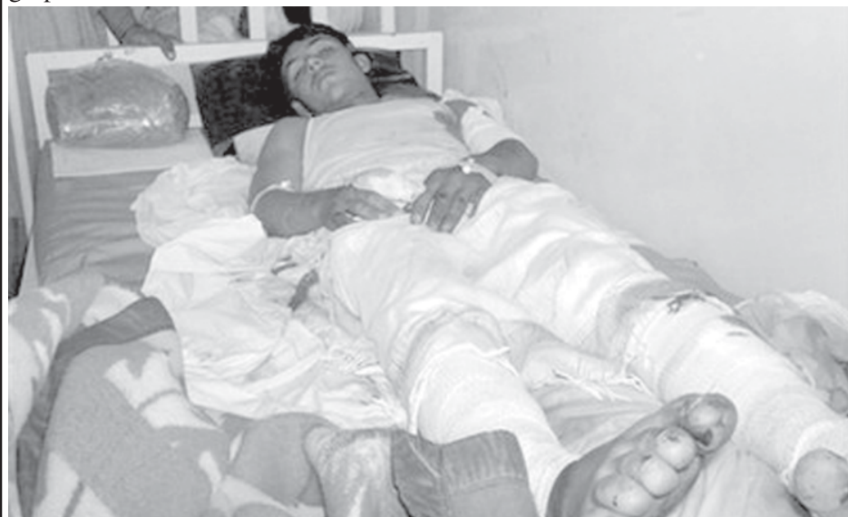
An Afghan youth who was injured in an explosion lies on a bed at a hospital in Asadabad, the provincial capital of Kunar Province, east of Kabul, Afghanistan, on 9 June, 2009.