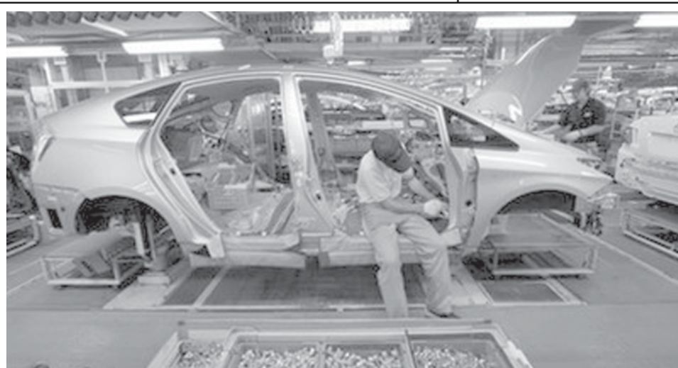
Workers at Toyota Motors Tsutsumi Factory in Aichi prefecture recently. Hopes for recovery in the Japanese economy have been dented by data showing wholesale prices fell at their sharpest in over 22 years while machine orders also dived.