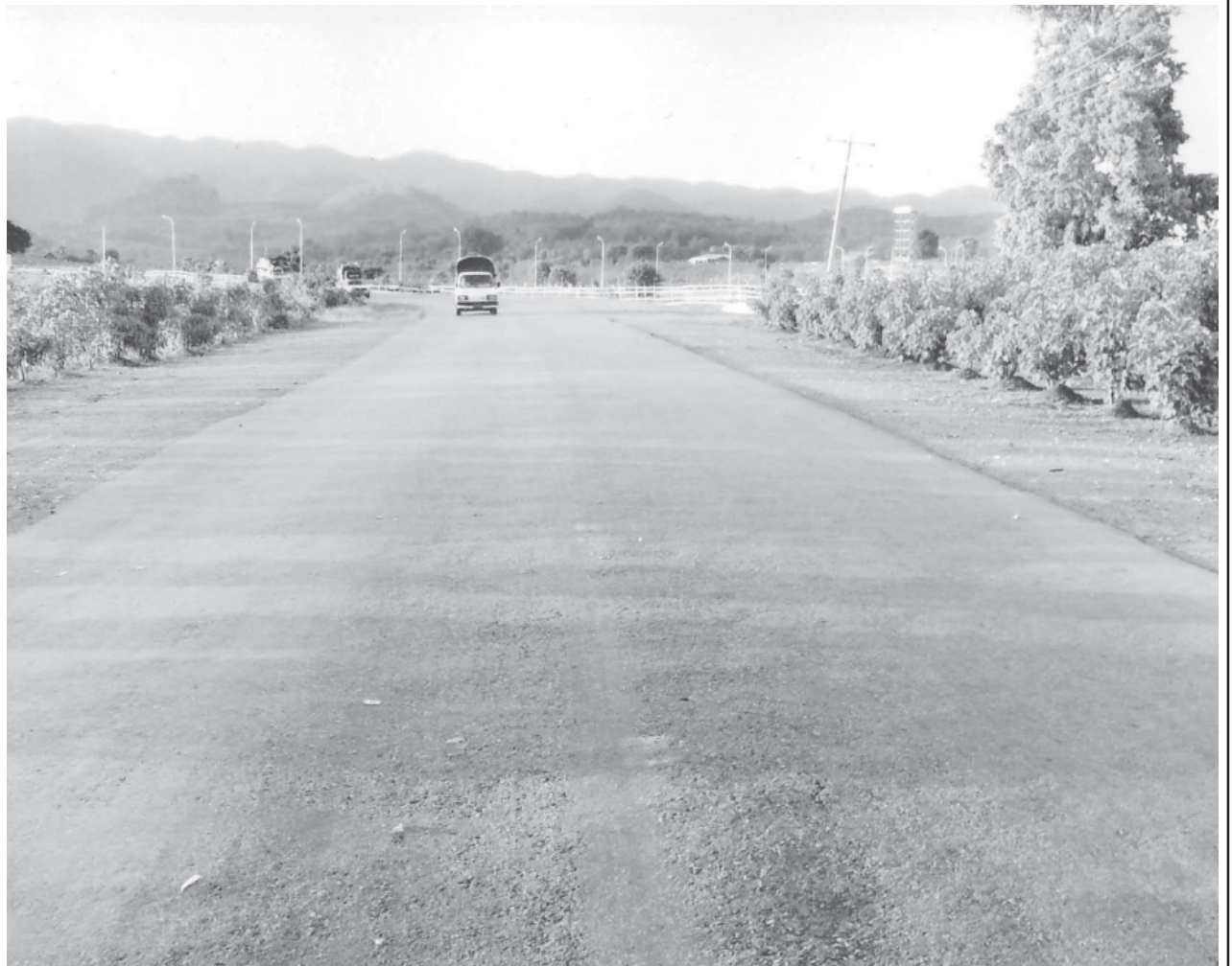
A section of Lashio-Muse Union Highway seen with Shan mountain ranges in the background near Lashio.