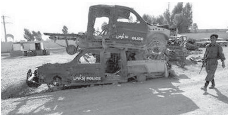
An Afghan policeman walks past a pile of destroyed patrol cars which were blown up, at an Afghan police station in the center of Kandahar city, on 9 June, 2009.—INTERNET

Outside the Afghan region, the Defence Department reports 67 more members of the US military died in support of Operation Enduring Freedom. Of those, three were the result of hostile action. The military lists these other locations as Guantanamo Bay Naval Base, Cuba; Djibouti; Eritrea; Ethiopia; Jordan; Kenya; Kyrgyzstan; Philippines; Seychelles; Sudan; Tajikistan; Turkey; and Yemen.—Internet