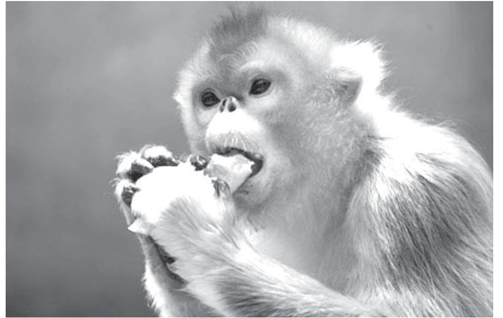
A golden monkey eats watermelons at the Jinan Zoo in Jinan, capital city of east China's Shandong Province, on 1 June, 2009, as a heat wave reaching 35 degrees Celsius hits the city.—INTERNET

An Air France A330 en route from Rio de Janeiro to Paris crashed into the Atlantic last week, killing all 228 on board. The Brazilian Air Force and Navy said on Monday they had recovered 24 bodies from the Atlantic so far as well as an increasing pile of shattered debris.—MNA/Reuters