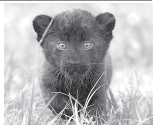
A new born black panther cub seen in the grass at the Tierpark zoo, during a presentation to the media in Berlin, Germany, on 9 June, 2009.