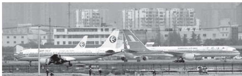
File picture taken on 8 April, 2009 shows aircrafts of China Eastern Airlines (L) and Shanghai Airlines (R) at the Hongqiao International Airport in Shanghai, China.

SHANGHAI, 10 June—A spokesman for China Eastern Airlines, a leading carrier in the country, confirmed Monday that it plans to merge with smaller rival Shanghai Airlines.