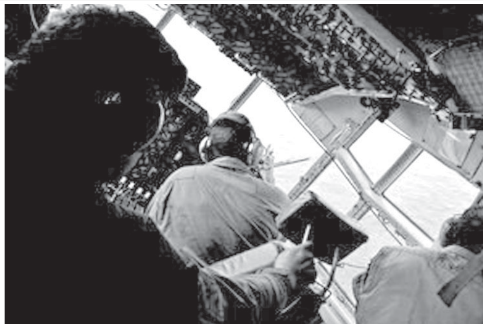
Brazilian military search for debris from an Air France jet that crashed into the Atlantic Ocean. A 12-mile-long oil slick and debris were found early Wednesday, but Brazil and France disagree over whether the debris is from Flight 447. Investigators are probing the last messages from the plane to determine the cause of the crash.