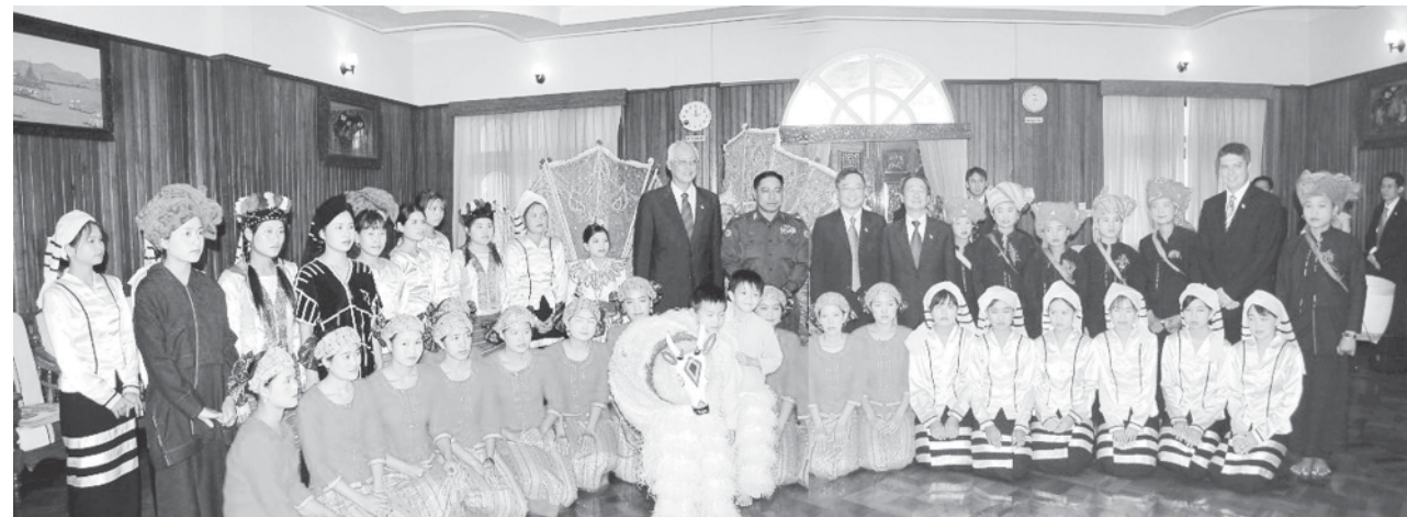
Commander of Eastern Command Brig-Gen Ya Pyae, Singaporean Senior Minister Mr Goh Chok Tong and cultural dance troupe pose for documentary photo.