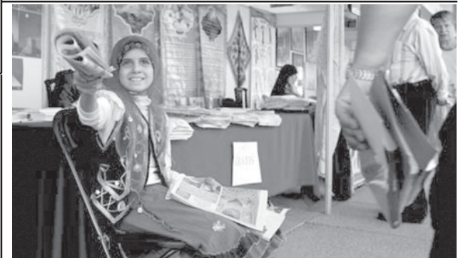
A child hands out leaflets promoting local tourism during a culture festival in Mexico City, capital of Mexico, on 8 June, 2009. A cultural festival was held here until 14 June by local government to revitalize the tourism in the city.

* Tender Closing Date: 31.8.2009 (Monday)