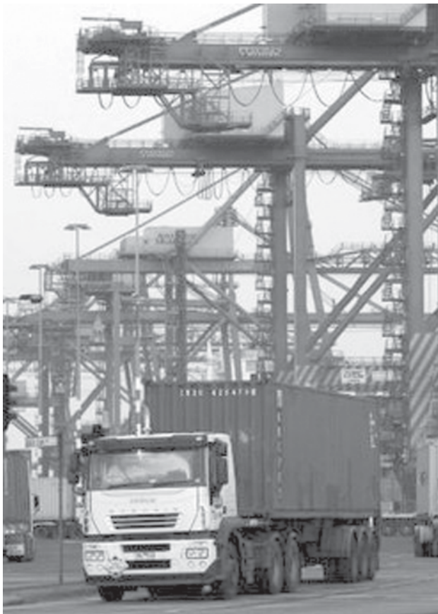
A truck is seen in front of shipping container cranes at the Patrick port facility in Melbourne on 9 June, 2009.

It added that two other workers were injured in the fire. Gas compression is believed to be the cause of the explosion, the report said.— Internet