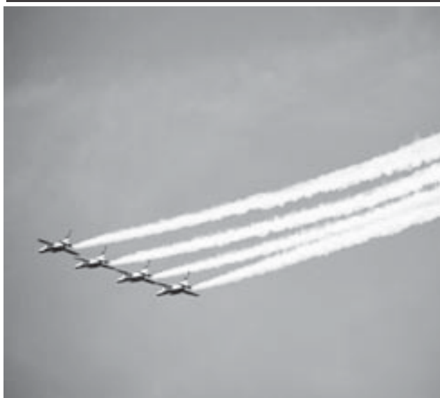
The Blue Impulse aerobatics team of Japan's Air Self-Defense Force performs over Yokohama, Kanagawa Prefecture, Japan, 2 June, 2009. The aerobatics show was put on to celebrate the 150th port-opening anniversary of Yokohama.

It was also suggested that they consider returning the products to their suppliers and the retailers were receptive to the advice.—Xinhua