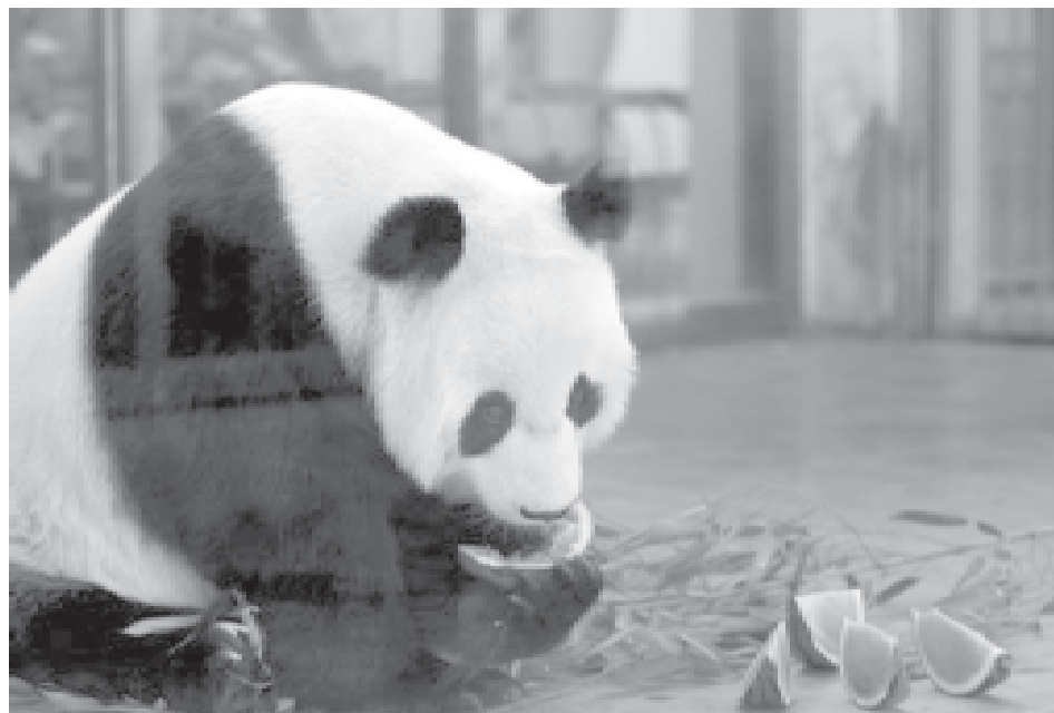
A giant panda eats watermelons at the Jinan Zoo in Jinan, capital city of east China’s Shandong Province, on 1 June, 2009, as a heat wave reaching 35 degrees Celsius hits the city.

Venezuela has asked the US to extradite Posada, a former CIA operative and opponent of former Cuban president Fidel Castro who is accused of plotting the 1976 bombing of a Cuban plane off Barbados that killed 73 people on board. The 81-year-old Posada is accused of plotting the bombing while living in Venezuela but denies involvement.— Internet