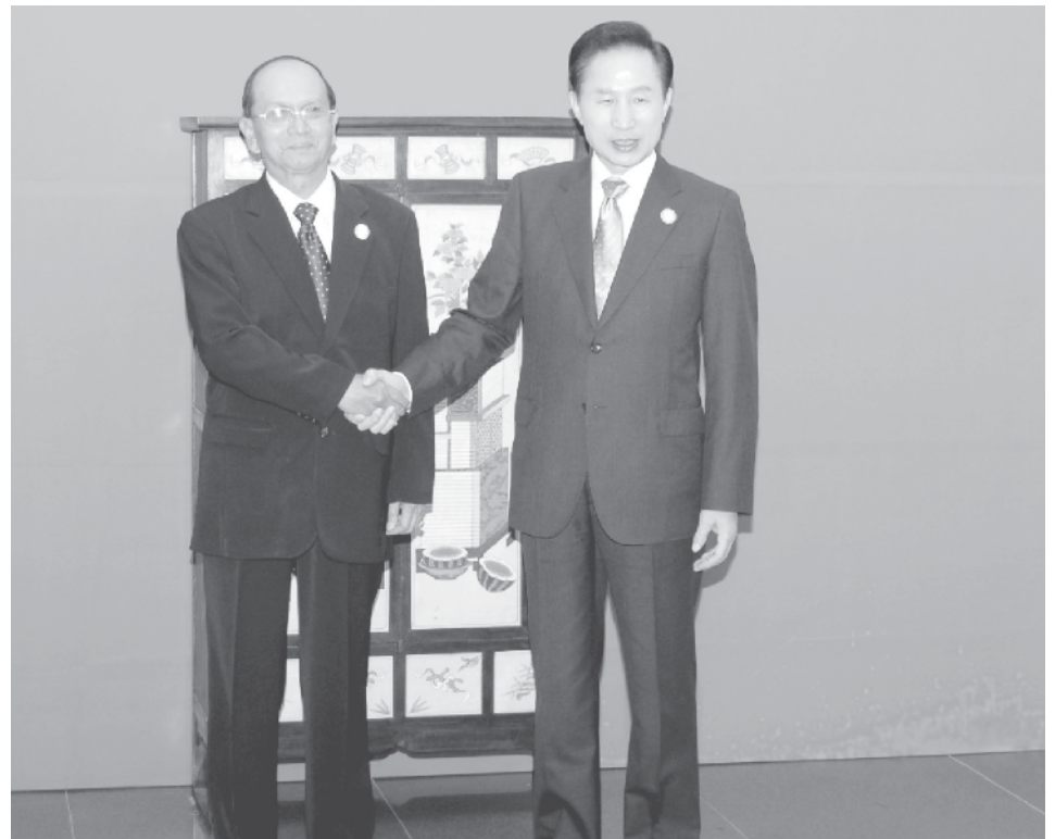
Prime Minister General Thein Sein being welcomed by President of ROK Mr Lee Myung-bak at ASEAN-Republic of Korea Commemorative Summit.

The whole region will gain benefits from the support by the Republic of Korea for peace, freedom, neutralization and establishment of nuclear-free zone of Southeast Asia.