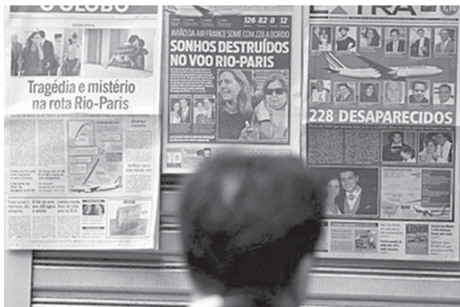
A man reads the front pages of Brazilian newspapers reporting on the Air France passenger jet which disappeared, on 1 June over the Atlantic while en route from Rio de Janeiro to Paris, at a newsstand in Rio de Janeiro.

The objects found at the sea will be taken to the Fernando de Noronha archipelago on a Brazilian naval ship, said Jobim. The minister added that Brazil will be in charge of the recovery of the plane parts, while France will carry out the investigations. Brazilian Navy ships are not expected to arrive in the area until Wednesday morning. Three mercantile ships, which were close to the area, have reached the crash site. The final passengers' list of the plane will be released on Wednesday by Air France, Jobim said. But it will not be complete, he said, as some of the names will be held upon the requests of families and relatives.—Xinhua