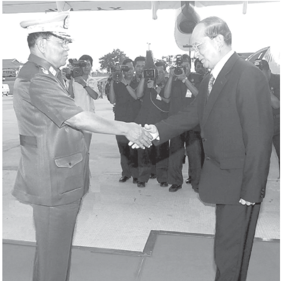
Senior General Than Shwe welcomes back Prime Minister General Thein Sein on his return from the Republic of Korea after attending the ASEAN-Korea Commemorative Summit and Related Summits of Bilateral Summit and the ASEAN-ROK CEO Summit held in Jeju Island, the Republic of Korea.