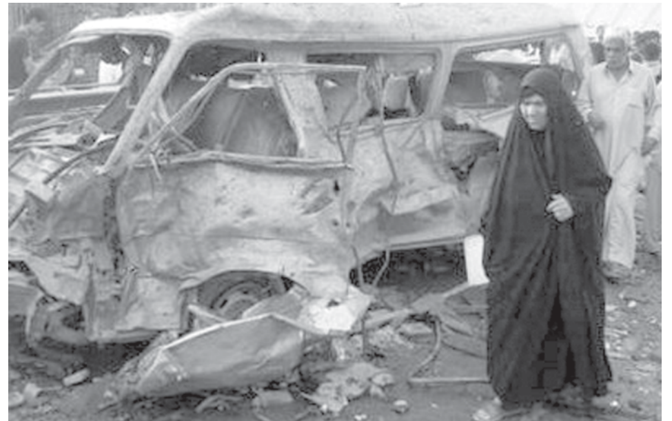
A woman walks beside a damaged vehicle at the site of a bomb attack in Baghdad's Shula district recently.

"We are building an army they will never be able to afford," a senior US military official told McClatchy. The official spoke on the condition of anonymity because he wasn't authorized to talk to reporters.— Internet