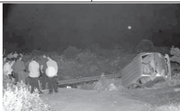
The wreckage of the minitruck lies on the roadside after a crash with a train near Tianmen, central China’s Hubei Province, on 2 June, 2009.

No one onboard the train was injured. No other details are available at this time. An initial investigation showed that the mini-van was trying to pass a pedestrian intersection that is off-limits to vehicles when it crashed with the train. Railway officers and police were rushing to the site for further investigation.— Internet