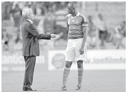
French national soccer team coach Raymond Domenech (L) speaks to captain Patrick Vieira during the friendly football match France vs Nigeria at the Geoffroy-Guichard stadium in Saint-Etienne, eastern France.

STETIENNE, 3 June—France coach Raymond Domenech suffered another blow to his authority here on Tuesday as Nigeria beat France 1-0 in an international friendly.