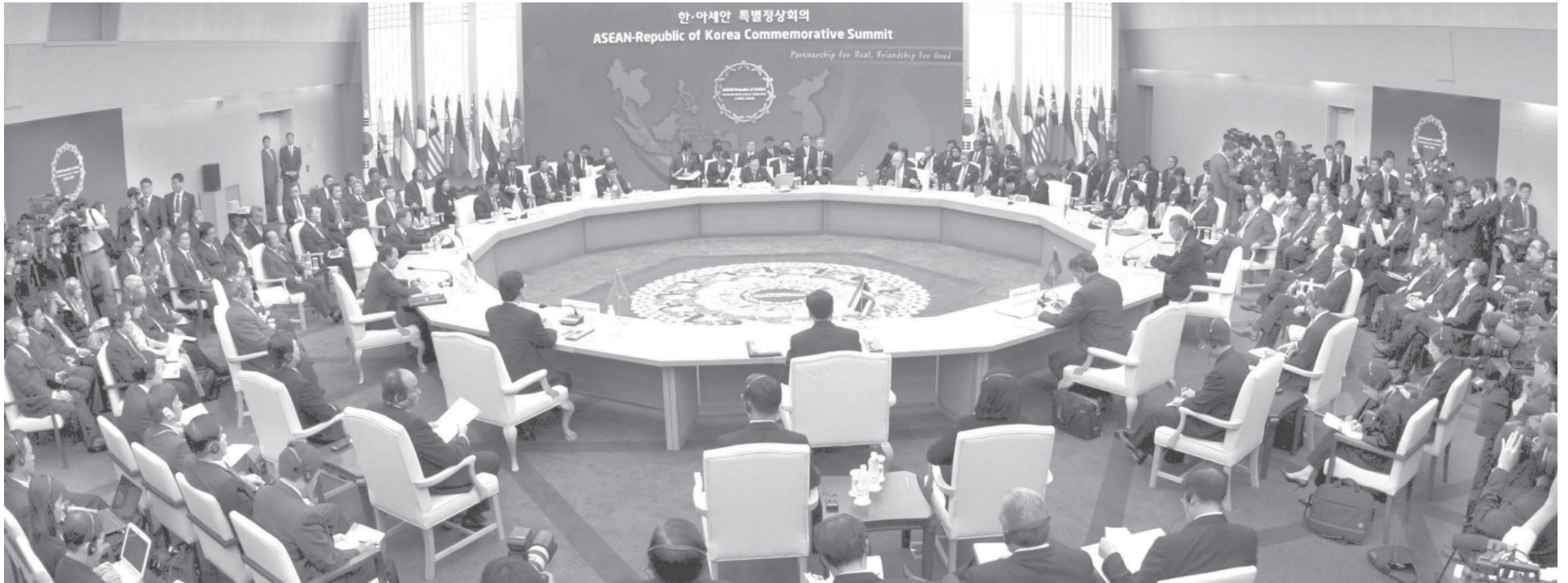
Prime Minister General Thein Sein attends ASEAN-Republic of Korea Commemorative Summit on Third Floor of International Convention Centre (ICC) in Jeju, the Republic of Korea.

NAY PYI TAW, 3 June—Prime Minister General Thein Sein attended the ASEAN-Republic of Korea Commemorative Summit on the Third Floor of Inter-