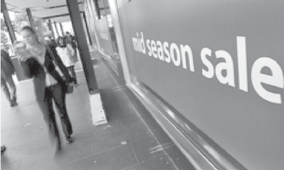
Shoppers in central Melbourne. Australia has unveiled figures showing surprise economic growth of 0.4 percent, defying widespread expectations of a technical recession thanks largely to a leap in exports.