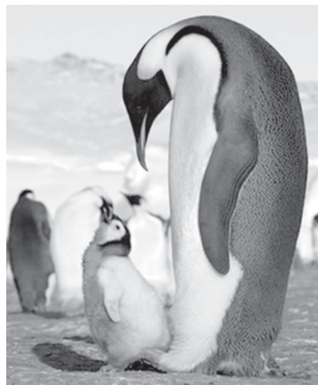
This undated handout photo shows an adult emperor penguin with a baby at an Antarctic breeding colony.—INTERNET

WASHINGTON, 3 June—Penguin poo (guano) stains, visible from space, have helped British scientists locate emperor penguin breeding colonies in Antarctica. Knowing their location provides a baseline for monitoring their response to environmental change, according to a new study