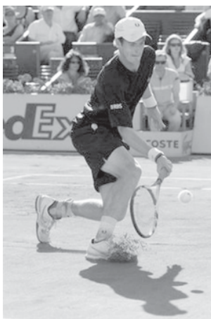
British player Andy Murray, pictured, at the French Open tennis quarter finals in Paris. Murray has said he would go into Wimbledon in the form of his life despite his Paris defeat to Chile's Fernando Gonzalez.

Murray, the third seed, lost 6-3, 3-6, 6-0, 6-4 to