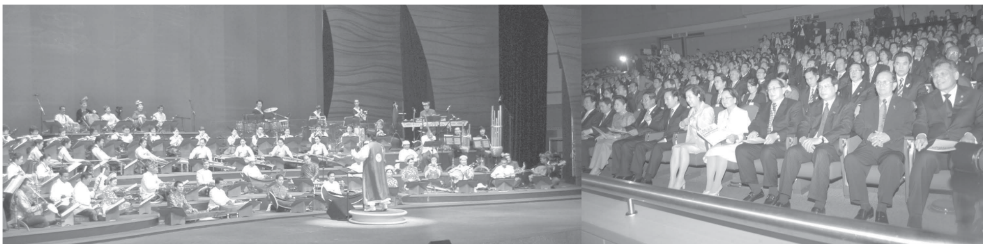
Prime Minister General Thein Sein enjoys entertainment of ASEAN-Korea Traditional Orchestra in honour of ASEAN-Korea Summit.