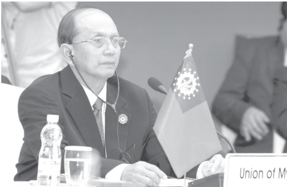
Prime Minister General Thein Sein taking part in ASEAN-Republic of Korea Commemorative Summit.