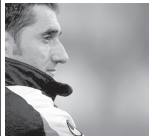
Ernesto Valverde is seen during Espanyol's Spanish League football match against Almeria at Mediterraneo Stadium in Almeria, 2008.

MADRID, 3 June—Villarreal on Tuesday named Spain's Ernesto Valverde as coach in place of Manuel Pellegrini, who is taking over at Real Madrid.