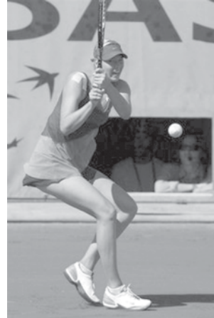
Russia's Maria Sharapova at the French Open tennis quarter finals on 2 June in Paris.

PARIS, 3 June—Maria Sharapova shrugged off her devastating French Open hangover on Wednesday and admitted she's come a long way since the dark days of injury misery which sidelined her for 10 months.