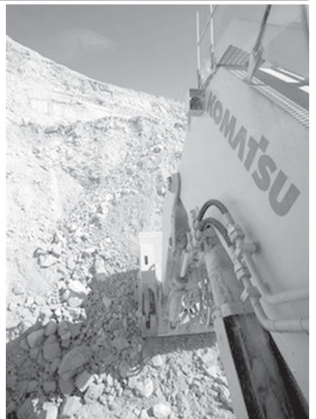
A Komatsu shovel fills at a mine in Canada. Komatsu, Japan's top maker of construction machinery, has said it plans to start assembling diesel-electric hybrid excavators in China this year.

The finding was presented at the Heart Failure Congress in Nice, France.