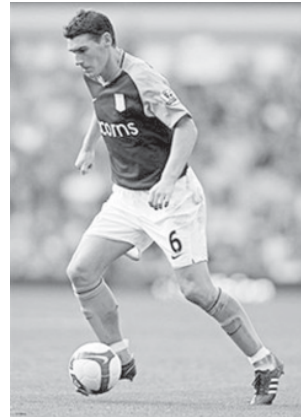
England midfielder Gareth Barry