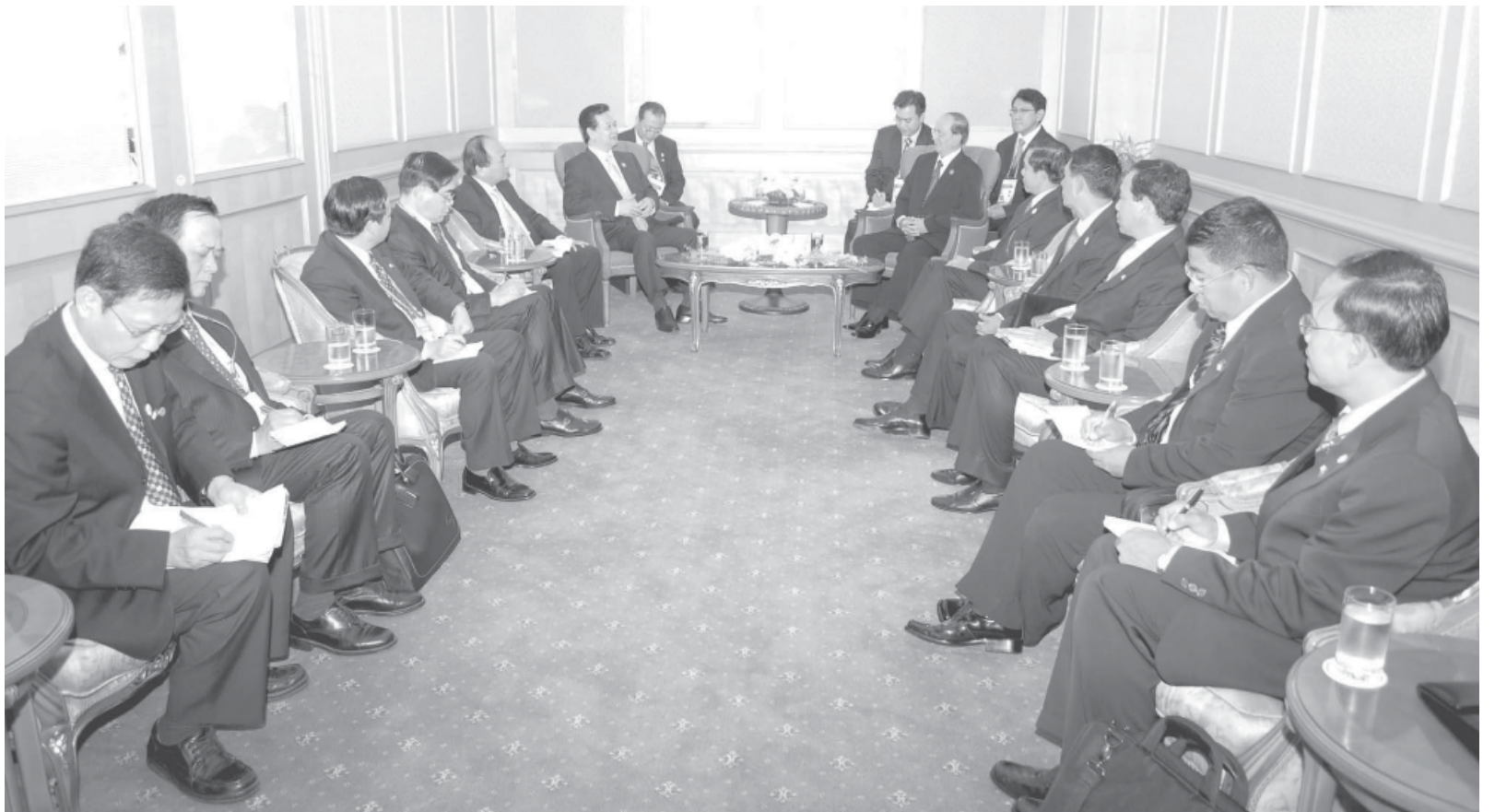
Prime Minister General Thein Sein meets with Vietnamese Prime Minister Mr Nguyen Tan Dung. — MNA

Present at the call together with the Prime Minister were Minister for Foreign Affairs U Nyan Win, Minister for National Planning and Economic Development U Soe Tha, Myanmar Ambassador to the Republic of Korea U Myo Lwin, Director-General of Government Office Col Thant Shin and departmental heads. Together with the Prime Minister of the Socialist Republic of Vietnam were Minister of Industry and Trade Mr Vu Hag Hoang and the Minister at the Government Office and personnel.