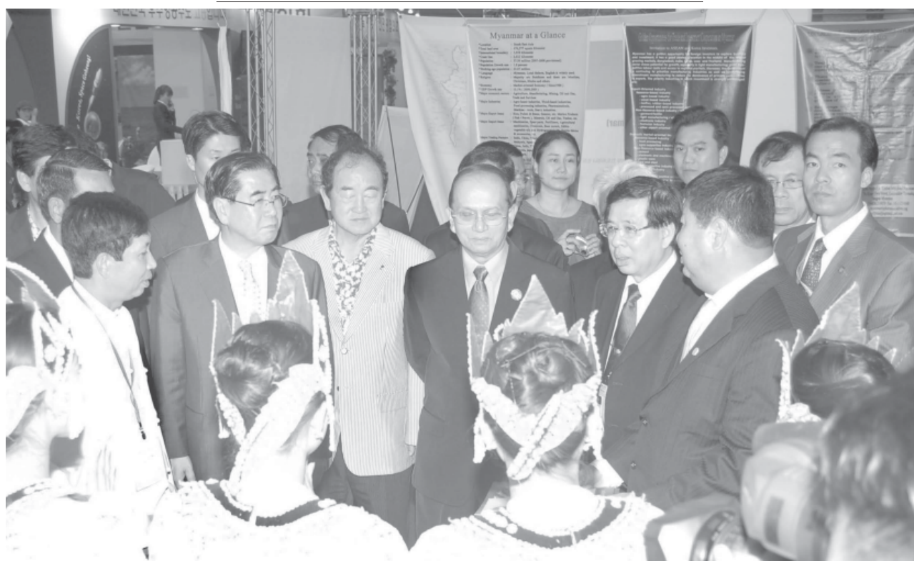
Prime Minister General Thein Sein visits Myanmar booth in Jeju World Culture & Travel Expo held at Jeju World Cup Stadium in Jeju of the Republic of Korea.—MNA

The Prime Minister, accompanied by Minister for National Planning and Economic Development U Soe Tha, Ambassador to the Republic of Korea U Myo Lwin, Director-General of Government Office Col Thant Shin, departmental heads and personnel left (See page 11)