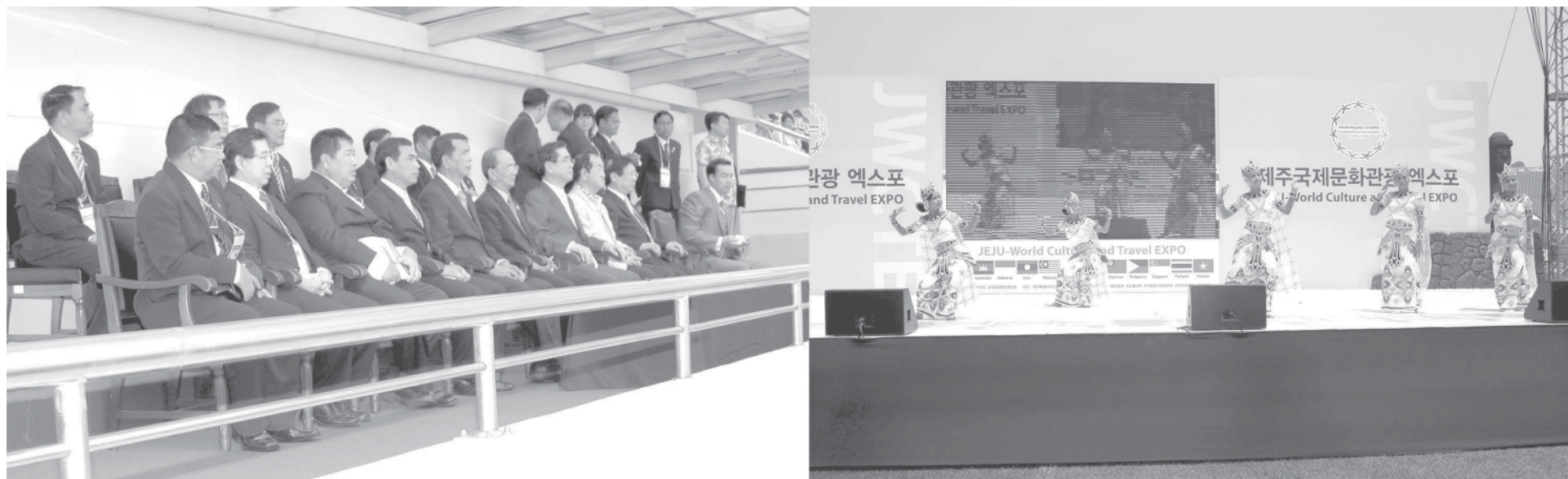
Prime Minister General Thein Sein enjoys dance of Bagan-era of Myanmar cultural delegation performed in commemoration of Jeju World Culture and Travel Expo held at Jeju World Cup Stadium in Jeju of the Republic of Korea.

NAY PYI TAW, 3 June—Prime Minister General Thein Sein visited Myanmar booth in Jeju World Culture & Travel Expo held at Jeju World Cup Stadium in Jeju of the Republic of Korea on 1 June afternoon.