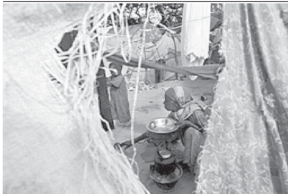
A displaced Somali woman prepares a meal in a makeshift shelter in a camp for Internally Displaced People on the outskirts of Mogadishu.