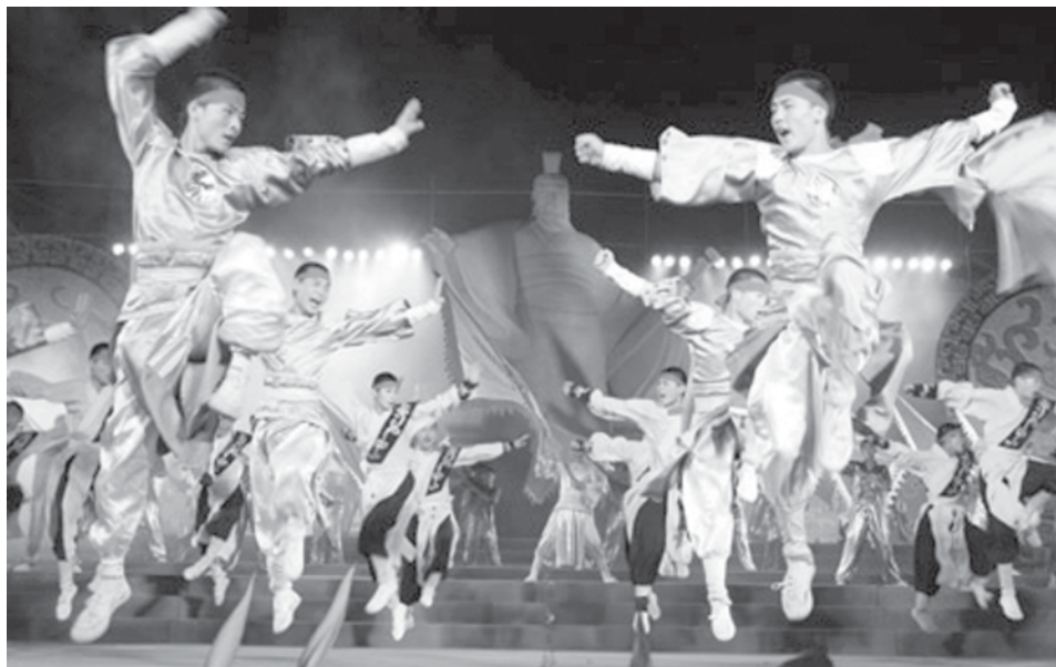
Dancers spring up in a brilliant art show during the 3rd Three Kingdoms Cultural Week, in the Xudu Capital Park, in Xuchang City, central China's Henan Province, on 1 June, 2009.