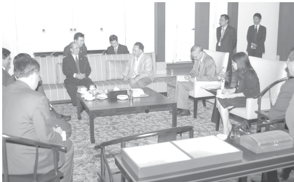
Prime Minister General Thein Sein receives Thai Foreign Affairs Minister Mr Kasit Piromya at Suvarnabhumi Airport in Bangkok of Thailand.—MNA

Before the summit, the Heads of State/Government of ROK and ASEAN countries posed for