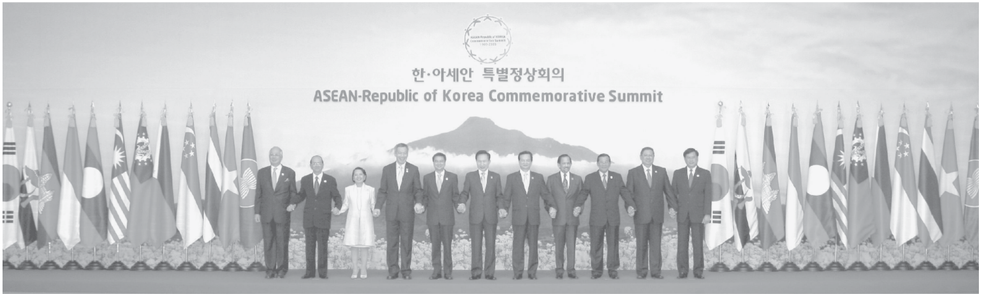
Prime Minister General Thein Sein, Korean President Mr Lee Myung-bak and heads of State/Government from ASEAN countries pose for documentary photo before ASEAN-Republic of Korea Commemorative Summit.