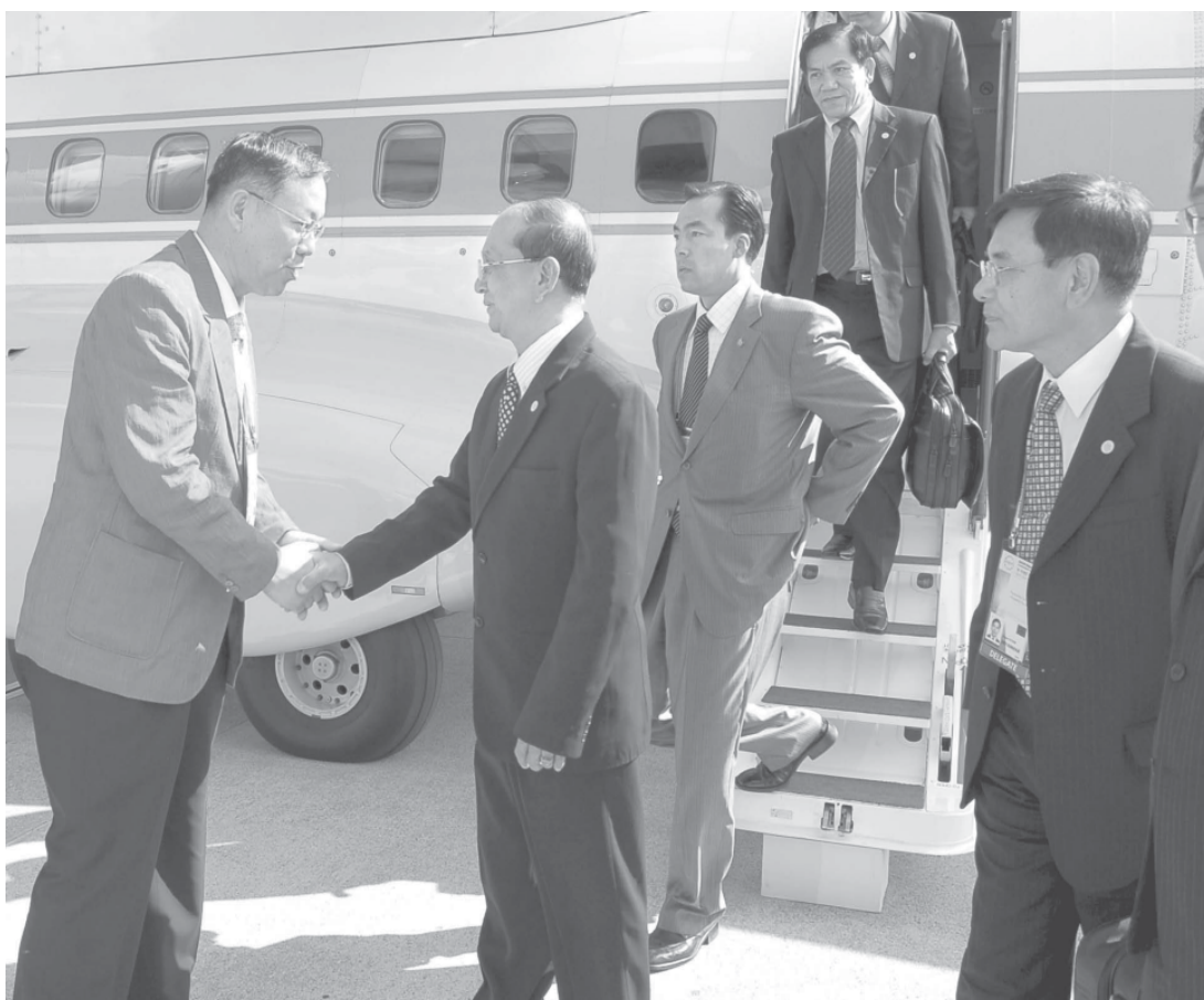
Prime Minister General Thein Sein being welcomed by Governor of Jeju Special Self-governing Province Mr Kim Tae-Hwan at Jeju Airport, the Republic of Korea.