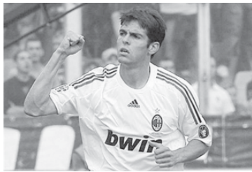
Brazilian playmaker Kaka

MADRID, 3 June—Brazilian playmaker Kaka has signed for Real Madrid from AC Milan in a 65-million-euro deal, Spanish radio station Cadena Ser reported on Tuesday.