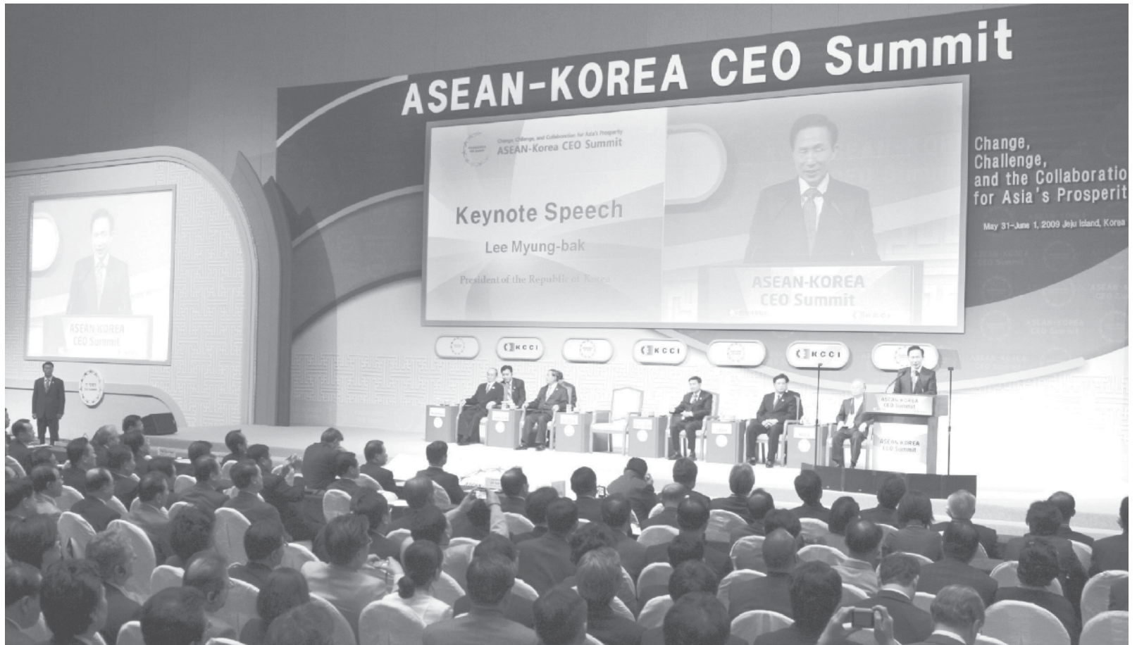
Opening ceremony of ASEAN-Korea CEO Summit in progress.—MNA

The heads of State/Government cordially greeted the senior officials and entrepreneurs of the