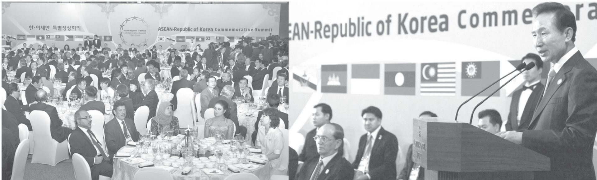
President of ROK Mr Lee Myung-bak makes speech at dinner.