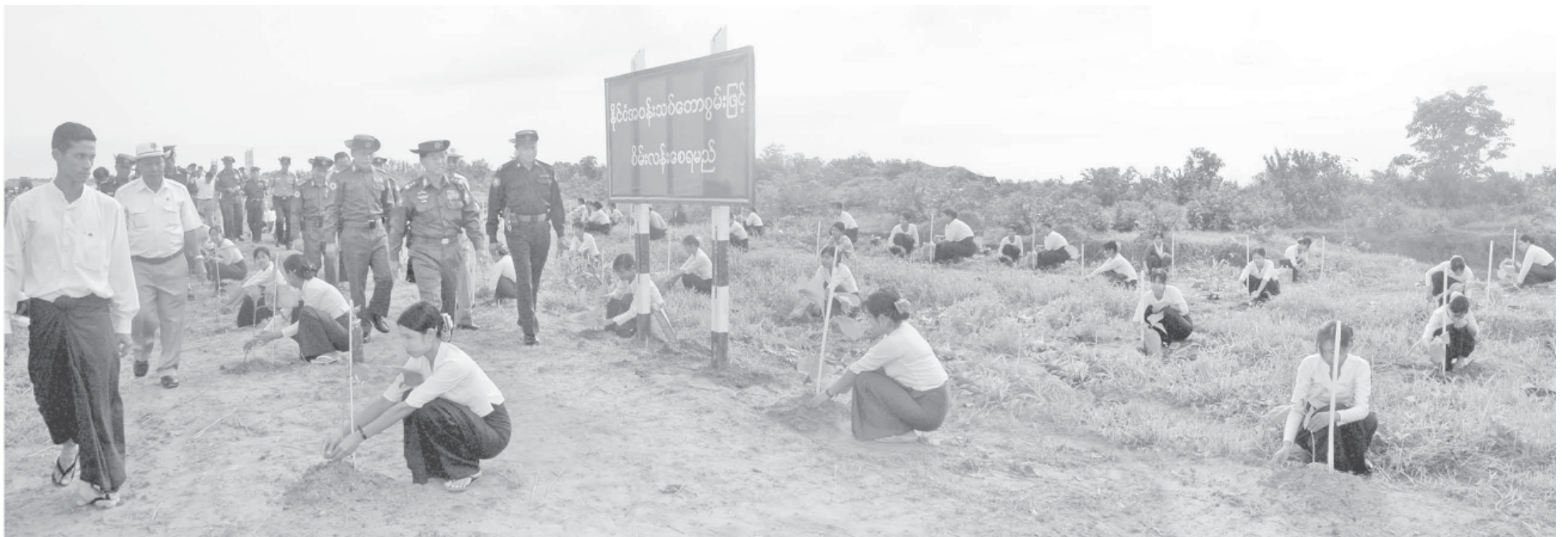
Lt-Gen Myint Swe of the Ministry of Defence views collective planting of teak saplings on both sides of Yangon-Mandalay Highway.

YANGON, 2 June — Lt-Gen Myint Swe of the Ministry of Defence attended the tree plantation ceremony held near Milepost No (8/7) on Yangon-Mandalay Highway in Hlegu Township, Yangon North District this morning in commemoration of World Environment Day of Yangon Division for 2009 and grew a teak plant.