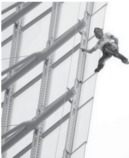
Alain Robert stops 20 floors up for a breather as he climbs the Royal Bank of Scotland building in Sydney, Australia, Tuesday, on 2 June, 2009. The French skyscraper climber nicknamed 'Spiderman' was arrested on Tuesday after scaling a 41-story building with his bare hands, stopping traffic on the busy street below.