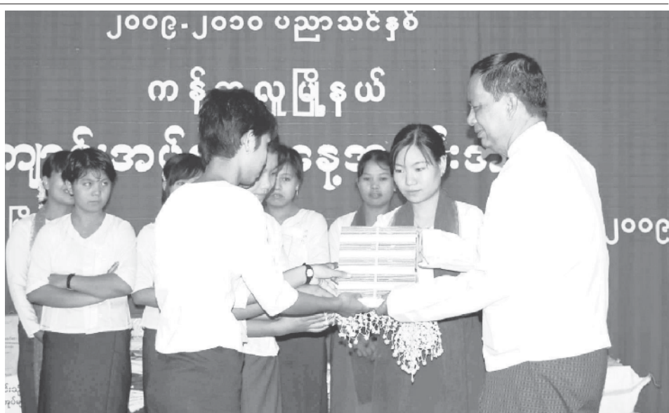
Minister Dr Chan Nyein presents exercise books to school boys and girls during the school enrolment day at BEHS No. 1 in Kanbalu.