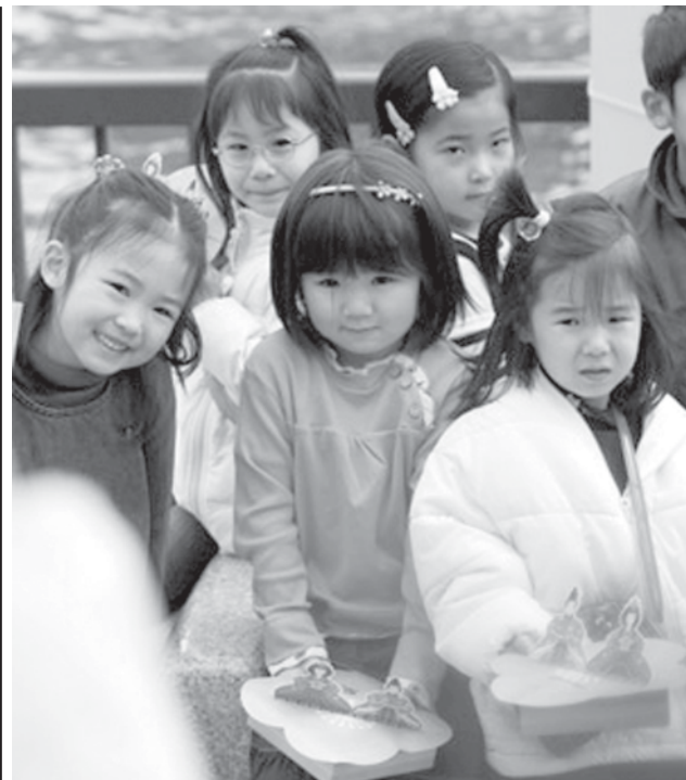
A file photo shows some girls prepare to release paper boats decorated with dolls in Tokyo, capital of Japan.