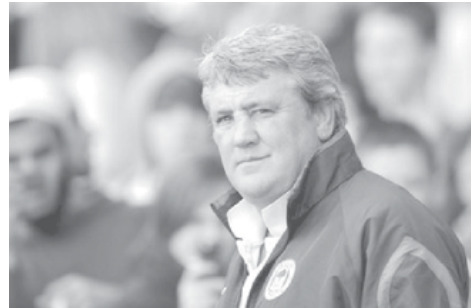
Wigan Athletic manager Steve Bruce pictured before his side's Premier League match against Blackburn Rovers at Ewood Park in Blackburn, north-west England, in April.

a big way," said Federer who battled back 6-7 (4/7), 5-7, 6-4, 6-0, 6-2 to beat German veteran Tommy Haas in the fourth round on Monday.