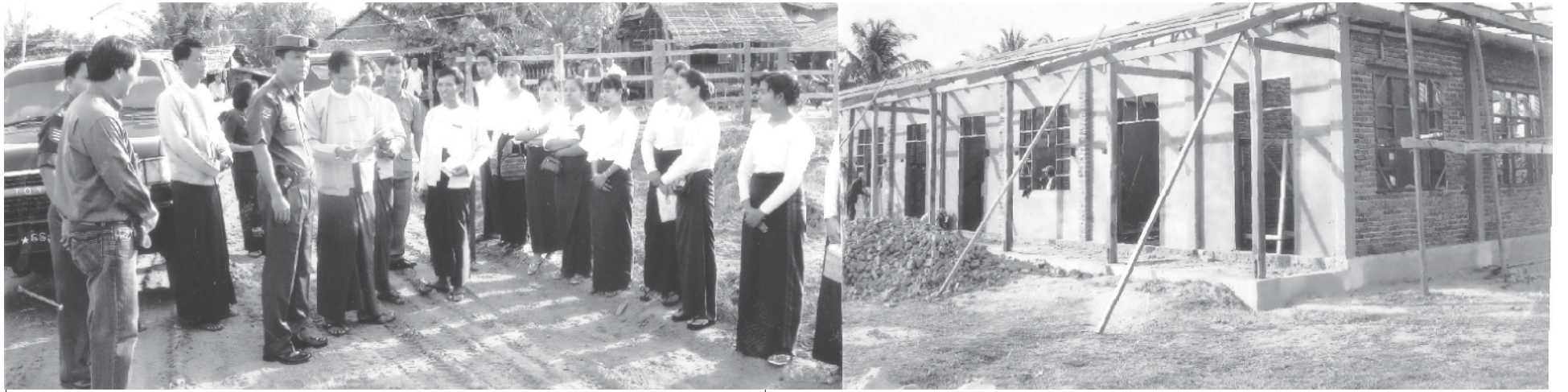
Commander Maj-Gen Kyaw Swe inspects construction of new school building in Chaungtha Ward-7 in Shwethaungyan Township.—MNA