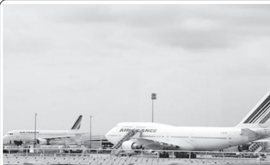
File photo dated on 2 May, 2009 shows an Air France plane. An Air France plane with 228 people on board has gone missing over the Atlantic after taking off from an airport in Rio de Janeiro of Brazil, the airline said, on 1 June, 2009.

The Cuban Public Health Ministry said the end of the restrictions was also because Cuba has improved and strengthened its sanitary measures against the flu virus. The ministry said in a communique that the sanitary and epidemic observation measures reduced the risk of an outbreak.—Xinhua