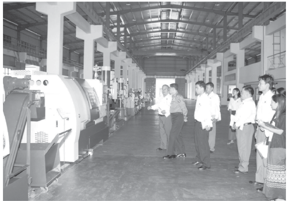
Minister Vice-Admiral Soe Thein inspects Machine and Machine Tools Factory (Myaing). — MNA

The copies of the journal are available at Sarpay Beikman Bookshop on Merchant Road, Kyautada Township, Panshwepyi Bookshop of News and Periodicals Enterprise and the NPE bookshop on Theinbyu Road, Botahtaung Township.—MNA