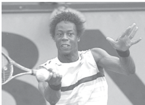
French player Gael Monfils returns a ball to US player Andy Roddick during a French Open tennis round of 16 match at Roland Garros Stadium in Paris. Monfils won 6-4, 6-2, 6-3.

"I respect her a lot," said Kuznetsova, who picked up her first career title in two years on the Stuttgart clay in April.