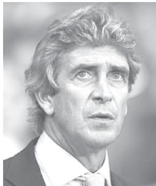
Real Madrid announced on Monday it has appointed Chilean Manuel Pellegrini, pictured in April, 2009, currently with Villareal, as the club's new coach.

MADRID, 2 June—Florentino Perez, the inspiration behind the Real Madrid 'Galacticos', launched his second term as president on Monday by bringing in Chile's Manuel Pellegrini as the club's new coach and France legend Zinedine Zidane as a top