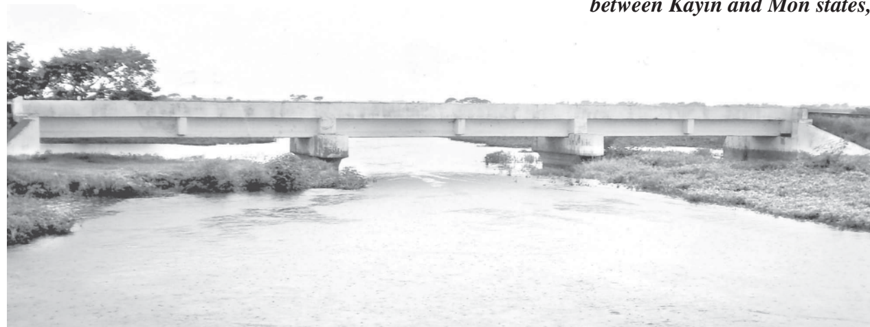
A bridge on DaikU-Sittoung railroad section.

time through the road, which also links Yangon-Mandalay Highway in DaikU Township and the road between Kayin and Mon states in Waw Township. So, local people can now travel to Kayin and Mon states through Yangon-Mandalay Highway.