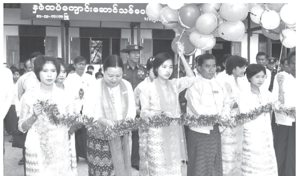
Minister for Finance and Revenue Maj-Gen Hla Tun attends opening of two-storey school building in Kabyu Village in Kyaukpadaung Township. — F & R

After the ceremony, he met with local people and called for