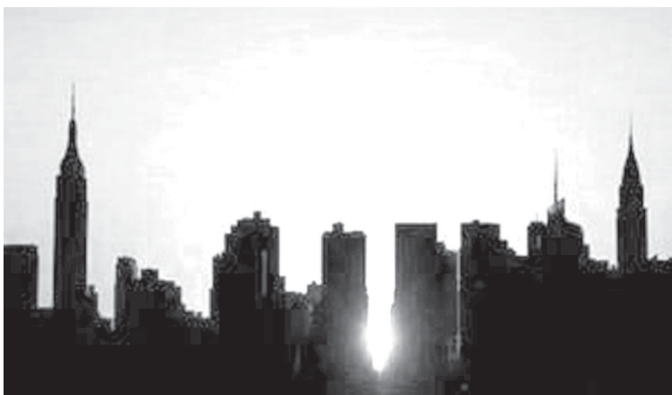
The sun sets over Manhattan aligned exactly with the streets in a phenomenon known as "Manhattanhenge", in New York, on 31 May, 2009.—INTERNET

Colombia has an annual production of 600 tons of cocaine and it is the largest producer and second exporter of cocaine in the world.—MNA/Xinhua