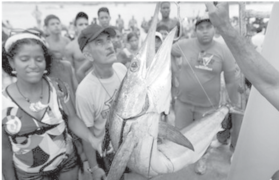
A marlin is weighed during the 49th Ernest Hemingway marlin local fishing tournament in Cojimar, Cuba recently.