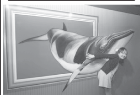
A visitor poses in front of an illusionary art work of a whale at the Trick Art Museum at the foot of Mount Takao on the outskirts of Tokyo, Japan.