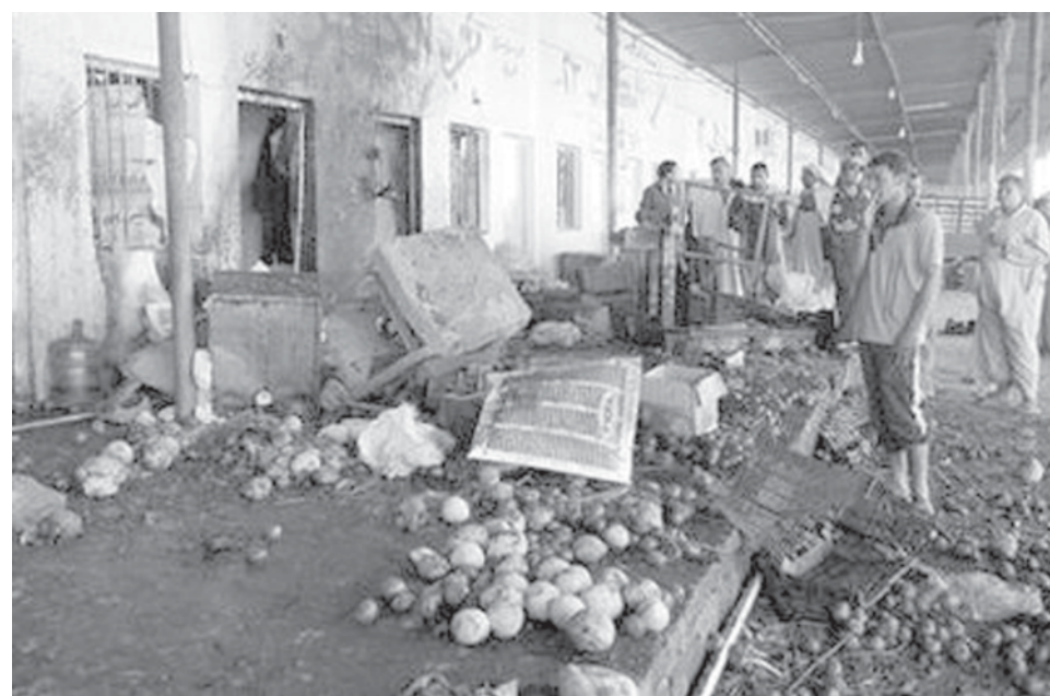
Residents gather at the site of a bomb attack in a wholesale vegetable market in Baghdad, on 1 June, 2009. A bomb planted in the popular vegetable market killed four people and wounded 13 in southern Baghdad on Monday, police said, the second time the market has been attacked in just over two weeks.— INTERNET

The journalists, who had just finished lunch, were planning to do a story on the local Olympic committee, a police officer said, speaking on condition of anonymity because he wasn't authorized to release the information. The head of the Iraqi Journalists' Union, Mouyyad al-Lami condemned the attack and called upon the Iraqi government to step up protection for journalists.— Internet