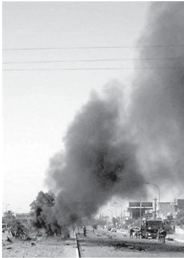
Smoke billows from a vehicle following a suicide attack in the northern city of Kirkuk, on 12 May.

An ISAF official told AFP on condition of anonymity that they were American troops who were killed in Wardak Province near Kabul.— Internet