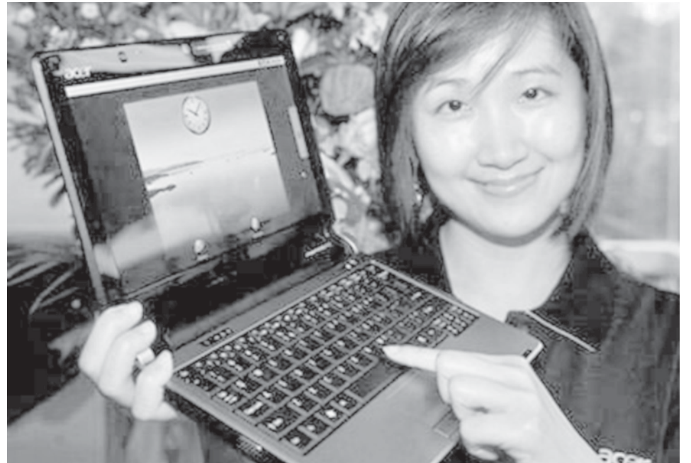
A woman displays a latest Acer UX-30 notebook at Computex Taipei, Asia's biggest information technology trade show, on 2 June, 2009. The show opened on Tuesday, with the spotlight on low-priced notebook computers and advanced broadband Internet mobile technology.—INTERNET

Admissions raised 7.2 million pounds in the last financial year, indicating the potential for additional income. The committee called for extra admissions and dismissed concerns that opening days were constrained by the amount of time the palace is used for state and royal occasions, with the queen in residence for 111 days in 2008.—MNA/Reuters