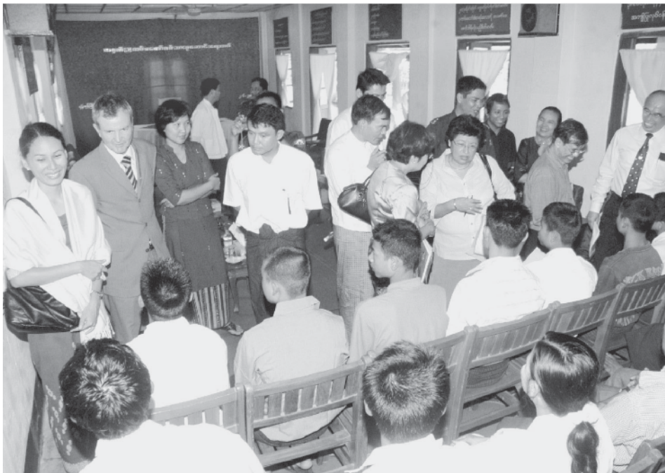
Resident representatives of NGOs and responsible personnel raise queries to parents of minors.

Resident representatives and responsible persons of the NGOs cordially met with the parents of the minors and raised questions.