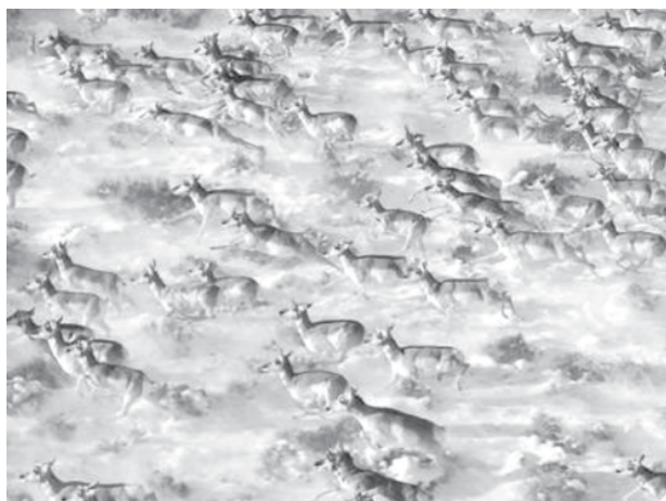
These are pronghorn ( Antilocapra americana ) running in snow.