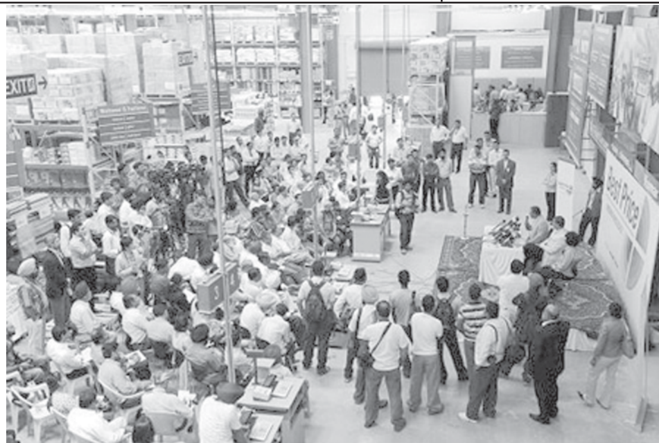
World's largest retailer Wal-Mart Stores Inc and local partner Bharti Group opened their first wholesale outlet in India as rising disposable incomes boost demand in the world's second-fastest-growing major economy.