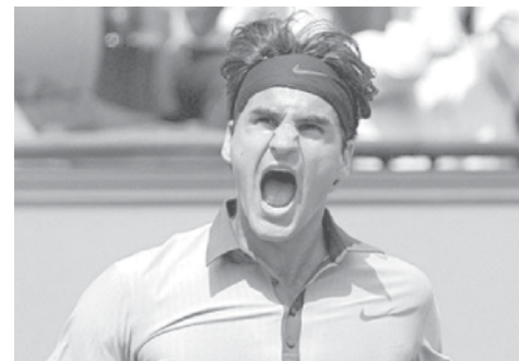
Swiss Federer Roger Federer celebrates after winning against German player Tommy Haas during a French Open tennis round of 16 match at Roland Garros Stadium in Paris. Federer won 6-7 (4/7), 5-7, 6-4, 6-0, 6-2.

"I'm used to any kind of a situation, so (Nadal's defeat) doesn't affect me in