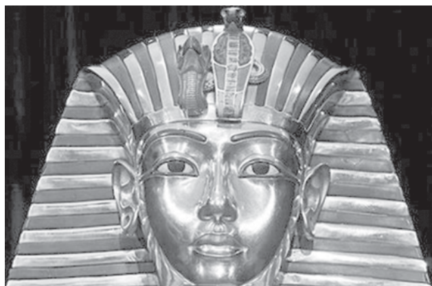
A replica of the death mask of Egyptian pharaoh Tutankhamun. Egyptian researchers are using DNA tests to discover the lineage of pharaoh king Tutankhamun, whose ancestry remains a mystery to Egyptologists, antiquities chief Zahi Hawass said on Monday.

The antiquities chief said the testing would be done with help from experts at Cairo University's faculty of medicine and would also include X-raying and the reconstruction of possible relatives' features.— Internet