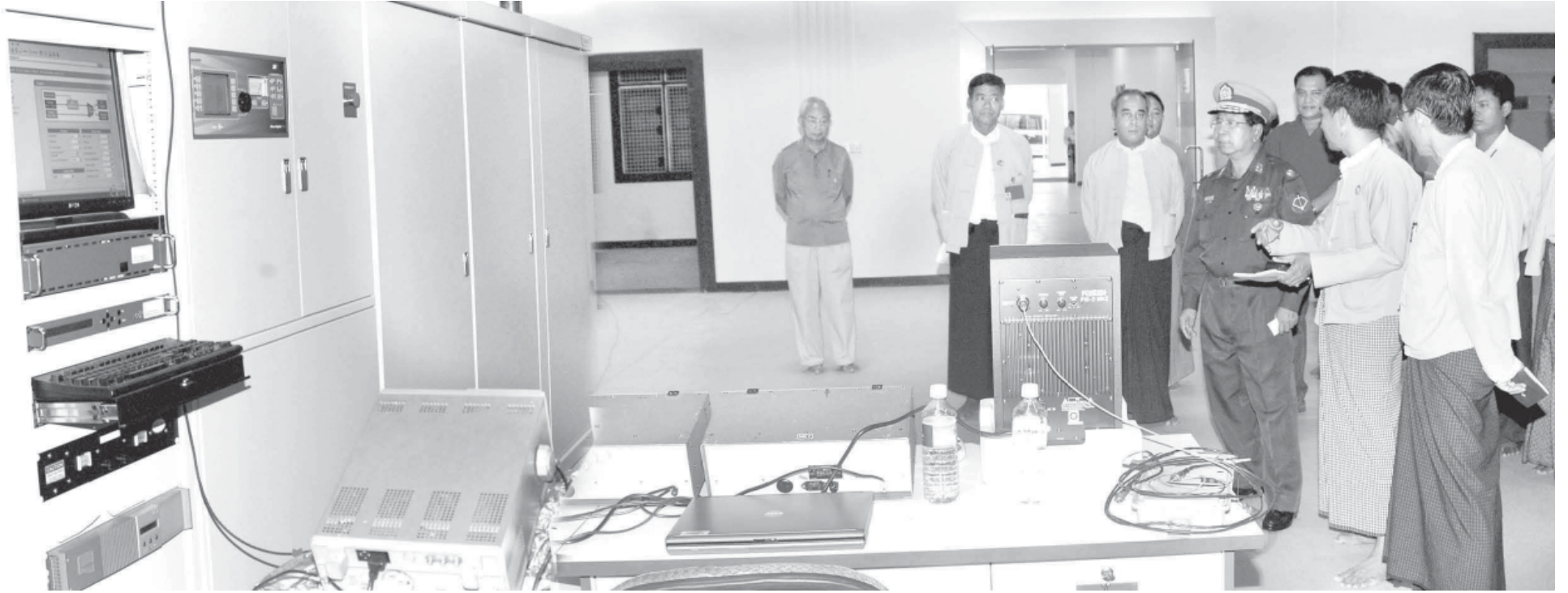
Minister Brig-Gen Kyaw Hsan inspects Yegu transmission station in Mayangon Township.

NAY PYI TAW, 2 June—Minister for Information Brig-Gen Kyaw Hsan visited Yegu transmission station in Mayangon Township here yesterday.