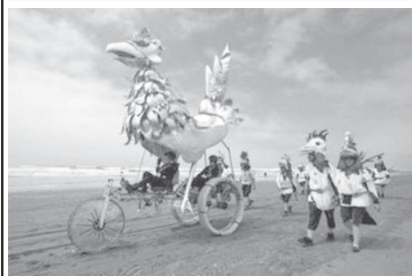
Contestants in the 40th annual Kinetic Grand Championship race their people-powered kinetic sculpture, "The Kinetic Chicken", across the beach in Manila, California. The championship is a three-day 42-mile bicycle race over land, sand, mud and water from Arcata to Ferndale.