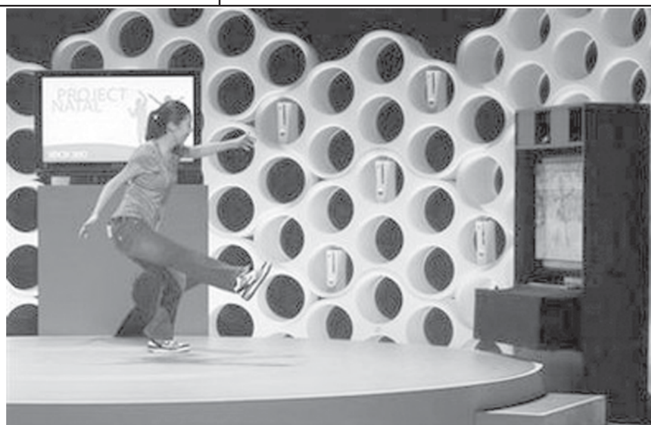
A demonstration is given of the new Xbox Project Natal, new technology that uses Natsals motion control to let gamers take control of titles using their entire body, at the Microsoft Xbox 360 E3 2009 media briefing in Los Angeles, on 1 June, 2009.

US crude fell 43 cents to $68.15 a barrel by 0158 GMT after hitting its highest settlement since 4 November on