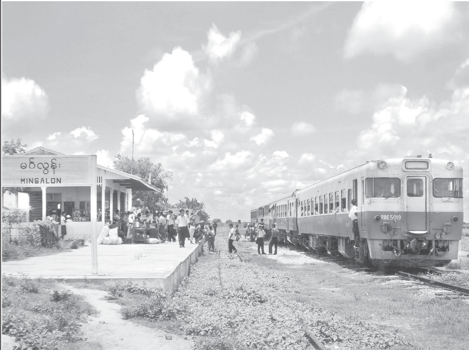
Mawlamyine-Nay Pyi Taw train seen at Mingalon Station in DaikU-Sittoung railroad section.

Article: Peinzalok Thein Nyunt; Photos: Nay Lin (Nyaunglebin)