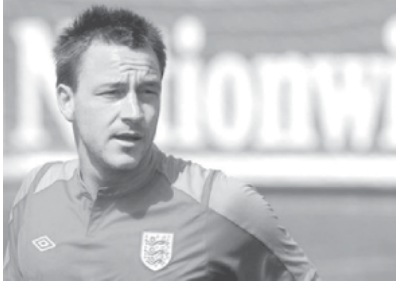
Chelsea captain John Terry

LONDON, 2 June—Chelsea captain John Terry admits Carlo Ancelotti's first job at Stamford Bridge is to ensure the Blues are serious challengers for the Premier League title. Ancelotti signed a three-year contract worth 6.5 million pounds a year on Monday to succeed Guus Hiddink as manager of the west London club.