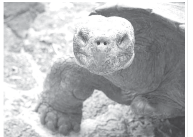
Galapagos giant tortoise.

fears that these changes could devastate the islands' unique native wildlife if a new mosquito-borne disease is introduced - a scenario which is increasingly likely with the continuing rise in tourism.—Internet