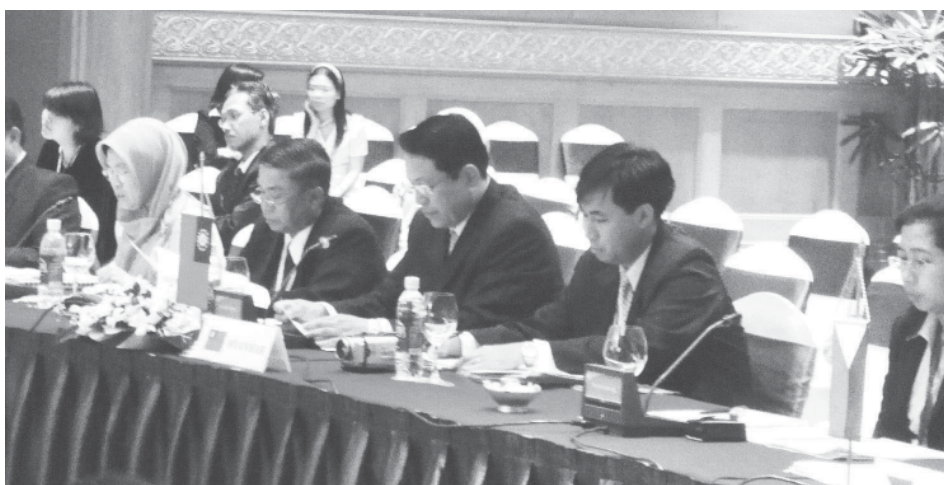
Deputy Minister Brig-Gen Tin Ngwe participates in ASEAN Ministerial Meeting on Poverty Reduction and Rural Development. — MNA

works of antenna towers and transmitters, gave instructions on safety of the station and prevention of destructive acts and urged staff families to raise poultry and farm on a manageable scale.—MNA