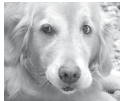
Researchers in Sweden have figured out the basis for a neurological disorder in Golden Retriever dogs called sensory ataxic neuropathy.

STOCKHOLM, 2 June—Sensory ataxic neuropathy (SAN) is a recently identified neurological disorder in Golden Retriever dogs with onset during puppyhood. Affected dogs move in an uncoordinated manner and have sensory deficits. Researchers from the Swedish University of Agricultural Sciences, Uppsala University and the Karolinska Institutet have now revealed that SAN is caused by a mutation in mitochondrial DNA. The study is published 29 May in the open-access journal PLoS Genetics . The researchers were able to trace back all affected offspring on the maternal side, over more than 10 generations, to a female that lived during the 1970s. This implied a maternal inheritance, which was confirmed by the identification of a one base pair deletion in the mitochondrial tRNA-Tyr gene. Further analyses revealed that the mutation leads to mitochondrial dysfunction, which in turn causes a progressive loss of neurons. Internet