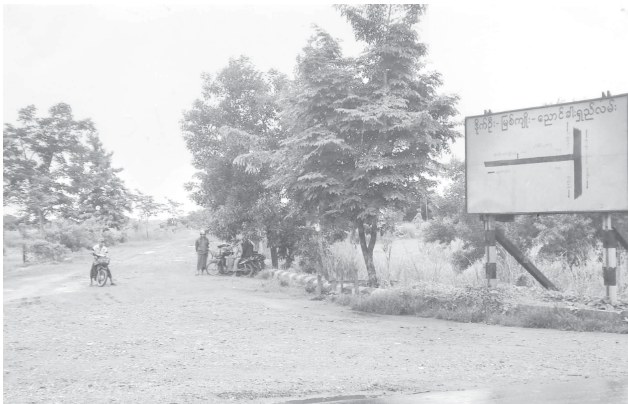
DaikU-Myitkyo-Nyaungkhashe laterite road linking Yangon-Mandalay Highway and the road between Kayin and Mon states, is seen at the entrance to DaikU.

So, local people transport their goods in a short