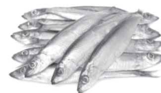
Parasites were found to be present at higher levels in anchovies from the south east Atlantic coast and the north eastern Mediterranean.