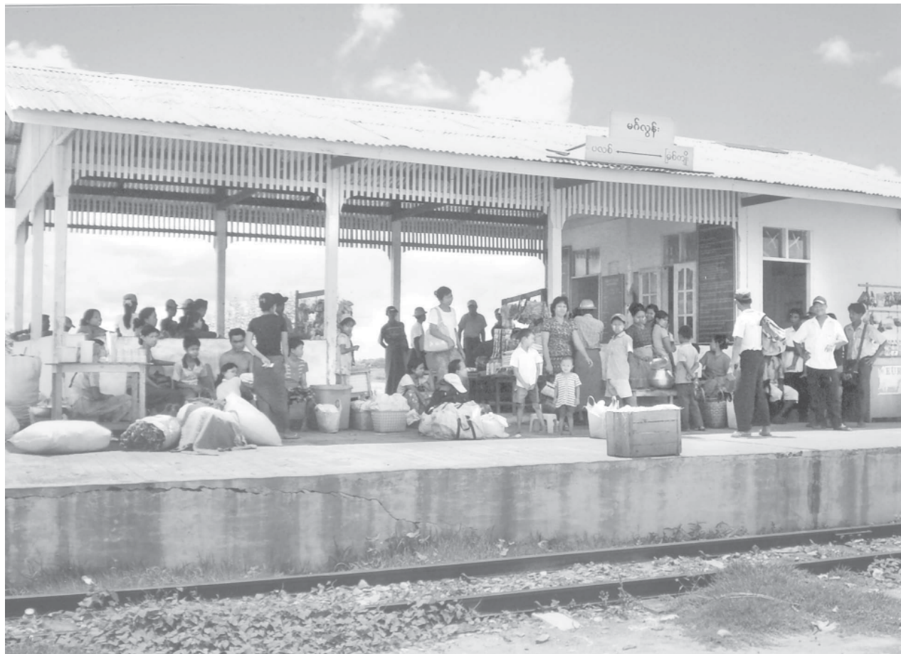
Passengers waiting at Mingalon Station in DaikU Township, Bago Division, to travel between Nay Pyi Taw and Mawlamyine.