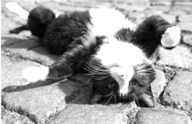
A cat relaxes in the morning sun on a terrace near Kiel, northern Germany, as temperatures reach 18 degrees Celsius (64.4 Fahrenheit) Monday morning, on 1 June, 2009.