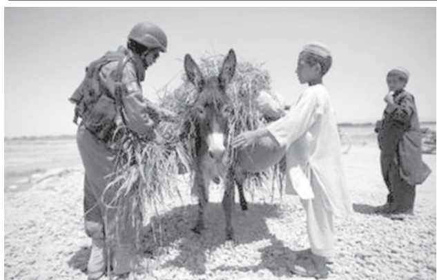
An Afghan police man searches a donkey at a check point near Forward Operation Base (FOB) Masum Ghar in Kandahar Province, on 24 May, 2009.

Meantime, a Taliban purported spokesman Zabihullah Mujahid from unknown location told media that four police were killed in the firefight lasting for a while.