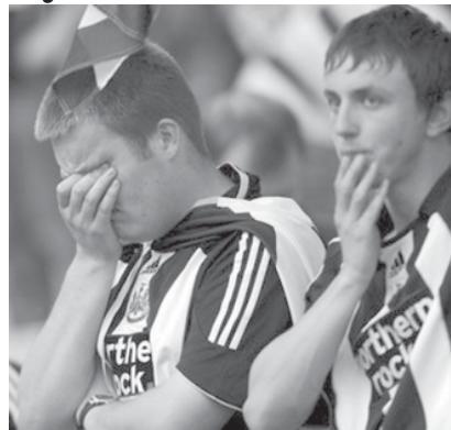
Newcastle United supporters show their disappointment following the final Premiership match of the season at Villa Park in Birmingham. Aston Villa won the game 1-0. The result relegates Newcastle United from the Premiership Division into the Championship.

Ashley was at Villa Park on Sunday to watch Newcastle surrender their 16-year membership of the Premier League thanks to an own goal from Damien Duff. Now he will meet with Shearer this week to discover whether the former Newcastle striker is willing to take the manager's job full-time. Shearer admits he has been bitten by the managerial bug and would like to remain at the helm to try to regain Premier League status at the first attempt next season. But he has seen so many things wrong at the club in the past few months, and for long periods before that, that he fears the club could implode completely, like Leeds who are now in League One, unless major changes are made.—Internet