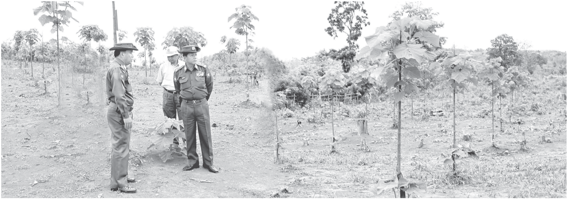
Maj-Gen Min Aung Hlaing of the Ministry of Defence views plantations of Forestry Department in Lashio.