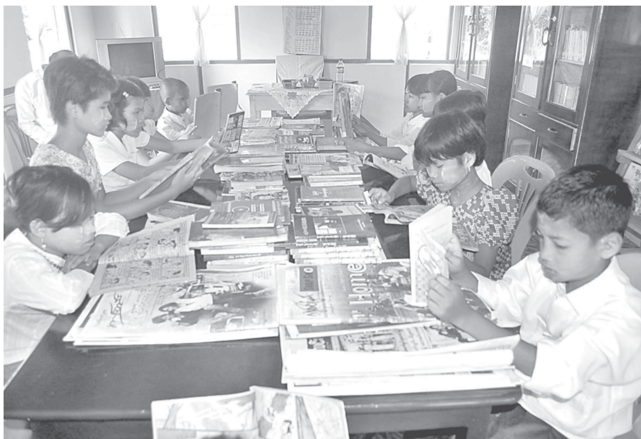
Locals reading at Doh-Alin library of Nanchaung village in Thandwe, Rakhine State.

Today is the Information Age, so it implies that no one can lose touch with news in their life. Today is also called Media Age. The