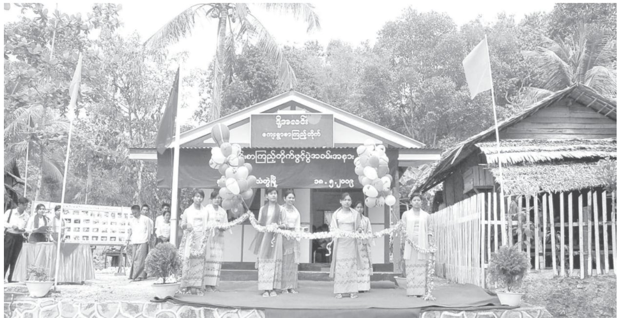
Opening of Doh Alin Library in Nanchaung Village, Thandwe, Rakhine State, in progress on 18-5-2009.

The stations are enough for all the townships in