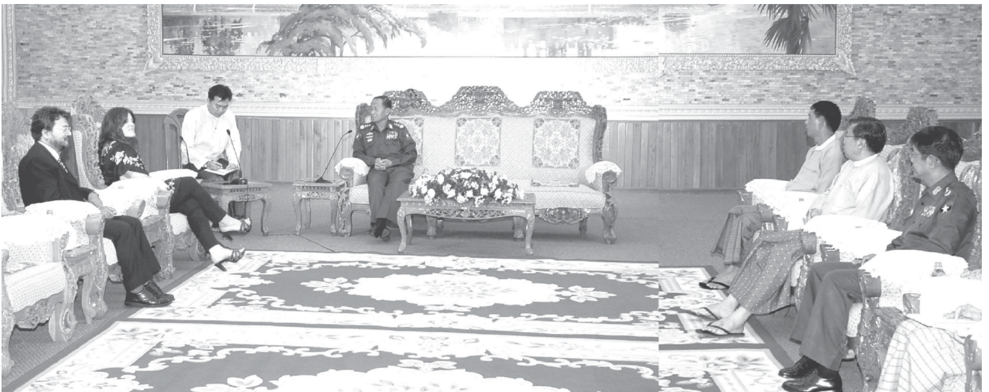
Secretary-1 of the State Peace and Development Council General Thiha Thura Tin Aung Myint Oo receives Ms Hilde F. Johnson, Deputy Executive Director of UNICEF.

NAY PYI TAW, 25 May—Secretary-1 of the State Peace and Development Council General Thiha Thura Tin Aung Myint Oo received Ms Hilde F. Johnson, Deputy Executive Director of the United Nations Children's Fund (UNICEF), at the SPDC Office at 5