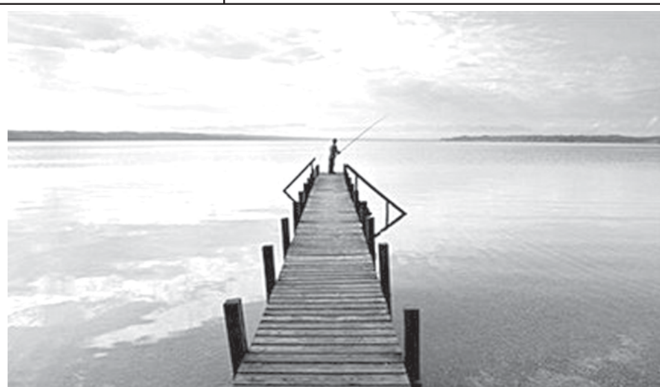
A man fishes at the Starnberger See lake in Garatshausen, southern Germany.