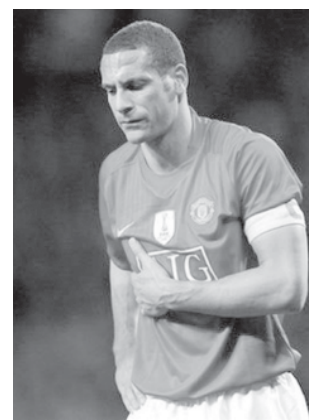
Sir Alex Ferguson is confident Ferdinand will be fit for Manchester United's Champions League final against Barcelona despite being forced to leave him out of his side's victory at Hull.

But it was Ferdinand's fitness that occupied United minds after the match. The England centre-back has missed the last