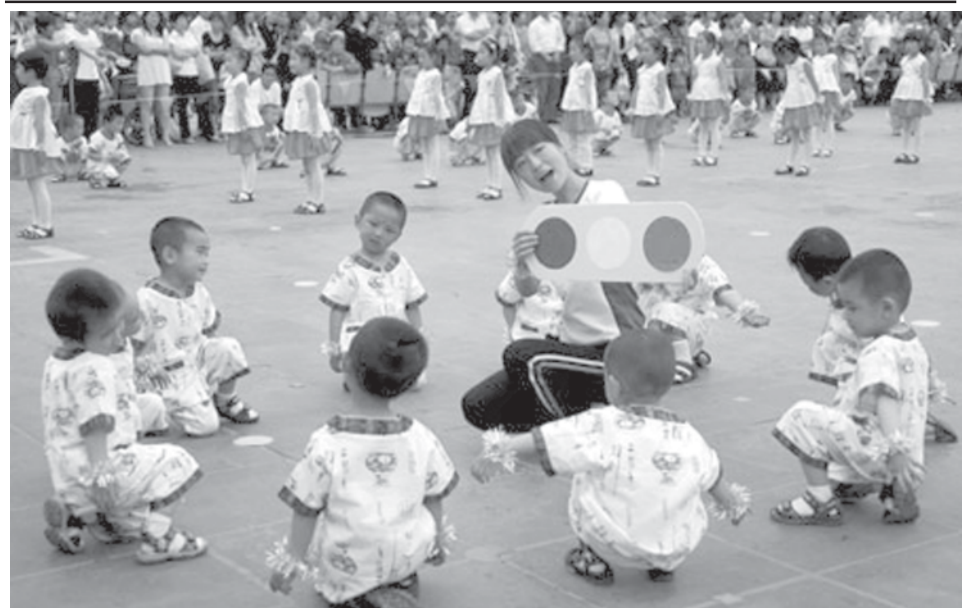
The children of a kindergarten perform group gymnastic exercise in an activity in Yuncheng, a city of north China's Shanxi Province, on 24 May, 2009.