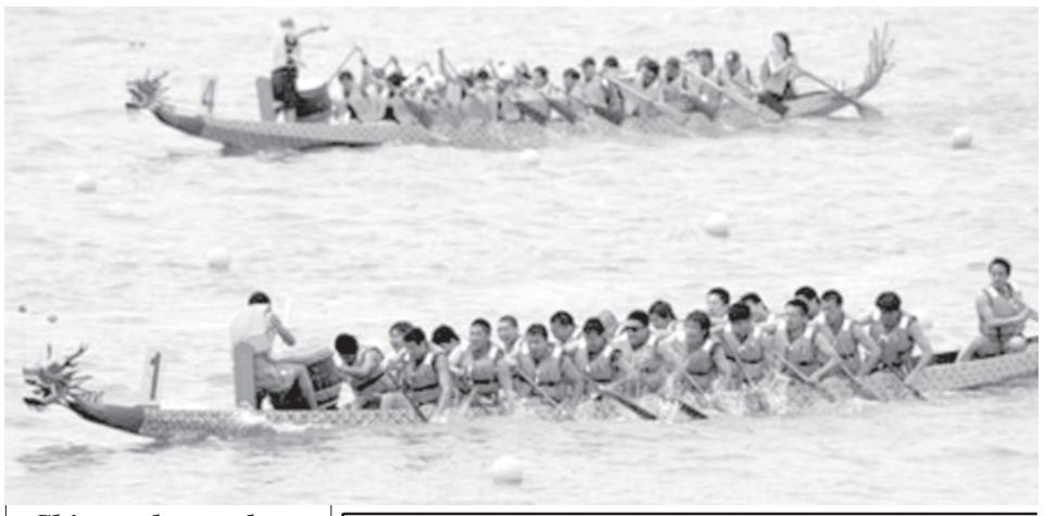
Chinese dragon boat athletes compete at an invitation race to welcome the Dragon Boat Festival, which is due on 28 May, on a lake in Shanghai, east China, on 24 May, 2009.