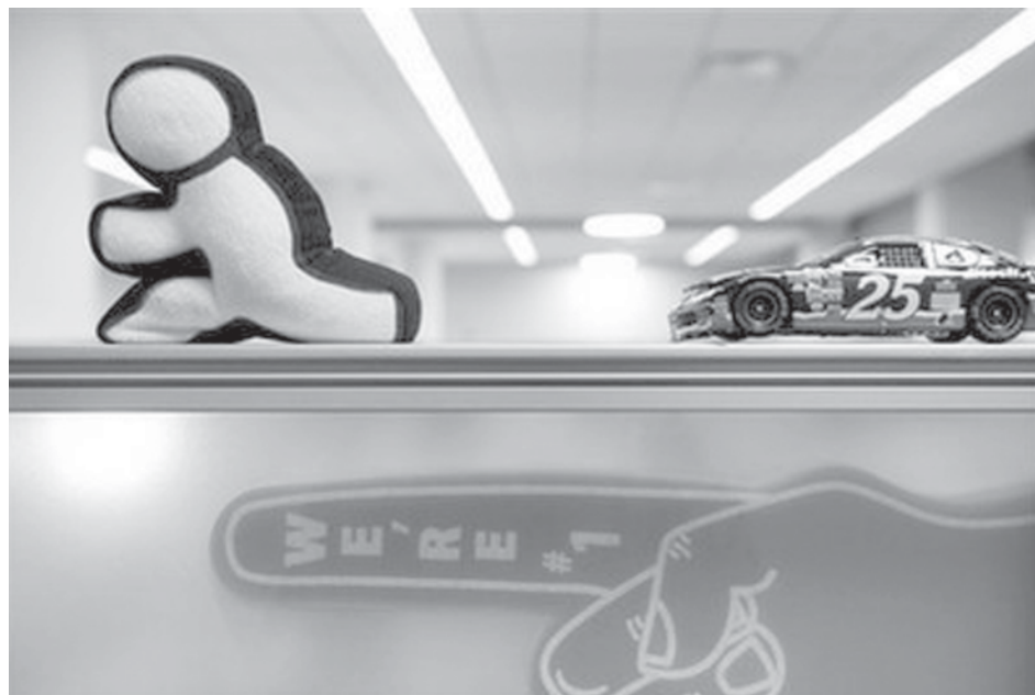
In this photo, the AOL Running Man figure decorates an employee's cubicle in AOL's New York office. The arrival of CEO Tim Armstrong arrival has thrilled employees who were unhappy under his predecessors, who were widely considered out of touch and out of place.