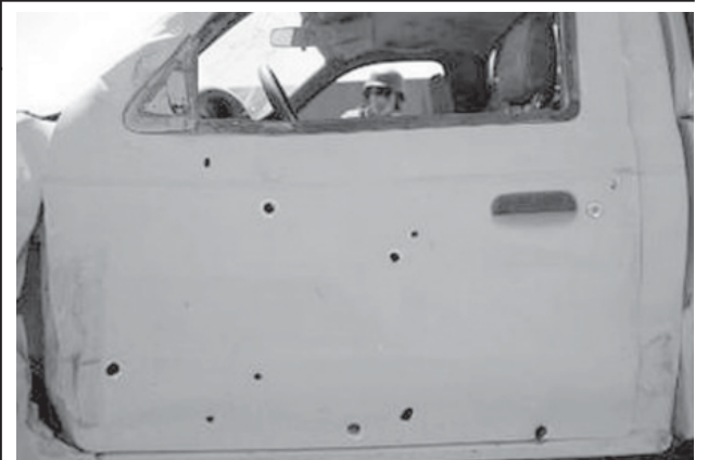
An Afghan national police officer examines a police car after it was attacked, near Forward Operation Base (FOB) Masum Ghar in Kandahar Province, on 24 May, 2009.