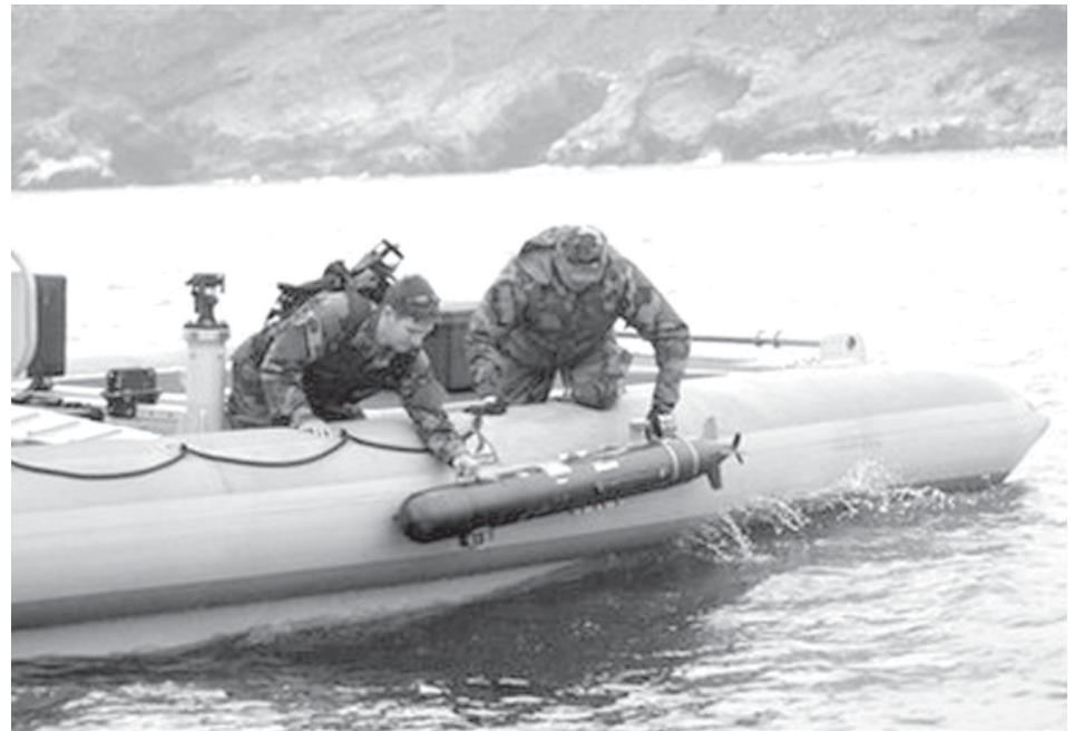
The Coast Guard suspended a search Thursday for two missing members of a Navy flight crew whose helicopter went down on a training flight southwest of San Diego on 21 May, 2009.—INTERNET