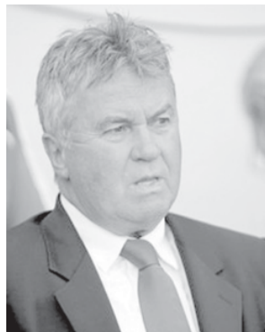
Chelsea's manager Guus Hiddink

SUNDERLAND, 25 May—Guus Hiddink is confident Frank Lampard and Chelsea's other injury victims will be fit to contest the FA Cup final against Everton at Wembley on Saturday. England midfielder Lampard and Brazil defender Alex didn't travel to Sunderland for Chelsea's 2-0 victory on Sunday, while Juliano Belletti was withdrawn after just 27 minutes at the Stadium Of Light.