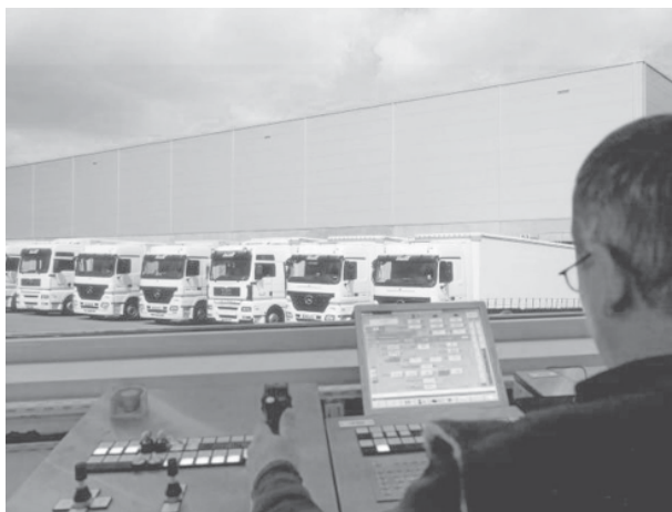
A new software system couples cargo space utilization and trip planning.

deliver paper to five customers in Bavaria. The trip planning software currently used calculates that one truck will be enough to cover the locations in central Bavaria if another truck on the Baden-Württemberg route takes over two of the deliveries. The problem is that, although the trips have been optimized, the trucks are not fully loaded. "At present, transport companies first compile the orders and then assign them to trips and vehicles. Truck capacity utilization is only optimized afterwards.—Internet