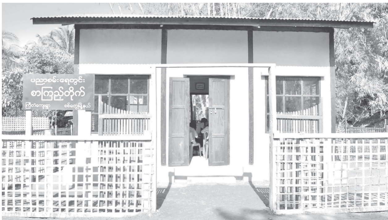
Pyinnya Sanyaydwin Library of Kywei-te village in Sittway Township, Rakhine State.

The Ministry of Information is carrying out necessary tasks for development of human resources so as to provide further impetus for national development such as improving TV and radio programmes, opening self-reliant libraries in rural areas, and providing publications for the libraries.