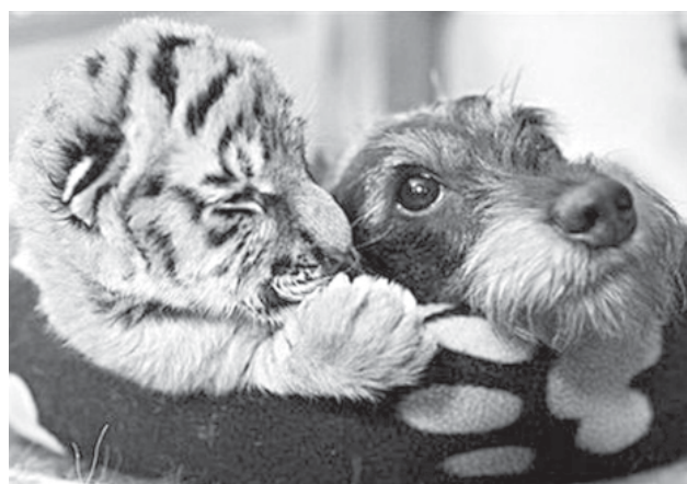
Female dachshund Bessi lays in a basket with a five-day-old baby tiger at the wild animal park Ismer in Stroehen, western Germany.