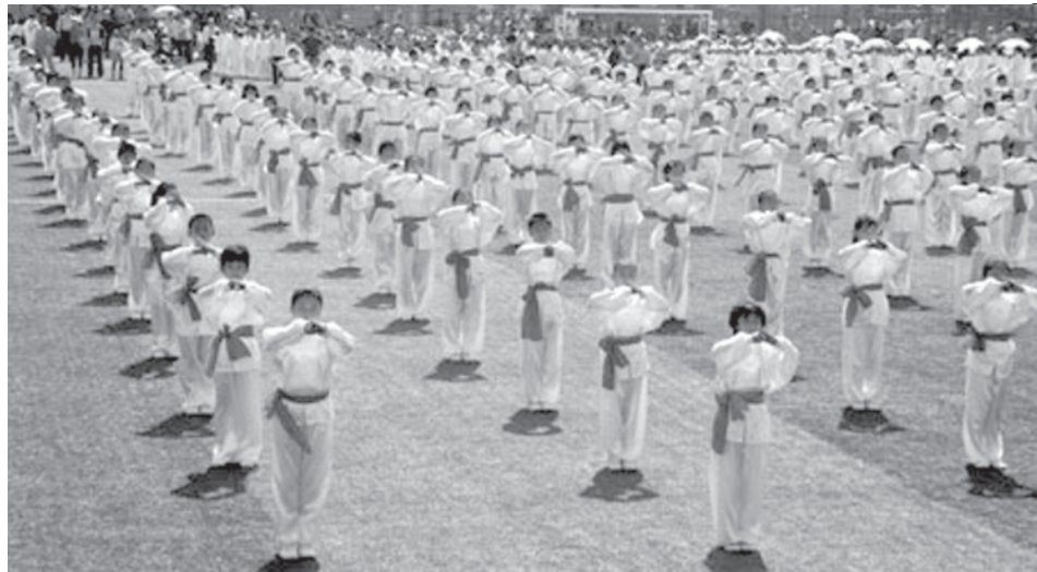
Chinese students present a group performance of Chinese Taichi, or shadowboxing, during a show in Cangzhou city, north China's Hebei Province, on 23 May, 2009.