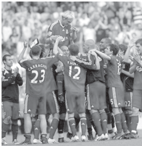
Liverpool's Finnish defender Sami Hyypia, after playing his last game for the club, with team-mates after their English Premier League 3-1 win over Tottenham at Anfield in Liverpool, north-west England.

LIVERPOOL, 25 May—Liverpool manager Rafa Benitez has insisted that he does not want to sell Spanish midfielder Xabi Alonso in the close-season. Benitez, speaking