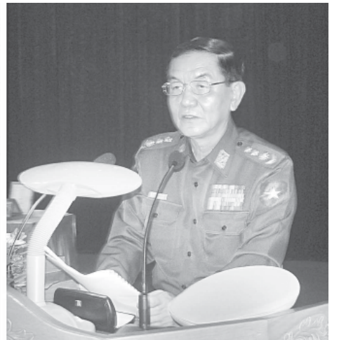
On behalf of the Secretary-1 of the SPDC, PBANRDA Minister Col Thein Nyunt delivers an address at the graduation of Nationalities Youth Resources Development Degree College (Mandalay).—MNA

NAY PYI TAW, 25 May—The course No.8 of Nationalities Youth Resources Development Degree College (Mandalay) concluded at the college this morning. Minister for Progress of Border Areas and National Races and Development Affairs Col Thein Nyunt delivered an address on the occasion on behalf of Secretary of Central Committee for Progress of Border Areas and National Races, Secretary-1 of the State Peace and Development Council General Thiha Thura Tin Aung Myint Oo.