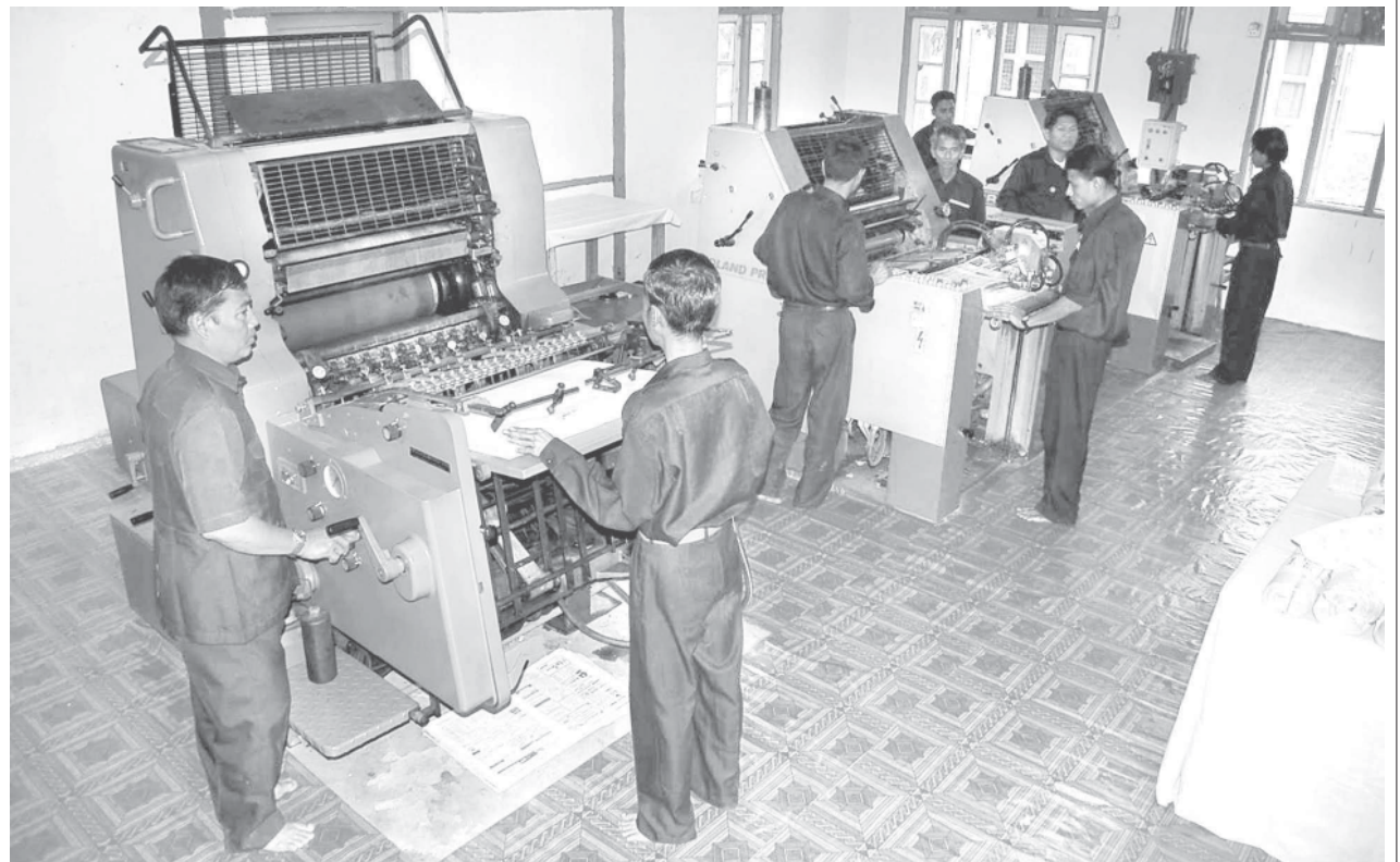
The sub-printing house of Sittway Township.

Follow-up programmes are also being carried out for sustainable progress of the self-reliant libraries. Now, many library buildings have been built with the funds donated by the Union Solidarity and Development Association and well-wishers. Under the programme, 20 library buildings have been built so far in Kywite village in Sittway Township, Bahtalay and Thaugdara villages in Yathedaung Township, Aungphyu-byin and Kwuntaung villages in Punnagyun Township, Lanmadaw and Apaukwa villages in Kyauktaw Township, Sunye village in Minbya Township, Angu village in Myebon Township, Taungphu village in Pauktaw Town-