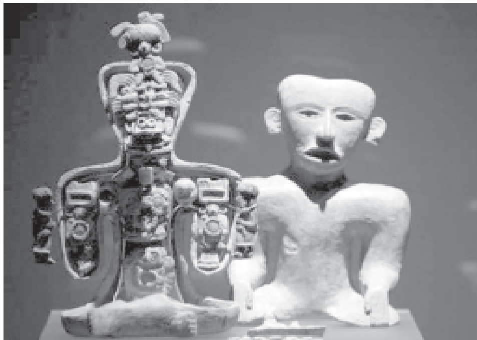
A pre-Hispanic piece called Host Figure (L) is displayed as part of the "Teotihuacan, City of Gods" exhibition in Mexico City's anthropology museum on 21 May, 2009. The piece was found in the Mayan area. Inside lie figurines and jade objects, representing Teotihuacan culture.