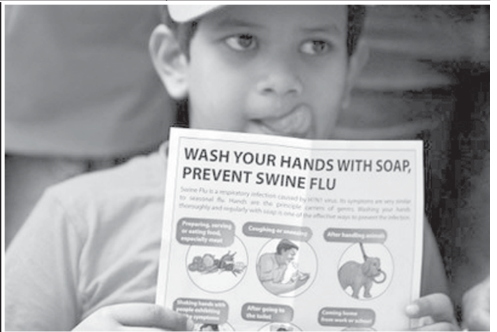
An Indian child holds up an instructional placard on how to prevent swine flu during a health awareness event in Hyderabad. Eighteen US soldiers who tested positive for swine flu have been removed from a military base in Kuwait, as Australia shuts down a school after identifying two more cases of the disease.

A mobile bomb defusal unit in which bombs can be safely detonated is expected to be delivered soon while a bomb detection vehicle which scans for explosives using X-rays is already undergoing trials with the city police. "So far the weaponry we have ordered have not been delivered since we have to order them from western countries", a senior city police official said. — MNA/PTI