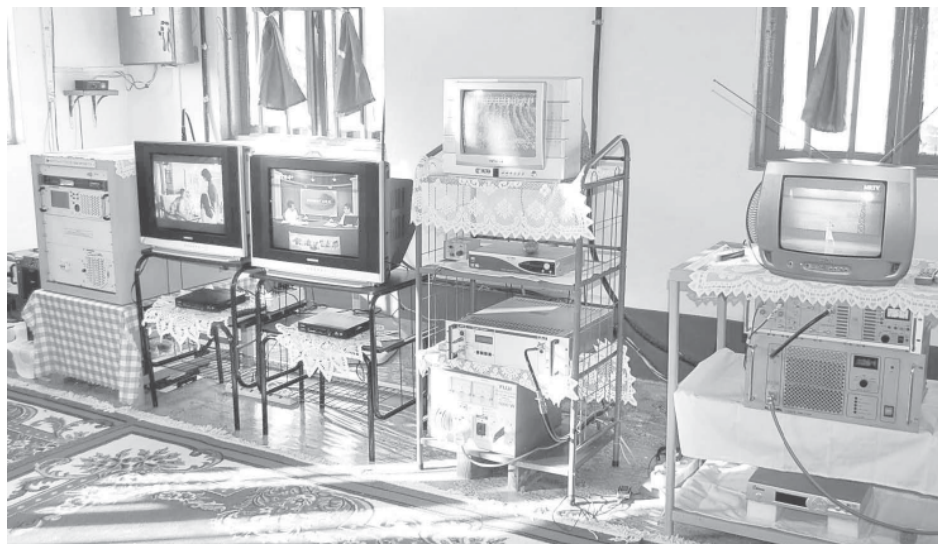
Now, Thandwe Township and surrounding areas receive programmes of MRTV-4 and related channels.

As a result of the hard work the government is exerting to build more infrastructural buildings for equitable development of all parts of the nation, local people of Rakhine State are now in a position to enjoy greater development.