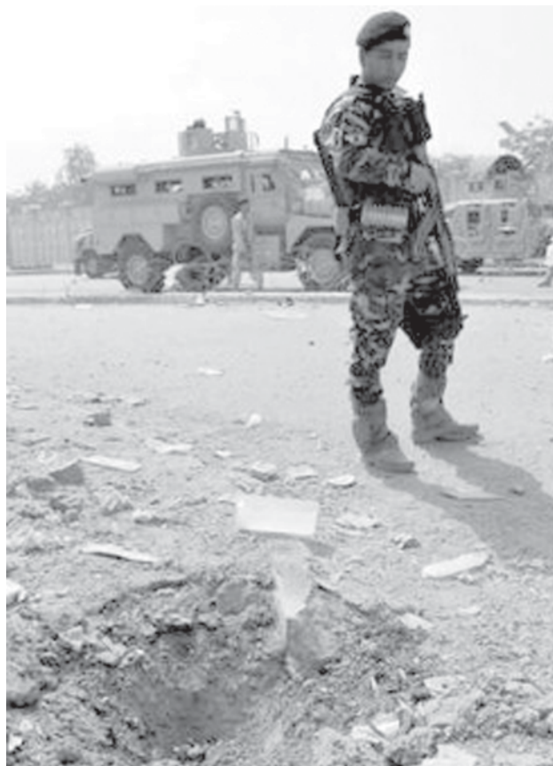
A policeman looks at a crater while securing the site of a bomb attack in Baghdad's Adhamiya district on 24 May, 2009. A roadside bomb targeting an Iraqi police patrol wounded one policeman and two civilians in Adhamiya district, northern Baghdad, police said.

Taliban militants fighting Afghan and the US-led forces have vowed to speed up attacks mostly in the shape of suicide and roadside bombings this year in Afghanistan.