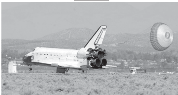
The Space Shuttle Atlantis lands at Edwards Air Force Base in California on 24 May, 2009. The Atlantis capped an extended 13-day mission to rejuvenate the Hubble Space Telescope on Sunday with a flawless landing at Edwards Air Force base in California. —XINHUA

The shuttle, STS-125, arrived at the Hubble Space Telescope at the International Space Station on 13 May. During the fifth and final space shuttle servicing mission to the Hubble Space Telescope, Atlantis' seven astronauts performed five spacewalks on five consecutive days to repair and upgrade the telescope, according to NASA. —Xinhua