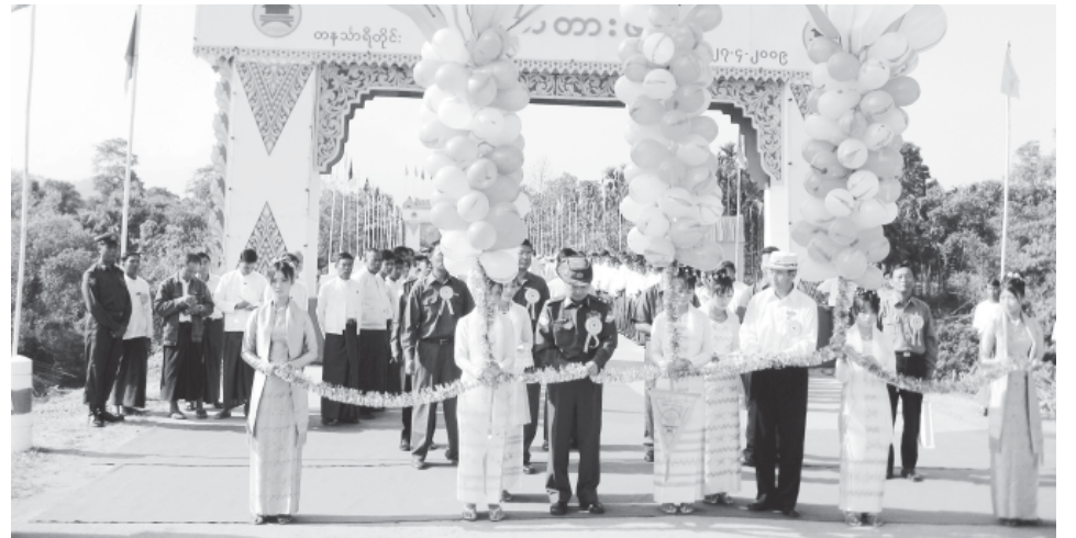
Opening ceremony of Yaypon Bridge in progress.