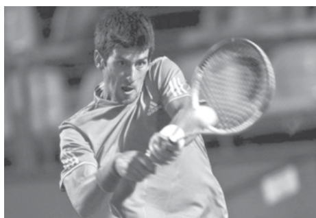
Serbian Novak Djokovic returns a ball to Spaniard Albert Montanes during their ATP Tennis Open in Rome. Djokovic won 7-6, 6-0.

Heynckes, 63, said he was "surprised" to be asked to take over from Klinsmann, but he quickly accepted the position "out of friendship for Bayern Munich and for Uli (Hoernes, Bayern team manager)."