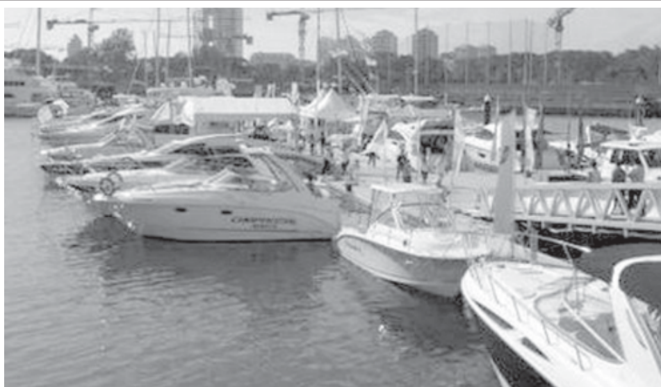
Boats are seen docked during the Boat Asia show in Singapore, on 23 April, 2009. Luxury boat makers are trying to survive the global financial storm by slashing prices and creating bargains for millionaires looking to play off Asia's coastlines.