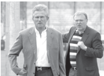
The new head coach of Bayern Munich Jupp Heynckes (L) and his assistant Hermann Gerland arrive for a training session of the Bayern Munich Bundesliga football team.

MUNICH, 29 April—In the wake of Jurgen Klinsmann's sacking by Bayern Munich, caretaker coach Jupp Heynckes said Tuesday his goal is to ensure his side qualify for the Champions League in his