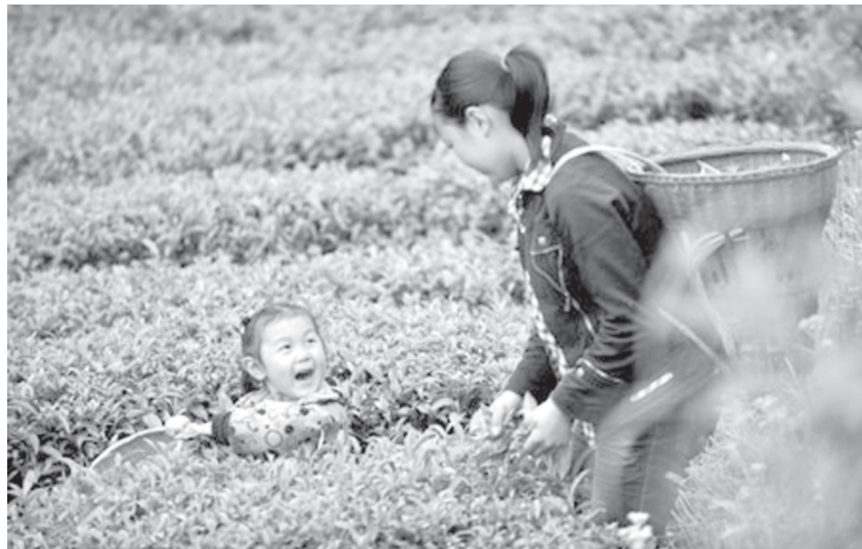
A girl helps her sister pluck tea leaves at a tea garden in Enshi, central China's Hubei Province, on 26 April, 2009. Local farmers live on planting tea on the 47,390,000 square metres' tea gardens at the Bajiao village of Dong ethnic group in southwest Enshi.