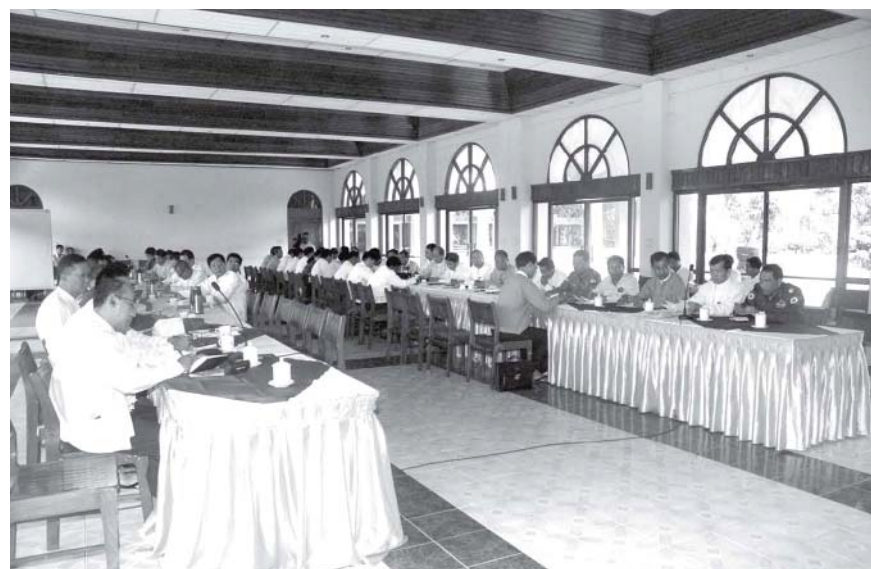
Lt-Gen Myint Swe of Ministry of Defence delivers speech at coordination meeting of management committee for industrial zones in Yangon Division.—MNA