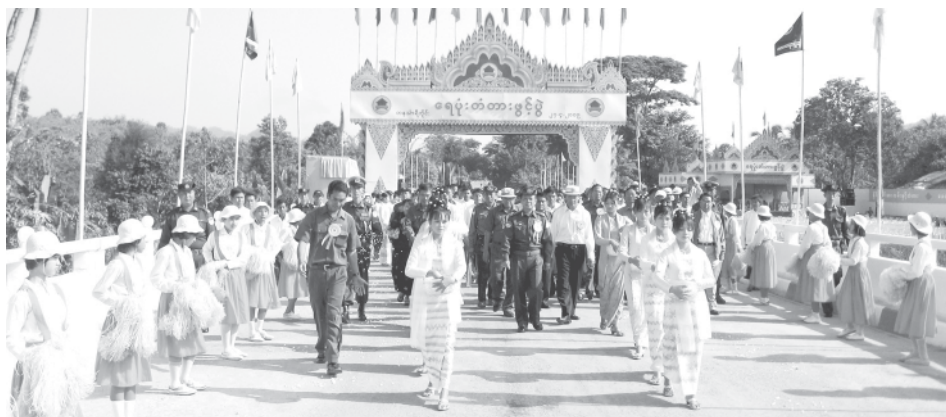
Commander Maj-Gen Khin Zaw Oo and party stroll along Yaypon bridge.—MNA