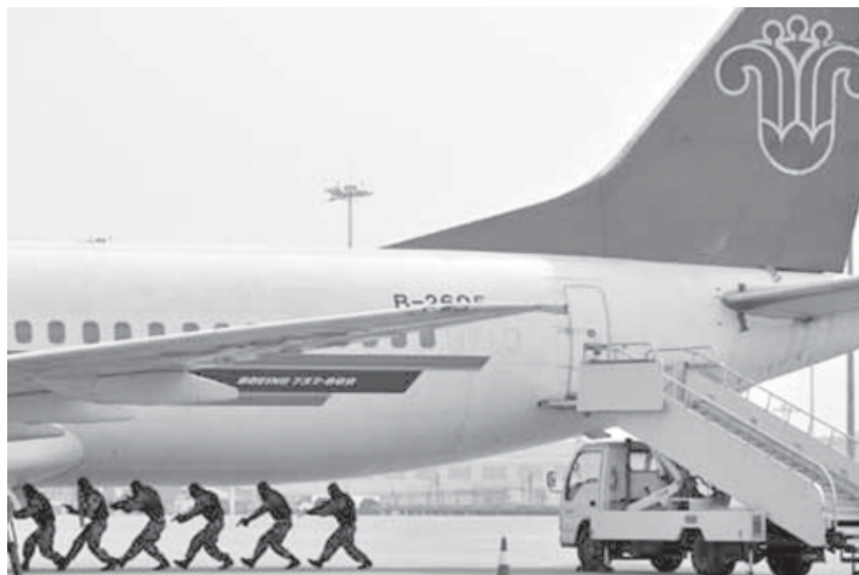
Soldiers sneak up onto the "hijacked" plane in the anti-hijacking exercise held at Tianhe Airport in Wuhan, capital of central China's Hubei Province, on 28 April, 2009.