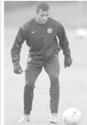
Manchester United and Portuguese winger's Nani

MANCHESTER, 29 April—Sir Alex Ferguson has insisted Nani has a future at Manchester United and attributed the Portuguese winger's lack of first-team opportunities this season to the form of Korean rival Park Ji-Sung.