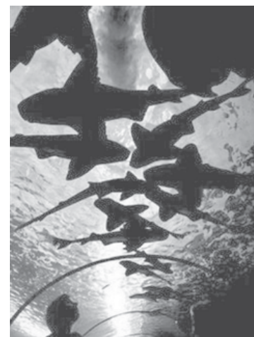
A tourist looks up through a glass tunnel at a group of Port Jackson sharks resting in the Sydney Aquarium.

"I walked over to McDonalds and borrowed a bucket off them and filled it