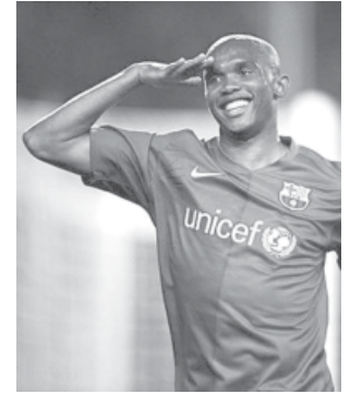
Barcelona's Cameroonian forward Samuel Eto'o celebrates after scoring during the Spanish League football match against Malaga at Camp Nou stadium in Barcelona, March 2009.