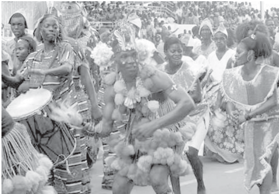
Togolese people with colourful clothes perform dancing as they pass the reviewing stand during a grand parade marking the 49th anniversary of the independence of Togo in Lome, capital of Togo, on 27 April, 2009.—XINHUA

PetroChina is the leading oil producer of China, with most crude oil it refined produced by the company itself, while Sinopec has over 70 percent of its crude oil imported.—Internet