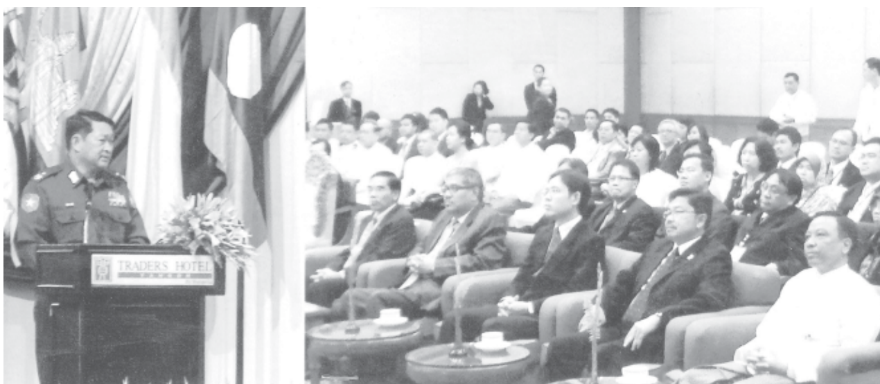
Minister Maj-Gen Soe Naing delivers an opening speech at ASEAN Tourism Task Forces Meetings.—H&T

YANGON, 29 April—ASEAN Tourism Task Forces Meetings were held here yesterday and Minister for Hotels and Tourism Maj-Gen Soe Naing delivered an opening address.