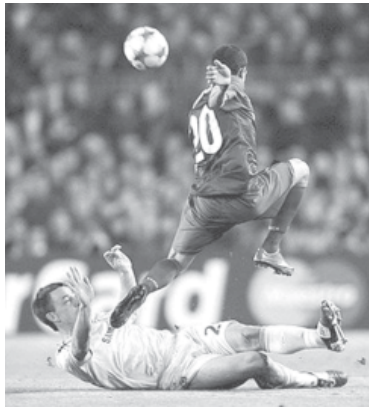
Chelsea's defender John Terry (bottom) slides in to challenge Barcelona's defender Daniel Alves during their Champions League semi-final, first-leg match at the Camp Nou stadium in Barcelona. The game ended 0-0.

BARCELONA, 29 April—Barcelona coach Pep Guardiola reacted angrily at what he saw as the referee's leniency towards English side Chelsea's physical approach in their 0-0 Champions League semi-final first leg match.