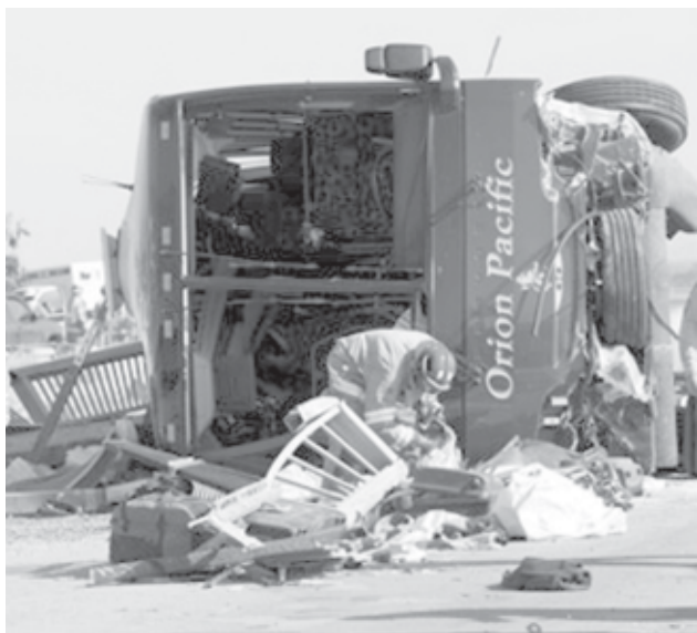
At least 10 people were killed and dozens more injured on Tuesday when a tour bus carrying French tourists crashed on a highway in California, hospital officials said.