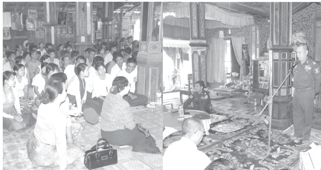
Minister Maj-Gen Thein Swe meets with local people in Gaelaung model village, An Township.—MNA

clothes, journals, magazines, LED fluorescent lamps and bio batteries to the villagers through officials concerned.—MNA