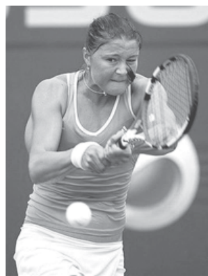
Dinara Safina of Russia

STUTTGART, 29 April—Russia's Dinara Safina celebrated her first match as world number one by needing just 51 minutes to blitz Italy's Sara Errani 6-0, 6-1 in the first round of Stuttgart's WTA tour-