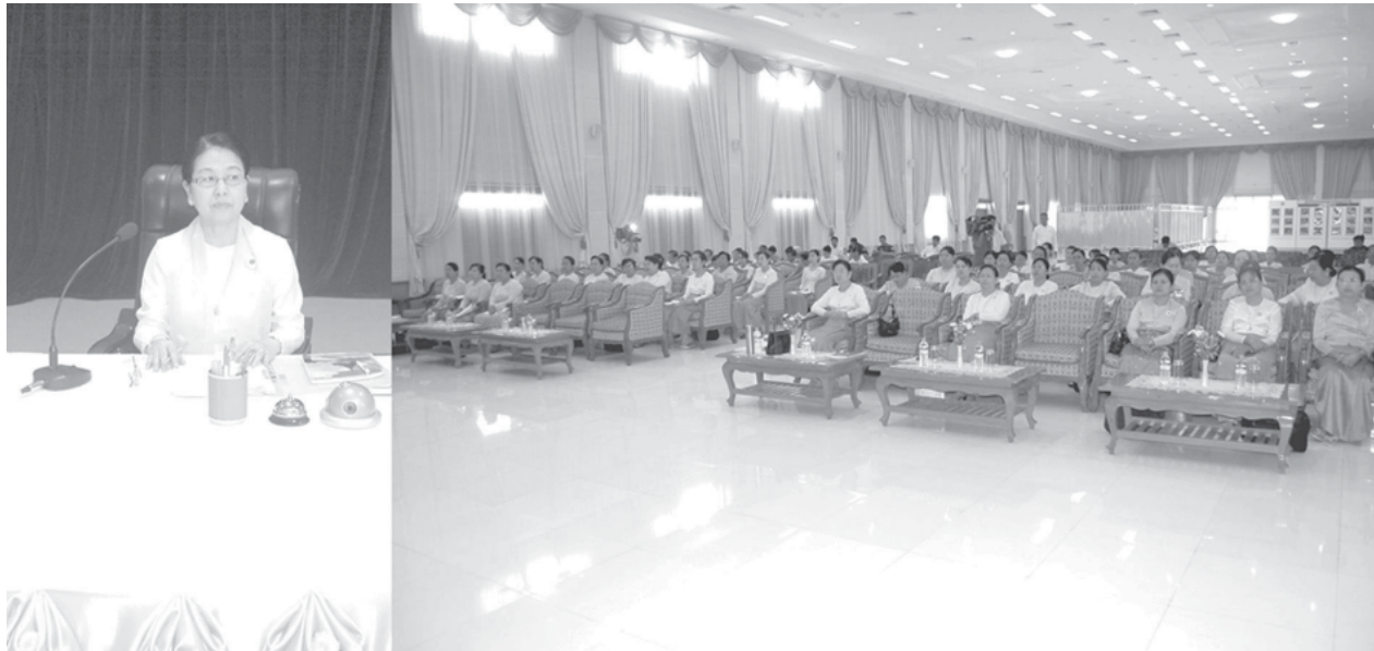
The 19th annual meeting of MMCWA continues for second day.