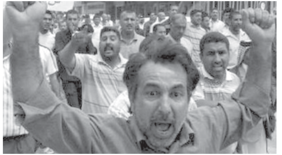
Residents chant slogans as they demonstrate in Kut, 150 km (95 miles) southeast of Baghdad, on 27 April, 2009. Hundreds of Iraqis protested against US forces on Sunday after US soldiers killed a policeman and a woman in an overnight raid that was condemned by the provincial governor.— INTERNET

An Australian National University poll on Wednesday found 53 percent support for Australian participation in the war.— Internet