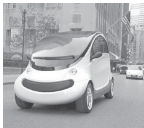
This photo released by Peapod Mobility shows the Peapod Neighbourhood Electric Vehicle. Designer Peter Arnell hopes the car that goes up to 25 miles per hour appeals to families who want another car for local trips.

The Indian leopard, a very famous member of the big cats family in the country, is now regarded as a threatened, if not endangered species by animal protection groups.