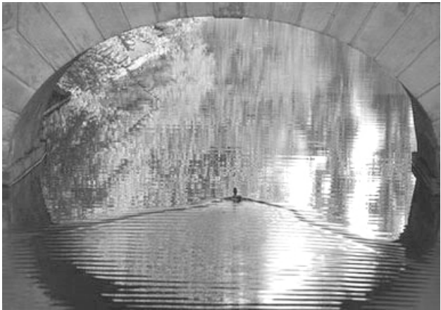
A duck passes under a bridge in Lazienki park in Warsaw, Poland on Tuesday, on 28 April 2009. INTERNET