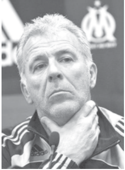
Marseille coach Eric Gerets

MARSEILLE, 29 April—Marseille coach Eric Gerets dropped a bombshell here on Tuesday as he told his title-leading players he would be quitting the club at the end of the season.