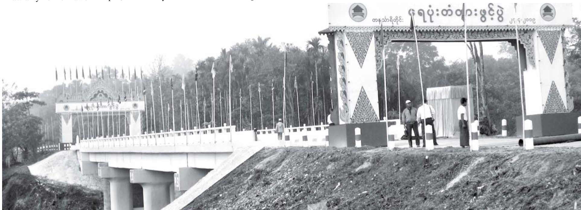
Yaypon Bridge on Yangon-Mawlamyine-ye-Dawei-Myeik-Kawthoung Road.—MNA

cial, members of social organizations, teachers and students, guests and local people.(See page 11)