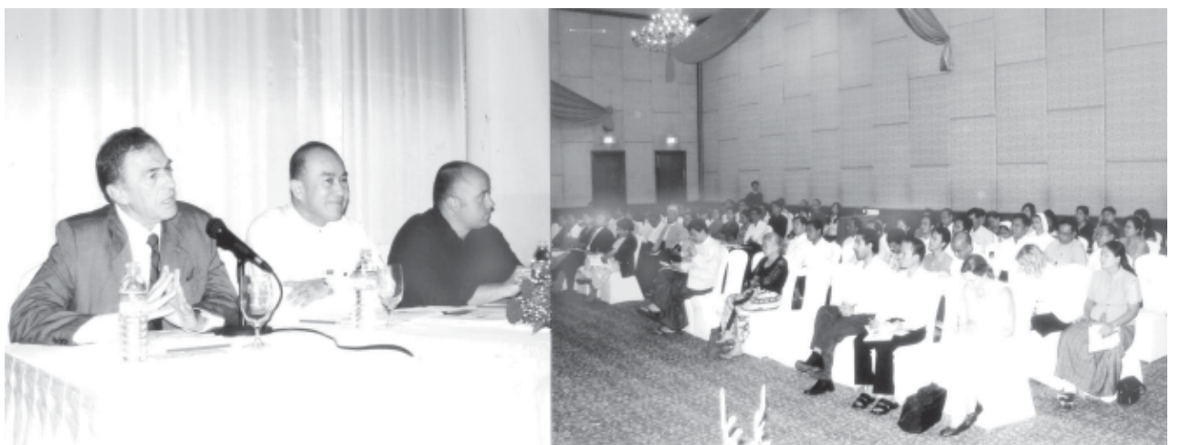
Discussion on Protecting Older People: Cyclone Nargis One Year On in Progress at Traders Hotel.

YANGON, 29 April—Discussion on Protecting Older People: Cyclone Nargis One Year On, organized by Help Age International, was held at the Ballroom of Traders Hotel here this morning.