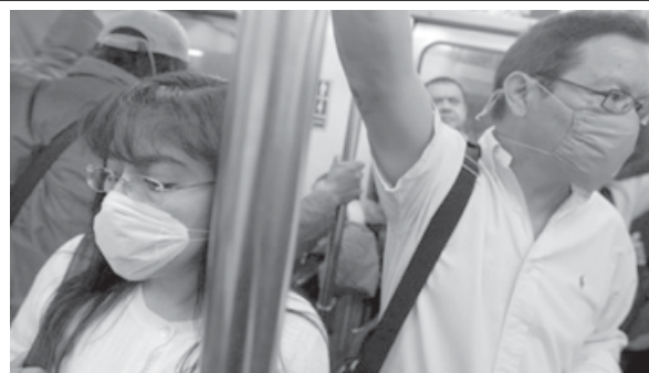
Passengers wear protective masks as they ride Mexico's city subway, on 28 April, 2009.

MEXICO CITY, 29 April— Three more people died in the last 24 hours of swine flu, Mexico City officials told a Tuesday press conference, adding that local authorities had ordered the closure of more public places. The total number of deaths in the city believed to be related to swine flu is now 25, while 89 people are in hospital with swine-flu symptoms, said Armando Ahued Ortega, head of the city's health department. He said that 31 people had been hospitalized on Monday while 14 had been discharged from hospital.—Xinhua