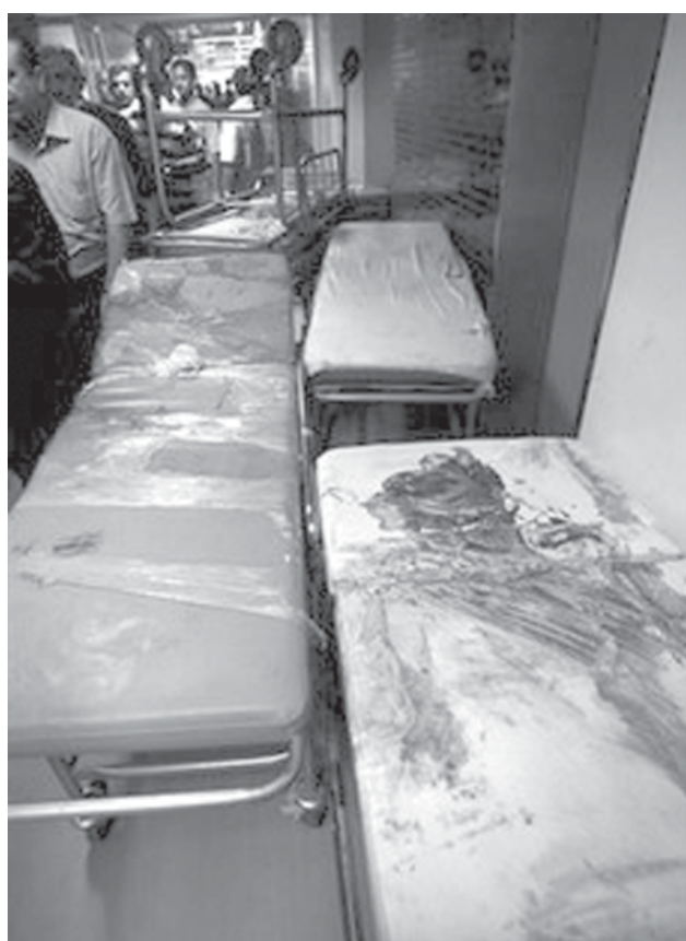
Blood-stained stretchers are seen after victims of a suicide bombing were brought into the Kazimiyah hospital in Baghdad, Iraq, on 24 April, 2009.

Dr. Richard Besser, acting director of the Centers for Disease Control and Prevention, said on Wednesday in an interview that the first American death of the disease was a 23-month-old child in Texas. He gave no other details about the child.