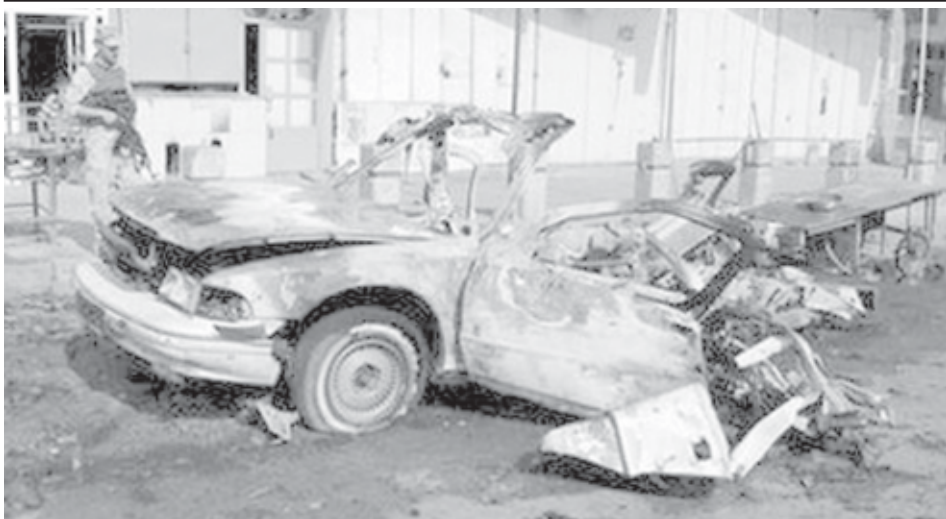
An Iraqi soldier inspects the wreckage of a vehicle used in a car bomb attack in Baghdad.