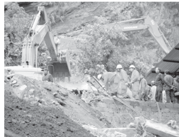
Rescuers work at the landslide site at Xiaoba Village of Weixin County, southwest China's Yunnan Province, on 27 April, 2009. At least seven people were killed and 15 others are missing in a landslide at the village on 26 April.