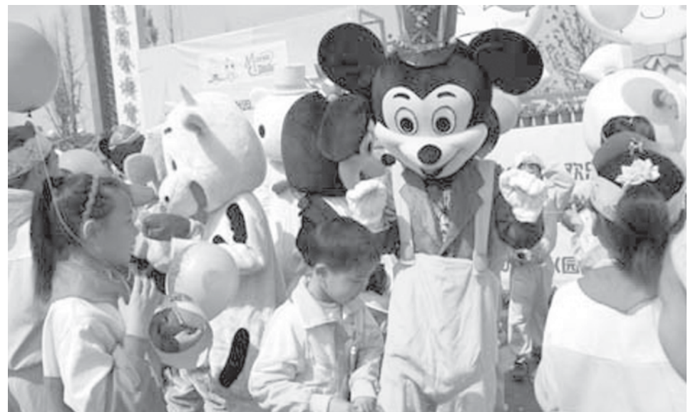
Cartoon star Mickey Mouse plays with children in a scenic spot of Nantong Horticulture Expo Park in Nantong, a city of east China's Jiangsu Province, on 27 April, 2009.

The meeting did not exclude the possibility that the epidemic could spread to China as "the situation in some countries is developing, more suspected cases have been found and the epidemic-stricken area is expanding."—Xinhua