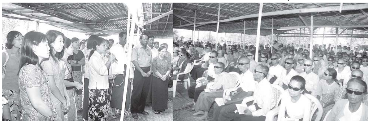
Eye specialists explain about dos and don'ts for eye patients who underwent operation.