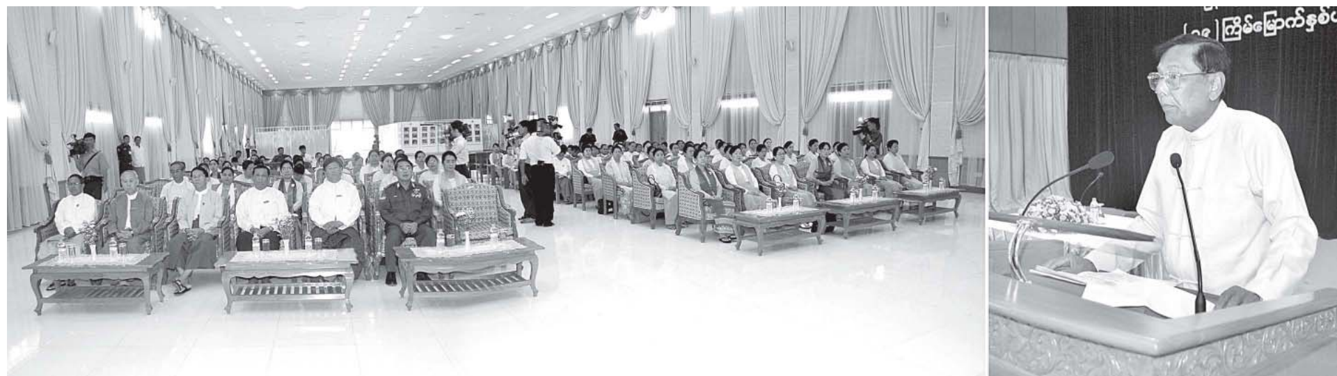
Deputy Minister for Health Dr Mya Oo makes a speech at the 19th annual meeting of Myanmar Maternal and Child Welfare Association.

With the united efforts of the government, the people and the Tatmadaw, the association will make all-out efforts to be effective in its aims and essence in cooperation with the people through national awareness