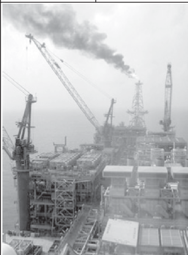
File photo shows one of Shell’s oil platforms off the Nigerian coast. 2009 is set to be a difficult year for the Anglo-Dutch firm in the west African nation, where not so long ago the oil giant was pumping one million barrels per day, the firm’s top official has warned.—INTERNET

GM, surviving on 15.4 billion dollars in US loans and seeking more, launched a very dilutive debt-for-stock exchange offer for 27 billion dollars of its unsecured bonds. If the swap is successful, bondholders will own about 10 percent of the company. If not, it will file for bankruptcy protection.—Internet