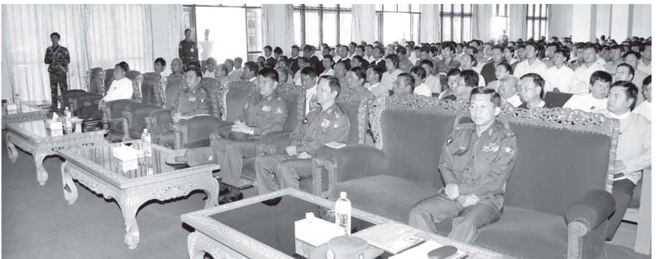
Prime Minister General Thein Sein delivers address at meeting with departmental officials, members of social organizations and local people in Kengtung.