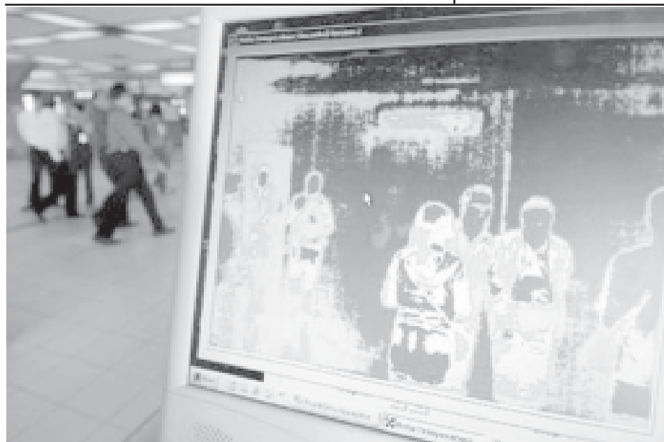
A thermal scanner is installed in the arrival terminal to check the temperature of arriving passengers at Ngurah Rai International Airport in Denpasar in Indonesia’s resort island of Bali on 27 April, 2009.