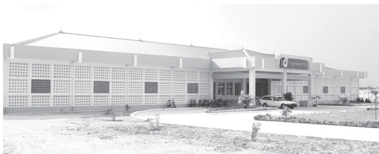
Photo shows Mittasanyay Clinic opened to hail the 19th Annual General Meeting of Myanmar Maternal and Child Welfare Association.