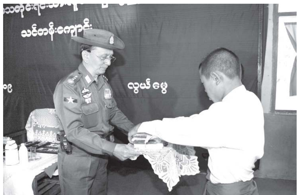
Prime Minister General Thein Sein presents school uniforms and exercise books to a student in Loimwe.—MNA