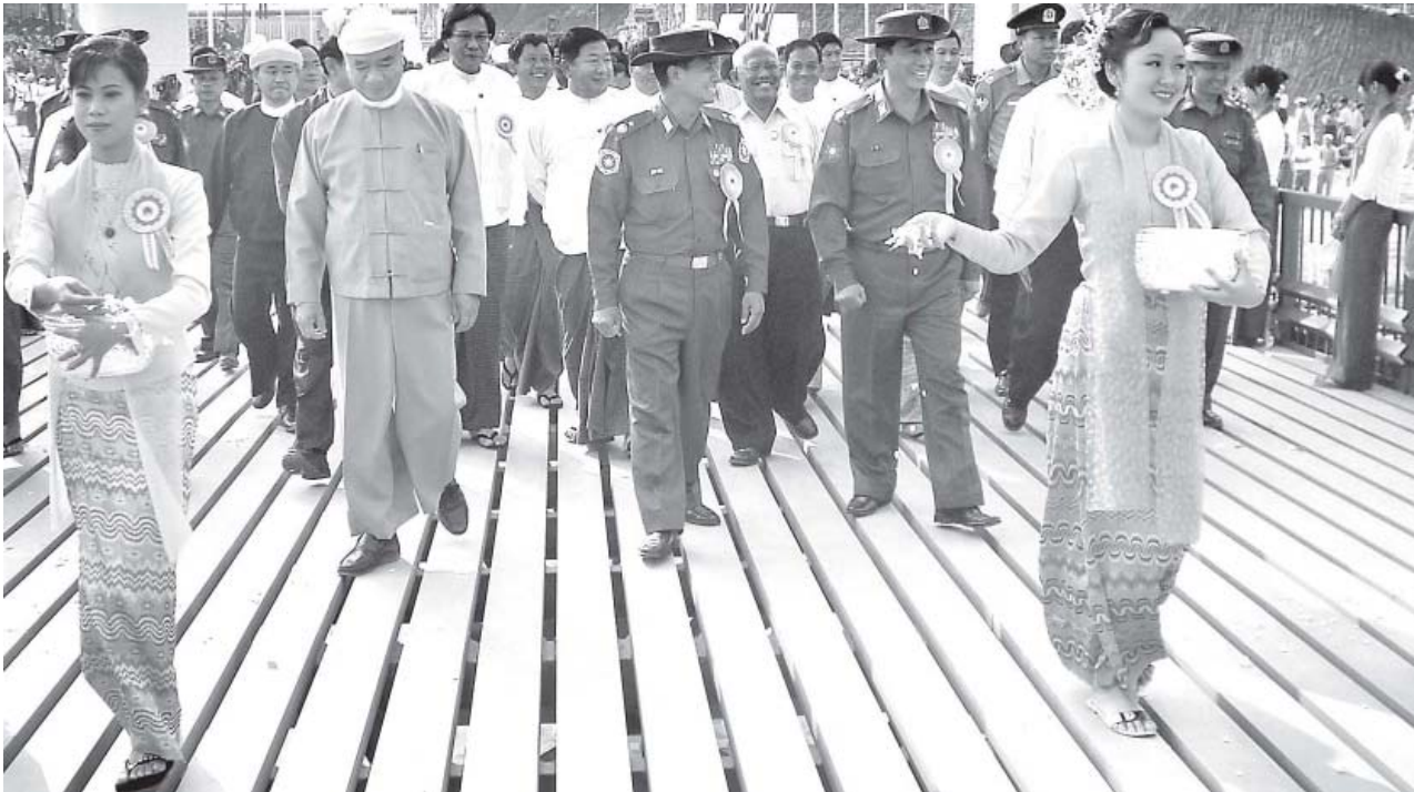
Minister Maj-Gen Khin Maung Myint strolls over Shweli Bridge (Namkham) after the inauguration of the bridge.—MNA

NAYPYITAW, 28 April —The opening of Shweli Bridge (Namkham) across Shweli River, built by Special Bridge Construction Unit (16) of Public Works under the Ministry of Construction, was held at the pavilion near the bridge at mile post No. (306/6) on Mandalay-Lashio-Muse-Namkham-Bahmo Road in Namkham Township, Shan State (North) yesterday morn-