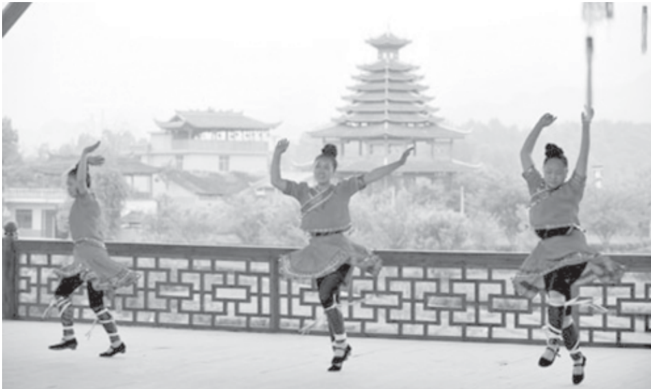
Amateur performers of China's Dong ethnic group dance for tourists in Enshi, central China's Hubei Province, on 26 April, 2009. A performing group founded by 53 local villagers in 2006 has become popular to tourists from at home and abroad.