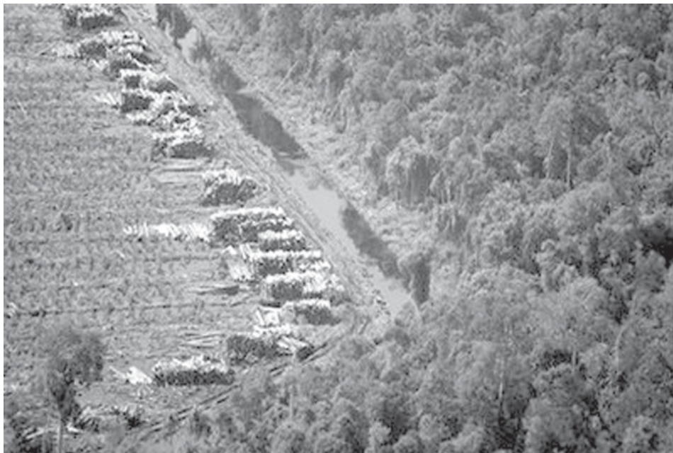
File photo shows acacia logs are seen collected before being transported as the natural forest is seen at right in Pangkalan Kerinci, Riau Province, on Sumatra island, Indonesia. Southeast Asia will be hit particularly hard by climate change, causing the region's agriculture-dependent economies to contract by as much as 6.7 percent annually by the end of the century, according to a study released on 27 April, 2009.