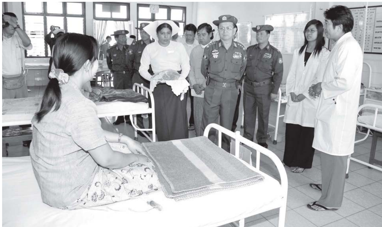
Prime Minister General Thein Sein comforts patients receiving treatment at Kengtung General Hospital.—MNA

Health staff to regard patients as their relatives when they give treatment to them and to disseminate knowledge on health including preventive measures against all forms of diseases to villages.