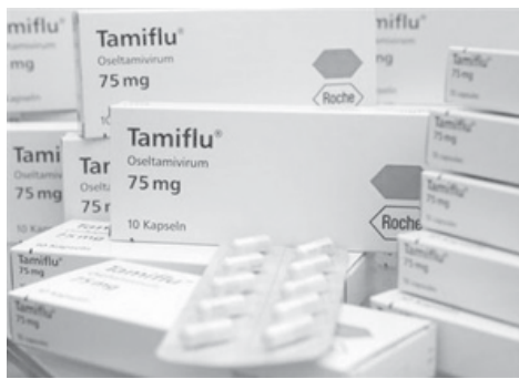
Flu drug Tamiflu is seen at a pharmacy in Zurich on 7 October, 2005.

Tamiflu, approved for treating and preventing the flu in people over a year old, can now be used in children under 1 year.