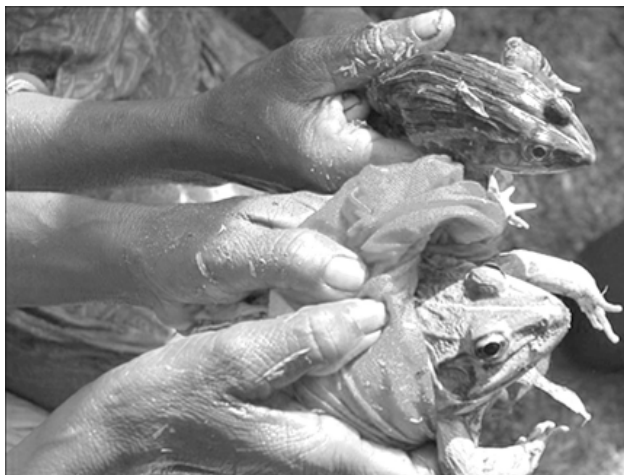
A frog marriage in Maghlipara village, Agartala, India, is part of an effort by villagers to appeal to the rain gods they believe in to usher in rain.—