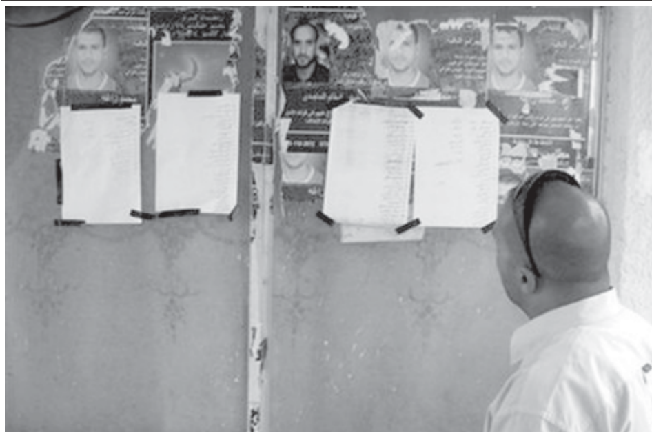
An Iraqi man looks at a list of injured people outside a hospital in Baghdad. Two suicide bombers struck near a major Shi'ite shrine in Baghdad, killing at least 58 people amid a brutal spike of attacks nine weeks before US troops are to withdraw from Iraqi cities.—INTERNET

It also added that troops during operation discovered a weapon cache containing six pieces of Kalashnikovs, anti-aircraft gun and thousands of bullets. Conflicts and violence have claimed the lives of over 5,000 in 2008 while Taliban militants whose regime toppled in late 2001 have vowed to intensify their activities against Afghan and international troops in the war-torn country in 2009.—Internet