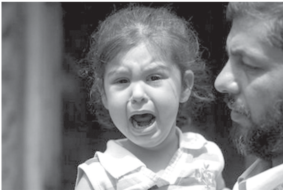
A girl whose mother was killed in a US military raid cries as she is consoled by a relative in front of her house in Kut, 160 kilometres (100 miles) south-east of Baghdad, Iraq, on 27 April, 2009.