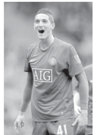
Manchester United's Italian forward Federico Macheda

It was for financial reasons that Macheda left Lazio to sign for United while just 16, but now