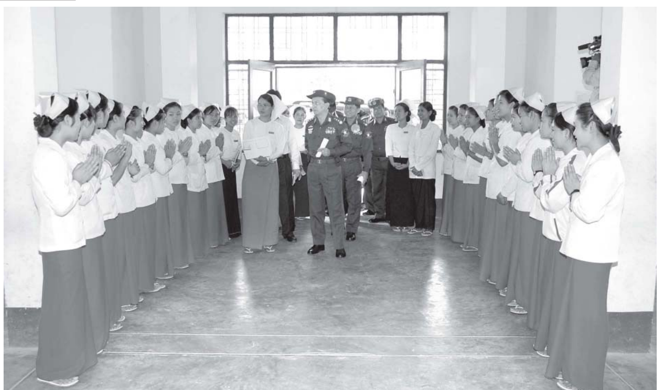
Prime Minister General Thein Sein greets trainees of Training School of Nursing in Kengtung.

The Prime Minister also went to the Loimwe Monastery and donated offertories to Sayadaw