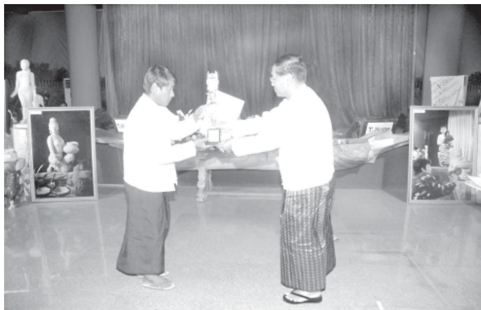
Lt-Gen Myint Swe awards winner of the sculpture, painting and photo contests to mark Post-Nargis Myanmar Arts and Crafts Show.

Lt-Gen Myint Swe together with Chairman of Yangon Division Peace and Development Council Commander of Yangon Command Brig-Gen Win Myint viewed Pyu, Bagan, Inwa, Pinya, Toungoo and Gonbaung eras Myanmar traditional sculptures and paintings, Chinese and