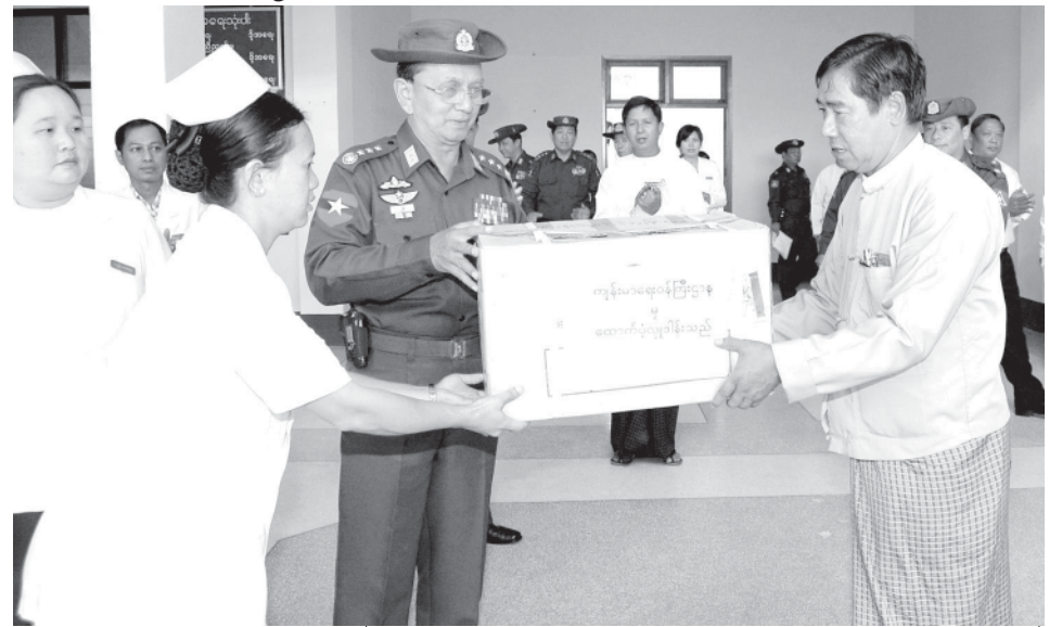
Prime Minister General Thein Sein presents medicines to Medical Superintendent of Kengtung General Hospital.—MNA

The Prime Minister and party arrived back Kengtung in the afternoon.—MNA