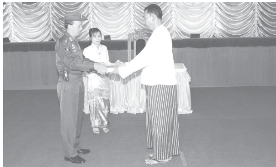
Prime Minister General Thein Sein presents uniforms to officials at town hall of Kengtung, Shan State (East).—MNA