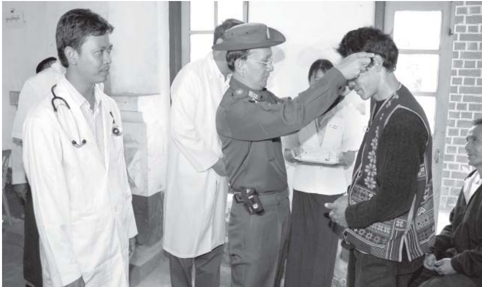
Prime Minister General Thein Sein puts spectacles on an eye patient in Loimwe.