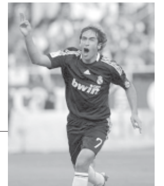
Real Madrid's Raul Gonzalez