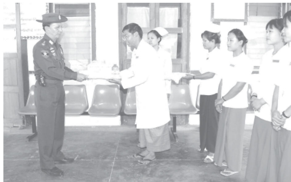
Prime Minister General Thein Sein donates medicines to the People's Hospital in Monghkat.