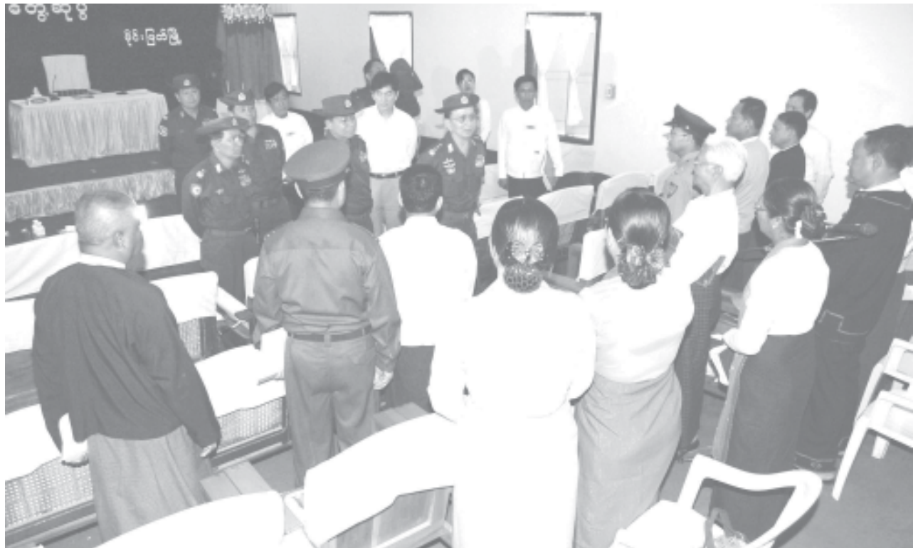
Prime Minister General Thein Sein meeting with departmental officials and local people in Mongphyat.