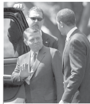
President Barack Obama and Jordan’s King Abdullah II, left, talk as the king leaves, after their meeting in the Oval Office of the White House in Washington.

“In the next 18 months, if we don’t move the proc-