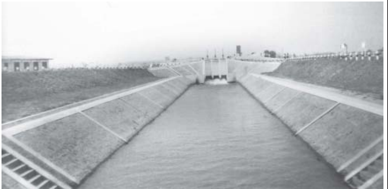
Water from Khabaung Diversion Weir flows out to right main canal.

Department said, "In the past, the local people had greeted each other asking the condition of soil and water since the two were very important for farm work. The farmers broadcast paddy seeds for cultivation of summer paddy. After that, they transplanted the paddy in row. Some farmers grew green gram at first, and after harvesting green gram, they cultivated summer paddy. Now, some are worried about supply of adequate water to the farmlands.