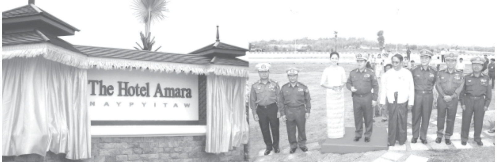
Commander Maj-Gen Wai Lwin unveils the signboard of The Hotel Amara (Nay Pyi Taw).