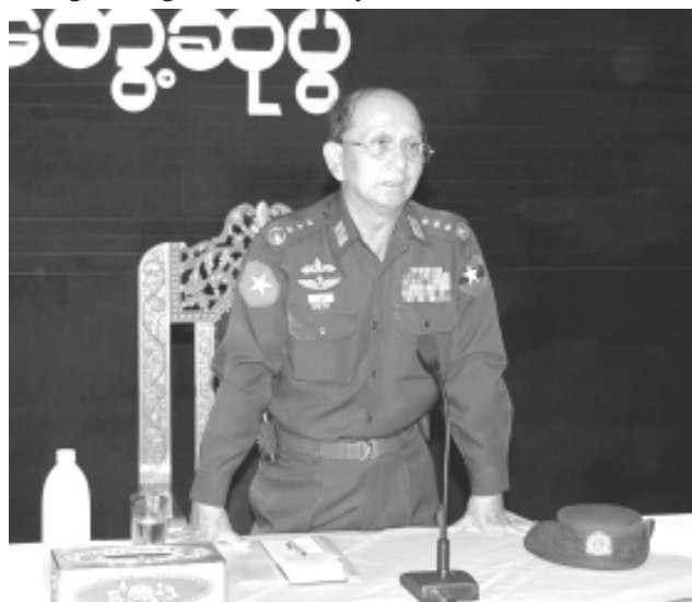
Prime Minister General Thein Sein delivers an address at meeting with departmental officials and local people in Monghkat.

NAY PYI TAW, 27 April—Prime Minister General Thein Sein, on his tour of Kengtung in Shan State (East), attended the opening ceremony of the runway of Kengtung airport on the morning of 25 April. Then, the Prime Minister, accompanied by Maj-Gen Min Aung Hlaing of the Ministry of Defence, Chairman of