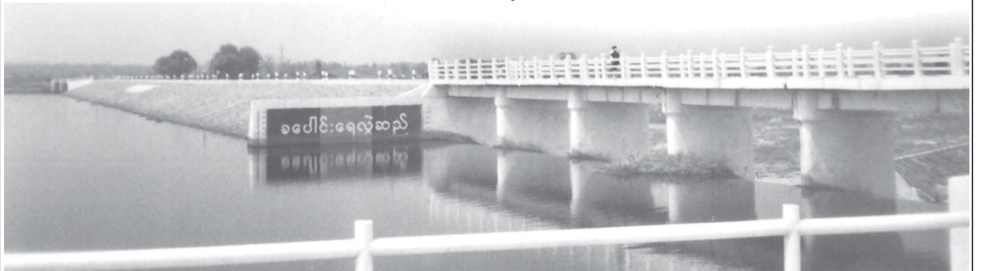
Khabaung Diversion Weir built in Ottwin Township to irrigate 10,000 acres of farmlands.