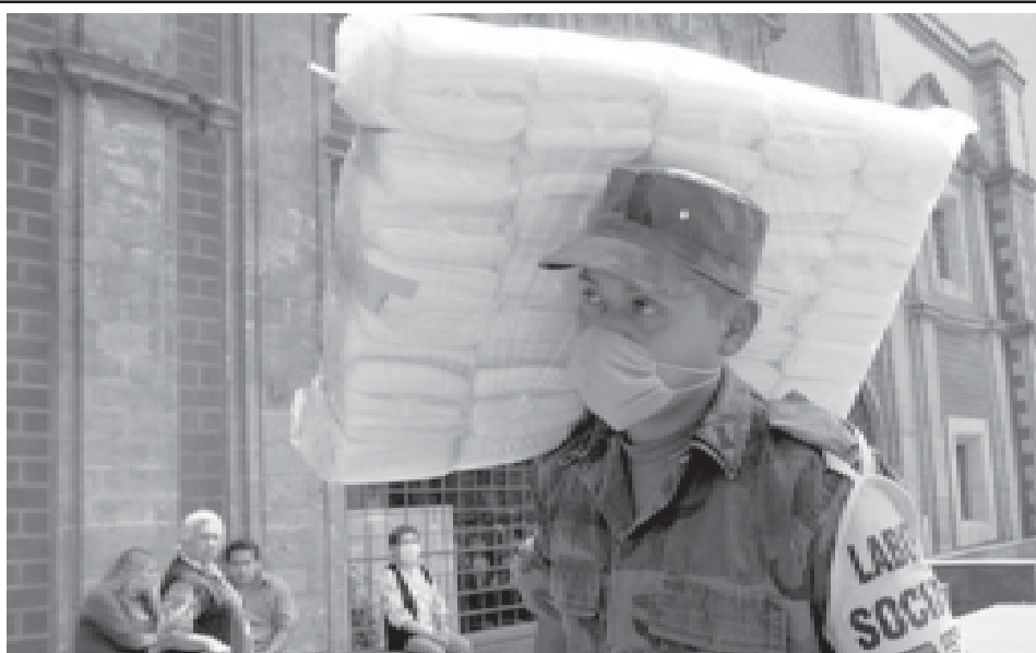
A Mexican soldier hands out masks in Mexico City, capital of Mexico, on 25 April, 2009. Mexican government has handed out 6 million masks for free to citizens of Mexico City since 23 April.—XINHUA