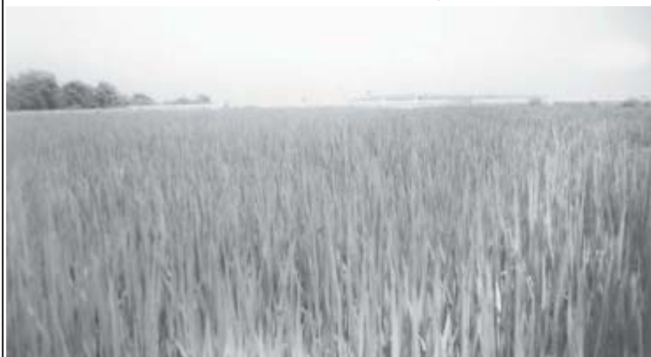
Photo shows thriving summer paddy plantation with the use of irrigation water of Khabaung Diversion Weir near Chin Village of Ottwin Township.

Khabaung Dam stores water at the full brim. Leaving doubt of water supply, they should grow green gram in time after harvesting monsoon paddy and they have to continue growing summer paddy. So, the local farmers will have to enjoy fruits of undertaking triple cropping fully."