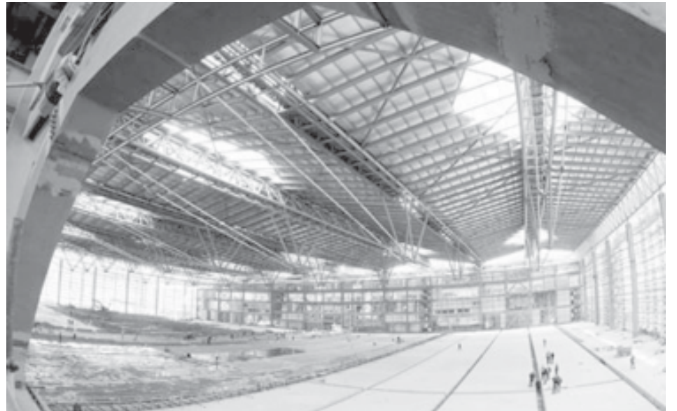
Construction workers get along with the interior decoration inside the west exhibition hall of the Theme Pavilion for the Shanghai 2010 World Expo, in Shanghai, east China, on 26 April, 2009. The west exhibition hall of the Theme Pavilion for the Shanghai 2010 World Expo, extending to 180 meters from north to south and 126 meters from east to west, is noted for a distinguished architectural structure free of pillars, the largest of its kind in China.