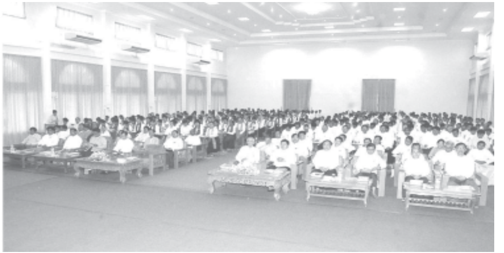
Minister for Education Dr Chan Nyein addresses the basic education school management refresher course No. 1/2009.

NAY PYI TAW, 27 April — Basic education school management refresher course No 1/2009 sponsored by the Ministry of Education was opened here this morning, with an opening address