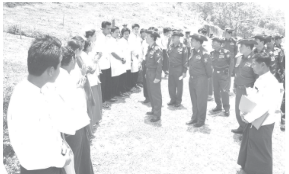
Prime Minister General Thein Sein meeting with departmental officials, teachers, students and local people in Metmang.

and security in the region. He also briefed on implementation of the special development project and rural area development project of the Tatmadaw Government as part of efforts for narrowing development gaps and equitable