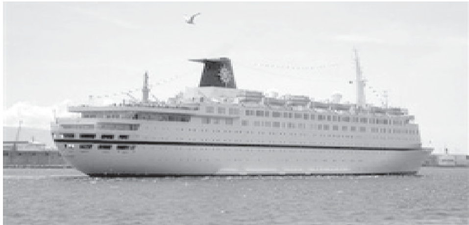
This image shows the Italian cruise ship Msc Melody. The commander of an Italian cruise ship says his crew successfully fended off an attack by pirates off Somalia, returning fire when the pirates attacked. Cmdr. Pinto tells Italian state radio that he ordered his security forces to return fire when six men in a small white boat opened fire on the Msc Melody on Saturday night on 25 April, 2009.