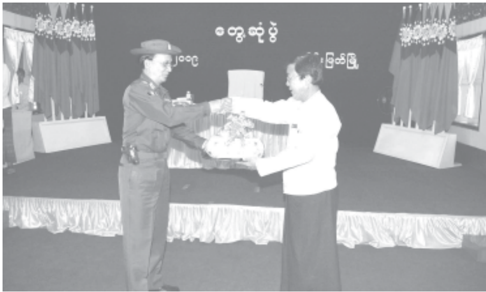
Prime Minister General Thein Sein hands over sports gear to an official in Mongphyat.—MNA

Later, the Prime Minister and party left Mongphyat by car along Mongphyat-Kengtung road and arrived back in Kengtung. — MNA