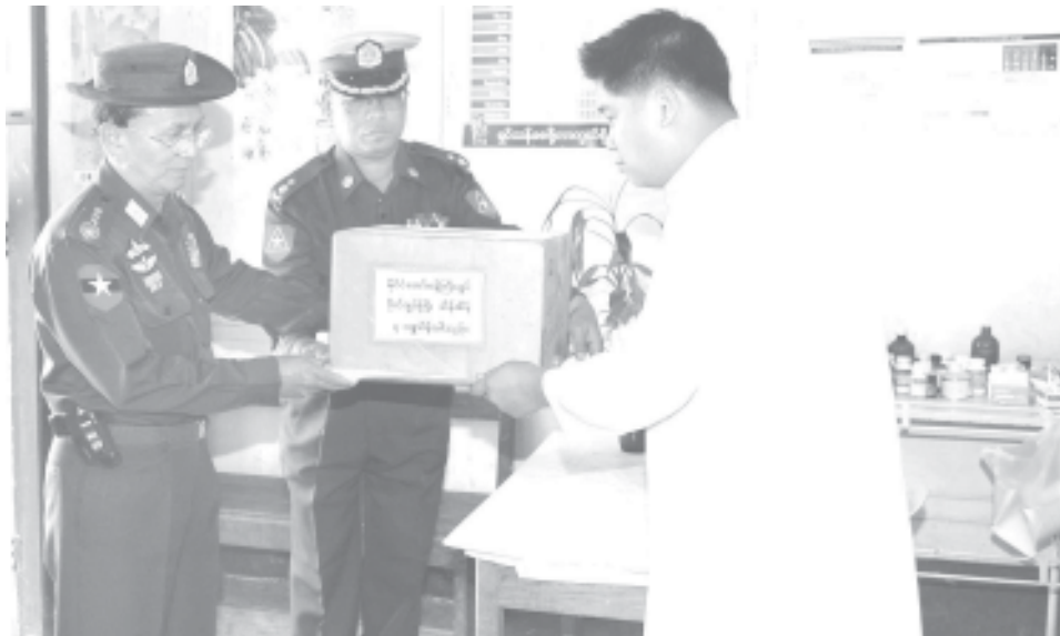
Prime Minister General Thein Sein donates medicines to People's Hospital in Metmang.—MNA

Minister and party were welcomed by Monghkat Township Peace and Development Council Chairman U Nyein Htwe,