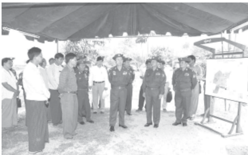
Prime Minister General Thein Sein visits farm in Kathpa Village-tract in Kengtung Township.

The Chairman of District PDC reported on education, health, transport and regional development. The Prime Minister fulfilled the requirements. In his address the Prime Minister said that he and the ministers and high-ranking officials were there to fulfill the requirements for development of townships in Shan State (East). He said relations, security and trade are im-