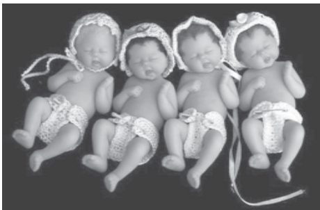
These little arrivals are so lifelike and appealing that they have captured hearts around the world.

The babies, from just over an inch to 4in high, are the work of artist Camille Allen, who sculpts them from polymer