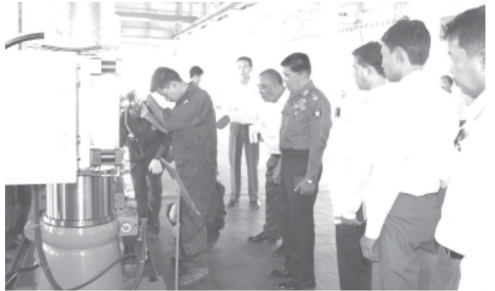
Minister Vice-Admiral Soe Thein inspects production process of machines at the machine tool factory in Myaing.—MNA

The minister went to the Industrial Training