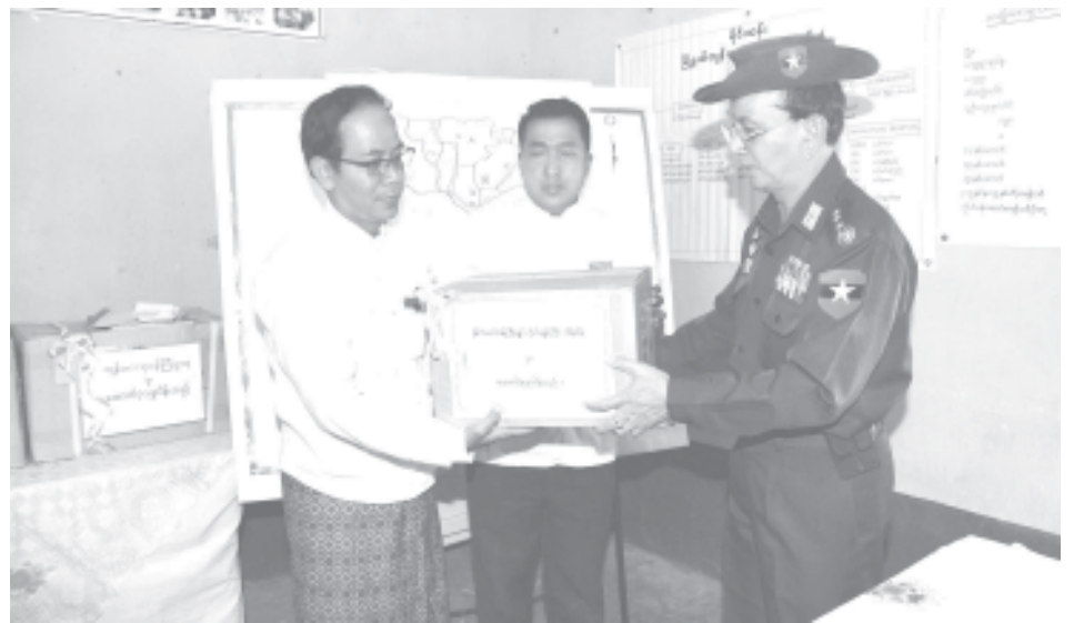
Prime Minister General Thein Sein donates medicines to People's Hospital in Mongyan.—MNA

Prime Minister met with local people in Monghkat at the townhall.