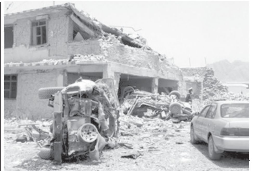
The site of a suicide attack in Kandahar in June 2008. Three suicide bombers detonated at the gates of a government compound in southern Afghanistan on Saturday, killing five policemen, an official said.