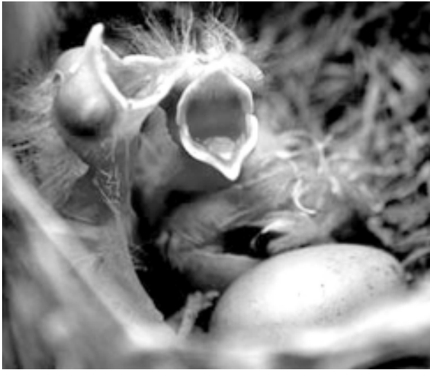
A nest of baby robins begins to hatch in a nest in a bush by the White House Press Room at the White House in Washington, on 23 April, 2009.