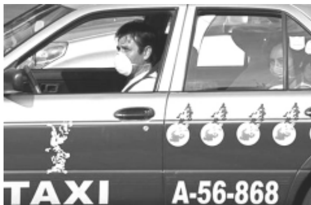
A taxi driver and his costumer wear surgical masks in Mexico City, Sunday, April 26, 2009. A fatal strain of swine flu has been detected in Mexico and experts fear it could become a global epidemic.