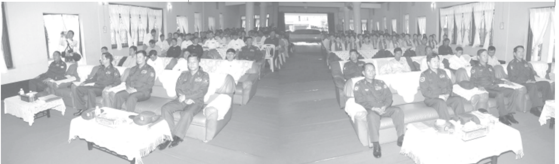
Prime Minister General Thein Sein delivers address at meeting with departmental officials, members of social organizations and local people in Tachilek.—MNA

Tachilek-Mongphyat-Kengtung road and inspected development of the villages and conditions of roads. On arrival at Mongphyat, the Prime Minister and party were welcomed by District Peace and Development Council U Soe Lin and officials. At Bayintnaung Hall, the Prime Minister met with departmental