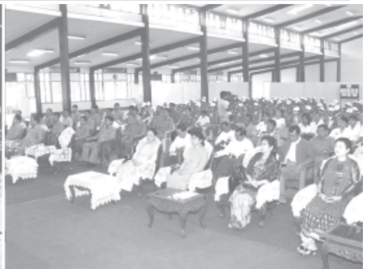
Minister Brig-Gen Thura Aye Myint delivers an address at opening of refresher course No. 15 for coaches of Ministry of Education.—MNA

YANGON, 27 April—Refresher course No.15 for sports coaches of Ministry of Education was opened at Sports and