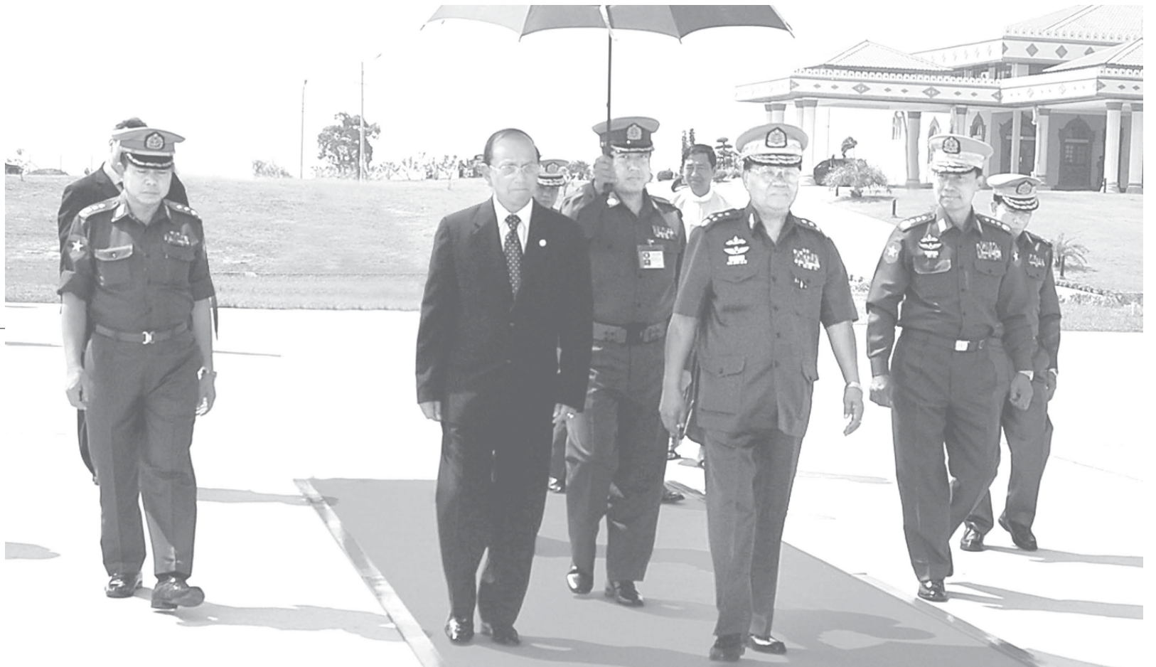
Senior General Than Shwe sees off Prime Minister General Thein Sein on PM's departure for Thailand at Nay Pyi Taw Airport.