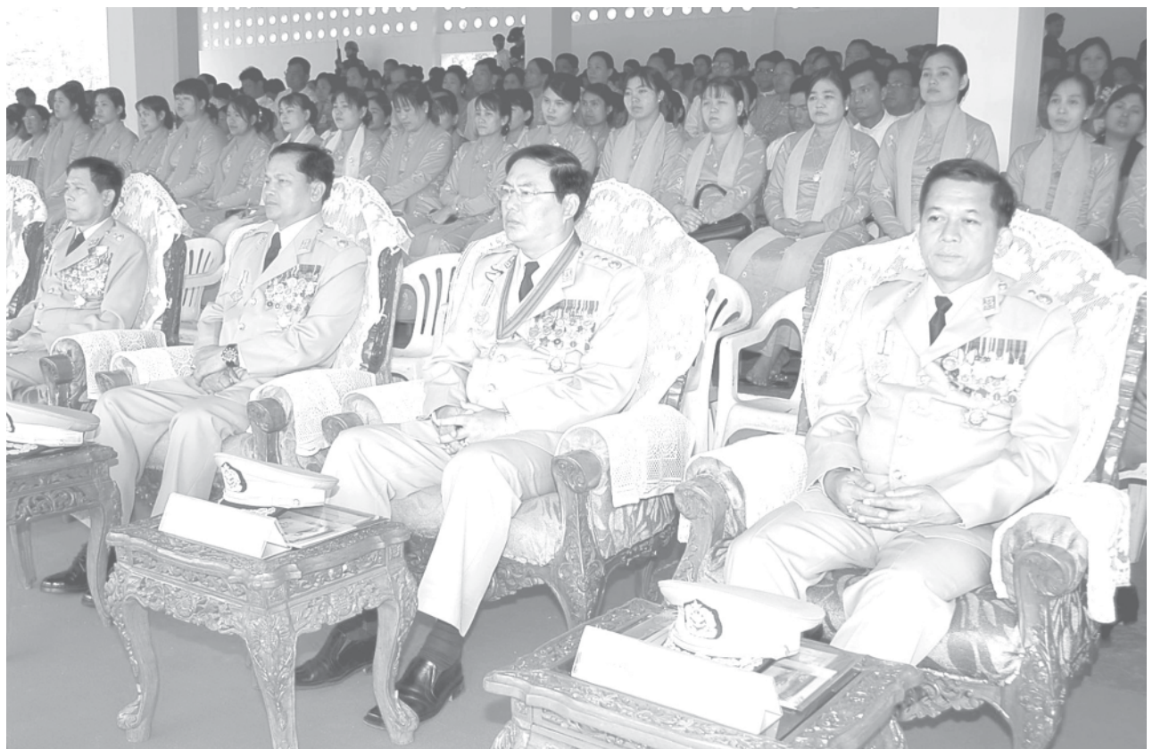
Dignitaries seen at graduation parade of 112th Intake of OTS.

Some countries faced instability following electoral violence due to the fact that political parties attacked one another in canvassing for votes in the electoral period because the democratic practice had not been mature enough in the countries concerned.