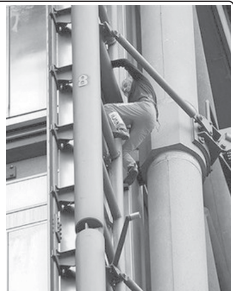
French climber Alain Robert, also known as ‘Spiderman’ scales the outside of the Lloyds Insurance building in central London in a protest about climate change.

“A man has been arrested for aggravated trespass at the Lloyd’s Building,” a Scotland Yard spokesman said.