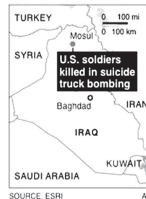
Map locates Mosul, Iraq, where a suicide truck bomb killed US soldiers and Iraqi policemen

Interior Ministry official who spoke on condition of anonymity, at least 20 Iraqi policemen were injured in the bombing.