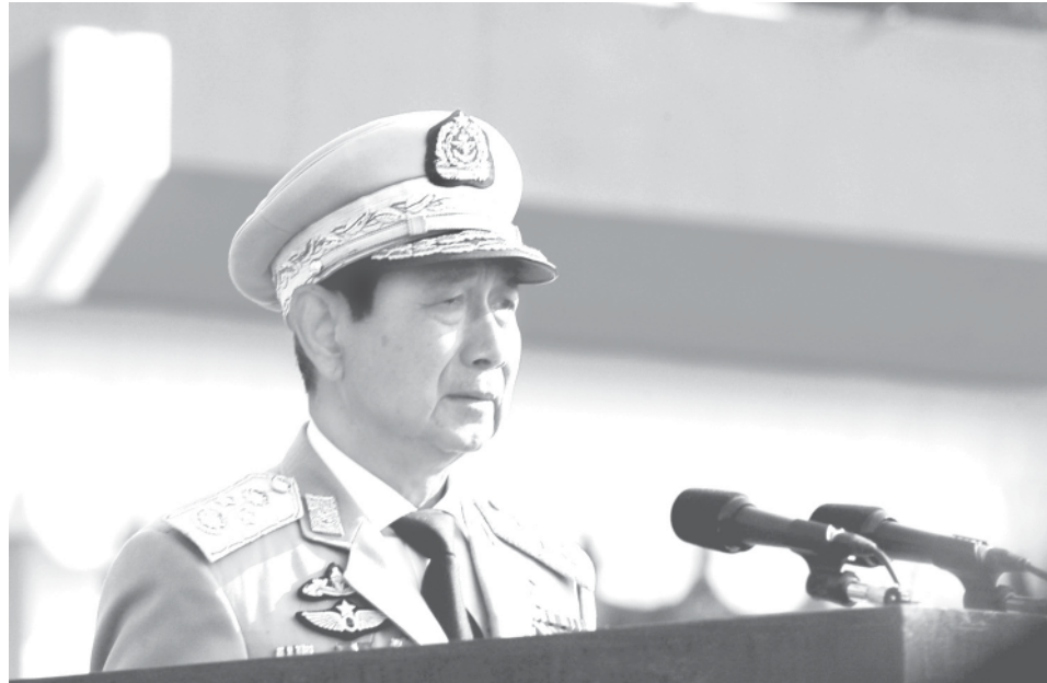
Deputy Commander-in-Chief of Defence Services Commander-in-Chief (Army) Vice-Senior General Maung Aye delivers an address at graduation parade of 112th Intake of OTS.

of Defence Services (Army) Officers Training School, I will discuss some points you should