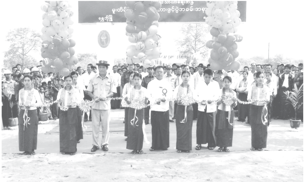
Commander Maj-Gen Myint Soe and PBANRDA Deputy Minister Col Tin Ngwe attend opening of Mu Tain creek bridge.—MNA

The deputy minister inspected upgrading of Wetlat-Ingyinpin-Sheinmaga gravel road, which is two miles long and twelve feet wide. It is being built with the financial assistance of the State and can contribute to the smooth transport of locals from 18 villages.—MNA