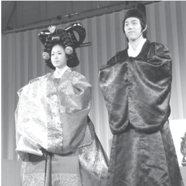
Representatives of South Korea perform a traditional South Korean wedding during the 2009 Asian Traditional Wedding Show in Shizuoka, Japan, on 10 April, 2009. The show was opened here on Friday with representatives from eight Asian countries including China, Japan, India, South Korea and Indonesia.