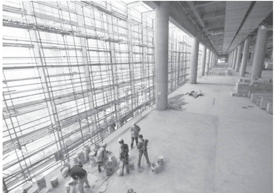
Workers are busy with construction project at the Passenger Hall of the Terminal No 2, of the Hongqiao Airport, in Shanghai, east China, on 8 April, 2009.