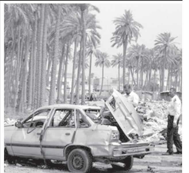
The site of a car bomb attack in a Shiite district of Baghdad just hours before a surprise visit by Barack.