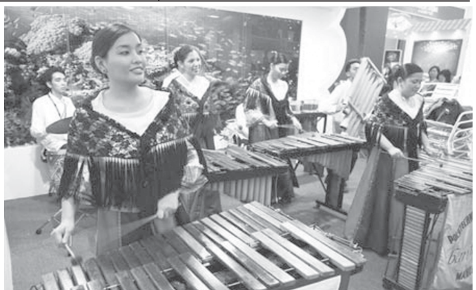
Girls perform traditional percussion instruments at the Philippines stand during the World Travel Fair 2009 in Shanghai, east China, on 9 April, 2009. The fair, opening on Thursday at the Shanghai New International Expo Center, attracted more than 450 exhibitors from over 50 countries and regions.—XINHUA

Monthly production of the Boeing 777 will decline from 7 to 5 airplanes per month beginning in June 2010. Boeing will also delay previous plans to modestly increase Boeing 747-8 and 767 productions. No change is being made at this time to the 737 production rate. In addition, the weak global economy has contributed to significant declines in the escalation indices that affect forecasted pricing for commercial airplanes already ordered. The production decisions and unfavorable price escalation are expected to reduce Boeing's first-quarter net earnings by approximately 38 cents per share. Because the 747 programme is currently in a loss position, the reduced earnings associated with the factors above will be recorded for most units in the 747 backlog. That impact, somewhat offset by a refinement in cost estimates, accounts for approximately 31 cents per share of the first-quarter charge.— Xinhua