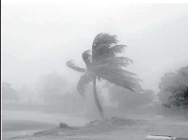
A palm tree is hit by winds near the beach in La Ceiba, Honduras as Hurricane Felix approaches in 2007. Six hurricanes are expected to churn through the Atlantic this year, a Colorado State University forecast team said Tuesday as it lowered its estimates for the upcoming storm season.

A 13th person was hospitalized in Howard County after a tree was toppled onto a house.