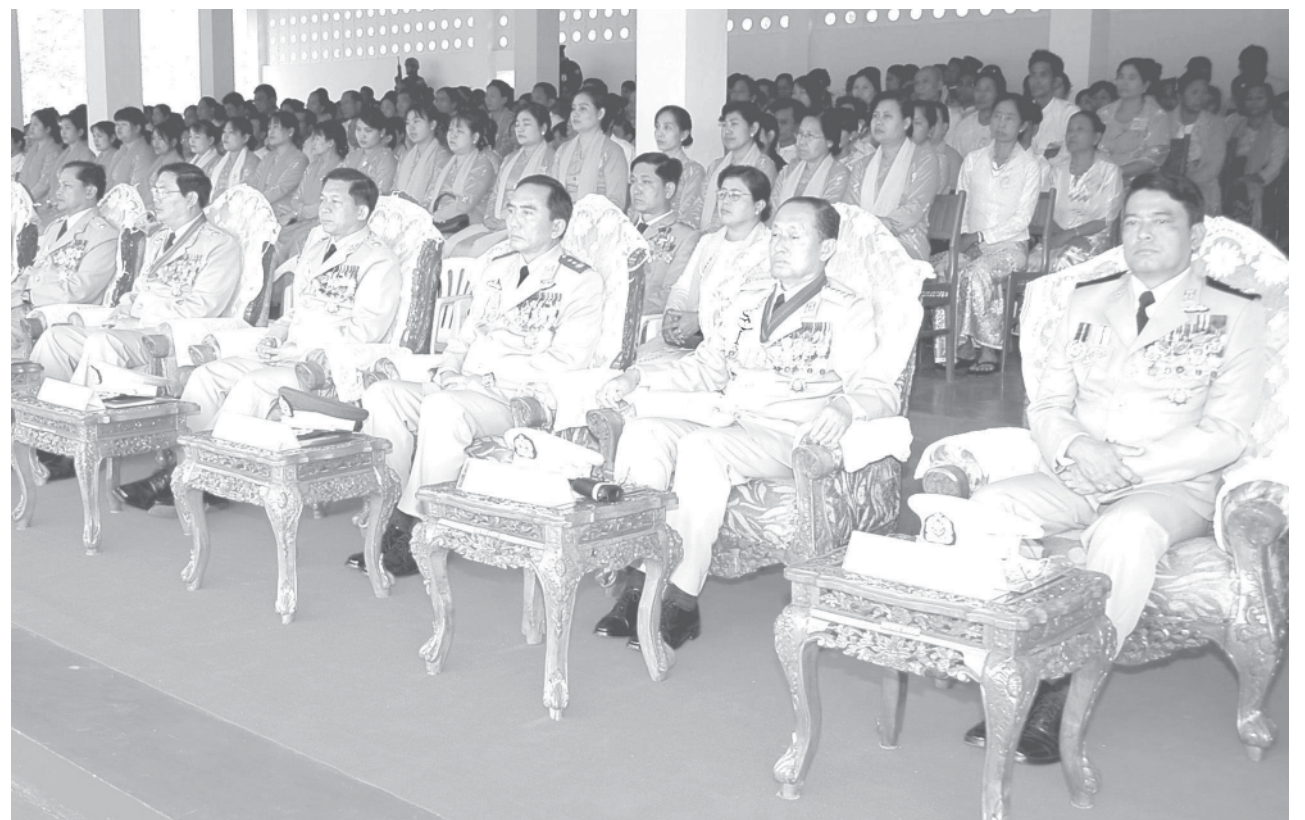
Dignitaries seen at graduation parade of 112th Intake of OTS.—MNA

Later, Vice-Senior General Maung Aye left the parade ground.—MNA