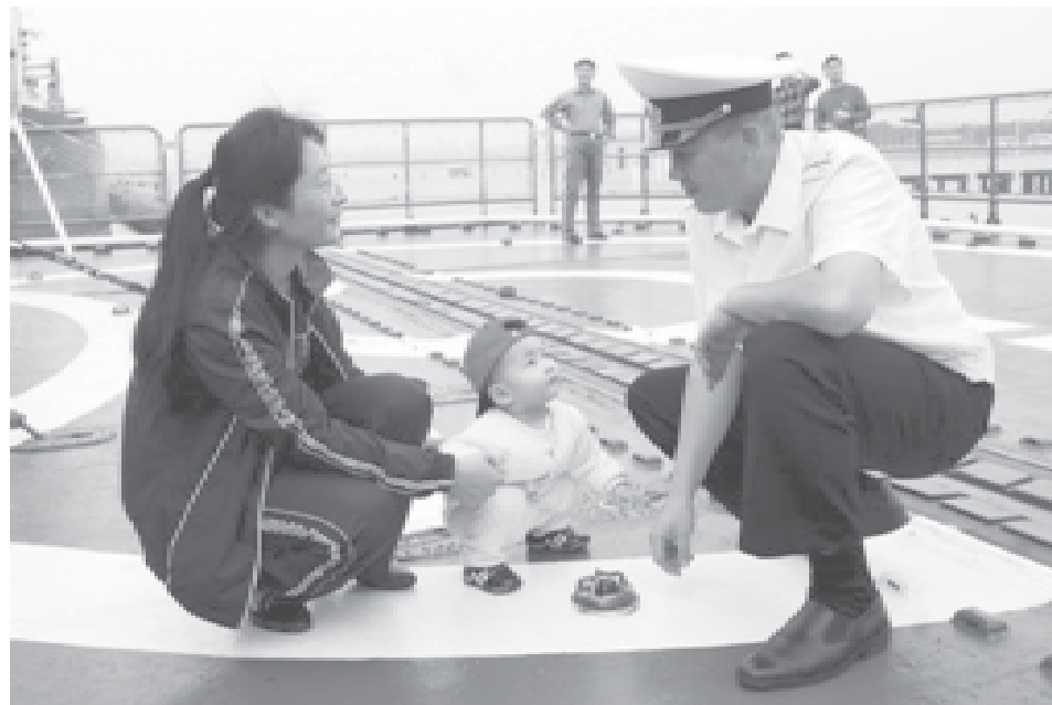
Zhanjiang citizens look around on the visiting Admiral Vinogradov submarine chaser of Russian navy in Zhanjiang, south China’s Guangdong Province, on 9 April, 2009. Several hundreds of local Chinese paid a visit to the Admiral Vinogradov submarine chaser that opened to public here Thursday. The warship and the Boris Butoma tanker is on a five-day visit in Zhanjiang since 6 April, 2009.—XINHUA

global temperature increases with different cuts in greenhouse gas emissions. It said that a cut by rich countries of 25-40 percent below 1990 levels by 2020, and substantial action by developing nations, could limit temperature rises to about 2 degrees Celsius (3.6 Fahrenheit), viewed by some governments as a threshold for dangerous change.— Internet