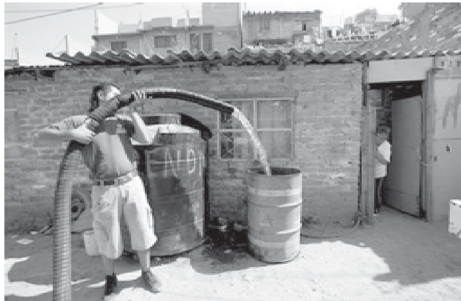
A resident looks on while a city worker delivers her weekly water ration in containers at a low-income neighbourhood in Mexico City, on 9 April, 2009. The Mexican capital, one of the most densely populated cities in the world, cut in water supply to a historic fall in reserves, a measure that affects at least five million people, according to authorities.