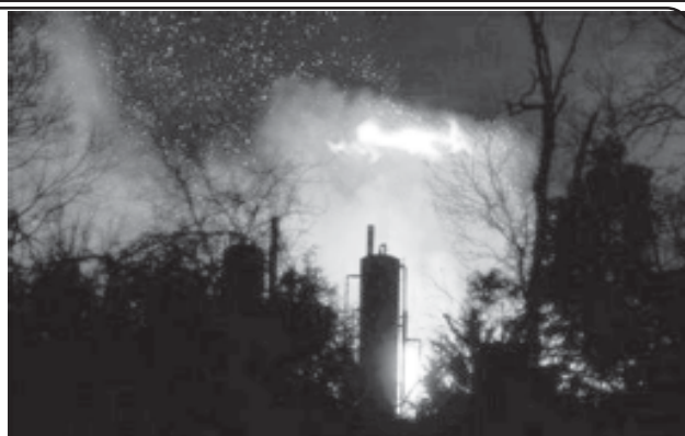
Flames illuminate a storage tank as a grass fire moves through Choctaw, Okla, on 9 April, 2009.