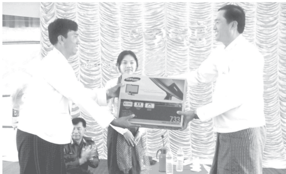
Deputy Minister U Maung Myint presents cash assistance, computers and TV sets for development of Mingin Township to a responsible person.—MNA