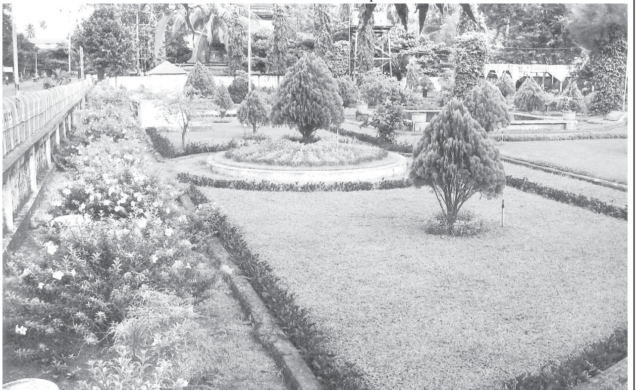
Colourful flowery plants thriving in Kyaikto Township Park.

Moreover, the township has opened one township hospital, one 24-