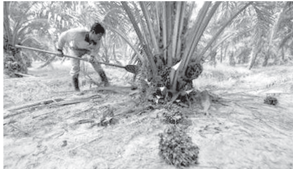
A worker collects oil palm fruits at a plantation in Sepang, outside Kuala Lumpur on 10 April, 2009. Malaysian crude palm oil stocks in March fell 12.89 percent to its lowest in 20 months at 1,363,657 tonnes from a revised 1,565,532 tonnes in February, official crop agency Malaysian Palm Oil Board said on Friday.