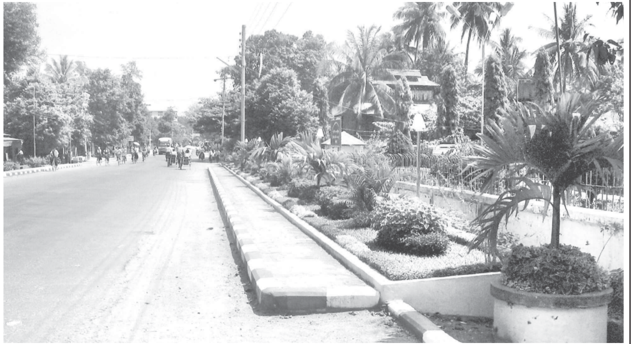
Bogyoke Street in Kyaikto being decorated with landscapes.

The town, gateway to Mon State is being decorated with landscapes, island areas and mobile flower boxes. The town has colourful pavements and straight detours in line with the