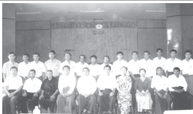
MPMEEA Chairman and executives, instructors and trainees pose for a documentary photo at the opening ceremony of Applied Pharmaceuticals Management Course No.1.