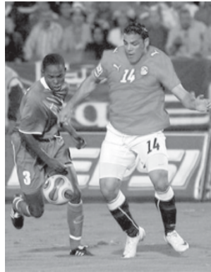
Egypt's Amr Zaki (right) is set for showdown talks with Wigan manager Steve Bruce after returning late from international duty for the fifth time this season.

Zaki, 26, insists he sustained a hamstring injury with Egypt but that is un-