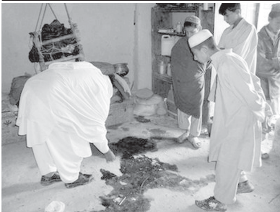
Afghans look at bloodstains following a raid by US coalition troops in Khost Province, east of Kabul, Afghanistan on 9 April, 2009. The raid by US coalition troops in the eastern Province killed four people, including two alleged female militants, and wounded another woman, the coalition said in a statement on Thursday.