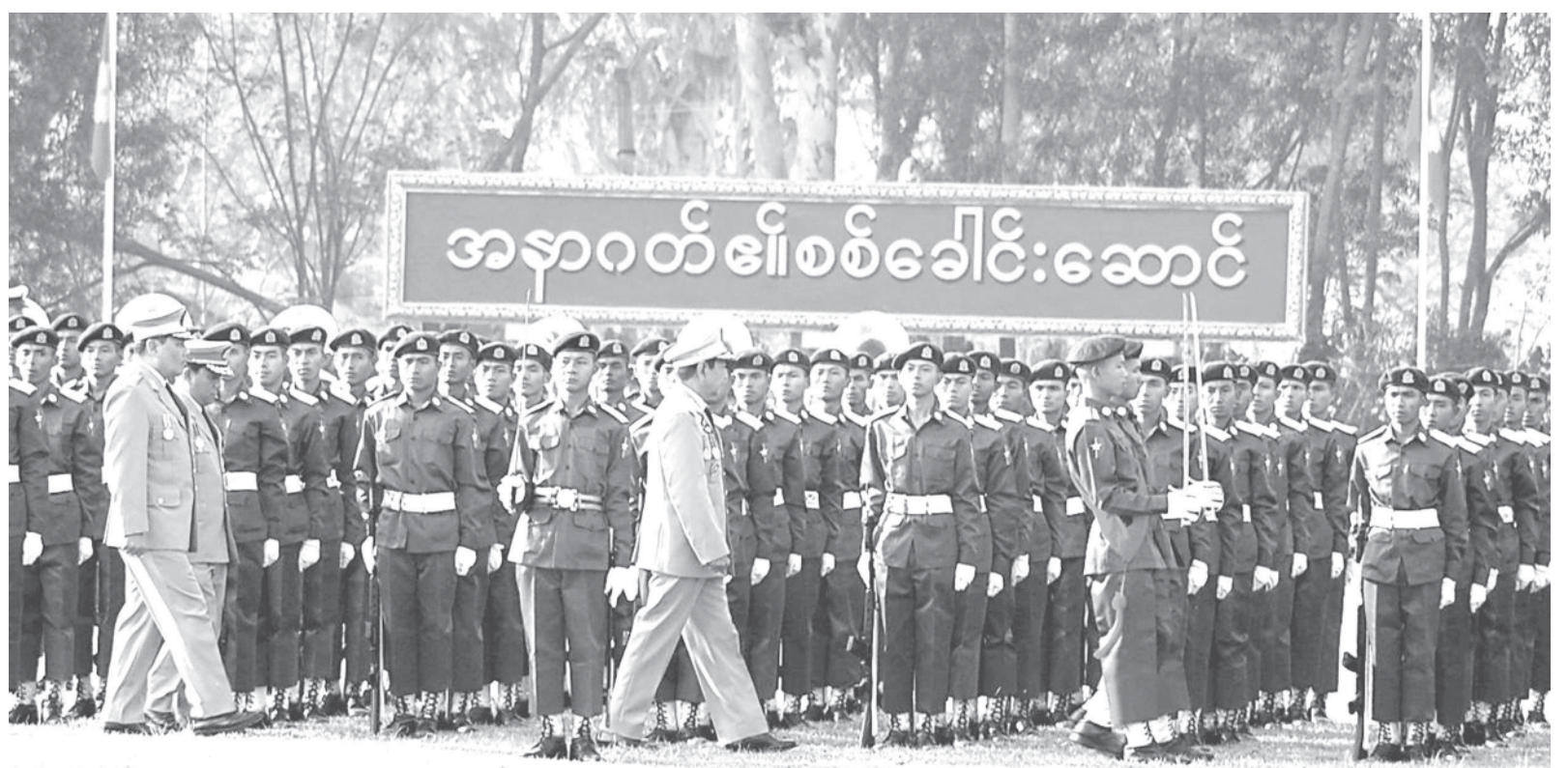
Deputy Commander-in-Chief of Defence Services Commander-in-Chief (Army) Vice-Senior General Maung Aye inspects the cadet companies.

Also present on the occasion were Secretary-1 of the State Peace and Development Council Quartermaster-General Thiha Thura Tin Aung Myint Oo, Commander-in-Chief (Navy) Rear-Admiral Nyan Tun, Commander-in-Chief (Air) Lt-Gen Myat Hein, (See page 9)