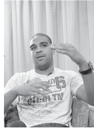
Brazilian striker Adriano, who is battling depression after a failed love affair, said on Thursday that he is not planning a speedy return to Inter Milan.