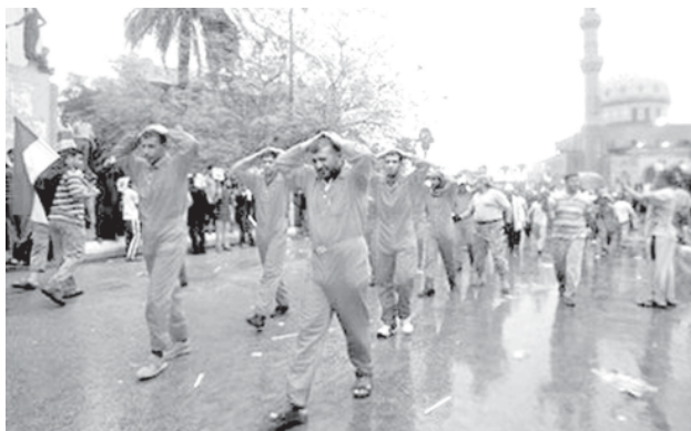
Protesters re-enact the mistreatment of detainees at the US-run prison at Abu Ghraib, an incident that sparked worldwide outrage, during a rally marking the sixth anniversary of the fall of the Iraqi capital to American troops in Baghdad, Iraq, on 9 April, 2009.—INTERNET

Protesters set fire to American flags and to Bush’s effigy as it hung from the pillar where Saddam’s statue once stood.—Internet