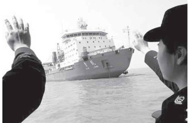
Police officers of the Shanghai Wusong frontier inspection station wait for the arrival of the Chinese Antarctic exploration vessel, "Snow Dragon," in Shanghai, east China, on 9 April, 2009.