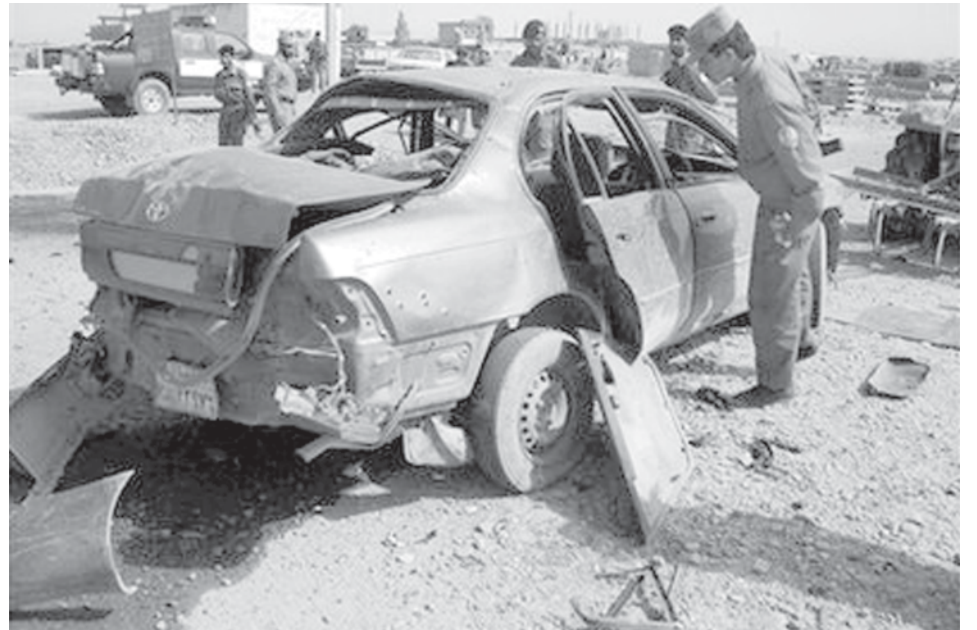
An Afghan police officer, right, checks a damaged vehicle following a suicide attack in Lashkar Gah the provincial capital of Helmand Province south of Kabul, Afghanistan on 9 April, 2009. A suicide bomber on foot attacked a police drug eradication unit in southern Afghanistan on Thursday, killing four officers and a child and wounding seven other officers, police said.