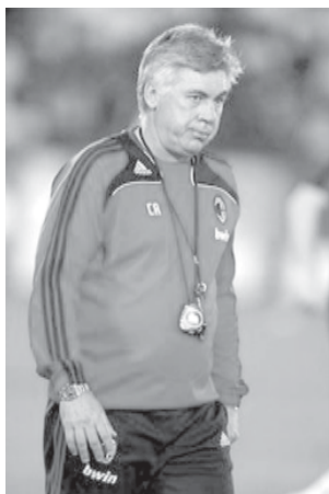
AC Milan coach Carlo Ancelotti, has agreed to take over at Chelsea next season to replace interim coach Guus Hiddink.

LONDON, 10 April — AC Milan coach Carlo Ancelotti has agreed to take over at Chelsea next season to replace interim coach Guus Hiddink, the Sun newspaper reported on Thursday. The report said