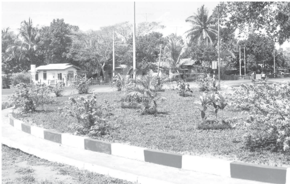
Multi-coloured flowery plants seen at island area on Zeyarmon Junction in Kyaikto Township.

Translation: TTA 7-4-2009 Myanma Alin: 7-4-2009