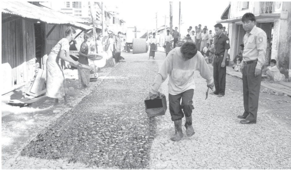
Workers of Pauktaw Township Development Affairs Committee tarmacking a road.

acres of monsoon paddy out of 115.063 acres. A total of 400 acres of paddy of 55 farmers at the entrance to the town yielded 37,734 baskets of paddy in 2007-2008, accounting for 94.34 per cent and 38,462 baskets of paddy in 2008-2009, accounting for 96.15 per cent.