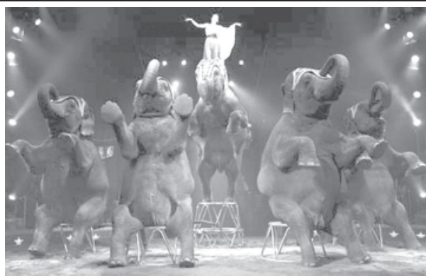
Artist Linna Knie Sun stands on an elephant during a rehearsal of the new show of Swiss National-Circus Knie in the town of Rapperswil east of Zurich. Circus Knie starts its tour.