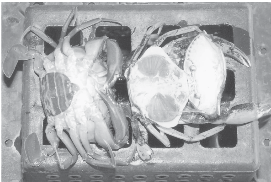
Two soft crabs.

Myanmar fish entrepreneurs and fishery product processors should export value-added marine products on a wider scale to help the country earn more foreign exchange.