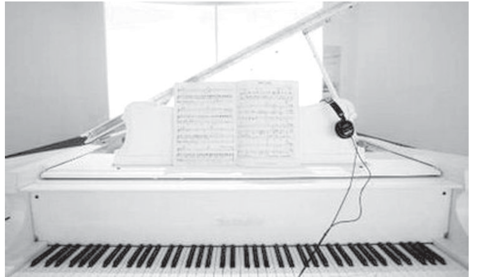
A white piano that visitors are welcome to play “imagine” on is displayed at the Montreal Museum of Fine Arts exhibition titled “Imagine: The Peace Ballad of John & Yoko” on 3 April, 2009. A large bed with white sheets is a central feature of the exhibition marking the 40th anniversary of John Lennon and Yoko Ono’s “bed-in” for peace, a week-long protest against the Vietnam War. Visitors to the Montreal exhibition can lie on the oversized bed, listen to archive interviews and watch clips from the peaceful protest that Lennon and Ono conducted from their bed at the city’s Queen Elizabeth Hotel.