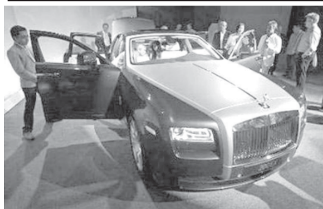
Members of the media examine a Rolls Royce 200EX experimental car after it was unveiled in Singapore on 3 April, 2009. The sales of Rolls-Royce cars will likely be flat this year but could potentially double next year as the global economy is expected to recover and as the firm introduces new models, a company official said on Friday.