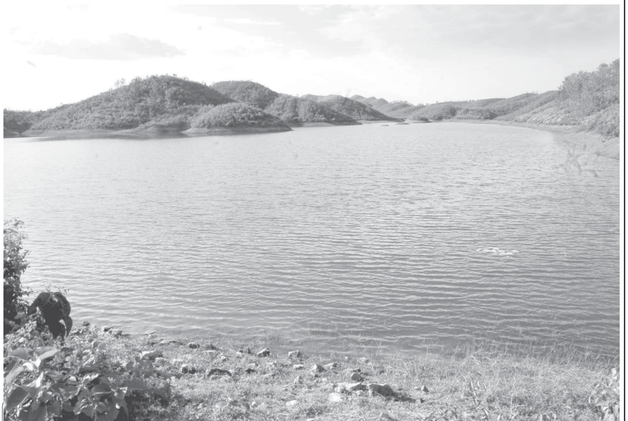
Photo shows an area of Pauktaw surrounded by seawater.