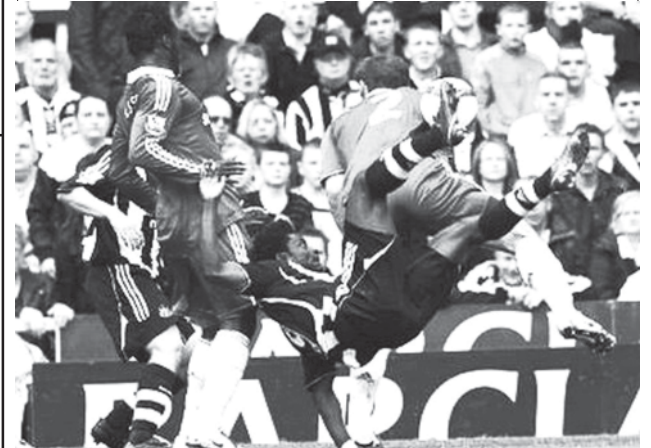
Newcastle United's Obafemi Martins (front) attempts an overhead kick at the Chelsea's goal during their English Premier League soccer match in Newcastle, northeast England on 4 April, 2009.