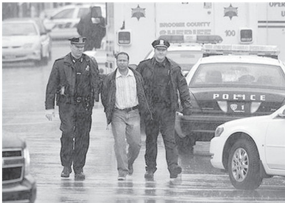
Police escort a man who had been inside the building during the siege at the American Civic Association. Fourteen people were killed, probably including the gunman, and four were critically injured during a massacre at a civic center in Binghamton, New York, police said recently.