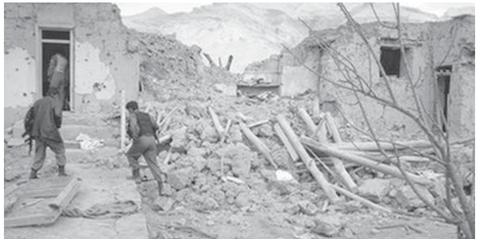
Afghan policemen run to a destroyed house after Thursday's joint coalition-Afghan mission, in which 12 militants were killed, in Shikhan village of Baraki Barak district of Logar Province south of Kabul, Afghanistan on 3 April, 2009. —INTERNET