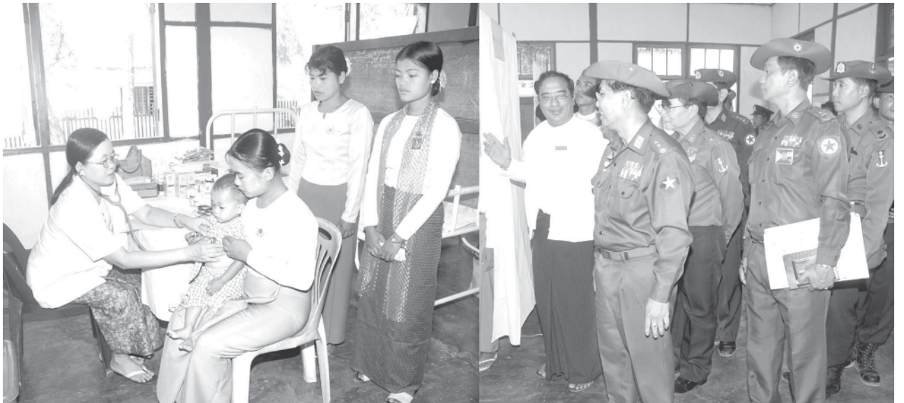
Lt-Gen Myint Swe of the Ministry of Defence views giving of free medical treatment to patients.