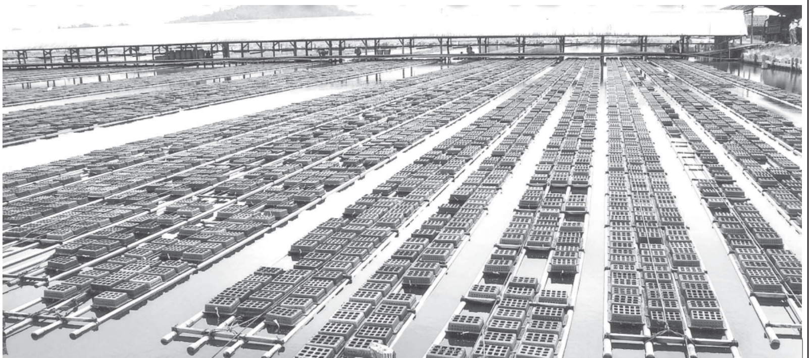
Crabs are kept in a plastic container each till they shed off their old shells.