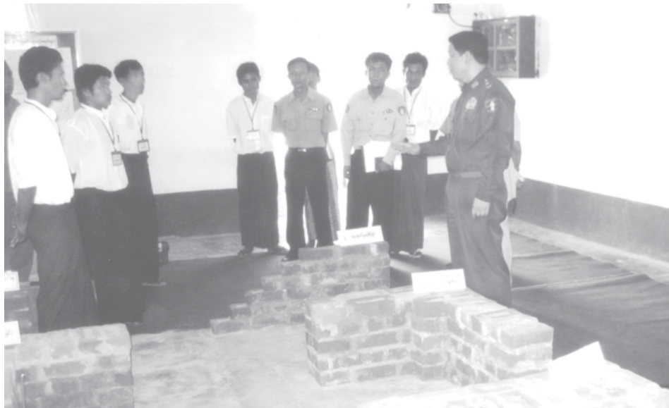
Deputy Minister Col Tin Ngwe observes works of the trainees.