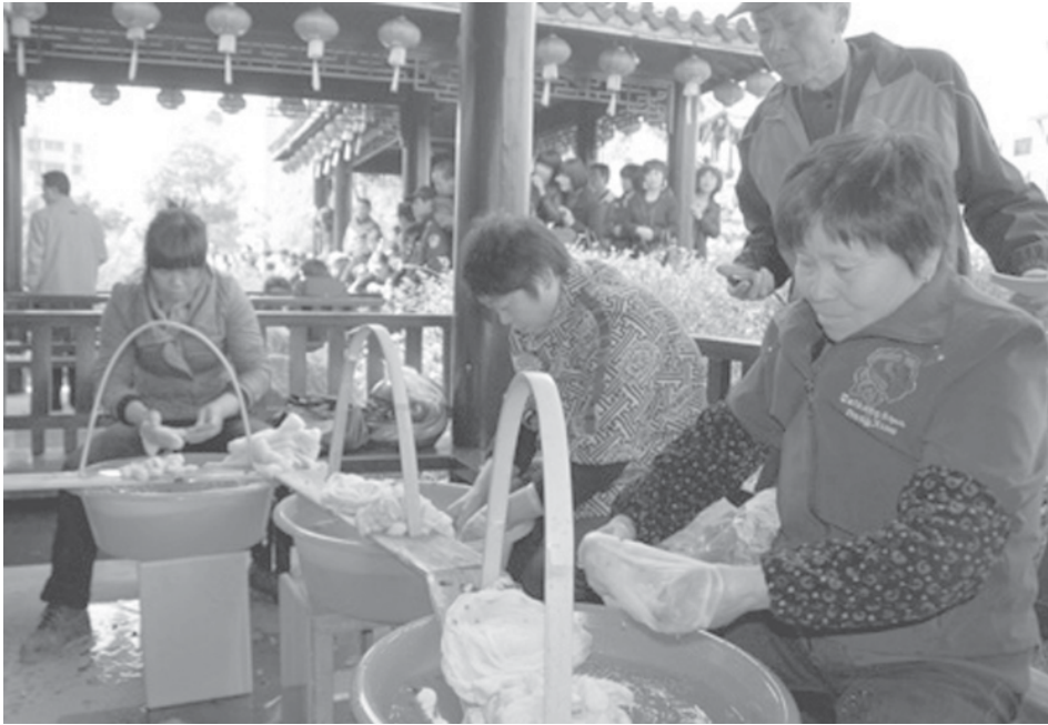
Workers show the traditional silk making technique at the silkworm temple fair held in Xinshi Township of Deqing County, east China's Zhejiang Province, on 2 April, 2009.