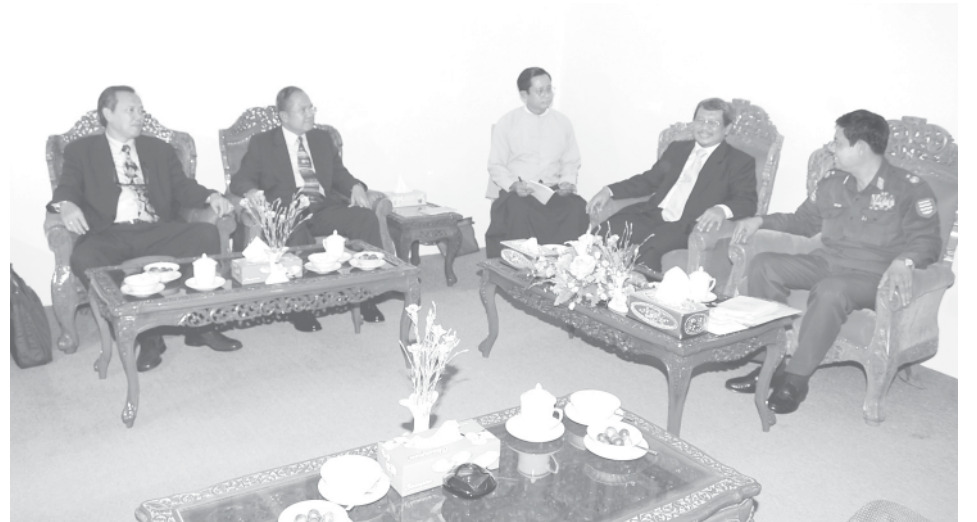
Minister Maj-Gen Htay Oo meets Minister of Agriculture of Indonesia Dr Anton Apriyantono and party.

Minister of Agriculture of Indonesia and party visited Agricultural