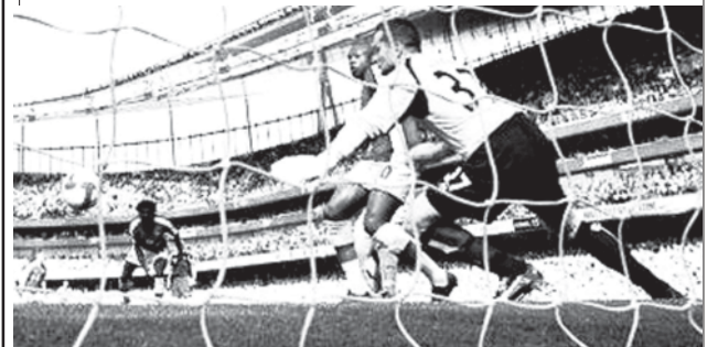
Arsenal's Emmanuel Adebayor (L) scores past Manchester City's goalkeeper Shay Given during their English Premier League soccer match at the Emirates stadium in London on 4 April, 2009.