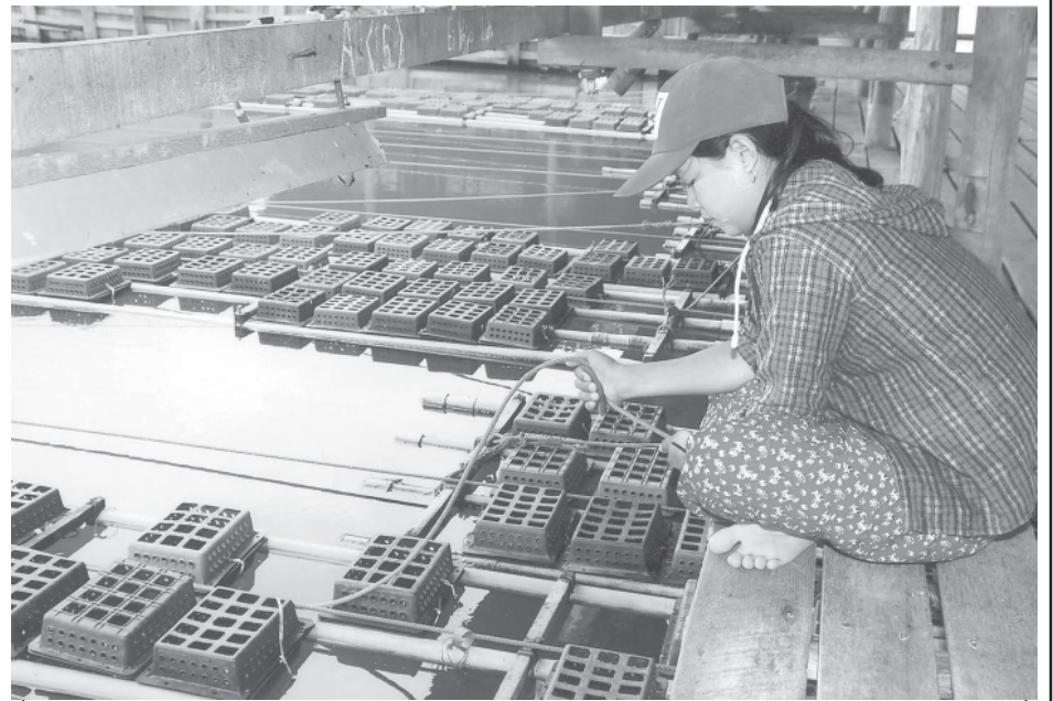
Workers have to check crabs once an hour all-day round to know whether they are shedding off their old shells.

So, Myanmar fish entrepreneurs and fishery product processors should export value-added marine products on a wider scale to help the