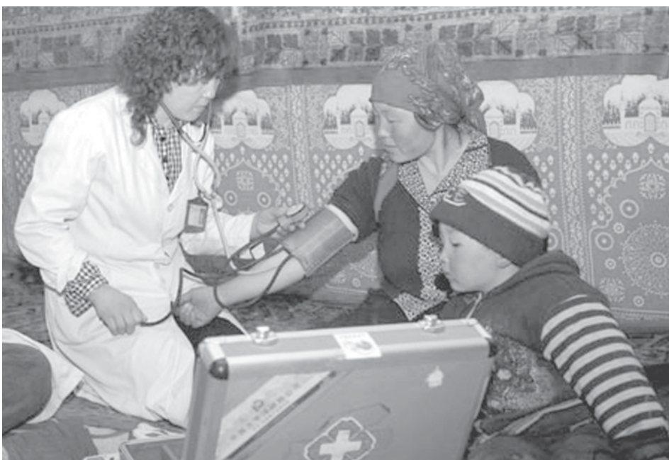
A doctor of a mobile medical team examines a herdsman in the pastoral area at Yiwu County, northwest China's Xinjiang Uygur Autonomous Region, on 2 April, 2009.

The Eutelsat W2A satellite, with a service life of 15 years and a take-off weight of 5,900 kg, was designed by the Thales Alenia Space company to provide internet and communication service for customers in regions such as Europe, Africa and the Middle East.—Xinhua