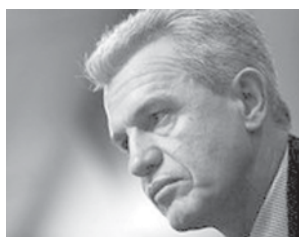
The Mexican football federation said Friday it had appointed former coach Javier Aguirre as their new handler.

Eriksson, 61, was fired after barely ten months in the job following Wednesday's disappointing 3-1 loss to Honduras in a World Cup qualifier, which came after a previ-