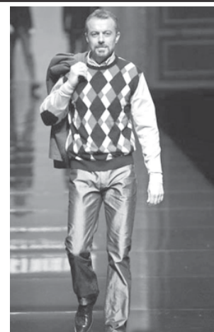
A foreign diplomat is displaying a creation during the China International Fashion Week.