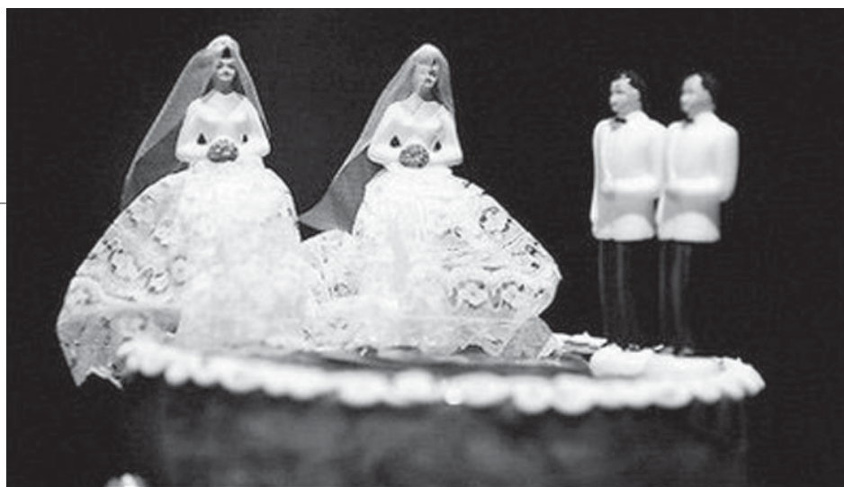
A wedding cake featuring two grooms and two brides, symbolizing gay marriage. Sweden's parliament on Wednesday voted by a wide majority in favour of a gay marriage bill that allows homosexuals to wed in either a religious or civil ceremony.