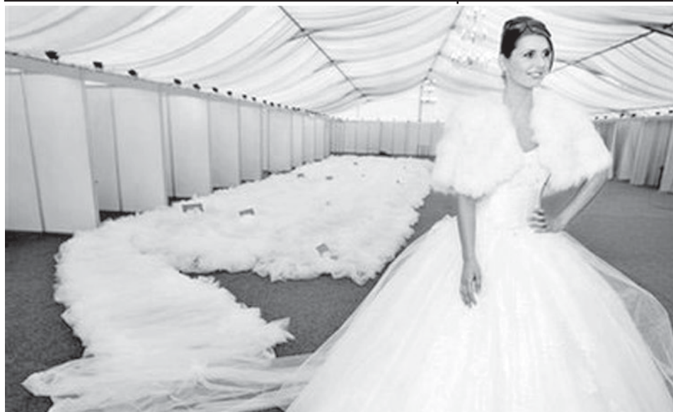
A Romanian model displays wedding dress with a train measuring 1,579 metres long for a new world record for the longest wedding train in Bucharest Romania, Wednesday, on 1 April, 2009.