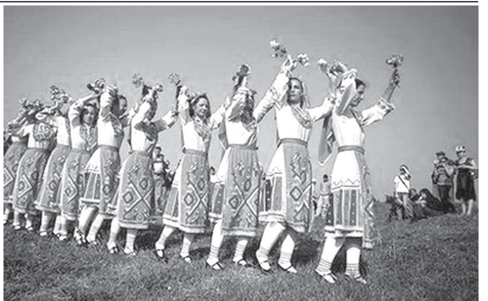
Bulgarian girls in traditional costumes performing the "Horo" for tourists in 2008. The Bulgarian government hopes to more than treble revenues from tourism by 2013 by improving service quality and aiming for a more up-market image, a strategy paper said Thursday.

"We must take a transitional path to a new model that we call socialism." Chavez and Ahmadinejad, both ex-military officers known for their anti-US rhetoric, have strengthened economic and political ties. Chavez is on his seventh trip to Iran since Ahmadinejad was elected in 2005.