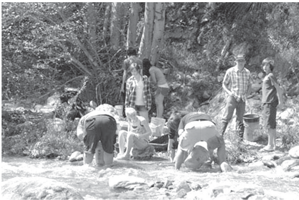
Parents with their kids seek for gold in the San Gabriel Mountains, Los Angeles, California, the United States, on 29 March, 2009. As one of the most significant events in California history, more people began to take part. Some of the gold seekers in the San Gabriel Mountains are for money and some of them are for fun.