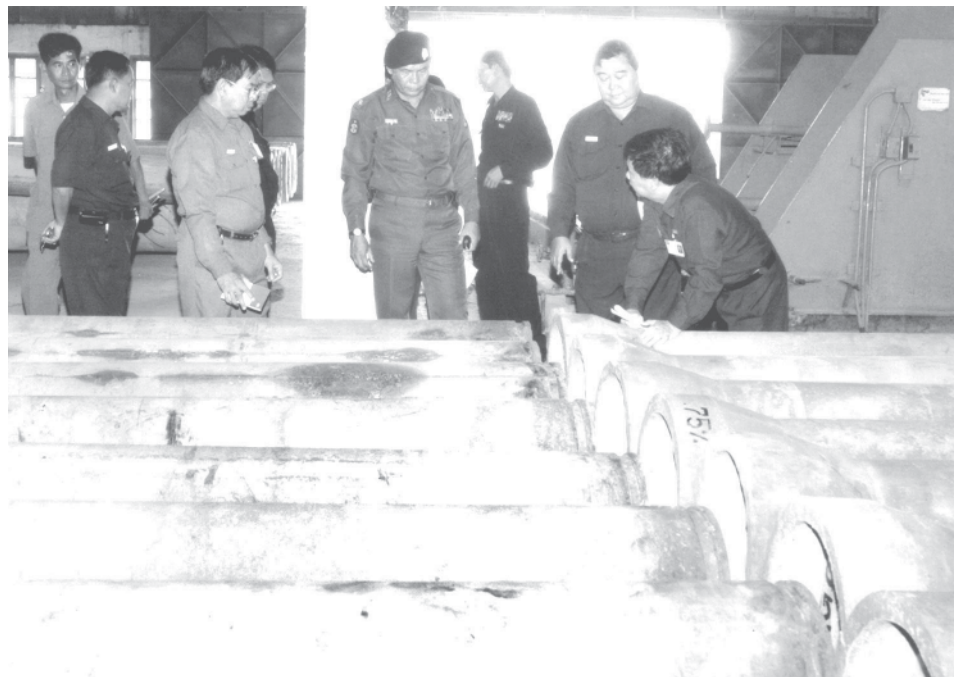
Mayor Brig-Gen Aung Thein Lin visits Pipe Factory in Phawtkan ward, Insein Township.

NAY PYI TAW, 4 April—Chairman of Yangon City Development Committee Mayor Brig-Gen Aung Thein Lin arrived at pipe factory Engineering Department (Water and Sanitation) in Phawtkan Ward in Insein Township today.