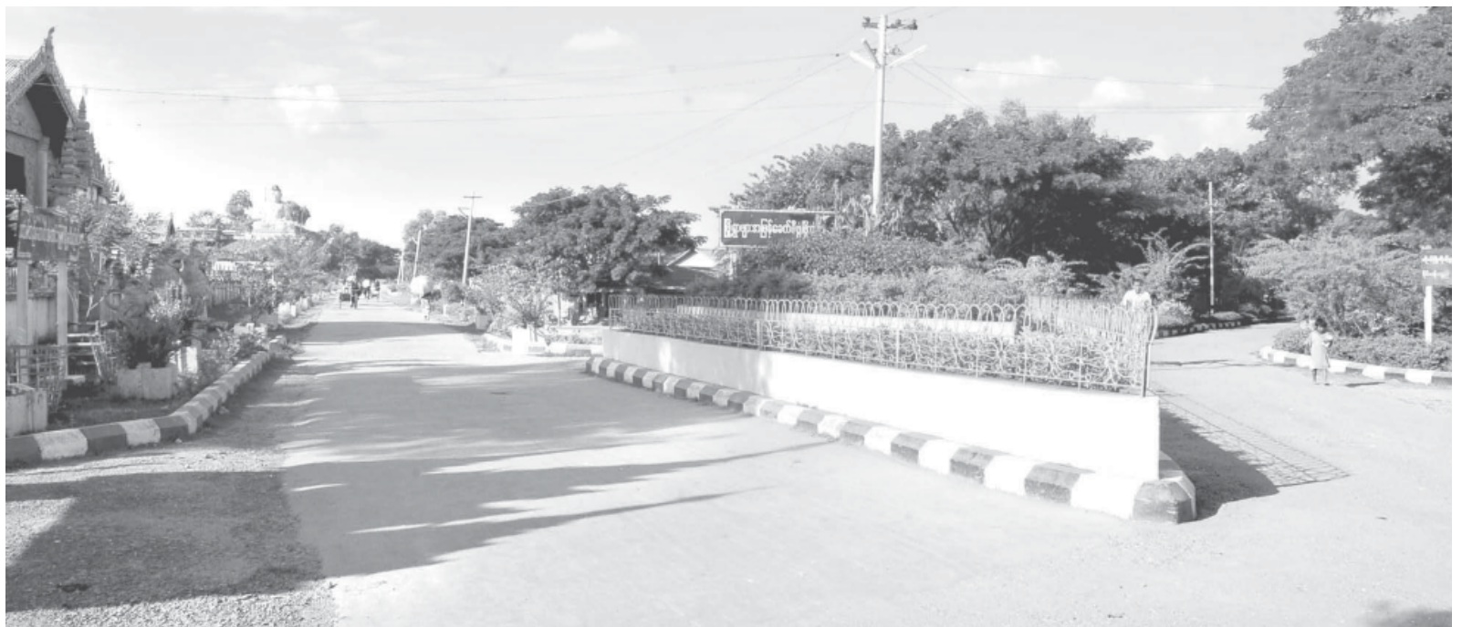
Roads of Pauktaw are neat and tidy.