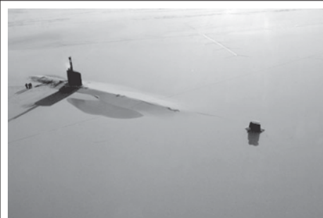
In this photo released by the US Navy, the Los Angeles-class submarine USS Annapolis is seen on the surface of the Arctic Ocean after breaking through three feet (ninety centimeters) of ice during Ice Exercise 2009, a training and research exercise.

He couldn't, however, get anyone out of bed there and went to sleep in boat. Police said the man was in his basement when an ember from the fireplace ignited a rug. It took firefighters about an hour to knock down the blaze after it was reported by a resident.