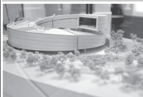
The design concept for the National Museum of African American History and Culture submitted by Foster + Partners/URS Group, Inc, is seen in Washington. Six architectural models for the planned National Museum of African American History and Culture are currently on display.