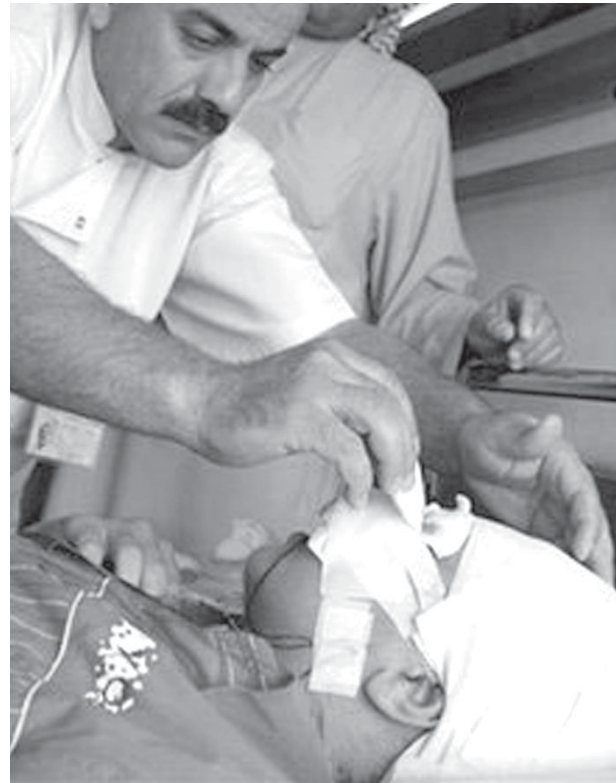
The victim of a car bombing is treated for his wounds at a hospital in Baghdad, Iraq, Saturday, 4 April, 2009. The man was one of five wounded and two killed on Friday in the Karrada district.