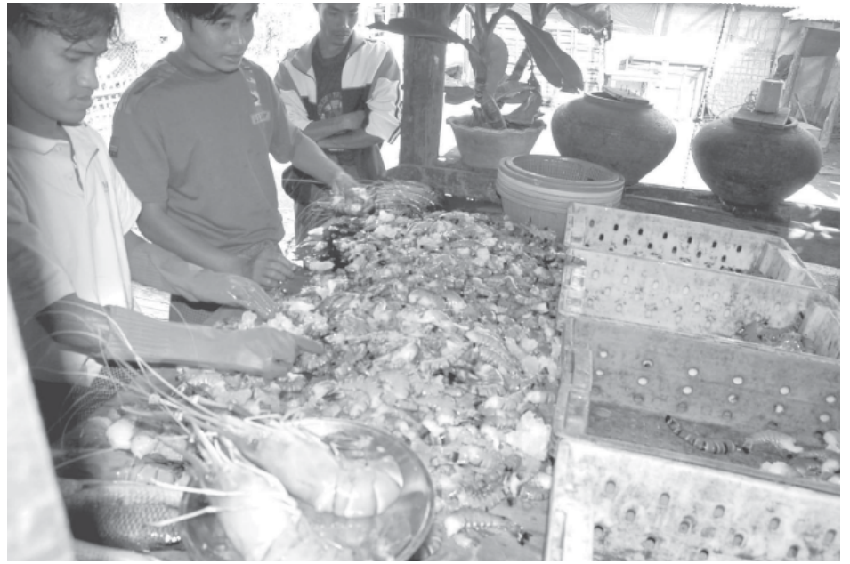
Workers processing prawns.

During the neap-tide days, about 300 viss each of fish and prawn were sold in 25 villages daily. Fish and prawn processed with ice were sent to Sittway by boat. Some of them were distributed to Yangon. When the price of prawn fell, the sellers faced loss.