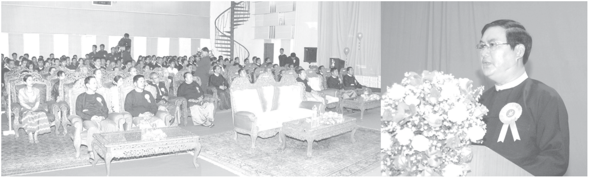
Adjutant-General Lt-Gen Thura Myint Aung addresses the 14th founding anniversary of Myawady TV Station.

YANGON, 4 April—The Myawady TV Station celebrated its 14th founding anniversary along with the awarding ceremony at its office in Hmawby this evening, with an address by Adjutant-General Lt-Gen Thura Myint Aung.