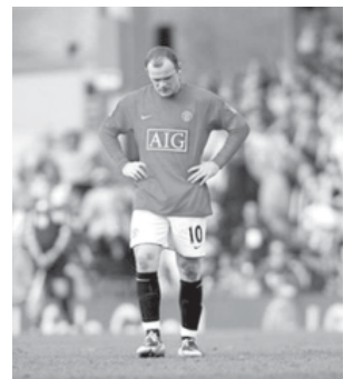
Manchester United's English striker Wayne Rooney