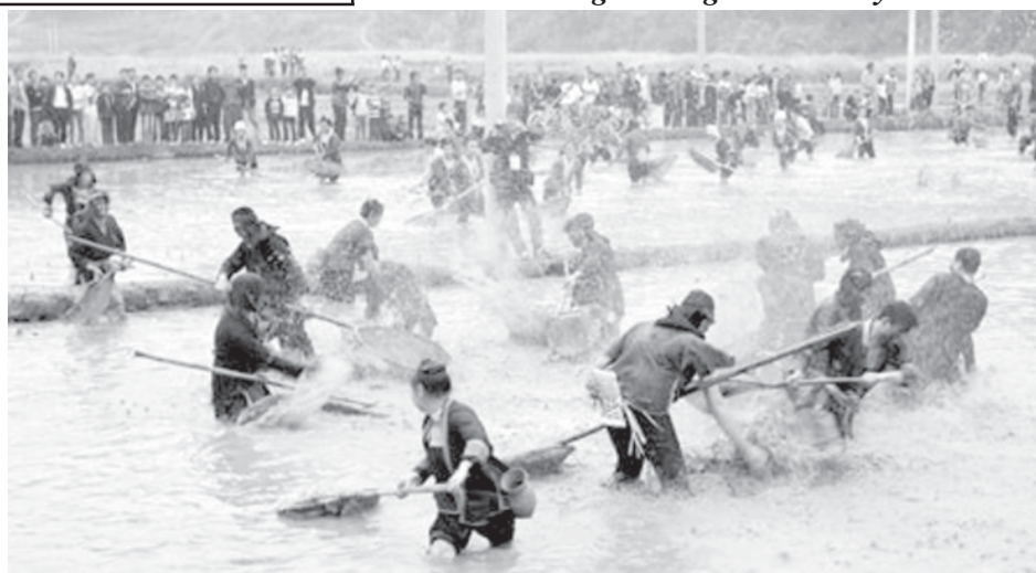
People of the Dong ethnic group take part in a fishing contest during a traditional cultural and art festival at the Long'e Village of Liping County, southwest China's Guizhou Province, on 23 March, 2009. The 3-day 2009 Long'e China Singing Cultural and Art Festival of the Dong Ethnic Group started at the Long'e Village on Monday.

oral vitamin D supplements among adults age 65 or older.