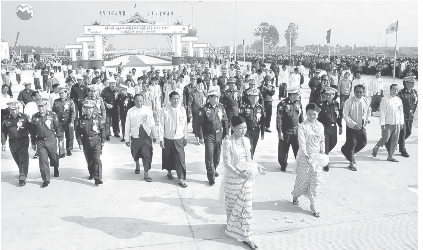
Secretary-1 General Thiha Thura Tin Aung Myint Oo strolls along Yangon-Mandalay Expressway (Nay Pyi Taw-Yangon road section).