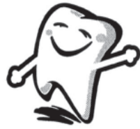
(Reg. No. IV/8140/2008)

Stafford-Miller (Ireland) Limited of Clocherane, Youghal Road, Dungarvan, Co. Waterford, Republic of Ireland is the Owner and Sole Proprietor of the following trademark -