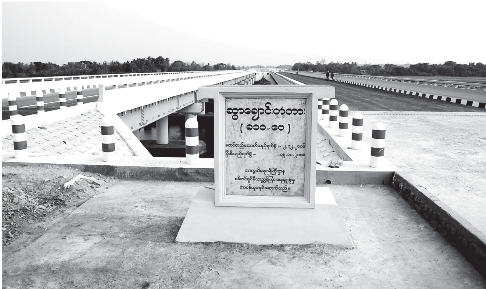
Swa Creek Bridge built on Yangon-Mandalay Expressway (Nay Pyi Taw-Yangon road section).