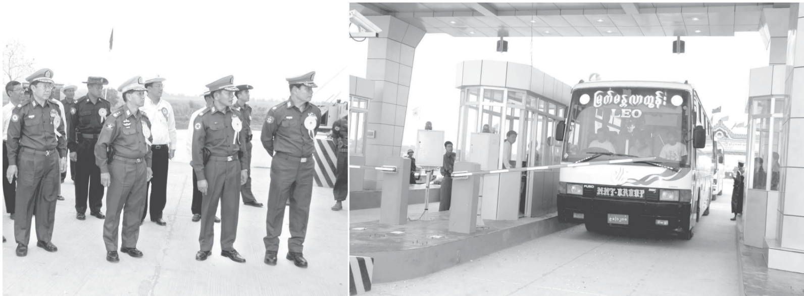
Lt-Gen Myint Swe of Ministry of Defence inspects running of buses after opening Yangon-Mandalay Expressway (Nay Pyi Taw-Yangon road section).