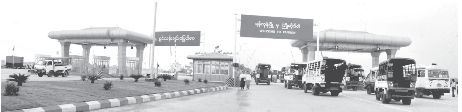
Vehicles running on Yangon-Mandalay Expressway (Nay Pyi Taw-Yangon road section) seen after the inauguration ceremony. — MNA