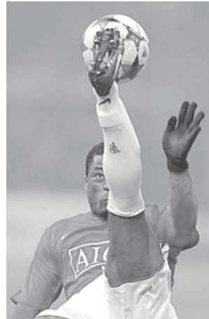
Manchester United's French defender Patrice Evra clears the ball during his team's UEFA Champions League first knockout round first leg football match against Inter Milan at San Siro Stadium in Milan, February 2009.