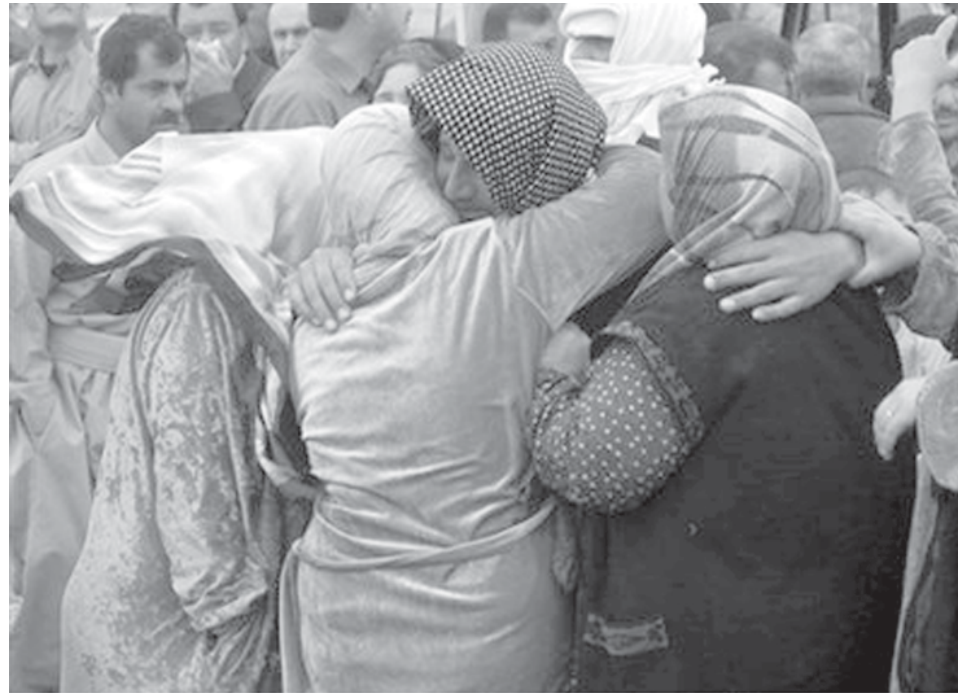
Women cry during a funeral of people who died in suicide bombing in Jalula, 125 kilometres (80 miles) northeast of Baghdad, Iraq, on 24 March, 2009.