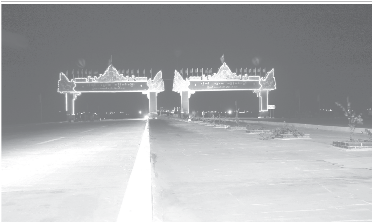
Yangon-Mandalay expressway (Nay Pyi Taw- Yangon road section) being illuminated. (News on page 1)