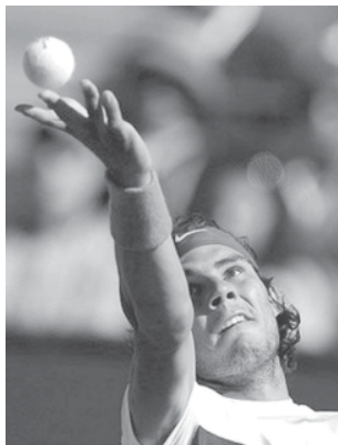
World number one Rafael Nadal

Nadal, who won his sixth Grand Slam title and his first on hardcourt in Melbourne and said his