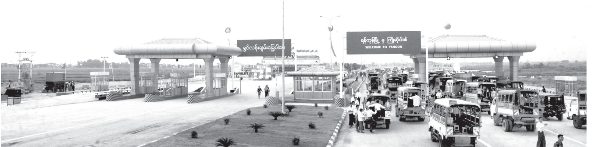
Vehicles running on Yangon-Mandalay Expressway (Nay Pyi Taw-Yangon road section) seen after its inauguration ceremony.

NAY PYI TAW, 25 March — Hailing the 64th Anniversary Armed Forces Day, Yangon-Mandalay Expressway (Nay Pyi Taw-Yangon road section) was inaugurated at Nay Pyi Taw C Junction at mile post No. 202/1 of the expressway today. The road section of international standard was built by Public Works and Directorate of Military Engineers of the Ministry of Defence under the guidance of the Head of State.