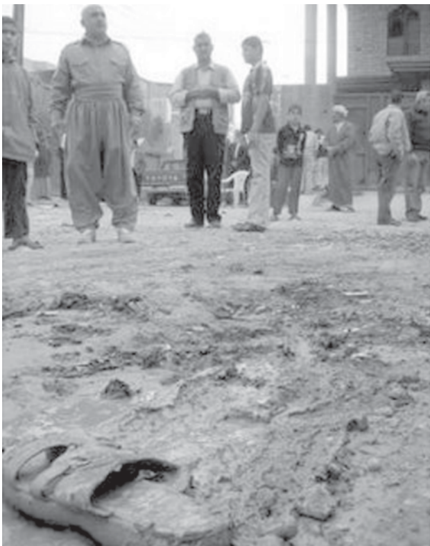
Footwear and bloodstains are seen at the site of a bomb attack in Jalawla, 115 km (70 miles) north-east of Baghdad, on 24 March, 2009.