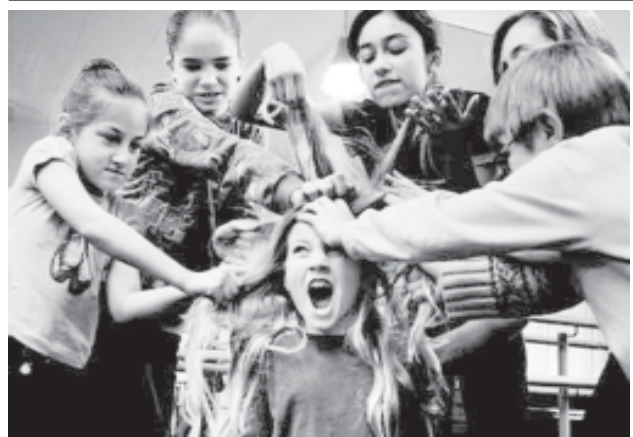
The photo "Dancers of Royal Theatre in Copenhagen" taken by Christian Als wins the silver prize in the Arts, Culture & Entertainment News Singles in the 5th China International Press Photo (CHIPP) Contest held in Shanghai, China, from 20 to 25 March, 2009.—XINHUA