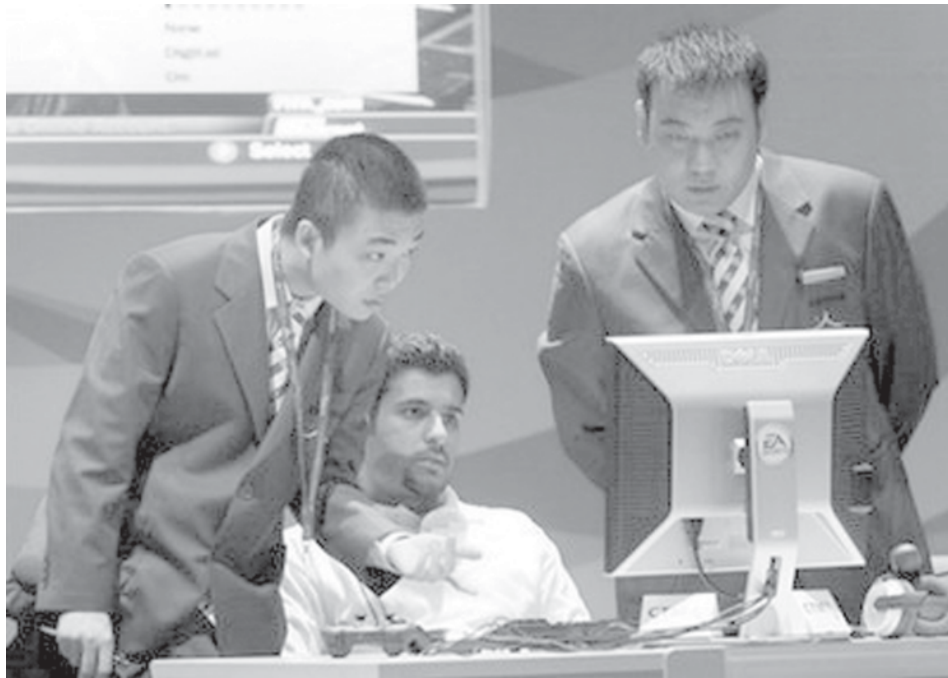
Games officials check the computer of a Qatari player prior to the E-sports competition at the 2nd Asian Indoor Games in Macau in 2007. Asian computer gamers will join more conventional athletes in Hanoi for the 3rd Asian Indoor Games later this year, organizers said on Friday.