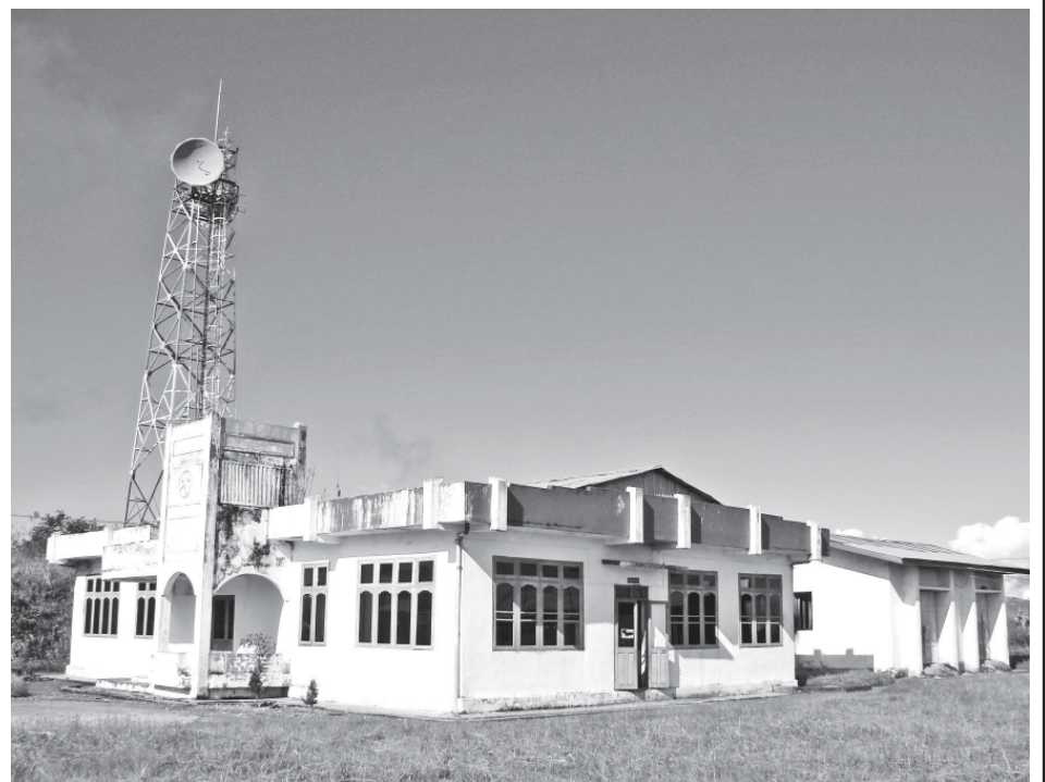
A microwave station facilitated in Falam of Chin State for better communications in Chin hilly region.