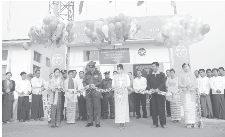
Minister Brig-Gen Thein Zaw opens Lonkhin digital auto-exchange office in Phakant Township.— MNA

After inspecting CDMA-450 control room, D-AMPS cellular