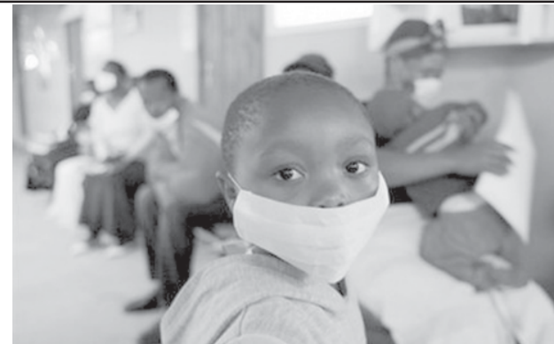
Patients at the tuberculosis center in Khayelitsha, on the south-western coast of South Africa.