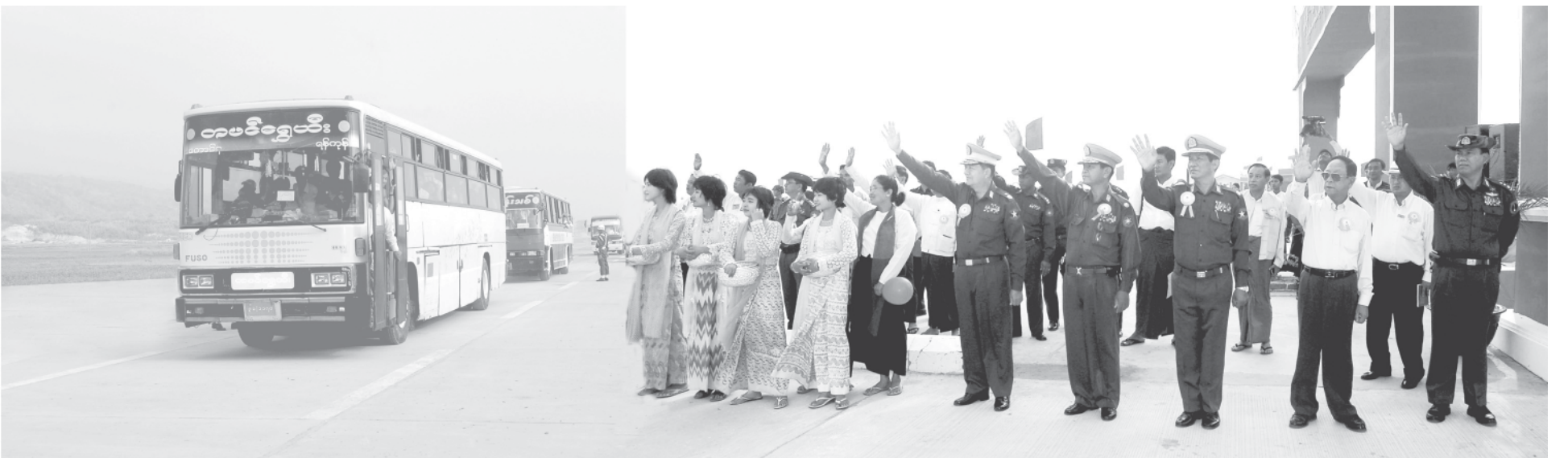
Maj-Gen Ko Ko of Ministry of Defence waving to passengers on buses after opening Yangon-Mandalay Expressway (Nay Pyi Taw-Yangon road section).—MNA

Overcoming the barriers and historical legacy, the government built roads, bridges and railroads in states and divisions for ensuring better (See page 5)