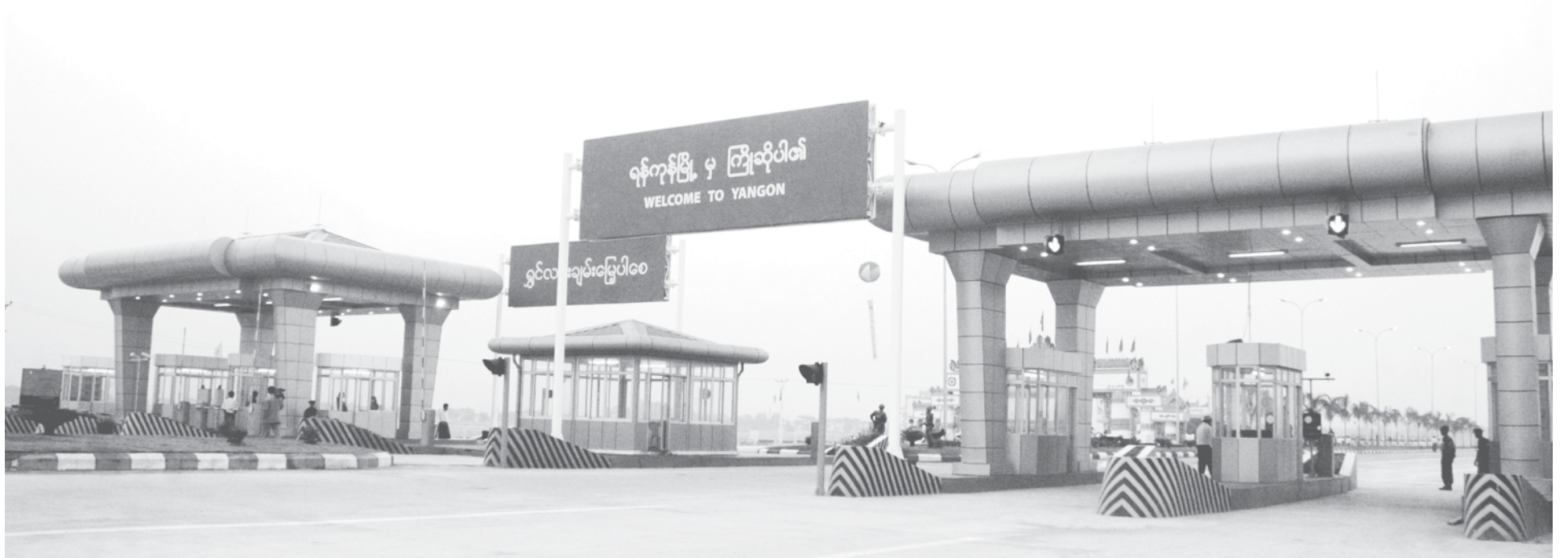
A toll gate seen near junction of No. 3 Expressway of Yangon-Mandalay Expressway (Nay Pyi Taw-Yangon section) in Hlegu Township. (News on page 1)— MNA