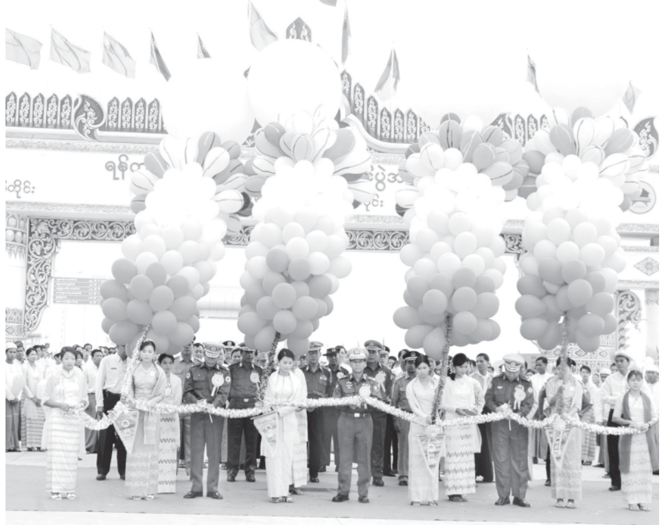
Lt-Gen Myint Swe of Ministry of Defence, Commander Brig-Gen Win Myint and Deputy Minister for Construction Brig-Gen Myint Thein formally open Yangon-Mandalay Expressway (Nay Pyi Taw-Yangon road section).