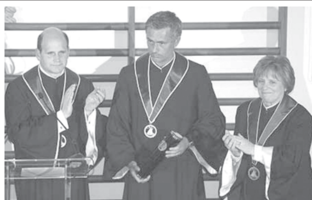
Inter Milan's coach Jose Mourinho (C) of Portugal attends a ceremony at the Sports Faculty of the University of Lisbon on 23 March, 2009. Mourinho received the title of Doctor Honoris Causa, an honorary doctorate, from the university.