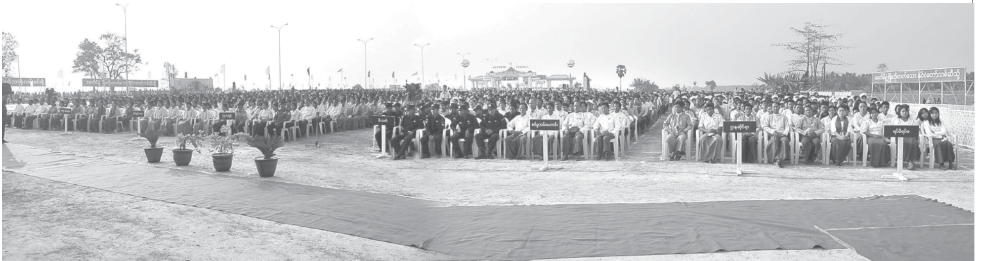
Secretary-1 General Thiha Thura Tin Aung Myint Oo delivers an address at inauguration of Yangon-Mandalay Expressway (Nay Pyi Taw-Yangon road section).—MNA