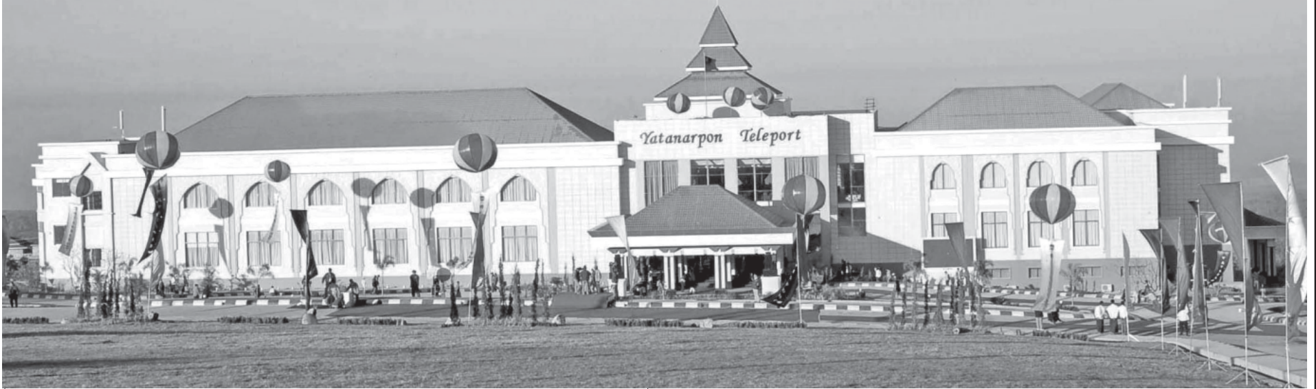
Yatanarpon Teleport built in Yatanarpon Myothit of PyinOoLwin Township, Mandalay Division, for ensuring development of ICT.