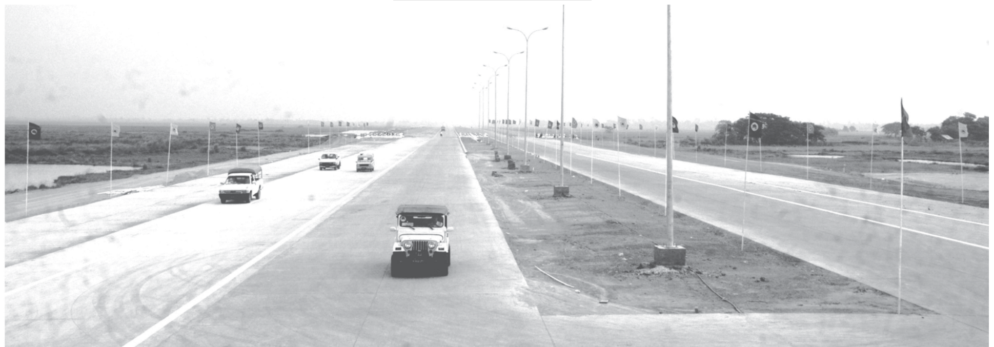
Vehicles running on Yangon-Mandalay Expressway (Nay Pyi Taw-Yangon road section) seen after the inauguration ceremony.—MNA