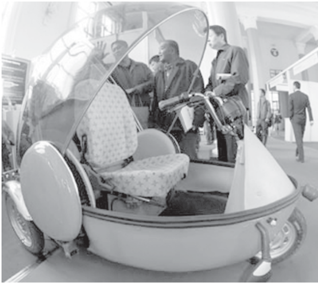
Visitors view an electric vehicle during the China International Energy Saving, Emission Reduction and New Energy Science and Technology Expo at the Beijing Exhibition Centre in Beijing, capital of China, on 22 March, 2009.