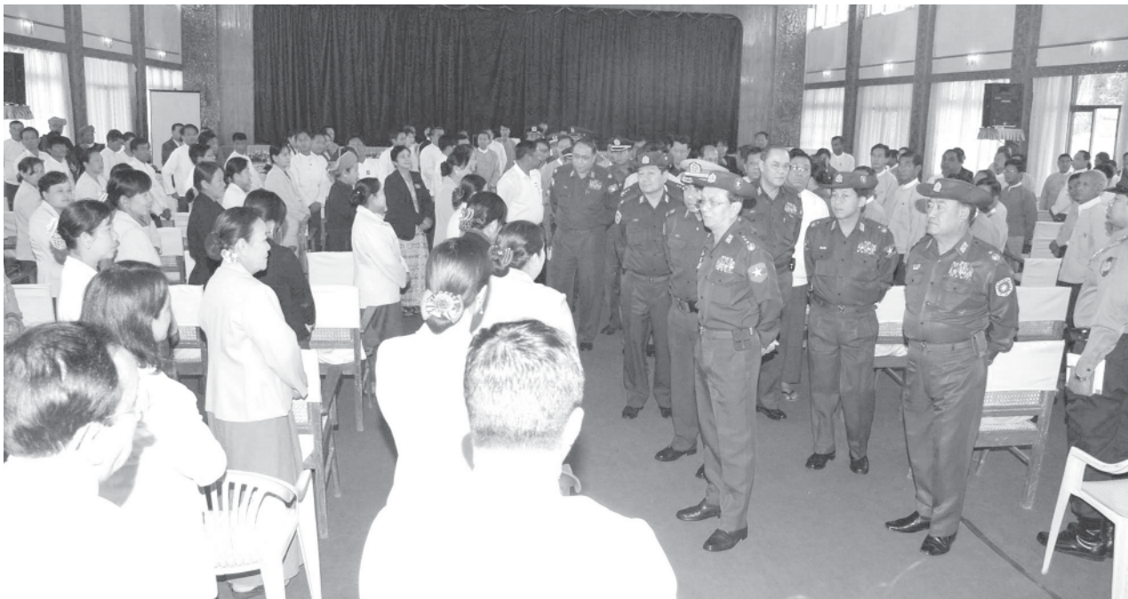
Prime Minister General Thein Sein cordially greets state/district/township level departmental personnel, members of social organizations, townsenders and local people at town hall in Taunggyi.—MNA