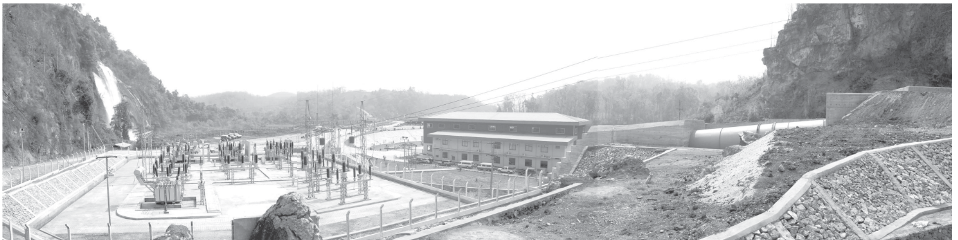
Kengtawng Hydropower Station with Kengtawng Falls.

NAY PYI TAW, 24 March—Hailing the 64th Anniversary Armed Forces Day a ceremony to open Kengtawng Hydel Power Plant built by Hydroelectric Power Implementation Department under the Ministry of Electric Power No. (1) near Kengtawng Waterfall on Namtein Creek about 30 miles north-east of