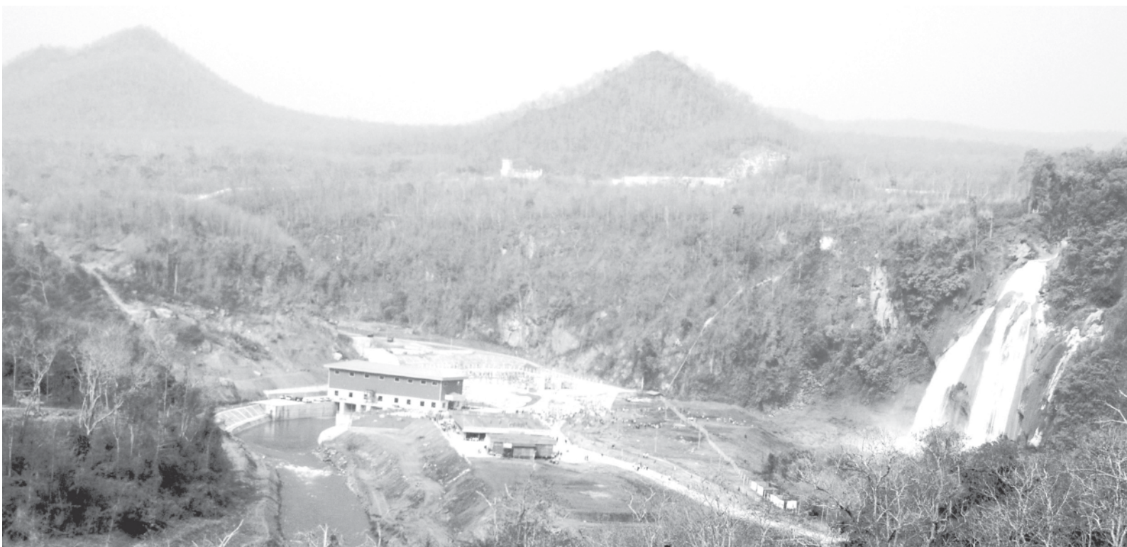
An aerial view of Kengtawng Hydel Power Plant.

Kengtawng hydropower project was built at a cost of K 15285 million and US$ 19.56 million.—MNA