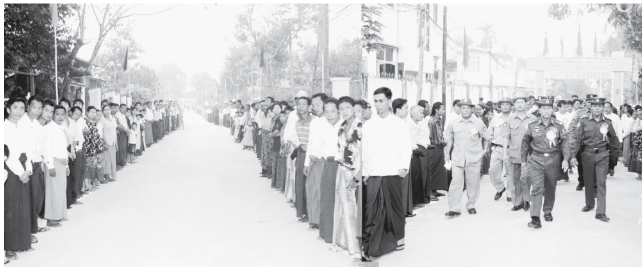
Lt-Gen Myint Swe of Ministry of Defence inspects newly opened Aung Mingala tarred road marking 64th Anniversary Armed Forces Day.