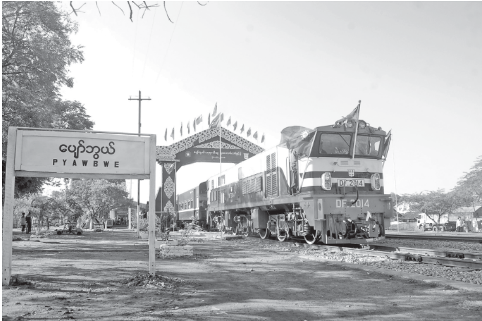
A train runs on Pyawbwe-Payangazu Road Section after inauguration of the railroad on 30, November 2008.