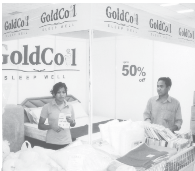
GoldCoil brand mattress with spring and wedding equipment at Yangon Expo 2009.

The national railway network will emerge soon as the government is constructing transport facilities in the whole country including border areas.