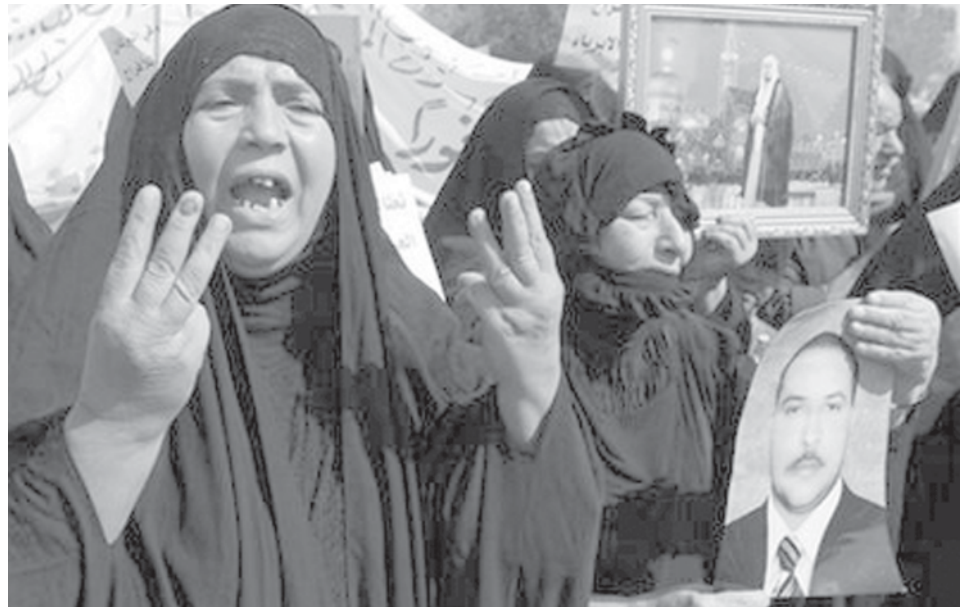
Iraqi women hold photographs of their loved ones who are in the US military custody during a rally in central Baghdad, Iraq, on 23 March, 2009.

"Every time we lose one of our brave men and women in uniform in Afghanistan I understand fully the concerns of the Australian people about this war and about where it goes in the future," he said.