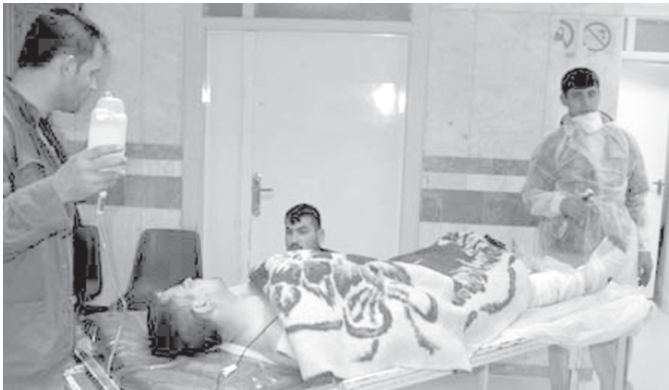
A man wounded in a suicide bombing in Jalulu, 125 kilometres (80 miles) northeast of Baghdad, Iraq, is helped by medics at a hospital in Sulaimaniyah, Iraq, on 23 March, 2009.

"Both attacks occurred in Sayd Abad district, the first roadside bomb went off at noon time targeting a convoy of the Afghan National Army (ANA) while the second one detonated by remote control hit a convoy of international troops, fortunately no casualties on both forces." Sirat told Xinhua . — Internet