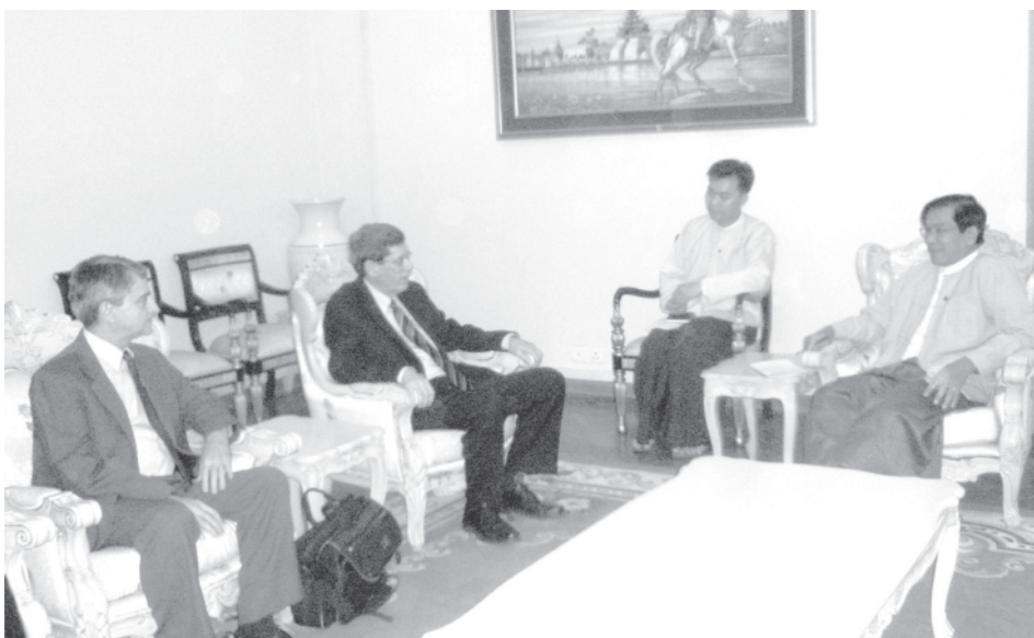
Minister U Nyan Win receives Mr. Stephen Blake, Director of Mainland Southeast Asian Affairs of State Department of the United States.

NAY PYI TAW, 24 March — Mr. Stephen Blake, Director of the Mainland Southeast Asian Affairs of the State Department of the United States, currently on a visit to the Union of Myanmar, paid a courtesy call on U Nyan Win, Minister for Foreign Affairs at the latter's office, here, at 11.45 a.m. today and held cordial discussions on issues of mutual interests and promotion of bilateral relations between the Union of Myanmar and the United States.