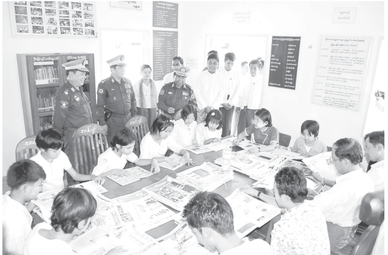
Commander Maj-Gen Wai Lwin, Minister Brig-Gen Kyaw Hsan and Minister Maj-Gen Thein Swe visit Alin Pwint self-reliant library of Thayetkon Village.—MNA

Secretary of Nay Pyi Taw District Union Solidarity and Development Association U Khin Maung Htay