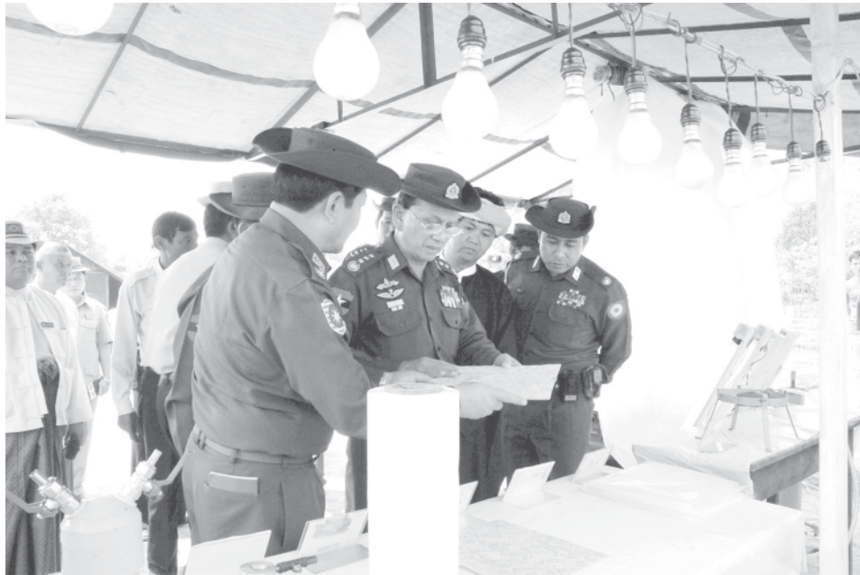
Prime Minister General Thein Sein inspects generating electricity from bio-digester at Moeyaung village in Taunggyi Township.

Division on 20 March, Prime Minister General Thein Sein, accompanied by Maj-Gen Min Aung Hlaing, the ministers, the deputy ministers, the director-general and departmental heads left for Taunggyi by helicopter and arrived in Taunggyi in Shan State (South) at 11.20 a.m.