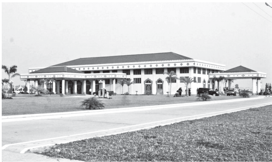
The terminal of Nay Pyi Taw Airport.