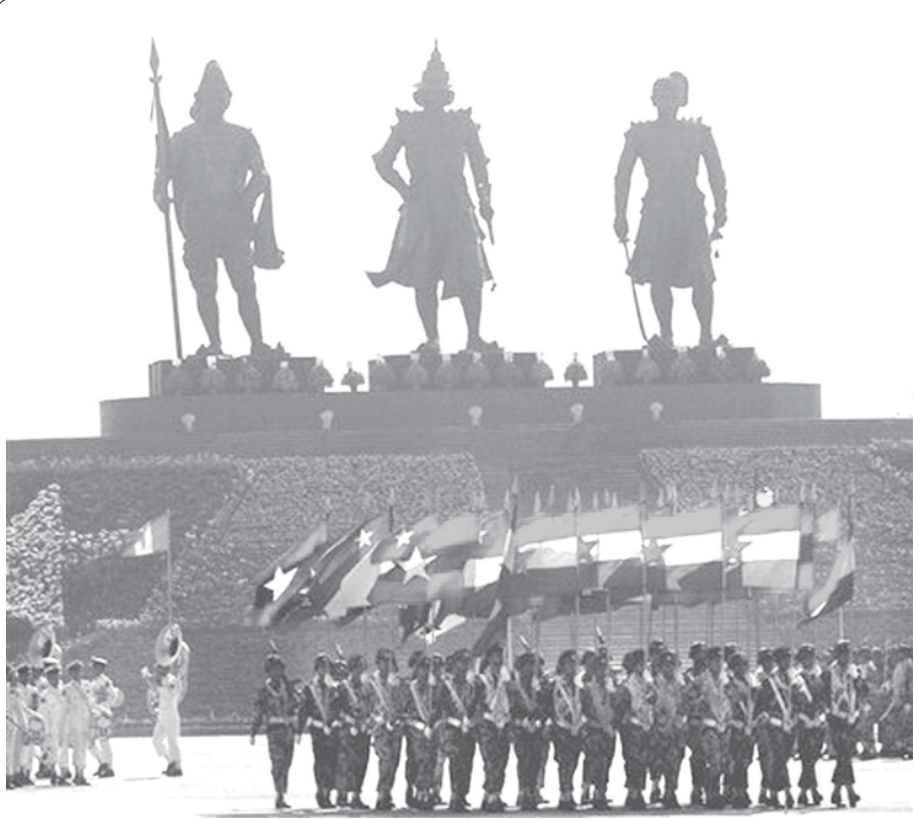
THE TATMADAW IS THE NATION'S STRENGTH