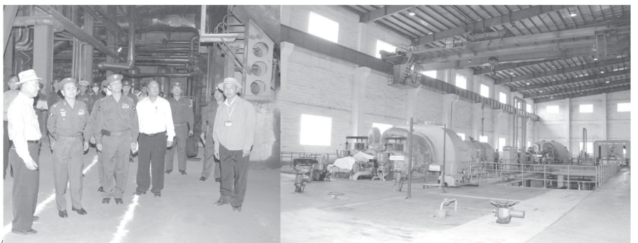
Prime Minister General Thein Sein looks into coal-fired power station (Tikyit) in Pinlaung Township.

After hearing reports, the Prime Minister fulfilled the requirements and greeted those present. Then they arrived back Taunggyi in the evening.