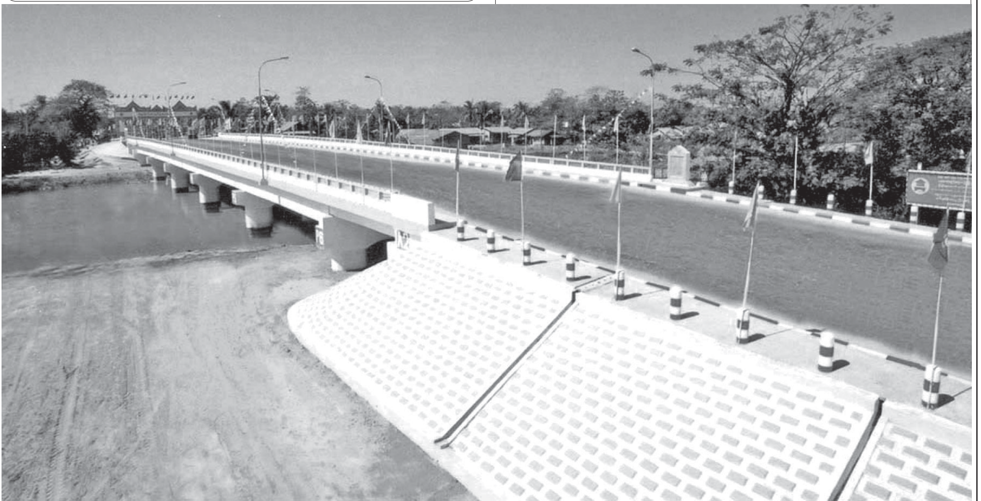
Yenwe Chaung Bridge in Nyaunglebin Township.