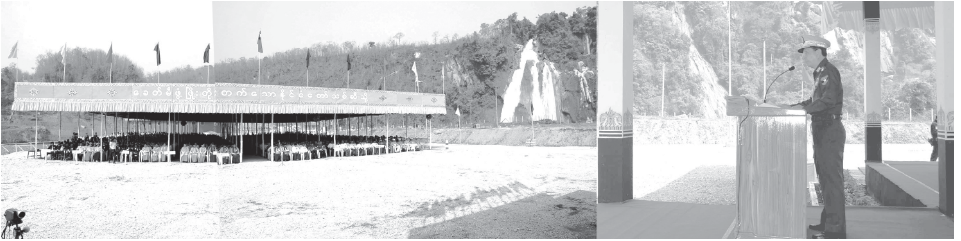
Prime Minister General Thein Sein delivers address at inauguration of Kengtawng Hydel Power Plant.