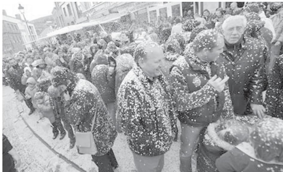
People are covered by confetti during carnival parade in Stavelot, about 150 kilometres east of Brussels, capital of Belgium, on 22 March, 2009. Carnival celebrations in Stavelot reached climax Sunday, while "Blanc Moussi" flogged crowds with pork bladders and threw confetti to them.

multidrug-resistant TB, the patients of which are resistant to at least two of the best anti-TB drugs. It also takes much longer to treat, sometimes as long as two years, and is more expensive than treating ordinary TB. The treatment also causes more severe side-effects, such as liver malfunction and severe gastrointestinal problems, the organization added.—Xinhua