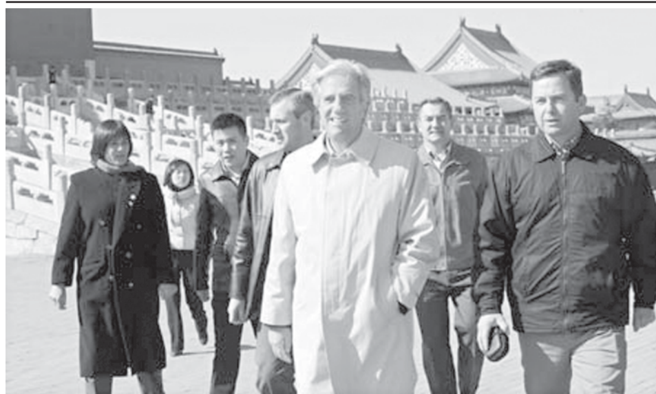
Uruguayan President Tabare Vazquez (C front) visits the Palace Museum in Beijing, capital of China, on 22 March, 2009.