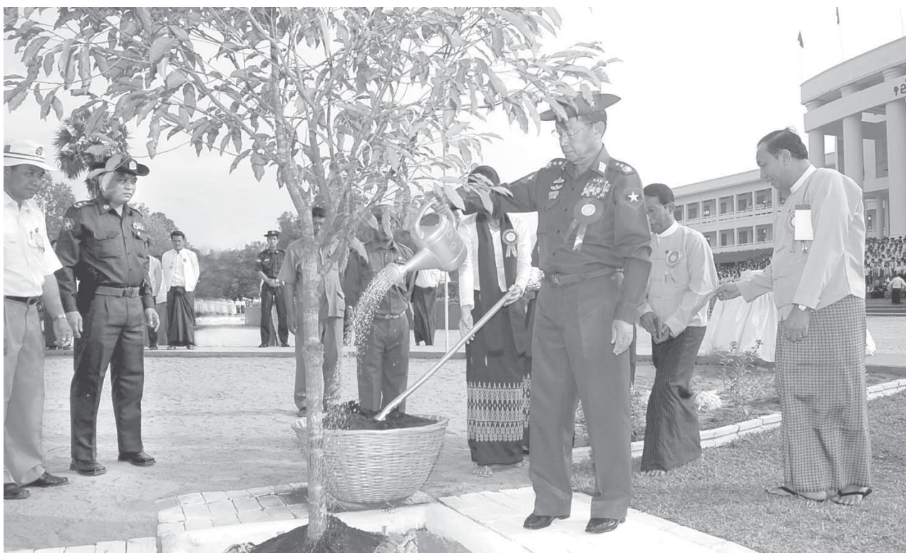
Chairman of Myanmar Education Committee Secretary-1 of the SPDC Lt-Gen Thiha Thura Tin Aung Myint Oo grows a tree, marking the opening of new building of Technological University (Mawlamyine).

Crossing Bridge, the longest river in the country, in order to ensure smooth transport and develop trading, he said.