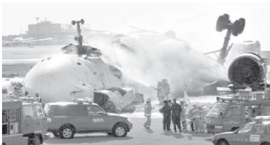
Photo taken on 23 March, 2009 shows the crash site of a cargo plane at the Narita International Airport, east of Tokyo, capital of Japan. A Federal Express Corp cargo plane crashed and burst into flames early Monday at the Narita International Airport, reports from Narita, Chiba Prefecture, cited airport and police officials as saying.