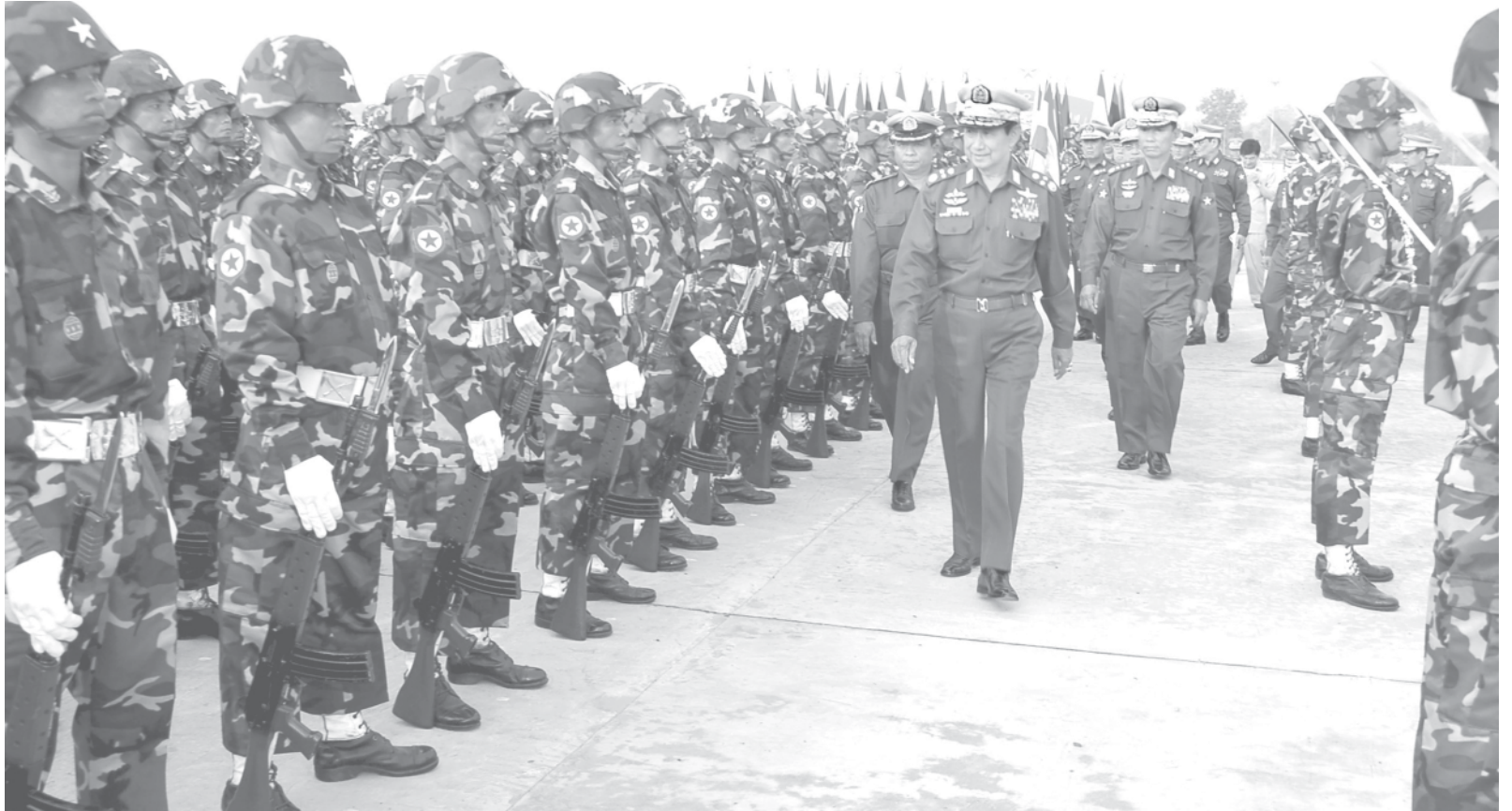
Vice-Senior General Maung Aye inspects the drill of Tatmadawmen from seven columns, members of Myanmar Police Force, Myanmar Fire Brigade and Myanmar Red Cross Society.