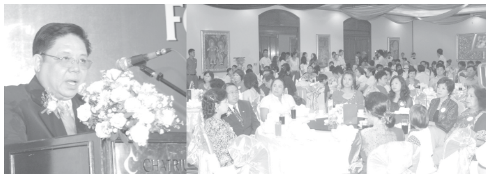
Ta-Fa Trading Co Ltd introducing new Follow Me & Secret Beauty Products.

YANGON, 23 March—The 15 th AGM of Myanmar Forest Product and Timber Merchants Association first cancelled for various reasons was postponed to 5 pm on 28 March at International Business Centre (I.B.C) on Pyay Road here and members are invited to attend it without fail.