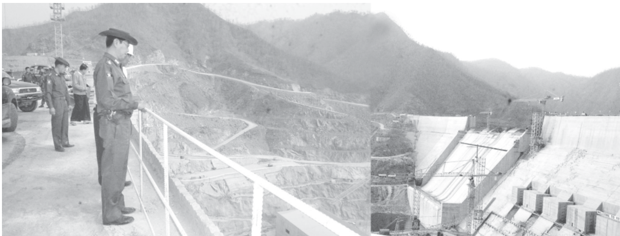
Maj-Gen Ohn Myint of the Ministry of Defence looks into Yeywa Hydropower Project.

NAYPYITAW, 23 March — Maj-Gen Ohn Myint of the Ministry of Defence inspected Yeywa hydropower project on 20 March.