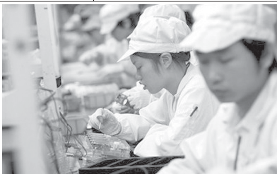
Workers produce the Chinese-made handsets "Spice" at a semi-hightech factory in Shenzhen, southern China's Guangdong province on December 2008. Wen Jiabao has urged businesses to focus on upgrading and innovation to help ride through the global financial crisis, state media has reported.