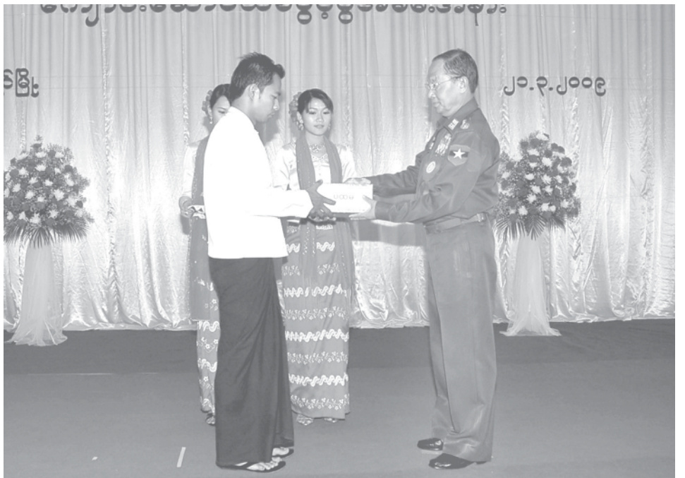
Chairman of Myanmar Education Committee Secretary-1 of the SPDC Lt-Gen Thiha Thura Tin Aung Myint Oo presents prize to first prize winner in Essay Contest.

Mon State is well-known for its fertile land and water resources. Some 900,000 acres have been put under monsoon paddy and over 130,000 acres under summer paddy.