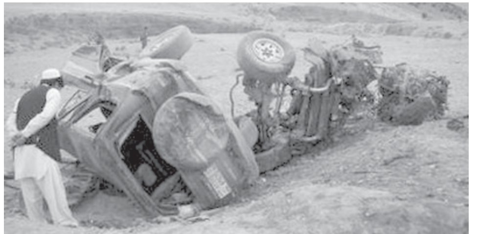
An Afghan man looks at the site of a suicide car bomb blast in Khost Province on 21 March, 2009.