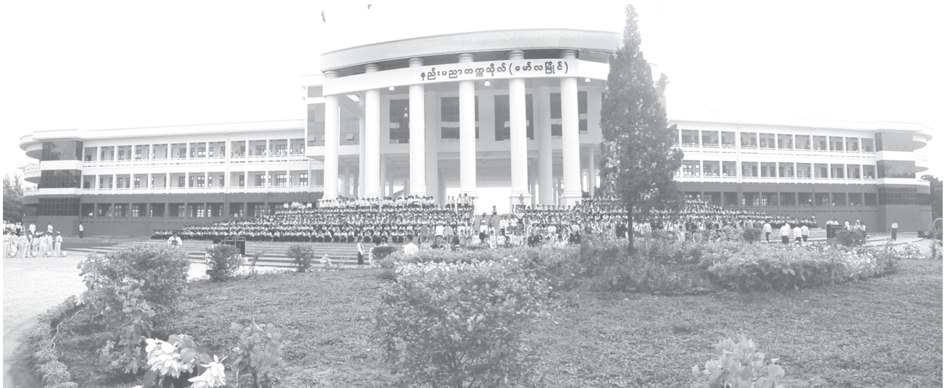
New building of Technological University (Mawlamyine).