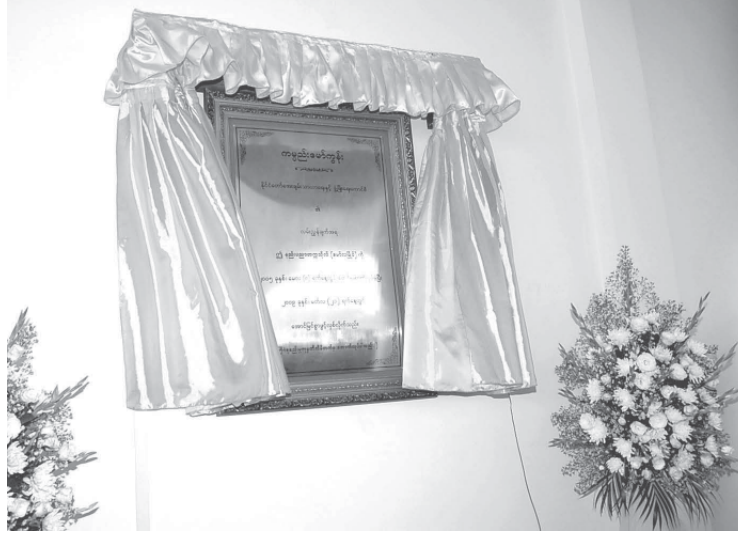
Chairman of Myanmar Education Committee Secretary-1 of the SPDC Lt-Gen Thiha Thura Tin Aung Myint Oo unveils the stone plaque of Technological University (Mawlamyine).

Next, the Secretary-1 unveiled the stone plaque of the university.