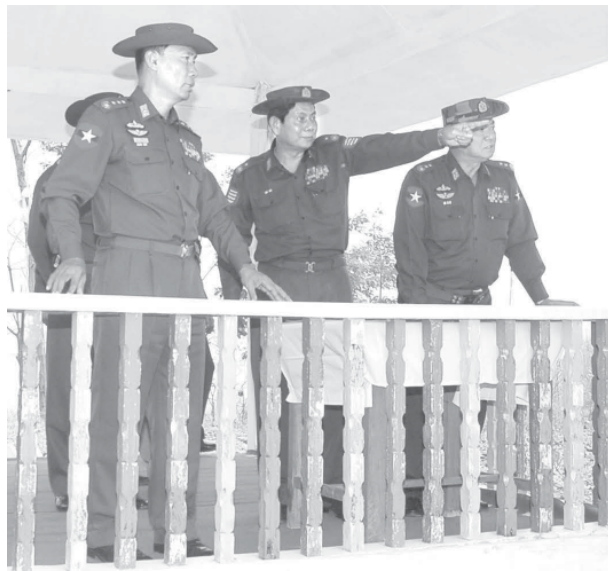
Member of the SPDC General Thura Shwe Mann inspects Ma De dam project on Kamma.

Afterwards, General Thura Shwe Mann thanked and praised the people of Myaungmya for their generous help for the victims of Cyclone Nargis and said that Ayeyawady Division would become more developed with unity