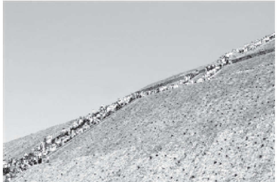
People climb up the Pyramid of the Sun located in the ruins of the pre-Hispanic city of Teotihuacan, 60km (37 miles) north of Mexico City, on 21 March, 2009.