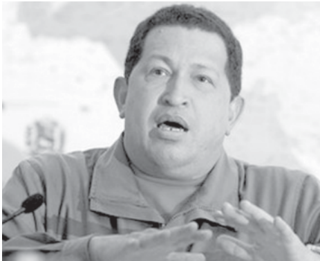
In this photo released by Miraflores Press Office, Venezuela's President Hugo Chavez delivers a speech at the Miraflores presidential palace in Caracas, on 21 March, 2009.

CARACAS, 23 March—Venezuelan President Hugo Chavez on Sunday called President Barack Obama “ignorant,” saying he has a lot to learn about Latin America.