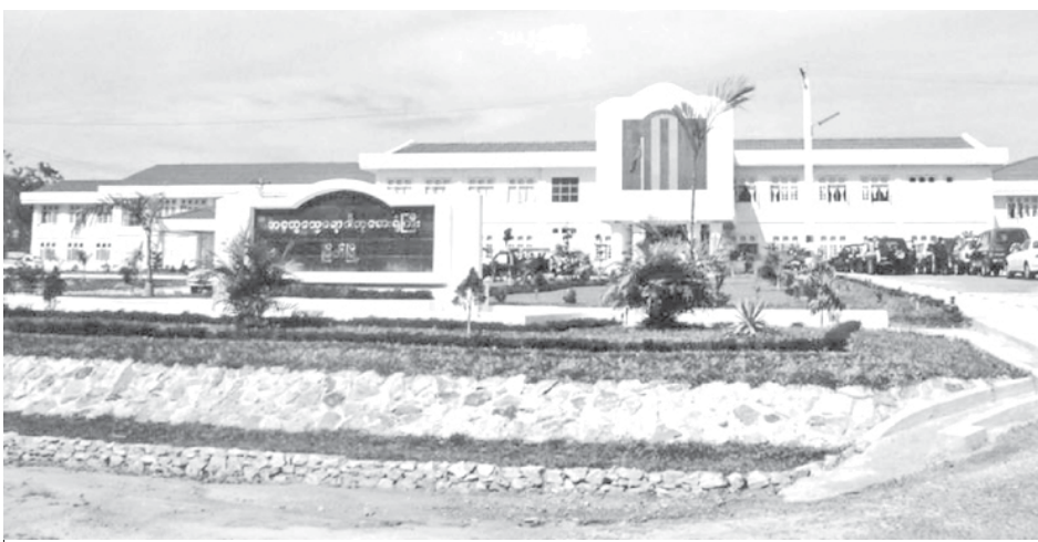
General Hospital in Myeik, Taninthayi Division, built for providing medical care to local people.