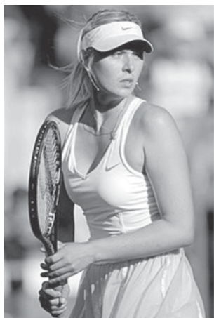
Former world number one Maria Sharapova

The Russian pin-up had hoped to play singles for the first time in Florida since August last year and had warmed-up for a return by playing in doubles at the Indian Wells WTA event last week. But the 21-year-old, who missed the US Open and Beijing Olympics in 2008 as well as this year's Australian Open, has decided the shoulder needs more rest.—INTERNET