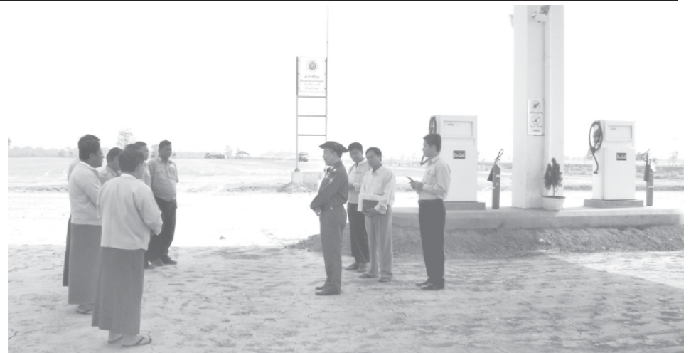
Minister for Energy Brig-Gen Lun Thi inspects No.0194 filling station of Toungoo under Myanma Petroleum Products Enterprise on Yangon-Nay Pyi Taw road section. (News reported)