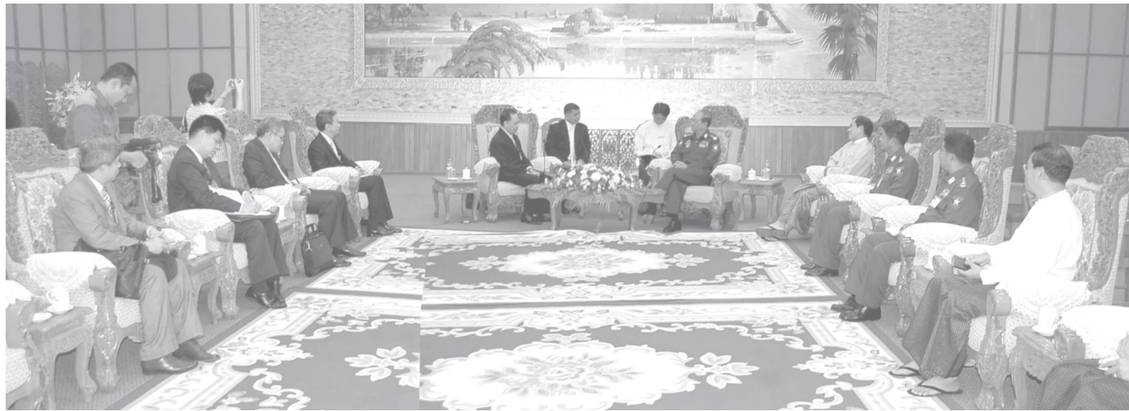
Prime Minister General Thein Sein receives Thai goodwill delegation led by Foreign Minister Mr Kasit Piromya.