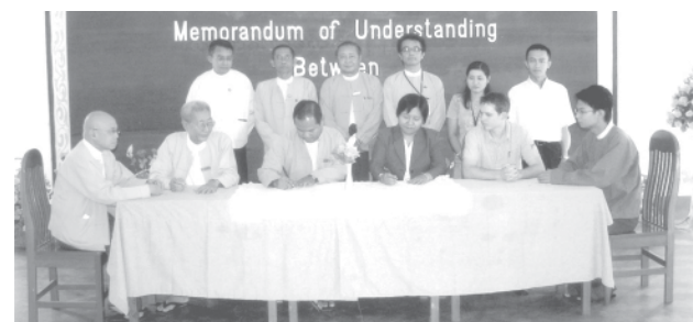
Myanmar Forest Product and Timber Merchants Association and CVT sign MoU on conducting of proficiency courses.

YANGON, 23 March — Jointly organized by the Myanmar Forest Product and Timber Merchants Association and Centre for Vocational Training (CVT), a ceremony to sign Memorandum of Understanding on conducting proficiency courses was held at the Wood Based Technical Training School of the association on Pinlon Street in Dagon Myothit (North) Township on 21 March morning.