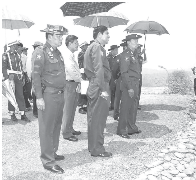
Member of the SPDC General Thura Shwe Mann looks into Kanyin dam project.