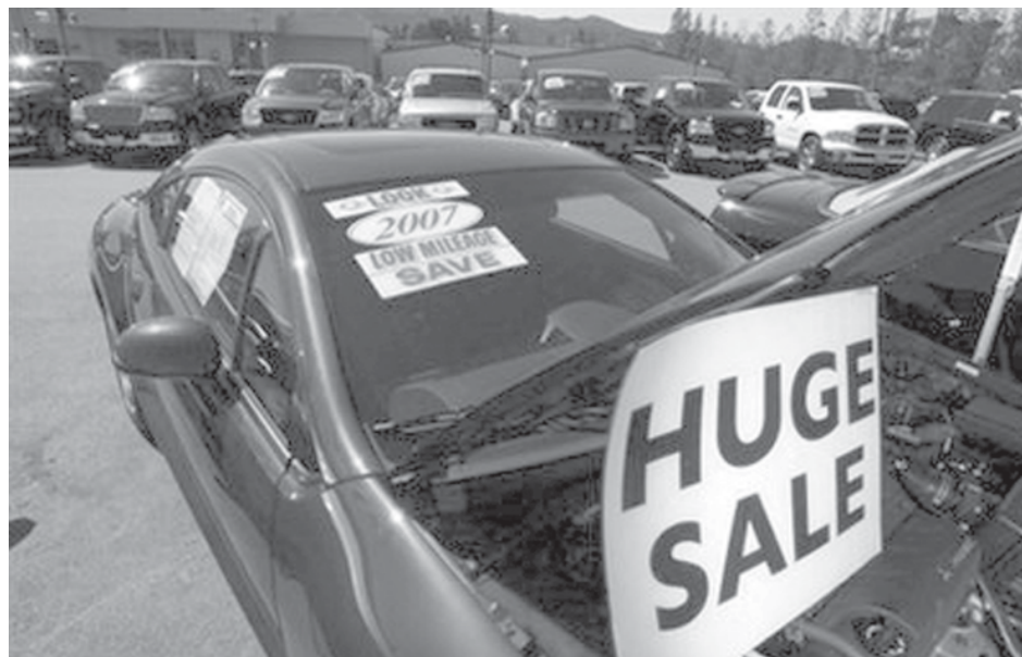
A used car lot tries to attract customers in California. US President Barack Obama defended his budget plans Saturday, insisting that he remained committed to halving the deficit within four years despite new data showing it was bigger than expected.