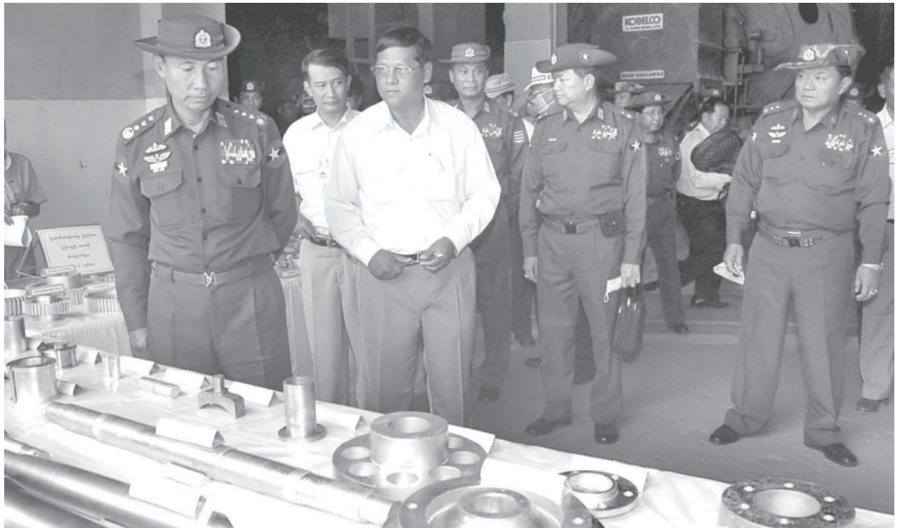
Member of the SPDC General Thura Shwe Mann inspects Kyangin cement plant.

strength of the State, the people and the Tatmadaw. Therefore, the government on its part needs to work hard ambitiously. The Tatmadaw on its part needs to serve the State and the people in a loyal manner. The people on their part need to work harmoniously with understanding and cooperation.