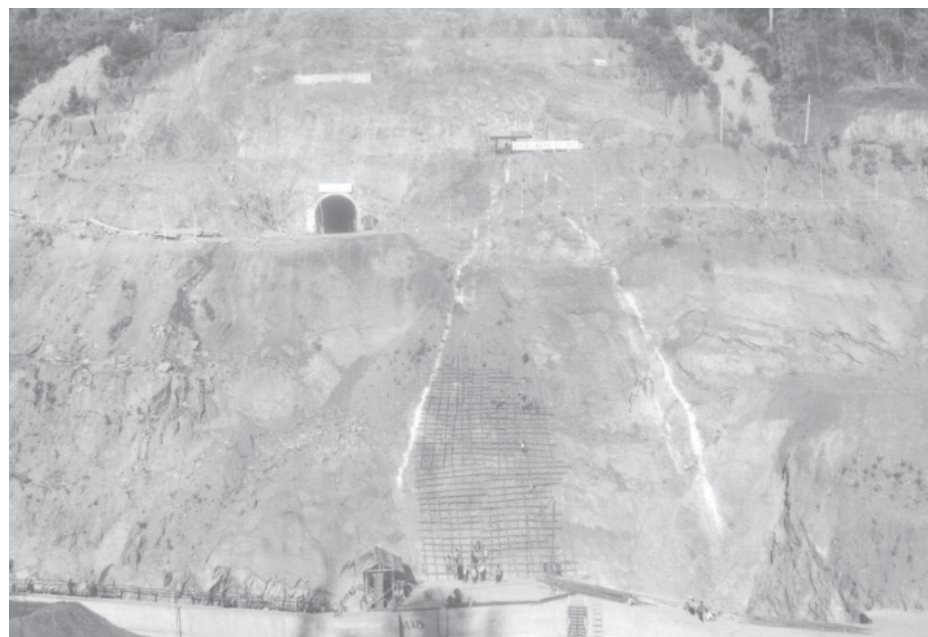
A water intake tunnel seen at rocky mountain.