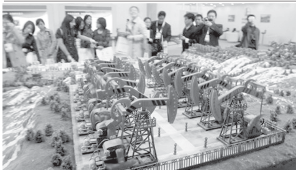
Visitors view energy saving and emission reduction models of oil factories during the China International Energy Saving, Emission Reduction and New Energy Science and Technology Expo at the Beijing Exhibition Center in Beijing, capital of China, on 19 March, 2009.