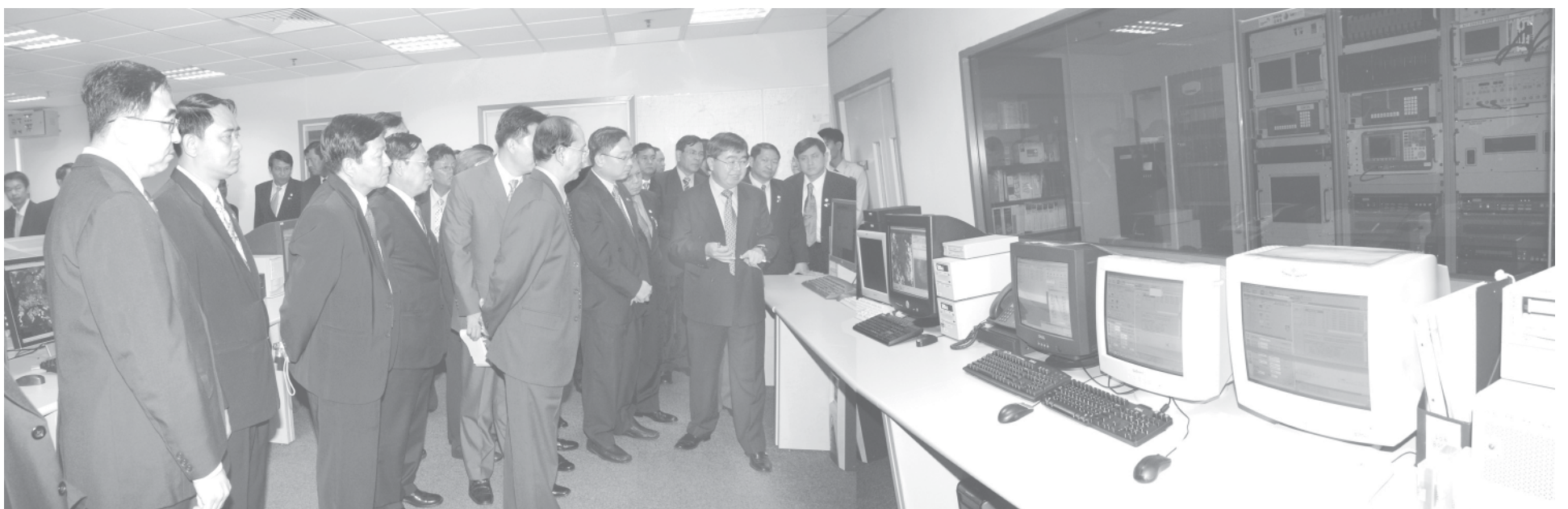
Prime Minister General Thein Sein observes acquiring data through satellite at Centre for Remote Imaging, Sensing and Processing in National University of Singapore.