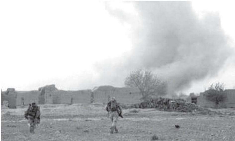
Canadian soldiers from the NATO-led coalition run for cover after an IED (Improvised Explosive Device) explosion during a mission in the Taliban stronghold of Zhari district in Kandahar province, southern Afghanistan, on 20 March, 2009.

There was no way to independently verify the toll. "This engagement was yet another blow to the militants, who are quickly losing their ability to operate in Helmand Province," a coalition spokesman said in the statement.—Internet