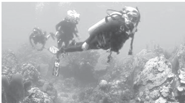
Coral reefs from around the Caribbean.

OTTAWA, 20 March — By combining data from 48 studies of coral reefs from around the Caribbean, researchers have found that fish densities that have been stable for decades have given way to