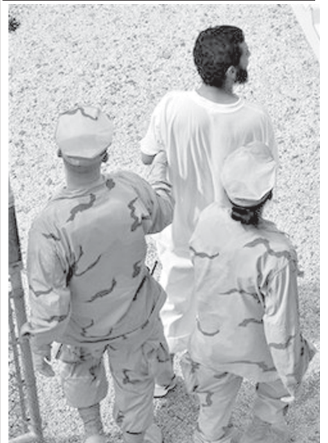
In this image reviewed by the US Military, a Guantanamo detainee is escorted by guards at Camp 4 detention facility, at the US Naval Base, in Guantanamo Bay, Cuba, on 18 Nov, 2008.