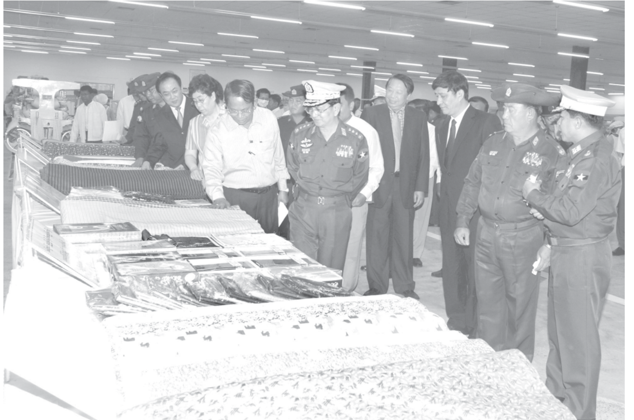
Prime Minister General Thein Sein inspects products of Myanma Textile Industries on display.

As individual requirements of the people are food, clothing and shelter, Myanmar has achieved not only food sufficiency but also surplus food. Myanmar has favourable climate and natural resources such as wood and bamboo. One should not worry about the shelter need because construction materials such as bricks, sand, granite and cement are available in the country.