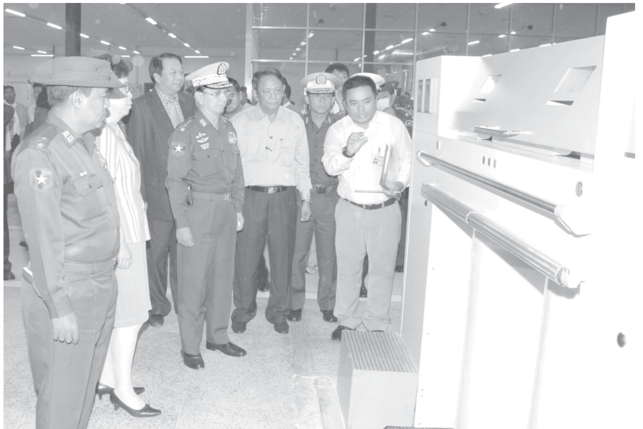
Prime Minister General Thein Sein inspects running of machines at Textile Factory (Pyawbwe).—MNA