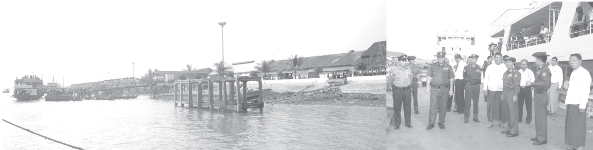
Lt-Gen Myint Swe of Ministry of Defence inspects Lanthit Jetty in Yangon.