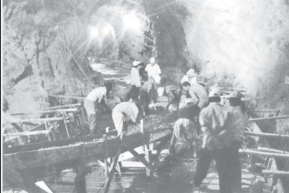
Engineers and skilled workers constructing water intake tunnel.