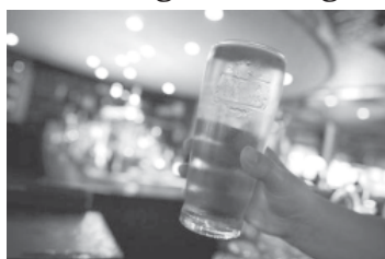
A customer poses for the camera with a pint of beer in a public house in Leeds, northern England.

The advice, which would be non-binding on