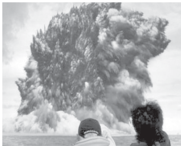
People look at an eruption of an underwater volcano in Hunga Ha'apai, Tonga on 18 March, 2009. The eruption is only 34 nautical miles off the coast of Tonga's capital Nuku'alofa. Picture taken on 18 March, 2009.

The Hawaii-based Pacific Tsunami Warning Center issued a tsunami warning for Tonga and neighbouring islands, and reported that sea level readings confirmed that a potentially destructive tsunami wave was generated by the quake.— Internet