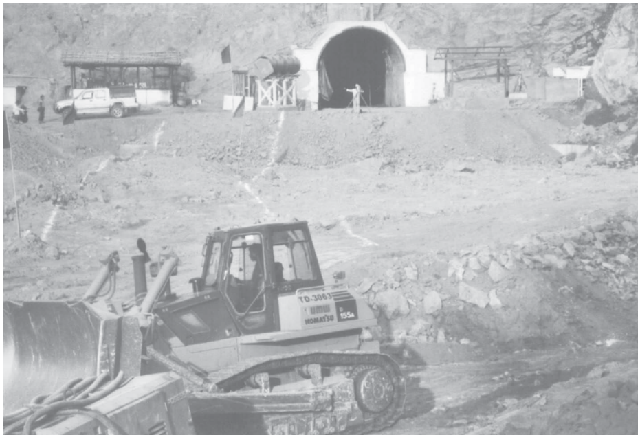
Heavy machinery being used in construction of a tunnel at Nancho Hydropower Project.

At present, the temporary dyke, the conduits and the water control lake are under construction. The target was set to complete the project by the year 2010 and to yearly generate 152 million kilo-