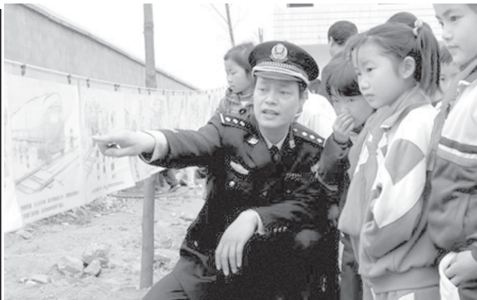
A police officer explains the cartoon posters of railway safety to pupils at a primary school in Hougang Town of Leping City, east China's Jiangxi Province, on 19 March, 2009.