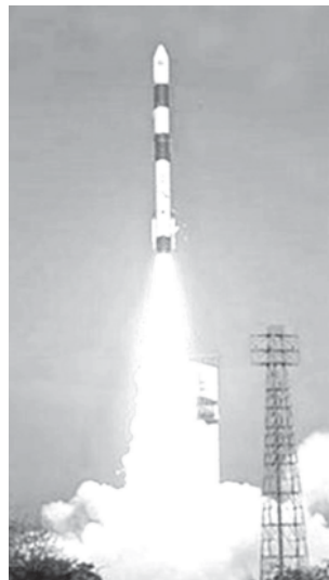
This handout photograph from the Indian Space Research Organisation (ISRO) shows the launch of an Israeli Techar satellite by an Indian-made rocket from the Sriharikota space station in January 2008. India has bought a spy satellite from Israel with day-and-night viewing capability to boost surveillance capabilities in the aftermath of the Mumbai militant attacks, a report said Friday.

The Satish Dhawan Space Center is used by the ISRO to launch satellites using multi-stage rockets such as the Polar Satellite Launch Vehicle and the Geosynchronous Satellite Launch Vehicle.