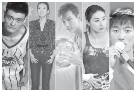
From left to right, Yao Ming, Zhang Ziyi, Yi Jianlian, Guo Jingjing and Liu Xiang.