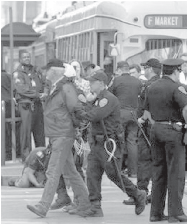
A protestor (L) is led away by police after being arrested for blocking street car traffic on Market Street during a demonstration on the sixth anniversary of the war in Iraq, in San Francisco, California on 19 March, 2009.