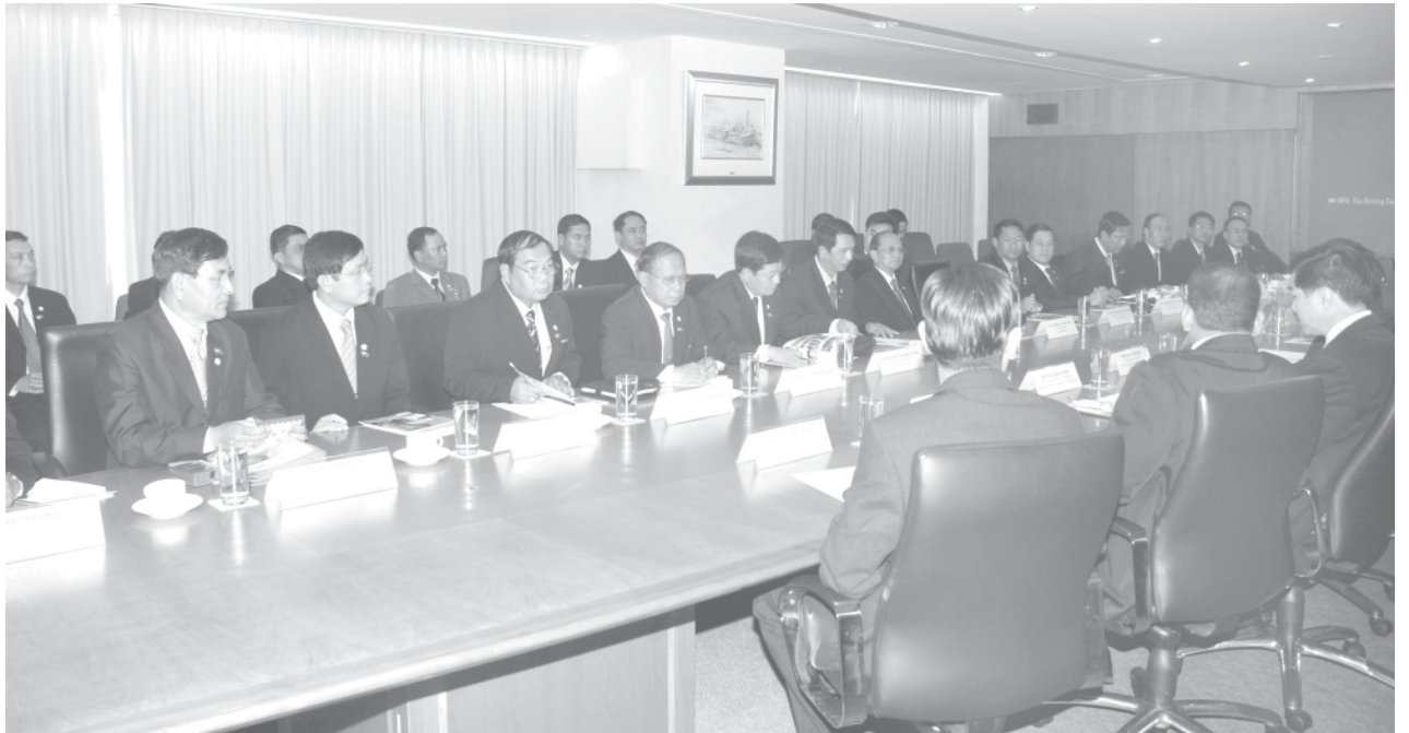
Prime Minister General Thein Sein meets with officials concerned of Maritime Port Authority of Singapore at Singapore Port.