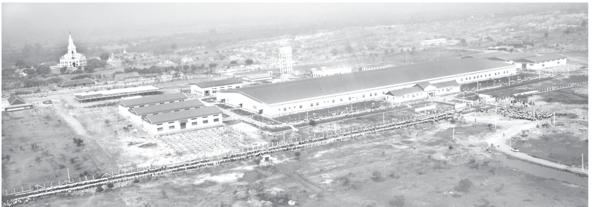
An aerial view of Textile Factory (Pyawbwe) of Myanma Textile Industries under the Ministry of Industry-1.