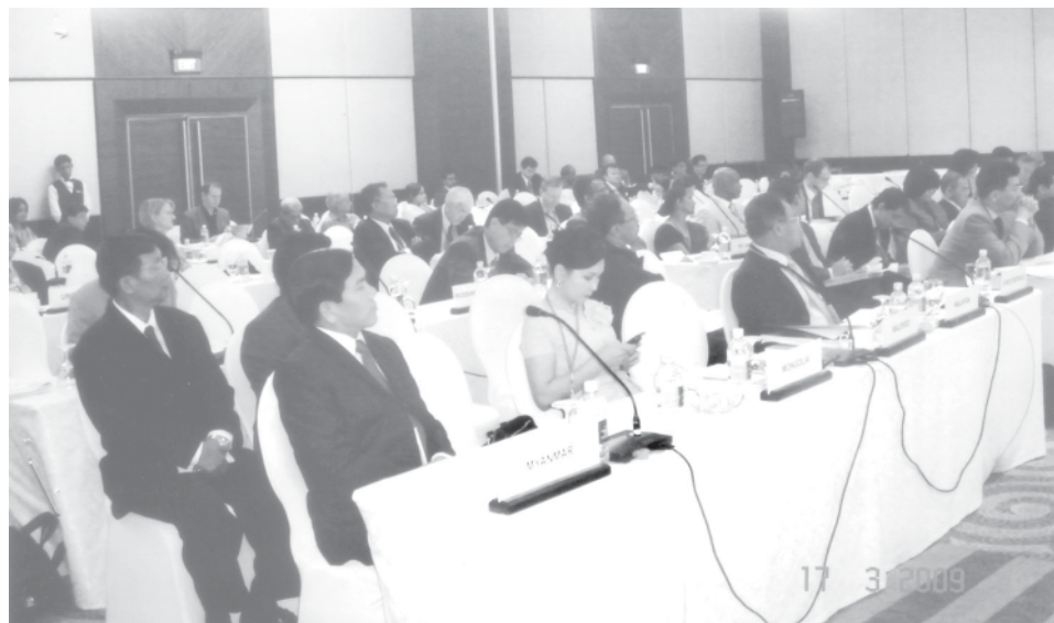
Minister U Nyan Win attends South Asia Regional Ministerial Meeting in Colombo, Sri Lanka.—MNA

During the visit, Foreign Minister U Nyan Win together with the