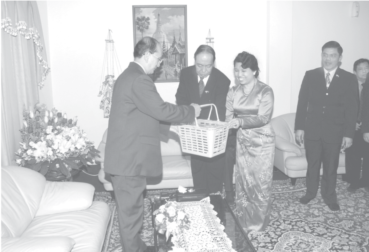
Prime Minister General Thein Sein presents gifts to the ambassador and wife and staff families of Myanmar embassy in Singapore.