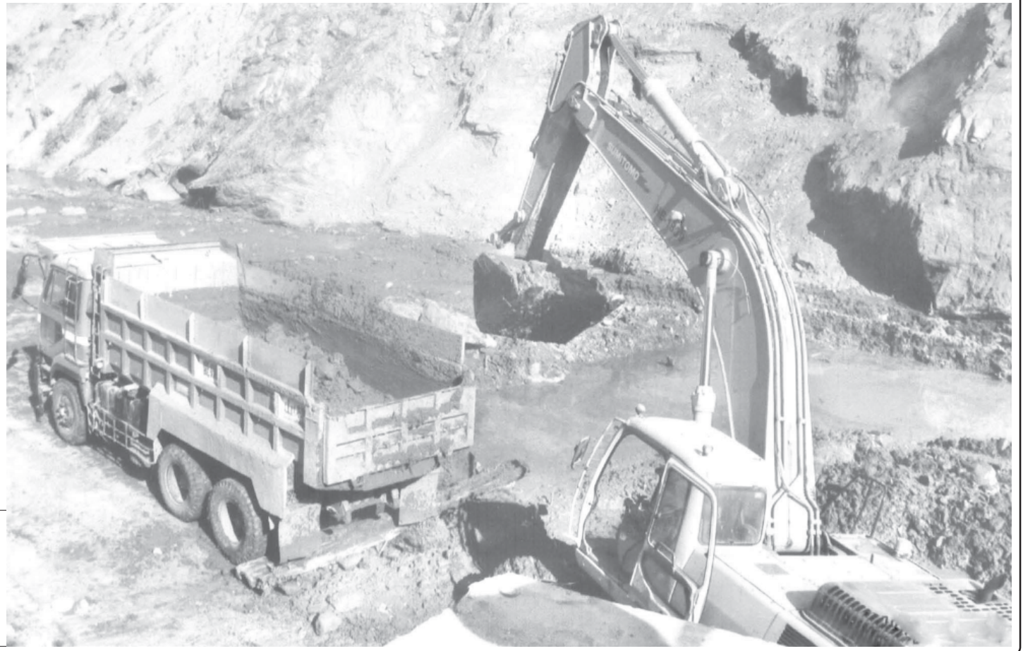
Heavy machinery seen at worksite of Nancho Hydropower Project, east of Nay Pyi Taw Pyinmana.