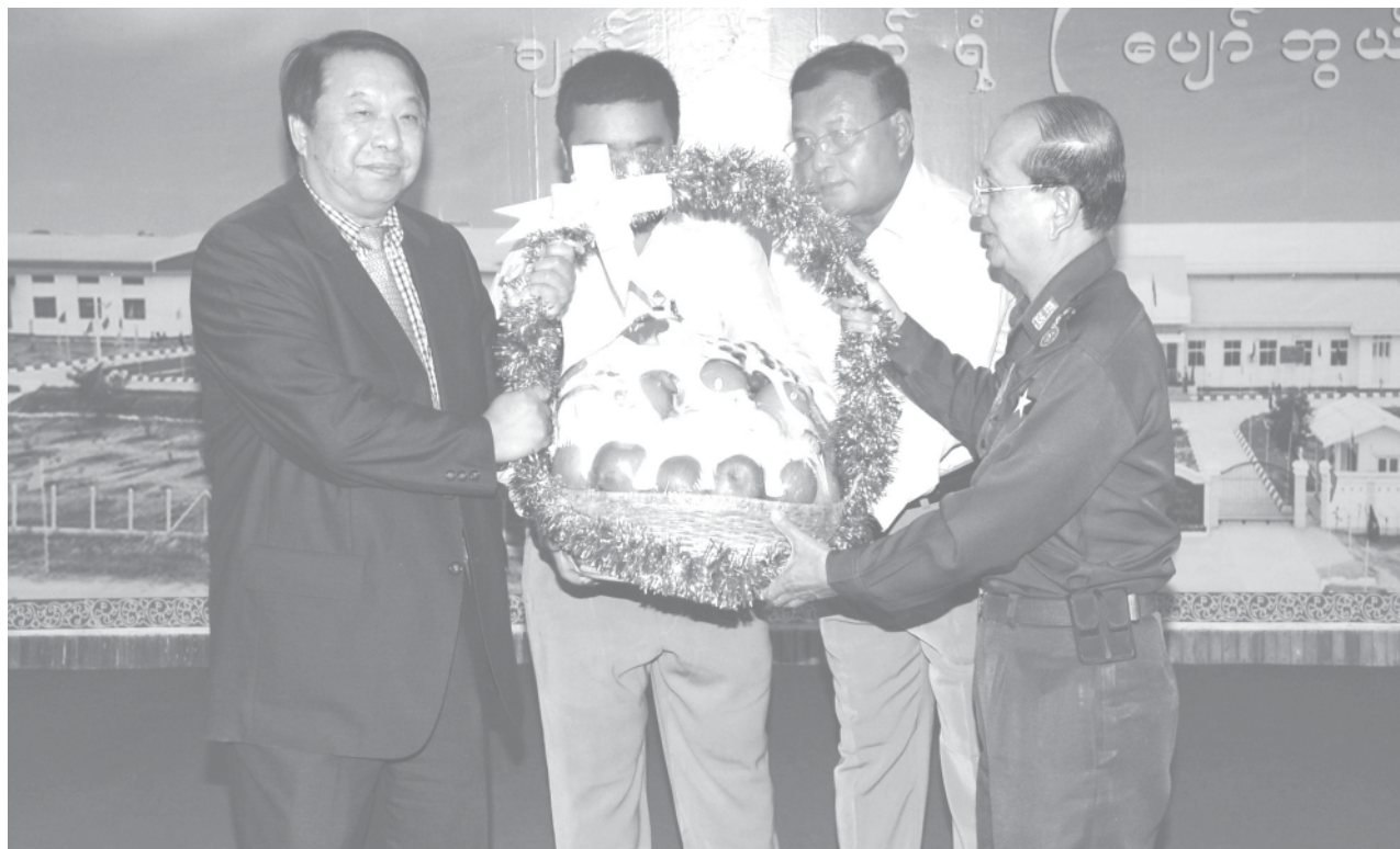
Prime Minister General Thein Sein presents fruit basket to Chinese technicians. (News on page-1)—MNA