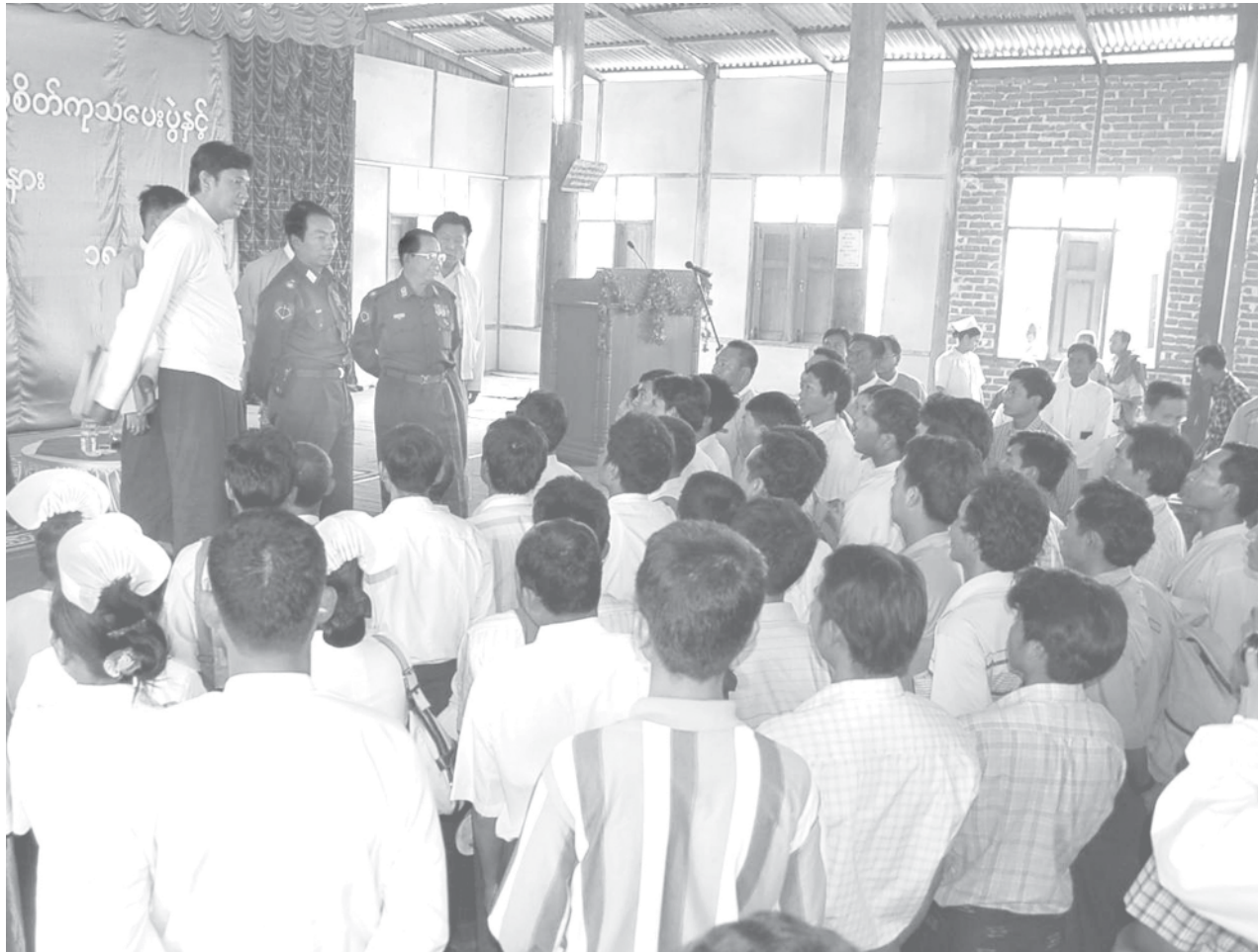
Commander Maj-Gen Myint Soe and Minister Brig-Gen Kyaw Hsan greet local people at the ceremony to give free medical treatment to eye patients in Monywa District, Sagaing Division.

People are to continue to cooperate with the government in building a peaceful, modern and developed nation