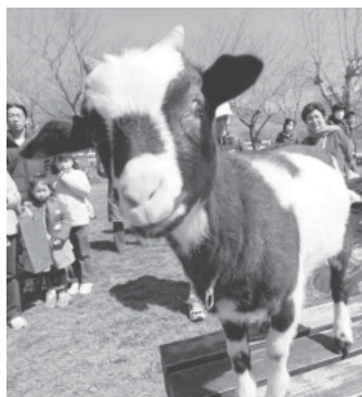
A cow lookalike billy goat named 'Ushika' is on display at Yume Bokujyo, or Dream stock farm, in Narita, east of Tokyo, Japan. The name of the three-month old goat is translated from the Japanese "Are you a cow?"

An elderly man who was with the woman suffered minor injuries from trying to hold open the car door. The incident occurred in the town of Narrabundah. Police were searching for the suspect.