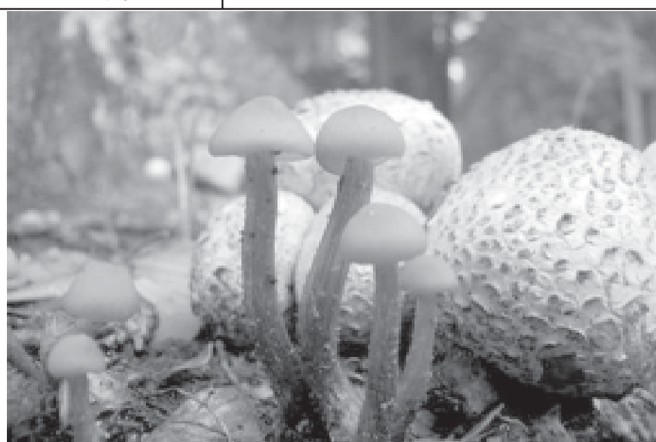
An Australian researcher has said that Chinese women who ate mushrooms and drank green tea significantly cut their risk of breast cancer and the severity of the cancer in those who did develop it.