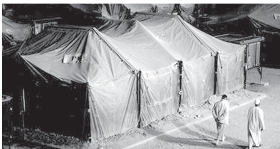
Detainees walk at a US military detention facility Camp Bucca, Iraq. The United States aims to shut down its largest detention center, Camp Bucca, by 2010.—INTERNET