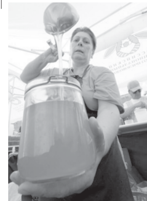
A vendor pours honey into a jar during an annual handmade products market near the Kremlin, central Moscow on 13 Aug, 2007.