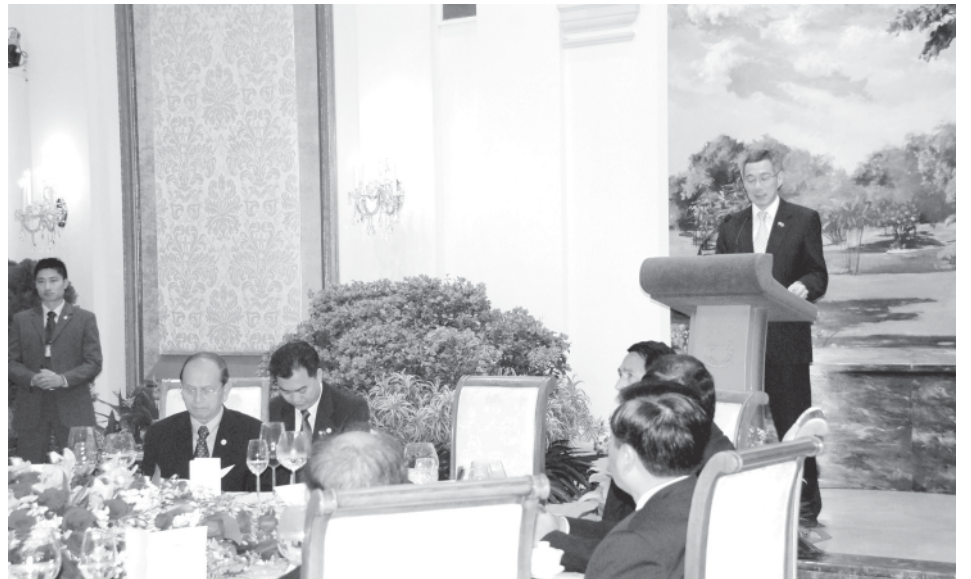
Singaporean Prime Minister Mr Lee Hsien Loong speaks at dinner hosted in honour of Myanmar delegation at Istana Presidential Palace in Singapore.

NAY PYI TAW, 19 March—Prime Minister of the Republic of Singapore Mr Lee Hsien Loong hosted a dinner in honour of the visiting Myanmar delegation led by Prime Minister General Thein Sein at the Presidential Palace in Singapore on 17 March evening.