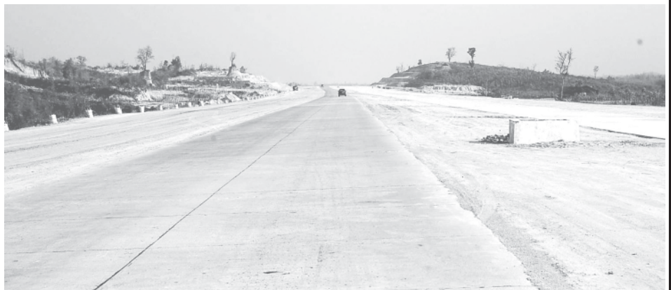
Progress of Two-Way/Two-Lane concrete section on Yangon-Nay Pyi Taw Road section.

The project needs 2.25 million tons of cement, 1.25 million tons of iron rods, 72 million gallons of fuel, 203,300,000 cubic feet of different types of rock and gravels. So far, the project has consumed 1.7 million tons of cement, over 90,000 tons of iron rods, over 40 million gallons of fuel, and 140,000,000 cubic feet of rock and gravels.