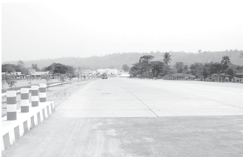
Two-Way/Two-Lane concrete road section near Myochaung Village on Yangon-Nay Pyi Taw Road section.

"As foundations of the bridges, we used nine feet diameter piles, 16" x 16" piles, 0.8 meter diameter mini-bore piles