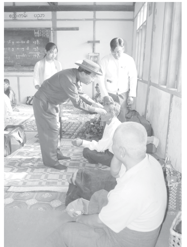
Minister Brig-Gen Kyaw Hsan puts eye glasses on an eye patient.

Minister for Information Brig-Gen Kyaw Hsan, local authorities and specialists performed supervision for convenient stay of the patients, cordial greeting with the patients, free providing of eye glasses to the patients, giving encouragement to the officials and social organizations that assisted the patients, daily meeting with patients from 11 townships at the hospital, encouraging the health staff, comforting the patients at the eye tests, giving glasses to the patients free of charge, greeting the specialists at the eye surgical operations