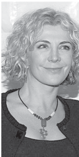
Actress Natasha Richardson has died following a ski accident, a spokesman for her actor husband Liam Neeson said in a statement on Wednesday.

NEW YORK, 19 March—Actress Natasha Richardson has died, according to a spokesman, two days after the daughter of British theater icon Vanessa Redgrave apparently suffered brain damage in what was initially dismissed as a minor ski accident.