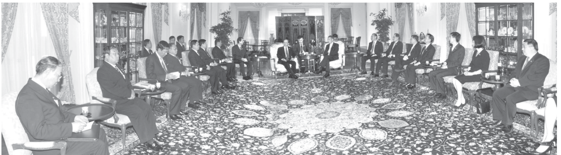
Myanmar delegation led by Prime Minister General Thein Sein holds a meeting with Singaporean Prime Minister Mr. Lee Hsien Loong at Istana Presidential Palace in Singapore.

NAY PYI TAW, 19 March—Members of the Myanmar delegation led by Prime Minister General Thein Sein held a meeting with Singaporean Prime Minister Mr Lee Hsien Loong at the meeting room of Istana Presidential Palace in Singapore at 2.15 p.m., on 17 March.