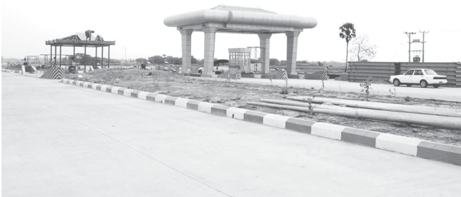
Construction of Toll Gate near Yangon No. 3 Junction on Yangon-Nay Pyi Taw Road section.

hill. Then, we removed the earth from the hill with bulldozers and excavators and it took us a long time. We had to make two geotextiles to fill the lake with earth at milepost number 84 near Danyingon Village and the 15 feet deep lake at milepost number 116 near the Pyu Creek.