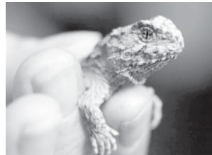
In this photo released by the Karori Wildlife Sanctuary, a baby tuatara is held by a staff at the Karori Wildlife Sanctuary in Wellington, New Zealand, on 19 March, 2009.