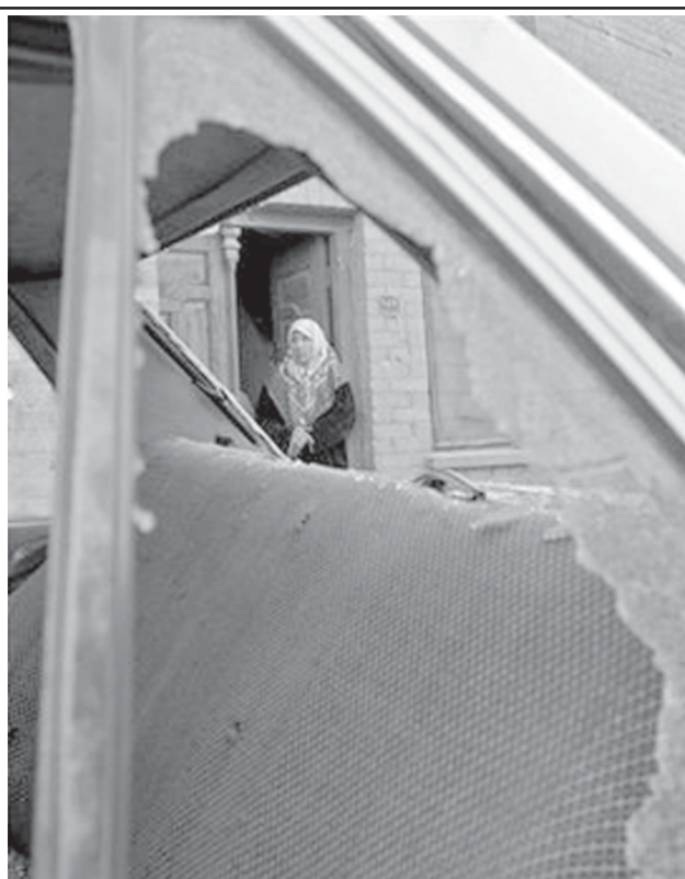
An Iraqi woman inspects her damaged car after a mortar attack in Baghdad, Iraq, on 18 March, 2009.