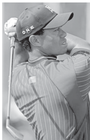
Tiger Woods watches his approach shot to the green during the second day of play in the annual Tavistock Cup golf tournament in Orlando, Fla. on 17 March, 2009.