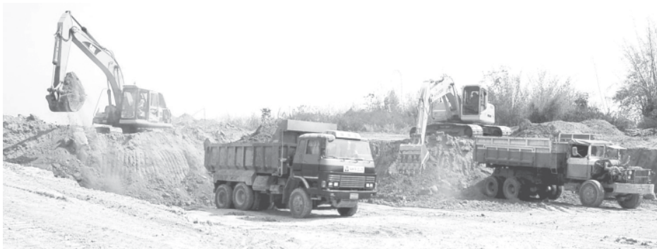
Land preparations on construction of Nay Pyi Taw C Junction-Pantin road section in progress.