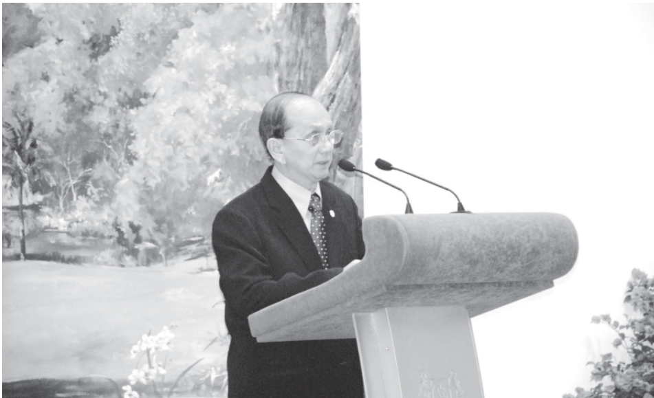
Prime Minister General Thein Sein speaks at dinner hosted in honour of Myanmar delegation at Istana Presidential Palace in Singapore.