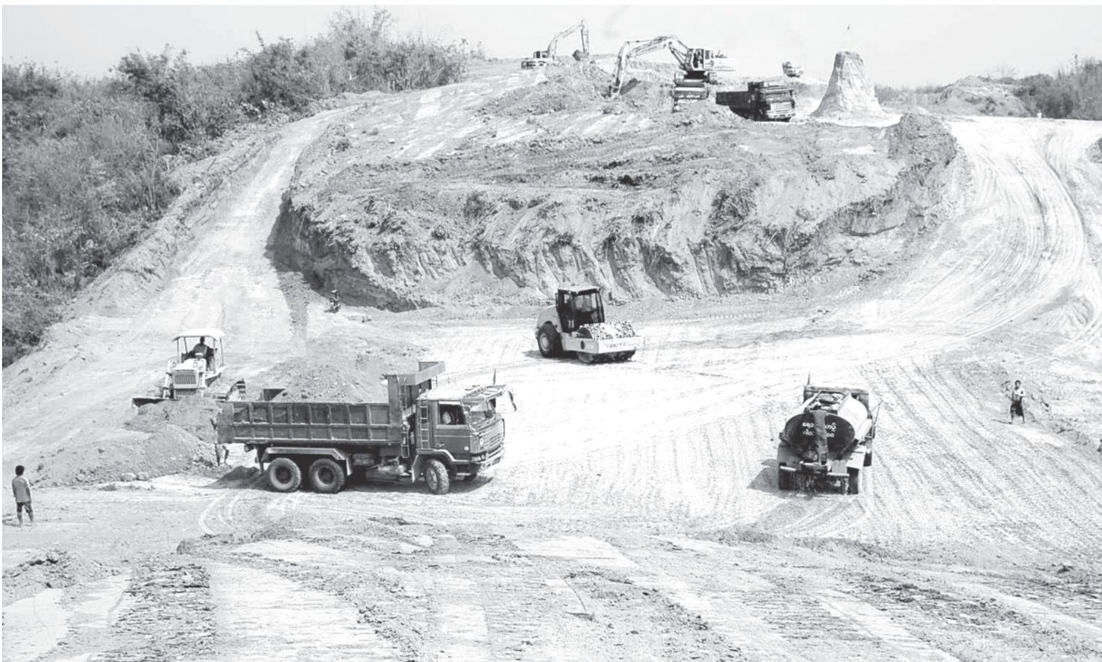
Heavy machinery at work to level the ground for construction of the expressway.