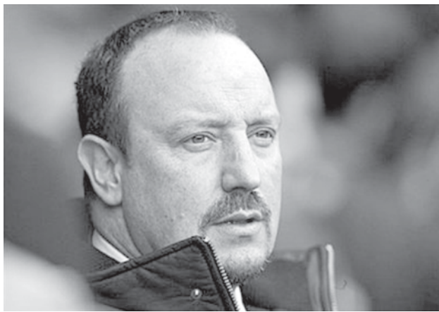
Liverpool manager Rafael Benitez.