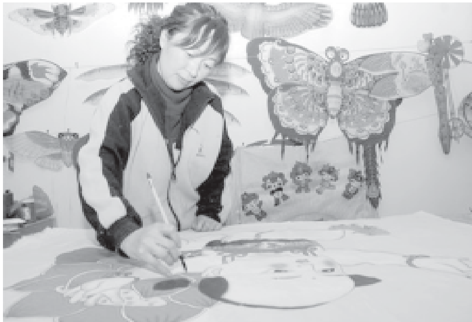
A handicraftswoman draws vivid patterns of folklore figures of traditional Chinese New Year paintings on the surface of kites, at Yangjiabu Town, Weifang City, east China's Shandong Province, on 18 March, 2009.