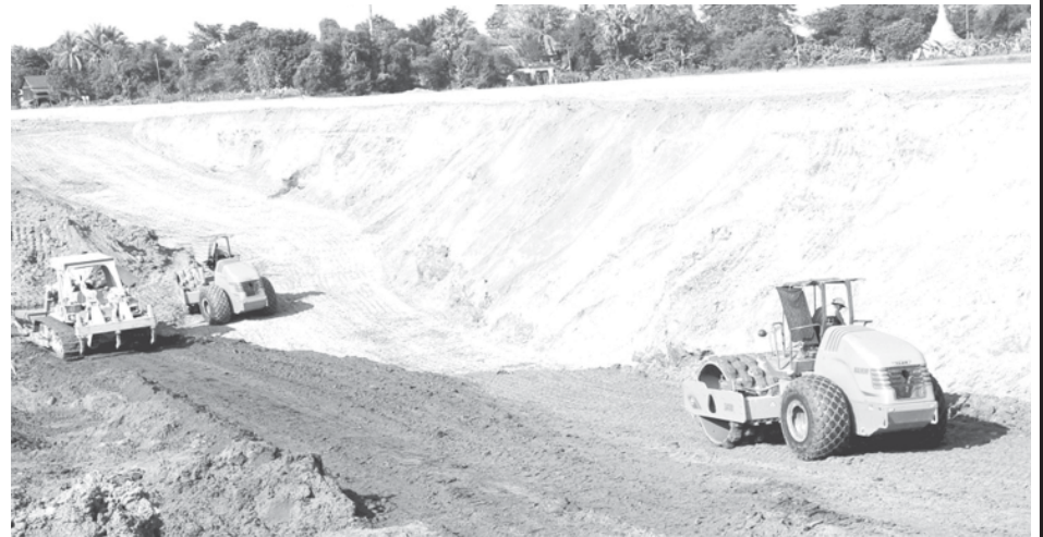
Land preparations on construction of Yangon-Nay Pyi Taw Road section near Myochaung.

restaurant, a car servicing centre, a fuel station, a car park, and a police station.