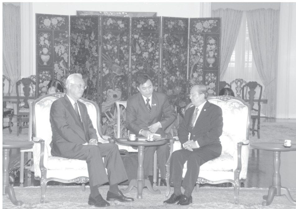
Prime Minister General Thein Sein holds talks with Senior Minister of Singapore Mr Goh Chok Tong at Istana Presidential palace in Singapore.

Afterwards, Prime Minister General Thein Sein said he held talks with the prime minister of Singapore over prospects for bilateral cooperation for development of economic