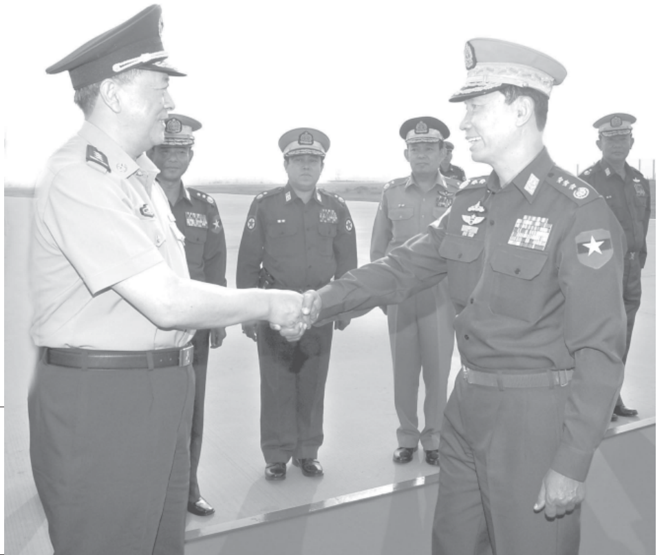
General Thura Shwe Mann bids farewell to Chief of General Staff General Chen Bingde of Chinese People's Liberation Army at Nay Pyi Taw Airport.