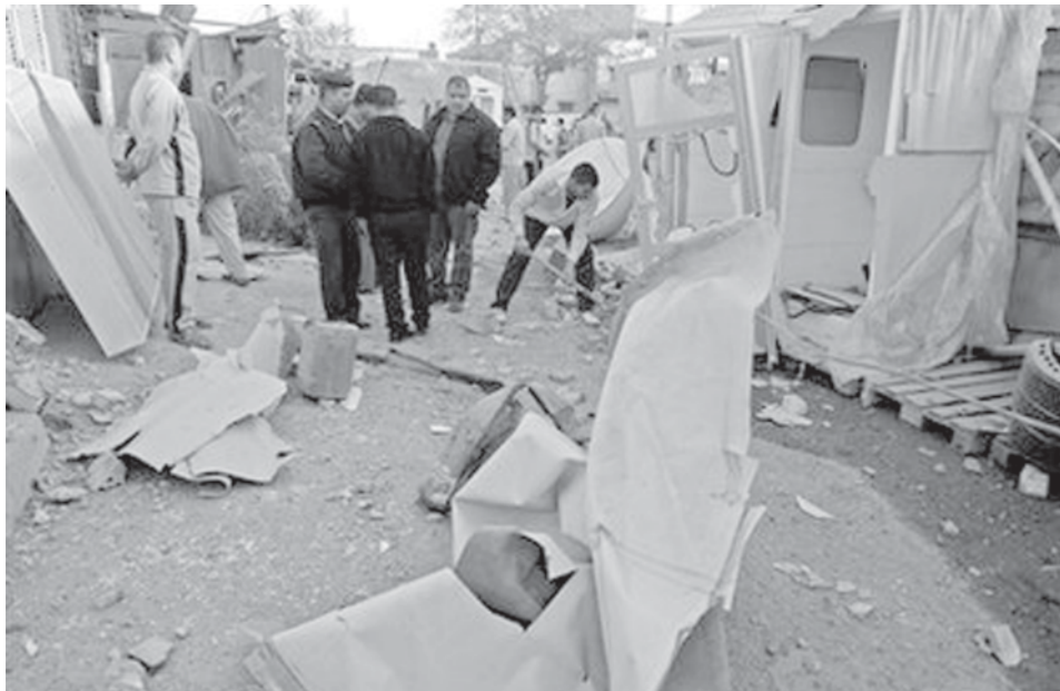
Iraqi men clean up damage in Baghdad, Iraq, on 18 March, 2009 after a mortar attack in Karrada area, downtown Baghdad, on Tuesday, injuring three civilians, police said.