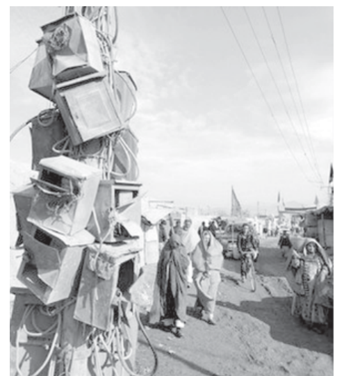
Afghan women walk past electric meter boxes in a residential neighbourhood of Kabul.