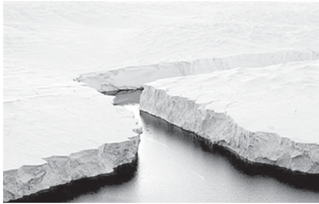
An enormous iceberg (R) breaks off the Knox Coast in the Australian Antarctic Territory in 2008.

OSLO, 19 March—The West Antarctic ice sheet may start to collapse if sea temperatures rise by 5 degrees Celsius (9 degrees Fahrenheit), triggering a thaw that would raise world ocean levels by 5 meters (16 ft), US scientists said.