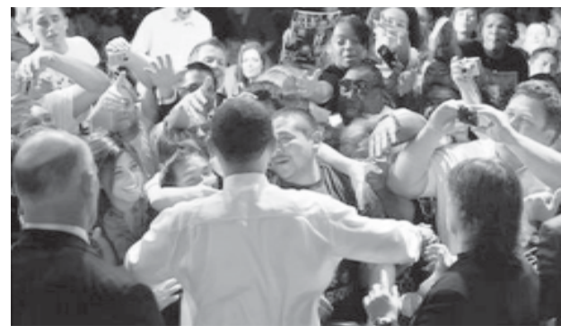
President Barack Obama greets the crowd at the Orange County Fairgrounds in Costa Mesa, California, on 18 March, 2009.

in Southern California, where he said the weather and conversations are much nicer than in Washington. The conversation was more one-sided, to be sure, as he stood before 1,300 frequently cheering people, 2,500 miles from