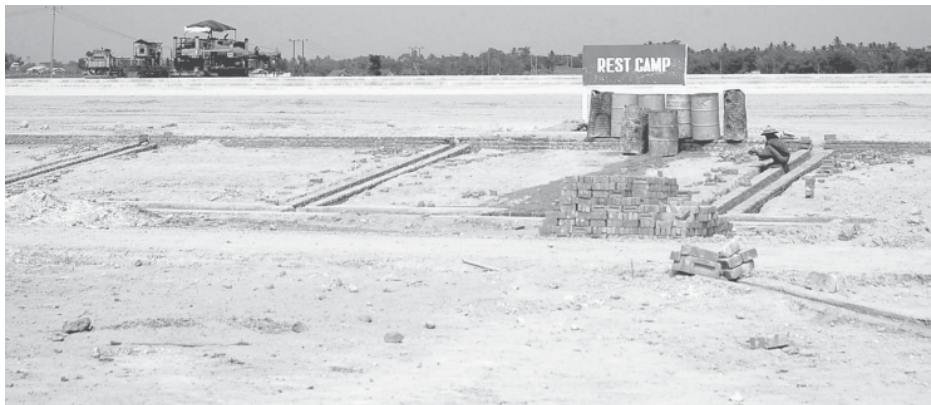
Construction of Rest Camp in progress at Mile Post No. 115/2 near Pyu.

Military Engineer had formed were deployed in the camps to repair the machinery units with mechanical problems.