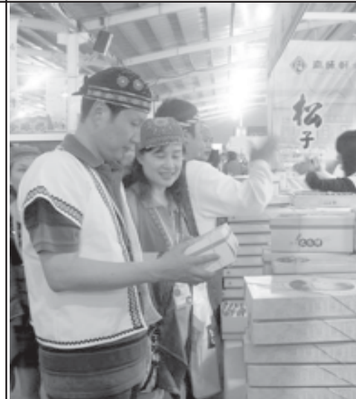
Tourists from the Chinese Mainland in traditional folk garment of Taipei do shopping at the Feng Chia night market in Taichung of southeast China's Taipei Province on 18 March, 2009. Xinhua

Police were called when the plane landed shortly before 7 a.m. and took both mother and child to hospital.—Xinhua