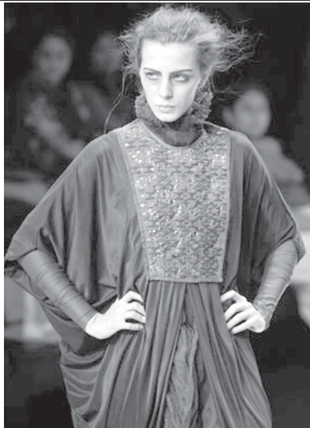
A model presents a creation during the Wills India Fashion Week (WIFW) in New Delhi, capital of India, on 18 March, 2009