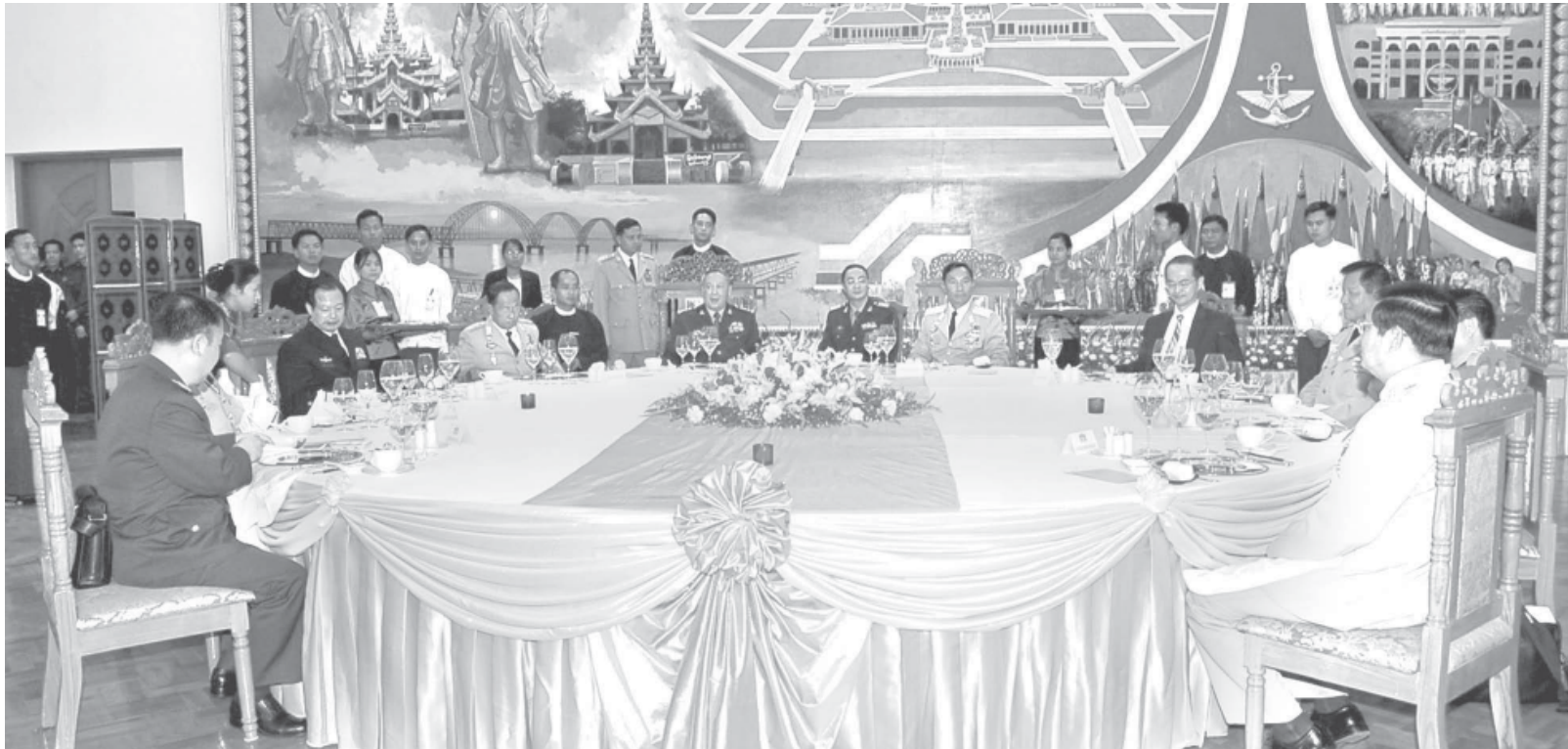
General Thura Shwe Mann of Ministry of Defence hosts dinner in honour of Chinese delegation led by Chief of General Staff General Chen Bingde of the People's Liberation Army of the PRC.