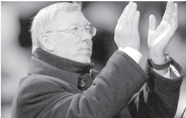
Manchester United manager Sir Alex Ferguson does not believe his team will win an unprecedented five major trophies this season — even though he reckons the current squad is the best he's had during more than two decades at Old Trafford.