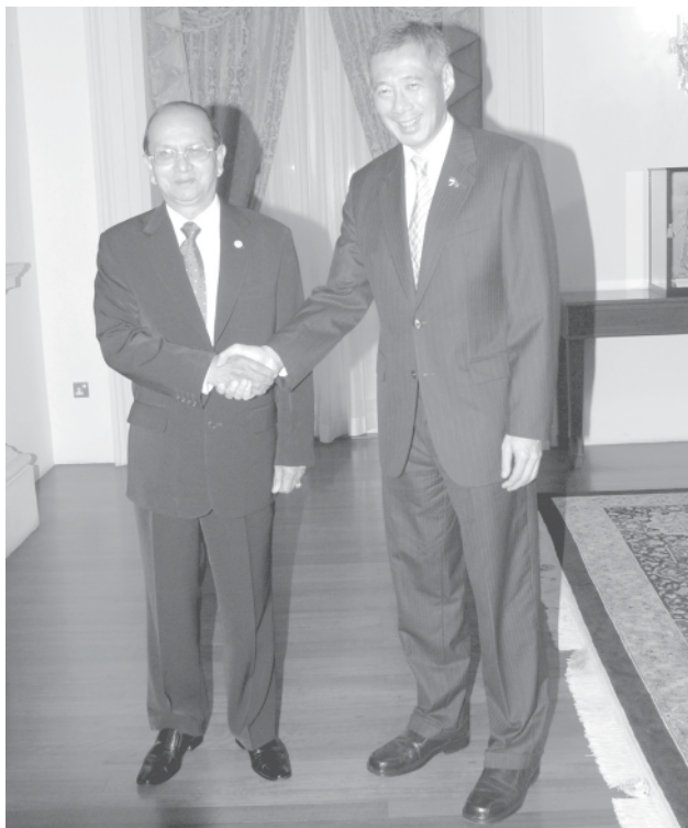
Prime Minister General Thein Sein being welcomed by Singaporean Prime Minister Mr. Lee Hsien Loong at Istana Presidential Palace.