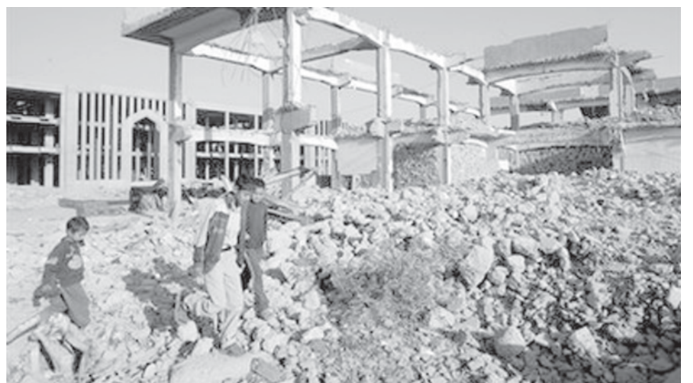
Iraqi boys walk among the debris of the former military base of Al-Rashid in Baghdad, Iraq, on 18 March, 2009.—INTERNET