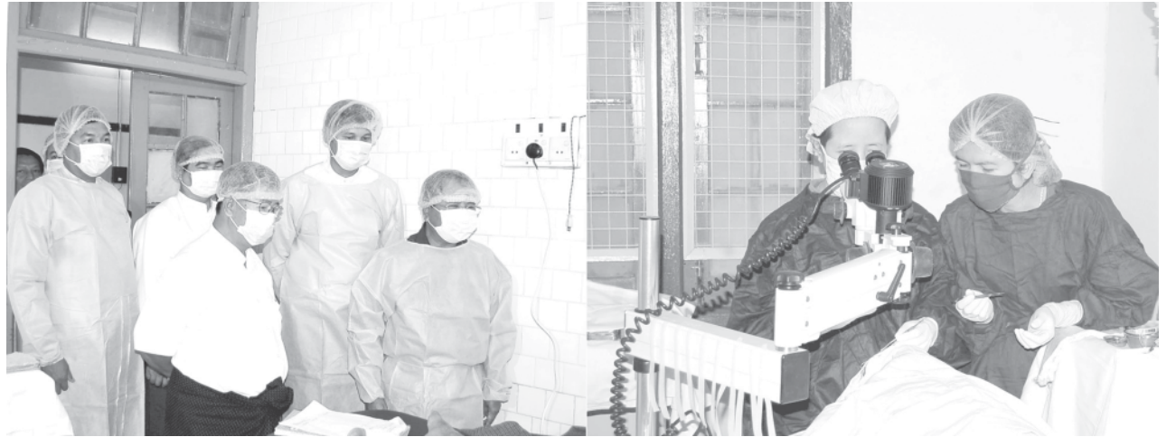
Minister Brig-Gen Kyaw Hsan views giving treatment to eye patients at Pale People's Hospital.

NAY PYI TAW, 19 March—A free eye surgical treatment for eye patients of Monywa District and surrounding areas was given at the People's Hospital in Pale Township from 10 to 18 March.