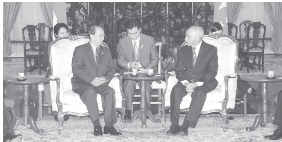
Prime Minister General Thein Sein holds talks with Acting President of Singapore Mr J Y Pillay at Presidential Palace in Singapore.

The remaining work procedures will be implemented according to seven-step road map laid down for the emergence of a democratic nation in future. After that the Acting President said that he arrived at Myanmar recently and found a series of opportunities to carry out economic cooperation. Moreover, he asked for assistance to be provided to hotels running in Myanmar by Singapore. Finally, the Prime Minister said that solutions for difficulties would be sought together within the framework of ASEAN.—MNA