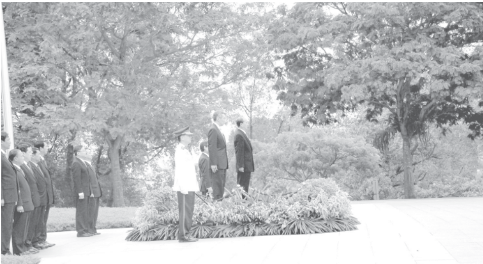
Prime Minister General Thein Sein and Singaporean Prime Minister Mr. Lee Hsien Loong take the salute of the Guard of Honour at Istana Presidential Palace.