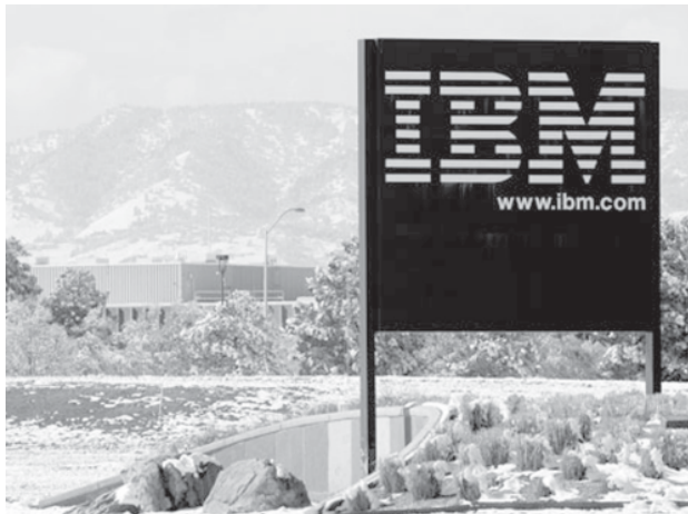
A view of the IBM facility outside Boulder, Colorado on 18 Oct, 2006.