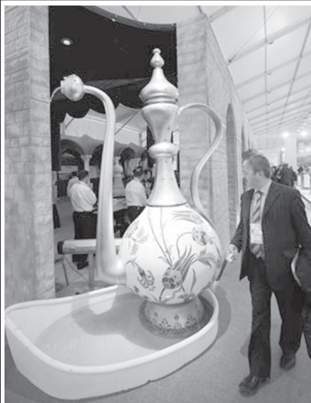
A visitor looks at a huge water jug during a water exhibition of the Fifth World Water Forum in Istanbul of Turkey, on 18 March, 2009.