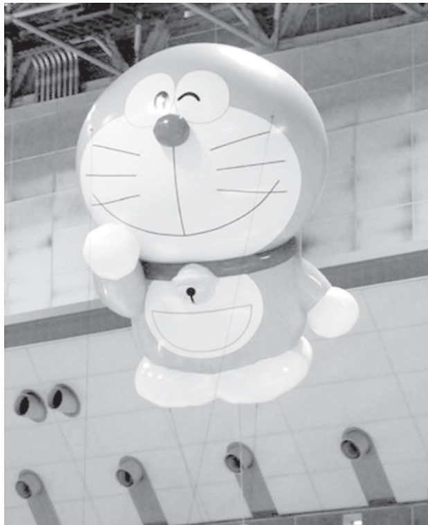
A Doraemon balloon is shown at the Tokyo International Anime Fair, Japan, on 18 March, 2009.

BERLIN, 19 March—One man in Horsens, a small town in German northwestern state of Lower Saxony, killed his wife and at least one of his children, it was reported on Wednesday evening. Three other children were wounded and the husband killed himself thereafter, German news agency DPA said. Among the three wounded, one, aged 15, is the son of the man's neighbor, while the two others are his step son and daughter, aged 14 and 16 respectively. The dead child, aged 8, is the man's own son, and his own daughter, aged 6, escaped from the killing without injury, DPA said.—Xinhua