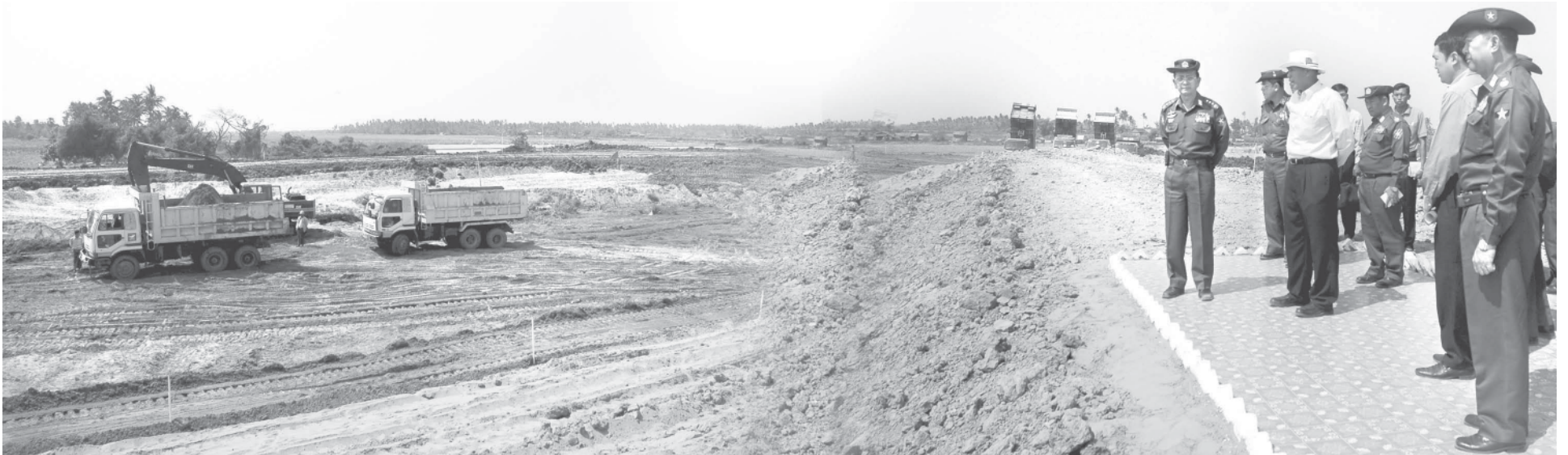
Prime Minister General Thein Sein inspects tasks for construction of Cyclone Shelter by Htoo Trading in Kadonkani Village, Bogale Township.—MNA

NAY PYI TAW, 22 Feb— Chairman of National Disaster Preparedness Central Committee Prime Minister General Thein Sein, accompanied by the ministers, the deputy ministers, the director-general of the Government Office and departmental officials, on 21 February left Yangon yes-