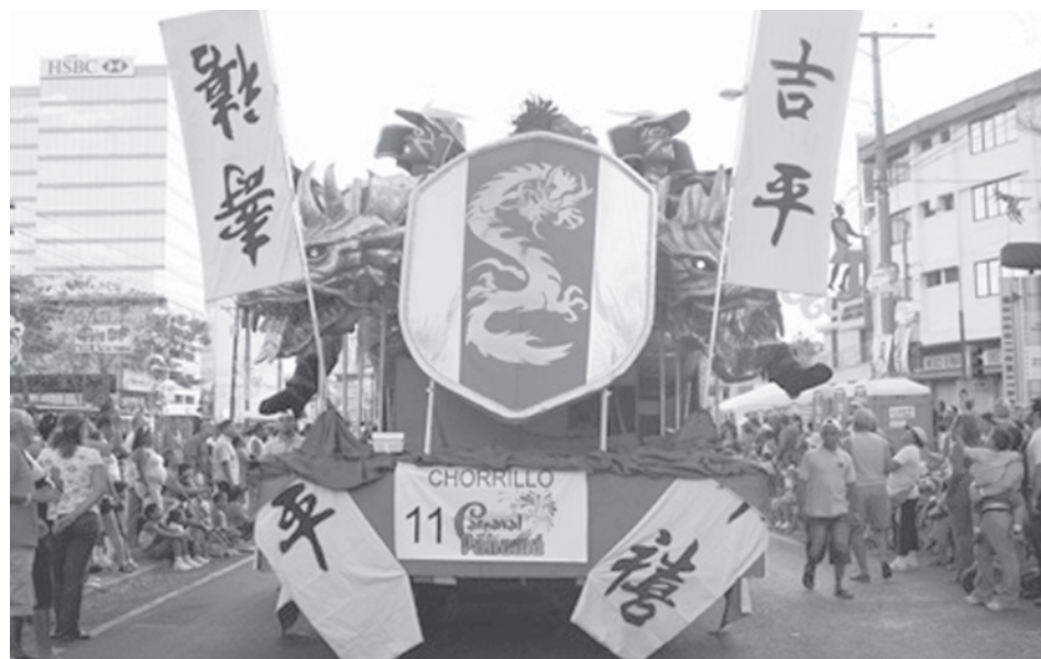
A float with the pattern of Chinese dragon is seen during the carnival parade in Panama City, capital of Panama, on 21 Feb, 2009. The four-day carnival kicked off on Saturday.

"Any talk about the peace process requires, first and foremost, the existence of parties who believe in peace and have the sincere intention to work for this purpose," said Assad.— Internet