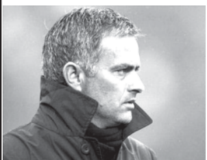
Mourinho - geared up for United clash.

MILAN, 22 Feb—Jose Mourinho has claimed to be delighted that Inter Milan must face Champions League holders Manchester United next week.