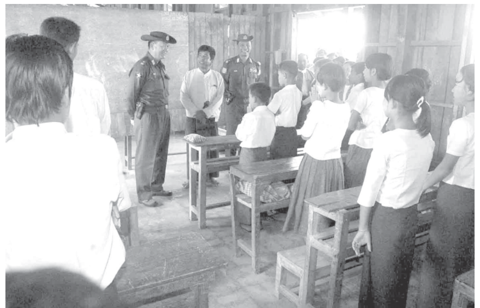
Maj-Gen Ko Ko meets students at affiliated high school in Thaukkya Village, Dedaye Township.—MNA

Afterwards, the Maj-Gen Ko Ko went to Pyapon and inspected the extension building of the 200-bed hospital constructed by Dagon International Co Ltd, holding a meeting with officers and other ranks and families of Pyapon region command, providing personal goods, clothes and sewing machines.—MNA