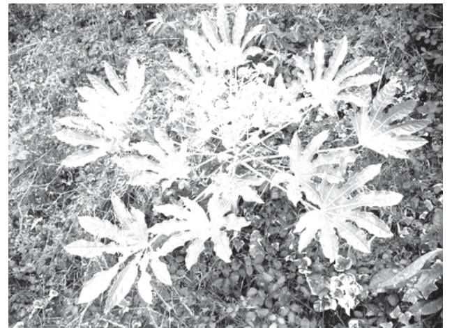
Fatsia japonica . Researchers found that complete plants removed approximately 80% of the formaldehyde in the air within 4 hours.—INTERNET