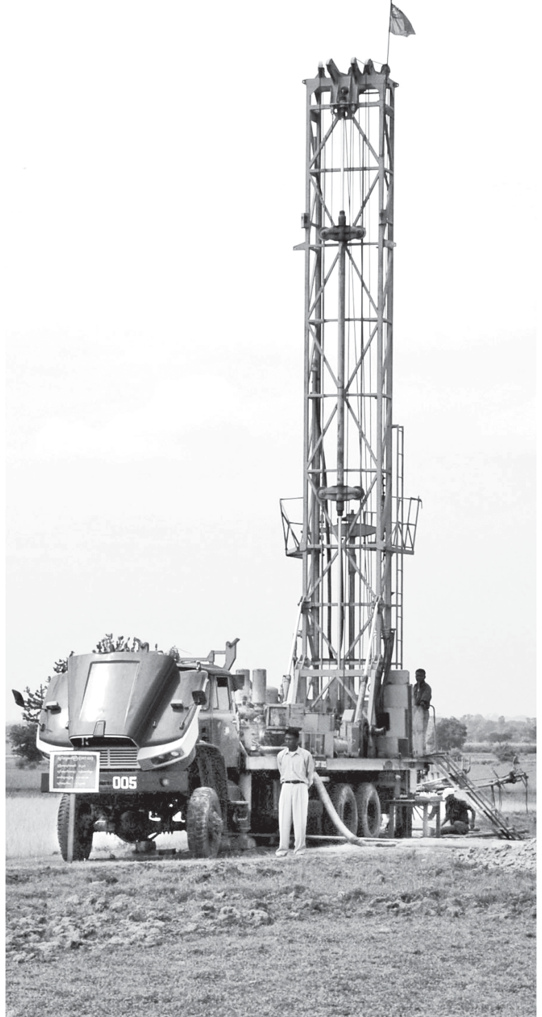
A tube-well is sunk in Kondaung village, Thazi Township to supply safe drinking water and irrigation water.

The government has been implementing the 10-year project (2000-2001 to 2009-2010 for sufficient safe water supply