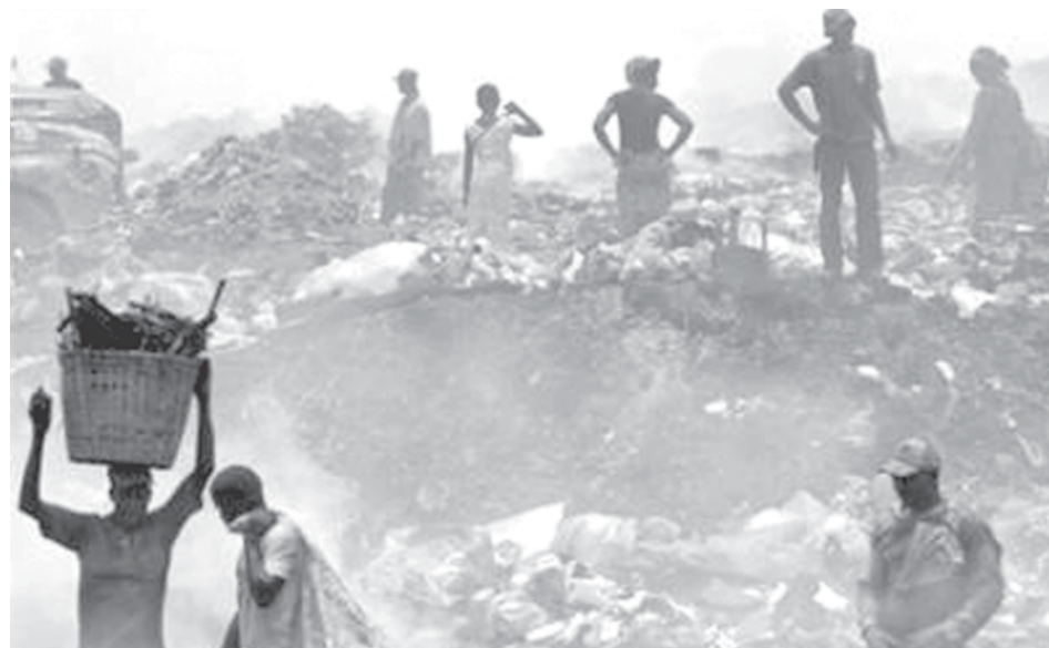
People sift through rubbish at a dump in Lagos. Nigeria ordered its customs service and security and environmental agencies to clamp down on illegal imports of potentially toxic electronic waste.

The water shortage was a blow to California's producers of almonds and other crops, the paper said.— Xinhua