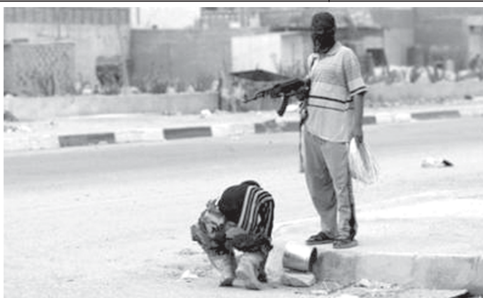
Shiite militants prepare a roadside bomb on the corner of a street in the southern city of Basra in March 2008. Iran offered to stop attacking troops in Iraq if the West dropped opposition to its nuclear programme, a top British official said in comments to be broadcast on Saturday.