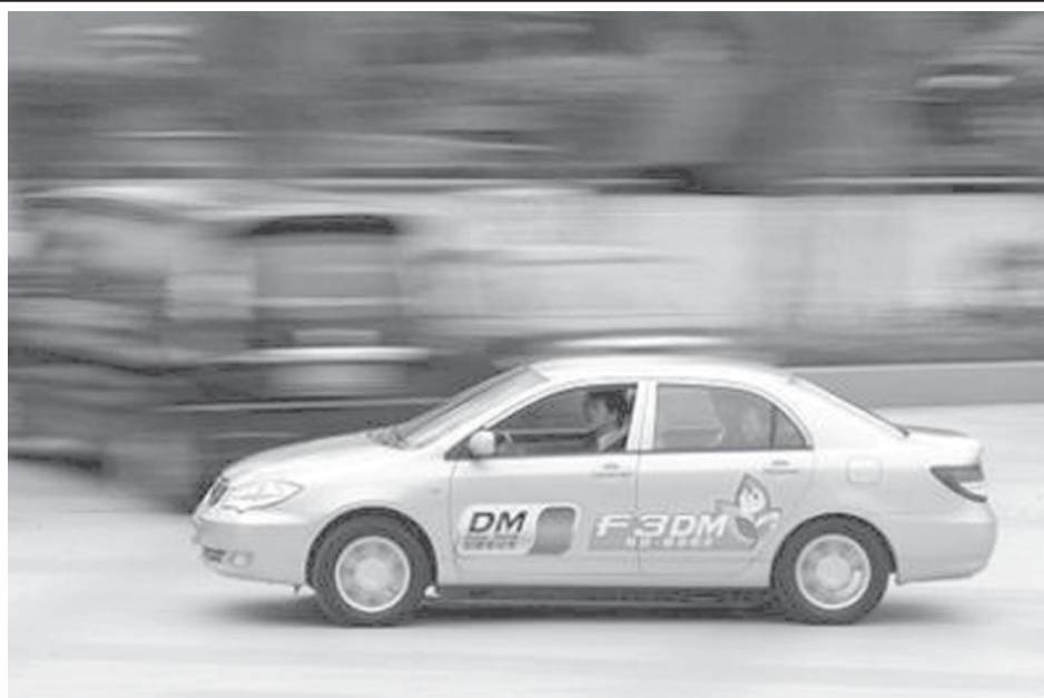
Visitors are driven in a BYD F3DM hybrid car at its headquarters in the southern Chinese city of Shenzhen on 17, 2009. From its headquarters in south China, BYD Auto is pursuing a project of staggering ambition: To be in the lead as the world's cars free themselves from their century-old dependence on petrol.