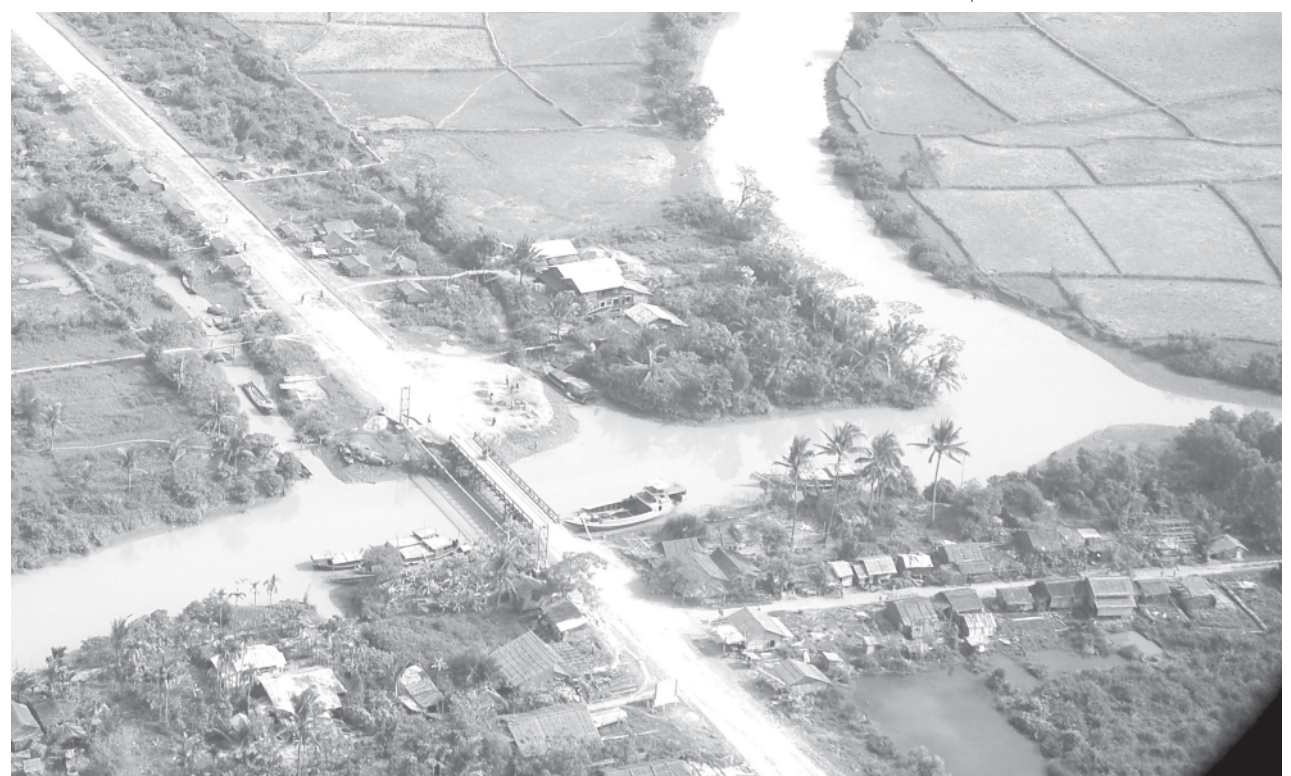
Progress of Pyapon-Daw Nyein - Ahmar road.

The Prime Minister heard the reports on construction of cyclone shelters by Chairman of Dagon International Co