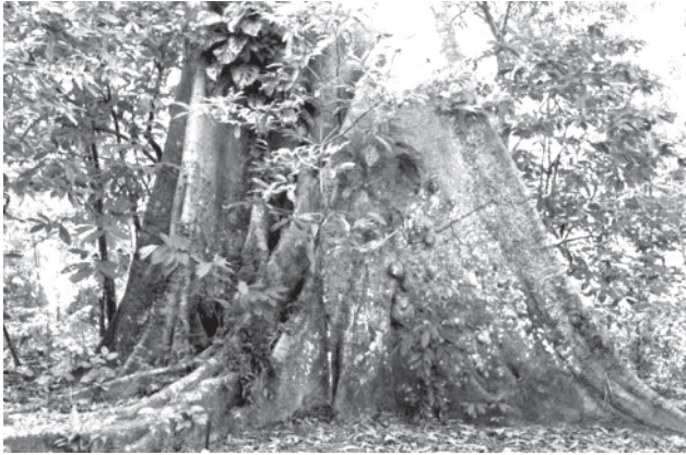
Globally, tropical trees in undisturbed forest are absorbing nearly a fifth of the carbon dioxide released by burning fossil fuels.

LEEDS, 22 Feb—Globally, tropical trees in undisturbed forest are absorbing nearly a fifth of the CO 2 released by burning fossil fuels.