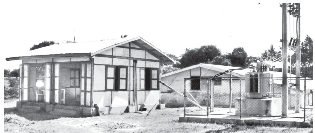
Mahasi underground water project to supply clean water in Meiktila Township.