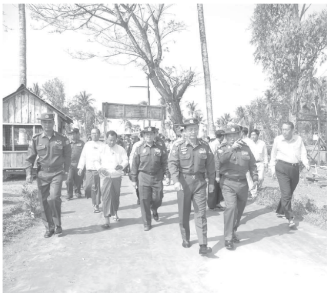
Prime Minister General Thein Sein inspects progress in construction of Ahmar Basic Education of High School.— MNA

On arrival at Bogale Education College in Bogale Township, the Prime Minister cordially greeted the trainees taking basic domestic science course No-1 at the Education College. The Prime Minister inspected learning of tailoring, cookery and clothes made by the trainees. He told the officials to present handsome prizes to the (See page 9)