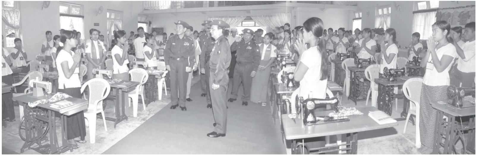
Prime Minister General Thein Sein greets trainees of basic domestic science course in Pyapon Township.—MNA

The Prime Minister said the Head of State had