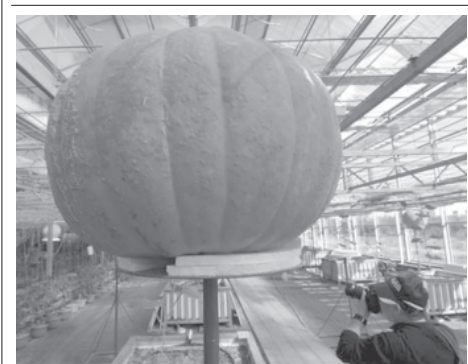
A photographer takes photo of a huge pumpkin growing in an intelligent greenhouse in Xiqing District in Tianjin, north China. The greenhouse is built to show new agricultural technologies, such as soilless culture and drip irrigation etc, as a model of modern sightseeing agriculture.

Scientists preserve the fossil of a dinosaur excavated in Liudian township in Ruyang County, central China's Henan Province. Extremely large fossils of dinosaurs were discovered recently by scientists in an area in Ruyang County. The biggest fossil measures 3.3 meters long and 2.3 meters wide. According to the fossil of its bones, the dinosaur is supposed to be much bigger than the one found in last July, which was identified as Asia's Heaviest dinosaur.