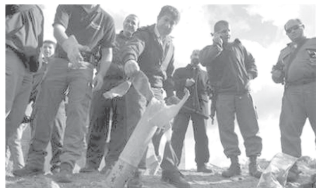
An Israeli police officer removes the remains of a rocket as others watch in a northern Israeli village, on 21 Feb, 2009. Two rockets were fired from south Lebanon at Israel early Saturday, with one slamming into a mostly Christian Arab village and causing minor injuries to at least one Israeli, reported Israeli and Lebanese officials. Israeli censorship rules do not allow media to report where, specifically, rockets fired from Lebanon land in Israel.