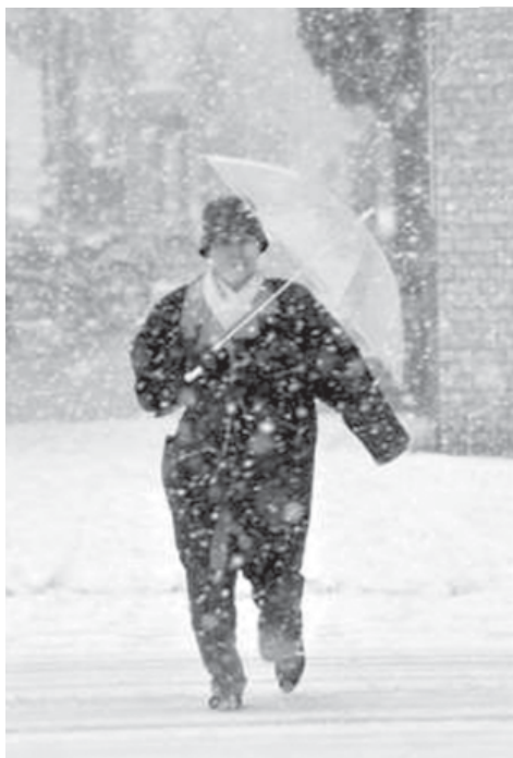
File photo shows a woman walking under heavy snow on the island of Hokkaido, northern Japan.