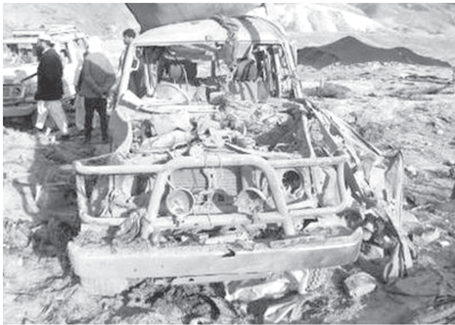
A damaged vehicle is seen after an air strike in Gozara district of Herat Province 17 February, 2009. US forces killed at least one child, video footage obtained by Reuters on Wednesday showed, in an air strike in western Afghanistan that Afghan police say killed 12 civilians and US forces said killed 16 militants.

About 40 percent of them died in military action, it said.—Internet