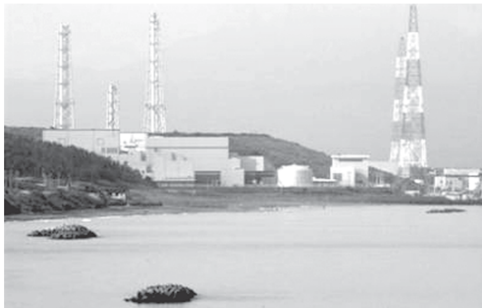
Tokyo Electric Power Co will build a solar power plant in the US state of California through its subsidiary Eurus Energy Holdings Corp, according to a report. It plans to begin operations at the 1000 kilowatt plant by 2010 on a site yet to be selected, the Nikkei business daily reported.—INTERNET