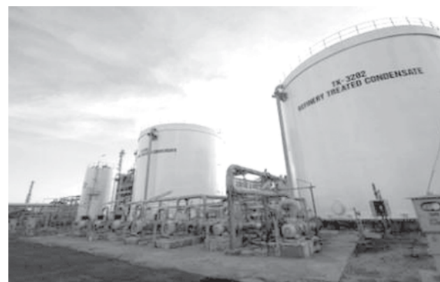
Oil tanks at Dung Quat, Vietnam's first oil refinery in the central province of Quang Ngai. Vietnam is to open its first oil refinery on 22 Feb, after decades of waiting, countless delays and spiralling costs, in what is being hailed as a significant moment in the country's development.

Although Vietnam has considerable offshore oil reserves, it currently has to import all its petroleum products, costing the southeast Asian nation hundreds of millions of dollars — a figure rising