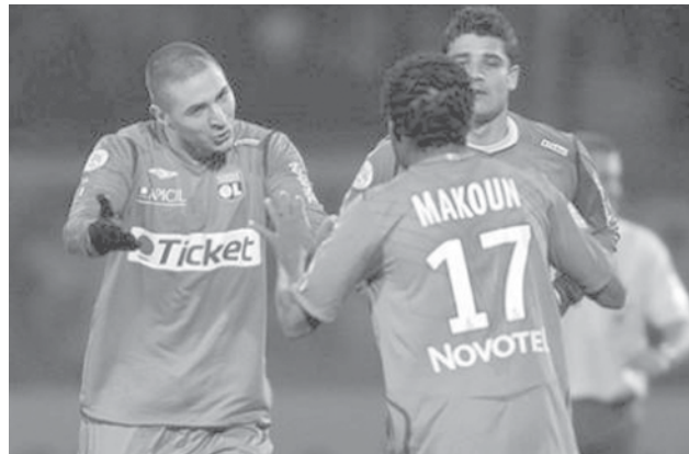
Lyon's forward Karim Benzema (L) celebrates with teammates after scoring a goal against Nancy during their French L1 football match at Marcel Picot Stadium in Tomblaine.

PSG had also enjoyed a European win bonus — in their case over Germany's VfL Wolfsburg, while Marseille were losing at home to Dutch side FC Twente — but against Grenoble they drew a blank.