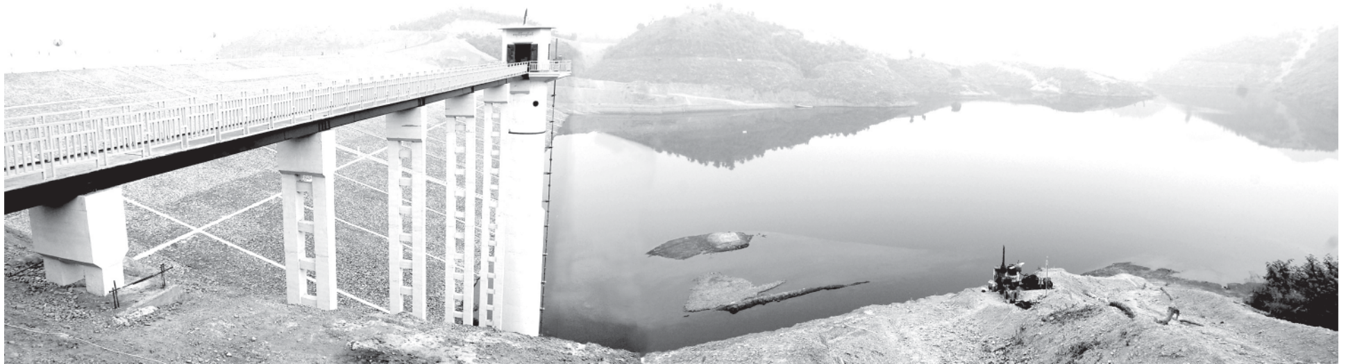
Newly built Zee Creek Dam in Kyauktaw Township.—MNA

The commander, the ministers and the guests posed for souvenirs. Then they visited the dam.—MNA