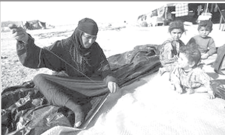
An internally displaced Iraqi woman sews together pieces of plastic sheeting to insulate her family's tent in a slum close to a garbage dump on the outskirts of the city of Karbala, some 120 kms from Baghdad in November 2008. More than 1.6 million Iraqis are still displaced and in urgent need of assistance after fleeing sectarian violence, the International Organization for Migration said.