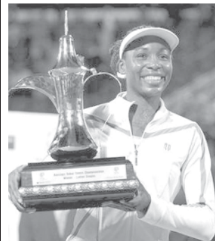
Venus Williams of the US holds her trophy after beating France's Virginie Razzano in the final match of the WTA Dubai tennis championships in the Gulf emirate.

Williams told a packed crowd that it was "a shame that one of our players couldn't be here", in a direct reference to the United Arab Emirates' widely-condemned decision to refuse to grant Israeli player Peer a visa. "I thought she had to be mentioned and I felt I was going to, whether anyone else did or not," said Wimbledon champion Williams, when it was remarked that she was the only one at the prize-giving ceremony to recall what had happened.