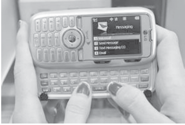
A customer samples a Sprint Nextel cellphone, manufactured by LG. Sprint Nextel Corp. said Thursday, it lost US$1.6 billion in the fourth quarter as it continued to lose subscribers and revenue.