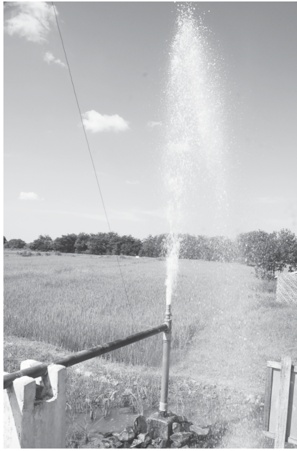
Water rising from an artesian well in Ayadaw Township, Sagaing Division.