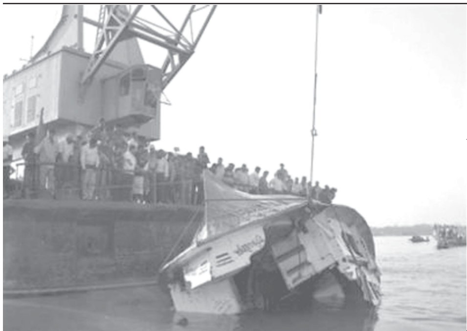
A salvage vessel hoists a capsized ferry out of the water in Barishal on 19 February. Search and rescue workers in southern Bangladesh recovered 12 more dead bodies following a ferry accident, bringing the death toll to 39, police said on Sunday.