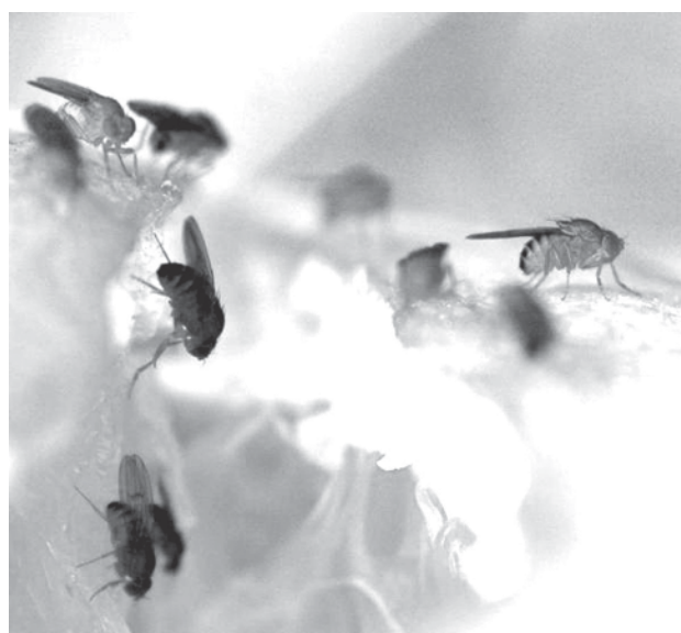
Fruit fly ( Drosophila melanogaster )

What's more, the cost of mating turns out to be rather high. "Previous research findings show that if this cost were not a factor, females would produce 20 percent more offspring," says Ted Morrow. It is costly for females to mate because competition among males has led to behaviours and adaptations in males that are injurious to females, such as harassment during mating rituals and toxic proteins in their sperm fluid. "Our results are the strongest evidence that the cost to females is probably tied to the cost of starting an immune reaction. In other words, the males are like a 'sickness' to females," says Ted Morrow.— Internet