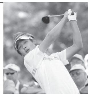
Danny Lee of New Zealand tees off on the first hole during the fourth day of the Johnnie Walker Classic golf tournament at The Vines Resort, Perth, Australia, on 22 Feb, 2009.

"It feels like I'm dreaming at the moment," Lee said. "I won lots of amateur tournaments before and the US Amateur, but this is a totally different feeling. It's a pro event. All I wanted to do is make the cut and play well and get in the top 20. But I played extremely well today, and I won it."