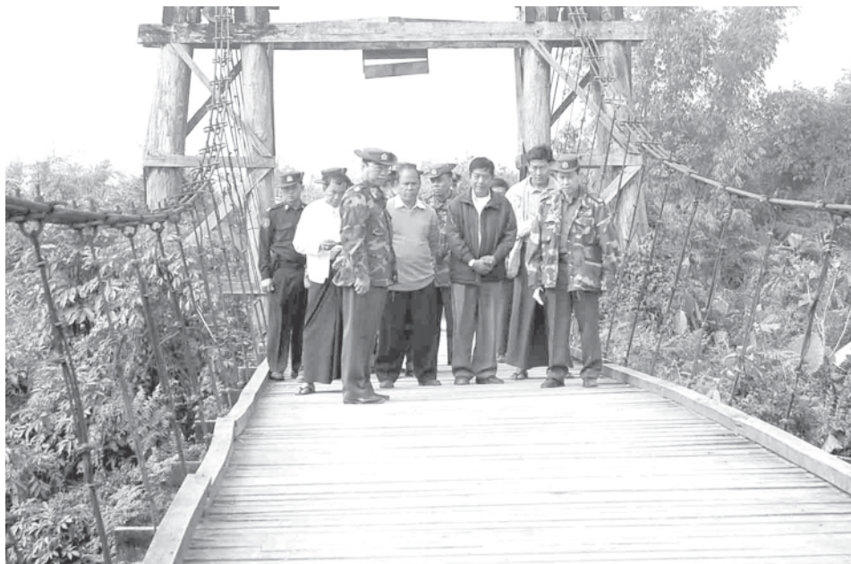
Maj-Gen Ohn Myint inspects Mansay suspension bridge linking Dagushiza and Mansay villages in Putao Township.

At the post-primary school of the village, Maj-Gen Ohn Myint met with teachers,