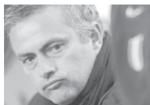
Inter Milan coach Jose Mourinho

ROME, 22 Feb—Inter Milan coach Jose Mourinho has hailed Manchester United as the best counter-attacking team in the world ahead of the pair's Champions League clash on Tuesday.