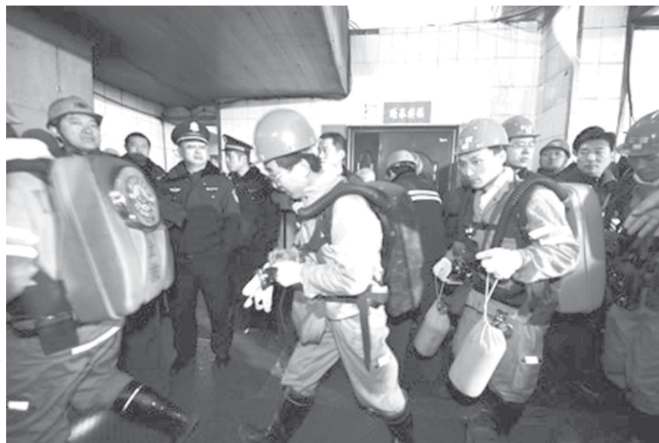
Rescue workers prepare to get into the coal mine to look for survivors in north China's Shanxi Province, on 22 Feb, 2009. More than 40 miners have died after a coal mine blast occurred at about 2:00 am Sunday at the Tunlan Coal Mine of Shanxi Coking Coal Group in Gujiao City near Taiyuan, capital of north China's Shanxi Province, while rescuers are pulling out the trapped from the shaft, according to a rescuer at the site.

Fidel has not been seen in public since mid-2006 when he underwent intestinal surgery and ceded power to Raul.