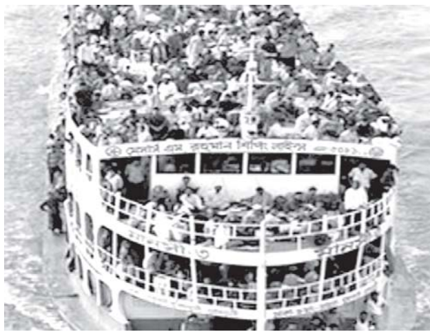
Ferry accidents kill hundreds of people and leave many unaccounted for in Bangladesh every year.