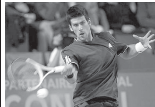
Serbia's Novak Djokovic returns the ball to France's Jeremy Chardy during their men's singles match at the Marseille Open ATP tennis tournament on 18 Feb, 2009.

MARSEILLE, 19 Feb—World number three Novak Djokovic celebrated his return to action with a 7-6 6-4 victory