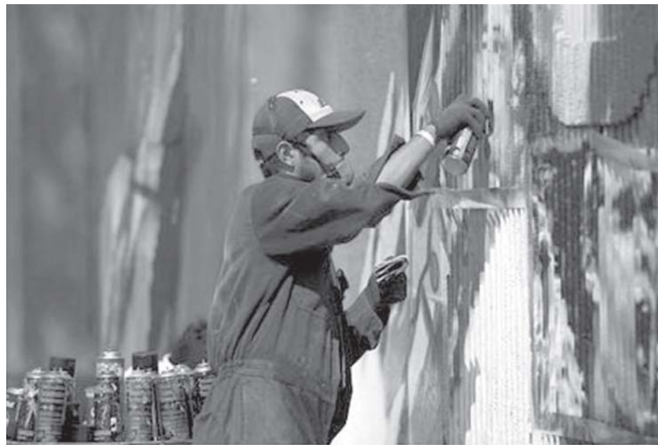
A man paints graffiti on a wall of the Azteca Stadium during a graffiti contest in Mexico City on 15 Feb, 2009.—XINHUA

Half of the 16-member crew, which included Chinese and Indonesian nationals, were picked up from a raft by a nearby Russian border guard vessel. but they failed to save those aboard the second raft, news reports said.— MNA/Xinhua