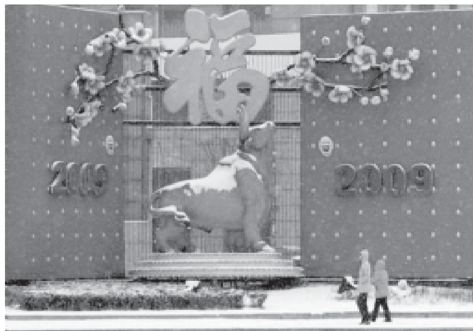
Two Chinese walk past an ox statue during a snowfall in the coastal city of Dalian, northeast China's Liaoning Province, on 18 Feb, 2009. Rain and snowfall have helped ease a severe drought in northern and eastern China.

In September 2008, Total's chief executive Christophe de Margerie denied that the company had withdrawn from Iran, saying Total wanted to remain involved in Iran's energy projects.