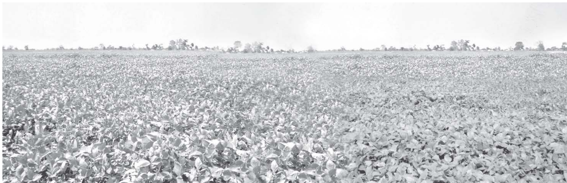
Photo shows thriving green gram plantations in Kanyinkyo Village of Kyaukdaga Township, Bago Division.