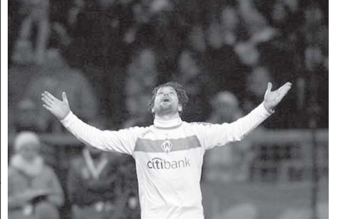
Werder Bremen's Diego celebrates after scoring against AC Milan during their UEFA Cup match at the Weser stadium in Bremen on 18 Feb, 2009.

Midfielder Diego rewarded a strong second-half display from the Bundesliga side six minutes from time by controlling Hugo Almeida's header with his chest before firing past Dida to secure a 1-1 draw. Filippo Inzaghi had put competition favourites Milan ahead on 36 minutes, the striker firing in a rebound after his own header from Mathieu Flamini's cross had been blocked.— Internet