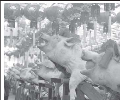
Well-decorated pigs are laid in rows to compete for this year's "big pig competition", a folk tradition, in Shantou, Guangdong Province. The pig with the heaviest weight and most beautiful decorations will be declared the winner. After that, the meat will be shared among relatives and friends. The tradition, dating back to the Ming Dynasty (1368-1644), was originally held by villagers who sacrificed their pigs to pray for good luck and dispel epidemics.