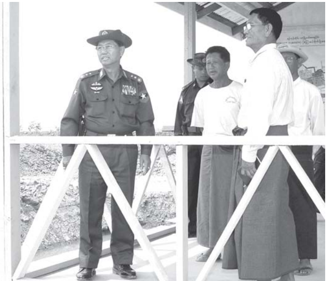
Lt-Gen Myint Swe of Ministry of Defence views progress of farm roads and drains being undertaken by Yuzana Co in Agricultural Mechanized Farming Special Zone (1) in Dagon Myothit (East) Township.

field of the local battalion in Dagon Myothit (South) Township and pumping water into the field.