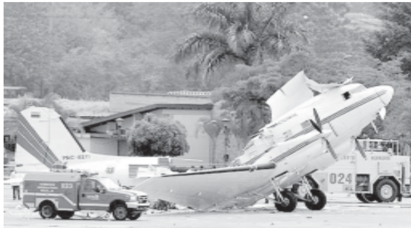
The plane reportedly broke in two pieces.

The incident occurred at Enrique Olaya Herrera Airport, which has become a secondary facility in Medellin since completion of Jose Maria Cordova International Airport.