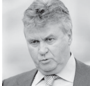
Chelsea manager Guus Hiddink.

Abramovich would hardly have considered the prospect of trailing leaders Manchester United by 10 points with 13 games remaining but that is the situation Chelsea are in after sacking Scolari last week.