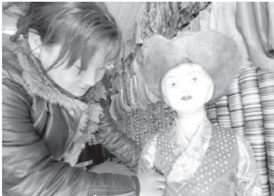
A shopowner shows a traditional children's clothes of Tibetan ethnic group at her shop in Lhasa, capital of southwest China's Tibet Autonomous Region, on 18 Feb, 2009.