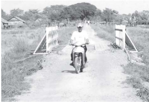
Rural laterite road constructed to link Peinzalok Ywama of Nyaunglebin Township and Kanyinkyo Village of Kyaukdaga Township.

He continued to say that while the Information and Public Relations Department is striving for enhancement of reading skills and knowledge of the rural people across the nation, the village built Pynnya Nuggaha Library with over K 1.4 million contributions of the people and the library will be opened soon. On completion, the local people will have the opportunity to read various kinds of books for broadening their knowl-