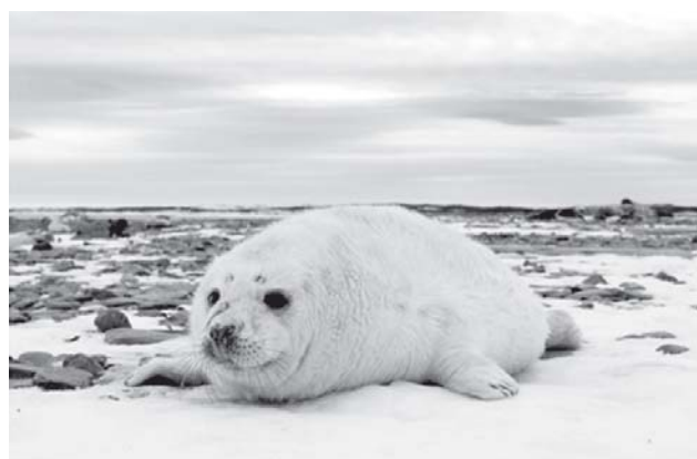
A grey seal pup is seen on Hay island off the coast of Nova Scotia on 11 Feb, 2009. East coast sealers postponed the hunt for 2,200 seal on the island after failing to find a buyer for the pelts.