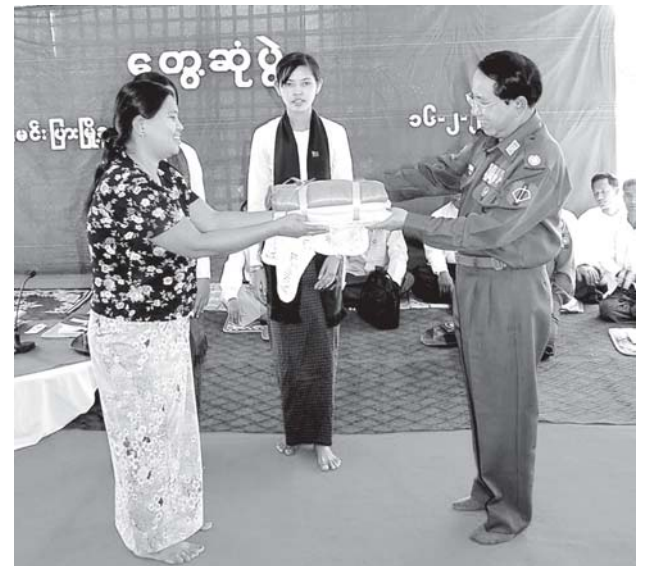
Information Minister Brig-Gen Kyaw Hsan presents cash assistance, books and stationery, clothes and personnel goods for regional development of Minbya Township through personnel concerned.