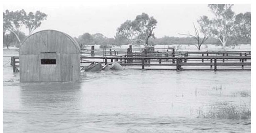
Flood waters pass through stock yards at Yarrarloola Station, a large farm in the Pilbara Region in northern part of Western Australia State in this handout picture received on 18 Feb, 2009.