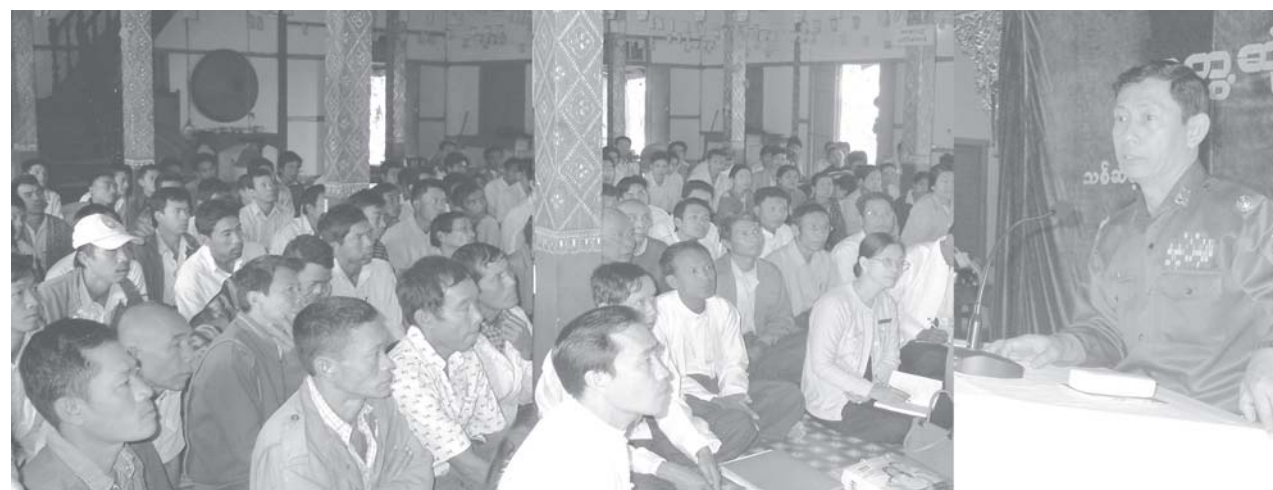
Deputy Minister Brig-Gen Than Htay delivers an address to village dwellers of Thitseintkine Village in Kyangin Township.—MNA

the Union of Myanmar to the 62 nd Anniversary Union Day held at the sport ground of Taunggyi on 12 February.—MNA