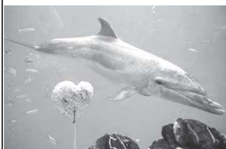
A dolphin flows over a heart-shaped ice mixed with food given by the breeder for the incoming Valentine's day at Yokohama Yakkeijima Sea Paradise, in Yokohama, south of Tokyo, Japan.