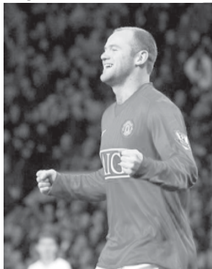
Manchester United's Wayne Rooney celebrates after scoring during their English Premier League match against Fulham in Manchester, on 18 Feb, 2009.

Dimitar Berbatov then doubled the tally 17 minutes later with a tap in. United now have 59 points to Liverpool's 54 and third placed Aston Villa's 51 after 25 matches. Chelsea, their title chances dismissed by United manager Alex Ferguson in the pre-match programme, are fourth on 49 with 13 games remaining.— Internet