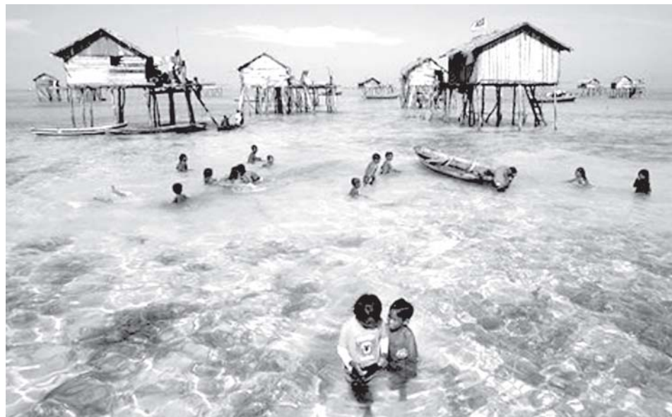
Young sea gypsies play in the water in the centre of their neighbourhood in the Sulawesi Sea in Malaysia's state of Sabah on the Borneo island on 17 Feb, 2009. A community of 30 families of the indigenous ethnic group of sea gypsies are still maintaining a nomadic and sea-based life without fresh water supply, TV nor electricity, and only go to land to bury the dead.