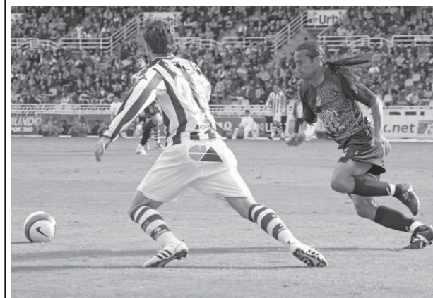
Match between Real Sociedad and Gimnastic de Tarragona.