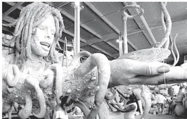
A float is being prepared in Rio de Janeiro, Brazil, ahead of next week's carnival.

The airstrikes were carried out as two US congressmen arrived here on Thursday, marking the highest-level visit by U.S. officials to the territory since Hamas movement seized control of the enclave nearly two years ago.