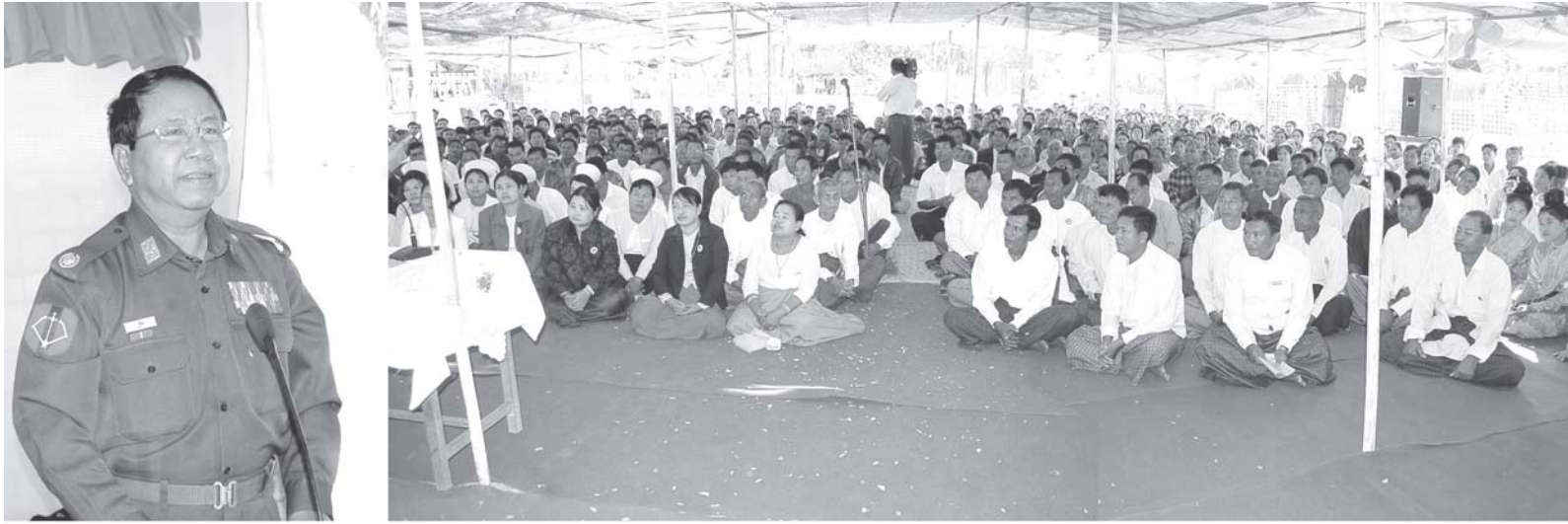
Information Minister Brig-Gen Kyaw Hsan gives a speech to local people of Pauktaw Township, Rakhine State.