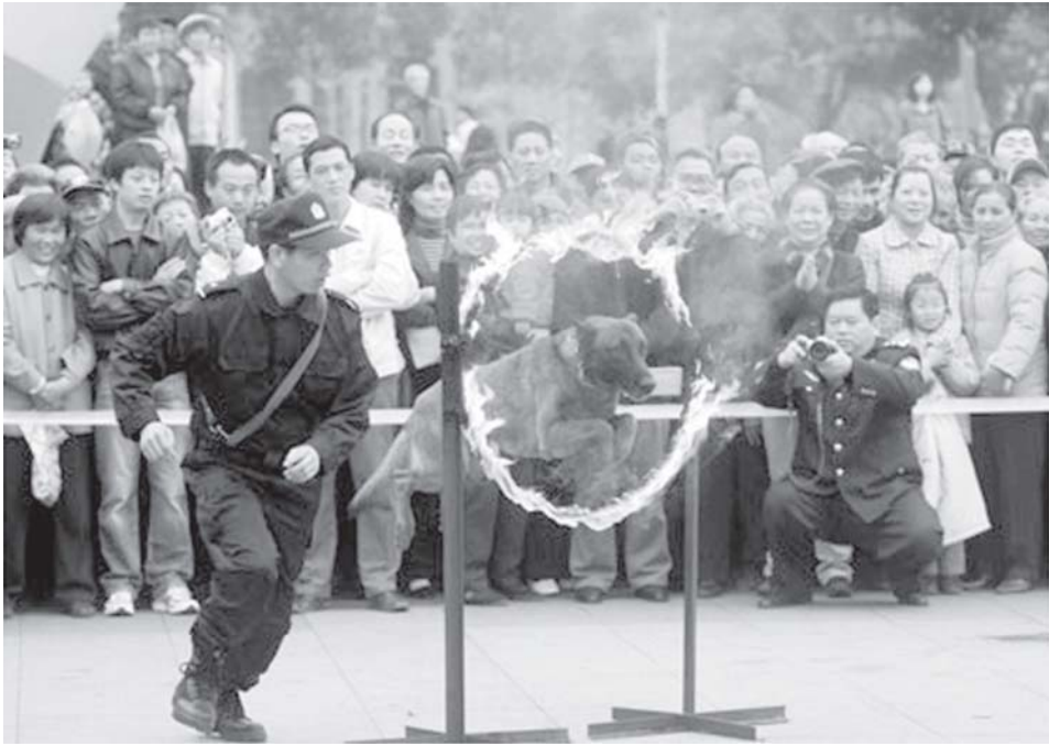
A police dog jumps through a fire ring at the command of a Chinese police officer during a city show for local residents at a square in Liuzhou, southwest China's Guangxi Zhuang Autonomous Region, on 17 Feb, 2009.