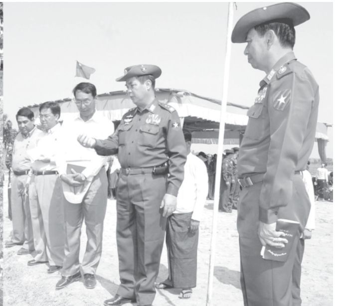
Lt-Gen Tha Aye of the Ministry of Defence views scattering of fertilizer and spraying of pesticide on the groundnut plantations in Chaungzon Township.

They viewed thriving groundnut plantations in Kawmupun Village and Kahnyaw