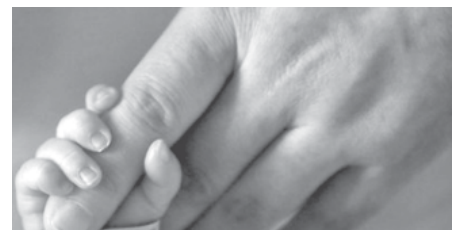
A newborn baby holds onto his mother's finger at a hospital. In only the second time in US medical history, a woman in California has given birth to eight babies, who remain in intensive care but are in a stable condition.