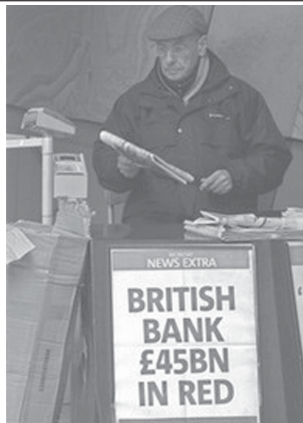
A vendor sells newspapers referring to a record annual loss by the Royal Bank of Scotland in central London on 19 Jan, Prime Minister Gordon Brown's government has launched two rounds of bank bailouts worth hundreds of billions of pounds which has seen the state take big stakes in high street names like Royal Bank of Scotland.—INTERNET

Four Iranian diplomats were kidnapped by the Christian Lebanese Forces (LF) militia at a checkpoint in northern Lebanon in 1982 during the Israeli invasion of Lebanon, and they have been missing since then.—Internet