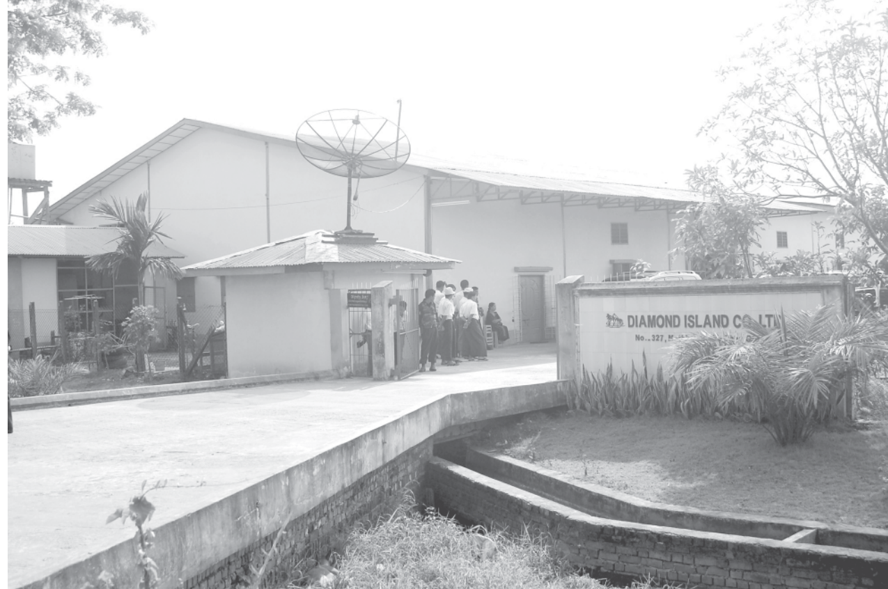
Diamond Island Plastic Factory in Shwepaukkan, North Okkalapa Township.