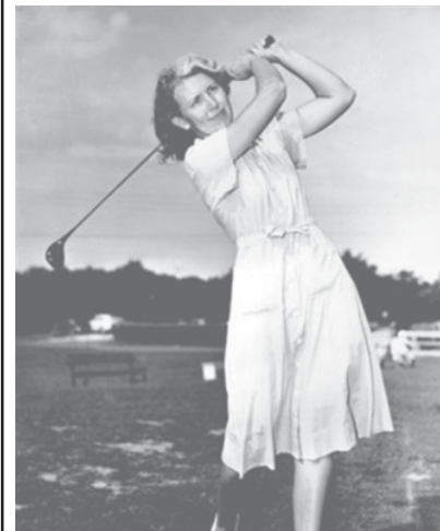
Betty Jameson one of the 13 founding members of the LPGA Tour in 1950, died on Saturday. She was 89.

BOYNTON BEACH, 8 Feb—Betty Jameson, one of the 13 founding members of the LPGA Tour in 1950, died Saturday, the tour said. She was 89. The tour did not give the cause of death.