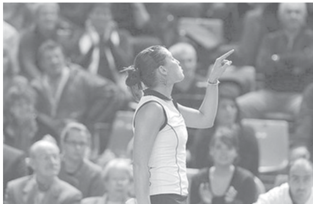
Italian Flavia Pennetta gestures during her game against French Amelie Mauresmo on the first round of the 2009 Fed Cup World group in Orleans, central France.