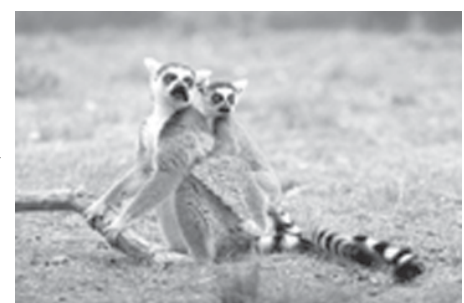
A baby lemur rests on the back of its mother at a zoo in Buenos Aires, capital of Argentina. Four baby animals, which were born from last October to January, met the visitors for the first time.