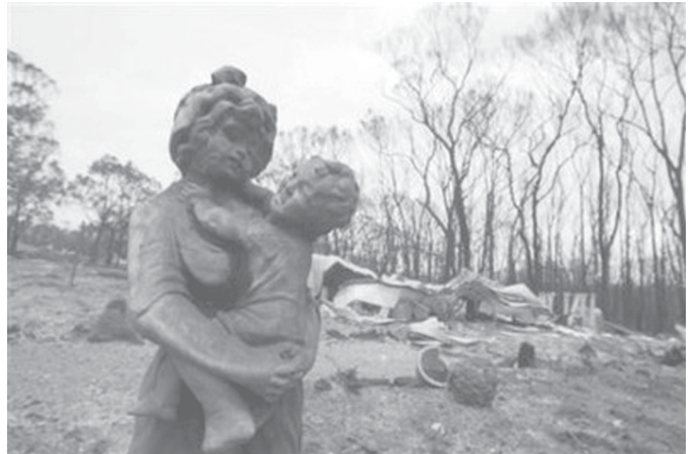
A statue of a woman and child is seen amongst the remains of houses destroyed by bushfires in the town of Heathcote Junction, 55km (34 miles) north of Melbourne, on 8 Feb, 2009.

Earlier on Tuesday, Teheran announced that the Omid lightweight telecommunications satellite, its first home-