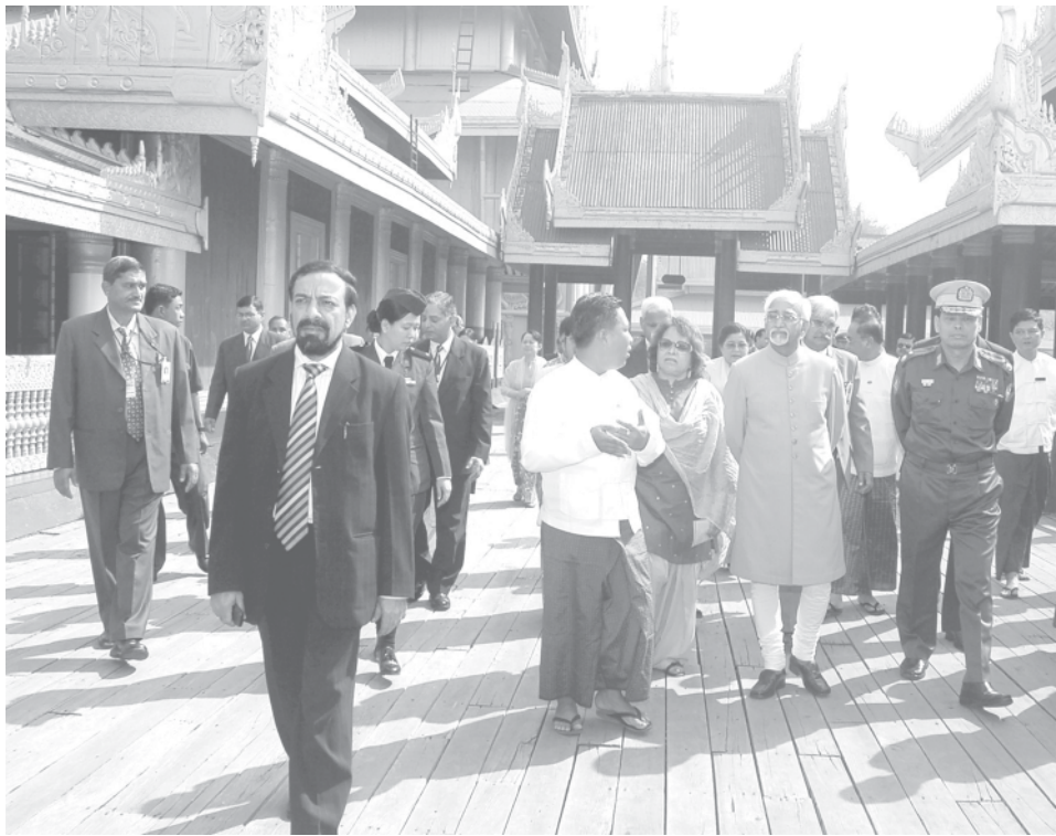
Indian Vice-President Mr Shri M Hamid Ansari and party visit Myanan San Kyaw Golden Palace in Mandalay.