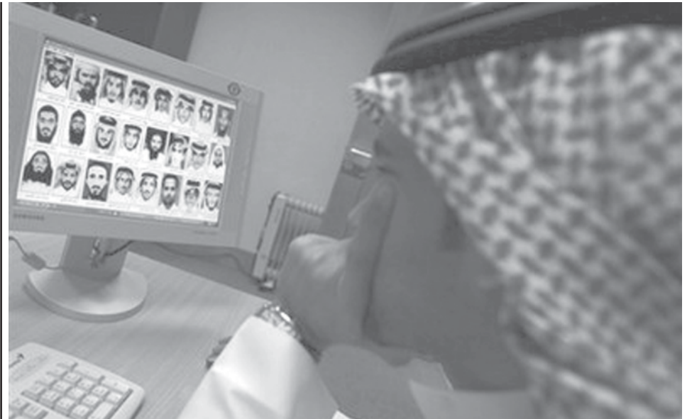
A Saudi man checks a computer profiling the 85 men on the kingdom's new most-wanted list in the Saudi Capital Riyadh, Saudi Arabia, on 7 Feb, 2009.