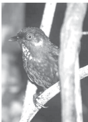
Nonggang Babbler is found only in southwestern Guangxi province, part of the south-east Chinese Mountains Endemic Bird Area. Internet

Guangxi University first sighted the birds in surveys during 2005 and confirmed its identity as an undescribed taxon the following year. A formal description was published in a recent edition of ornithological journal The Auk . In general behaviour it resembles a wren-babbler of the genus Napothera in that it prefers running to flying, and seems to spend most of its time on the ground foraging for insects between rocks and under fallen leaves.