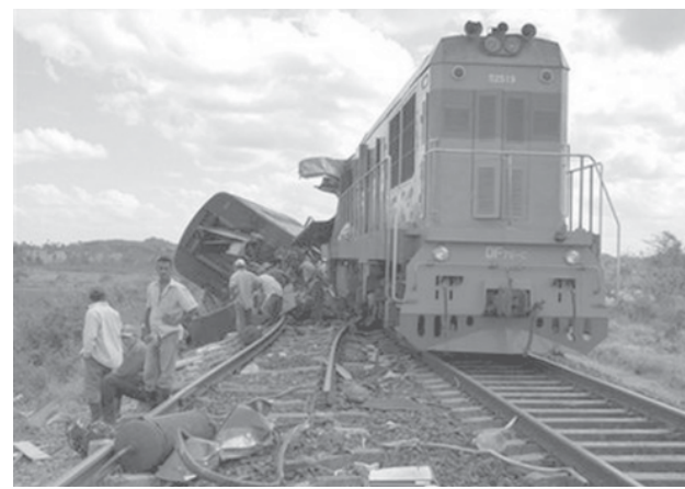
Residents attend the scene of a train crash in Camaguey, Cuba, on 7 Feb, 2009. Two passenger trains collided in central Cuba, killing at least three people and injuring 93 others, state media reported.—INTERNET

One of the trains had left Havana bound for the eastern city of Santiago, 540 miles (860 kilometres) to the east, and the other was heading west toward Havana from the coastal city of Manzanillo, 480 miles (775 kilometres) from the capital.— Internet