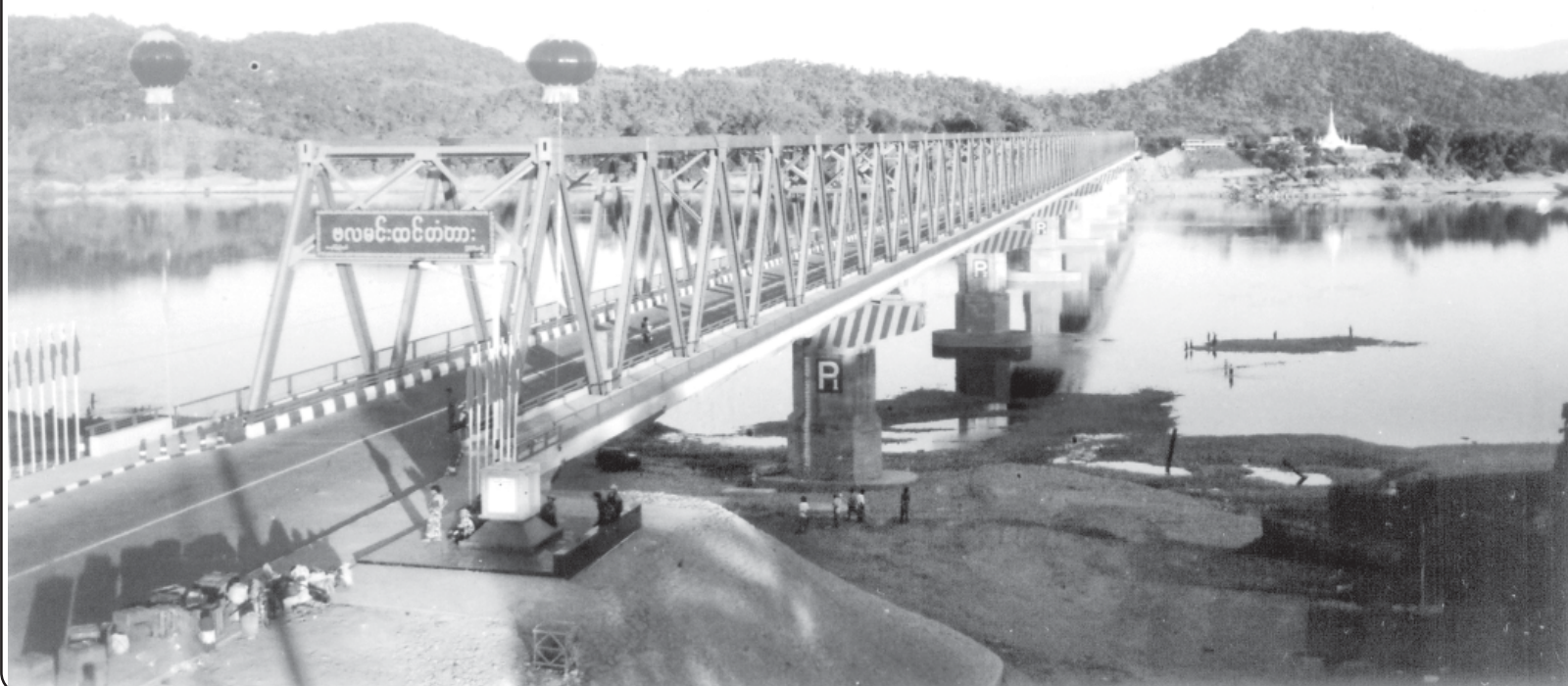
Bala Min Htin Bridge

2,688 feet long Bala Min Htin Bridge built in Myitkyina Township of Kachin State lies on Ayeyawady River.