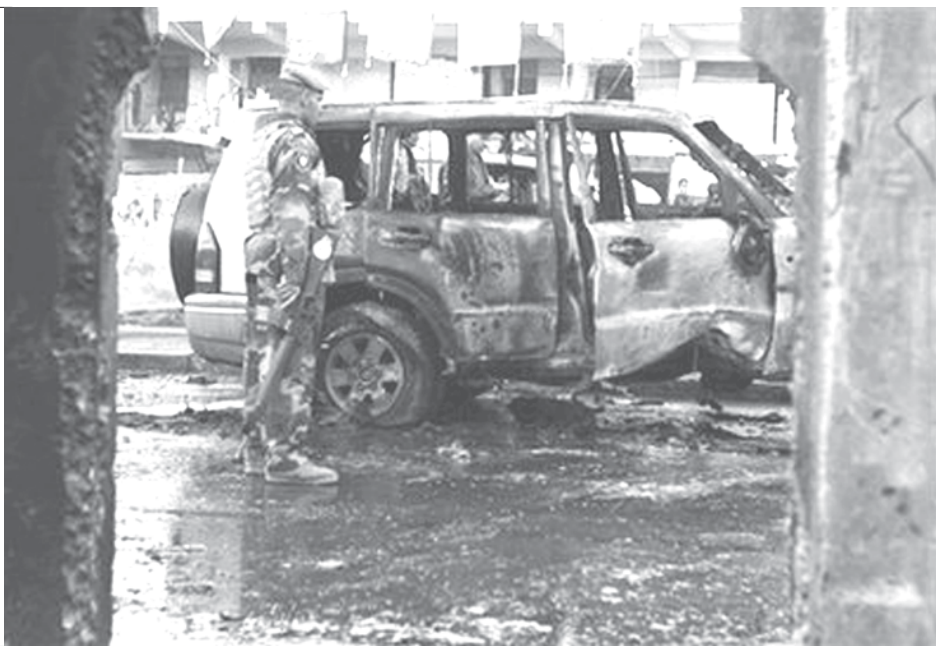
Iraqi police stand at the scene of bombing in Baghdad, Iraq recently. A bomb hidden under a car exploded in central Baghdad.

Saca's conservative government was a staunch ally of the Bush administration. Salvadoran troops stayed in Iraq years after Honduran, Dominican and Nicaraguan soldiers left.