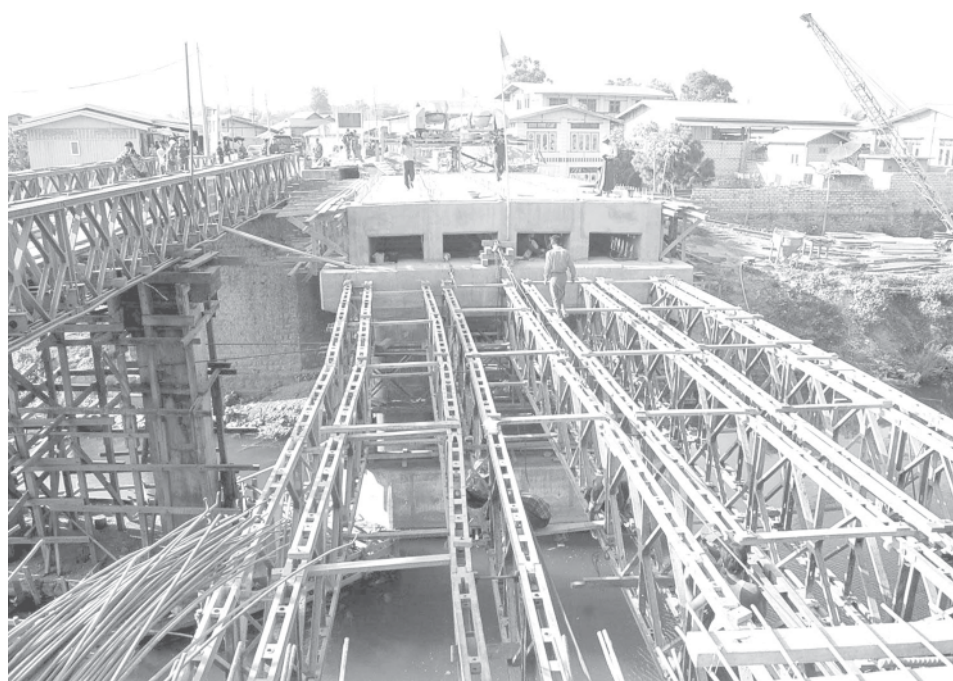
Implementing of Nampaung Bridge project in progress.

At the hall of Seikkhaung Station in Mongyai, he met with servicemen and family members.