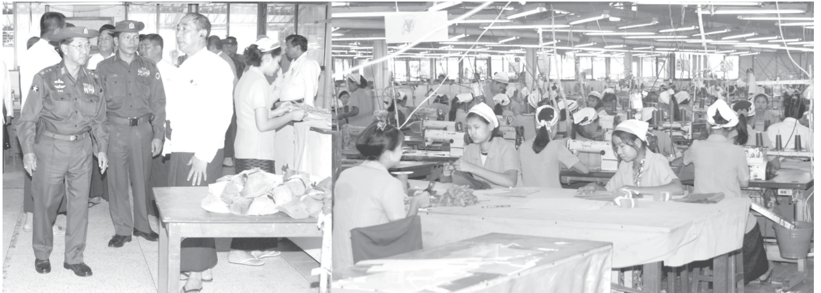
Lt-Gen Myint Swe of Ministry of Defence visits the garment factory of Myanmar Segye International Limited.

YANGON, 8 Feb—Lt-Gen Myint Swe of the Ministry of Defence accompanied by Chairman of Yangon Division Peace and Development Council Commander of Yangon Command Brig-Gen Win Myint, Chairman of Yangon City Development Committee Mayor Brig-Gen Aung Thein Lin and officials visited the garment factory of Myanmar Segye International Limited in Pyinmabin Industrial Zone of Mingaladon