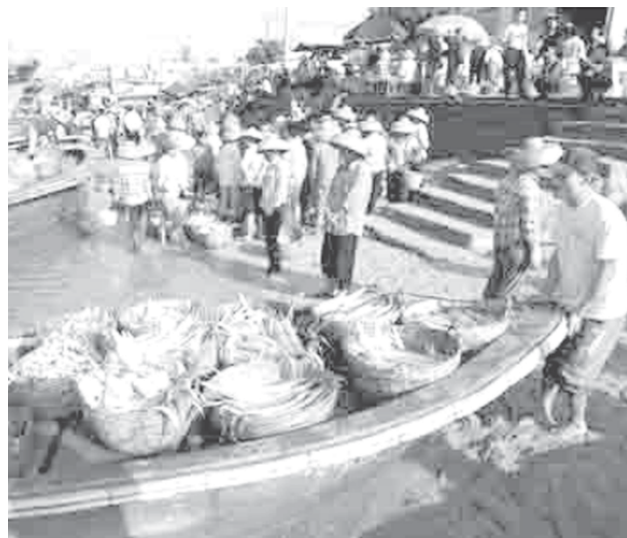
Boats loaded with fish are anchored at a wharf in Tanmen Township of Qionghai, south China's Hainan Province, on 7 Feb, 2009. The inshore fishing keeps flourishing here at the beginning of spring this year.