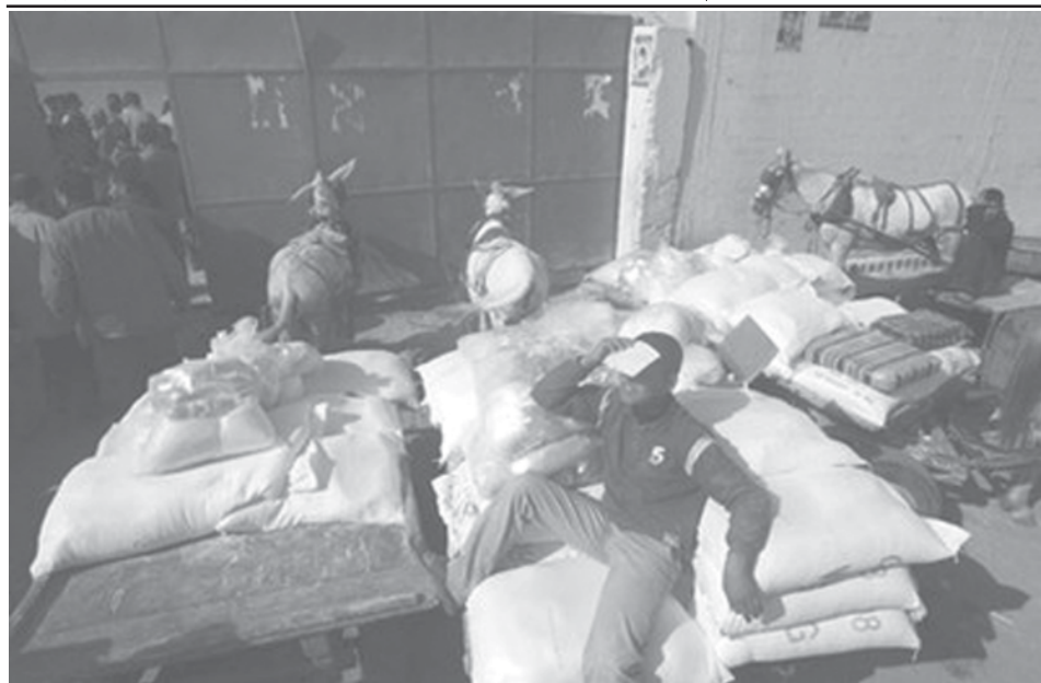
A Palestinian sits on top of food supplies outside the United Nations aid distribution centre in Gaza City. The United Nations was on 7 Feb, awaiting the promised return of hundreds of tonnes of food aid for Gaza "mistakenly" seized by Hamas, as the Islamists insisted the crisis is over.