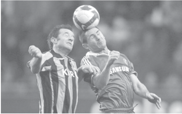
Chelsea's Frank Lampard (left) is challenged by Hull City's Ian Ashbee. Chelsea assistant manager Ray Wilkins admits his side's title hopes are receding after the Blues were held to a surprise 0-0 draw at home to Hull.