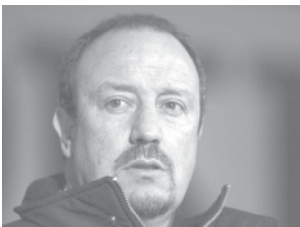
Liverpool's manager Rafael Benitez

PORTSMOUTH, 8 Feb—Rafael Benitez insists Liverpool are strong enough to compete for the Premier League title despite needing a half-fit Fernando Torres to rescue a 3-2 stoppage time win at Portsmouth on Saturday.