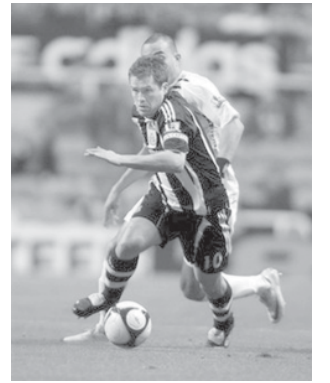
Newcastle's Michael Owen (foreground) is facing a two-month lay-off after the Newcastle striker's injury jinx struck again during a 2-1 defeat at Manchester City.

The 29-year-old former England star, playing only his 62nd game for Newcastle since arriving from Real Madrid in a 16-million-pound transfer in August 2005, limped out of Wednesday evening's clash after nineteen minutes after landing awkwardly following a challenge by City debutant Nigel de Jong.—Internet