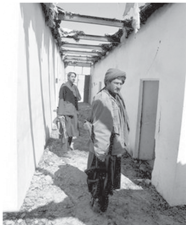
Afghan district policemen inspect a school torched by rebels in southern Helmand Province. Many people in Afghanistan were hopeful at the end of 2001 but seven years since the US-led invasion that ousted Taliban forces the hardline group has returned, swept along by a catalogue of post-invasion failures committed by the USA.