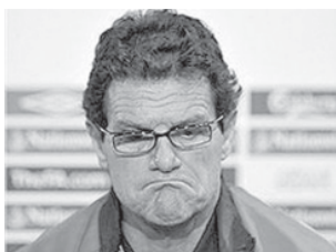
England coach Fabio Capello.

to check on his form and before that I sent my assistants. It seems to me that he has fitted in very well at Milan."