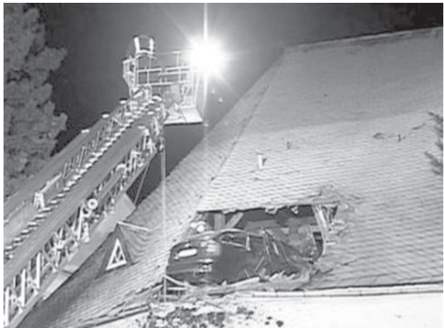
A frame grab taken from TV footage shows emergency services attending the scene of a car lodged in the roof of a church following an accident in Limbach-Oberfrohna in Saxony on 26 Jan, 2009.