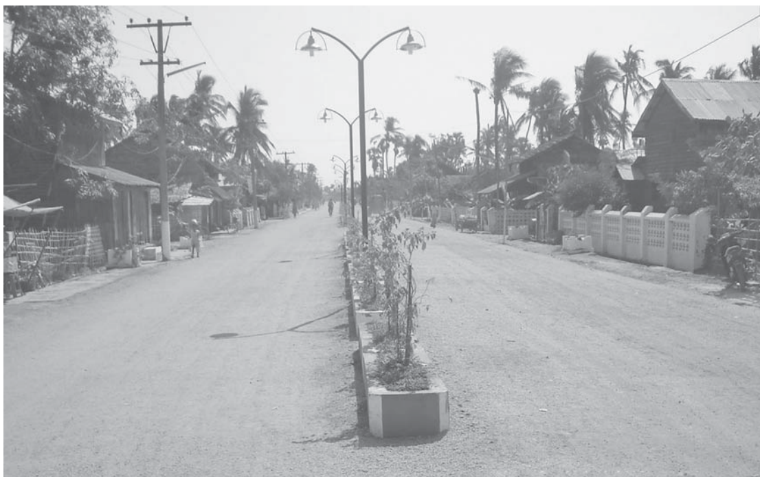
Awbar Street in Labutta Township has been upgraded to a tarred facility.