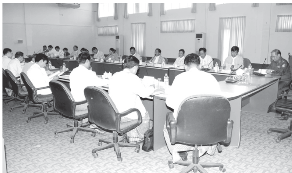
The 107 th Meeting of Banks Supervisory Committee with executives of Myanmar Banks Association in progress.

Deputy Minister for Finance and Revenue Col Hla Thein Swe delivered an address. Governor of Central Bank of Myanmar U Than Nyein discussed money circulation of banks and banking operations in accord with the law, rules and regulations. Executives of the association, responsible