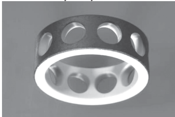
Plastic cage coated with diamond-like carbon: Bearings achieve much higher engine speeds with parts coated in this way.