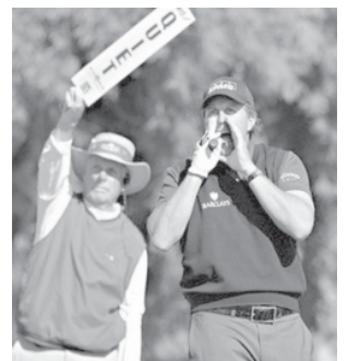
Phil Mickelson yells fore after hitting from the fifth tee during the first round of the FBR Open golf tournament on 29 Jan, 2009 in Scottsdale, Ariz.