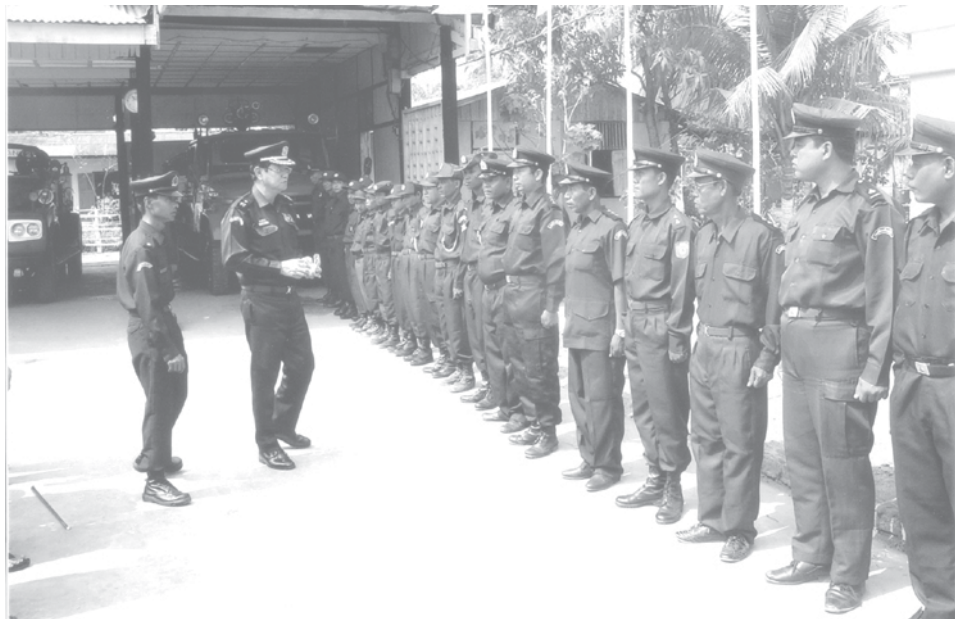
Director-General U Myint Tun of Fire Services Department inspects fire brigade members at Mawlamyinegyun Fire Station.