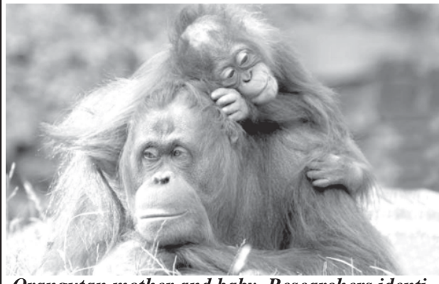
Orangutan mother and baby. Researchers identified fast evolving human genes by comparing our genome with those of other primates.

UPPSALA, 30 Jan — Why have some of our genes evolved rapidly? It is widely believed that Darwinian natural selection is responsible, but re-