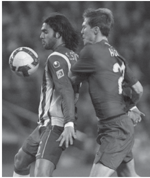
Barcelona's midfielder Aleksandr Hleb (R) fights for the ball with Espanyol's Sergio Sanchez (L) during the King's Cup football match at the New Camp Stadium in Barcelona. Runaway La Liga leaders Barcelona edged into the semi-finals of the Spanish Cup thanks to a narrow 3-2 home win over city rivals Espanyol on Thursday.

Barcelona had been held 0-0 in the first leg of their tie against their neighbours, but coach Pep Guardiola displayed his confidence ahead of the return leg by leaving inform strikers Thierry Henry and Samuel Eto'o on the bench at the Nou Camp.—Internet