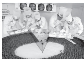
Chefs serve what they claim to be the world’s largest cheesecake in Mexico City. The chefs hope to win a Guinness World Record.

World Records declared the cheesecake the world’s largest on Sunday at an event sponsored by Kraft Foods, maker of Philadelphia cream cheese.