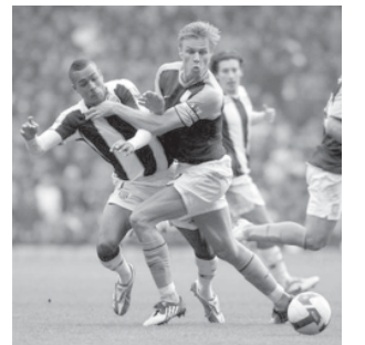
Aston Villa's Danish captain Martin Laursen (right) announced on Thursday he was retiring from international football due to his injured knee.