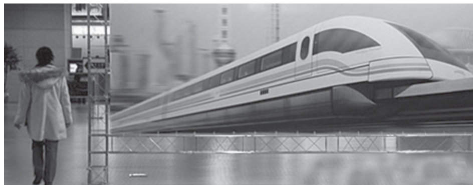
This undated file photo shows a maglev. China and Germany on Thursday signed a memorandum of understanding on the transfer of parts of the core technologies from Germany for the maglev railway projects in China.

The signing ceremony was witnessed by Merkel and Wen, who arrived in Berlin late on Wednesday. Xinhua