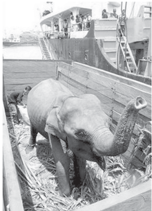
A Sumatran elephant in Surabaya. A spate of recent deadly animal attacks in Indonesia has thrown the spotlight on growing conflicts between humans and animals triggered by the rapid dwindling of the country’s forests.