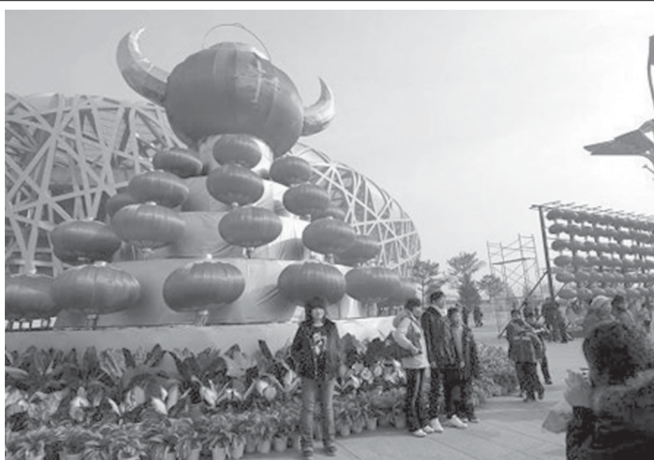
Tourists take photos in front of red lanterns that pile up as the head of an ox at the National Stadium, or Bird's Nest, on 29 Jan, 2009.