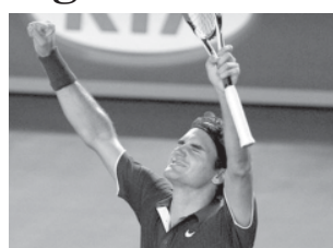
Federer says he can never be called tennis's all-time best despite underlining a glorious return to form by moving within one match of equalling the Grand Slam record.

The 27-year-old Swiss has reached his fourth Australian Open final and is bidding for his 14th Grand Slam win, which would match the record