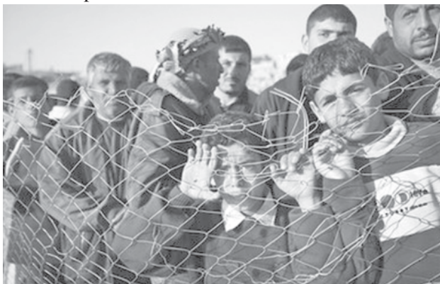
Palestinians gather behind a fence in front a make shift camp to wait for humanitarian organizations to hand out sheets and mattress and to get a place in a tent camp in the destroyed part of eastern Jebaliya, northern Gaza strip, on 29 Jan, 2009.

He blamed the aid shortage on the lack of access to Gaza and demanded that the border crossings be opened.