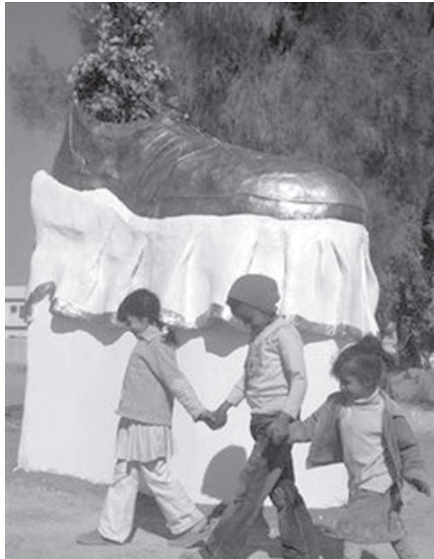
Girls stand next to a sculpture of a shoe that serves as a monument to the shoes thrown at then-US president George W Bush in Tikrit, 130 kilometres (80 miles) north of Baghdad, Iraq, on 29 Jan, 2009. The shoe-hurling last month at Bush spawned a flood of Web quips, political satire and street rallies across the Arab world. Now, it's inspired a work of art.

On Thursday, Toshiba said it expects a group largest-ever net and operating loss of 280 billion yen (about 3.09764 billion US dollars) for fiscal 2008, its first red-ink in seven years.—Internet