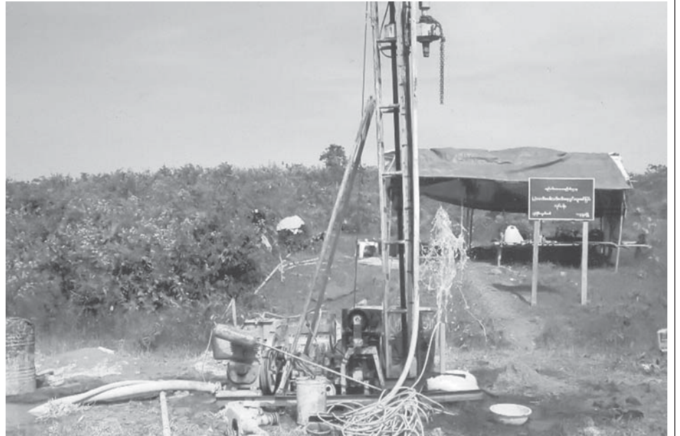
A two-inch-diameter tube-well is under test run in Labutta Township.

Service personnel of the Ministry of Progress of Border Areas and National Races and