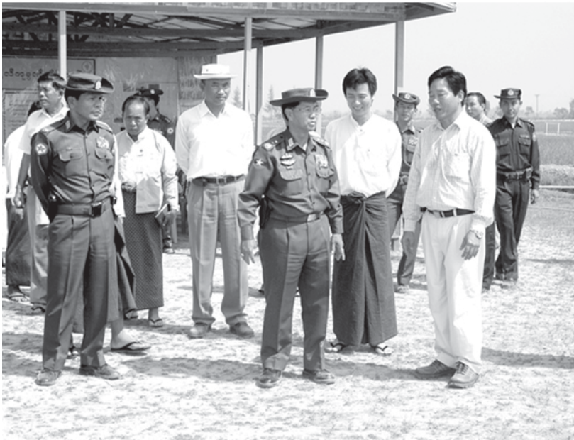
Lt-Gen Myint Swe of Ministry of Defence inspects summer paddy model plantation at special zone (1) in Dagon Myothit (East) Township.

essential instructions. Later, Lt-Gen Myint Swe and the commander heard reports on supply of water for ag-