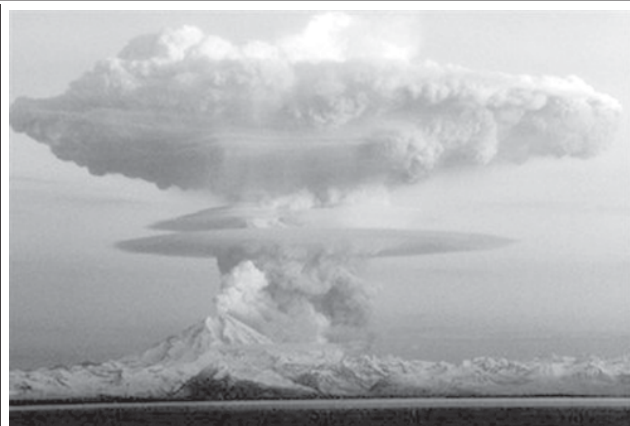
This 1990 photo release by the Alaska Volcano Observatory shows an ascending eruption cloud from Redoubt Volcano about 100 southwest of Anchorage Alaska as viewed to the west from the Kenai Peninsula on 21 April, 1990. Redoubt volcano is rumbling and simmering, prompting geologists to warn that an eruption may be imminent.

Ebola-Reston, unlike its African counterparts which are proven deadly to humans, was first found on monkeys shipped from the Philippines to Reston, Virginia, the United States in 1989. The Philippine authority said tests done late last year found hogs from a selective few swine farms in the north were carrying Ebola-Reston virus.