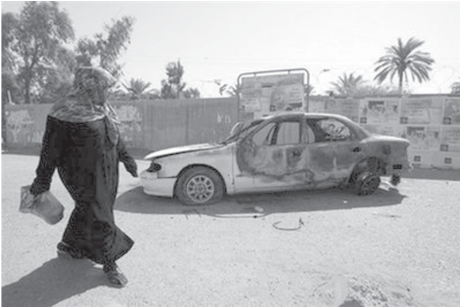
An Iraqi woman walks past the remains of a car that was destroyed by Blackwater security guards in September 2007. Iraq said on Thursday it was banning controversial US security outfit Blackwater from operating in the country over a 2007 Baghdad shooting involving its guards in which 17 civilians were killed.