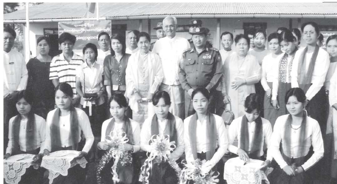
Minister Maj-Gen Soe Naing poses for a documentary photo together with wellwishers at opening of new school building for BEPS-5 in Pyapon on 29 January. H&T

Afterwards, the minister went to preprimary school opened by Kyonku village Maternal and Child Welfare Association where he made cash donation and viewed providing refreshment to school children.—MNA