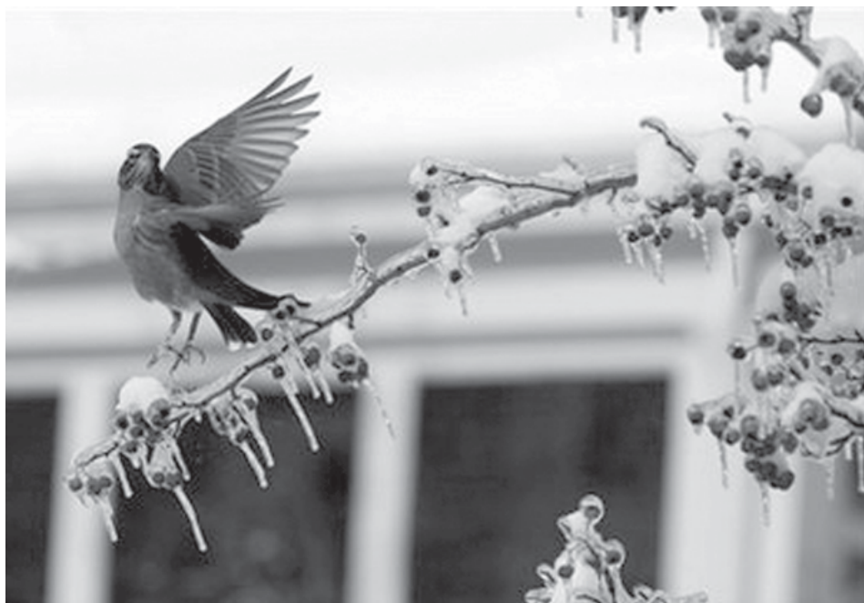
A red Robin lands on a tree branch along Wentworth Avenue in Clifton, Ohio on 28 Jan, 2009. A winter storm spread a glaze of ice and snow from the southern Plains to the East Coast, leaving blackouts, hundreds of school closings and treacherous travel conditions in its wake. At least 19 deaths are blamed on the storm.

twice daily with either nicotine or saline for 15 days. After the treatment period ended, they subjected the rats to several experiments designed to find out how they would react to stressful situations as well as how they would respond to the offering of rewards. They found that behavioral changes symptomatic of depression can emerge after one week of nicotine cessation and — most surprising — that even a single day of nicotine exposure during adolescence can have long-lasting effects.— Internet