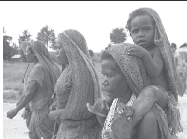
Women from the Mony tribe walk to attend a traditional ceremony for a handover of land from the tribe to the government in Waghete Paniyai village in Indonesia's Papua province on 29 Jan, 2009. Picture taken on 29 Jan, 2009.

There has been no report of casualties and property damages so far.—Internet