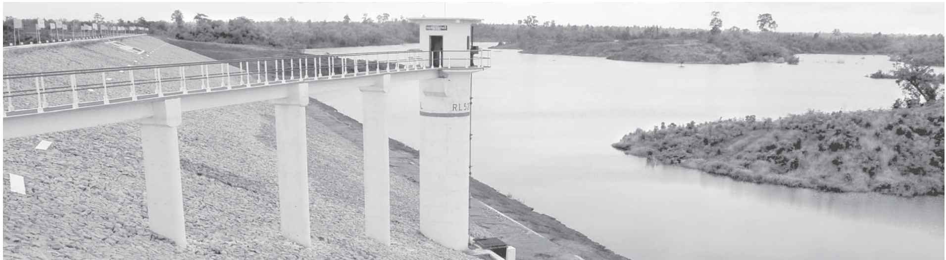
Photo shows storage of water at Chaungmange Dam built near Pannyosein Village of Nay Pyi Taw Lewe Township. (See page 10)

Article: Nu Nu Yi & Aye Thanda Thein; Photo: Myanma Alin