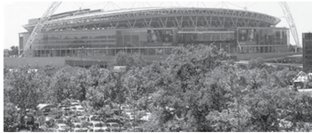
Wembley stadium in north-west London, pictured in May 2007. Wembley was on Thursday chosen by UEFA to host the 2011 Champions League final with the same season's UEFA Cup final going to Dublin's new Lansdowne Road ground.

As for whether or not Beckham would be in Capello's plans for the 2010 World Cup in South Africa, by which time the midfielder would be 35, the coach said: "We have to qualify first and only then will I think about who to select."—Internet