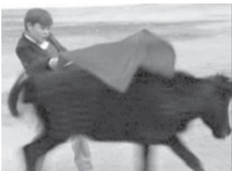
Michelito first entered a bullfighting ring when he was four.

The controversial spectacle was given a last minute go-ahead by the authorities despite pressure from child pro-