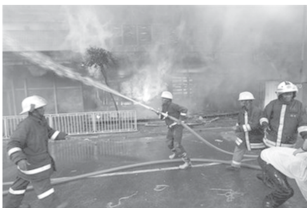
Nairobi fire brigade attempt to extinguish a fire which engulfed a supermarket in Nairobi, Kenya, on 28 Jan, 2009. Thousands of people have streamed out of their offices in downtown Nairobi as a massive fire engulfs a supermarket, sending plumes of black smoke into the sky. Police Commissioner Mohamed Hussein Ali said Wednesday that authorities were investigating the cause of the fire and whether there were any casualties.