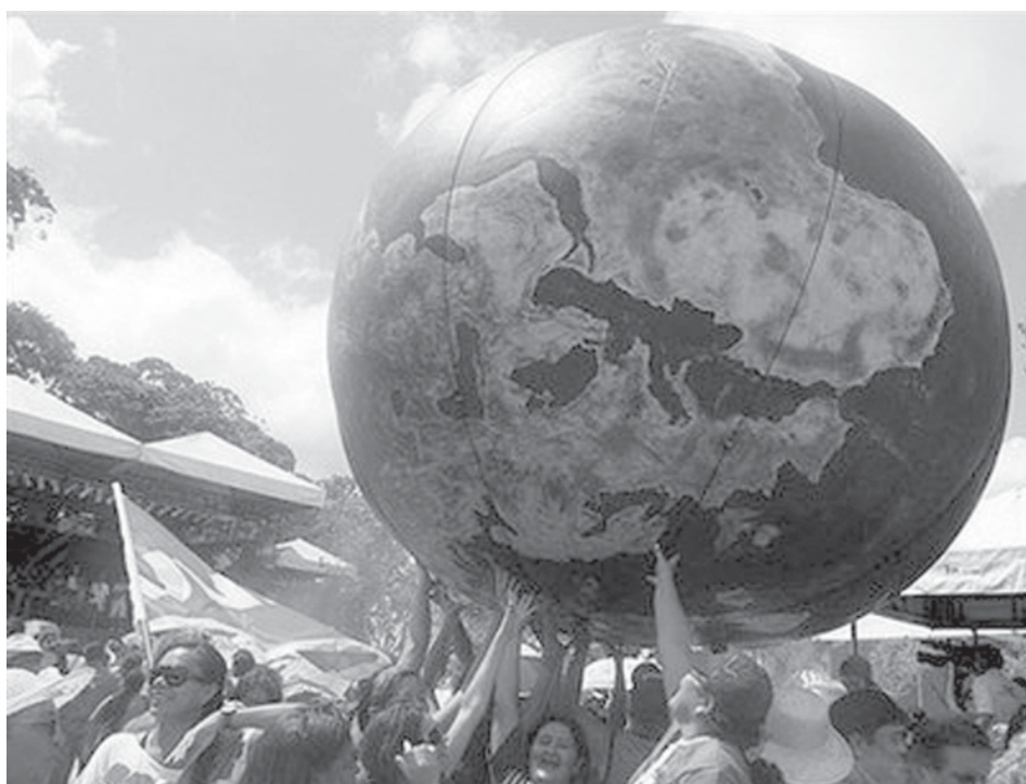
People transport a globe in a parade held during the World Social Forum in Belem, in Para, in the heart of the Brazilian Amazon. Leftist groups attending the World Social Forum (WSF) in Brazil kicked off their week of activities Wednesday with a call for greater protection of the Amazon basin.

Researchers from the New York Institute of Technology had previously demonstrated that a process called photo-irradiation using 405-nm light destroys MRSA strains grown in culture. In the current study, the authors exposed bacterial colonies of MRSA to various doses of 470-nm light, which emits no UV radiation.—Internet