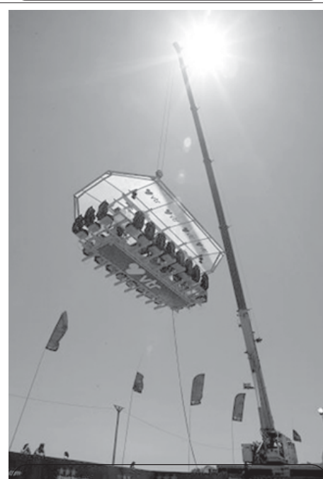
Guests have dinner at an event known as “Dinner in the Sky” as they are seated around a table that is lifted by a crane in Vina del Mar city, about 75 miles (120 km) northwest of Santiago. Dinner in the Sky is hosted at a table that accommodates 22 people around a table suspended at a height of 50 metres by a crane.