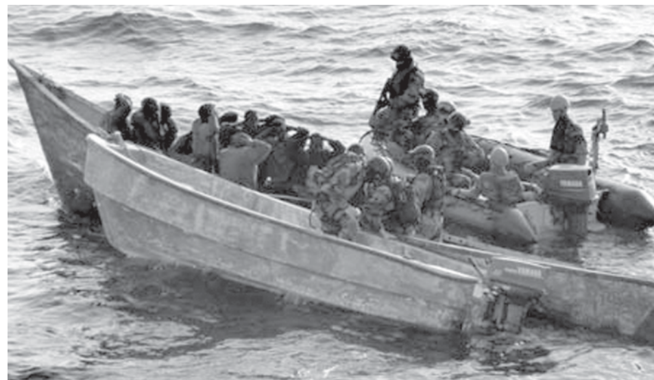
Commandos from the "Floreal", a French frigate, arrest Somali pirates in the Gulf of Aden.

The French navy has previously handed over several batches of pirates to local authorities who tried them in especial courts in the region which has been a hotbed for piracy and hostage taking. Xinhua