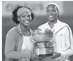
Serena (left) and Venus Williams of the US pose with their trophy after victory in their match against Ai Sugiyama of Japan and Daniela Hantuchova of Slovakia at the Australian Open.