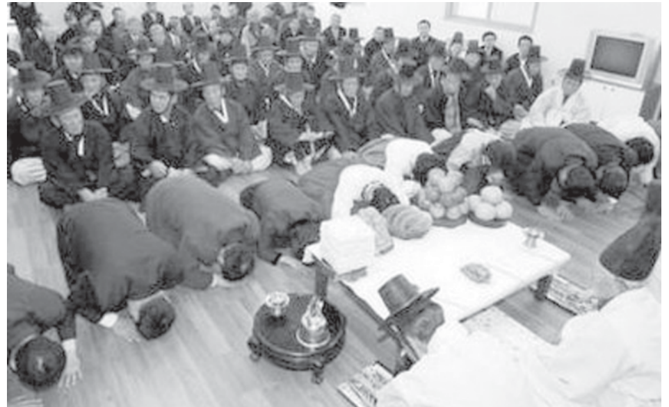
Residents bow to the head (bottom R) of their village and other seniors during a ceremonial event in a village in Gangneung, about 240 km (149 miles) east of Seoul on 27 Jan, 2009.