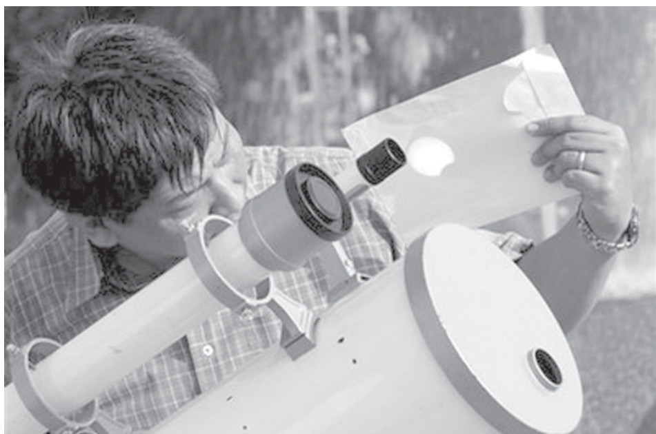
A man reflects a partial solar eclipse through the lens of a telescope while watching the phenomenon at Chulalongkorn University in Bangkok, Thailand, on 26 Jan, 2009.—INTERNET

The attack took place four days before the country's landmark provincial elections Nineveh Province, with its capital city Mosul, some 400 km north of Baghdad, is said to be one of the last strongholds of al-Qaeda fighters in the war-torn country. — Internet