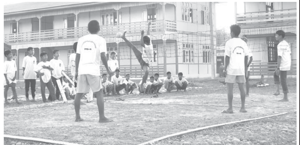
Schoolboys playing Sepak Takraw.