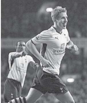
Tottenham Hotspur's Michael Dawson (R) celebrates his goal against Stoke City during their Premier League football match at White Hart Lane in London. Tottenham won 3-1.

LONDON, 28 Jan—Tottenham manager Harry Redknapp has played down talk of swoops for Robbie Keane and Fred but admitted he is looking for a top class striker despite seeing his team put Stoke to the sword.