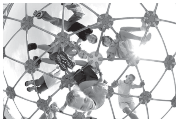
A daily break of 15 minutes or more in the school day may play a role in improving learning, social development, and health in elementary school children.