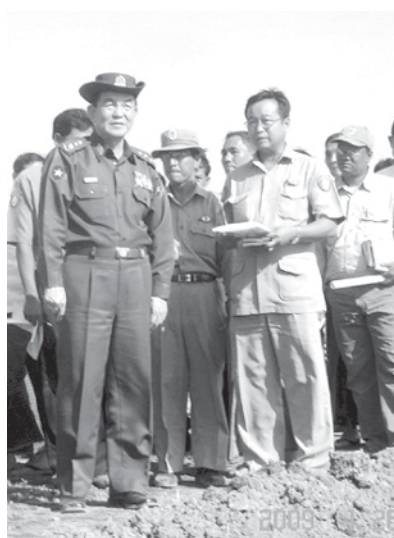
Minister Col Thein Nyunt inspects land reclamation in Labutta.

YANGON, 28 Jan—Minister for Progress of Border Areas and National Races and Development Affairs Col Thein Nyunt attended a ceremony to open Ayeyawady jetty in Labutta township to mark the 62 nd Anniversary Union Day on 26 January.