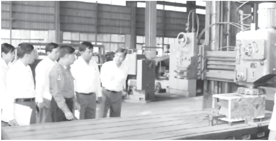
Minister Vice-Admiral Soe Thein visits No. 2 Automobile Factory (Htonbo).