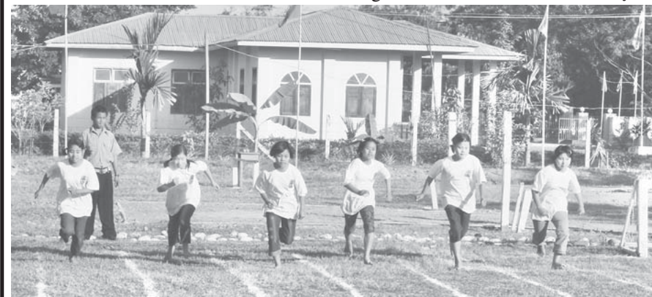
Schoolgirls in a sports event to mark the 61 st Independence Day.