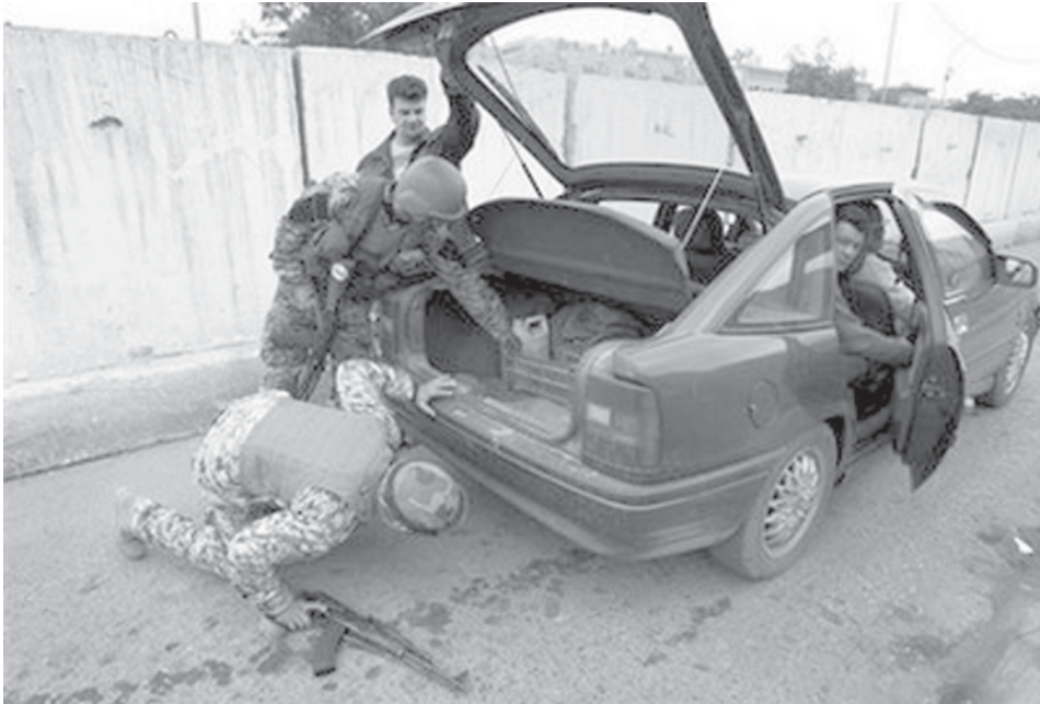
Iraqi police inspect a car at a checkpoint in the neighbourhood of Sadr City in Baghdad, Iraq. As the sixth anniversary of the US-led invasion nears, there are ample signs that Baghdad is settling back into some regular rhythms, but it's still far from a comfortable trust that the war and its violent offshoots can be declared over.