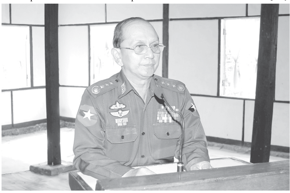
Prime Minister General Thein Sein meets with departmental officials, members of social organizations and local people in Myebon Township, Rakhine State.