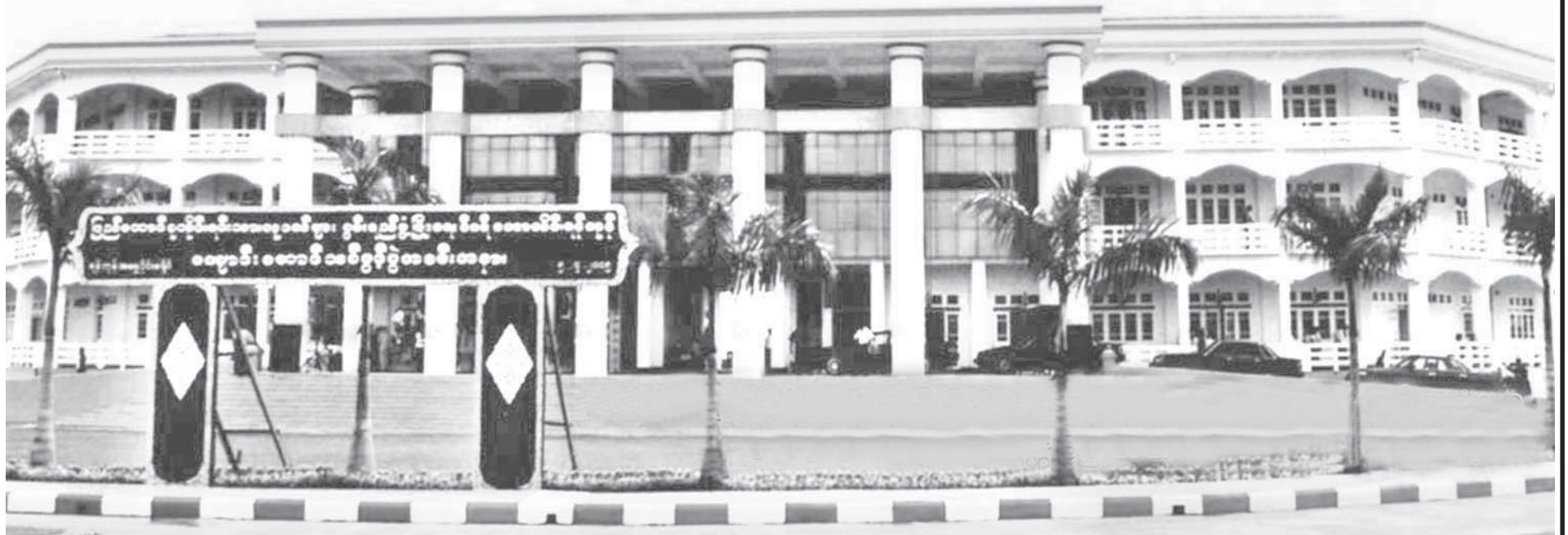
Nationality Youth Resource Development Degree College (Yangon).

in 1989 expedited regional development tasks; that human resource development of a region was essential for sustainable development of the region, so Chairman of the Central Committee for Development of Border Areas and National Races Senior General Than Shwe gave guidance on development of human resources in border areas; that respecting and (See page 7)