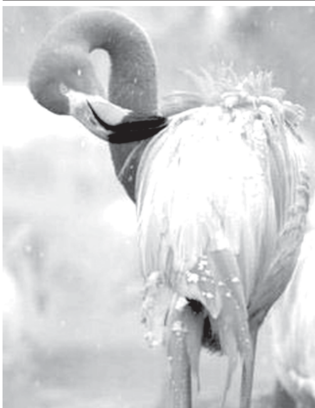
An American Flamingo stands outside in the snow at Smithsonian National Zoo in Washington on 27 Jan, 2009.