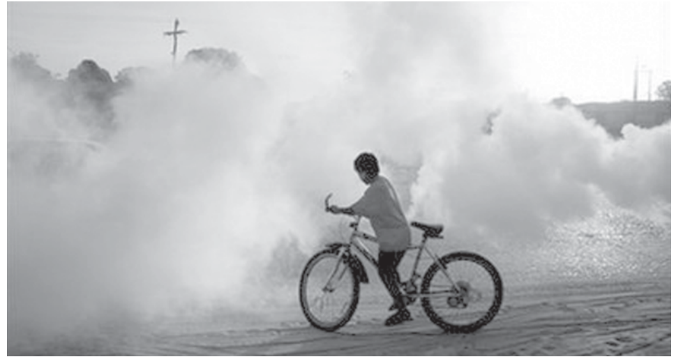
A boy stands on a bike as officials of the departmental health services fumigate during a campaign against Dengue fever in Santa Cruz, Bolivia, on 27 Jan, 2009. Bolivian Health Ministry confirmed more than 4000 classic Dengue fever reports and the decease of three people due to Dengue hemorrhagic fever, the stronger version of this acute febrile disease.—INTERNET

The export of mechanical and electrical products to Russia hit 3.92 billion US dollars, up 76.8 percent than the previous year. Farm produce reached 1.48 billion US dollars, up 25 percent year-on-year. —Internet