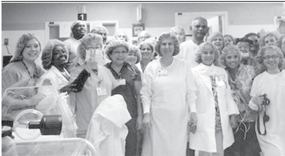
This image provided by Kaiser Permanente Bellflower Medical Center, shows the nursing staff posing for a photograph after delivering octuplets to a mother, on 26 Jan, 2009 in Bellflower, Calif.—INTERNET