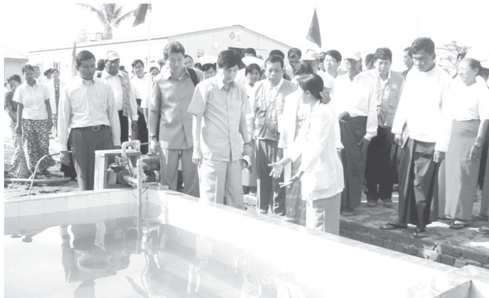
Minister for Health Dr Kyaw Myint views supply of drinking water outside a prefabricated clinic.—MNA