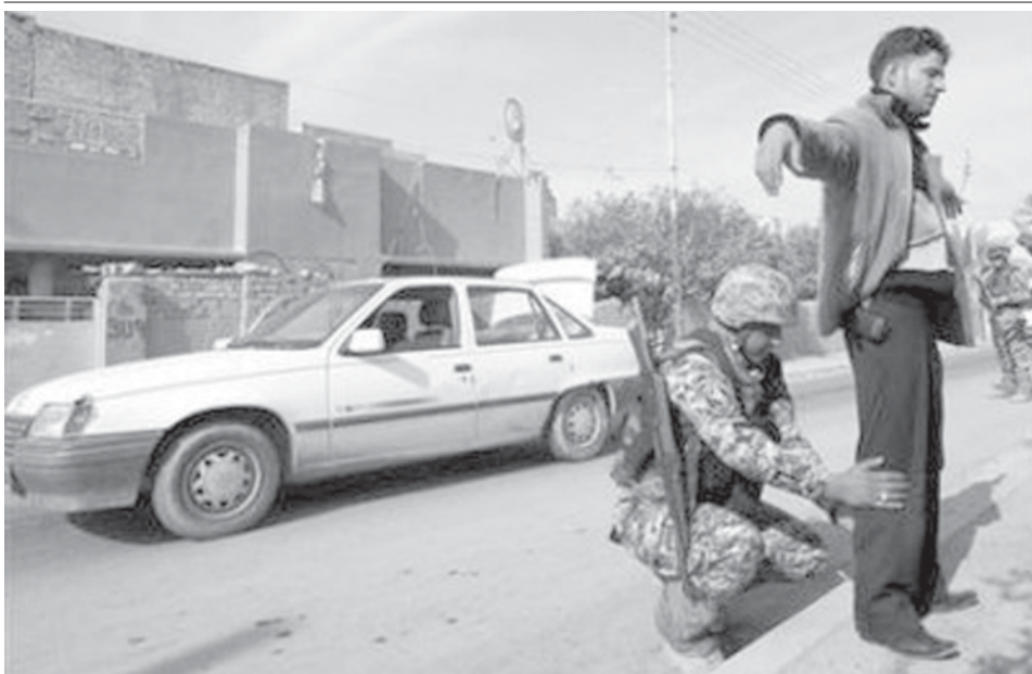
A policeman frisks a motorist in Baghdad's Doura district on 27 Jan, 2009.

"KTK distributes various kinds of NTN bearings but was not appointed as the Sole Agent of NTN products in Myanmar."