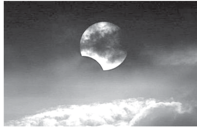
The moon casts a shadow at the sun blocking it partially in a partial solar eclipse as it sets on Monday 26 Jan, 2009 at Manila's bay, Philippines.