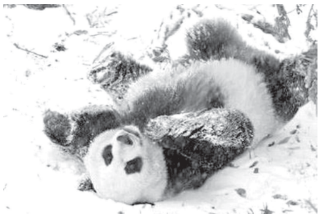
Giant panda Mei Xiang plays in the snow at Smithsonian National Zoo in Washington on 27 Jan, 2009.