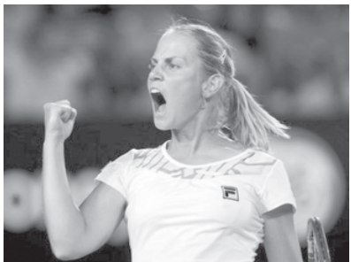
Australia's Jelena Dokic

MELBOURNE, 28 Jan—Australia's Jelena Dokic said her amazing Grand Slam comeback at Melbourne Park had changed her life as the nation's media hailed a prodigal daughter's return to the big time.