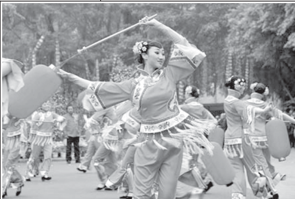
Actors perform folk dances at a tourist resort of Chinese folk culture in Shenzhen, south China's Guangdong Province, on 27 Jan, 2009. A lot of tourists enjoy folk dances and makeup parade in the scenic spot during the Spring Festival holiday.

To date, the SEF has attracted a total of 603 applications from 312 companies, from a wide range of service sectors. Grants approved under the SEF are valued at 31.1 million ringgit (8.61 million US dollars).—Xinhua