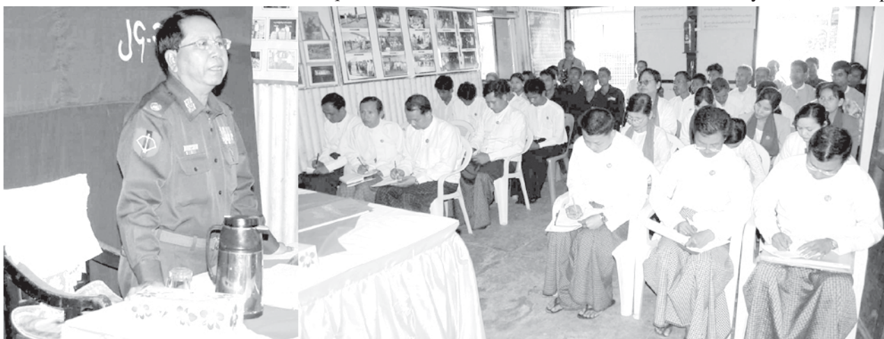
Minister Brig-Gen Kyaw Hsan meets state/district/township level departmental personnel at office of Information and Public Relations Department in Sittway.—MNA