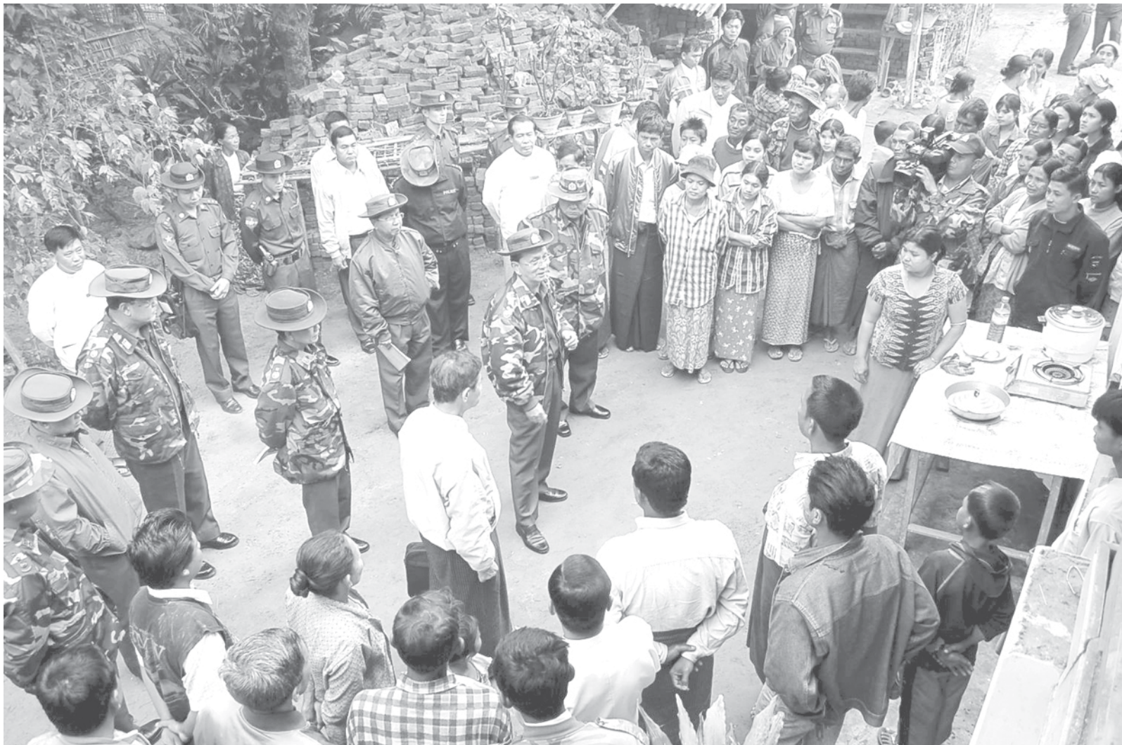
Prime Minister General Thein Sein inspects cooking food with the use of bio-gas at house of farmer U Maung Me in Maungnibyin Village, Sittway Township.—MNA