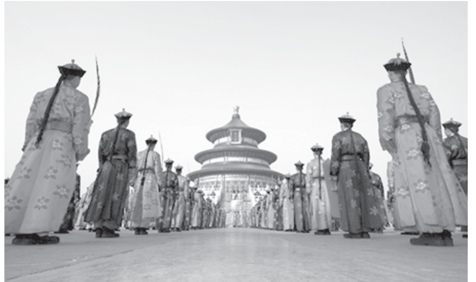
Ritual performers wearing costumes of the royal court of the Qing Dynasty (1644-1911) perform in front of the Hall of Prayer for Good Harvests at the Tiantan (Temple of Heaven) Park in Beijing, capital of China, on 26 Jan, 2009.