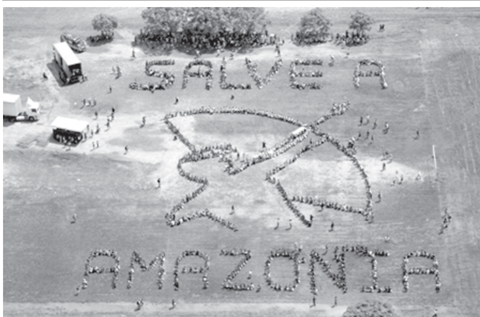
An aerial view shows people protesting against Amazon deforestation during the 2009 World Social Forum near the mouth of the Amazon River in the city of Belem, on 27 Jan, 2009.—XINHUA

All the children killed were under 10, including a set of 5-year-old girl twins and a set of 2-year-old boy twins, police said.—Xinhua