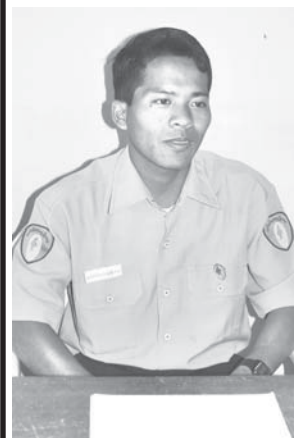
U Kyaw Hsan of Myitkyina Border Areas and National Races Development Office.

(from page 16) responding to the guidance, the ministry had formed the Education and Training Department to step up the tasks; that the 28 schools provided free school education from third standard to matriculation to needy youths of border areas and spent funds of the border areas development project on their basic needs and other requirements; that