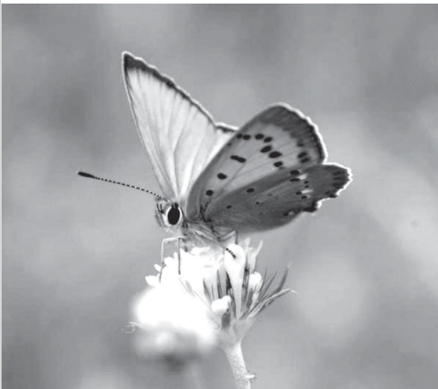
The scarce copper (Lycaena virgaureae) is one of the butterflies, researchers analyzed.

LIEPZIG, 28 Jan — Climate change will cause Europe to lose much of its biodiversity as projected by a comprehensive study on future butterfly distribution. The Climatic Risk Atlas of European Butterflies predicts northward shifts in potential distribution area of many European butterfly species.