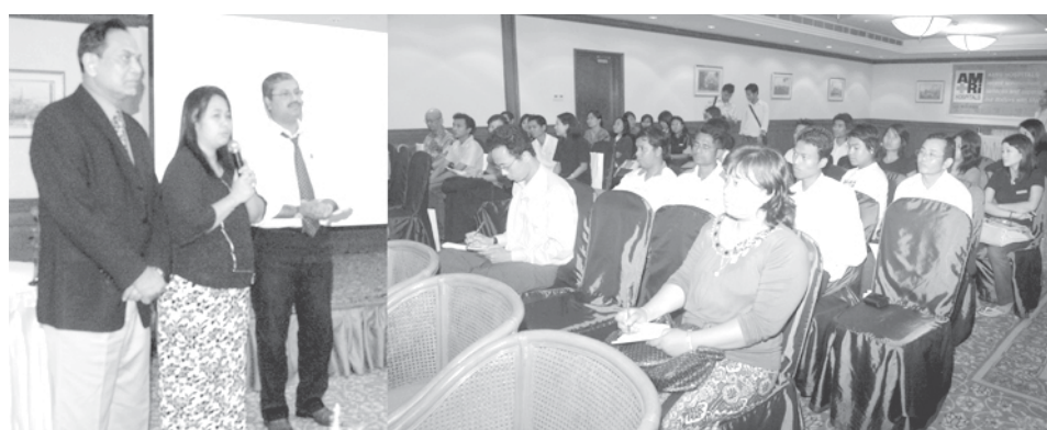
Specialists from AMRI Hospital of India giving medical talks at the Traders Hotel.