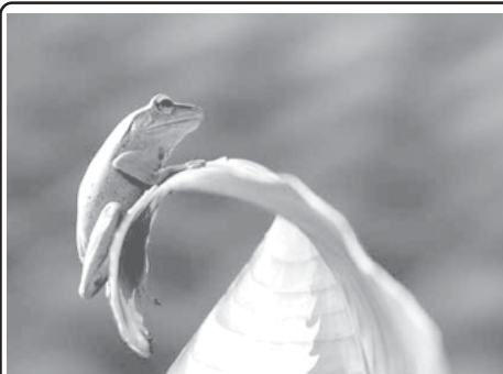
A frog sits on a banana leaf at a garden in Kuala Lumpur.

Iran said it awaited changes in US policies towards it.—Internet