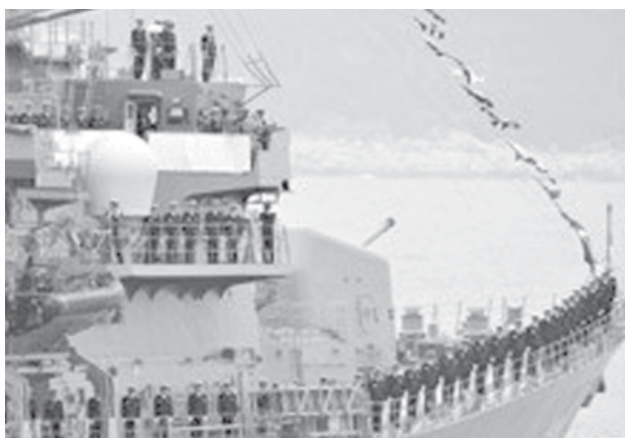
Japan's Maritime Self-Defence Force is only allowed to deploy defensively.—INTERNET

Japan would be joining a multi-national effort against piracy which includes ships from the United States and China. "The pirates' activities off