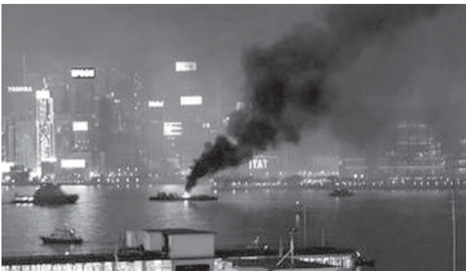
A fire department boat approaches a barge on fire in Hong Kong's Victoria Harbour on 27 Jan, 2009.