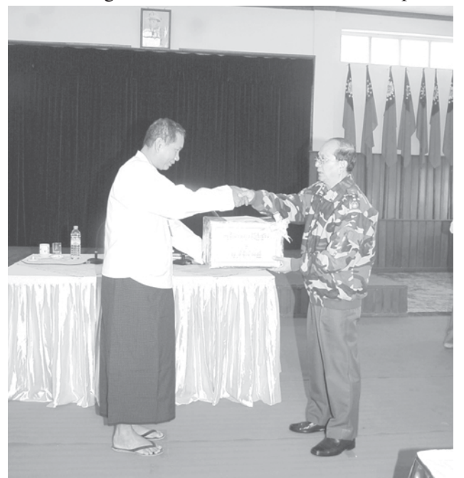
Prime Minister General Thein Sein presents books and journals to self-reliant village libraries at An Town Hall.

After delivering an address, the Prime Minister presented medicines, exercise books and publications for self-reliant village libraries to