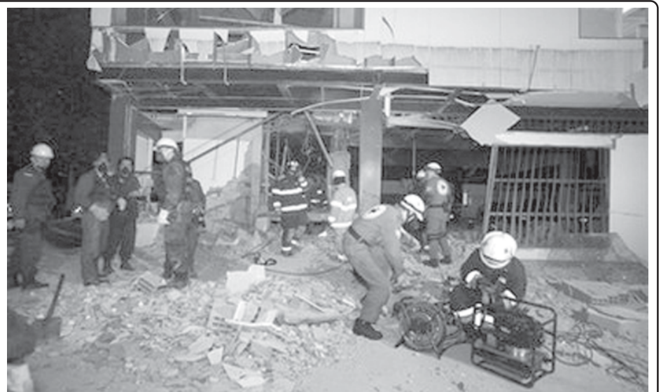
Police officers inspect the area in front of a video store damaged by the explosion of a bomb that killed at least two people in Bogota, on 27 Jan, 2009.