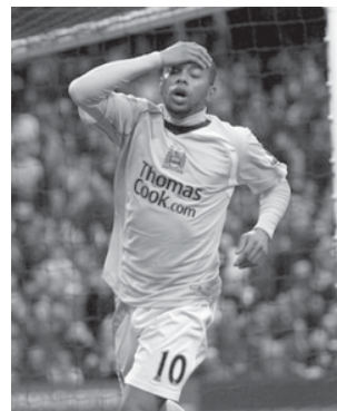
Manchester City striker Robinho

"He strenuously denies any allegation of wrongdoing or criminality and is happy to cooperate with