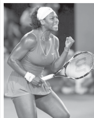
Serena Williams celebrates after beating Russia's Svetlana Kuznetsova during their Women's singles quarterfinal match at the Australian Open tennis tournament in Melbourne, Australia, on 28 Jan, 2009.

Closing the Rod Laver Arena roof and cranking up the air conditioning