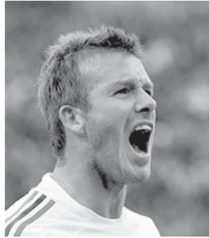
AC Milan's David Beckham

"If Beckham reaches an agreement with the Galaxy, we are prepared to pay a fee," Milan vice president Adriano