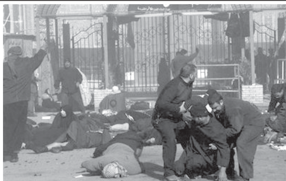
Two men, at right, assist an injured man as other victims lie in the street, after a suicide attack in Baghdad’s northern Shiite neighborhood of Kazimiyah, Iraq, on 4 Jan, 2009.