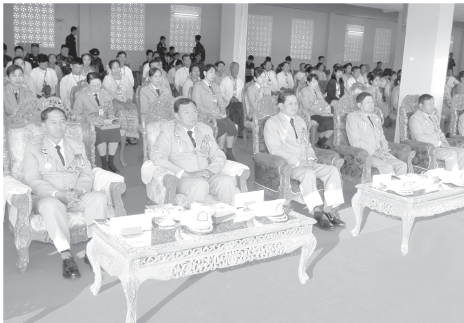
Distinguished guests seen at Graduation Parade of Sixth Intake of Defence Services Institute of Nursing and Paramedical Science.