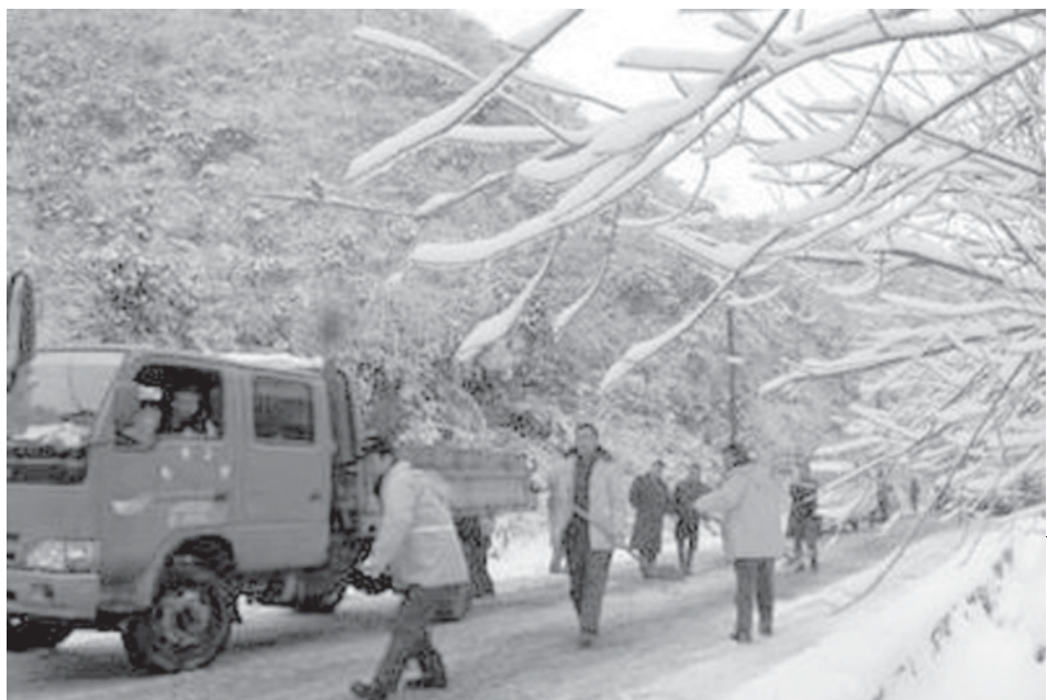
Workers sprinkle sand to prevent vehicles from skidding on a slippery snow-covered road in Miaowangpo, Guizhou Province, on 7 Jan, 2009.