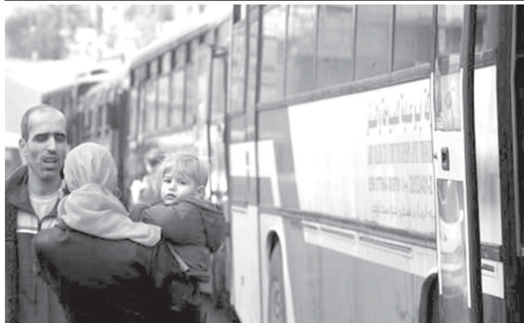
A Palestinian mother and her son with dual citizenship wait outside a bus before they leave the Gaza Strip on 8 January, 2009. INTERNET

WASHINGTON, 8 Jan—As of Wednesday, 7 Jan, 2009, at least 4,223 members of the US military had died in the Iraq war since it began in March 2003. The figure includes eight military civilians killed in action. At least 3,402 military personnel died as a result of hostile action, according to the military’s numbers.— Internet