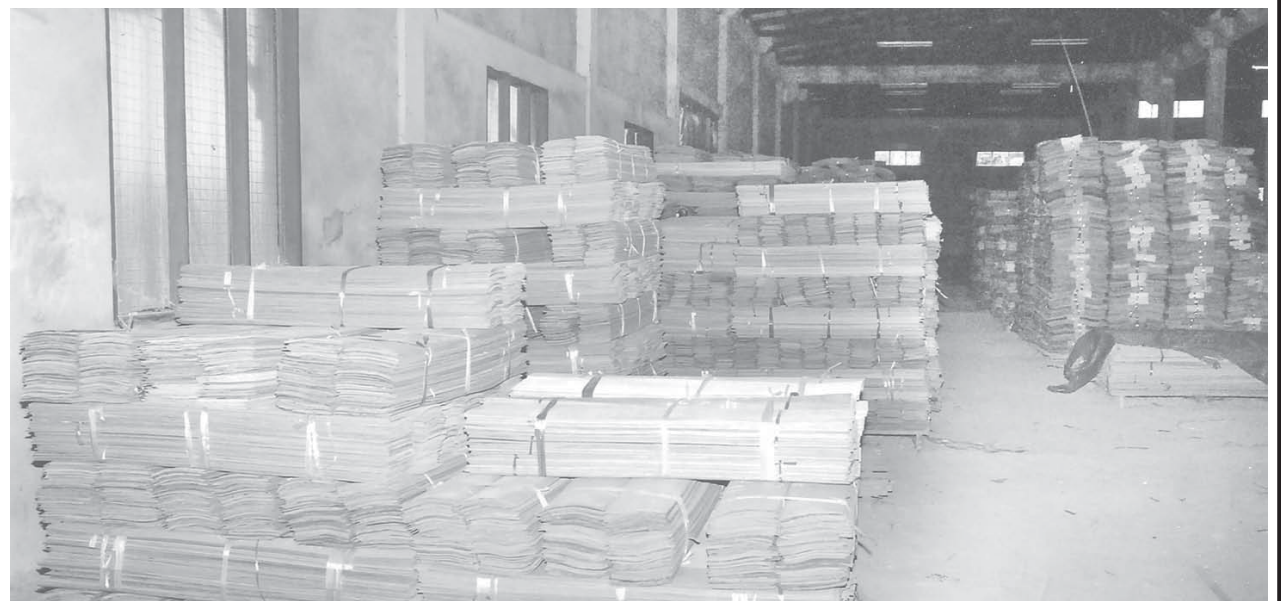
Plywood for export seen at a warehouse.