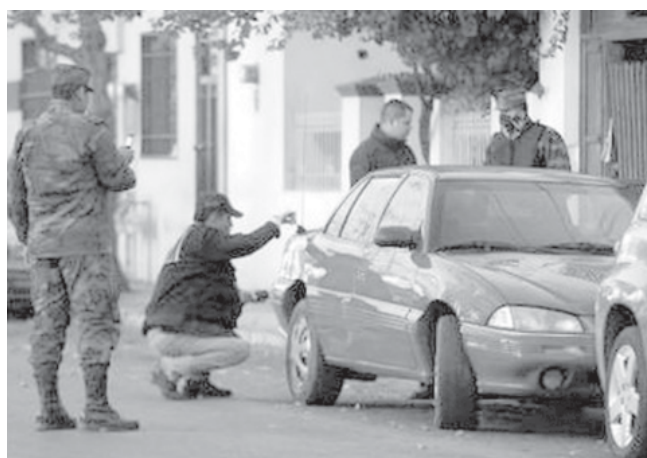
Mexican soldiers and police examine a car related to an attack on the offices of broadcaster Grupo Televisa in Monterrey city, Mexico, on 7 Jan, 2009. Gunmen threw a grenade and opened fire outside the television news station during its evening broadcast in Mexico on Tuesday and left a message warning journalists from reporting on drug war violence.