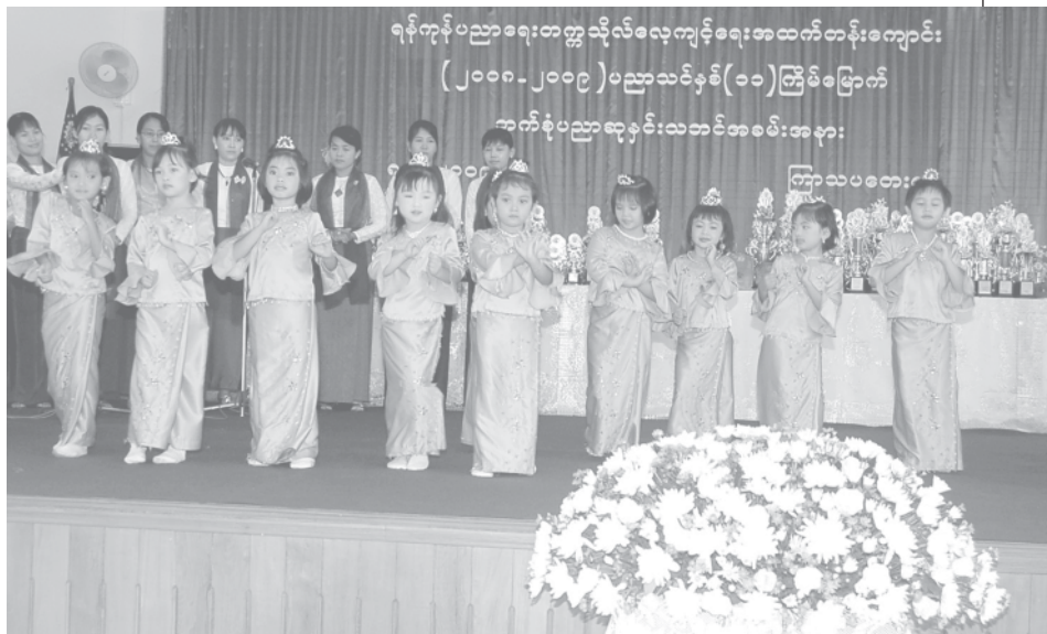
Students perform dances at 11th prize presentation ceremony for 2008-2009 academic year of Yangon Institute of Education Practising High School.