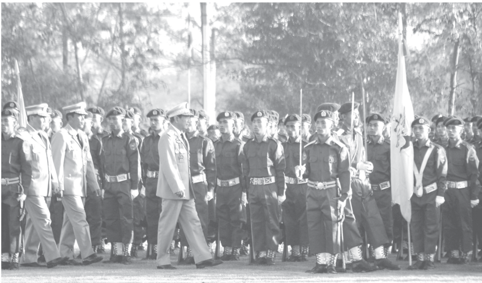
Vice-Senior General Maung Aye inspects companies of DSINPS.