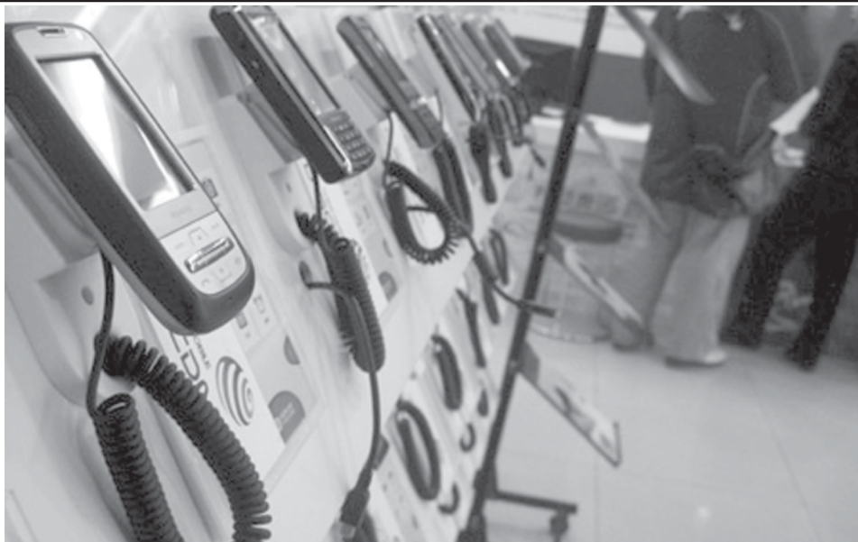
Customers try third-generation (3G) mobile phones at a China Mobile exhibition hall in Beijing, China, on 7 Jan, 2009.