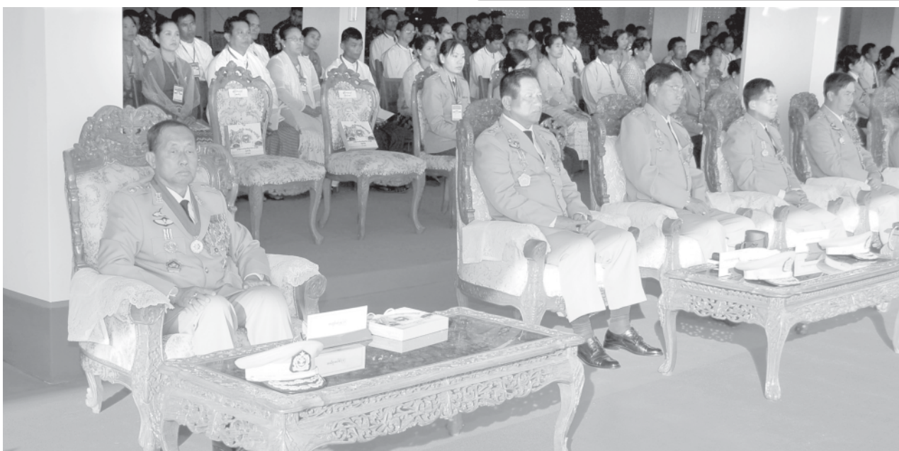
Distinguished guests seen at Graduation Parade of Sixth Intake of Defence Services Institute of Nursing and Paramedical Science.—MNA

After assuming the responsibilities of the State, the Tatmadaw has systematically implemented the infrastructures projects in every corner of the country including the border areas for the human resource development and the development of the State.