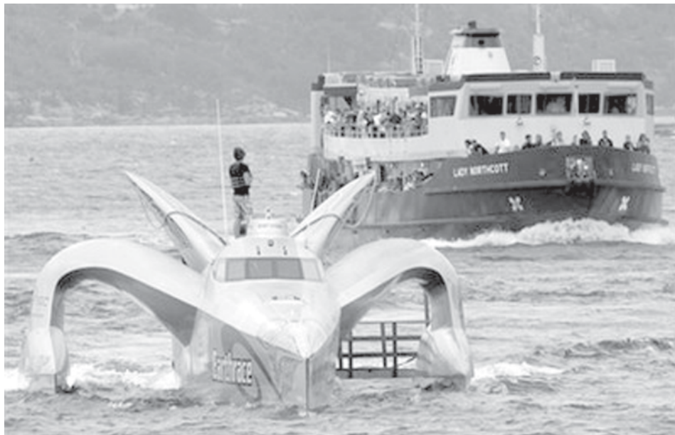
The manly ferry passes behind the 100 percent biodiesel, 100 percent carbon neutral Earthrace at Manly wharf in Sydney, Australia, on 8 Jan, 2009. Earthrace smashed the round-the-world record by almost 14 days, completing almost 24,000 nautical miles in just 60 days 23 hours and 49 minutes. Earthrace is a 24-metre (78-foot) tri-hull wavepiercer that has been designed and built specifically to get the record for a powerboat to circumnavigate the globe.—INTERNET

Meanwhile, WHO said that it remains safe to consume pork meat, as long as it is purchased in accredited outlets and it is handled and cooked properly. Meat from suspect pigs, sick pigs or pigs found dead, should not be eaten nor fed to other animals, and proper hygiene precautions and protection should be taken to dispose of sick or dead pigs, health experts warned the public.—Internet