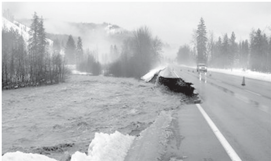
In this photo provided by the Washington State Department of Transportation, water rushes past a washed out road near Blewett Pass on US highway 97 in Washington State on 7 Jan, 2009.—INTERNET