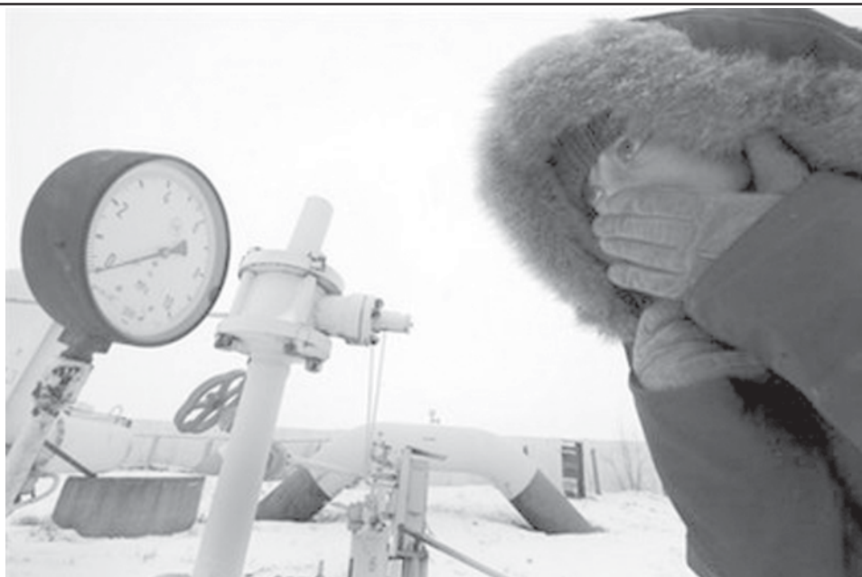
A woman looks at a manometer set on a gas pipe at a compressor station in the Ukrainian city of Boyarka. Envoys from Russia and Ukraine go to Brussels on Thursday for emergency EU-brokered talks to resolve a bitter gas fight between the two ex-Soviet giants that has engulfed Europe in a major energy crisis.—INTERNET

Poland’s Defence Minister Bogdan Klich told Gazeta Wyborcza daily that the number of Polish troops in Afghanistan should be increased from the present 1,600 to 2,000-2,200. The Polish government is due to discuss participation of Polish troops in military missions next week, according to PAP.—Internet