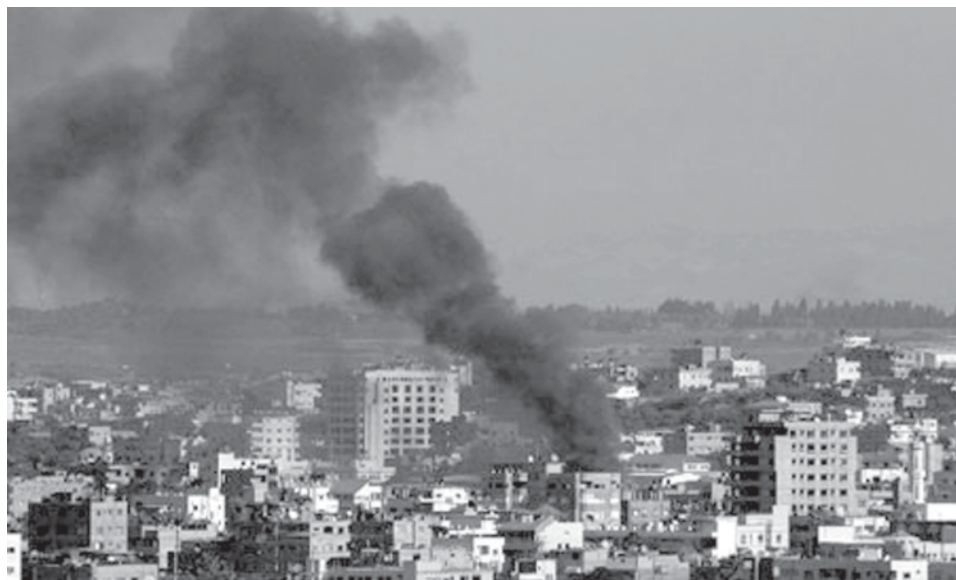
Dense smoke rises from Gaza city after Israeli bombardment on 8 Jan, 2009.