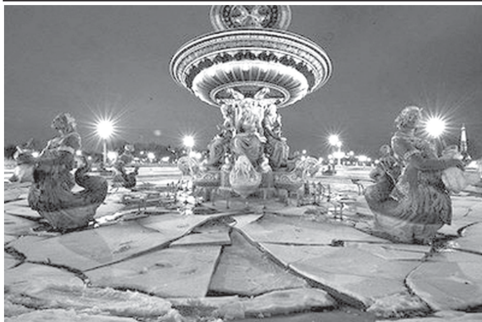
Icy Paris : A fountain is covered with ice and snow on Place de la Concorde, in Paris.

Forecast for Mandalay and neighbouring area for 9-1-2009: Generally fair weather.