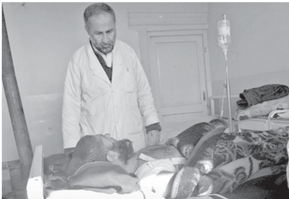
An Afghan doctor stands by the bed of a man, who allegedly got wounded during a US strike, in a hospital in Laghman Province, northeast of Kabul, Afghanistan, on 7 Jan, 2009.