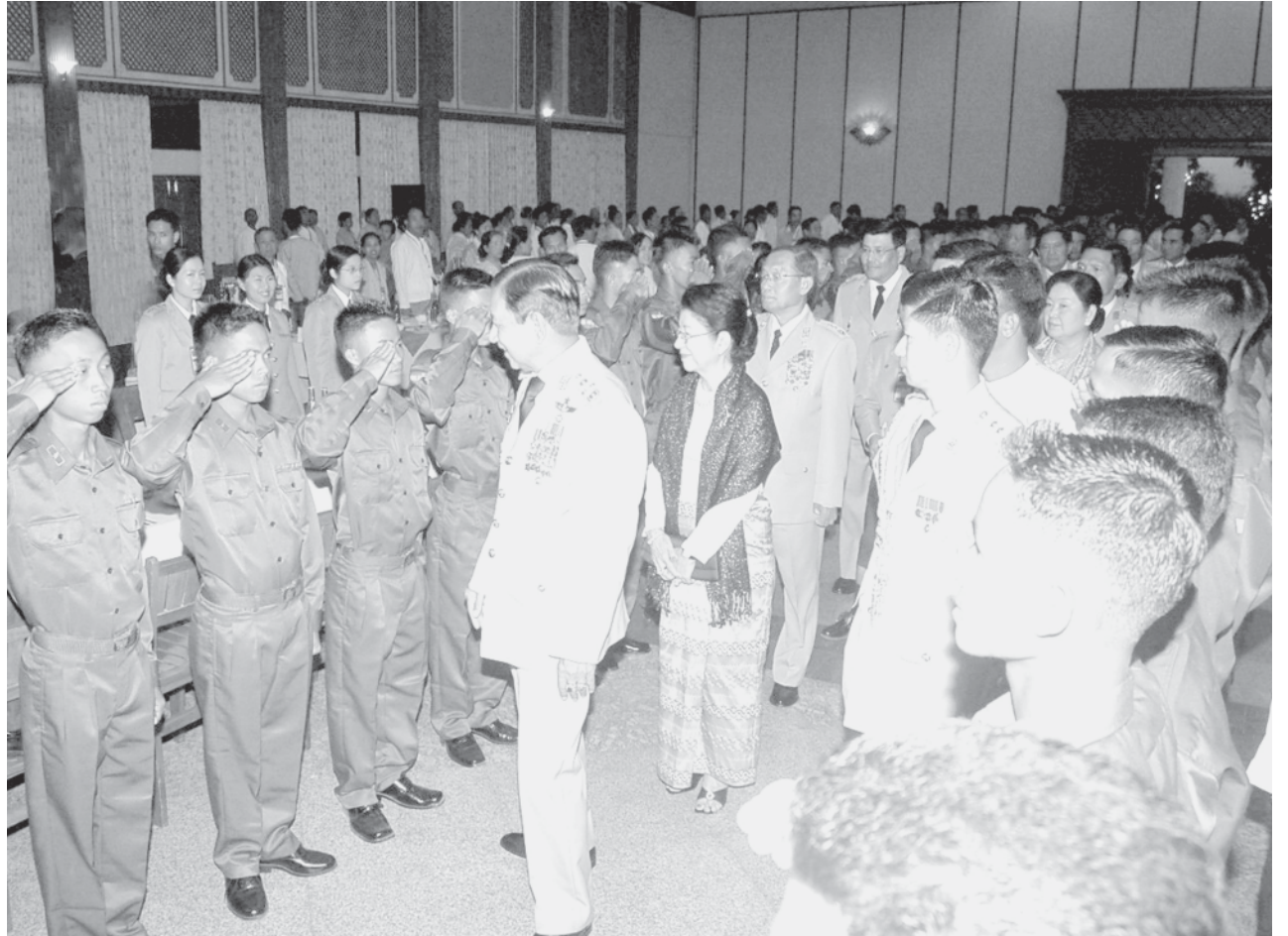
Vice-Senior General Maung Aye attends graduation dinner of Sixth Intake of Defence Services Institute of Nursing and Paramedical Science at auditorium of Convocation Hall of DSMA.