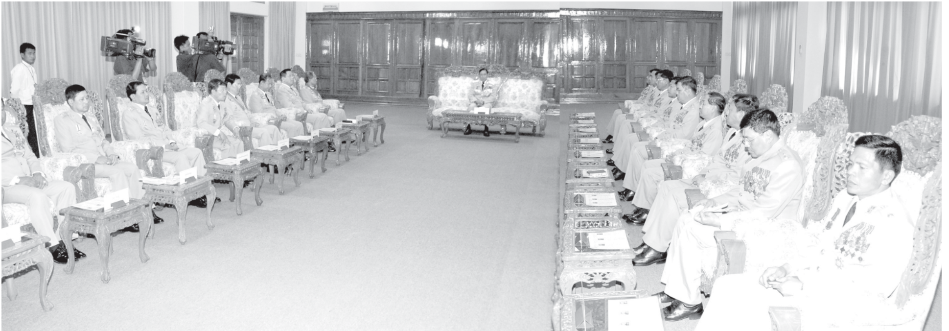
Vice-Senior General Maung Aye cordially meets with three outstanding trainees of Sixth Intake of Defence Services Institute of Nursing and Paramedical Science and their parents at the main lecture hall of the Defence Services Medical Academy.