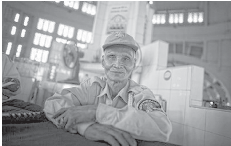
A security guard smiles as he stands watch at Central Market in Phnom Penh, Cambodia on 8 Jan, 2009. The market, which features an art-deco style building, has been serving the Cambodian capital since 1935.

SHIPPING AGENCY DEPARTMENT MYANMA PORT AUTHORITY AGENT FOR: M/S GATI COAST TO COAST Phone No: 256908/378316/376797