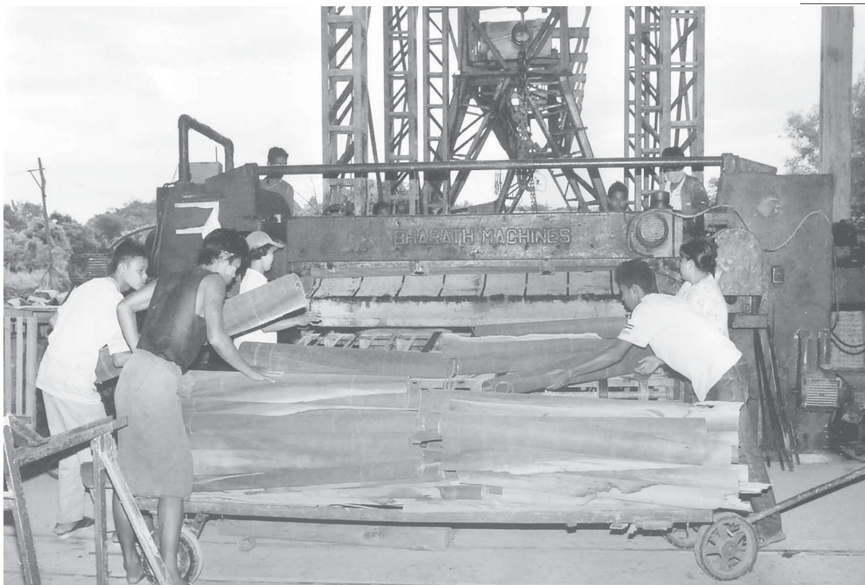
Plywood sheets being produced from timber logs with the use of heavy machinery.

arrived at the factory, sheets of plywood were being produced.