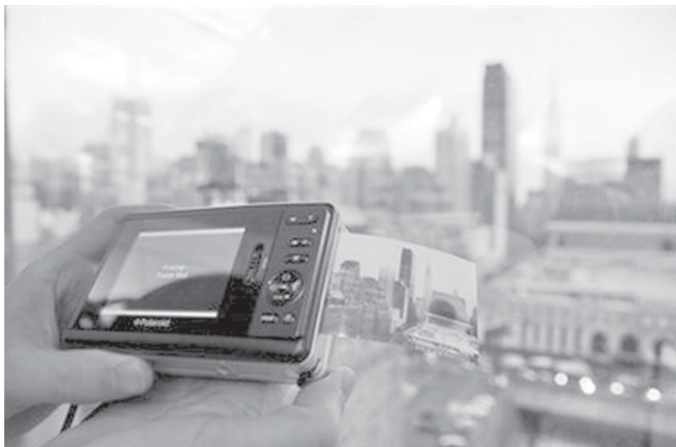
The Polaroid Zinc instant print camera is demonstrated on 31 Dec, 2008 in New York.