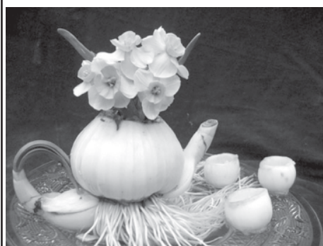
Photo shows a set of tea ware carved out of the daffodil, at a daffodil nursery garden in Zhangzhou City, southeast China's Fujian Province. Daffodil sculpture for indoor decoration has become increasingly popular among local people at the current high season of narcissus efflorescence.