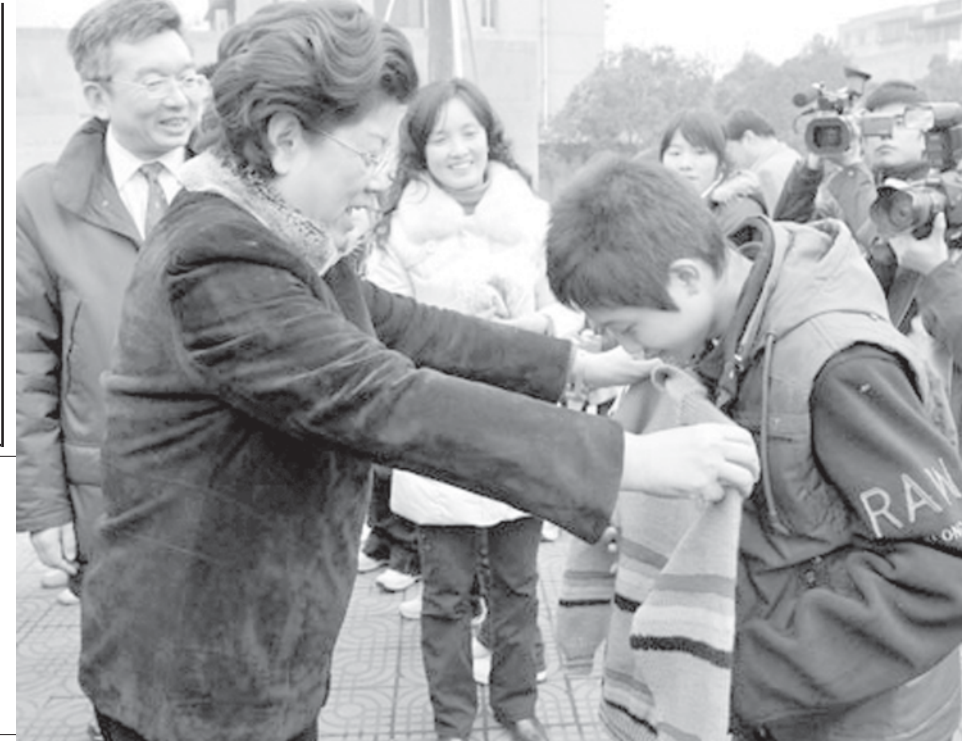
Chen Zhili (L), president of All-China Women's Federation and vice chairwoman of the Standing Committee of China's National People's Congress, selects a sweater for a student who lost parents during the devastating earthquake hitting Sichuan on 12 May, 2008 at Tanghu High School in Dujiangyan City, southwest China's Sichuan Province, on 6 Jan, 2009.