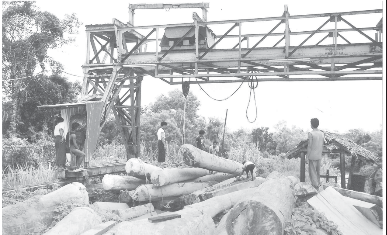
Timber logs being lifted by crane for making plywood.

He added, "Furthermore, thanks to establishment of the