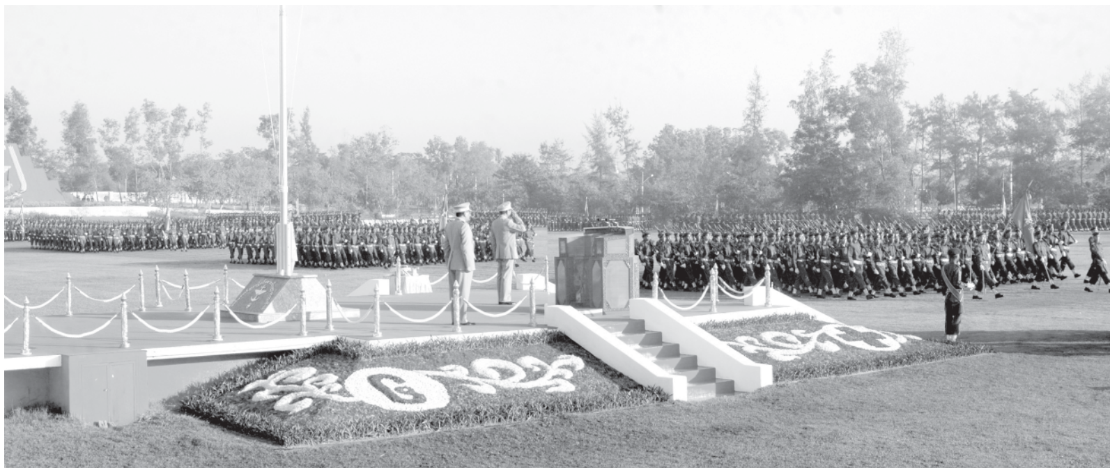
Vice-Senior General Maung Aye takes the salute of the DSINPS companies.