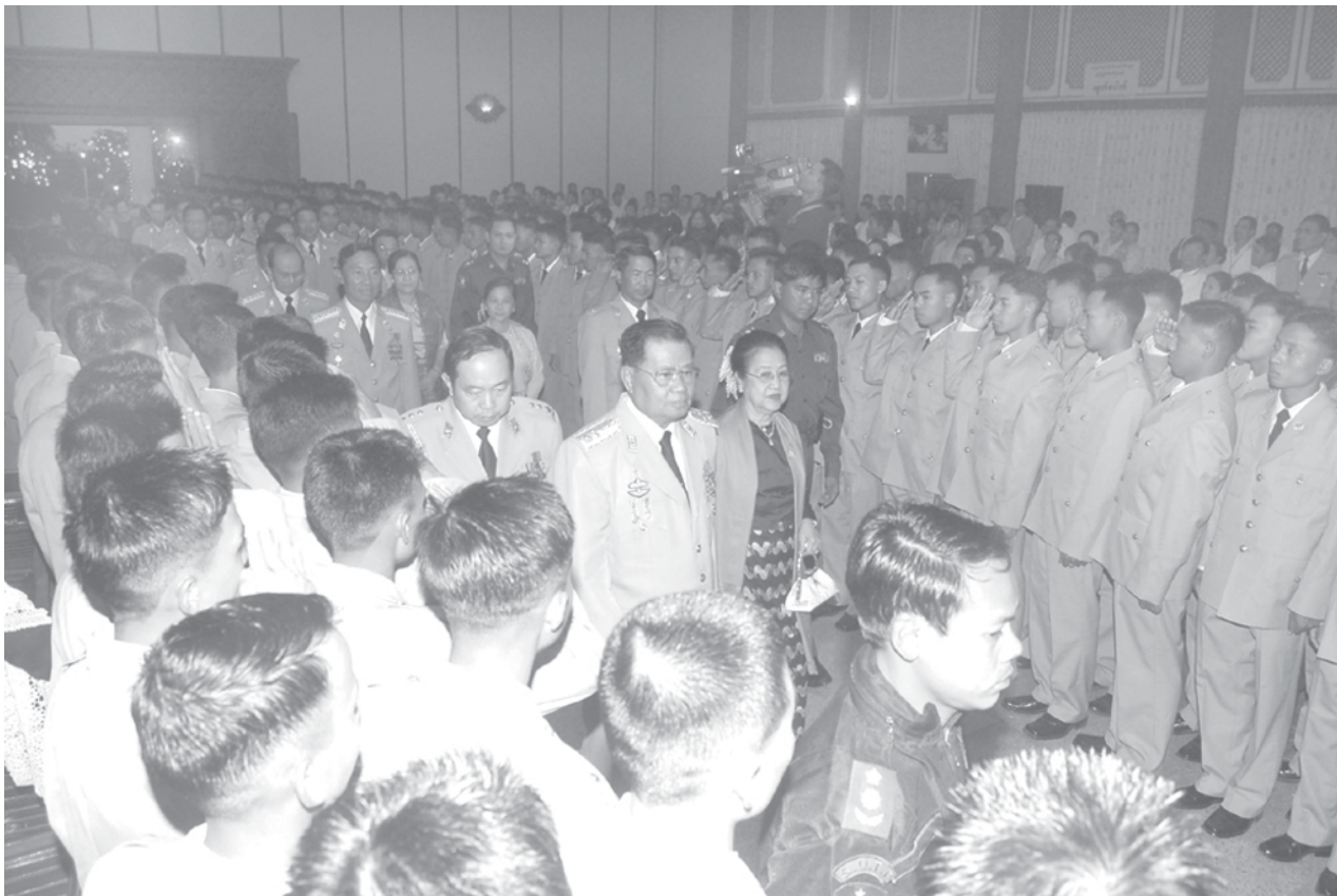
Commander-in-Chief of Defence Services Senior General Than Shwe attends graduation dinner of 10 th Intake of Defence Services Medical Academy.

NAY PYI TAW, 26 Dec — Chairman of the State Peace and Development Council Commander-in-Chief of Defence Services Senior General Than Shwe