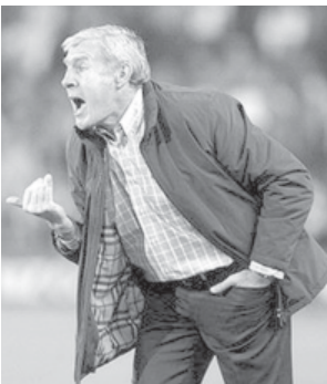
Former Paris St Germain and Athletic Bilbao coach Luis Fernandez has agreed to take over as coach at struggling French second division side Reims, club sources said on Thursday.