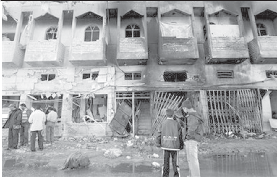
People stand at the site of car bomb explosion in Shula, Baghdad, Iraq, on 25 Dec, 2008. The bombing outside a restaurant frequented by police killed four people and wounded 25 others in the Shiite neighbourhood of Shula.