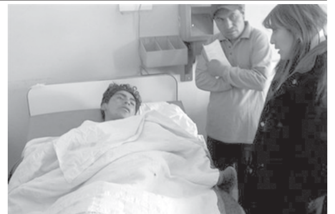
a man, victim of a tear gas grenade detonated in a disco, rests as he speaks with an attorney, right, at a hospital in Juliaca, Peru, on 25 Dec, 2008. Peruvian police say five nightclubbers are dead after a tear gas grenade was detonated in the middle of a crowded disco.

Authorities are investigating how the suspects could have been in possession of the gas.—Internet