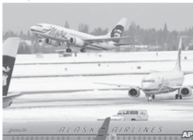
The airport has been hit by heavy snow this week.—INTERNET

Fire engines and ambulances are on the scene. The airport has been hit by heavy snowstorms this week. The plane had been preparing to take off on a flight to Burbank, California, with 143 passengers and a crew of 5, reports said.—Internet