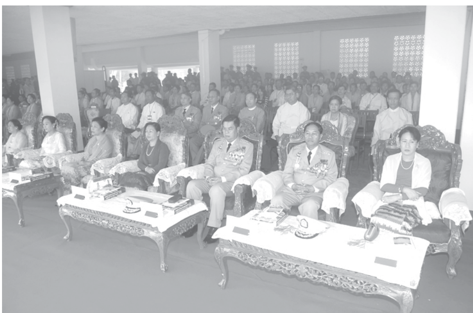
Dignitaries seen at Graduation Parade of 10th Intake of Defence Services Medical Academy.