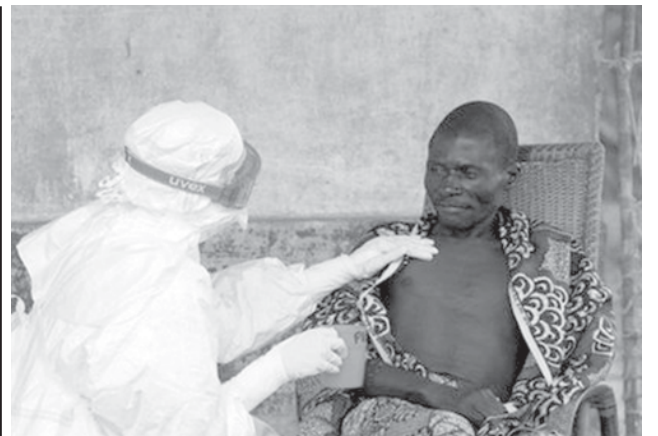
A nurse comforts a 43 year old patient who has been laboratory confirmed to have Ebola haemorrhagic fever (EHF). A deadly Ebola outbreak in the central Democratic Republic of Congo has killed nine and infected 21, the UN-sponsored radio Okapi quoted the health minister as saying.