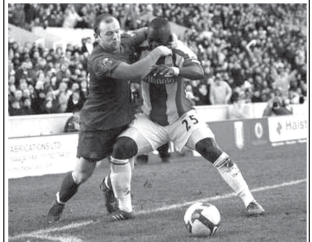
Manchester United's Wayne Rooney (L) tussles with Stoke City's Abdoulaye Faye during their English Premier League soccer match at the Britannia Stadium in Stoke-on-Trent, central England on 26 Dec, 2008.