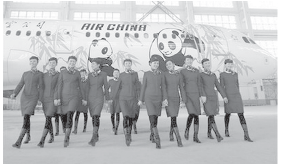
Air stewardesses pose in front of a Chinese airliner's A321 plane painted with images of the Giant Panda to promote tourism at the Shuangliu International Airport in Chengdu of southwest China's Sichuan Province on 25 Dec, 2008.