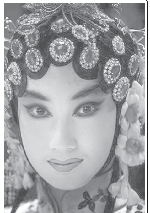
A performer dressed in full Peking Opera costume takes part in a press conference for the world premiere of director Chen Kaige’s new movie “Mei Lanfang” (“Forever Enthralled”) in Beijing, China. The movie marks Kaige’s comeback attempt after his last movie, the epic fantasy movie “The Promise,” was panned by critics three years ago.