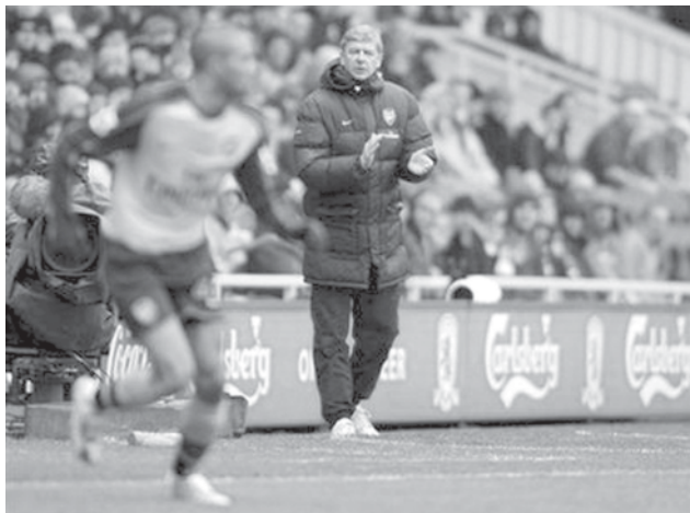
Arsenal's manager Arsene Wenger is expected to revive his interest in Liverpool midfielder Xabi Alonso as soon as the January transfer window opens to compensate for the loss of club captain Cesc Fabregas.