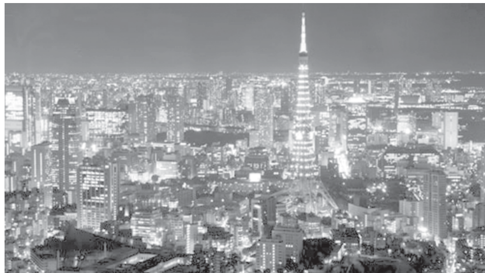
The Tokyo Tower is decorated with colourful lights in Tokyo, capital of Japan, to marks its 50th anniversary on 25 Dec, 2008. The 333-metre-high tower opened to public in 23 Dec, 1958, and has attracted about 157 million tourists since then.