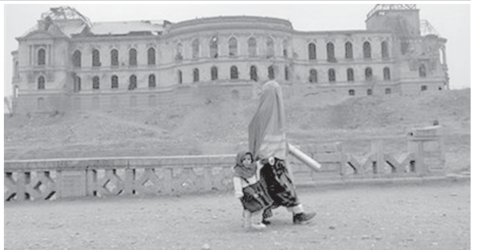
An Afghan woman walks with her daughter past the Darul Aman’s palace, destroyed during the civil war of 1992, in Kabul, Afghanistan, on 19 Dec, 2008.—INTERNET

A Pakistani paramilitary soldier stands guard in southwestern province of Baluchistan. Two Pakistani girls were killed Friday when a bomb exploded in their home in a remote village in restive southwestern Baluchistan Province, police said.—INTERNET