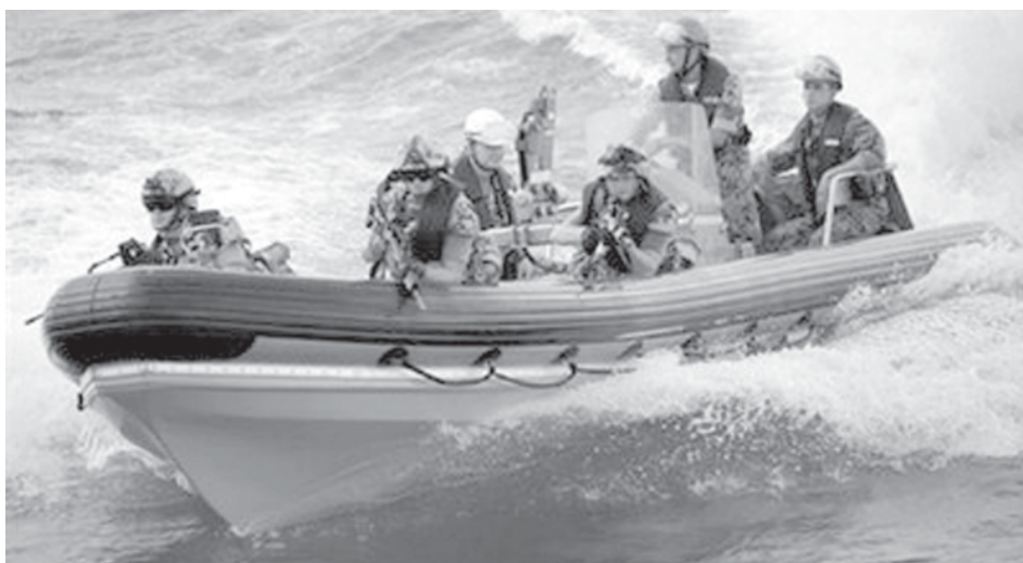
German soldiers take part in a maneuver to secure the frigates Karlsruhe and Mecklenburg-Vorpommern in Djibouti on 23 Dec, 2008. The German navy foiled a hijack attempt by Somali pirates on an Egyptian bulk carrier Thursday that left one crewman wounded on the merchant ship, Germany's military said.