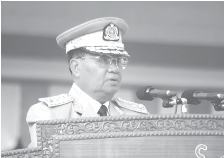
Senior General Than Shwe delivers an address at Graduation Parade of 10th Intake of Defence Services Medical Academy.

It is necessary to accumulate experiences by making systematic research on the characteristics of region-wise diseases.