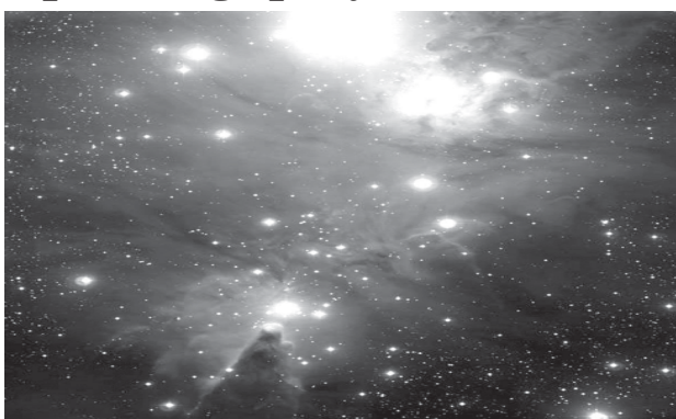
The colour image of the region known as NGC 2264.

LA SILLA, 26 Dec — NGC 2264 lies about 2600 light-years from Earth in the obscure constellation of Monoceros, the Unicorn, not far from the more familiar figure of Orion, the Hunter. The image shows a region of space about 30 light-years across.