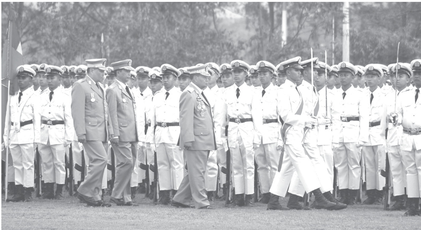
Commander-in-Chief of Defence Services Senior General Than Shwe inspects graduation cadet companies of DSMA.

The effectiveness of the micro-biological medicines is amazingly improving with the advancement of medical sciences. However, it