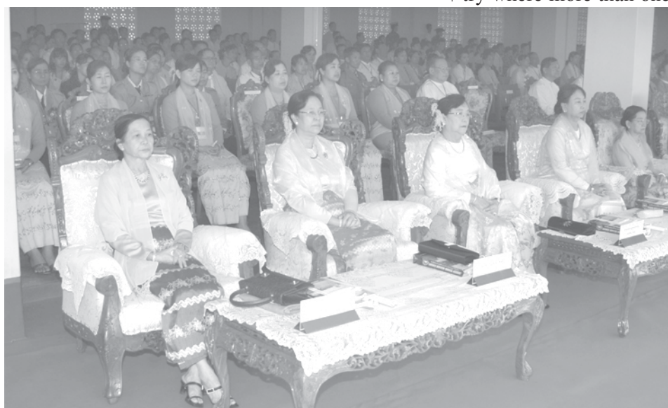
Distinguished guests seen at Graduation Parade of 10 th Intake of Defence Services Medical Academy.

Since seventy-five per cent of the population is living in the rural areas, national developments can be achieved by uplifting of their living standards. I