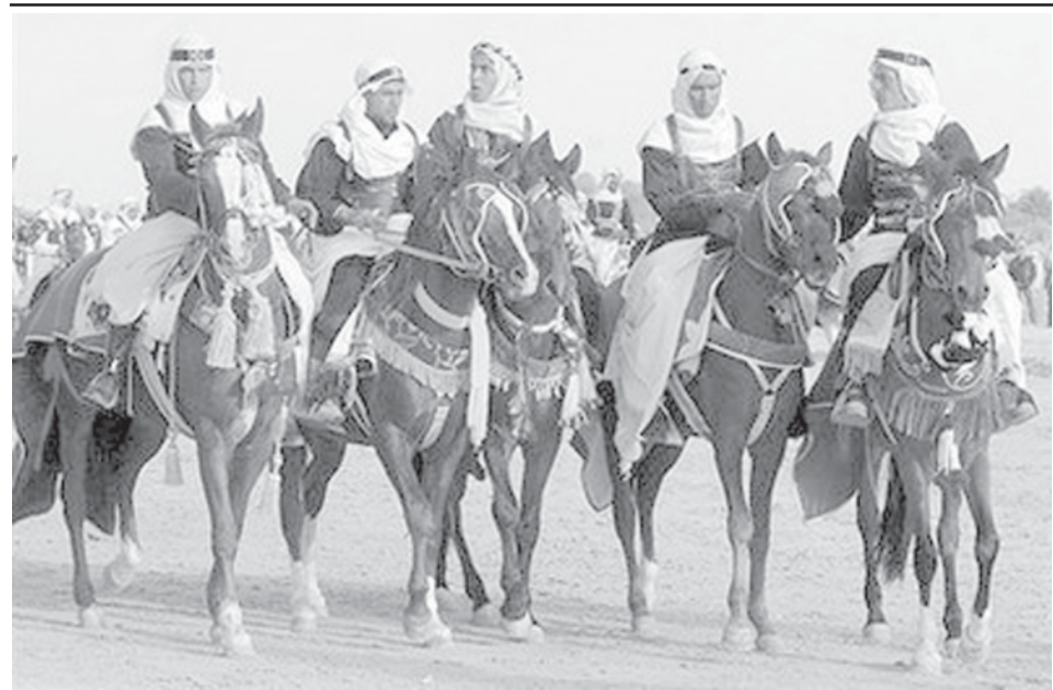
Horsemen parade during the opening of the Sahara International Festival in Douz, south-western Tunisia. The 41st International Sahara Festival opened with camel races, desert dog hunting and Saharan music launching four days of cultural events with participants from around the world.