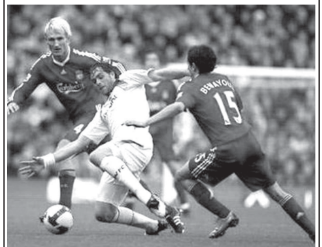
Liverpool's Sami Hyypia (L) and Yossi Benayoun (R) challenge Bolton Wanderers' Johan Elmander during their English Premier League soccer match in Liverpool, northern England on 26 Dec, 2008.