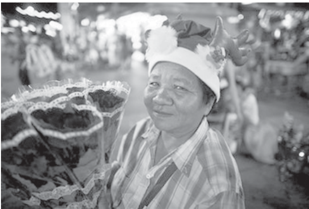
A Thai vendor smiles as she sells roses in Phuket, Thailand, on 25 Dec, 2008.