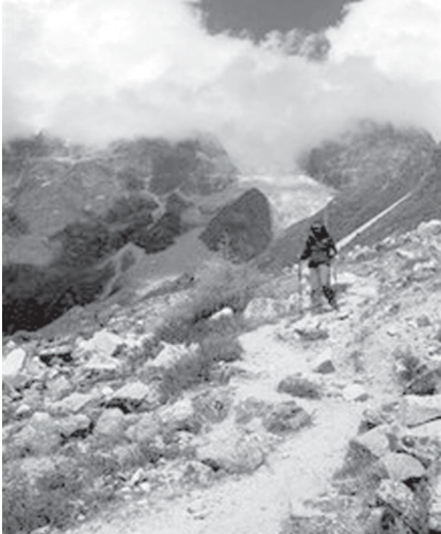
A trekker walking close to Lirung Glacier in the Langtang Valley, some 60 kilometres (37.5 miles) northwest of Kathmandu. The glacier has retreated at least two kilometres in recent decades, an effect of global warming that is worrying local residents.