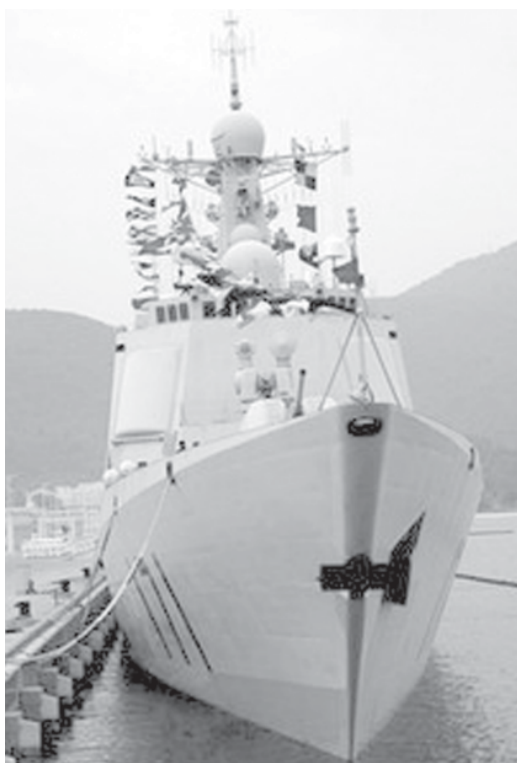
In this photo released by China’s Xinhua News Agency, Chinese Navy’s DDG-171 Haikou destroyer is seen in Sanya, capital of South China’s Hainan Province on 25 Dec, 2008. On Friday, warships armed with special forces, missiles and helicopters will sail for anti-piracy duty off Somalia, the first time the communist nation has sent ships on a mission that could involve fighting so far beyond its territorial waters.