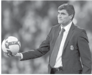
Real Madrid coach Juande Ramos.

MADRID, 26 Dec — Real Madrid coach Juande Ramos said Thursday the Spanish champions, trailing in fifth position behind arch rivals Barcelona in La Liga, were experiencing "a complicated situation".