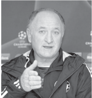
Luiz Felipe Scolari.

LONDON, 26 Dec — Luiz Felipe Scolari has responded defiantly to Chelsea's latest disappointment but knows his side cannot afford another setback when they begin their Christmas programme against West Bromwich Albion.