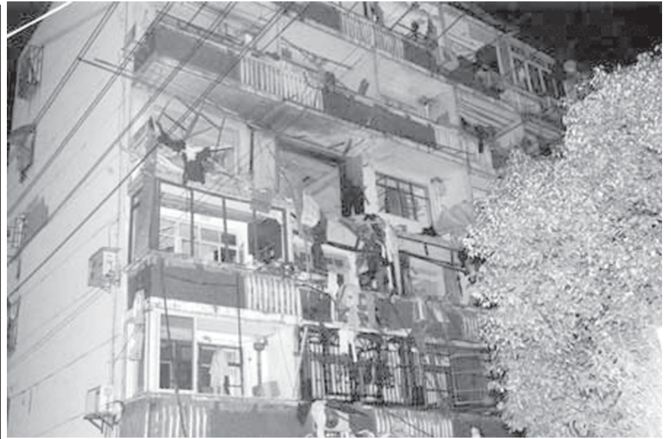
Photo taken on 26 Dec, 2008 shows the site of an explosion in Baoshan District of Shanghai, east China. The explosion happened at the early morning Friday at a six-story residential building in Baoshan District, causing two people dead and eight injured. An initial investigation showed the explosion was probably caused by gas leak.