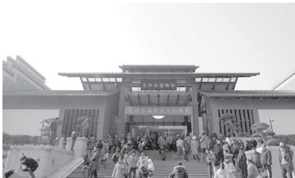
Visitors gather at the entrance of the Mao Zedong Relic Museum in Shaoshan Village, the birthplace of late Chinese leader Mao Zedong, in Xiangtan City of central China's Hunan Province, on 25 Dec, 2008.