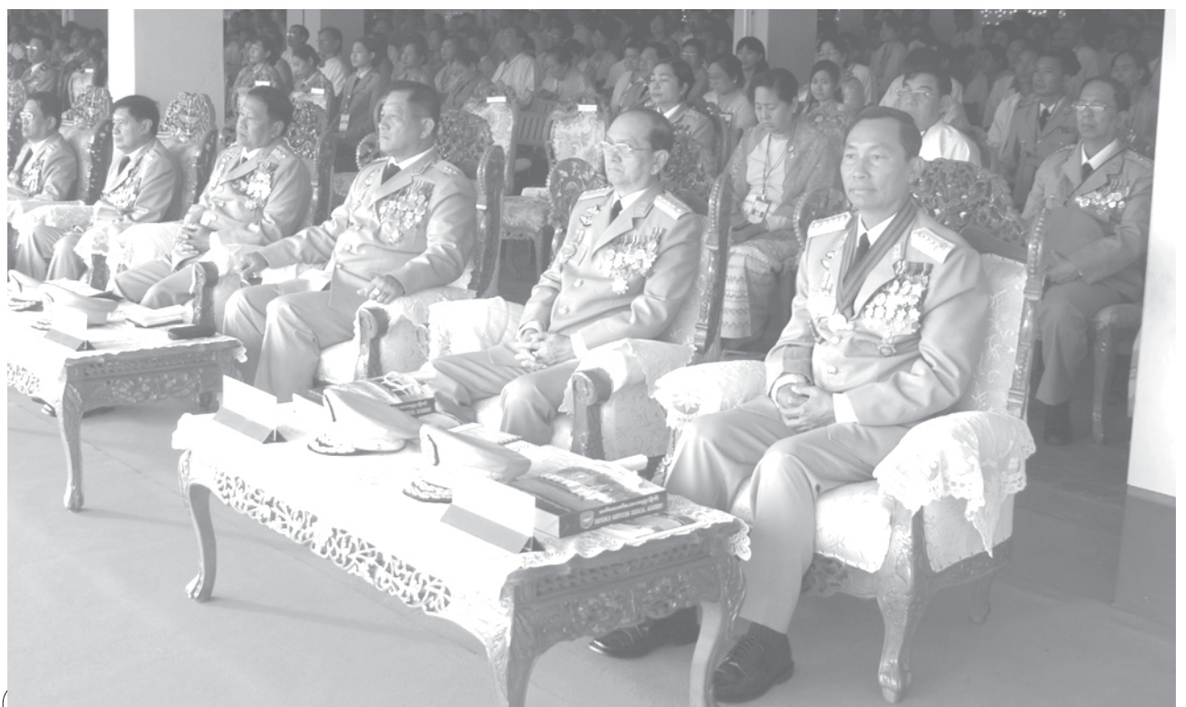
Dignitaries seen at Graduation Parade of 10 th Intake of Defence Services Medical Academy.