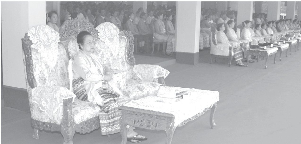
Distinguished guests seen at Graduation Parade of 10 th Intake of Defence Services Medical Academy.— MNA

his Tatmadaw. In addition, it is necessary to have continuous study and observation on the developing military tactics and effectiveness of the sophisticated military equipments such as chemical and biological weapons. It is also your permanent work to find out causes which will affect the health and fitness of the warriors with military awareness.