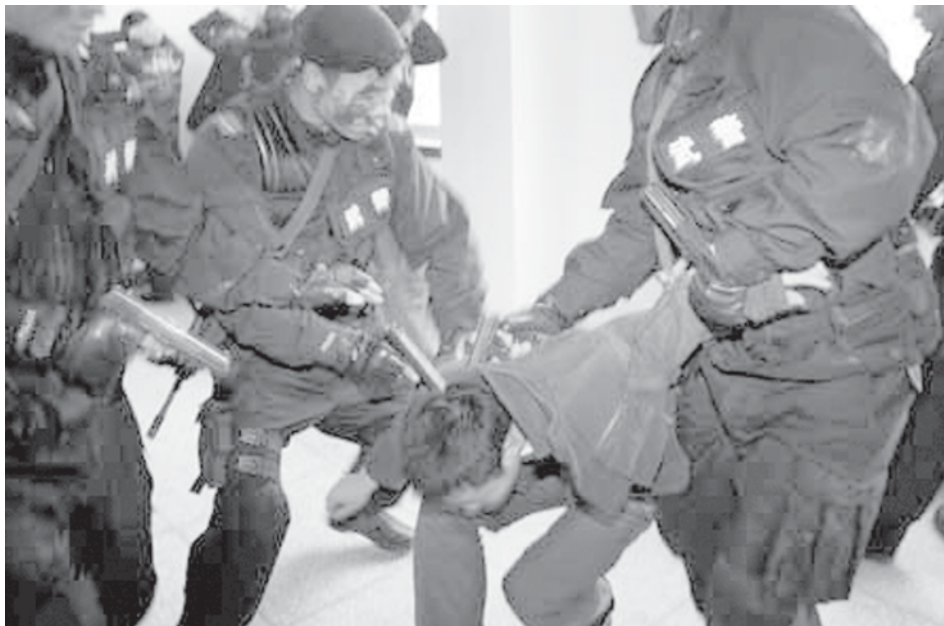
Members of local special police capture an impersonative suspect during an anti-hostage-taking drill in Guiyang, capital of southwest China's Guizhou Province, on 25 Dec, 2008.