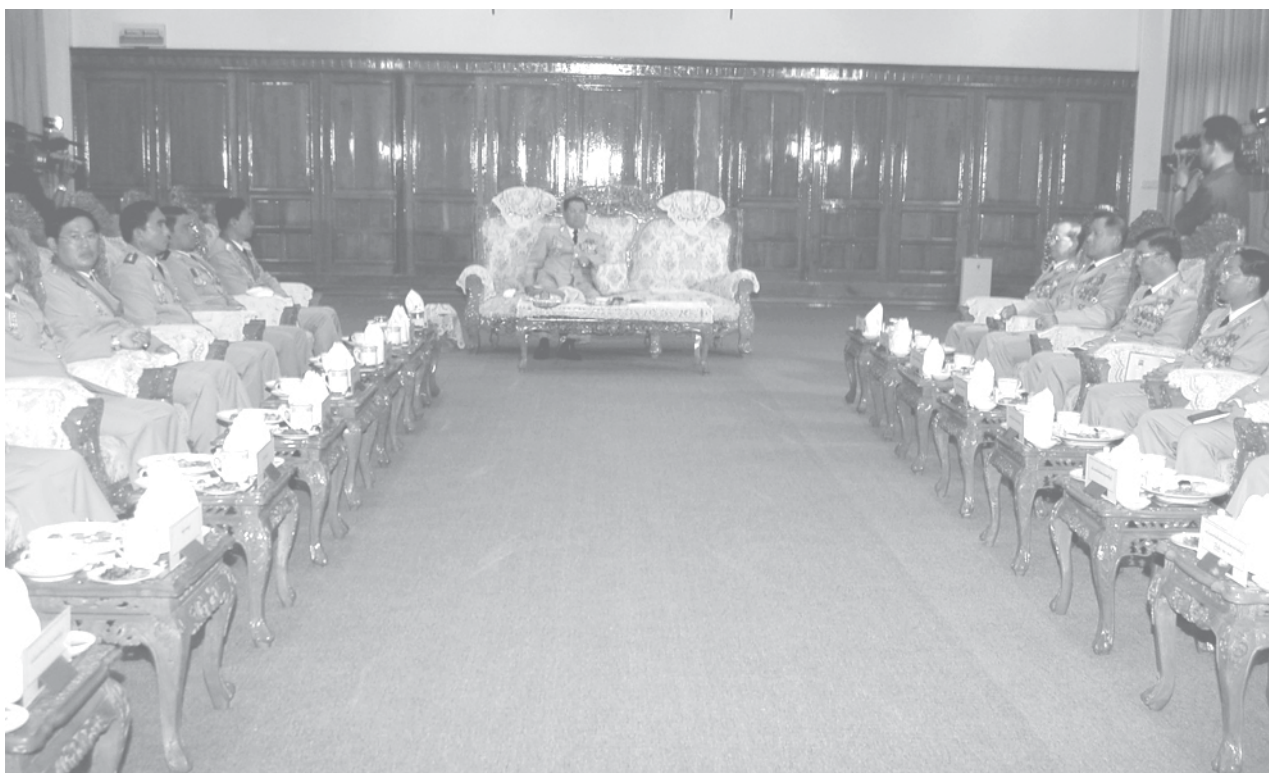
Commander-in-Chief of Defence Services Senior General Than Shwe meets three outstanding cadets and their parents.

Myanmar is trying to promote traditional medicines and customary treatments by doing research utilizing advanced technology.