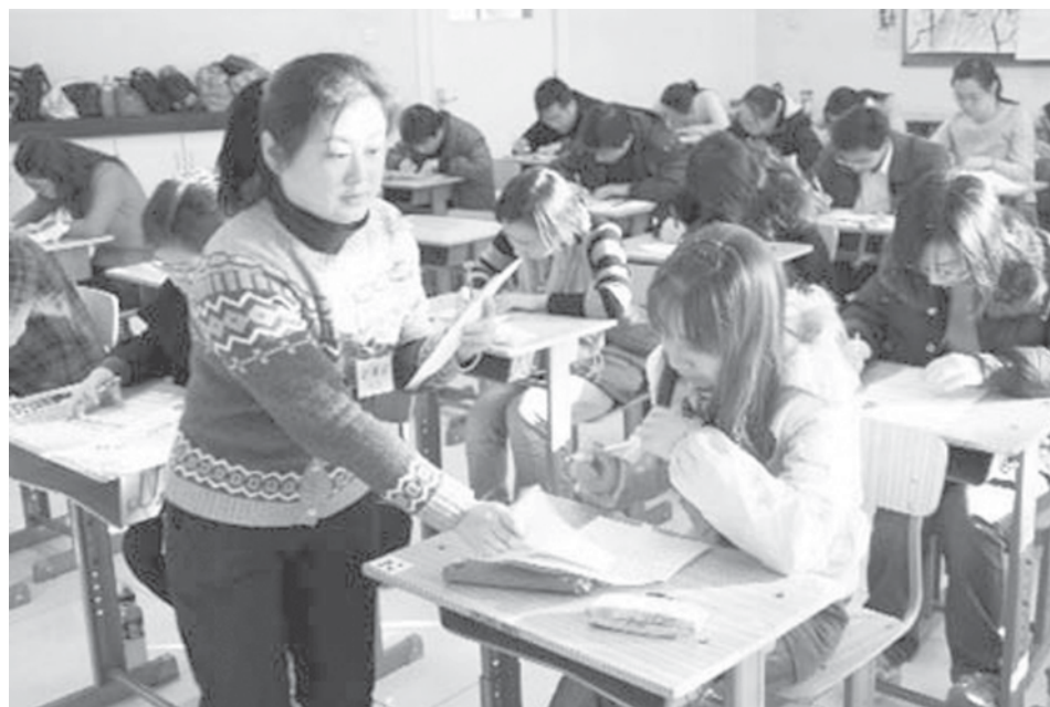
Photo taken on 30 Nov, 2008 shows an examination room in Beijing No. 1 Middle School in Beijing. A total of 775,000 people took a nationwide exam in 38 cities of China to qualify for 13,500 posts as national civil servants on Sunday. —INTERNET

Altogether, 153 students went to see doctors. Among them, eight showed no abnormal symptoms and have been discharged, 105 are being treated as outpatients and 40 others are still in the hospital. —MNA/Xinhua