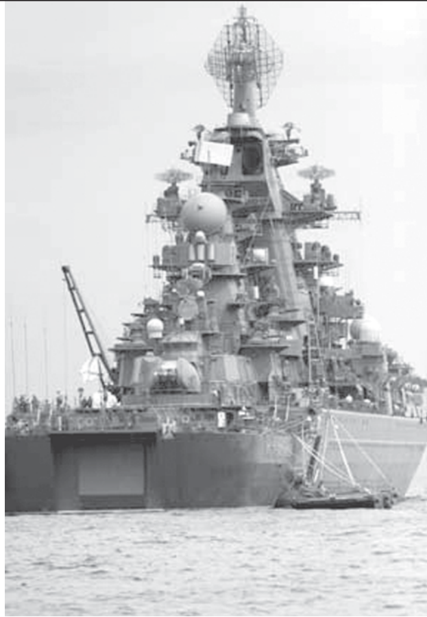
The Russian nuclear propulsion cruiser "Peter the Great" is anchored in the La Guaira port in Vargas State of Venezuela, on 29 Nov, 2008.