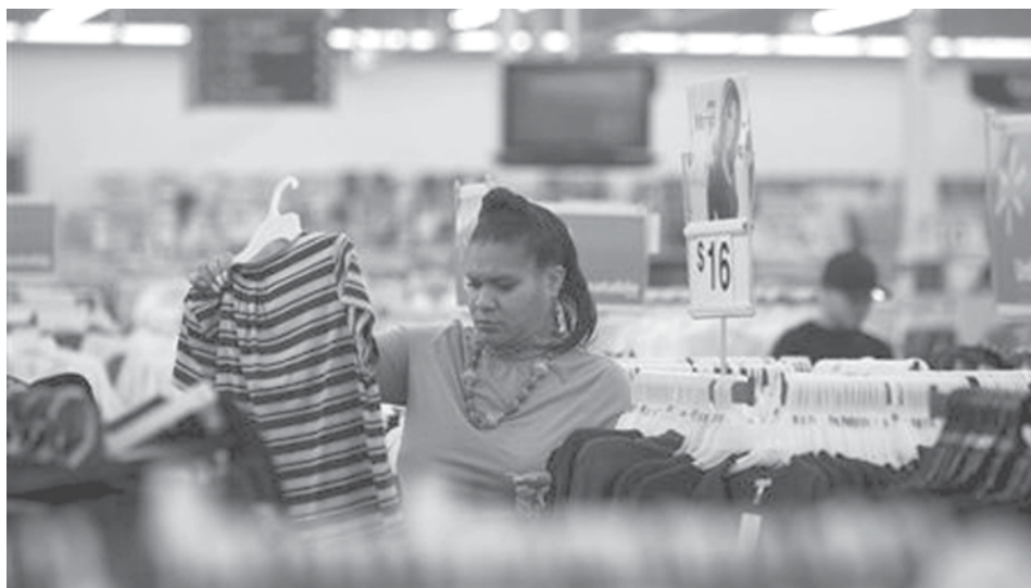
A woman shops at a Walmart store on "Black Friday" in Oakland, California, on 28 Nov, 2008.