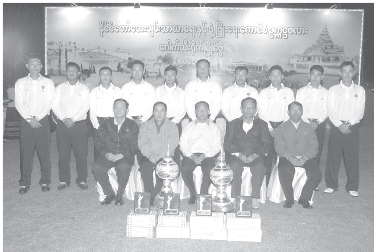
Secretary-1 Lt-Gen Thiha Thura Tin Aung Myint Oo and party pose together with golfers of the Ministry of Defence team.

At 6.30 p.m today, the prize presentation ceremony was held at City Golf Course, attended by the Secretary-1. Also present on the occasion were senior military officers of the Ministry of Defence, the commander of (See page 8)