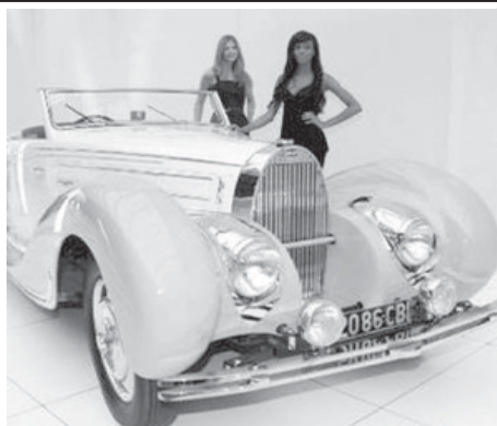
Models pose with a 'Bugatti' during a press presentation prior to the Essen Motor Show in Essen. About 550 exhibitors from 19 countries will present their latest developments at the Essen trade fair.