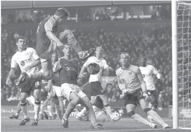
Aston Villa's James Milner (top) shoots at the Fulham goal during their English Premier League match at Villa Park in Birmingham, on 29 Nov, 2008.