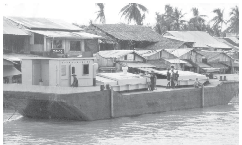
TaKha 13 type pontoon anchored in the river at Kanbet Village.

The IWT launched the freight speed vessel lines plying Yangon-Labutta route and Yangon-Bogale runs on 12 June 2006. Moreover, one more speed vessel