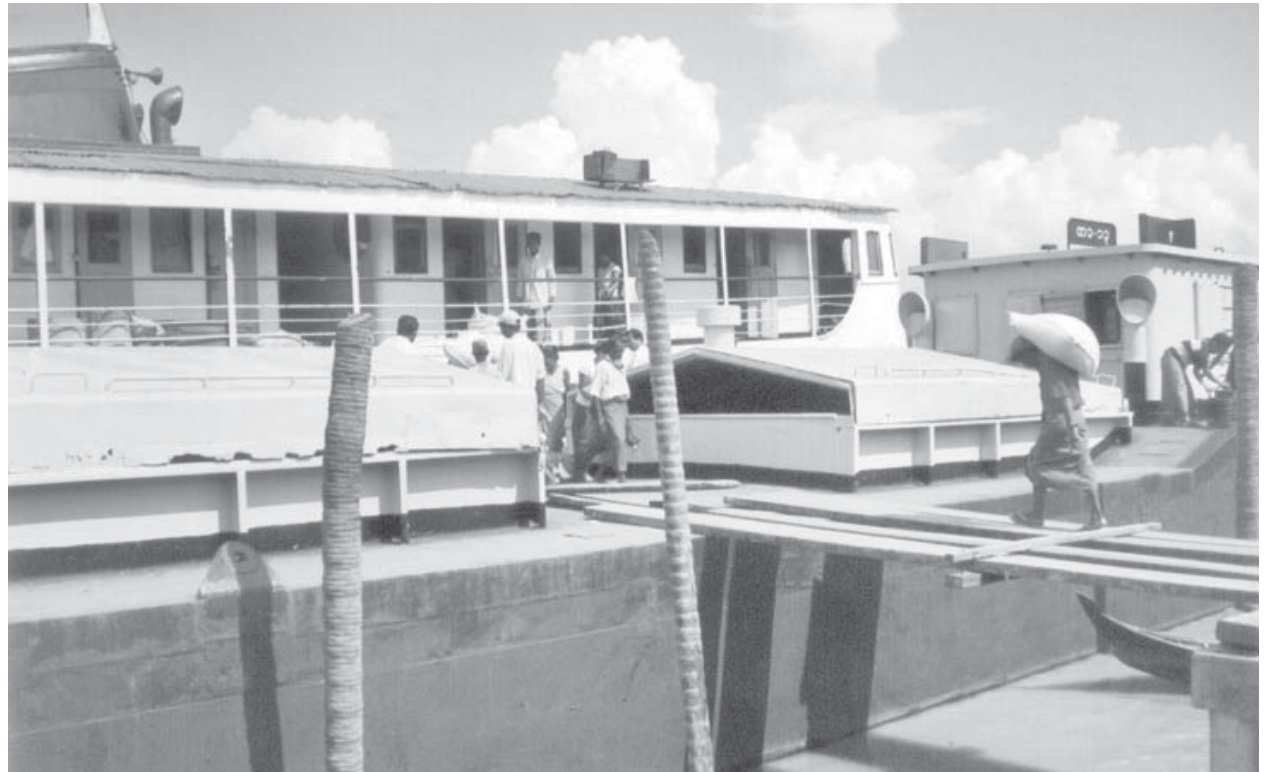
TaKha 13 type pontoon seen with Vessel Bandoola in Kanbet Village.

Pontoons are being used as jetties at the ports of IWT branches. Moreover, the department launched new routes of vessels and built the ports at suitable villages.