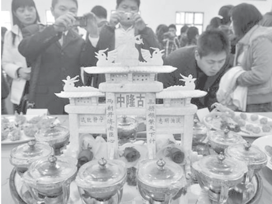
Visitors take photos of a dish during the 6th National Cooking Contest (Hubei Zone) held in Wuhan, capital of central China's Hubei Province, on 29 Nov, 2008. More than 200 contestants took part in the contest on Saturday.