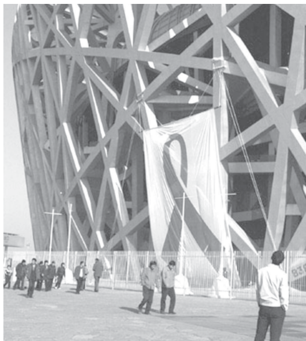
A giant red ribbon is set up outside the Bird Nest during a World AIDS Day event in Beijing, capital of China, on 30 November.

“We (Member Parliaments of APA) recognized the need to spare no effort in working on ideas and initiatives aimed at promoting a new global financial architecture that could support a more just and transparent world economic structure, and ensure the stable provision of financing for development which concurrently would promote the achievement of peace and stability in the region,” said the declaration. Thus, APA members encourage the governments to take rapid and comprehensive ways to restore the market confidence and stability, to minimize the risk of the prolonged crisis and to ensure the smooth running of real economy, it said.—MNA/Xinhua