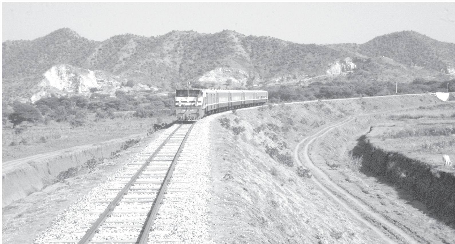
Newly-built Pyawbwe-Phayangazu railroad.