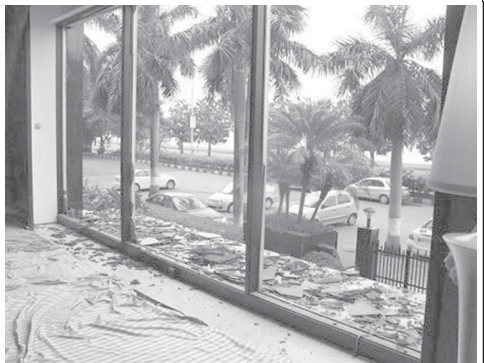
A view of the shattered windows at the lobby of Trident-Oberoi hotel, a day after the operations to dislodge militants ended in Mumbai on 29 November, 2008. The toll from a series of attacks in India's financial capital Mumbai has risen to at least 195 dead and 295 wounded, the local disaster control room said.

Elite Black Cat commandos killed the last of the gunmen on Saturday after three days of room-to-room battling inside the Taj Mahal, one of several landmarks struck in co-ordinated attacks on Wednesday night.