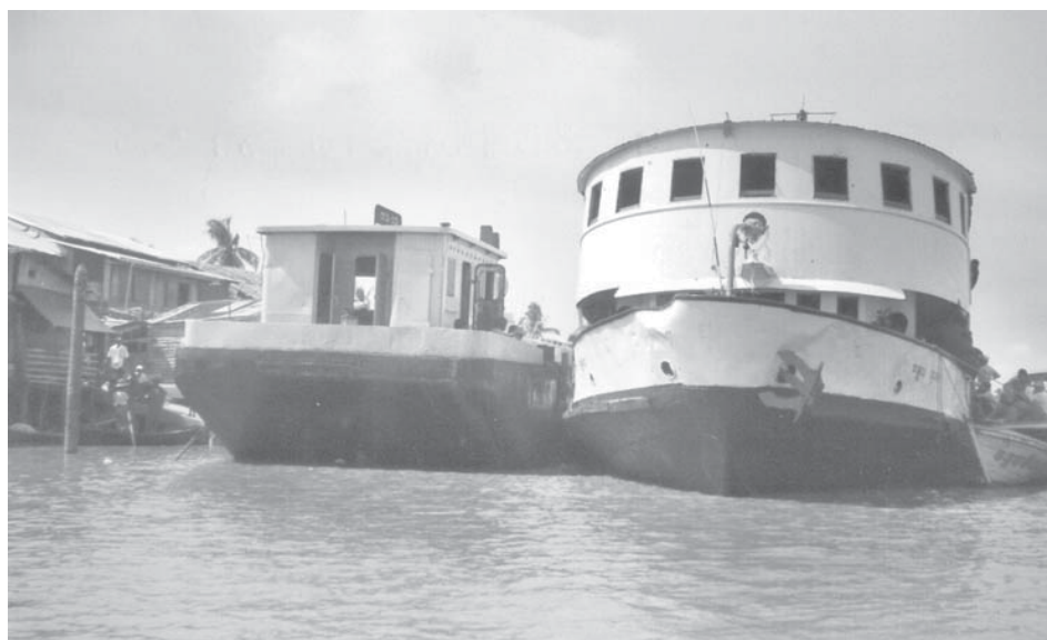
TaKha 13 type pontoon tugging at Vessel Bandoola .

and staff to observe the transport of the barge.