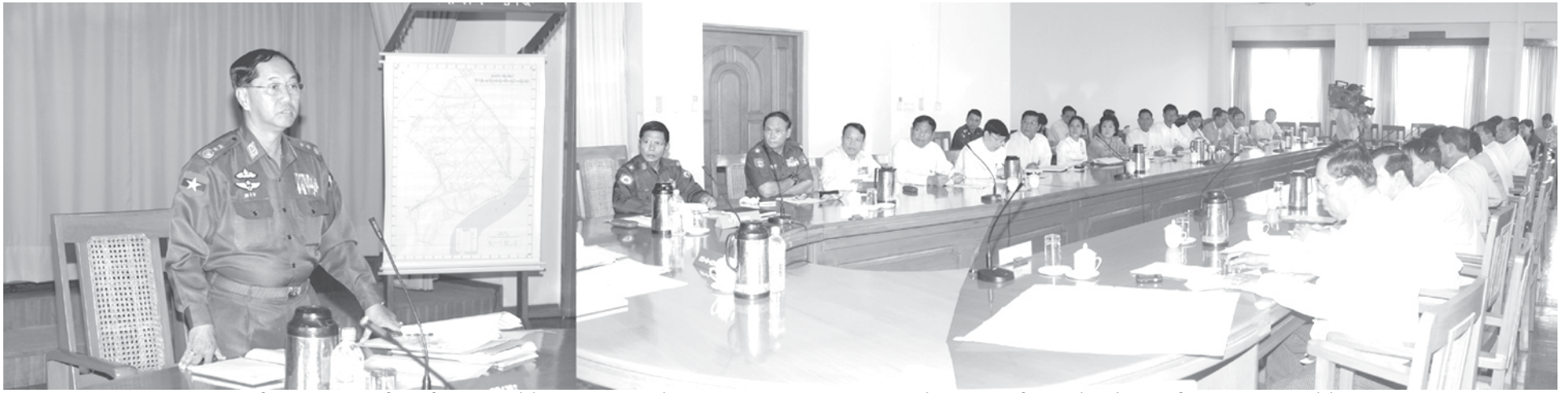
Lt-Gen Myint Swe of Ministry of Defence addresses coordination meeting on production of 100 baskets of summer paddy per acre.