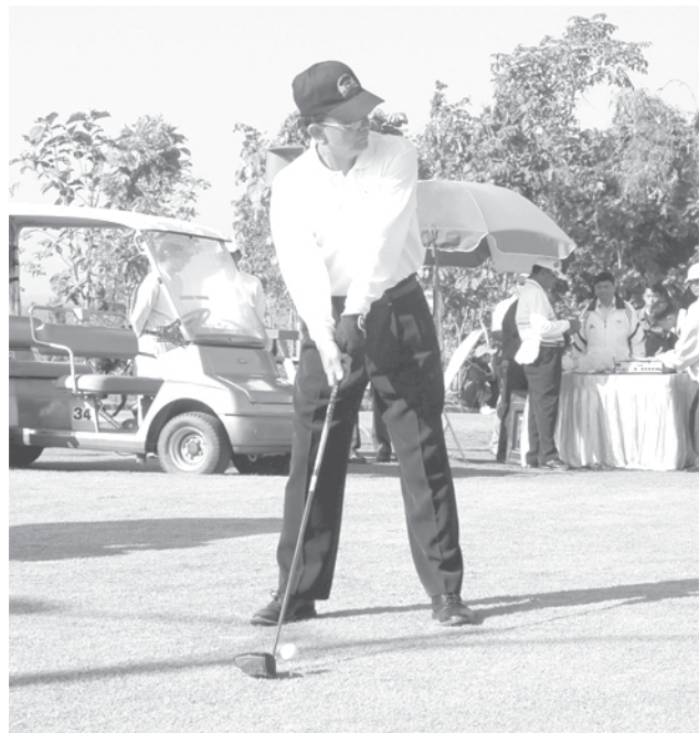
Prime Minister General Thein Sein participates in the State Peace and Development Council Chairman's Trophy Golf Tournament.