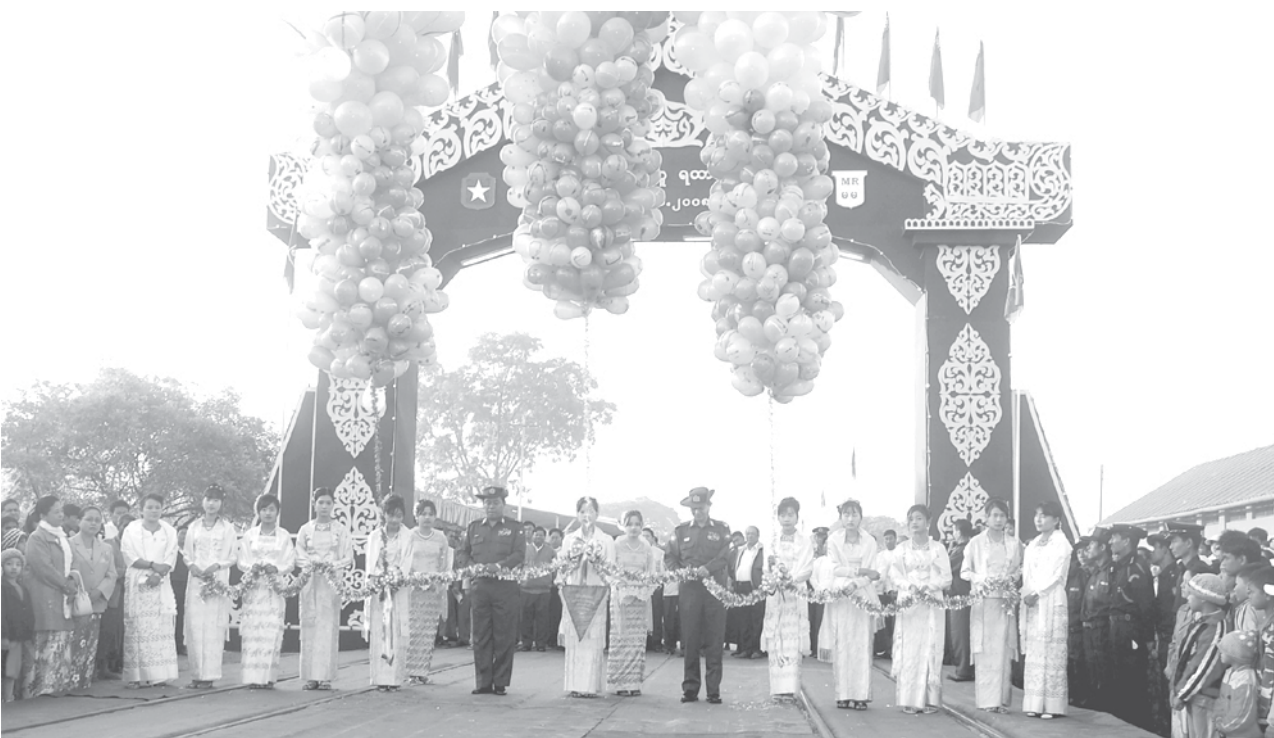
Commander Maj-Gen Tin Ngwe and Minister Maj-Gen Aung Min cut the ribbon to open Pyawbwe-Phayangazu railroad.—MNA

The previous Pyawbwe-Thazi-Phayangazu railroad is 31.75 miles long. The new road saves 15.56 miles. In the past, passengers bound for Nay Pyi Taw changed the train at Thazi. Now they can go to Nay Pyi Taw from Shwenyauang and Loikaw in a short time. The new railroad makes easier and better transport for local people in Shwenyauang, Namhsan and Monai in Shan State (South) and Loikaw in Kayah State.—MNA