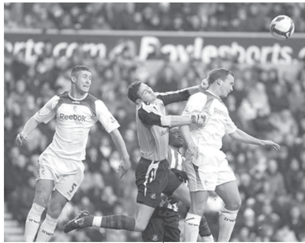
Kevin Davies (R) and Gary Cahill (L) of Bolton fight for the ball with Craig Gordon (C) of Sunderland, on 29 Nov, 2008.