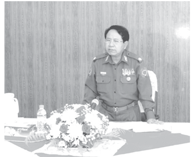
Minister Brig-Gen Kyaw Hsan meeting with executives of Myanmar Printing and Publishing Entrepreneurs Association.

Speaking on the occasion, Minister Brig-Gen Kyaw Hsan said that the Myanmar Printing and Publishing Entrepreneurs Association is to implement the aims for ensuring modernization and development of printing and publishing works, uplifting livelihoods of the workers in printing and publishing circle and serving the interest of the State. The Ministry of Information is rendering necessary assistance for them, he said. It is necessary to cooperate in solving the problems in work, he added. He said that development of printing