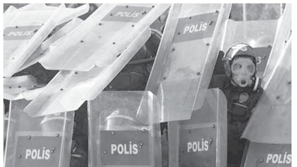
Police protect themselves behind their shields from stones being thrown by leftist demonstrators during clashes in Ankara on 29 Nov, 2008.

"It is said in the law that one of the TNI's tasks is to overcome all forms of terrorism in Indonesia. Of course we cannot do it ourselves and therefore we will continue to coordinate with both the national and regional police," Djoko Santoso said.—Xinhua