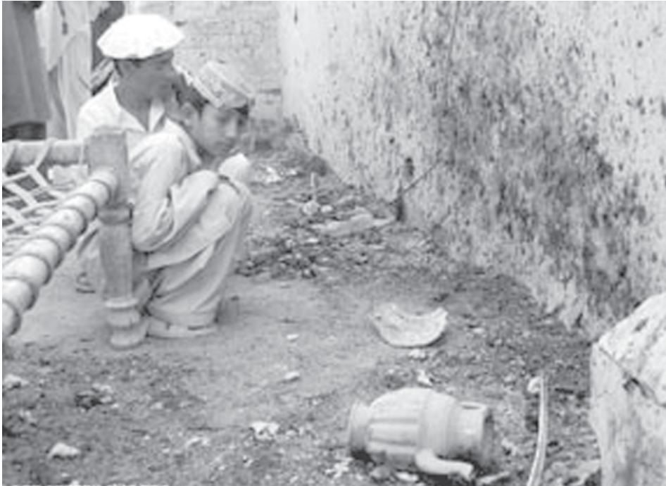
Young Pakistanis look at a house after a missile hit it in the tribal region of North Waziristan last month.