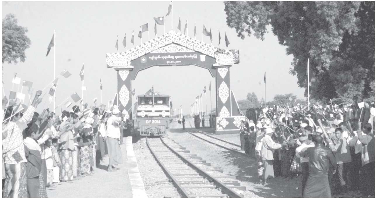
Local people welcome a special train running on newly-built Pyawbwe-Phayangazu railroad.

The government is making all-out efforts for the birth of a new modern and developed nation. In this regard, priority is being given to secure and smooth transport as it plays a pivotal role in national development. Only when there is better transport, will regional economy develop, and only when there is regional (See page 9)