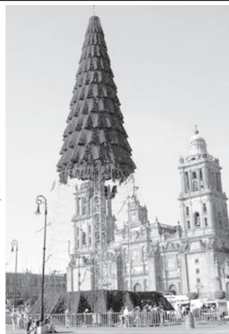
Workers build a 45-metre-high Christmas tree in Mexico city, capital of Mexico.

Other officers arrived at the school and found a screen had been cut, a window near the teacher's lounge was open, and the lounge freezer had been looted.