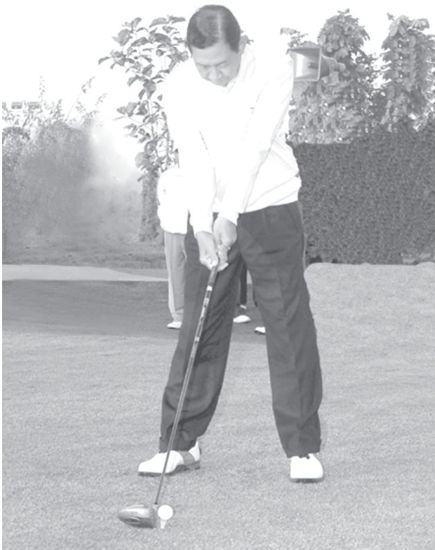
Vice-Senior General Maung Aye putting in the State Peace and Development Council Chairman's Trophy Golf Tournament at City Golf Course in Nay Pyi Taw.

NAY PYI TAW, 30 Nov—The State Peace and Development Council Chairman's Trophy Golf Tournament commenced at City Golf Course, here, yesterday.