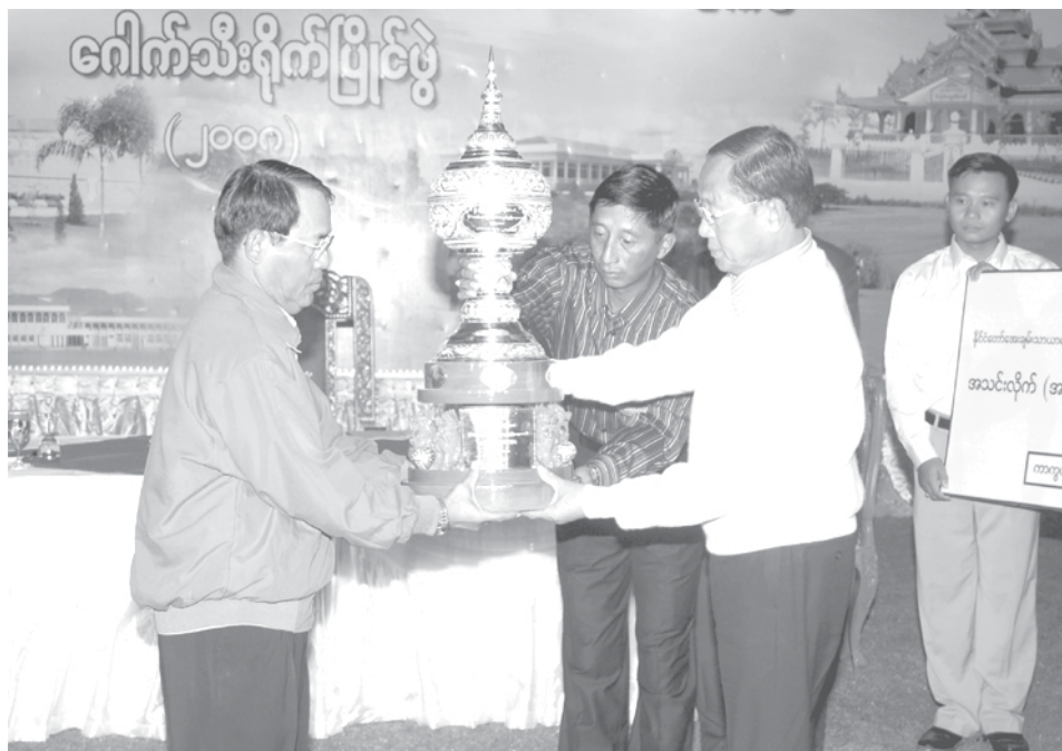
Secretary-1 Lt-Gen Thiha Thura Tin Aung Myint Oo presents championship trophy to leader of Ministry of Defence's team.