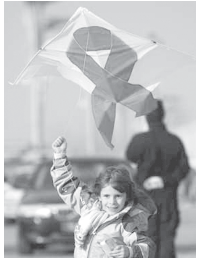
A child flies a kite with a red ribbon during a World AIDS Day event at the Olympic Green in Beijing, capital of China, on 30 Nov, 2008. UNAIDS and China Red Cross on Sunday jointly organized an event "One Goal One Dream - of a world without Stigma", in commemoration of the World AIDS Day 2008 which falls on 1 December.