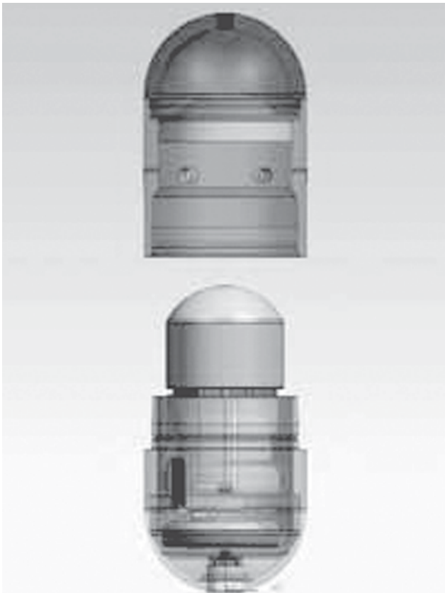
The mechanical design of Philips Research's intelligent pill (iPill) in the form of an 11 x 26 mm capsule is seen in this undated handout illustration. Dutch group Philips has developed an "intelligent pill" that contains a microprocessor, battery, wireless radio, pump and a drug reservoir to release medication in a specific area in the body.