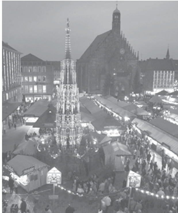
An overview shows Germany's oldest Christkindlesmarkt (Christ Child Market) in Nuremberg, on 28 Nov, 2008. The first official record of this pre-Christmas market dates back to 1628. A list of notices for stall holders from 1737 shows that almost all of Nuremberg's craftsmen were represented.