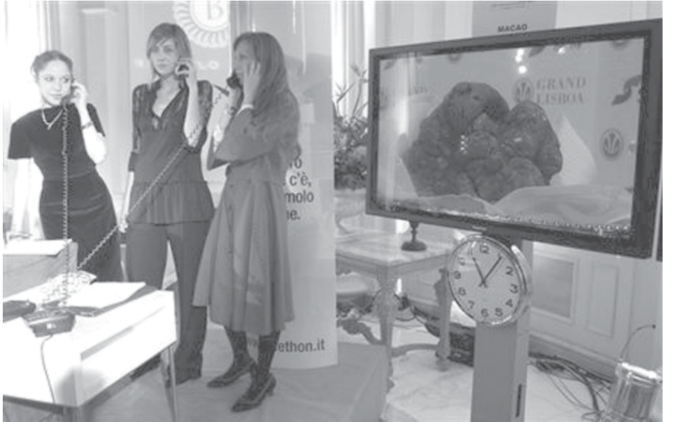
An Italian truffle weighing just over 1 kilo is seen on the monitor from the Grand Lisboa hotel casino in Macau as three operators receive offers during an international auction held in London, Abu Dhabi, Macau and Rome on 29 Nov, 2008.