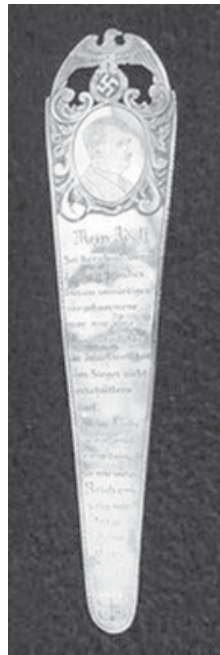
This photo, provided by Immigration and Customs Enforcement, shows a stolen 18-carat gold bookmark, alleged to belong to Adolf Hitler, circa 1943, that was seized by ICE agents in Seattle, Wash. Federal prosecutors said the bookmark, reportedly given to Hitler by his long-time mistress, Eva Braun, was among several items taken in an auction-house heist in Madrid six years ago.