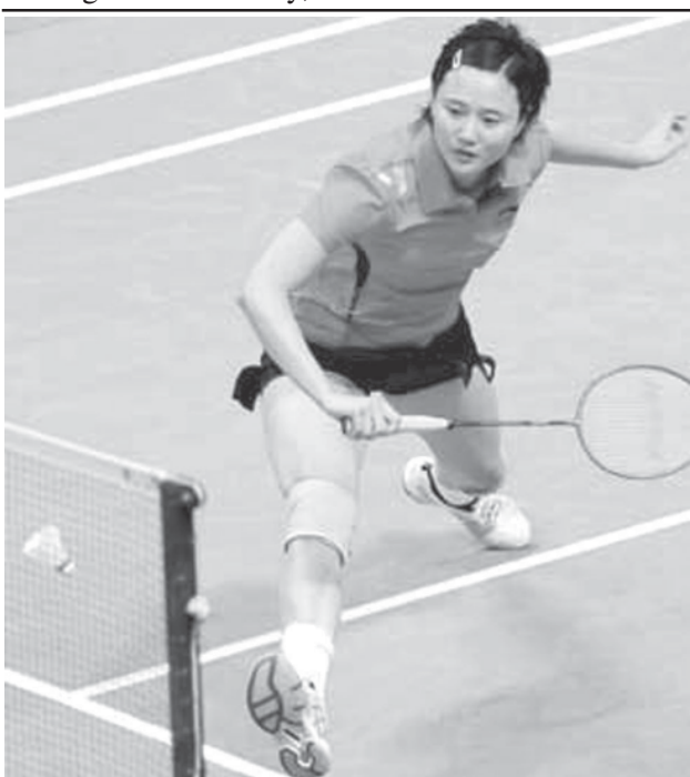
Wang Chen of Chinese Hong Kong returns the shuttle during the final of women's singles against China's Xie Xingfang in the 2008 Yonex Sunrise Hong Kong Badminton Super Series in Hong Kong, south China, on 30 Nov, 2008. Wang won 2-1.

Forecast for Mandalay and neighbouring area for 1-12-2008: Generally fair weather.