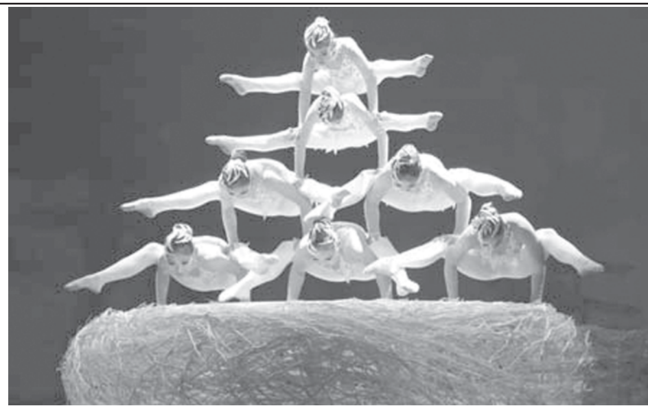
The acrobats perform on the stage during the awarding ceremony of the 7th National Acrobatic Contest held in Shenzhen, south China's Guangdong Province, on 28 Nov, 2008.

"We hope that solar cells will one day be as thin as paper and be attached to the surface of your choice," said co-author Hsiang-Yu Chen, a UCLA graduate student in engineering. "We'll also be able to create different colors to match different applications." The research team found that substituting a silicon atom for carbon atom in the backbone of the plastic markedly improved the material's photovoltaic properties, said the release. — Internet