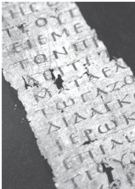
A fragment from a copy of the Gospel of John, circa 200AD, is displayed at Sotheby’s auctioneers in London, on 28 Nov, 2008.

Grenfell and Arthur Hunt at the site of the important early Christian community at Oxyrhynchus, about 120 miles from Cairo. It is believed to have been written in Alexandria.—Internet