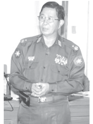
Rail Transportation Minister Maj-Gen Aung Min.