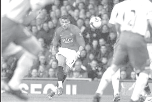
Manchester United's Cristiano Ronaldo (C) scores from a free kick during their English Premier League soccer match against Stoke City in Manchester, northern England on 15 Nov, 2008.