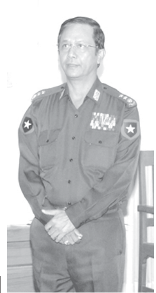
Minister for Electric Power No. 1 Col Zaw Min.—MNA

Now, plans are under way to complete on schedule national grids—the project linking 132 KV Thazi-Dagundaing grid and Bellin main power station, project linking 132