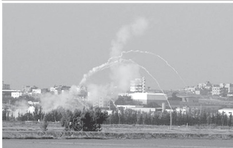
Mortars are fired from the Gaza Strip near the border with Israel, on 14 Nov, 2008.