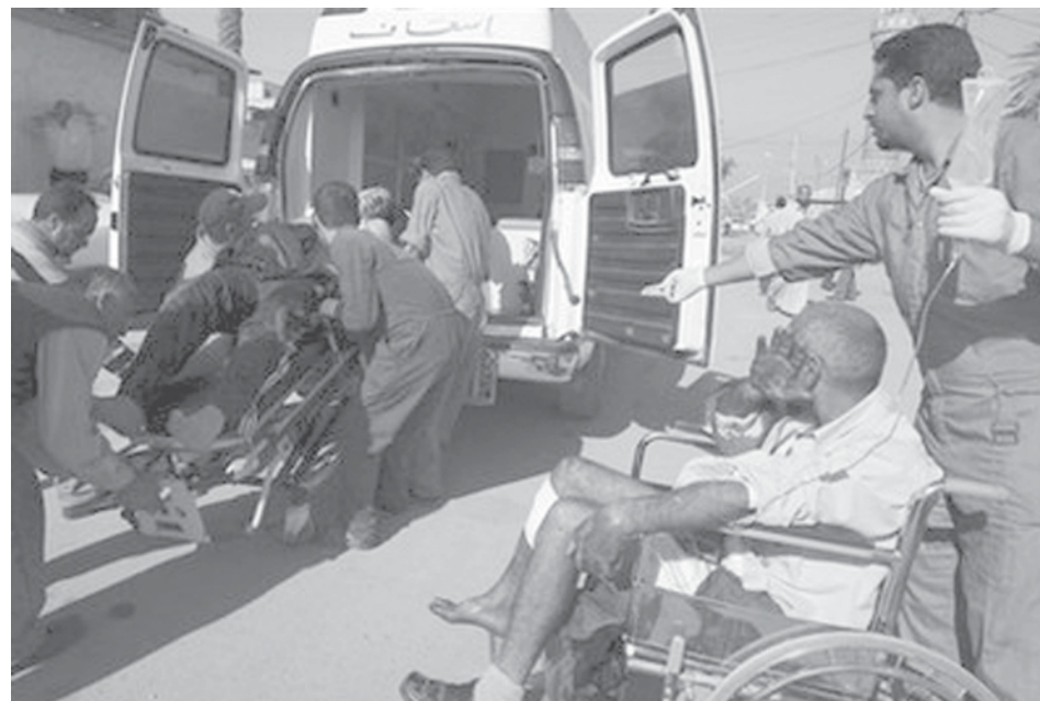
Medics tend to wounded Iraqi men arriving at a hospital after a parked car bomb exploded in a bustling section of downtown Baghdad, Iraq, on 12 Nov, 2008. Police said the blast killed three people and wounded 14 others. The attack occurred around 9:30 am (630 GMT) off al-Nasir Square in central Baghdad — a busy neighborhood of shops, pharmacies and photography stores. Police said that two officers were among the wounded.