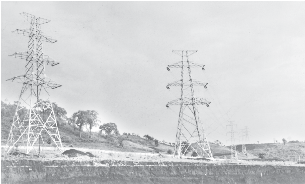
Pylons linking Shweli-Mansan power circuit being undertaken by Ministry of Electric Power No. 2.