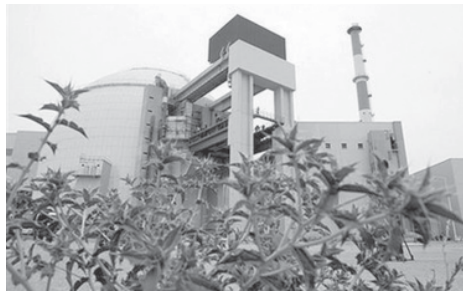
A general view of the building housing the reactor of Bushehr nuclear power plant at the Iranian port town of Bushehr, 1200 kms south of Tehran in 2007.

MOSCOW, 15 Nov — A Russian diplomat says major world powers remain divided over new sanctions against Iran after a meeting on the nation's nuclear