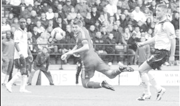
Liverpool's Steven Gerrard (C) heads to score against Bolton Wanderers during their English Premier League soccer match in Bolton on 15 Nov, 2008.