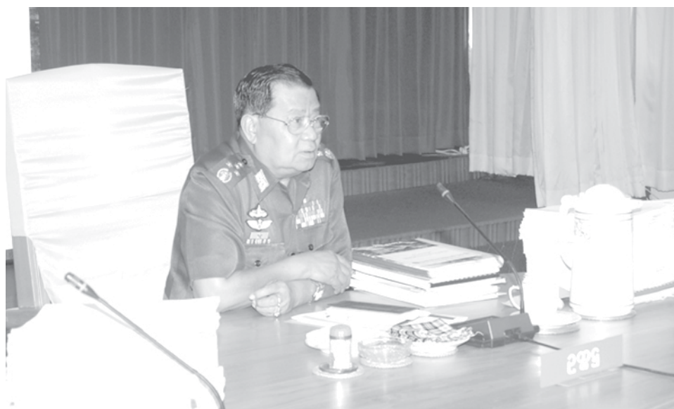
Senior General Than Shwe giving guidance at the Special Projects Implementation Committee coordination meeting (1/2008).

NAY PYI TAW, 15 Nov — The Special Projects Implementation Committee held its coordination meeting (1/2008) at the office of the Commander-in-Chief (Army) here at 2 p.m. yesterday, attended by Chairman of the Committee Chairman of the State Peace and Development Council Commander-in-Chief of Defence Services Senior General Than Shwe.