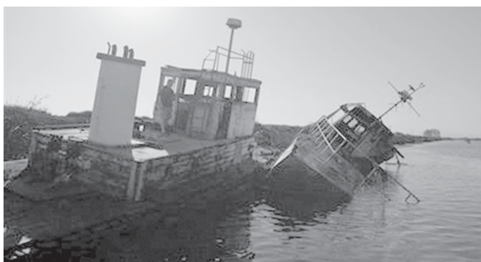
A pair of abandoned commercial vessels sit in the banks along Fisherman's Cut near Bethel Island, Calif, recently.

The fire, which started Thursday night in Santa Barbara about 80 miles (about 128 kilometres) west of Los Angeles, has required mandatory evacuations and road closures, and residents have been forced to seek emergency shelter, according to Schwarzenegger. Xinhua