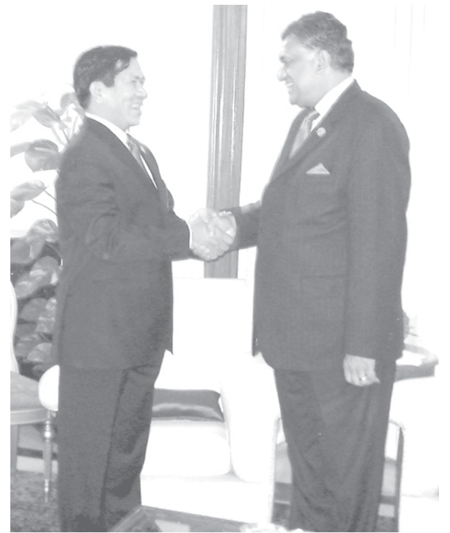
Foreign Affairs Minister U Nyan Win meets Minister of Foreign Affairs of Sri Lanka Mr R. Bogollagama. (News on Page 10)— MNA