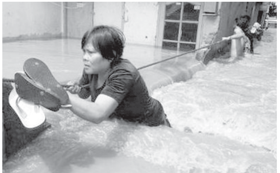
A resident crosses her flooded housing complex in central Jakarta on 14 Nov, 2008.—INTERNET

Police are yet ready to name the suspects and no group has claimed responsibility so far.— Xinhua