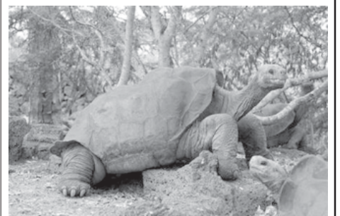
George the giant tortoise is seen in the national park of the Galapagos islands in this 29 April, 2007 file photo.

A Pinta Island tortoise, George had showed little interest in sex during 36 years in captivity. His new-found libido has raised hopes he could save his subspecies from extinction.