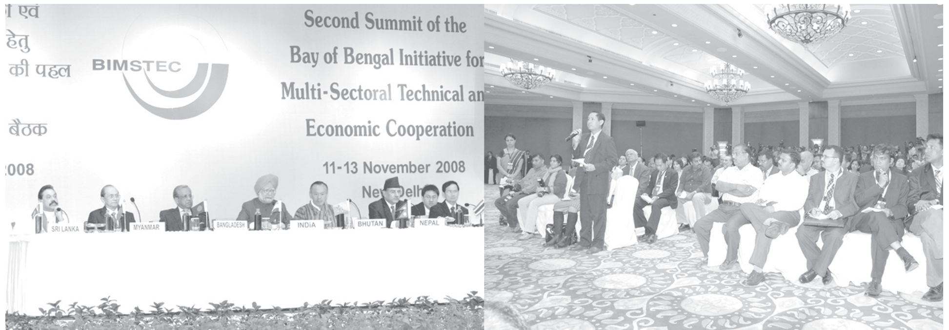
Prime Minister General Thein Sein and heads of government of BIMSTEC countries attend the press conference on 2nd BIMSTEC Summit.

NAY PYI TAW, 15 Nov— Prime Minister of the Union of Myanmar General Thein Sein on 13 November attended the informal meeting of Heads of Government of BIMSTEC member countries held at Shahjehan Hall of the Hotel Taj Palace in New Delhi, the Republic of India.