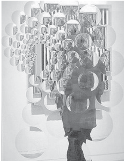
Polesello's view : A visitor is reflected through a creation by Argentine artist Rogelio Polesello on display during Sotheby's Latin American Art preview, in New York.