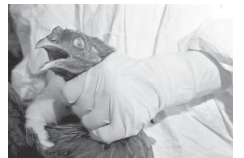
Malaysia has suspended imports of whole chicken and chicken parts from Thailand with immediate effect following a bird flu scare in the neighbouring country.—INTERNET