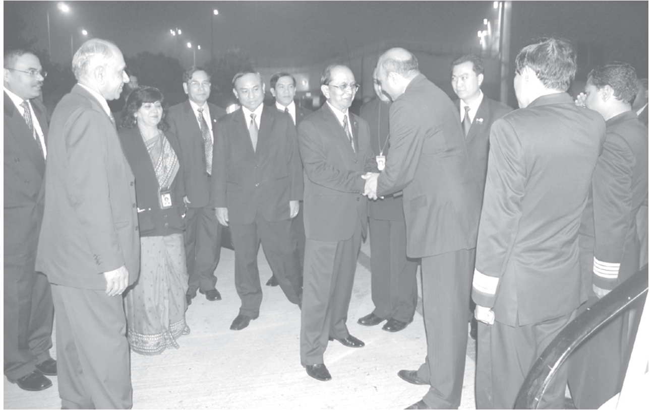
Prime Minister General Thein Sein being seen off by Deputy Minister of the Ministry of Defence of India Mr Pallam Rajv at Indira Gandhi International Airport.