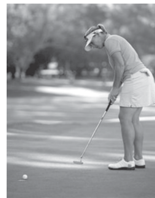
US golf player Angela Stanford putts on the 18th hole during the second round of the LPGA Lorena Ochoa Invitational golf tournament in Guadalajara, Mexico, on 14 Nov, 2008.