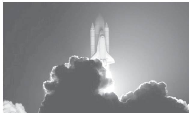
The space shuttle Endeavour blasted off carrying seven American astronauts on a "home improvement" mission that will expand living quarters on the orbiting International Space Station.