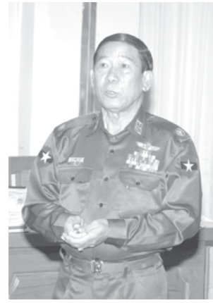
Energy Minister Brig-Gen Lun Thi. MNA