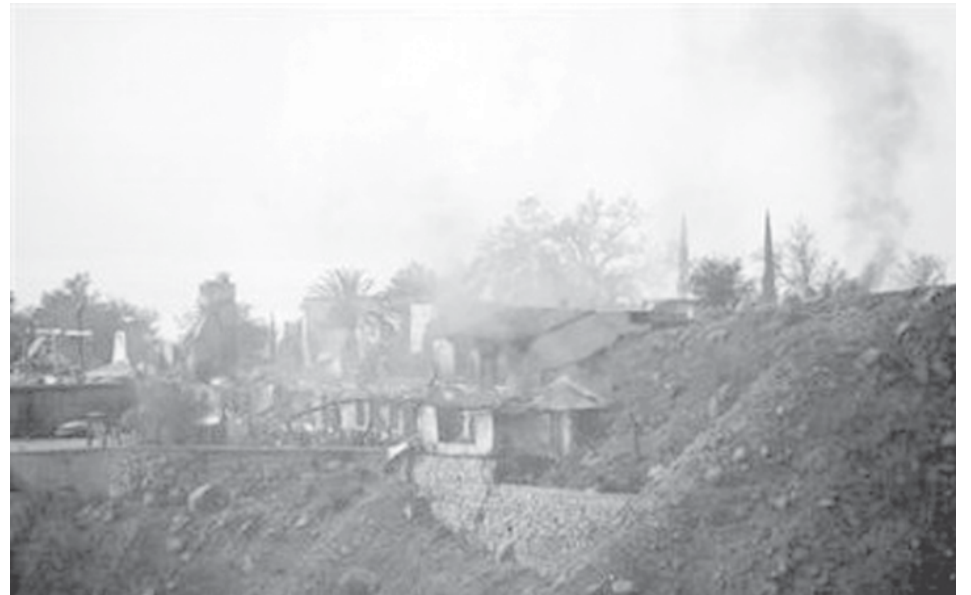
A fire damaged home is seen on a hillside as firefighters work to contain a wildfire which has destroyed over 100 homes in the Montecito area of Santa Barbara County, California 14 November, 2008.

Iran already is under three sets of Security Council sanctions, but efforts to pass a fourth have been stymied. Russia argues that sanctions are counterproductive. The US claims Iran is seeking nuclear weapons under the guise of a civilian programme.— Internet