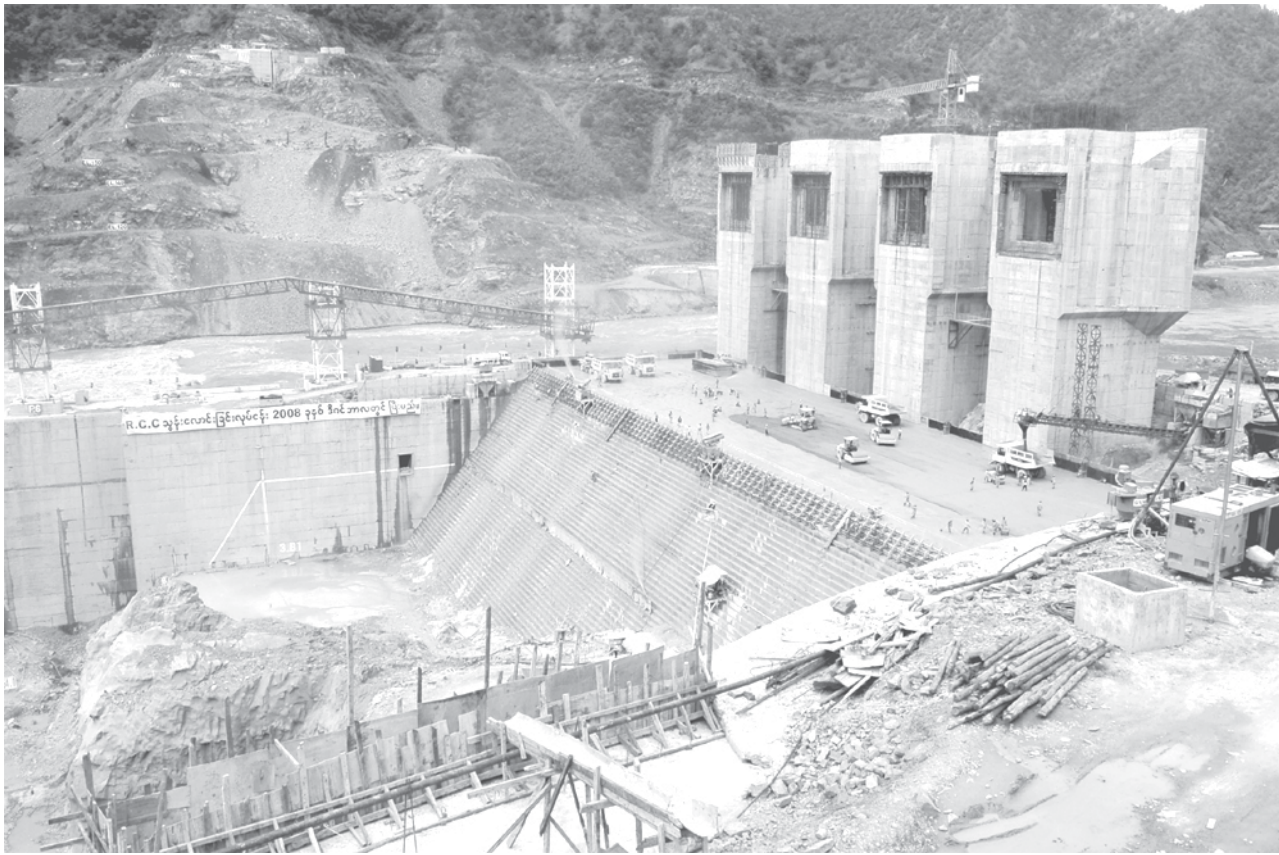
Yeywa Hydropower Project being implemented by Ministry of Electric Power No. 1.

Hydropower Project (380 megawatts) in Sagaing Division; Upper Hsedawgyi Hydropower Project (60 megawatts) in Mandalay Division; Upper Buywa Hydropower Project (150 megawatts) in Magway Division; Upper Yeywa Hydropower Project (140 megawatts) in Shan State (North); and Pyuchaung Hydropower Project (40 megawatts), Khabaung Hydropower Project (30 megawatts) and Bilu Creek-3 Hydropower Project (48 megawatts) in Bago Division.