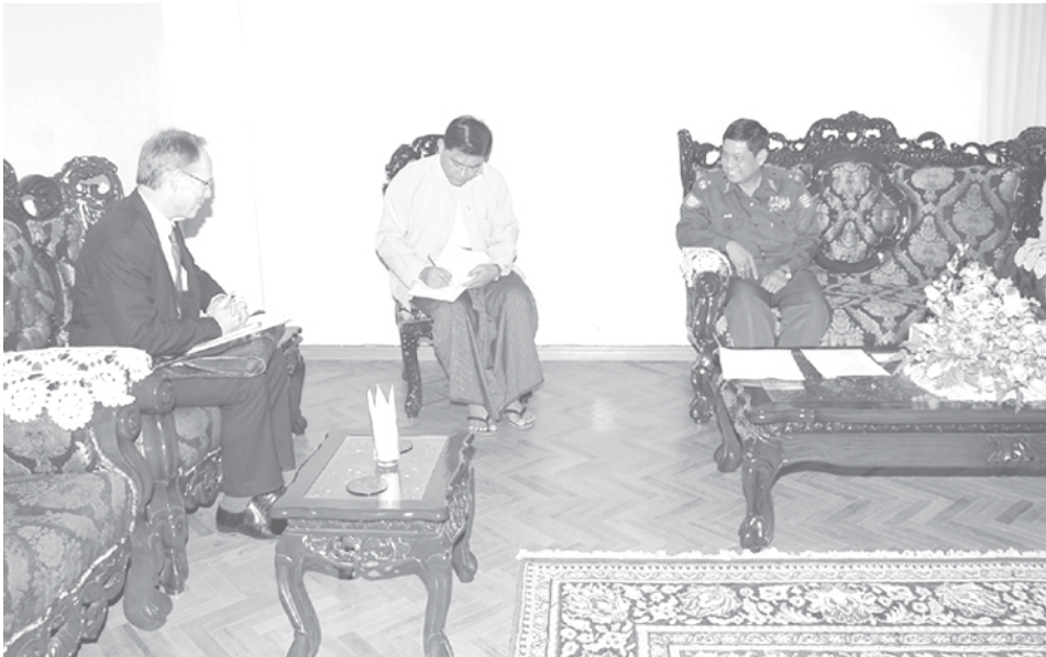
Minister for Agriculture and Irrigation Maj-Gen Htay Oo receives Swedish Minister Counsellor Mr Benet Ekman.

NAY PYI TAW, 15 Nov— Minister for Agriculture and Irrigation Maj-Gen Htay Oo met Minister-Counsellor Mr Benet Ekman of the Bangkok-based Swedish Embassy, at the hall of the Ministry of Agriculture and Irrigation in Nay Pyi Taw at 5.30 p.m. on 13 November.