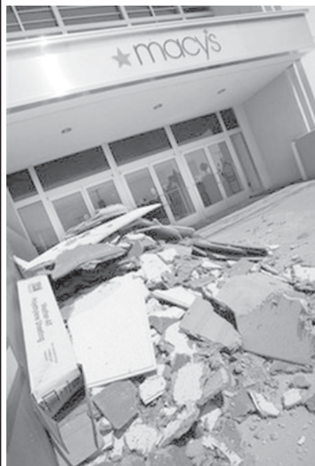
In this photo, ceiling tiles and other debris are piled outside, after pipes broke at a Macy's department store in the Canoga Park area of Los Angeles following an earthquake that rolled through Southern California.

California will star Thursday in a mock earthquake disaster drill — considered the largest in US history — with some 5 million people pledging to