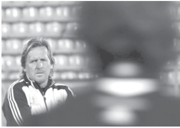
Real Madrid coach Bernd Schuster

MADRID, 15 Nov — Real Madrid could bring in a player to replace injured striker Ruud van Nistelrooy, who is out for the season after having knee surgery, coach Bernd Schuster said