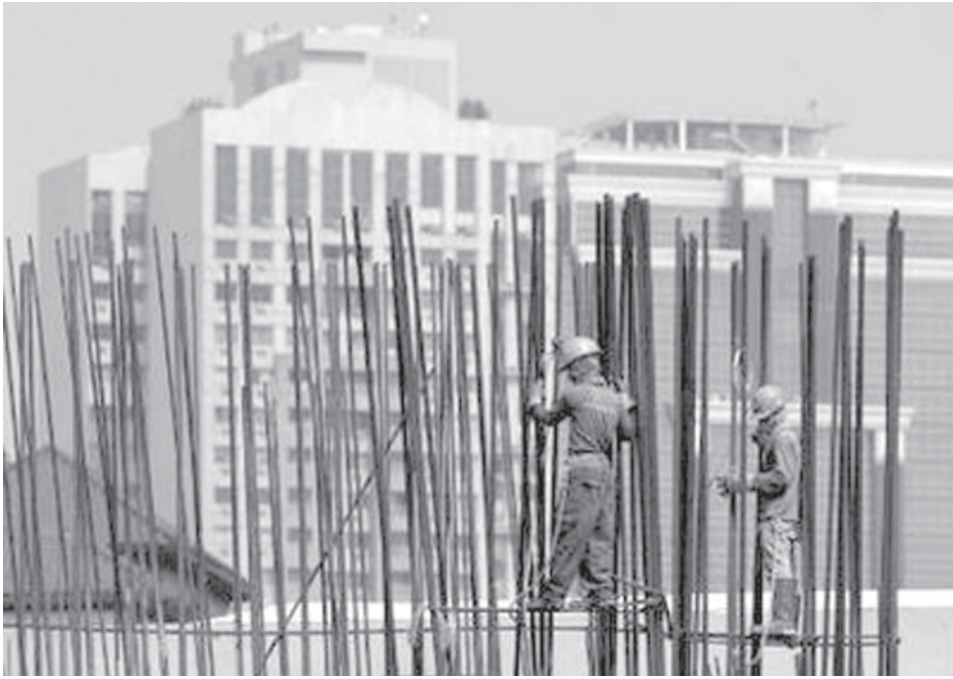
Construction workers prepare steel bars before cement is poured at a building project in Manila on 14 Nov, 2008. The Philippine economy is expected to slow further to post growth of 3.7 to 4.7 percent next year from 4.1 to 4.8 percent this year as the global financial crisis dampens domestic and external demand.—INTERNET