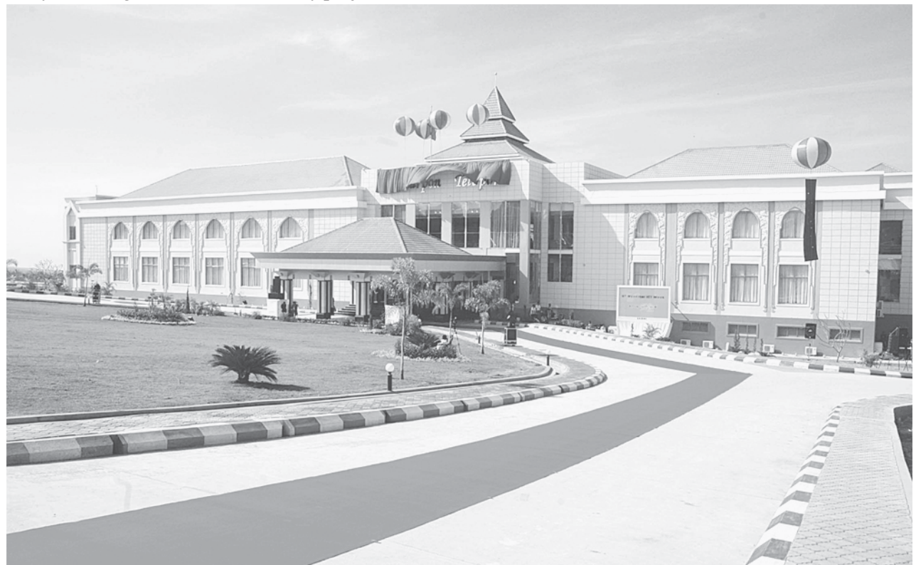
Yatanarpon Teleport in Pyin Oo Lwin Township.

All the projects must be undertaken successfully and effectively by holding the concept that those projects can help develop the Union, improve living conditions of the entire national people and serve the long-term interests of future generations.