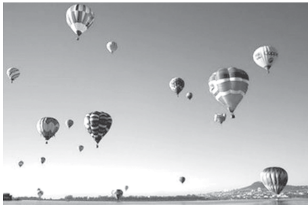
One hundred balloons take off in unison over the Palote dam during the seventh edition of the 'Hot Air Balloons Festival' in Leon, Mexico, on 14 Nov, 2008.