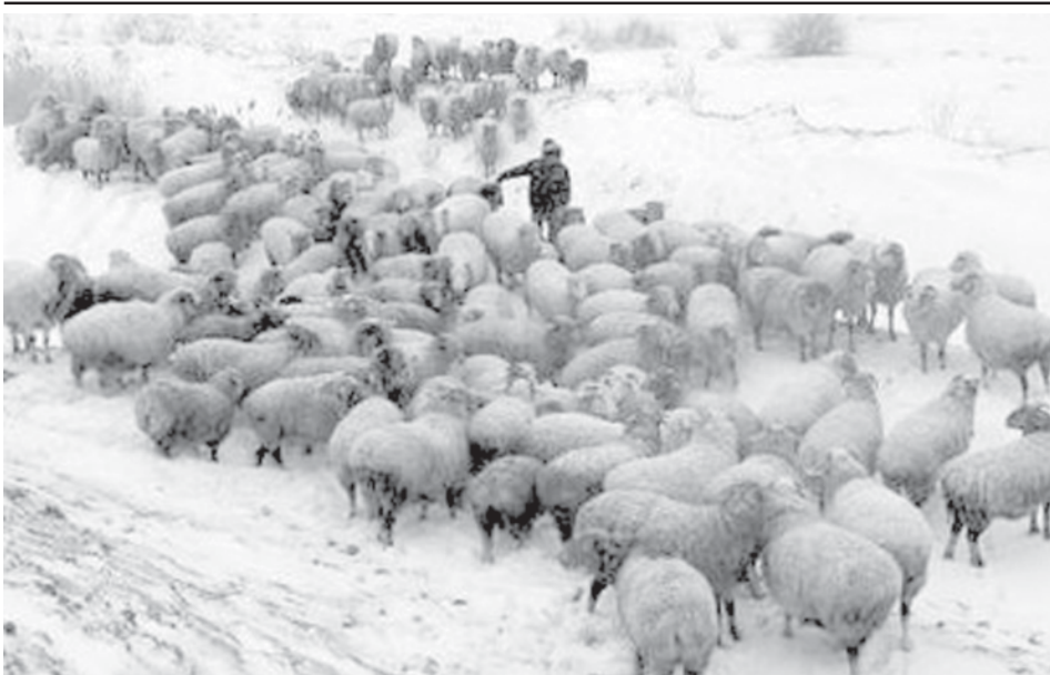
A shepherd herds sheep amid snow at a mountainous region in Altay prefecture, Xinjiang Uygur Autonomous Region, on 13 Nov, 2008. About 1,000 vehicles are stranded on a section of a major highway in northwest China after rain and snow left an impassable layer of ice on Thursday, Xinhua News Agency reported traffic authorities saying.—INTERNET

Brown clouds are caused by an unhealthy mix of particles, ozone and other chemicals that come from cars, coal-fired power plants, burning fields and wood-burning stoves. First identified by the report's lead researcher in 1990, the clouds were depicted Thursday as being more widespread and causing more environmental damage than previously known.—Internet