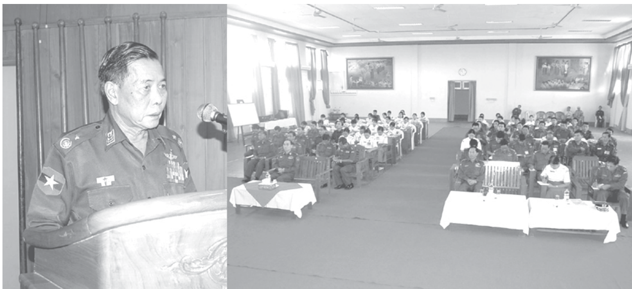
Minister for Immigration and Population Maj-Gen Saw Lwin speaking at opening of English Proficiency Course. —MNA

NAY PYI TAW, 15 Nov— The Ministry of Immigration and Population opened the English Proficiency Course at the ministry here yesterday morning, attended by Minister for Immigration and Population Maj-Gen Saw Lwin, Deputy Minister Brig-Gen Win Sein, officials of the departments under the