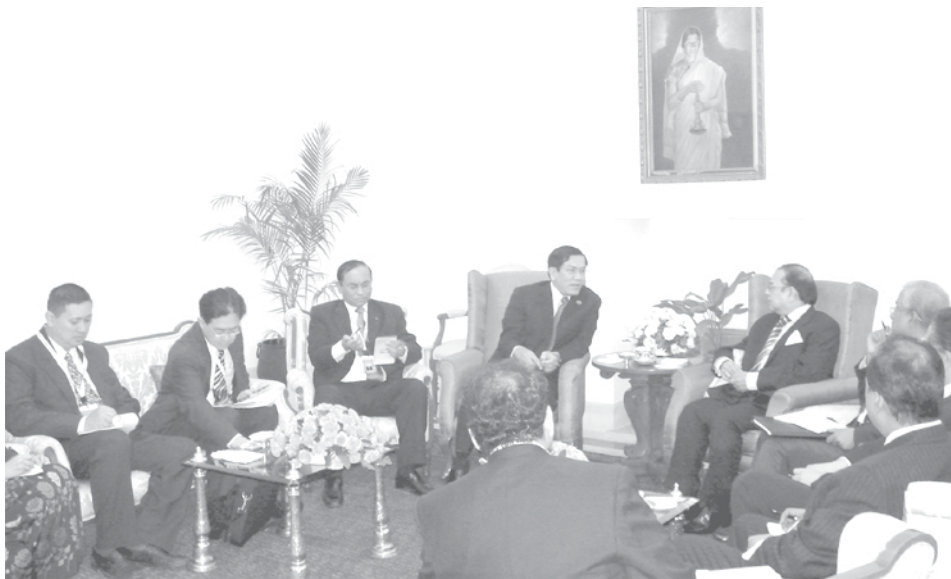
Foreign Affairs Minister U Nyan Win meets Bangladesh Caretaker Government's Adviser to the Ministry of Foreign Affairs Dr Iftekhar Ahmed Chowdhury.