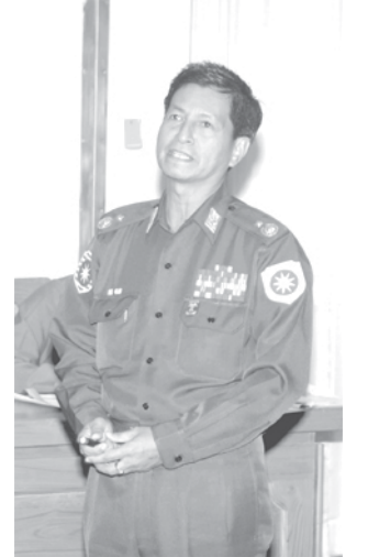
Minister for Electric Power No. 2 Maj-Gen Khin Maung Myint. MNA

Communications, Posts and Telegraphs launched the tasks for installation of 55,000 CDMA-450 mobile exchange lines and 46 CDMA-450 radio stations in Yangon and other regions to improve the communication pattern in offshore and deep sea areas. Up to April 2008, the ministry had set up 34 stations and 55,000 lines in the seaside regions and in Ayeyawady Division including three stations in Yangon. It managed to carry out rescue and rehabilitation tasks effectively in areas hit by the cyclone “Nargis” with the use of CDMA-450 communication system.