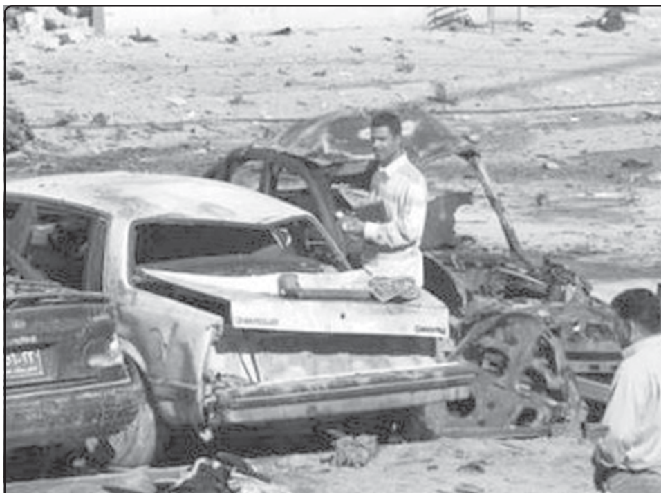
Men look at their destroyed vehicles at a parking lot after a bomb attack in Baghdad 12 November, 2008. A parked car bomb killed four people and wounded 14 others, including two policemen, in Sadoun street in central Baghdad, police said.—INTERNET