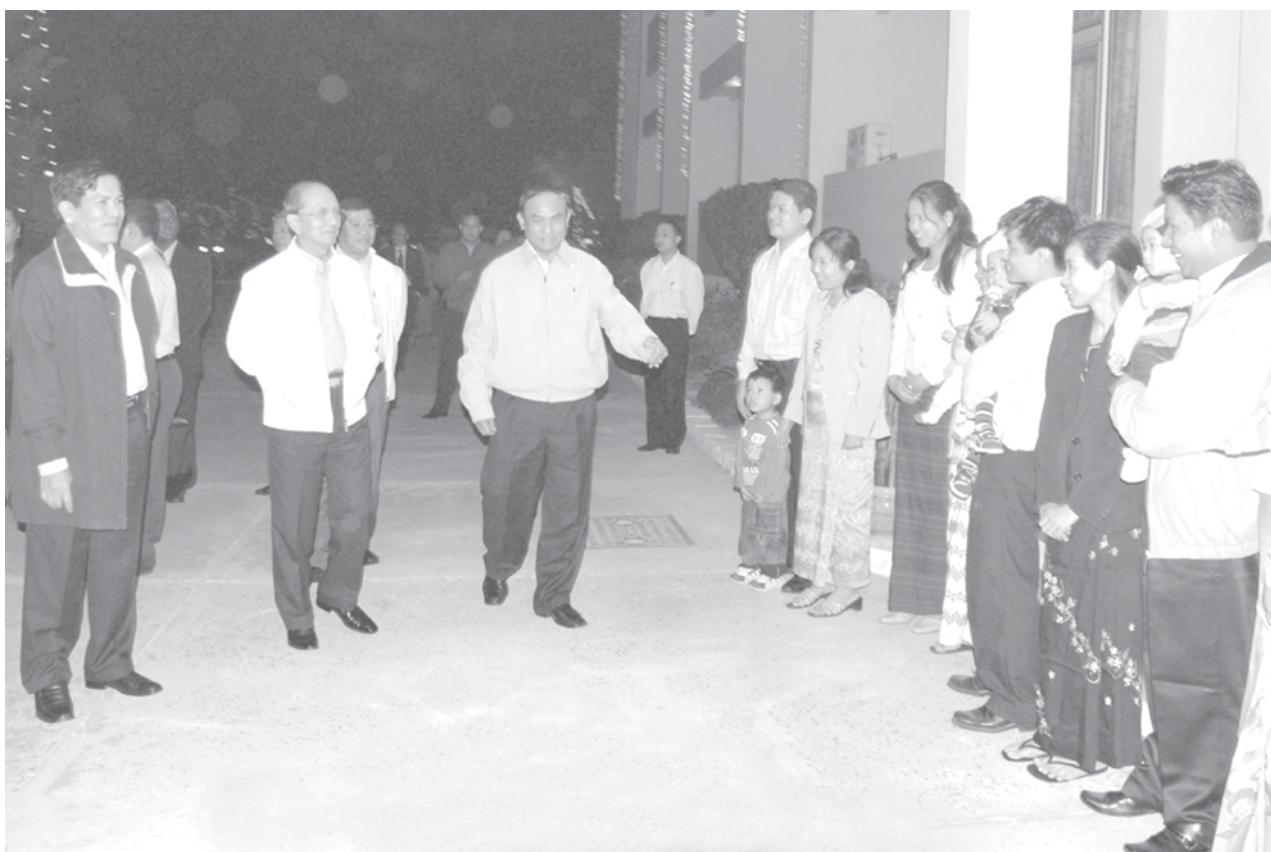
Prime Minister General Thein Sein greets embassy staff and their families led by the Ambassador, the Military Attaché and the Consul-General at the residence of Myanmar Ambassador in New Delhi.