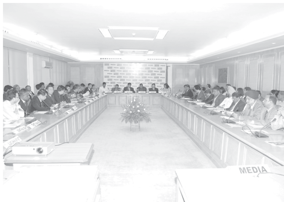
A meeting between Union of Myanmar Federation of Chambers of Commerce and Industry and Federation of Indian Chambers of Commerce and Industry in progress.