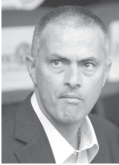
Inter Milan coach Jose Mourinho, has dropped both Adriano and Ricardo Quaresma from his match-day squad to face Palermo on Sunday.

ROME, 15 Nov — Inter Milan coach Jose Mourinho has dropped both Adriano and Ricardo Quaresma from his match-day squad to face Palermo on Sunday.