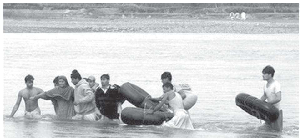
Local villagers rescue passengers from the Kabul river after a boat capsized while crossing the river in Qila Shah Baig near Peshawar, Pakistan on 14 Nov, 2008. Dozens of people who fell in the river while riding in an overloaded boat were rescued by the villagers.

Sun Microsystems, one stalwart of the industry, said on Friday it would cut up to 6,000 jobs, 18 percent of its workforce.