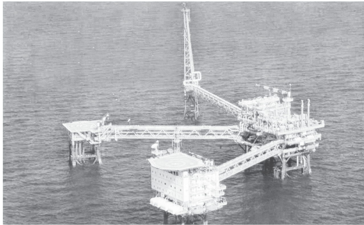
A rig seen in exploring natural gas at Mottama Offshore Region.

Magway Railroad construction project, Namhsan-Kengtung Railroad construction project and Dawei-Myeik Railroad construction project.