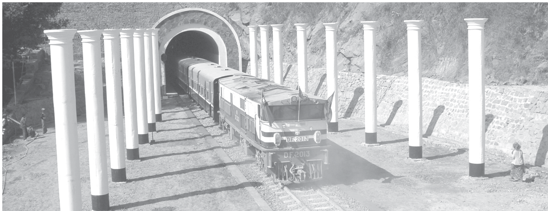
Ponnyataung Tunnel on 7-mile long Kyaw-Yemyetni railroad section of Pakokku-Gangaw-Kalay railroad built by Myanma Railways in Gangaw Township for ensuring smooth transportation. —MNA

The 15 hydropower projects to be undertaken by the Ministry of Electric Power No. 1 are Yi Nan Hydropower Project (1200 megawatts), Khaunglanphu Hydropower Project (2,700 megawatts), Phizaw Hydropower Project (2,000 megawatts), Wuhsauk Hydropower Project (1,800 megawatts), Chiphwe Hydropower Project (2,800 megawatts), Chiphwenge Hydropower Project (99 megawatts), and Laikzar Hydropower (See page 8)