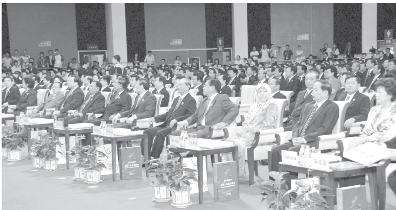
Prime Minister General Thein Sein attending opening of 5 th China-ASEAN Expo.

ASEAN is taking effective measures for greater economic cooperation in the region with an object of forming an ASEAN economic community.