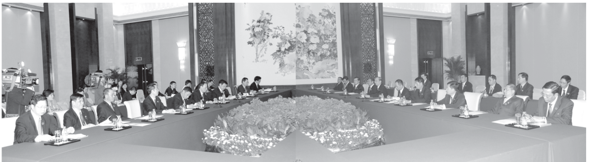
Prime Minister General Thein Sein and Chinese Vice-Premier Mr Wang Qishan hold discussions on bilateral cooperation in Nanning.