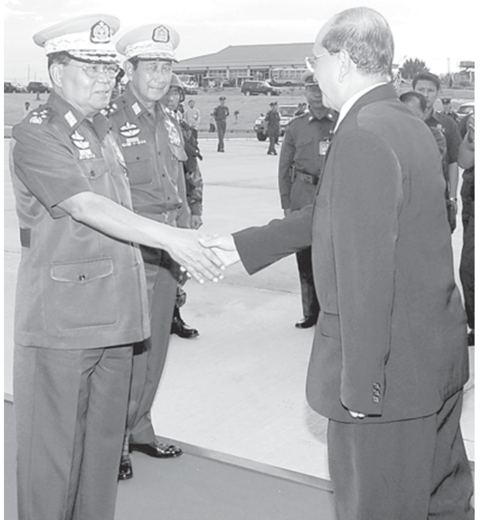
Senior General Than Shwe greets Prime Minister General Thein Sein at Nay Pyi Taw Airport in Nay Pyi Taw.