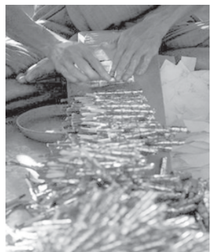
An Indian worker hand-rolls fireworks in Ahmedabad on 14 October. Eighteen people have been killed, many of them children, when an illegal fireworks factory exploded in northern India, police have said.