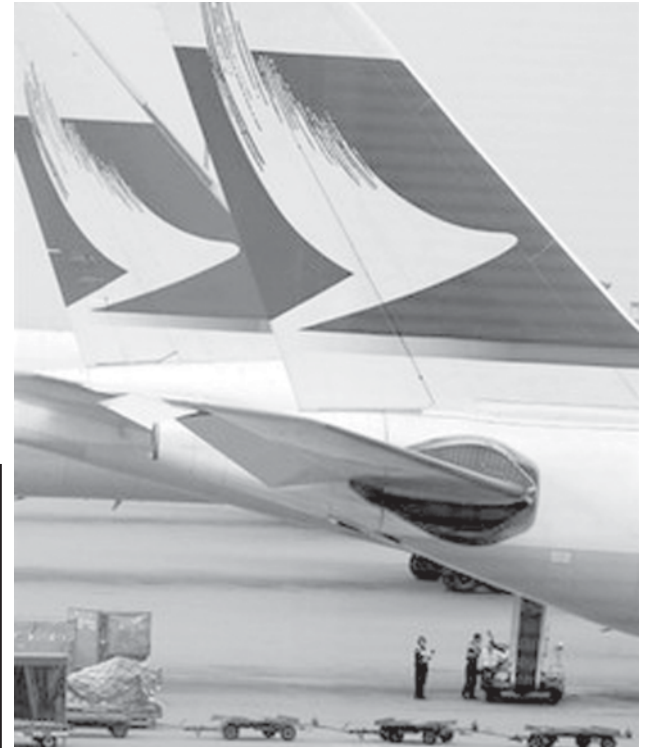
File photo shows Cathay Pacific aircraft at Hong Kong International Airport. Cathay Pacific on 23 Oct denied market rumours that it was planning a takeover of British Airways.

of BA rose on Wednesday on speculation that the firm was a takeover target.