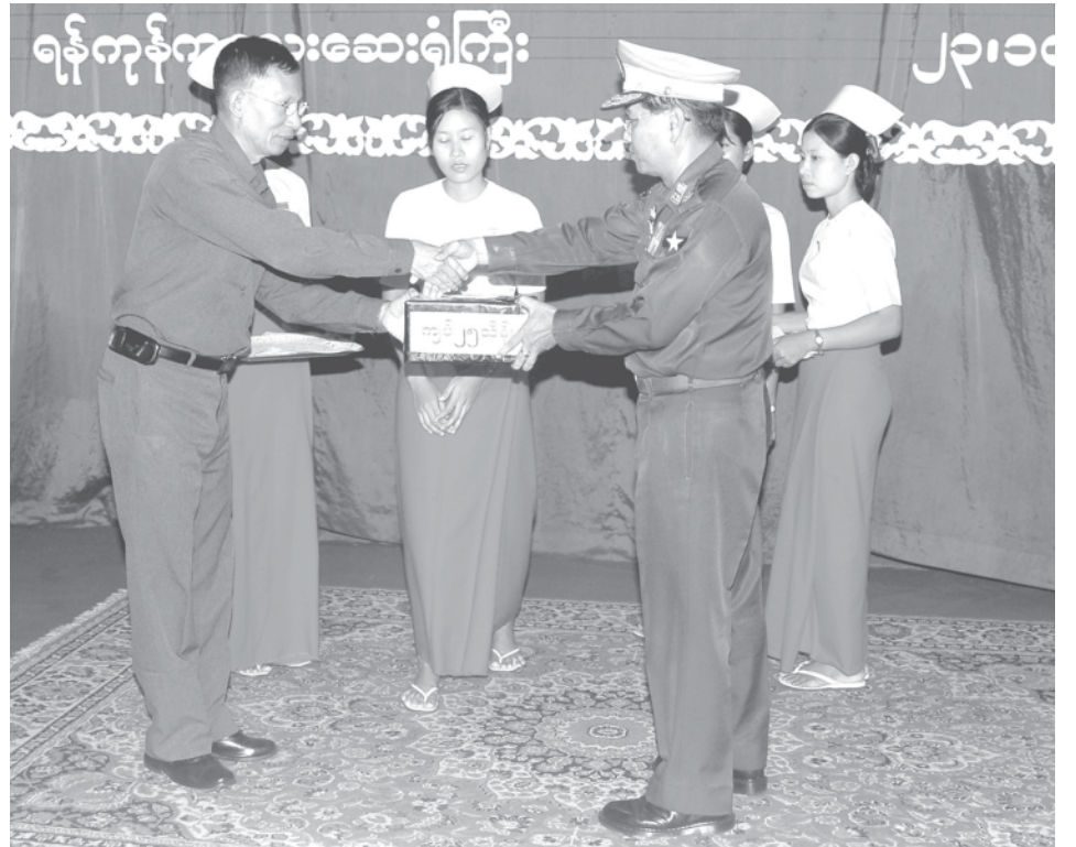
Lt-Gen Myint Swe accepts cash donation from a wellwisher for construction of annexe of Yangon Children's Hospital.

Afterwards, Lt-Gen Myint Swe attended a ceremony to donate cash to the construction of the annexe presented by 92 donors for the third time.