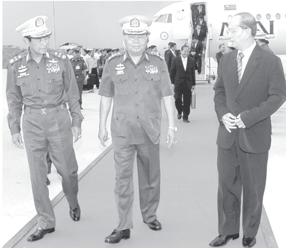
Senior General Than Shwe welcomes back Prime Minister General Thein Sein at Nay Pyi Taw Airport in Nay Pyi Taw.