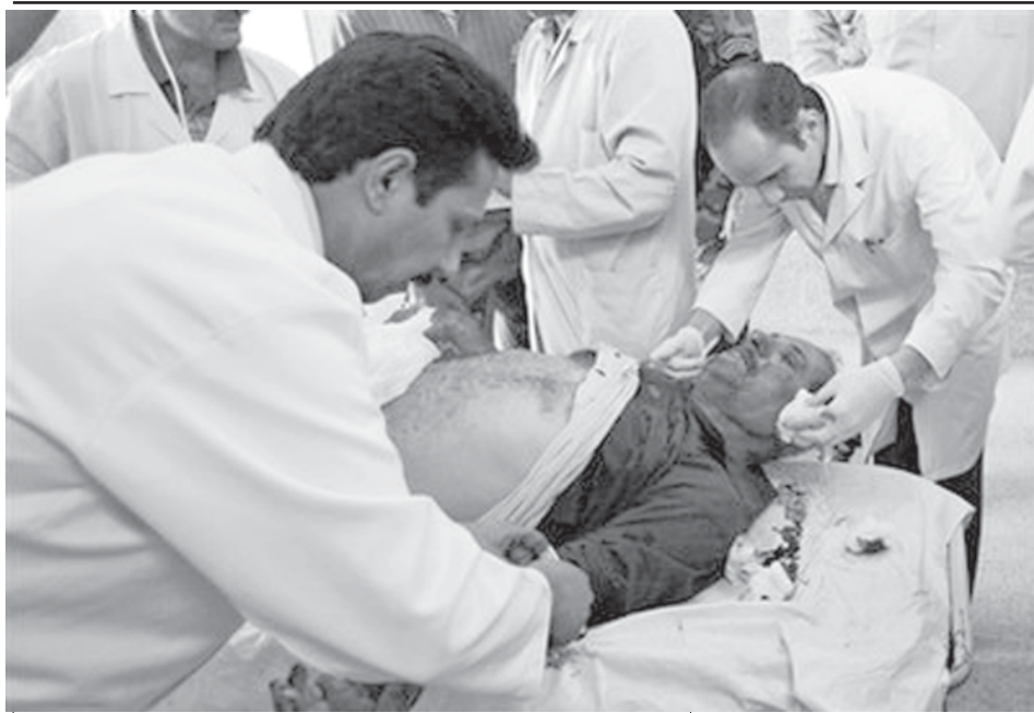
A medic treats a wounded man in al Kindi hospital, Baghdad, Iraq, on 22 Oct, 2008. A roadside bomb struck an ambulance in al Nidhal Street, in central Baghdad.