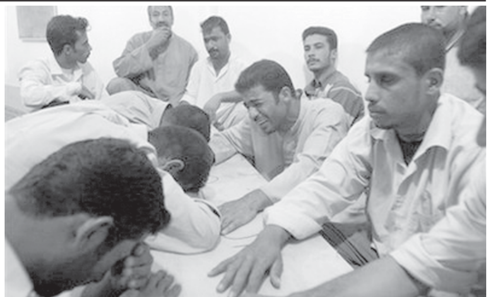
Iraqi men mourn over the coffin of a relative in a mosque, in Karbala, 80 kilometres (50 miles) south of Baghdad, Iraq, on 22 Oct, 2008. Iraqi officials Wednesday reported finding mass graves with the remains of 34 people, most believed to have been Iraqi Army recruits waylaid three years ago by al-Qaeda gunmen as they travelled to a training base near the Syrian border.