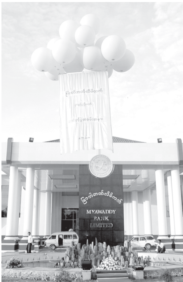
Secretary-1 Lt-Gen Thiha Thura Tin Aung Myint Oo unveils the signboard of Myawaddy Bank in Nay Pyi Taw. (News on page 16)

Next, Laotian Vice-President Mr Bounngang Vorachit, Speaker of the House of Representatives of the Philippines Hon Prospero C Nograles, Vietnamese Deputy Prime Minister Mr Hoang Trung Hai, UNCTED Secretary-General Dr Supachai Panitchpakdi and Chinese Vice-Premier Mr Wang Qishan delivered the opening speeches and the opening ceremony ended.