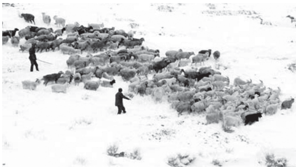
Herdsmen herd sheep in snow in Hami, northwest China’s Xinjiang Uygur Autonomous Region, on 21 Oct, 2008. A heavy snow hit the north of Hami from Monday to Tuesday, causing some inconvenience to the local stockbreeding industry and transportation.

The accident prompted a temporary close of Runway No 16 at Zurich Airport. The rescue service has yet to release more information about the staff abroad the plane.—Xinhua