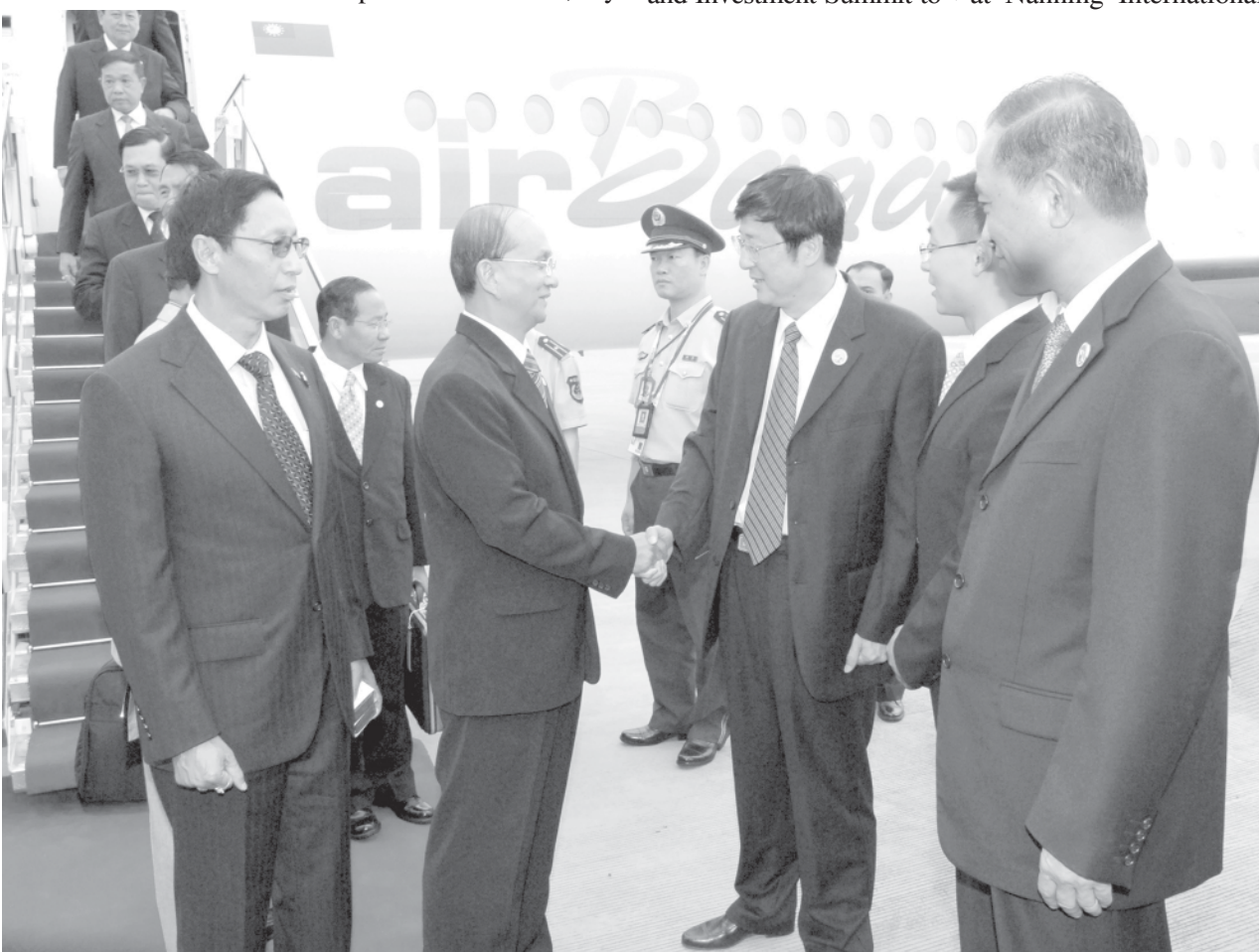
Prime Minister General Thein Sein being welcomed by Permanent Committee Member of Guangxi Zhuang Autonomous Region Mr Shen Bei Hai. — MNA