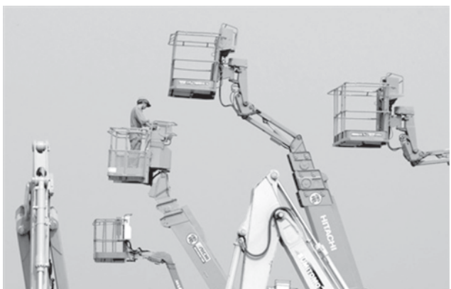
A worker stands on a crane which is parked at a construction site at Keihin industrial zone in Kawasaki, south of Tokyo on 22 Oct, 2008.