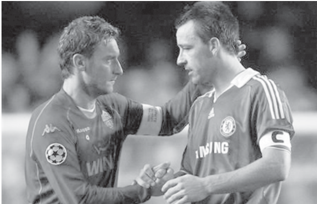
Chelsea's John Terry (R) shakes hands with AS Roma's Francesco Totti after their Champions League soccer match at Stamford Bridge in London on 22 Oct, 2008.

Until the goal Roma, who had been thrashed 4-0 by Inter Milan in Serie A at the weekend, held out with few problems against a team who had been scoring for fun in the Premier League.