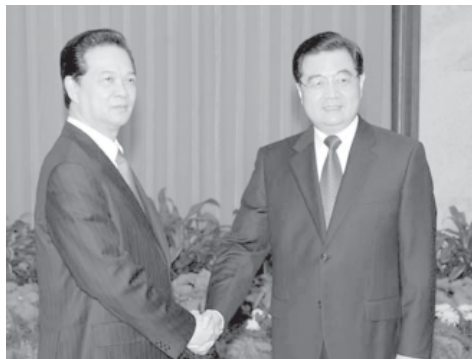
Chinese President Hu Jintao (R) meets with visiting Vietnamese Prime Minister Nguyen Tan Dung.

Vietnam was willing to resolve disputes with China concerning the issue in a spirit of cooperation and brotherhood