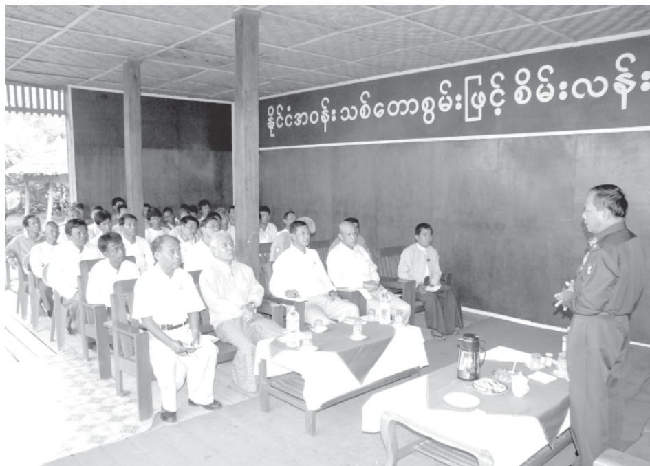
Minister for Forestry Brig-Gen Thein Aung meets local people at Natkanle forest camp in eastern Mount Popa of Kyaukpadaung Township.

At the briefing hall, the minister heard reports on establishment of the factory and investment presented by officials.