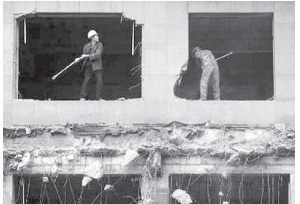
Workers demolish a building in Suining, Sichuan Province on 23 Oct, 2008. China's Ministry of Finance on Wednesday announced a series of policy changes that will make it easier for people to buy their first homes, fleshing out a directive approved last week by the cabinet.

Dalian Hanovo Foods was not immediately available for comment. A woman in the quality supervision department at Dalian Greensnow said she knew nothing about the recall.