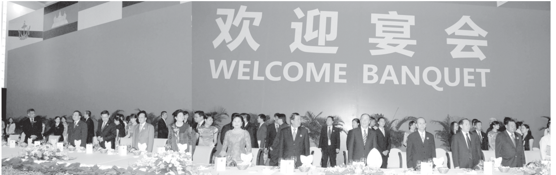
Prime Minister General Thein Sein attends banquet hosted in honour of 5th China-ASEAN Expo and 5th China-ASEAN Business and Investment Summit.— MNA

NAY PYI TAW, 23 Oct — Prime Minister of the Union of Myanmar General Thein Sein attended a banquet hosted by the Government of the People's Republic of China at International Conference Centre at Li Yun Hotel in Guangxi Zhuang Autonomous Region, Nanning on 21 October, to mark the 5th