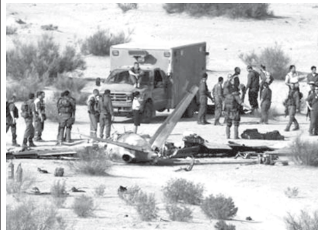
Israeli military personnel check the site of the training plane crash in the northern Negev Desert near Kibbutz Tzeelim, Israel, on 22 Oct, 2008. A military training plane crashed in southern Israel on Wednesday, killing an Israel Air Force (IAF) officer and a soldier.