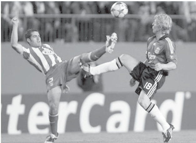
Atletico Madrid's Antonio Lopez (L) and Liverpool's Dirk Kuyt try to control the ball during their Champions League soccer match at Vicente Calderon stadium in Madrid on 22 Oct, 2008.

MADRID, 23 Oct—Simao Sabrosa scored a late equaliser to cancel out Robbie Keane's first-half strike as Atletico Madrid and Liverpool shared an entertaining 1-1 draw in their Champions League Group D match on Wednesday.