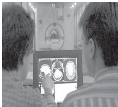
Researchers at the University of Cambridge said they have found that alemtuzumab, a drug originally developed to treat leukaemia, can halt and even reverse the debilitating effects of multiple sclerosis (MS).