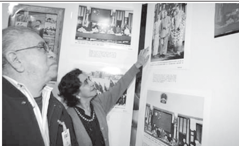
Visitors view the picture exhibition titled “Tibet of China” in Mexico City, on 21 Oct, 2008. The exhibition, initiated by the Chinese Embassy in Mexico, the China-Mexico Friendship Group of the Chamber of Deputies, the Cultural Commission of the Chamber of Deputies and Xinhua News Agency, was inaugurated in the Mexican Chamber of Deputies on Tuesday, where 195 images documenting Tibetan history, cultural and religious protection, and socio-economic development are exhibited.