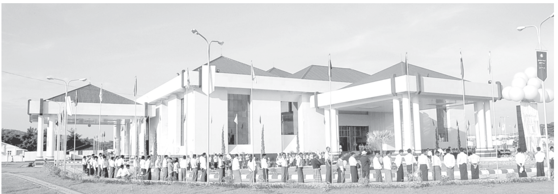
Myawaddy Bank in Nay Pyi Taw. (News on page 16)