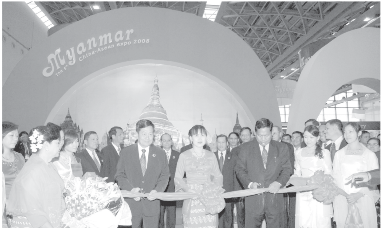
Prime Minister General Thein Sein attends opening of Myanmar booths by Minister for Commerce Brig-Gen Tin Naing Thein and UMFCCI President U Win Myint at 5th China-ASEAN Expo.—MNA

NAY PYI TAW, 23 Oct—Prime Minister General Thein Sein attended the opening ceremony of the Myanmar pavilions to be exhibited in the 5 th China-ASEAN Expo at Nanning International Convention and Exhibition Centre in Nanning, Guangxi Zhuang Autonomous Region of the People's Republic of China on 21 October.