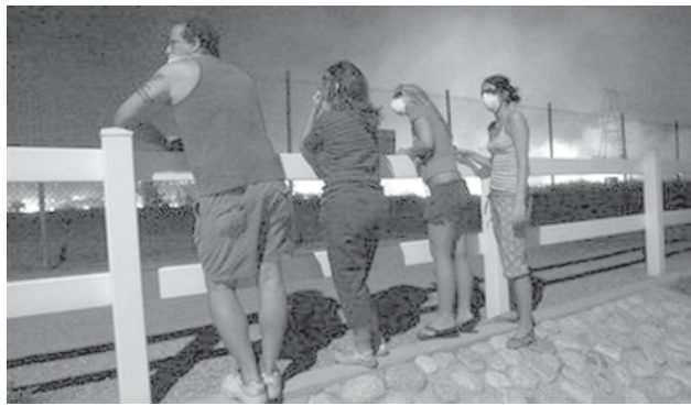
Residents watch as a brush fire fanned by Santa Ana winds burns out of control in Fontana, California on 22 Oct, 2008.

RANCHO CUCAMONGA, 23 Oct—Hot, dry Santa Ana winds — and a high risk of wildfires — returned to Southern California on Wednesday, but firefighters quickly jumped on the small brush blazes that erupted.