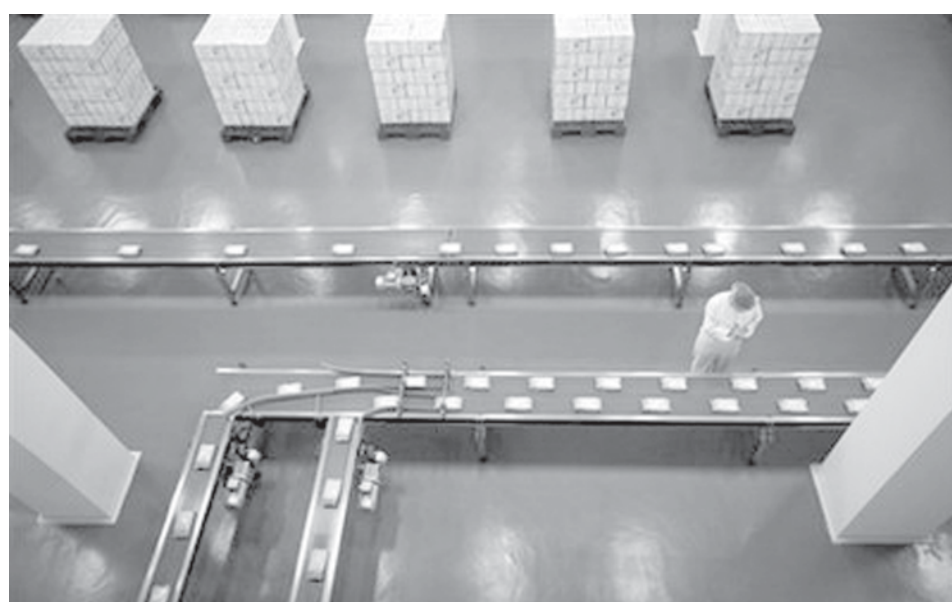
A worker checks product lines of milk powder in a factory owned by Yili Industrial Group Co, one of China's largest dairy producers, in Hohhot, north China's Inner Mongolia region. In a report released on 22 Oct, 2008, the United Nations recommended China tighten oversight focusing on high-risk areas of the food chain, have an all-encompassing food safety law that would cover the whole industry and hold businesses responsible for the products they sell.