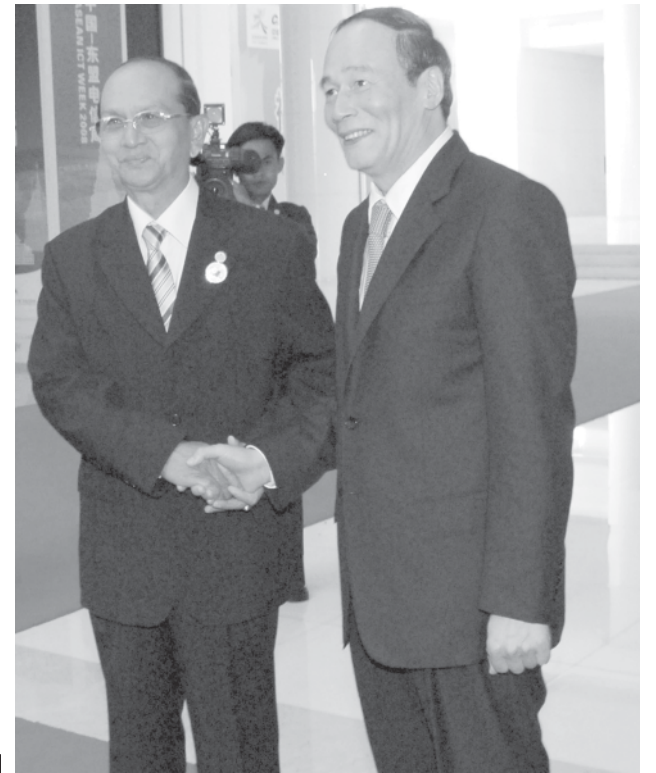
Prime Minister General Thein Sein shakes hands with Chinese Vice-Premier Mr Wang Qishan at International Convention Center in Nanning.

In accordance with the motto of 5 th China-ASEAN Expo and 5th China-ASEAN Business & Investment Summit "Broader Vision, Move Action", efforts for cooperation in various areas are to be stepped up effectively.