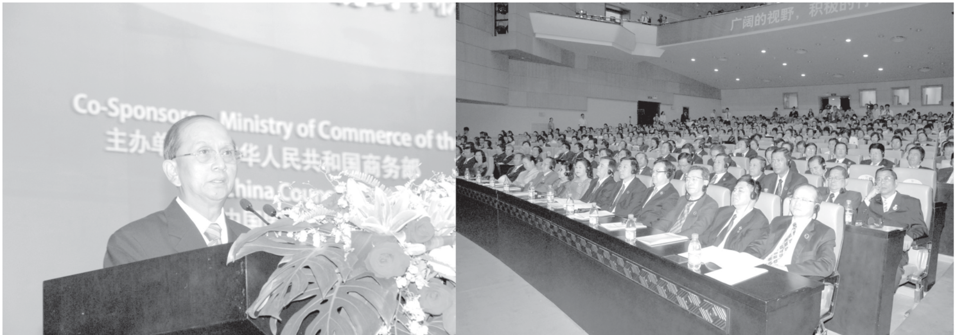
Prime Minister General Thein Sein delivers an address at 5 th China-ASEAN Business & Investment Summit.

NAY PYI TAW, 23 Oct —Prime Minister of the Union of Myanmar General Thein Sein delivered an address at the 5 th China-ASEAN Business and Investment Summit at the People's Hall of Guangxi in Nanning, Guangxi Zhuang Autonomous Region of the People's Republic of China yesterday.