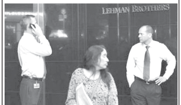
People stand outside the world headquarters for Lehman Brothers in New York 15 September, 2008.—INTERNET

Asian share markets, many of them closed for a holiday on Monday, tumbled as investors absorbed the weekend's dramatic events on Wall Street, where Merrill Lynch agreed to be sold to Bank of America for $50 billion. In Singapore, hundreds of anxious investors thronged the office of an AIG unit to redeem their policies.— Internet