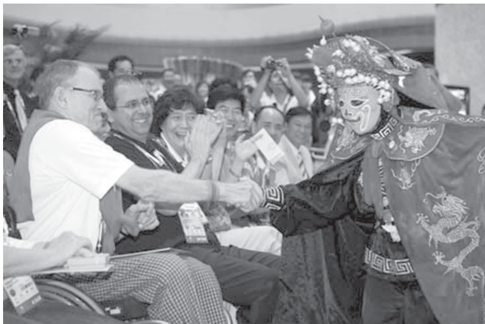
A Chuanju Opera player shakes hands with a foreign audience during the Mid-Autumn soiree in Beijing, capital of China, on 14 Sept, 2008.