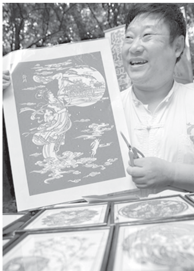
A folk artist displays a piece of his works titled “Chang’e flying to the moon”, a legend about the Chinese moon goddess Chang’e, during the Mid-Autumn Folklife Festival in Nanjing, East China’s Jiangsu Province on 13 Sept, 2008.

The PRF has yet to determine how many passengers were traveling in each vehicle. A total of 24 people were involved in the crash, more than the combined maximum capacity of both vehicles, 22 passengers. —Xinhua