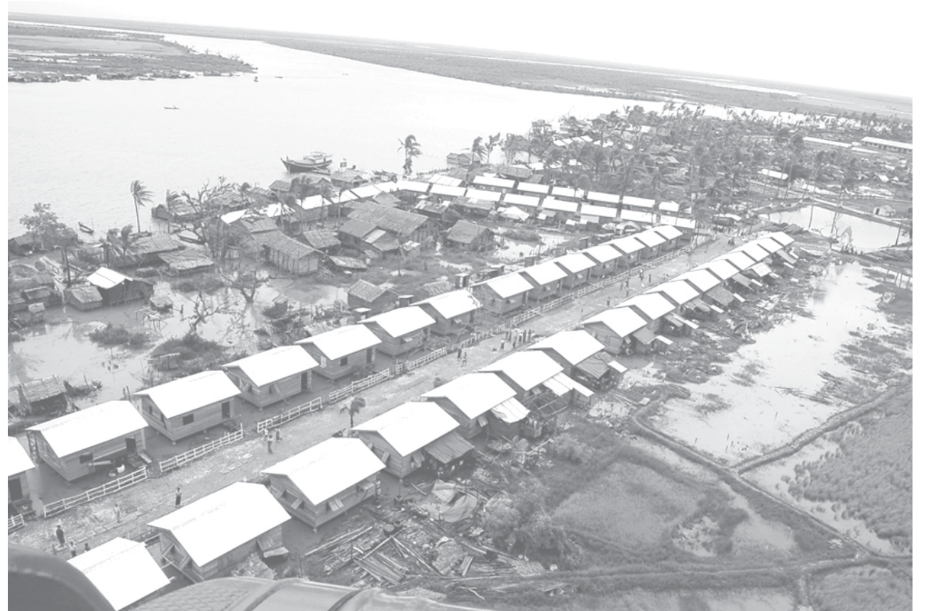
An aerial view of Polaung village in Labutta Township.

nessed the severe storm and a great number of lives were lost and a large amount of property was