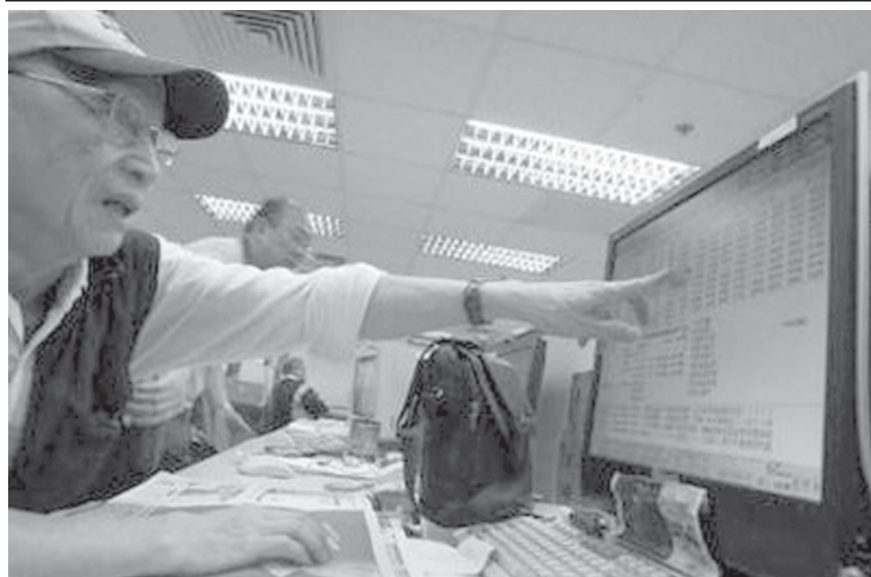
Small investors react as they monitor share prices during morning trading at a brokerage in Hong Kong on 16 Sept, 2008.