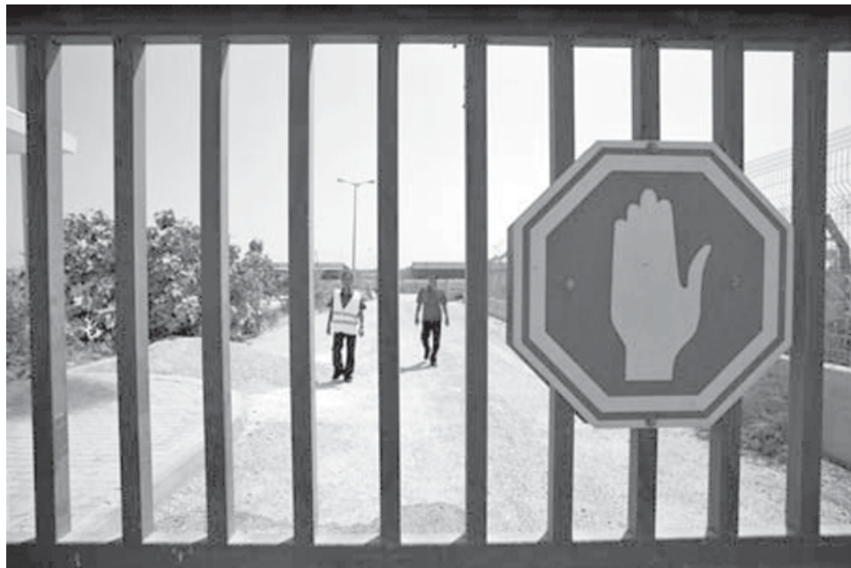
Two Palestinian man walk beyond a gate of the closed Karni crossing point connecting Gaza Strip and Israel, on 15 Sept, 2008. Israeli army on Monday shut down commercial crossing points into Gaza in response to a rocket attack that targeted southern Israel territories a day earlier.