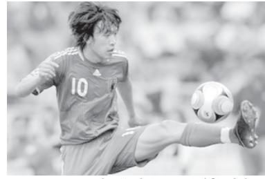
Japan and Celtic midfielder Shunsuke Nakamura, seen here, says he wants to return to his his old J-League home, Yokohama Marinos, and possibly as early as January, Japanese media reported.

Nakamura was earlier quoted by British media as saying he