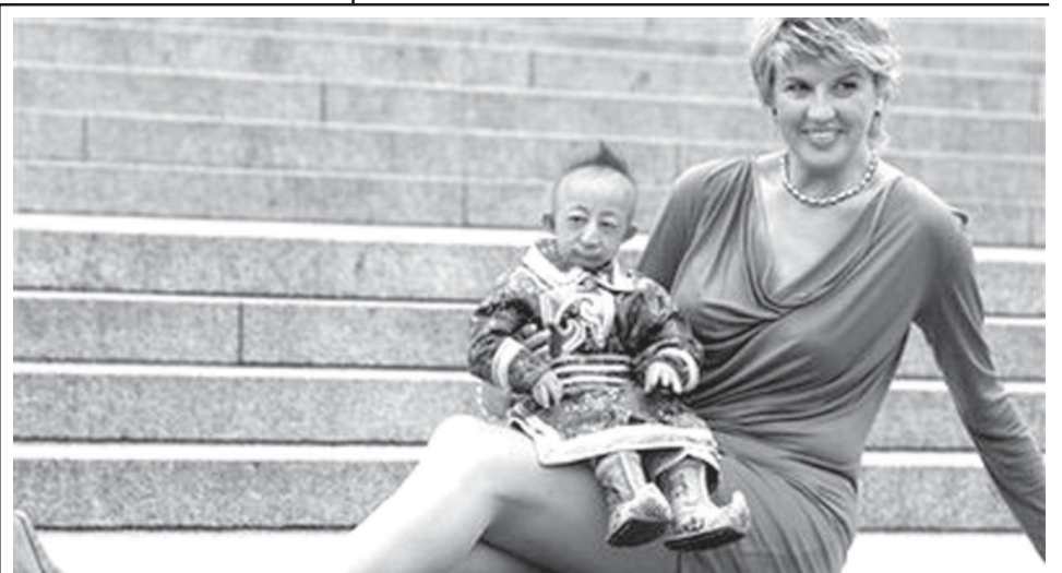
He Pingping from Inner Mongolia, China’s autonomous region, the world’s smallest man sits on the lap of Svetlana Pankratova from Russia, the Queen of Longest Legs, as they pose at Trafalgar Square in London, on 16 Sept, 2008. Pingping, born with primordial dwarfism, holds the Guinness World Record for the smallest man at 74.61 cms (2 feet and 5.37 inches) and Pankratova holds the Guinness World Record for the longest leg of any woman at 132 cms (4 feet 4 inches) in length.