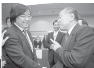
Chinese former Foreign Minister Li Zhaoxing (R) talks to Yasushi Kudo, representative of a Japanese nonpolitical organization, at the opening banquet of the 4th Beijing-Tokyo Forum in Tokyo, Japan, on 15 Sept, 2008.