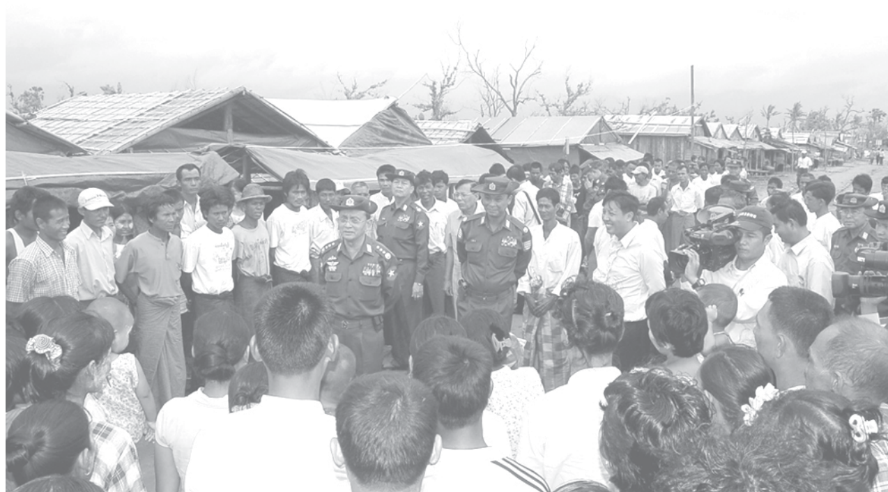
Prime Minister General Thein Sein greets local people at Thingangyi village in Labutta Township.