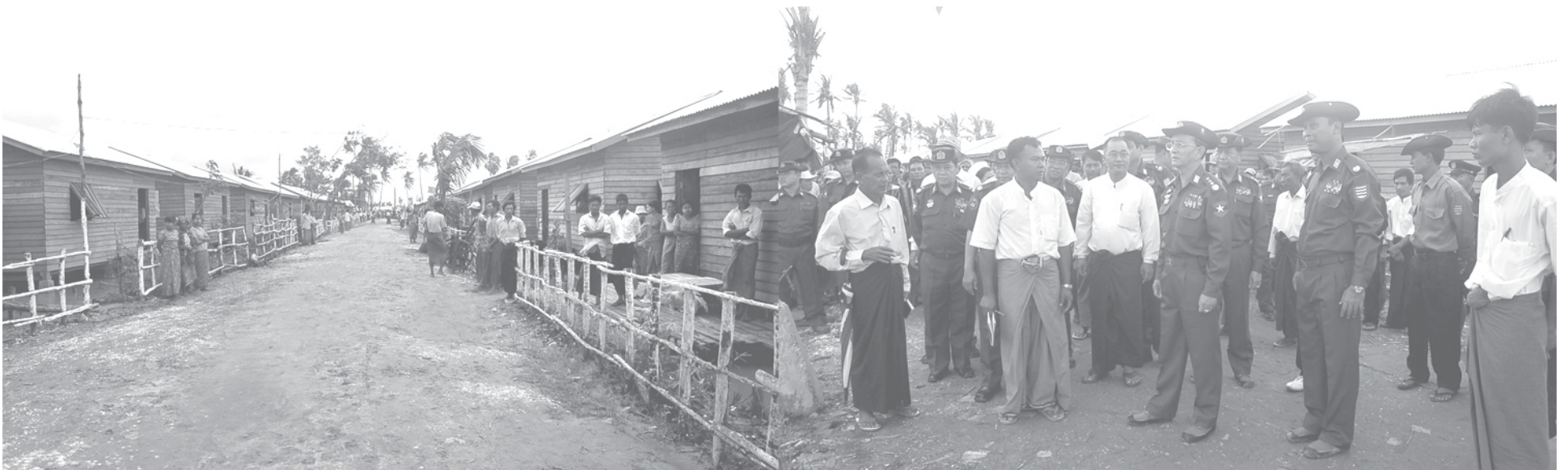
Prime Minister General Thein Sein visits local people living in new homes at Polaung Village in Labutta Township, Ayeyawady Division.

NAY PYI TAW, 16 Sept—Chairman of National Disaster Preparedness Central Committee Prime Minister General Thein Sein visited Thingangyi and Polaung Villages and Pyinsalu in Labutta Township yesterday and made arrangements for regional development.