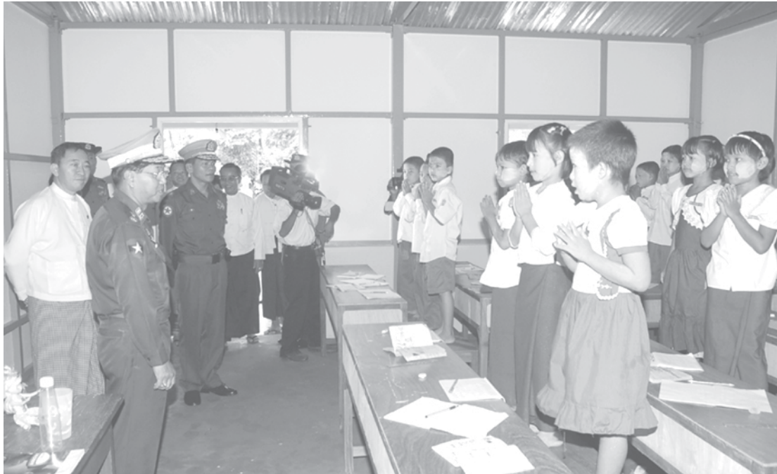
Lt-Gen Myint Swe visits children at a classroom built by Shwedaung Development Co Ltd in Thanlyin Township.

YANGON, 16 Sept— Lt-Gen Myint Swe of the Ministry of Defence attended the opening ceremony of new school buildings donated by Shwedaung Development Co Ltd for Basic Education Middle School in Myohaung Ale Ward in Thanlyin Township this morning.