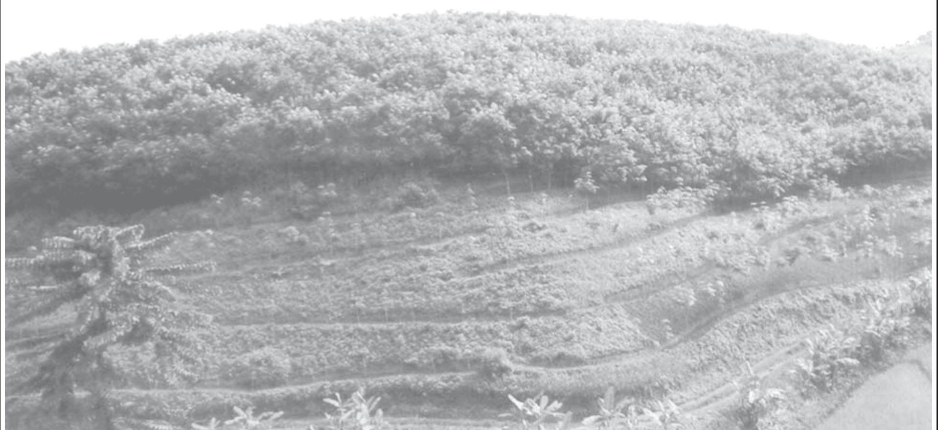
Rubber being cultivated on commercial scale in contour lines on mountains as industrial raw material.