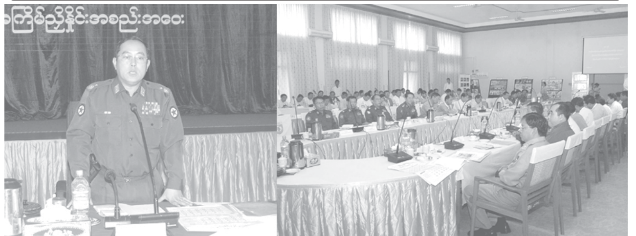
Commander Maj-Gen Wai Lwin addresses coordination meeting of the Leading Committee for Organizing Performing Arts Competitions. —MNA