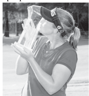
Angela Stanford gives her trophy a kiss after winning the Bell Micro LPGA Classic golf tournament on 14 Sept, 2008, in Mobile, Ala.