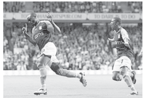
Aston Villa's English midfielder Nigel Reo-Coker (L) celebrates scoring during their Premier League match against Tottenham Hotspur at White Hart Lane, London. Aston Villa won 2-1.

"I thought it was sensational," purred the Northern Irishman.