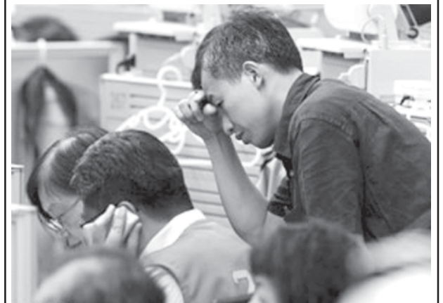
Floor traders at the Hong Kong Exchange react Tuesday to news of falling shares.

BAGHDAD, 16 Sept — General Ray Odierno took command of US-led forces in Iraq on Tuesday, faced with the challenges of pulling off large-scale attacks by militants at a time when American troop levels are being reduced. Odierno replaced General David Petraeus at a ceremony presided over by US Defence Secretary Robert Gates.