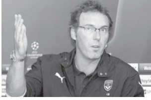
FC Girondins de Bordeaux Manager Laurent Blanc, seen here addressing the press at Stamford Bridge, insists Chelsea can't expect to win the Champions League just because they are a financial superpower.

LONDON, 16 Sept — Bordeaux manager Laurent Blanc insists Chelsea can't expect to win the Champions League just because they are a financial superpower.