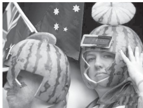
Two Australian spectators with watermelon helmet on the head watch athletic event at Beijing 2008 Paralympic Games.