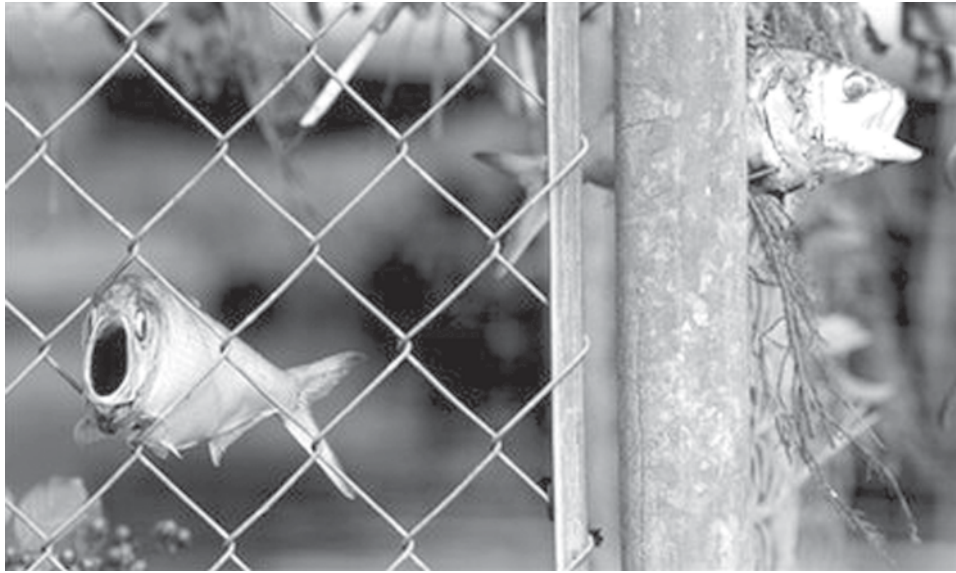
Fish remain stuck in a fence as flood waters caused by Hurricane Ike recede, in West Orange, Texas, on Monday, 15 Sept, 2008.