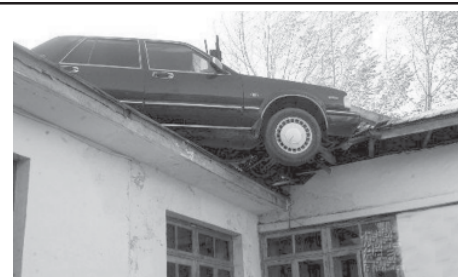
The photo shows a car being accidentally blown onto the house by hurricane in Yan Ji, Jilin Province.

Court documents indicate the man's earlier actions led court staff members to believe he was armed. Police say he called asking if there was a locked box to store his gun, later entered the office and ran out, returned and checked the court calendar, then took pictures of signs saying weapons are prohibited.