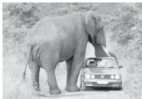
Two visitors have a "close contact" with an elephant at a wild animal park in South Africa.