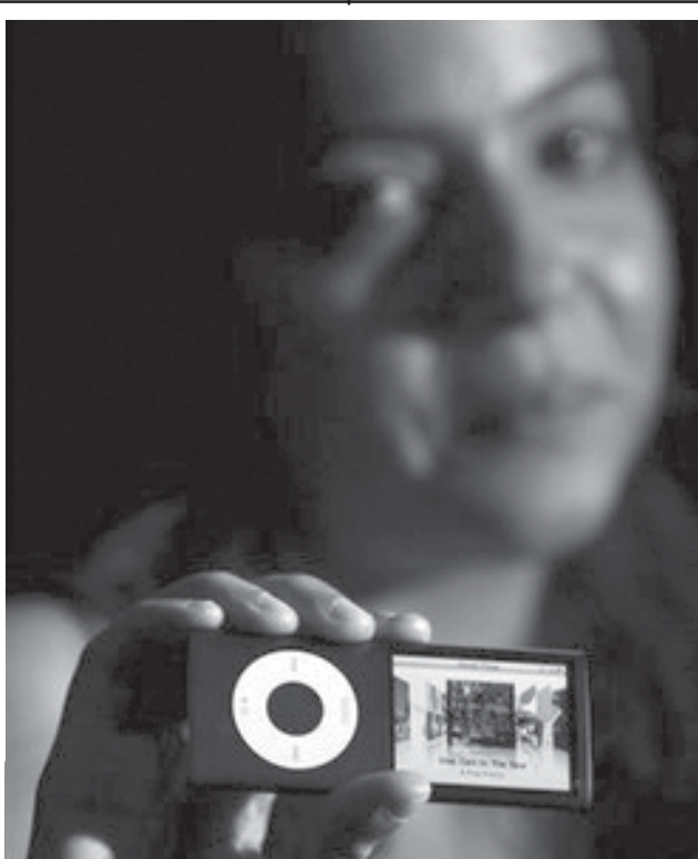
A model displays the newly launched Apple iPod nano in Mumbai, India, on 15 Sept, 2008. The iPod nano, the thinnest version yet, will be priced at Rs 9700 (US$ 211.93) for the 8GB model and Rs 12,500 (US$ 273.11) for the 16GB one.

The dollar tumbled in Asian and European trading before climbing back. Investors took the greenback as a safe-haven currency against the euro and the pound on concerns over shock wave of the meltdown in US finance systems. Low yielding currencies, the yen and the Swiss franc, rose against the dollar on risk aversion. —Internet