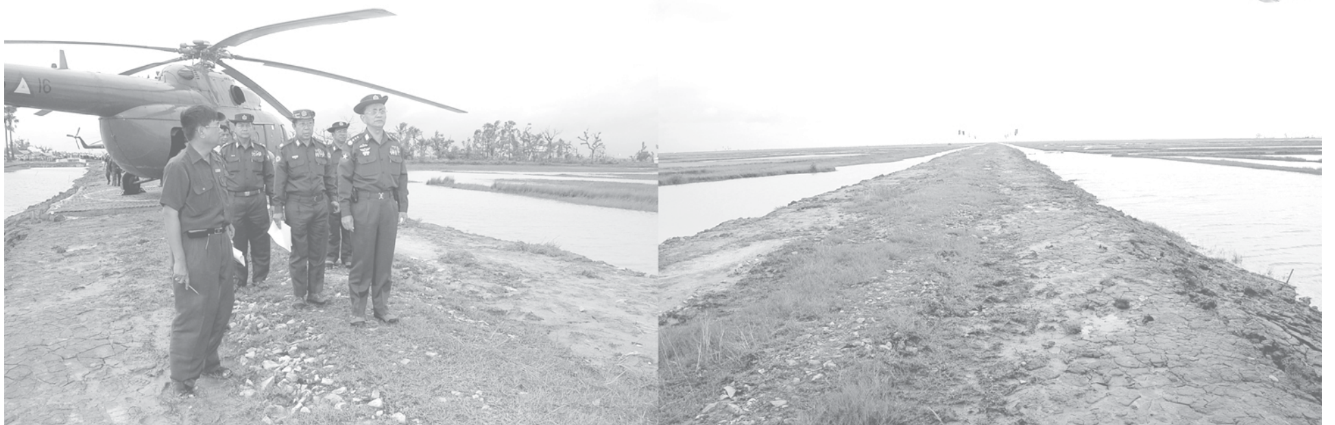
Prime Minister General Thein Sein inspects construction of Labutta-Thingangyi road section on Labutta-Thingangyi-Pyinsalu road. — MNA