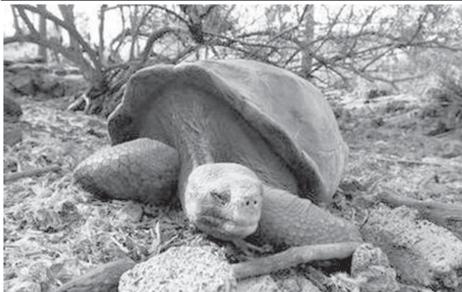
A giant tortoise is seen at its shelter at Galapagos National Park in Santa Cruz on 15 Sept, 2008.