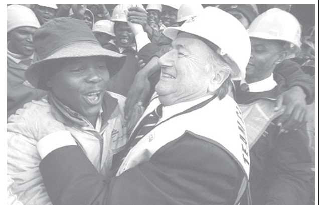
FIFA President Joseph Blatter(R), seen here mingling with construction workers at the Greenpoint WC2010 football stadium in Cape Town.