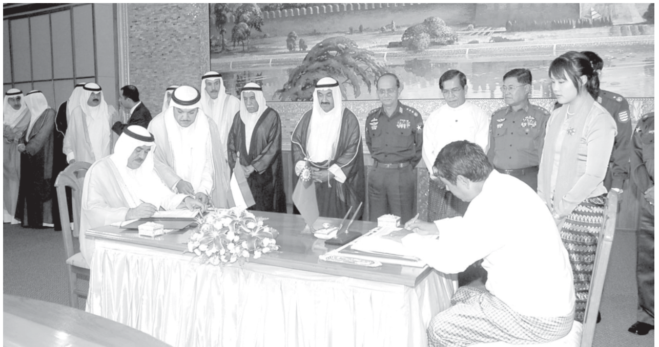
Minister for National Planning and Economic Development U Soe Tha and Kuwaiti Minister of Finance Mr Mustafa Jassim Al-Shamali sign notes of agreements. — MNA

U Soe Tha, Minister for Commerce Brig-Gen Tin Naing Thein, Minister for Foreign Affairs U Nyan Win, Minister for Livestock and Fisheries Brig-Gen Maung Maung Thein, Minister for Energy Brig-Gen Lun Thi, Deputy Minister for Hotels and Tourism Brig-Gen Aye Myint Kyu, Deputy Minister for Foreign Affairs U Maung Myint, Director-General Col Kyaw Kyaw Win of the SPDC Office, Director-General Col Thant Shin of the Government Office, Director-General U Kyaw Kyaw of the Protocol Department of MOFA, high-ranking