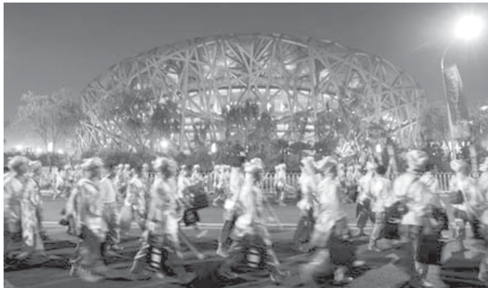
Actors of the opening ceremony walk outside the National Stadium, nicknamed the Bird's Nest, in Beijing, China, on 5 Aug, 2008. A dress rehearsal of the opening ceremony of Beijing 2008 Olympic Games was held on 6 Aug, 2008.