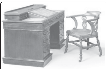
The desk where Charles Dickens wrote "Great Expectations" is seen in a handout photo from Christie's auction house in London. The desk where Dickens wrote "Great Expectations" and his final correspondence hours before his death fetched 433,250 pounds (850,000 US dollars) at auction on 4 June, 2008, around seven times its pre-sale estimate.