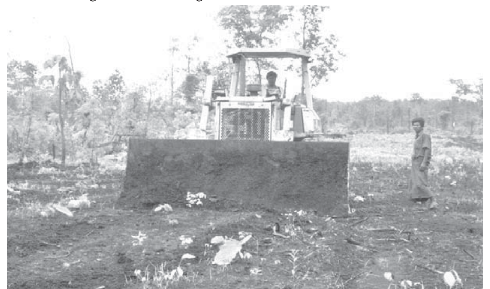
Workers carrying out land preparations by heavy machinery.