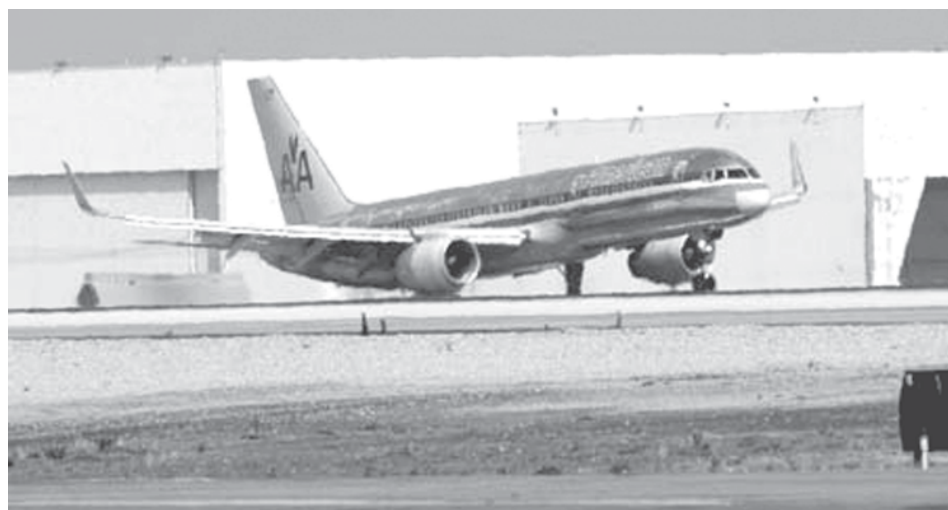
American Airlines Flight 81 made an emergency landing at the Los Angeles International Airport (LAX) on 5 Aug, after the pilot reported smoke in the aircraft. —XINHUA

The jetliner was bound for Honolulu but turned back for LAX after the pilot reported smoke in the aircraft, said Ian Gregor of the Federal Aviation Administration.—Xinhua