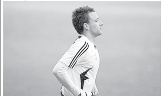
John Terry, pictured in April 2008, believes Chelsea are primed to overtake Manchester United and reclaim the Premier League title.

"The Premier League is the one we want and when the Champions League starts again, it's going to be exciting."— Internet