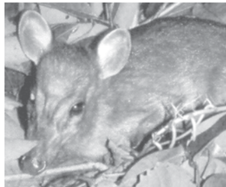
The animal is the world's smallest deer species. It is found in dense forest habitats at an elevation of 1500-2000 feet, where it's solitary and eats mostly fruit.