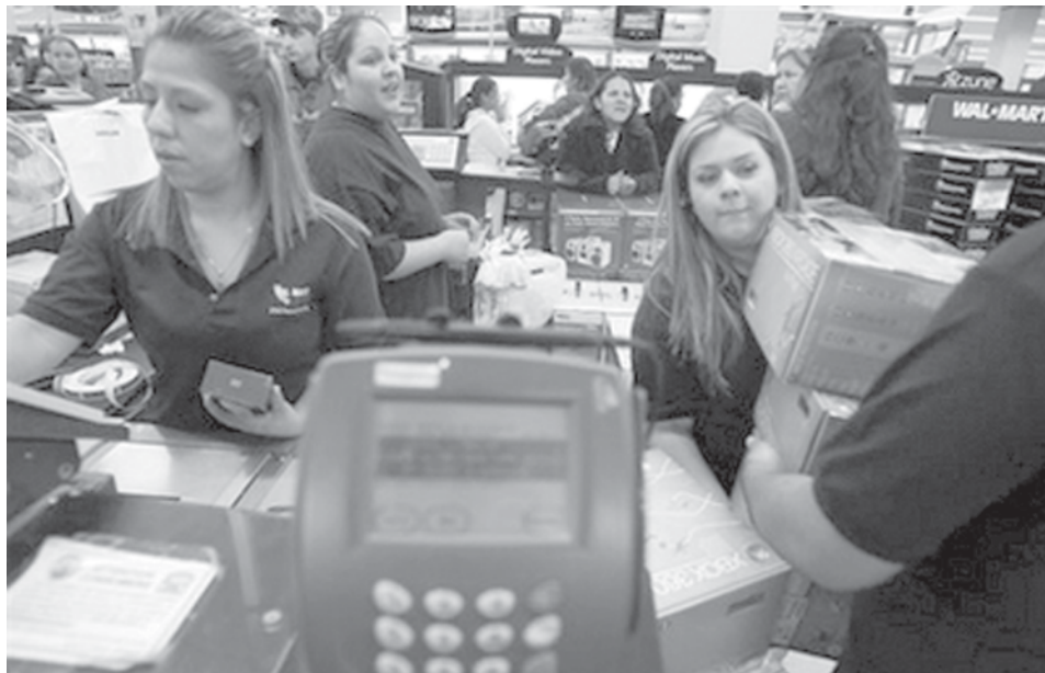
US shoppers. Eleven people have been indicted in Boston for stealing and selling some 40 million credit and debit card numbers they obtained by hacking into the computers of nine major US retailers, the US Justice Department said.

The eleven defendants include three US citizens, three from Ukraine, two from China, one from Belarus, one from Estonia and one whose place of origin is unknown, the department said in a statement.