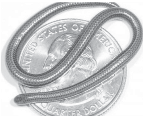
The snake named Leptotyphlops carlae , as thin as a spaghetti noodle, rests on a US quarter in this undated handout image. Scientists have identified the world's smallest snake—a reptile about 4 inches (10 cm) long and as thin as spaghetti that was found lurking under a rock on the Caribbean island of Barbados.