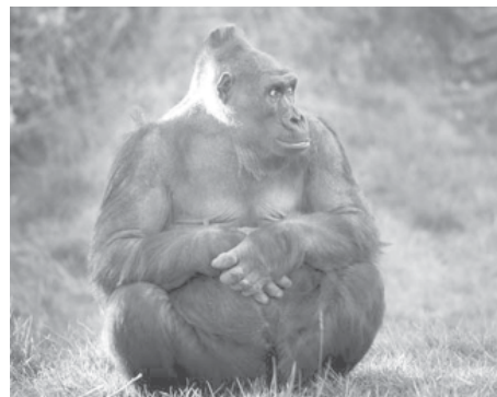
A gorilla sits in its enclosure at London Zoo in this 16 Feb, 2008 file photo. Almost half the world's monkeys and apes are facing a worsening threat of extinction because of deforestation and hunting for meat, an international report showed on 5 Aug, 2008.