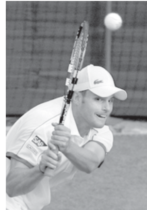
Andy Roddick.

"I don't care about the Olympics," said the 28-year-old who attended both Sydney and Athens, winning just one match on aggregate. "It doesn't make sense to fly 15 hours over and 15 hours back for one event."— Internet