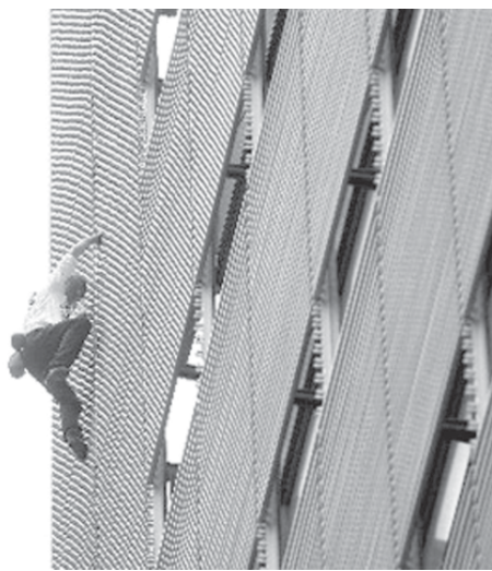
French climber Alain Robert, also known as "Spiderman," climbs outside The New York Times building to raise awareness of global warming.