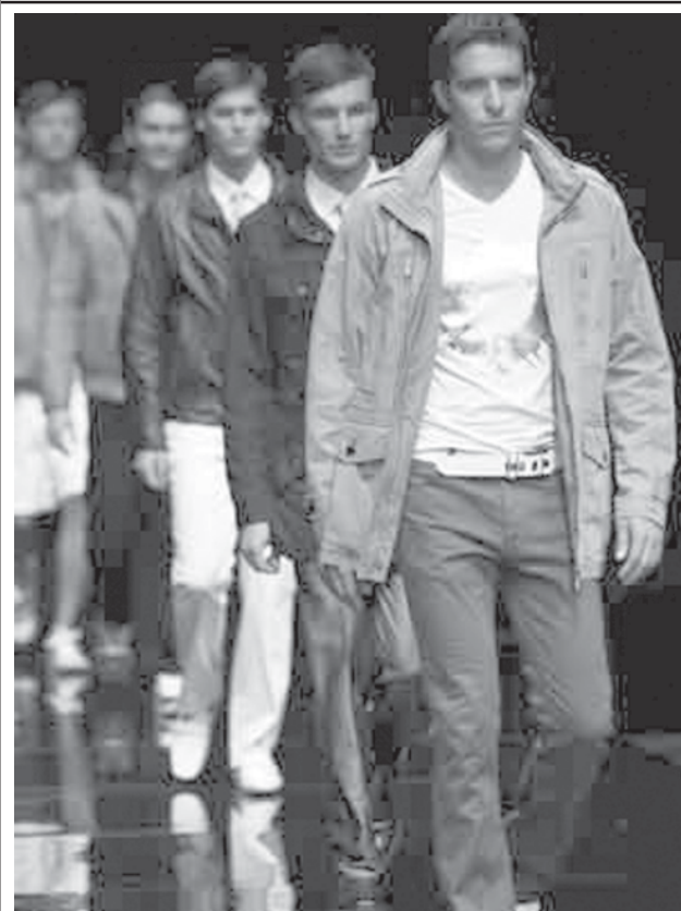
Models present creations during a fashion show showcasing Chinese fashion creations for exportation, in Beijing, China, on 5 Aug, 2008.

The Interior Ministry said police had seized six machine guns, 25 assault rifles and a number of smaller firearms on Monday night from a house rented by US officials. The firearms and ammunition were illegally possessed, it said.—MNA/Reuters