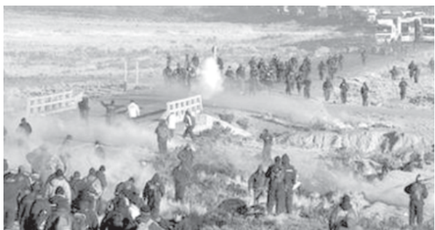
Workers of the Huanuni mine clash with riot police in Caihuasi near Oruro on 5 August, 2008.

TARIJA (Bolivia), 6 Aug—The leaders of Venezuela and Argentina cancelled a trip to Bolivia on Tuesday after two people were killed and many were injured during protests across the country