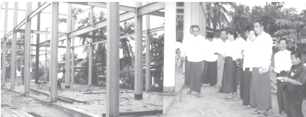
Mayor Brig-Gen Aung Thein Lin inspects construction of No. 7 BEPS in Yangonthis Ward, Thingangyun Township.

YANGON, 6 Aug — CEC member of the Union Solidarity and Development Association (Yangon Division In-charge) Chairman of Yangon City Development Committee Mayor Brig-Gen Aung