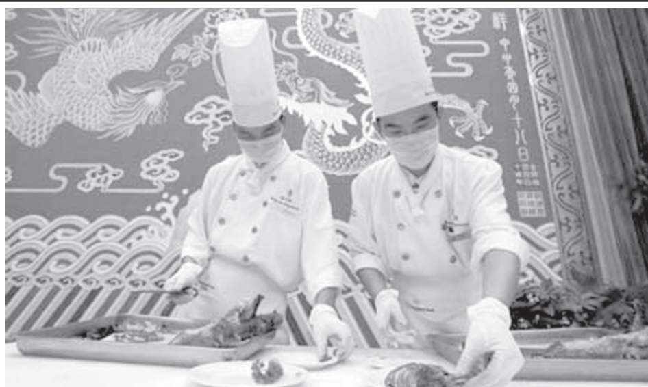
Roast duck is prepared at Quanjude restaurant in Beijing on 4 August, 2008.