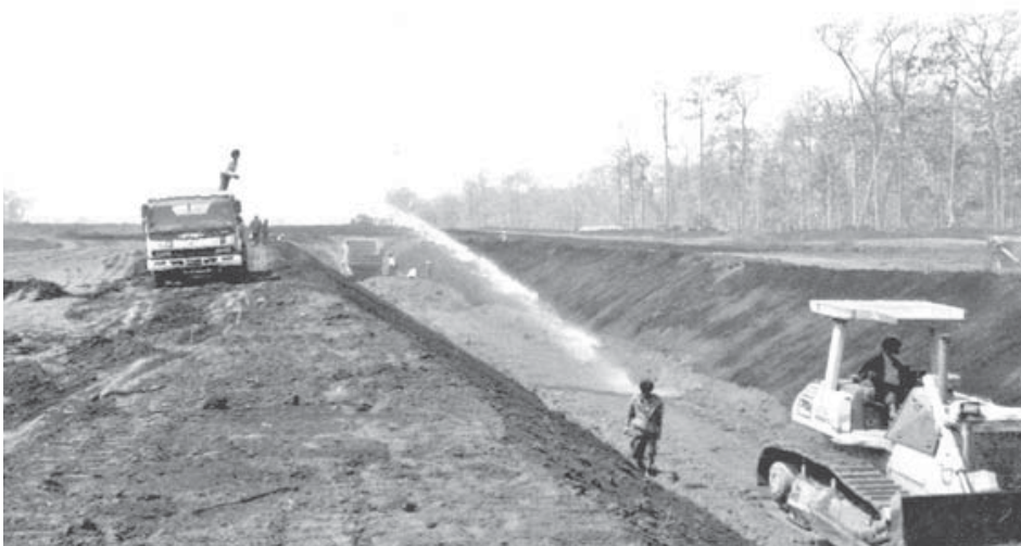
Earth work of the embankment and lower structure of Kengkham Dam is under construction with the use of heavy machinery.

matters related to the dam. Accompanied by Staff Officer U Tin Aung Myat (Embankment), I proceeded to the construction site of Kengkham Multi-purpose Dam Project. We left Bahtoo and arrived at the 18 th mile post. During the trip, we went across Zawgyi Creek. After that, we went along Kengkham Road to the construction site of the dam. Actually, the construction site is 42 miles from Yaksawk.