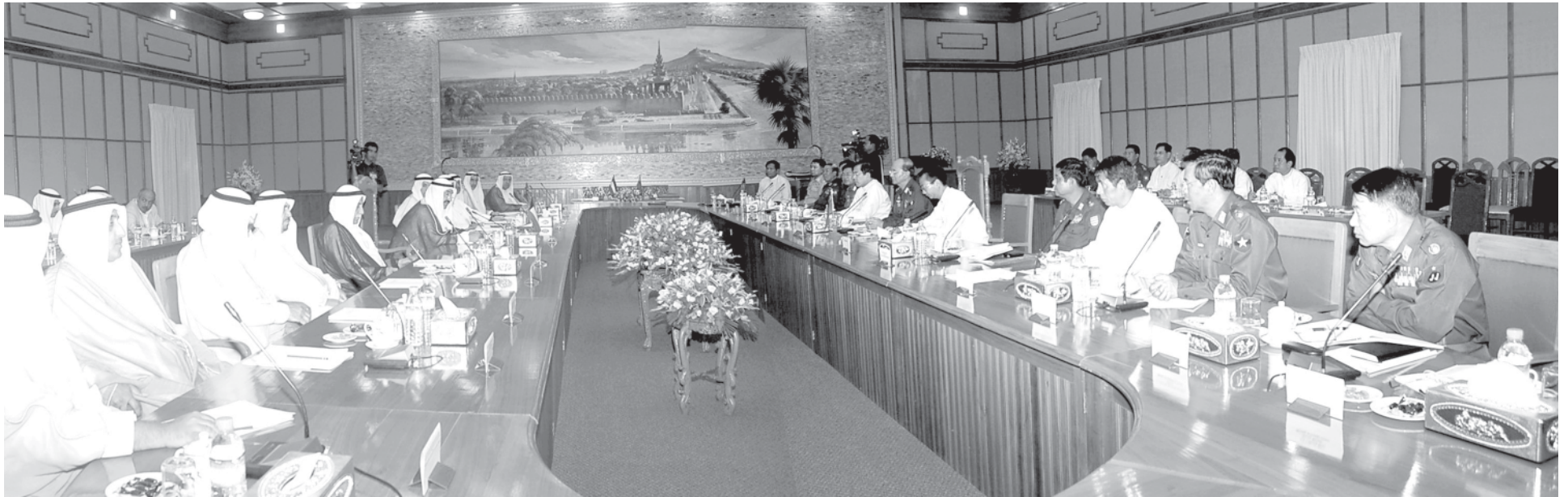
Prime Minister General Thein Sein and Prime Minister of Kuwait Sheikh Nasser Al-Mohammed Al-Ahmed Al-Jaber Al-Sabah holding discussion on matters related to bilateral cooperation at Government Office in Nay Pyi Taw. — MNA

NAY PYI TAW, 6 Aug—Prime Minister General Thein Sein received Prime Minister of Kuwait Sheikh Nasser Al-Mohammed Al-Ahmed Al-Jaber Al-Sabah at the meeting hall of Government Office here at 3.30 pm today. They discussed bilateral cooperation between two countries.