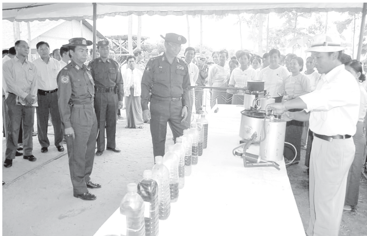
Maj-Gen Ohn Myint inspects physic nut seeds, milling of physic nut seeds and use of physic nut oil stove.