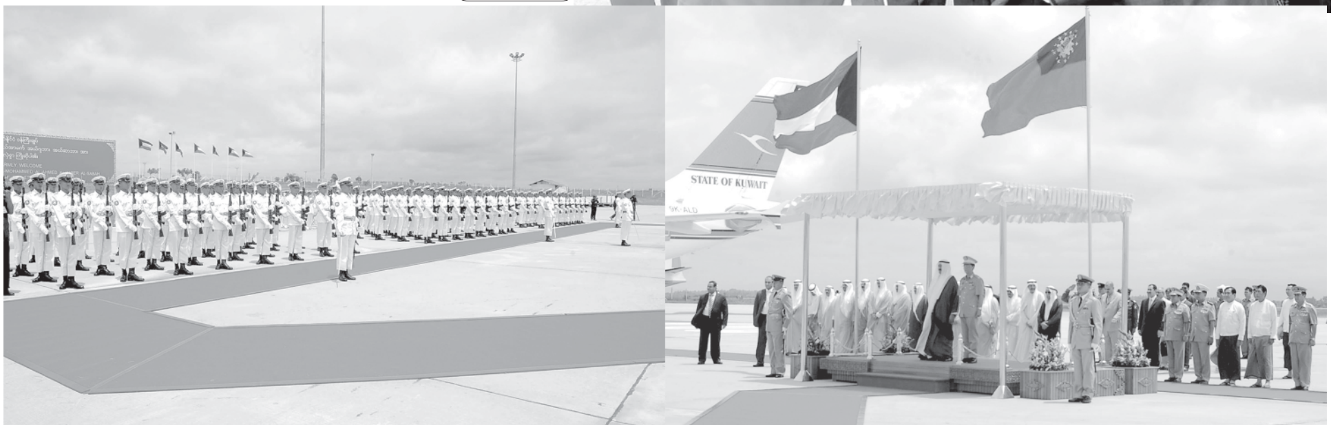
Prime Minister General Thein Sein and Prime Minister of Kuwait Sheikh Nasser Al-Mohammed Al-Ahmed Al-Jaber Al-Sabah take the salute of the Guard of Honour at Nay Pyi Taw Airport.—MNA