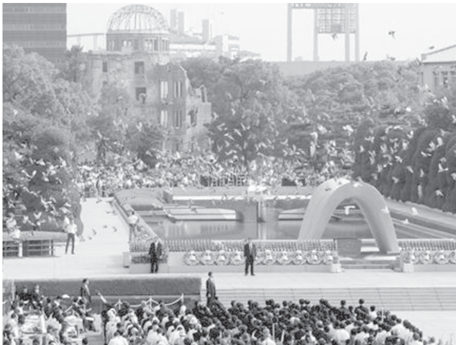
Doves fly over the Peace Memorial Park at a ceremony in Hiroshima on 6 August, 2008, on the 63rd anniversary of the world's first atomic bombing on the city.