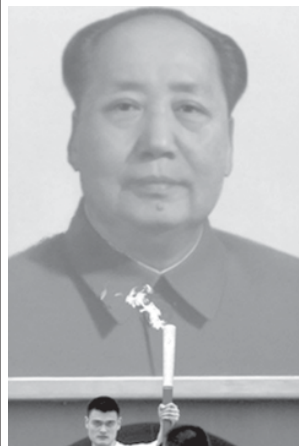
Chinese NBA basketball icon Yao Ming holds the Olympic torch.