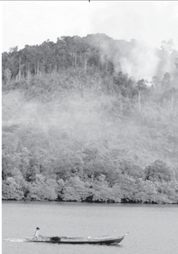
This file photo shows villagers steering their boat passing a forest fire in Galang, on Batam island bordering Singapore. Forest fires from Indonesia caused by traditional farming methods have been blamed for the choking haze, which shrouds the region annually during the dry season.—INTERNET

At 11 am EDT (1500 GMT), the storm was about 40 miles (65 kilometres) west of Port Arthur, Texas, and about 45 miles (70 kilometres) north-northeast of Galveston, the US National Hurricane Centre said.—MNA/Reuters