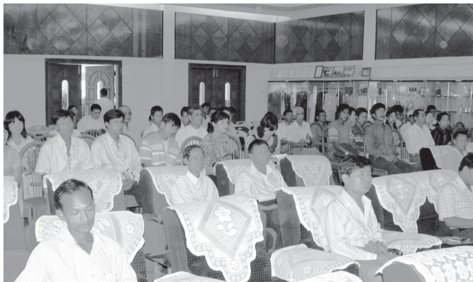
Vice-Admiral Soe Thein meets members of Hlinethaya Industrial Zone Management Committee, Industrial Zone Development Committee and work committee and industrialists.—MNA

provide health care services to storm survivors today.—MNA