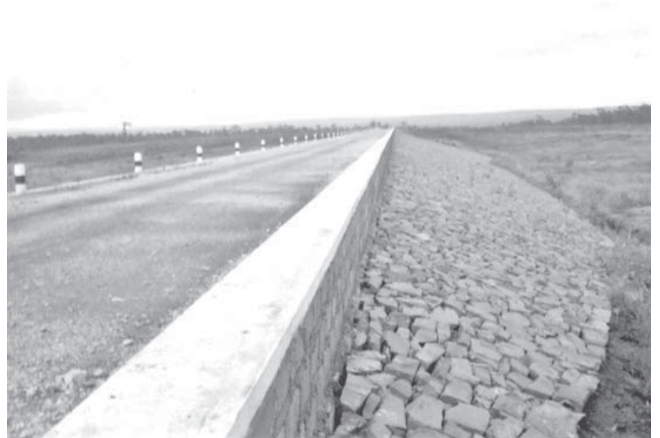
Photo shows progress in construction of earth embankment of Kengkham Dam.

Construction of Kengkham Dam is to green the whole area of Meiktila Plain and cultivate various kinds of crops and to generate electricity for the region. Furthermore, plans are under way to supply water from Kengkham Dam to Zawgyi Dam through Nammelyan Creek. Thanks to construction of Kengkham Dam, Zawgyi dam will be able to increase its generation capacity from 6 to 12 megawatts. In addition, Zawgyi Dam can supply water to Myogyi Dam in Ywangan Township through Zawgyi River. As a result, the two dams will be able to supply 990,000 acre-feet of water to irrigate Meiktila Plain and other crops included in