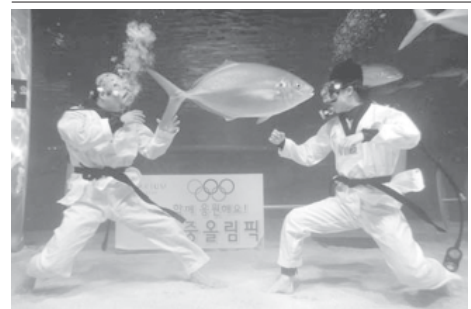
Divers perform Taekwondo in an aquarium during a diving performance related to the 2008 Beijing Olympics at the Coex Aquarium in Seoul on 4 August, 2008. The Korean reads, "Let's cheer together! Water Olympics".