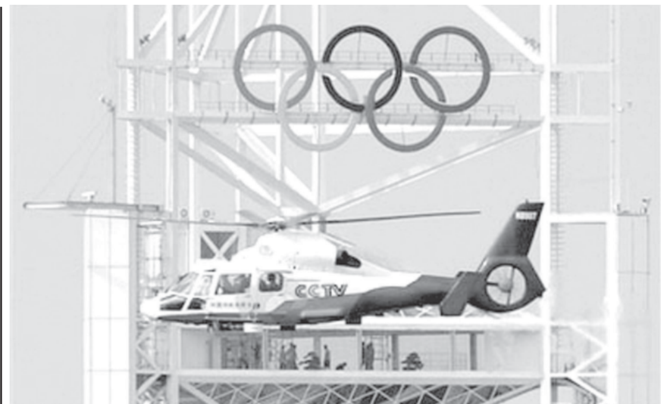
A China Central Television helicopter flies past the Olympic rings on a viewing tower in the Olympic Green in Beijing on 29 July, 2008. The 2008 Beijing Olympic Games open on 8 Aug.

A Qantas spokeswoman told The Canberra Times website that a Melbourne-bound Boeing 737-800 returned to Adelaide