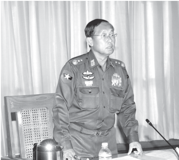
Secretary-1 Lt-Gen Thiha Thura Tin Aung Myint Oo addresses meeting of the Central Supervisory Committee for Ensuring Secure and Smooth Transport in Nay Pyi Taw. — MNA