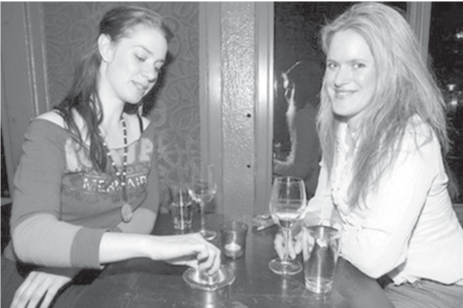
A Swedish smokers stubs out her cigarette in Stockholm. Lung cancer has become the deadliest form of cancer among women in Sweden, overtaking breast cancer, Sweden’s National Board of Health and Welfare said in a report.

BEIJING, 29 July — With only 10 days to go before the Beijing Olympic Games, both Chinese men’s and women’s handball teams walked out of their gym and received a pressure-