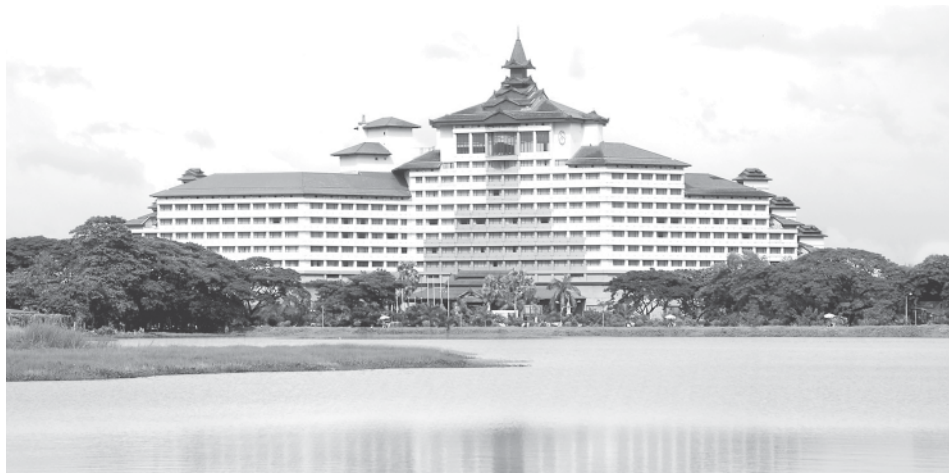
Sedona Hotel (Yangon).

YANGON, 29 July— Sedona Hotels International calls for double celebration. Sedona Hotel Yangon was awarded the prestigious Myanmar's Leading Hotel at the World Travel Awards 2008 while its sister property, Sedona Hotel Mandalay was also nominated for the same