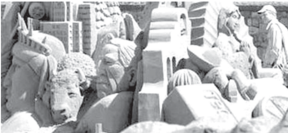
A visitor views sand sculptures on the beach at Weston-Super-Mare in south west England on 28 July, 2008. The Sand Sculpture Festival runs until the end of August with intricate designs ranging from cityscapes to animals to iconic people.