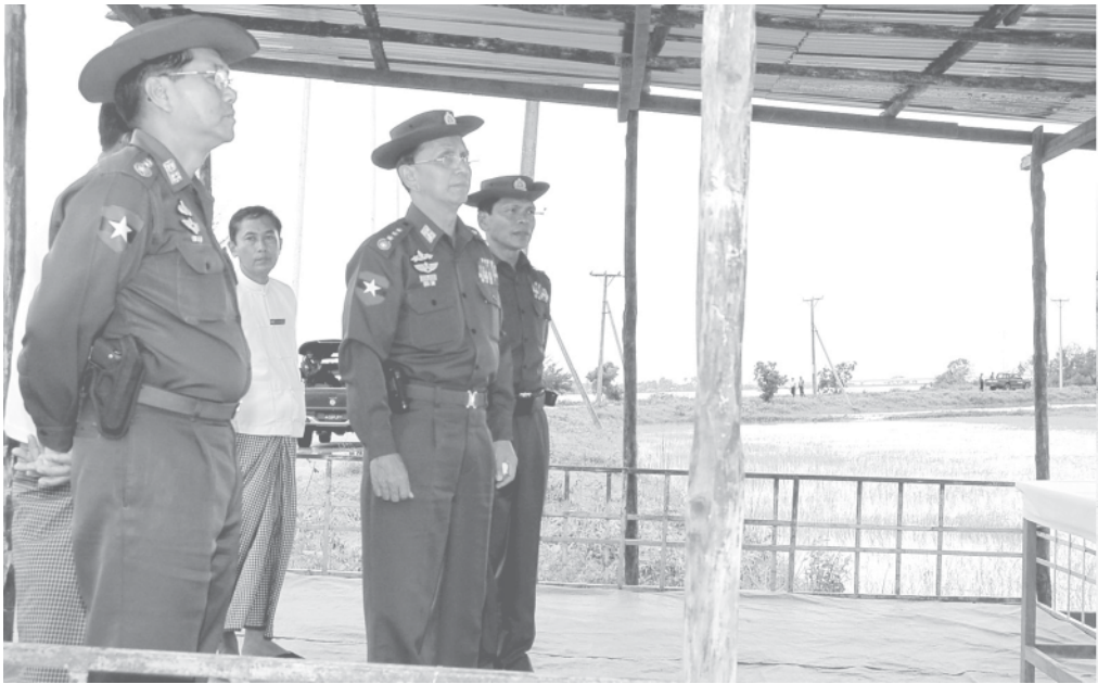
Prime Minister General Thein Sein inspects rain-fed paddy cultivation in Dagon Myothit (Seikkan) Township.

NAY PYI TAW, 29 July— Prime Minister General Thein Sein inspected monsoon paddy cultivation in Yangon Division this afternoon.