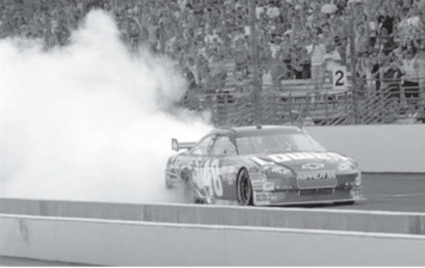
Jimmie Johnson performs a burnout on the main straight after winning the Allstate 400 at the Brickyard auto race at the Indianapolis Motor Speedway in Indianapolis, on 27 July, 2008.

Johnson was indeed OK. Goodyear and NASCAR were not OK, left to explain why the race became a debacle.