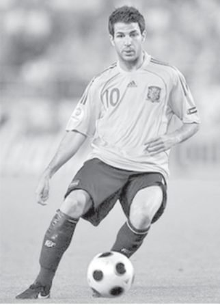
Arsenal midfielder Cesc Fabregas, seen here in June 2008, has slammed a report suggesting he is considering a move to Real Madrid.