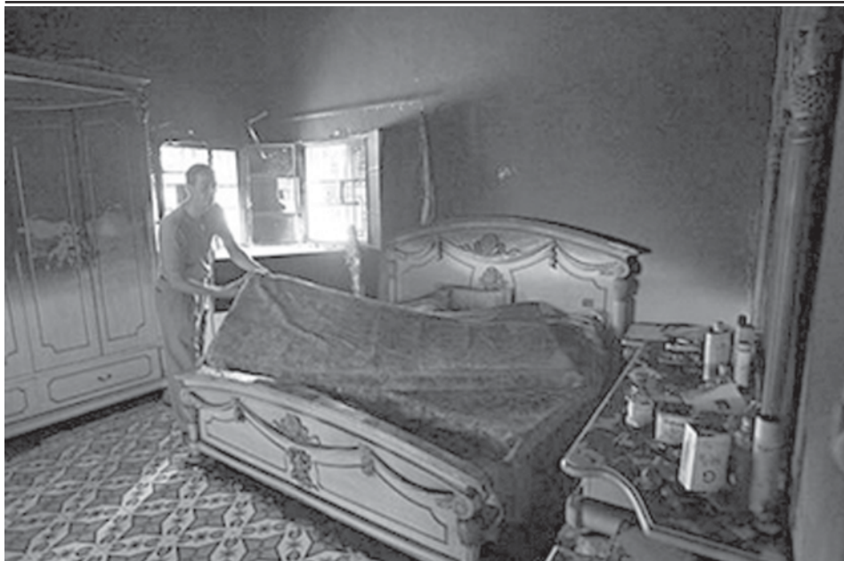
After the attack : A Palestinian man from the West Bank village of Burin inspects the damage in their home after Jewish settlers from the nearby Brakha settlement set it afire.

Glymour said there is accumulating evidence about the number of health problems linked to secondhand smoke.