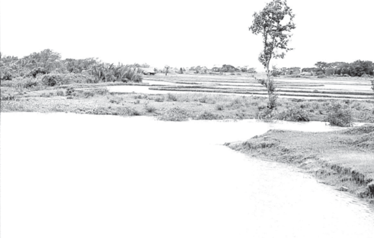
Rain-fed paddy cultivation in Dagon Myothit (East) Township.