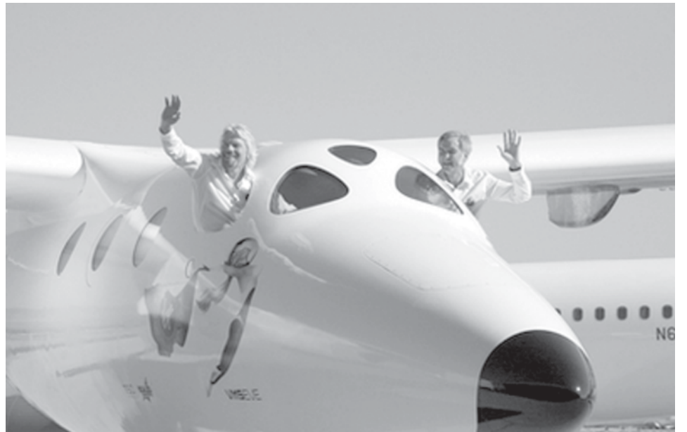
The White Knight Two is unveiled by billionaire Richard Branson, left, in the Mojave Desert. The carrier aircraft is designed to launch passenger-carrying SpaceShipTwo as part of Branson's commercial space programme. Burt Rutan, right, is the owner of Scaled Composites and one of the designers of SpaceShipTwo.

SpaceShipOne accomplished it with help from White Knight Two's smaller predecessor, White Knight. —Internet