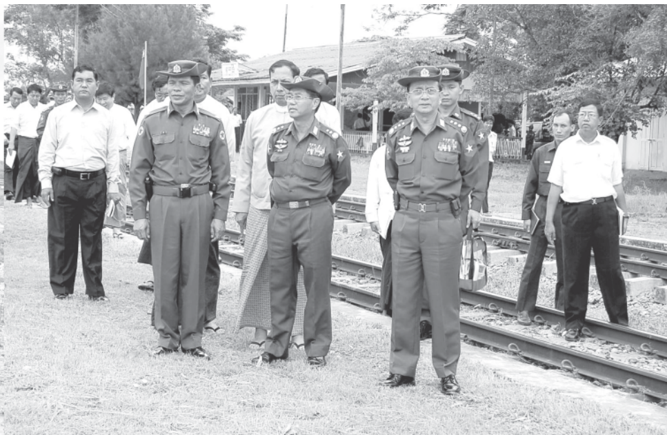
Prime Minister General Thein Sein inspects rain-fed paddy cultivation in Dagon Myothit (East) Township.

NAY PYI TAW, 28 July—Minister for Electric Power No. 2 Maj-Gen Khin Maung Myint together with officials concerned, looked into Meiktila sub-power station (Thapyaewa) on 26 July. Next, the minister proceeded to Mandalay sub-power station (Taguntaing) where he inspected control room and arrangements for generat-