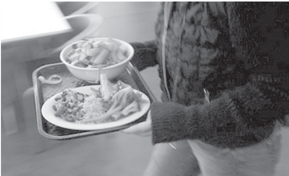
A student at the University of California, Berkeley. The cafeteria tray is being elbowed out of US university canteens as campuses change the way students collect their food and look for savings in tough economic times.

GENEVA, 29 July— Unhappy with the fresh proposal on agriculture at the WTO meeting here, India is looking up to over 100 developing countries for support to ensure that farmers remain protected after a global trade deal is signed for liberalizing the farm and other sectors.