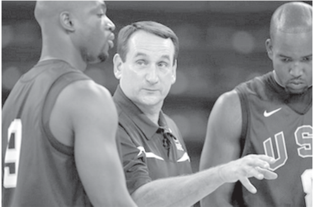
US Olympic basketball team head coach Mike Krzyzewski talks to his teammate during a training session in Macau, on 28 July, 2008. US team will play the friendly match against Turkey and Lithuania in Macau.

“Every time we step onto the court, we know we have the talent and we know we have the strength to go out and be the best team on the court,” James said. “The chemistry right now is really good.”—Internet