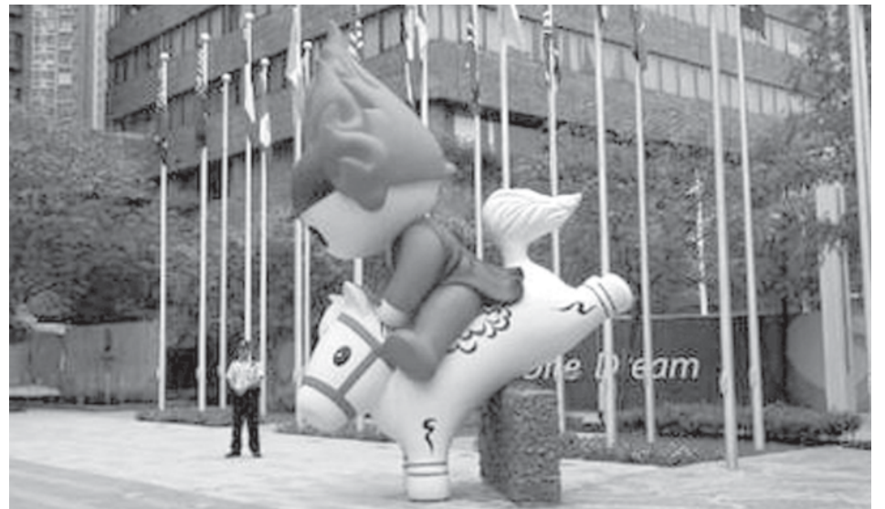
A policeman stands guard beside a decoration at the Hong Kong Olympic Village on 29 July, 2008. Hong Kong police chief said the territory will deploy 4,000 police officers during the Olympic equestrian event to be held in August.

Asked whether any members of the Organization of the Petroleum Exporting Countries (OPEC) should cut production if oil prices continued to fall, he said: “No, I don’t think so. Why should they cut production?” “They always want to make sure there’s good supply and demand and to satisfy the demand,” he said.— Internet