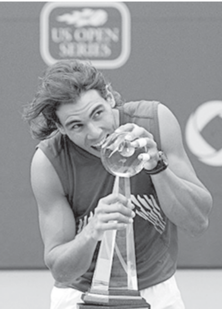
Rafael Nadal of Spain poses with the Rogers Cup trophy after defeating Germany’s Nicolas Kiefer in the final at the Rexall Centre at York University in Toronto. Nadal won 6-3, 6-2.

“This year we are doing a lot of things very well and seeing a lot of very good sportsmen in Spain,” Nadal said.