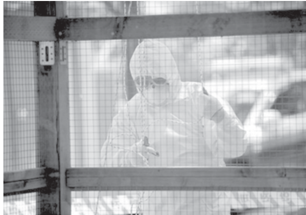
A Seoul quarantine official. A cat found dead in a South Korean city was infected with a virulent strain of bird flu, the first mammal in the country known to have had the H5N1 virus, health officials said.