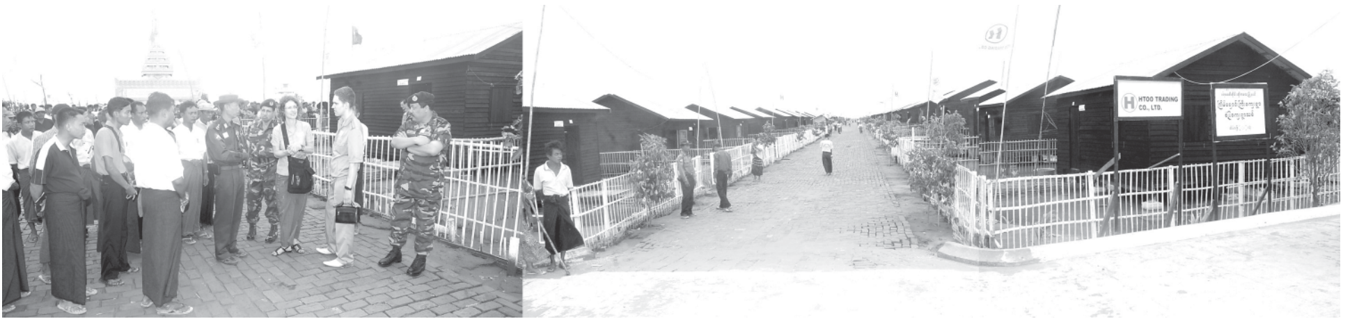
Ambassadors, diplomats, resident representatives of UN agencies and journalists view settlement of storm survivors in houses in Kyeinchaunggyi New Model Village in Bogale Township.