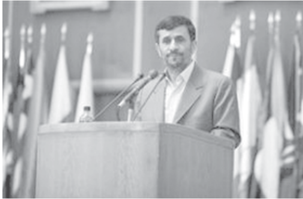
Iran's President Mahmoud Ahmadinejad speaks during the 15th Ministerial Conference of the Non-Aligned Movement in Teheran, on 29 July, 2008.