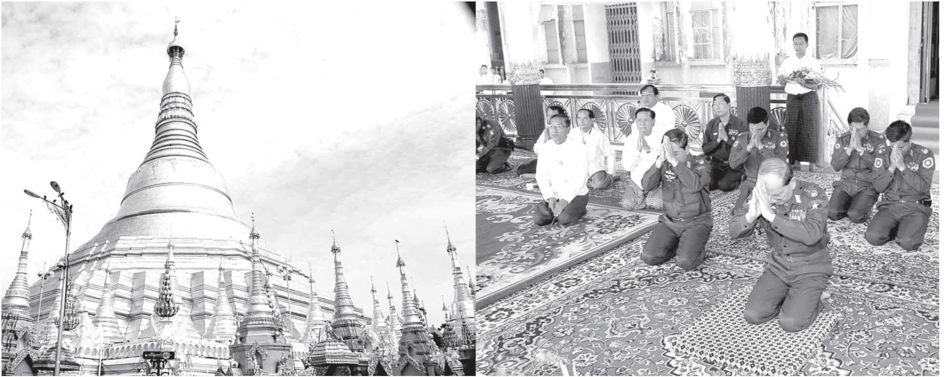
Prime Minister General Thein Sein pays homage to Shwedagon Pagoda.