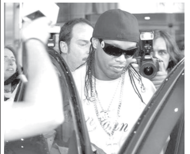
Barcelona has received a US$51m offer for two-time world player of the year Ronaldinho from English Premiership side Manchester City.

"After seven long years of hard work, I brought glory to my country in Athens and then they just threw the medal away," said Sheikh Ahmed, who has come out of retirement in a bid to retain his title at next month's Beijing Olympics. —MNA/Reuters