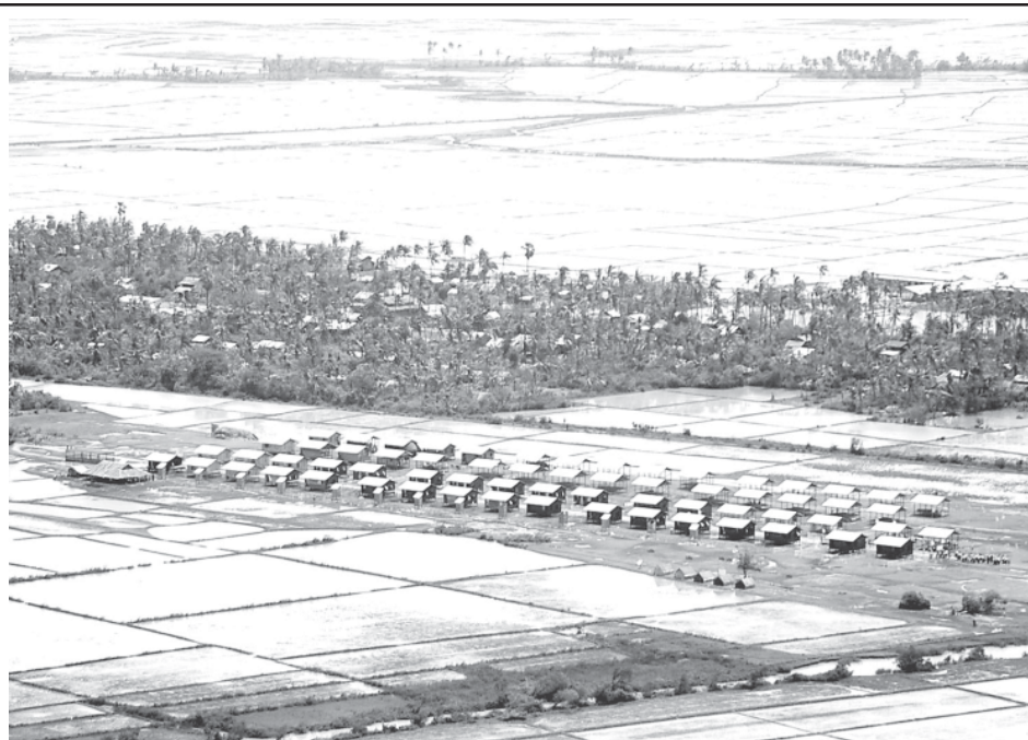
New houses for storm survivors in Toe Village in Dedaye Township.

Up to 14 July, vessels in the township have transported 100 tons of timber to the village.—MNA