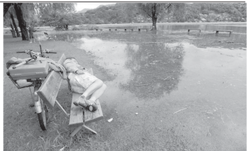
A fisherman rests on a bank at the flooded watersides of the Ceresio lake in Agno, Switzerland, on 13 July, 2008. Heavy rainfalls hit the south of Switzerland and caused obstructions of traffic by floods and landslides.