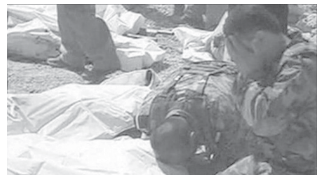
At least 35 people die in a twin suicide bombing north of Baghdad.—INTERNET

Tuesday's attack was the deadliest since 1 May, when twin suicide bombers killed at least 35 people in the nearby town of Balad Ruz.— Internet