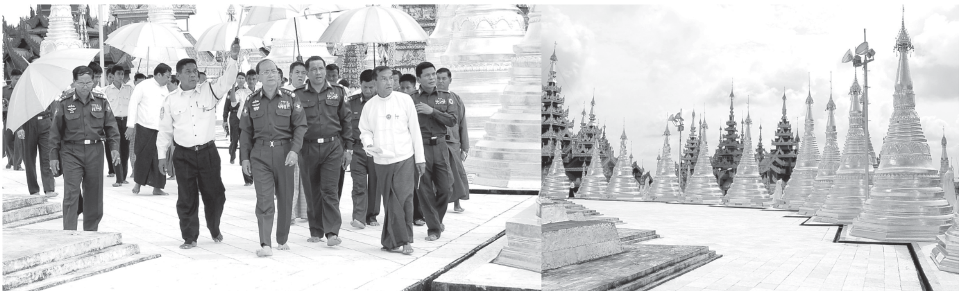
Prime Minister General Thein Sein inspects all-round renovation at Shwedagon Pagoda.

NAY PYI TAW, 15 July—Prime Minister General Thein Sein this morning paid homage to Shwedagon Pagoda and inspected all-round renovation of the pagoda and gave necessary instructions to officials.