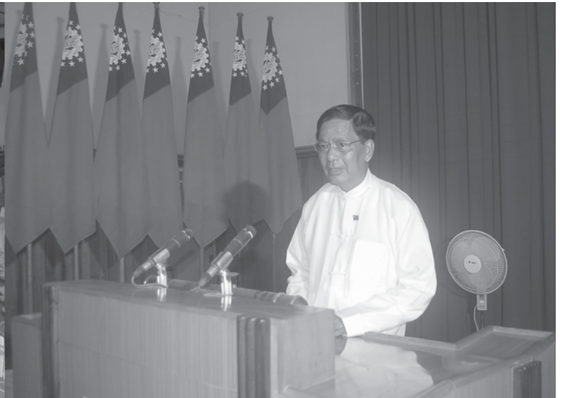
Minister Dr Chan Nyein speaks at the concluding ceremony of special refresher course No. 10 for faculty members.—MNA

and Training Board, departmental heads, local authorities, Rector of CICS (Upper Myanmar) U Aung Hsan Win, the pro-rector, heads of departments, instructors and trainee teachers.