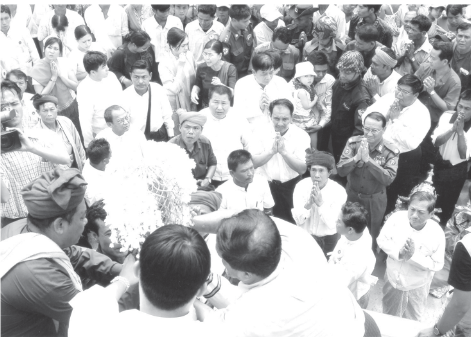
Diamond Bud being conveyed.