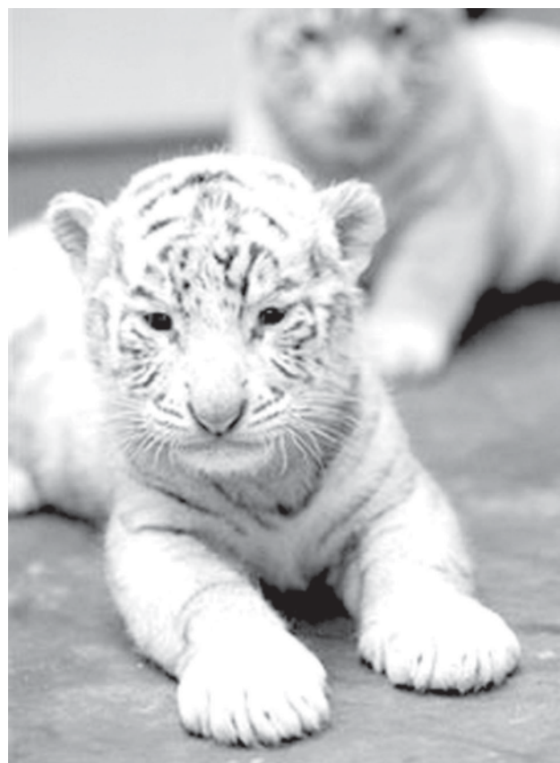
Bengal tiger cubs Jasmine and Jafarh rest following feeding at the Saskatoon Zoo in Saskatoon, Sask., Monday, July 7, 2008. The tigers' mother Rani didn't have milk, so the cubs, just over one month old, are currently cared for by zoo keepers.—INTERNET

On 8 June, a 6.5-magnitude quake struck near the western port city of Patras, about 120 miles west of Athens, damaging hundreds of buildings and injuring more than 200 people. In 1999, a magnitude 5.9 quake near Athens killed 143 people.— Internet