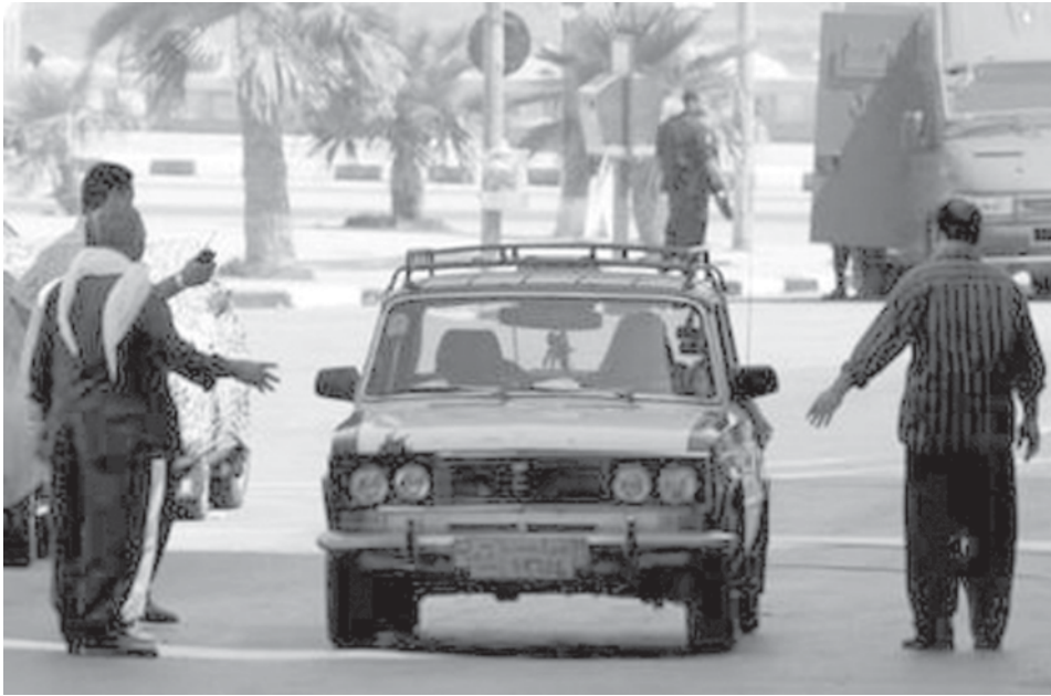
Plainclothes police inspect a car during elections for four vacant parliamentary seats in Alexandria, some 220 km (137 miles) northwest of Cairo, on 13 July, 2008.