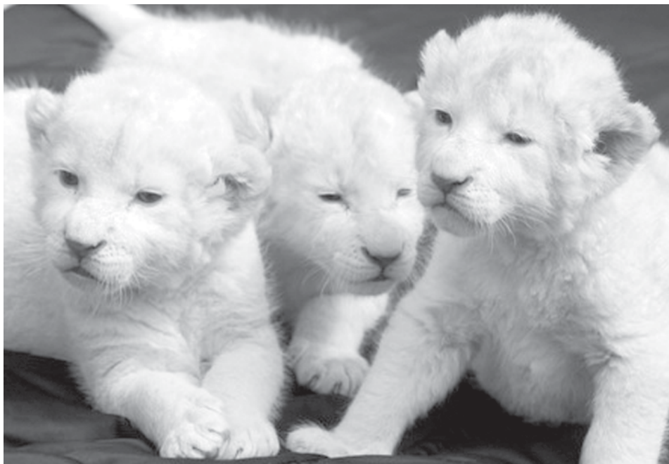
Three white lion cubs play at a wildlife zoo in Schloss-Holte Stukenbrock of Germany on 14 July, 2008.