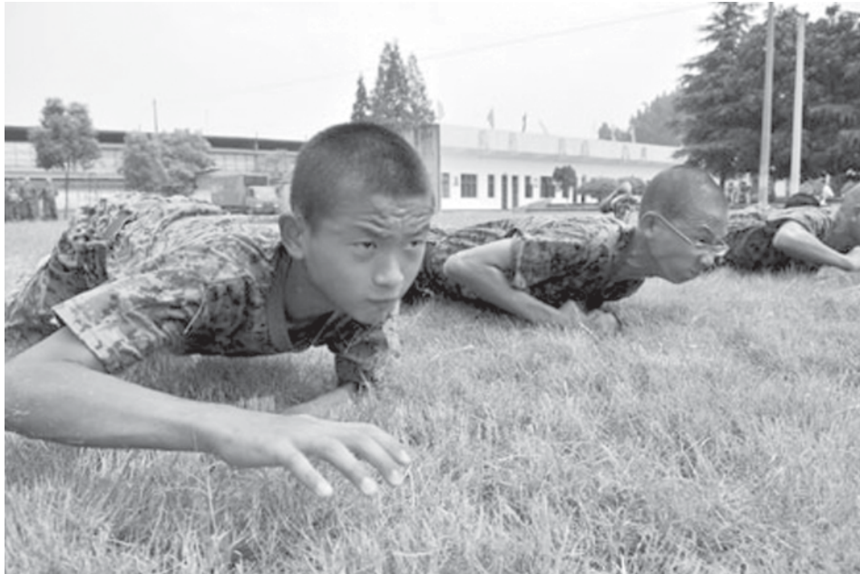
Children receive training in the burning sun at a youth training base in Yichang City, central China's Hubei Province, on 13 July, 2008. Over 50 children from Hainan, Hunan and Hubei provinces took part in a special summer camp to enhance physical strength and develop willpower.