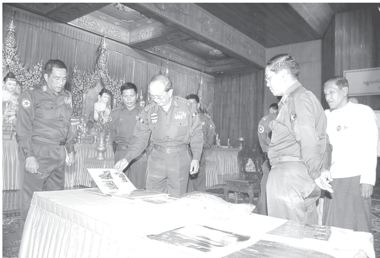
Prime Minister General Thein Sein inspects jewels and gold plates fallen during the storm at Shwedagon Pagoda.