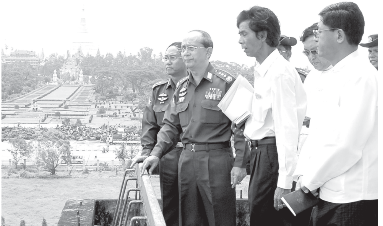
Prime Minister General Thein Sein inspects former Hluttaw building on Pyay Road.