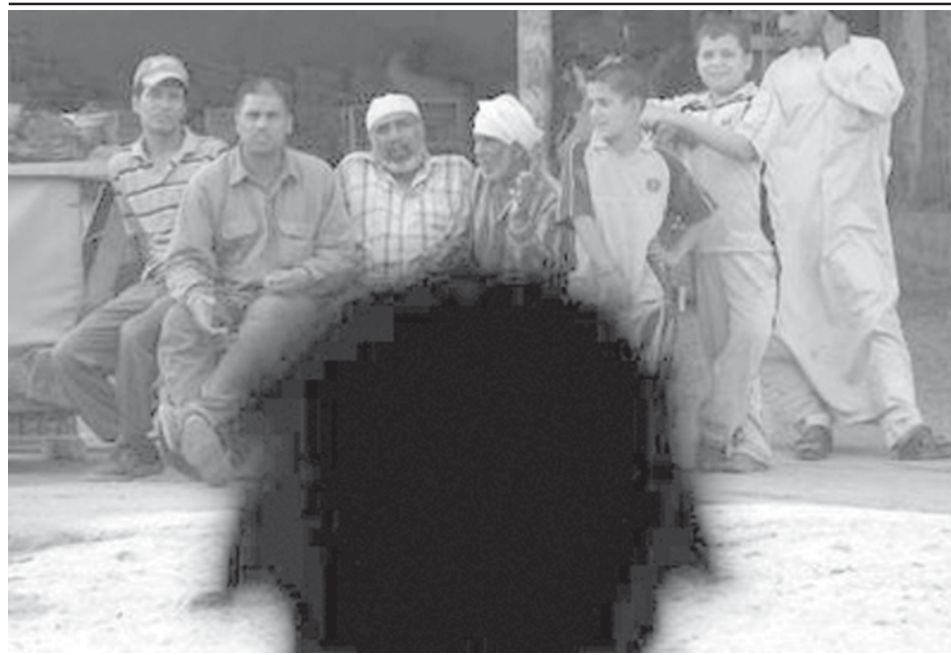
Iraqi men sit in front of warehouse searched by US soldiers of the 2nd Brigade, 1st Armour Division and Iraqi army soldiers in Baghdad's Sadr City on 13 July, 2008.

Delegates from 15 countries held talks with Russian weapon makers during the four-day exhibition of Russian export arms, defence and protective means that ended on Wednesday and involved 463 Russian and foreign companies, organizers said.—Xinhua