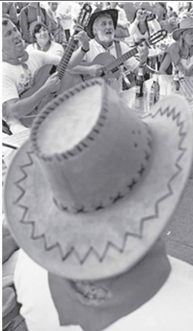
Revelers enjoy as they sing a song during the San Fermin fiestas in Pamplona northern Spain, on 13 July, 2008. The fiestas 'Los San Fermines' held since 1591, attracts tens of thousands of foreign visitors each year for nine days of revelry, morning bull-runs and afternoon bullfights.

The PKK, listed by the United States and Turkey as a terrorist group, took up arms against Turkey in 1984 with the aim of creating an ethnic homeland in the southeast. — Xinhua