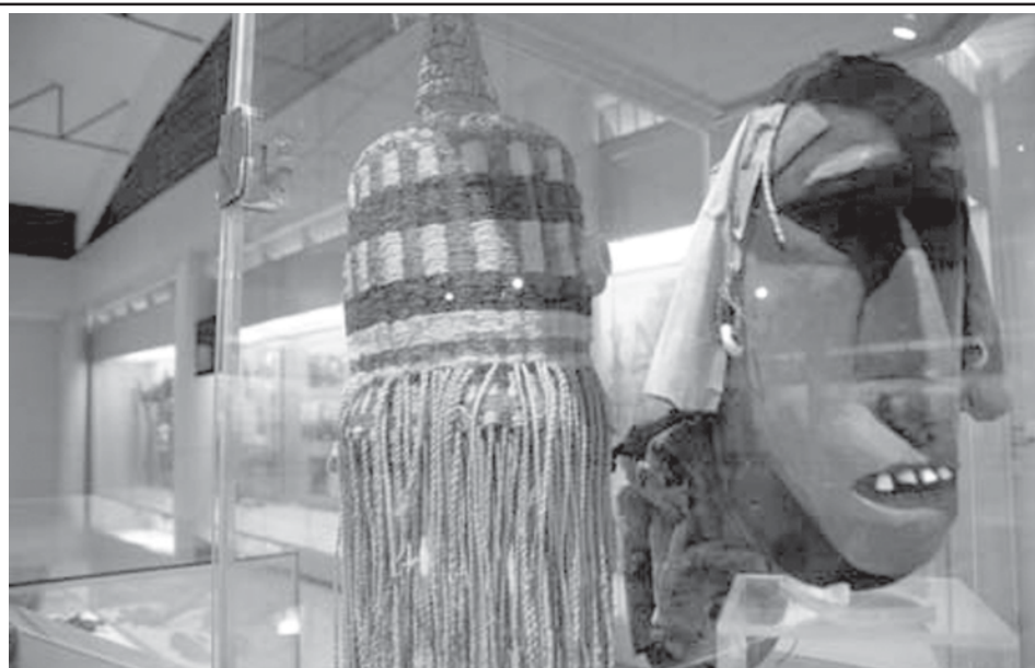
Photo taken on 14 July, 2008 shows the exhibits in the cultural exhibition hall of Nairobi National Museum in Nairobi, capital of Kenya.