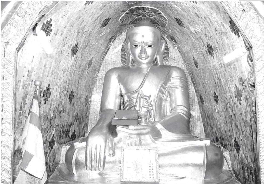
Prime Minister General Thein Sein pays homage to Padamyia Myatshin Buddha Image at Shwedagon Pagoda.