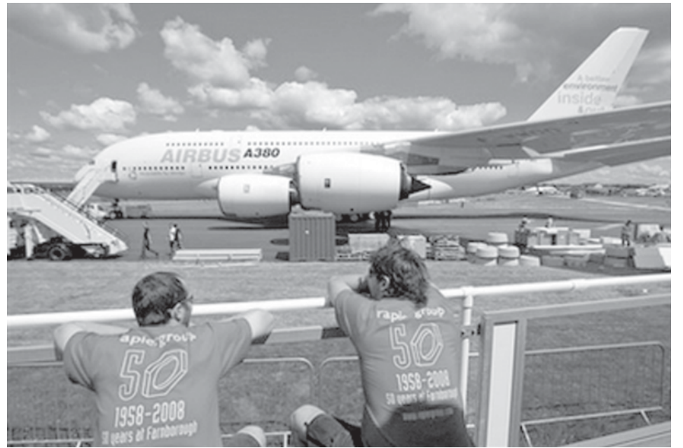
People are seen in front of an Airbus A380 airplane during preparations on the eve of the Farnborough aerospace show, in Farnborough, England, on 13 July, 2008.