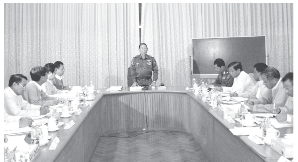
Minister Brig-Gen Lun Thi delivers an address at coordination meeting of MOGE.