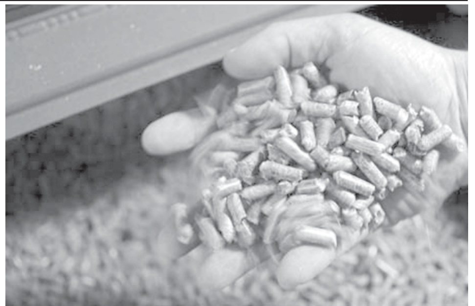
A customer at Black Magic Chimney and Fireplace holds a handful of wood pellets for a stove at the store in Cambridge, Massachusetts on 10 July, 2008. Record prices for home heating oil are rippling across America's northern regions, stoking demand for wood stoves and other alternatives, and forcing some traditional heating oil companies out of business.