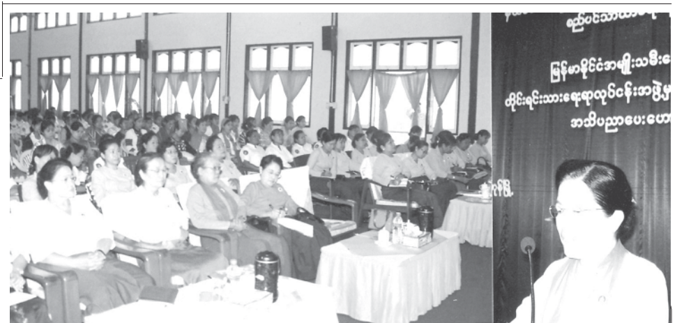
MWAF educative talks in progress.—MNA

After the ceremony, the personnel of MWAF encouraged the trainees learning tailoring and wicker works.—MNA