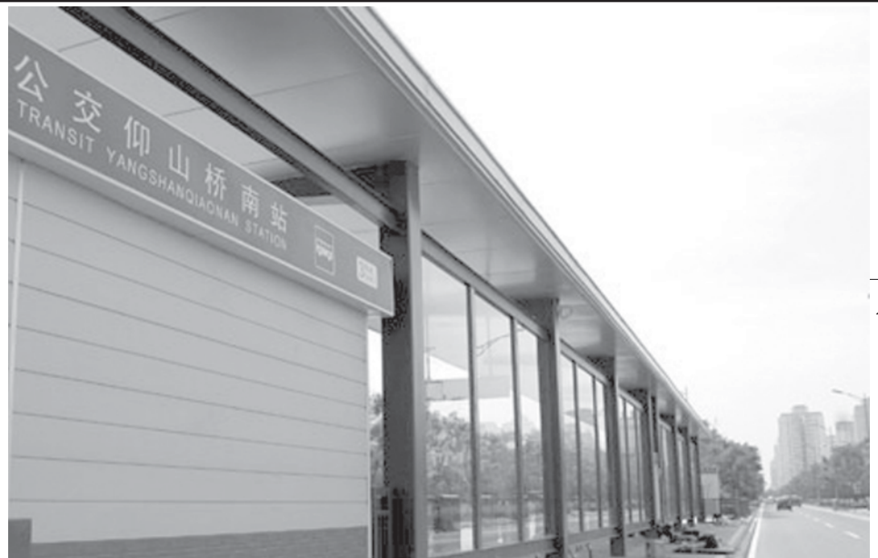
Photo taken on the on 13 July, 2008 shows a new bus station for the Olympic bus line in construction in Beijing, capital of China.