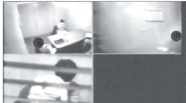
A videotape showing a detainee being questioned at the US prison camp in Guantanamo Bay.—

During the 10-minute video of his questioning in Guantanamo a year later, he can be seen crying, his face buried in his hands, and pulling at his hair. He can be heard repeatedly chanting: "Help me."