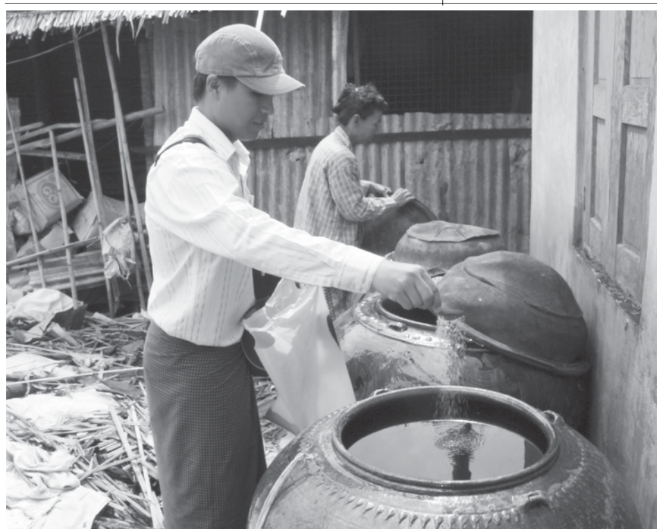
Health staff putting Abate into water pots for prevention of DHF. —HEALTH