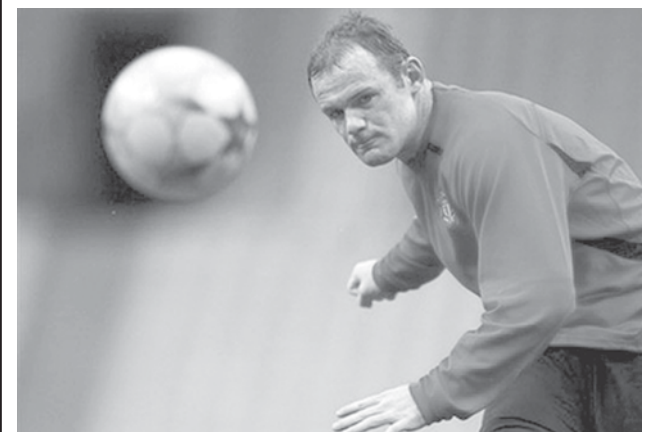
Wayne Rooney, seen here in May 2008, kicked off Manchester United's Premier League preparations by inspiring the newly crowned European champions to a 2-0 victory against Aberdeen at Pittodrie on Saturday.