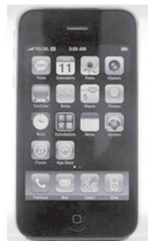
Apple's new 3G iPhone.

Instead, employees were telling buyers to go