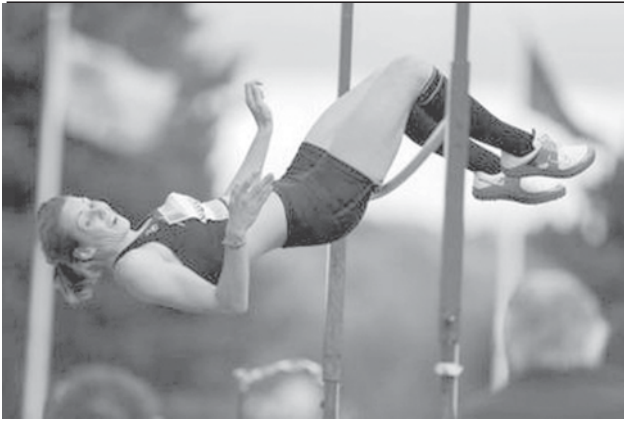
Kelly Sotherton competes in the women's high-jump final at the British Olympic trials in Birmingham, central England, on 12 July, 2008.