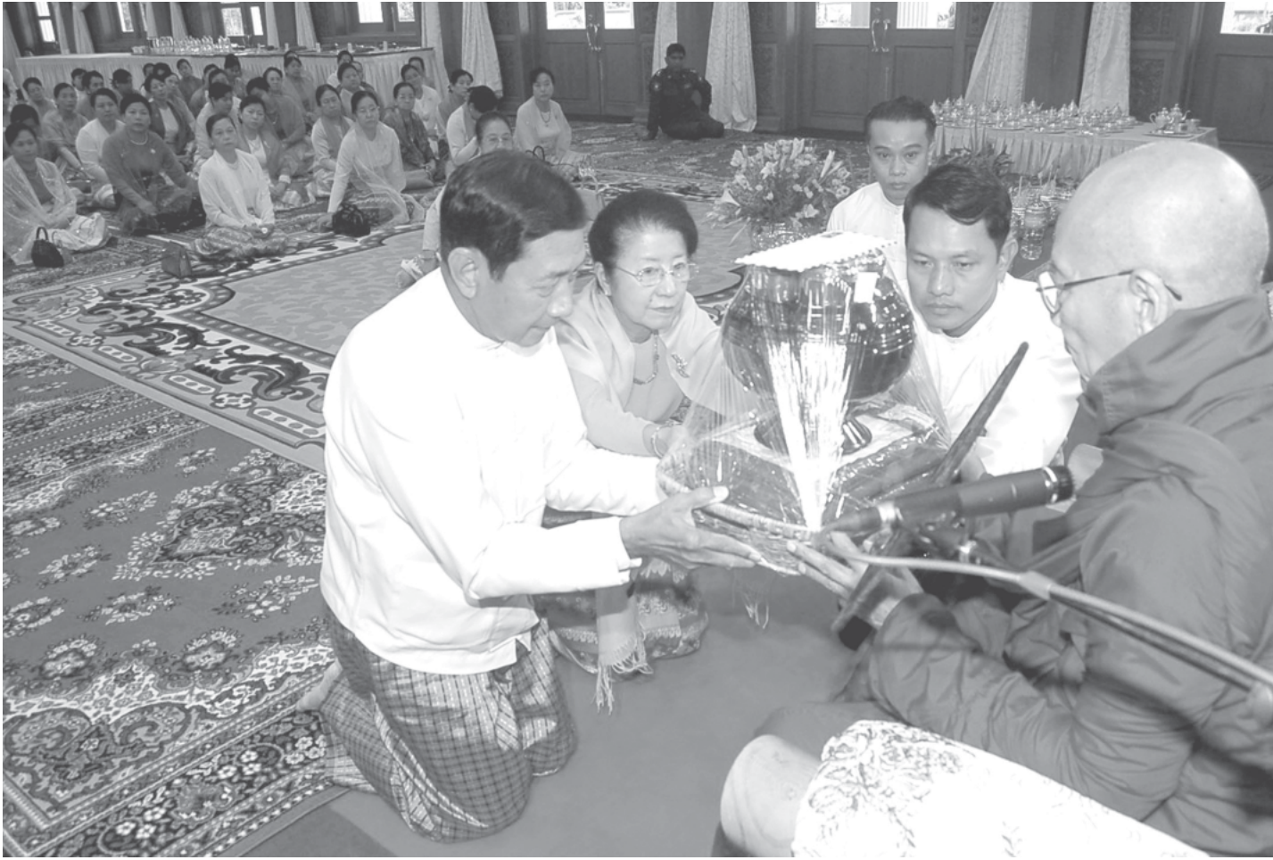
Vice-Senior General Maung Aye and wife Daw Mya Mya San offer Waso robes and provisions to the Vice-Chairman Sayadaw of State Sangha Maha Nayaka Committee.