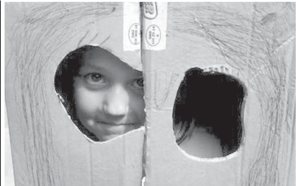
A boy plays with a cardboard box during the San Fermin Festival in Pamplona Spain on 11 July, 2008.