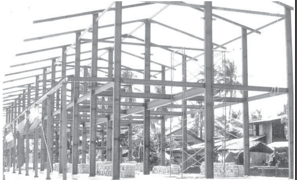
A school building under construction.

the main pillars and beams of the new school building. With regard to the use of H type steel beams, Head of Engineering Department (Building) U Zaw Win said that the construction of