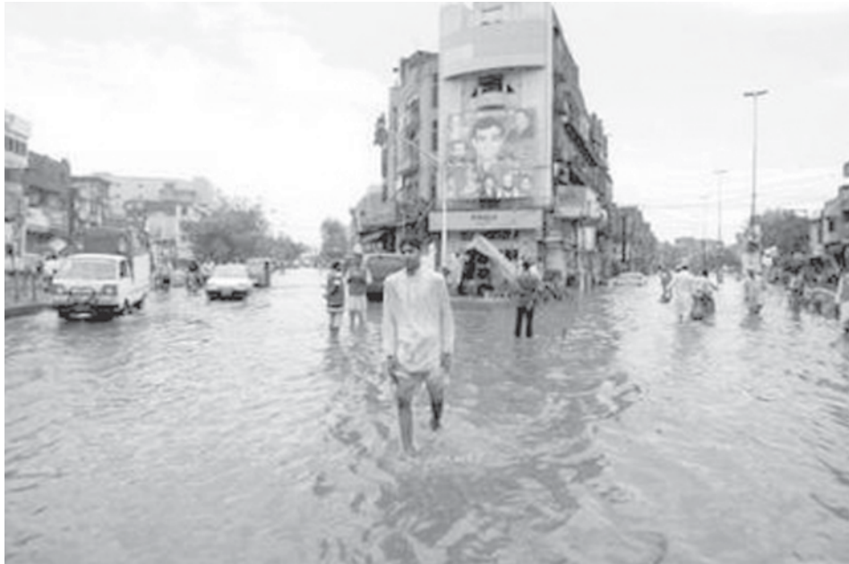
Pakistani men walk through flooded streets during heavy monsoon rain in Lahore on 12 July, 2008. Weather forecasts predict monsoon rains in some parts of the country receiving more than average rainfall.