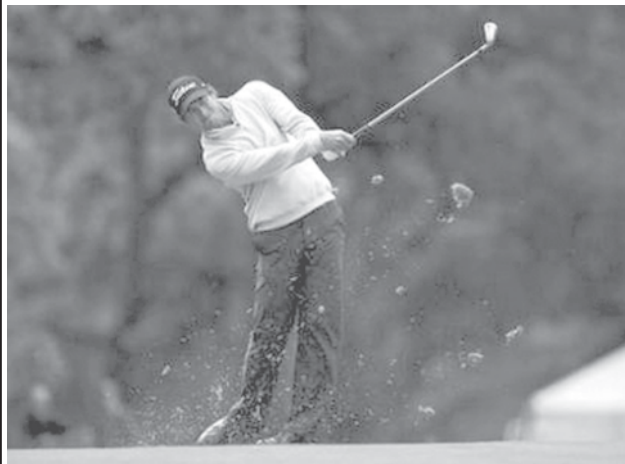
Australia's Adam Scott plays his second shot at the sixteenth hole during the third round of the Scottish Open golf tournament at Loch Lomond near Glasgow, Scotland, on 12 July, 2008.

"I first felt a 'pop' in my wrist on the 15th tee during the final round of the US Open and over the past three weeks I have been meeting with hand specialists to determine the best course of treatment for the injury," said the Ryder Cup player.