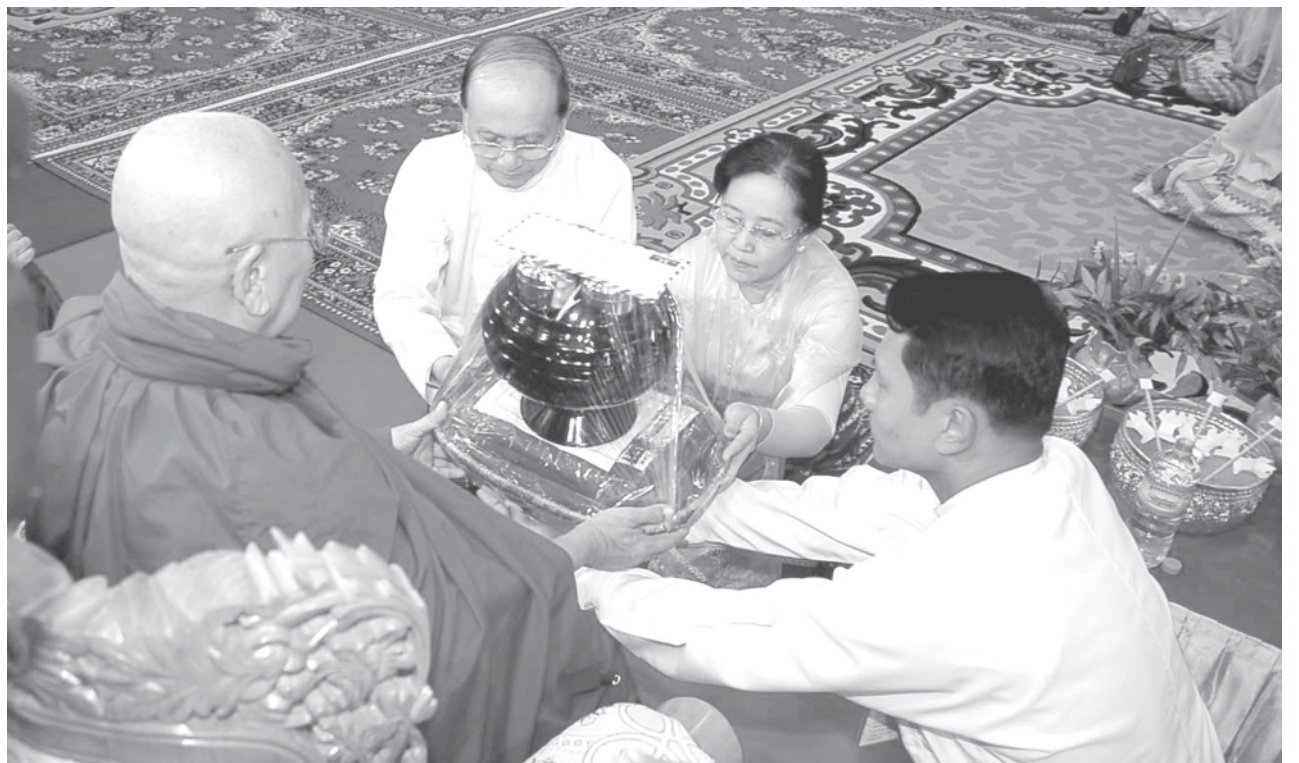
Prime Minister General Thein Sein and wife Daw Khin Khin Win offer Waso robes and provisions to a Sayadaw.