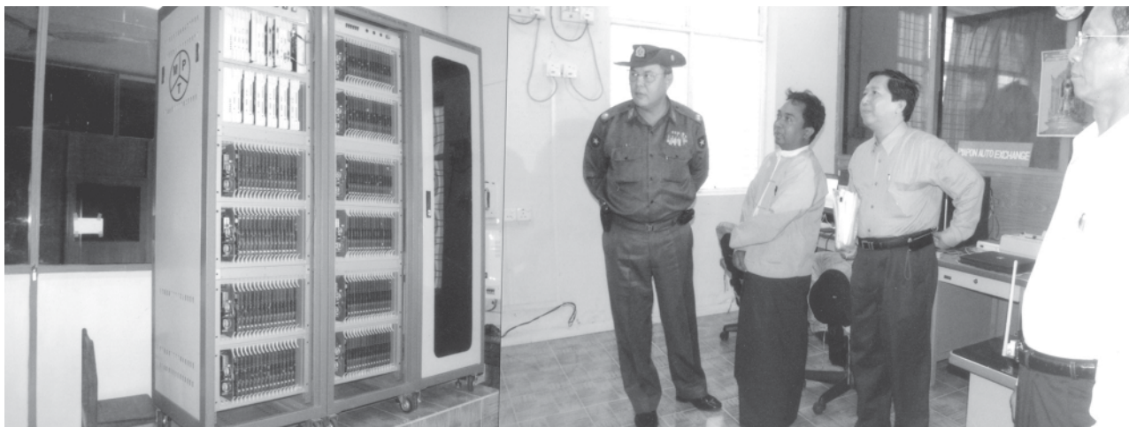
Minister Brig-Gen Thein Zaw inspects International underwater cable station in Pyapon.