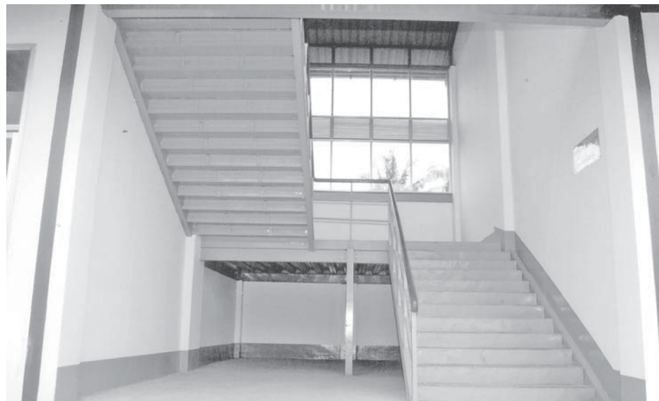
Staircase of school building constructed with steel structures.

the building could save time by using H type steel beams. Moreover, he added that the withstanding of steel structure can be better than that of the reinforced concrete one. In addition, the age of steel structure can be longer than any other types of structure, he said.