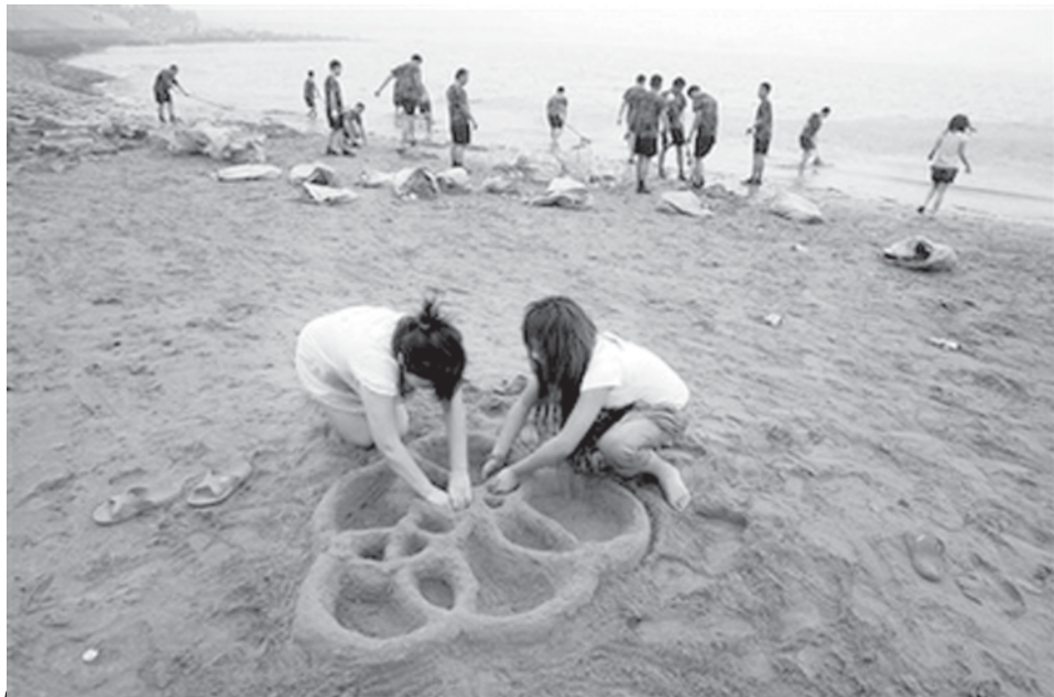
Chinese girls make a sand sculpture depicting the Olympic rings on a beach near soldiers removing blue green algae invading the scenic coastal city of Qingdao, eastern China, recently.