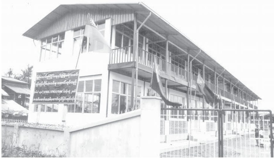
The photo shows a two-storey school building constructed with the use of steel structures.