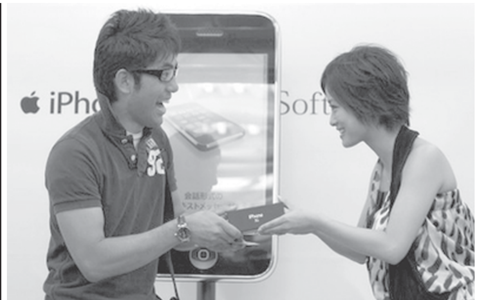
Actress Aya Ueto hands an Apple iPhone to customer Shingo Okubo during a ceremony on the first day of its Japanese launch at SoftBank Mobile’s flagship store on 11 July, 2008 in Tokyo, Japan.