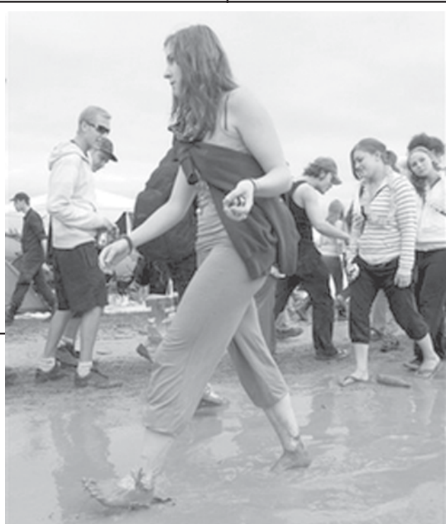
Festivalgoers walk through the mud at the camping site of the Open Air Music Festival in Frauenfeld, Switzerland, on 12 July, 2008.

US Secretary of State Condoleezza Rice, on a visit to US ally Georgia on Thursday, called for a more intensive international effort to resolve a conflict over Georgia's breakaway regions of Abkhazia and South Ossetia. Abkhazia and South Ossetia both broke away from Tbilisi's rule in wars in the 1990s. They have become the focus of escalating tension between Tbilisi and Moscow and some Western diplomats say they fear more violence in the regions.