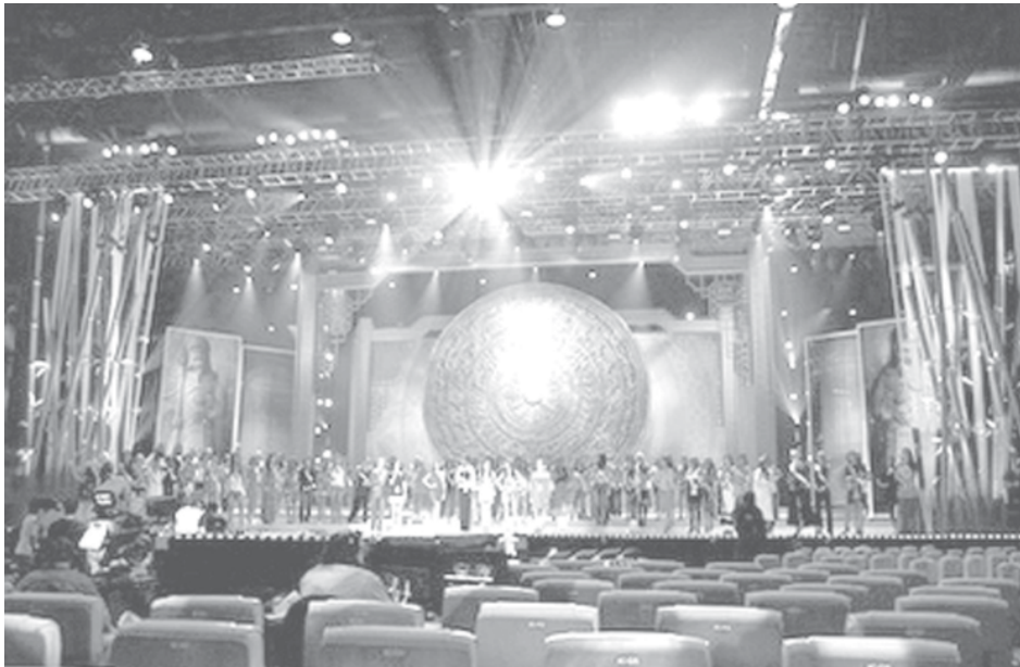
Miss Universe 2008 contestants are seen during a rehearsal in Nha Trang, Vietnam, on 12 July, 2008. The 57th annual Miss Universe competition will take place in Nha Trang, Vietnam at the Crown Convention Center on 14 July, 2008.—INTERNET