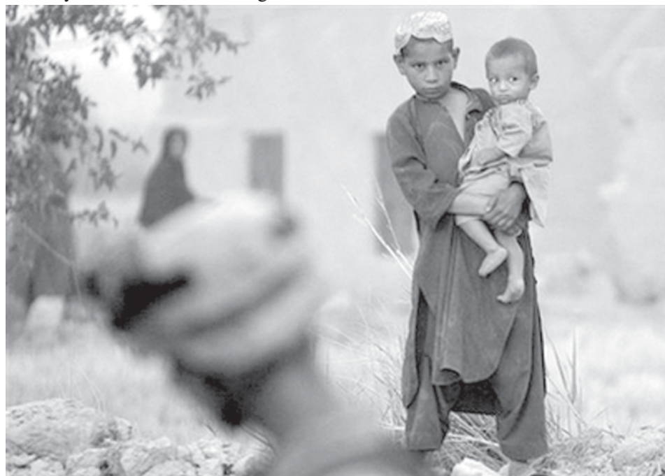
An Afghan boy looks on as a US Marine patrols in the town of Garmser in Helmand Province of Afghanistan, on 12 July, 2008.

There are nearly 53,000 troops from 40 nations serving in NATO's International Security Assistance Force in Afghanistan.—Internet