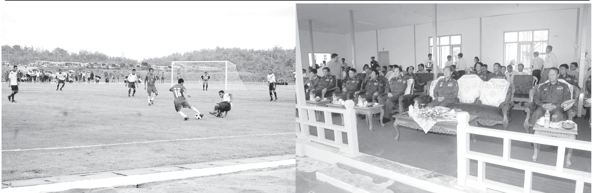
Chairman of Myanmar National Olympic Council Secretary-1 Lt-Gen Thiha Thura Tin Aung Myint Oo watching opening match of 2nd Nay Pyi Taw Inter-Ministry Men's Football Tournament 2008.

NAY PYI TAW, 11 July — A ceremony to open the 2nd Nay Pyi Taw Inter-Ministry Men's Football Tournament 2008 was held at No. 1 Nay Pyi Taw Sports Ground, here, this afternoon, attended by Chairman of Myanmar National Olympic Council Secretary-1 of the State Peace