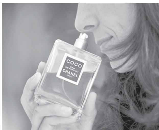
A woman takes a sniff of a perfume from Chanel in Gelsenkirchen, Germany, on 10 July, 2008. The German antitrust watchdog said on Thursday that it would levy fines against a number of cosmetics and perfume companies for collusion and price-fixing.