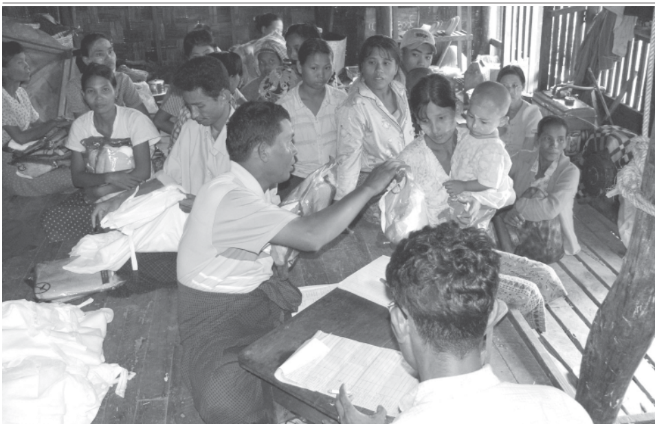
Health staff present insecticide-treated mosquito nets to the storm victims in Sutkyun village, Bogale Township.