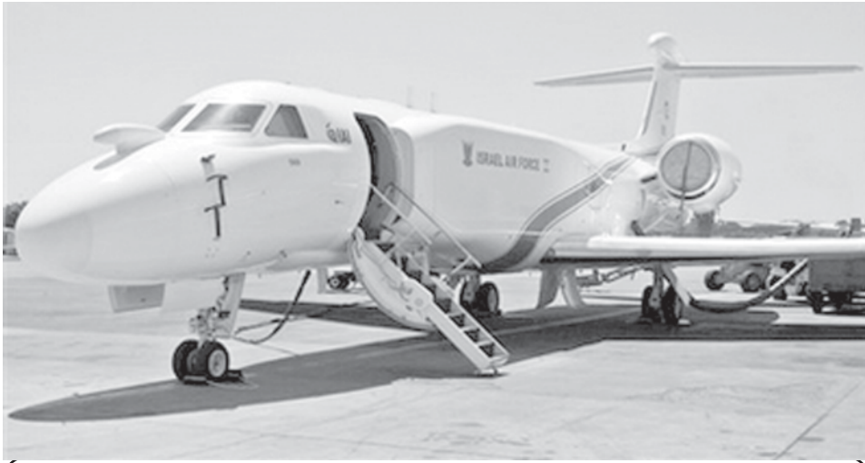
The Israeli Eitam airplane is seen during an in-house exhibit at Israel Aerospace Industries near Tel Aviv on 10 July, 2008. Israel says the Eitam airplane, which is equipped with sophisticated intelligence-gathering systems can spy on Iran.—INTERENET