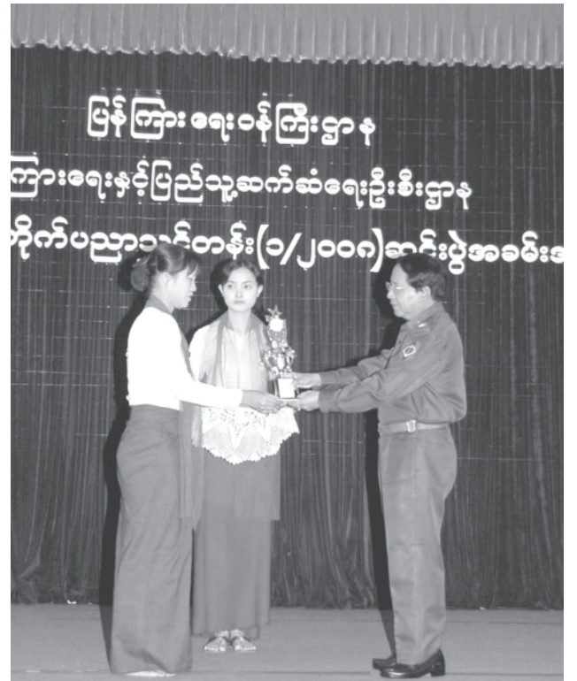
Minister Brig-Gen Kyaw Hsan presents a prize to a trainee of Basic Librarian Course.

In conclusion, all the trainees are to successfully perform the tasks of the ministry through the skills and knowledge gained from the course. The trainees are to