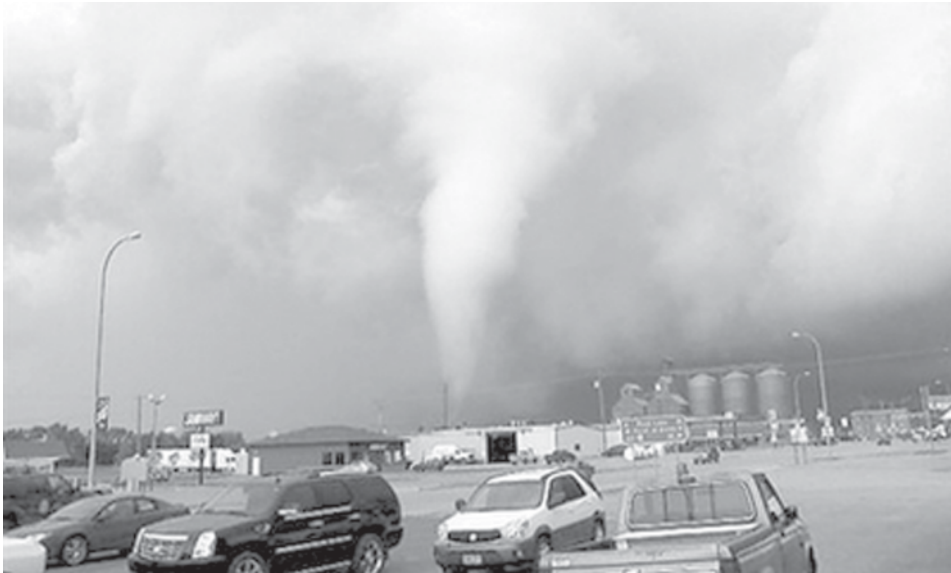
A tornado touches down northeast of Rolla , ND, in a store parking lot on 7 July, 2008. Residents say they were warned well before a tornado struck their small town, destroying six homes and damaging others.