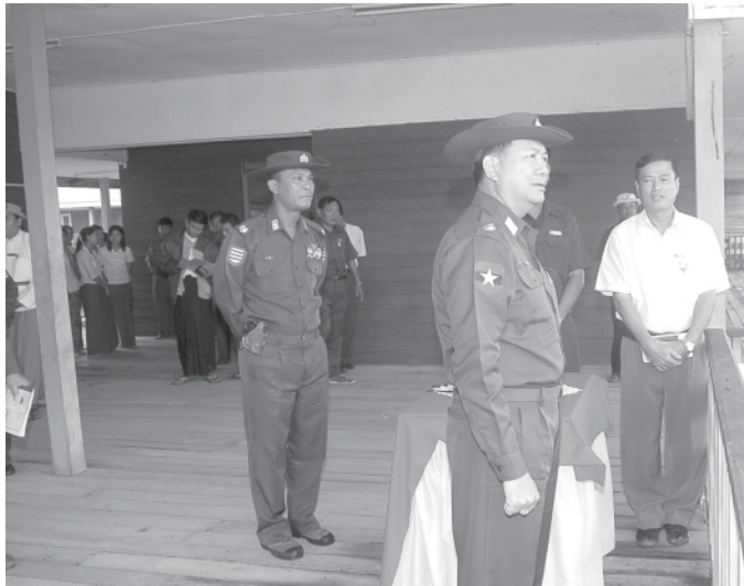
Maj-Gen Ko Ko inspects construction of Ngawun Bridge in Hinthada Township.

Ngawun Bridge is being built with reinforced concrete beams and frames. The bridge will be 2,835 feet long and 34 feet wide, and it will withstand 60-ton loads. So far, the construction of the main bridge has completed by 90 per cent and the approach bridge by 50