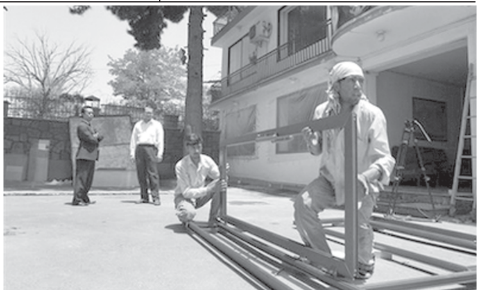
Indonesian Embassy staff are seen, while locals work on the Indonesian Embassy in Kabul, Afghanistan, on 10 July, 2008. The Embassy was partially destroyed in Monday’s suicide attack on the Indian Embassy in Kabul.—INTERNET

Gates was also asked about the possibility that Iran could soon obtain Russian air defence missiles. An improved air defence system would make a strike on Iran more difficult.— MNA/Reuters