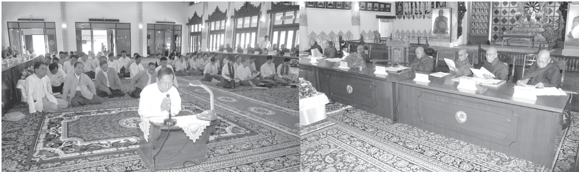
Minister Brig-Gen Thura Myint Maung supplicates on religious matters at Fifth Meeting of Sixth 47-member SSMNC.