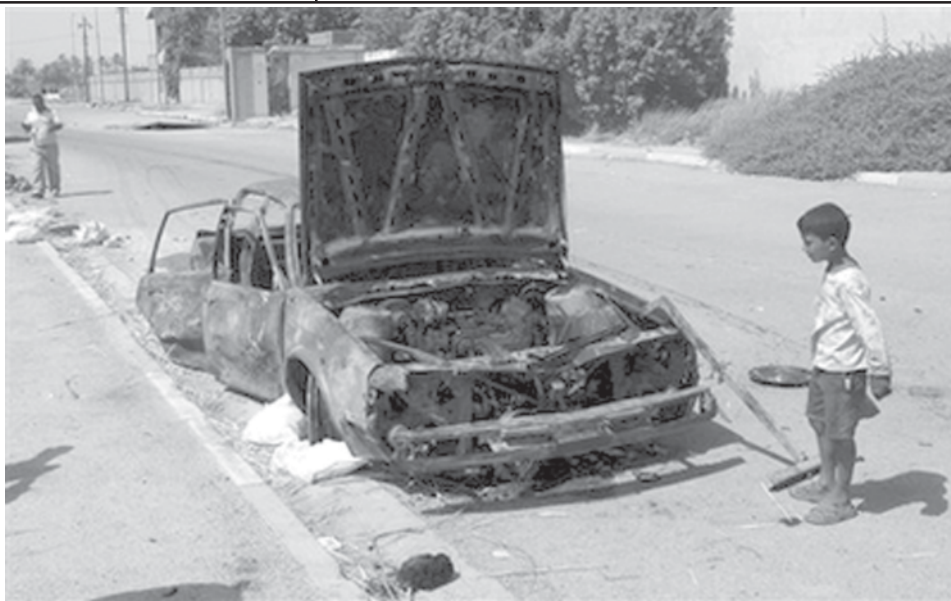
A boy stands by a vehicle destroyed in a car bomb explosion in west Baghdad’s Mansour neighborhood, Iraq, on 10 July, 2008. A parked car bomb went off Thursday afternoon in Mansour, targeting an Iraqi army patrol, killing two people and injuring ten others, police said.