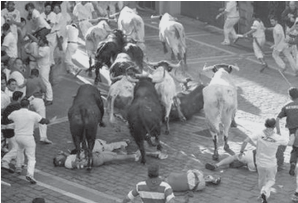
Runners are chased by Ventorrillo fighting bulls at the Mercaderes corner on the fourth day of the running of the bulls at the San Fermin festival in Pamplona on 10 July, 2008.