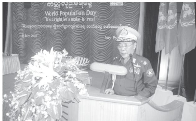
Minister Maj-Gen Saw Lwin speaking at World Population Day Ceremony.

engaged in providing quality reproductive health counseling, services and advocacy on health reproductive health and sexually transmitted diseases. Myanmar is cooperating keenly with the nations of the world in promoting universal access to reproductive health and will also contribute to achieving the ICPD-PoA and MDGS, particularly to the cause of universal access