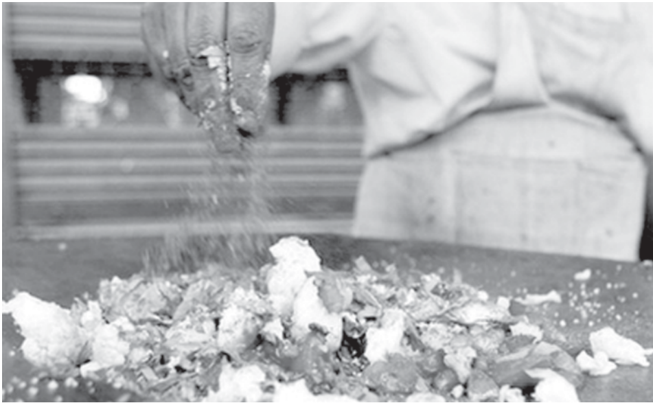
An Indian food vendor prepares a curry at his roadside stall in Mumbai. A London restaurant is serving up what it hopes will be confirmed as the world's hottest curry, with even the chef admitting it is "too extreme" to keep on the menu.