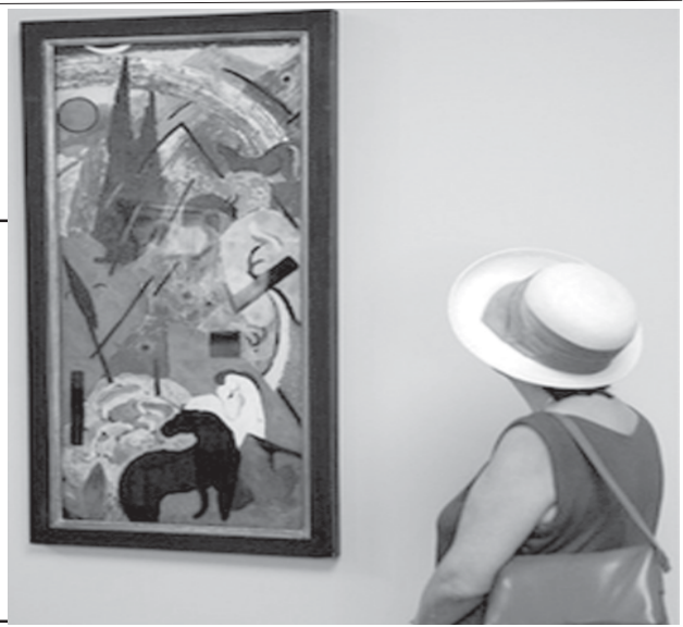
A visitor stands in front of the painting 'Landscape with animals and rainbow' by artist Franz Marc at the Franz Marc Museum in Kochel, southern Germany, on 10 July, 2008.