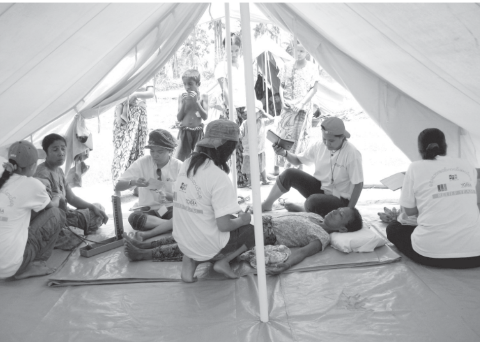
Medical team of Pun Hlaing International Hospital provides free health care in storm-hit villages.

YANGON, 11 July—Under the arrangements of the Ministry of Health, a medical team of Pun Hlaing International Hospital performed voluntarily health care to storm victims of the villages in Ngapudaw Township and Hainggyikyun, Ayeyawady Division from 23 May to date.