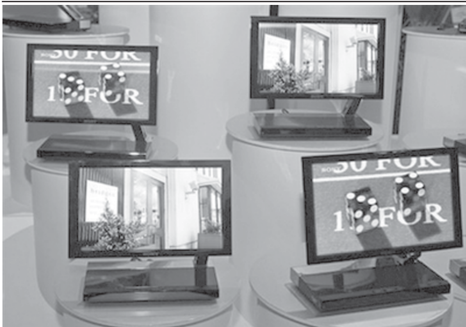
Sony Corp's OLED television sets are seen here on display at the 2008 Consumer Electronics Show in Las Vegas, in January. A Japanese government body said on Thursday it would fund a joint project of leading firms to develop a key technology to produce large, energy-saving organic (OLED) displays.

Caffeine would not necessarily provide the same effect in persons with MS, and the relationship between the disease and the stimulant should be researched further, they said. — MNA/Xinhua