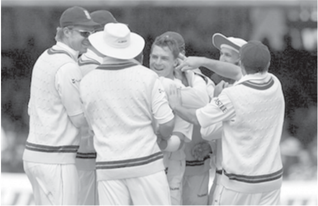
South Africa's Dale Steyn, facing centre, celebrates with the team after claiming the wicket of England's Michael Vaughan during the first day of the first test at Lord's cricket ground, London, on 10 July, 2008.