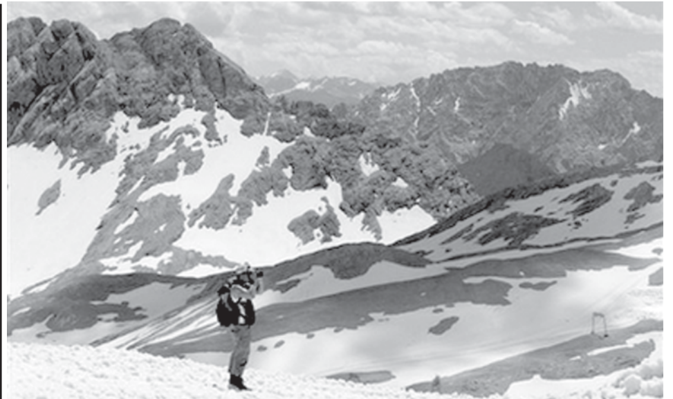
A hiker takes a picture on a snowfield near the Zugspitz plateau (2,600 Metre) in the Alps, southern Germany, during sunny weather on 10 July, 2008.