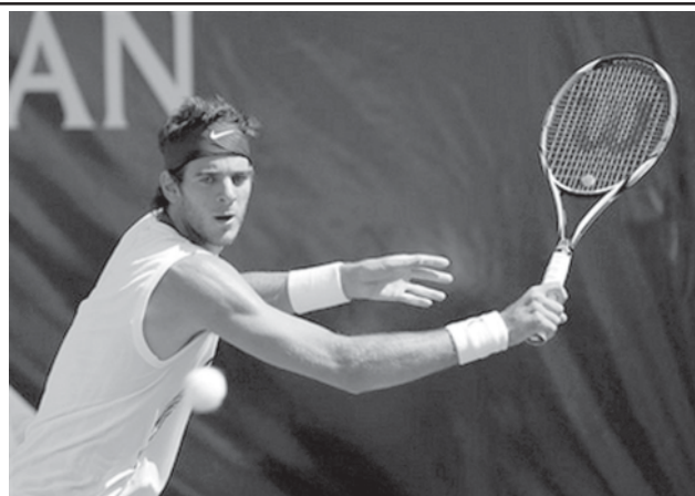
Argentina's Juan Martin del Potro returns a ball during a second round match against Italy's Simone Bolelli at the Mercedes Cup tennis tournament in Stuttgart, southern Germany, on 10 July, 2008.