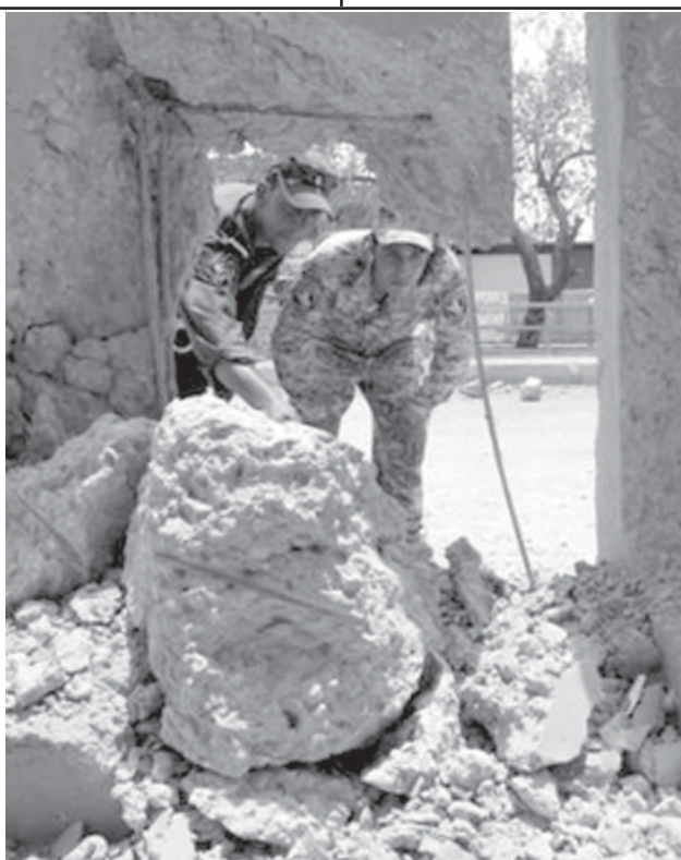
Policemen inspect the site of a roadside bomb attack in Baghdad on 10 July, 2008. The attack killed one civilian and wounded four others, including three traffic policemen, police said.