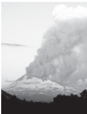
Chile's imposing southern Llaima volcano (seen here in February) roared into action on Thursday, spewing rocks, lava and clouds of ash.