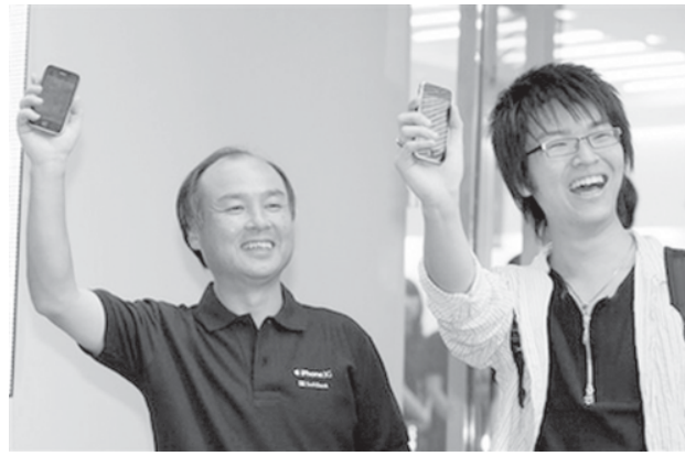
Softbank President Masayoshi Son, left, and a first customer hold up Apple Inc's iPhones in Tokyo on Friday morning, 11 July, 2008.