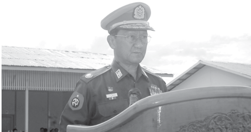
Chairman of MOC Minister Brig-Gen Thura Aye Myint speaks at opening of Inter-Ministry Men's Football Tournament.

He added that while uplifting the sports standard of the nation as a national duty, the government sets the plans to improve