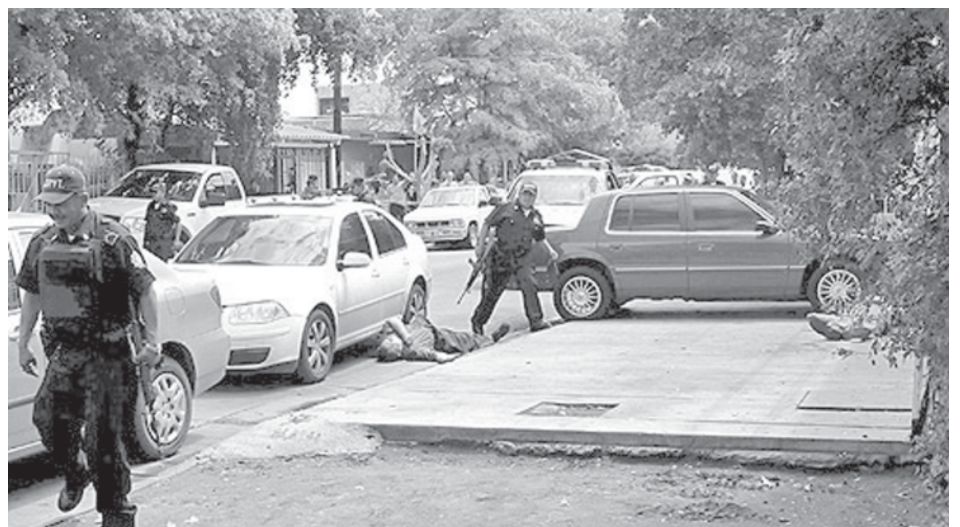
Authorities investigate the killings at an auto repair shop. The fleeing gunmen traded fire with police who gave chase in a busy commercial area. Sinaloa state is notorious for drug-related violence, but officials gave no motive for the shootings.

Home to the so-called Sinaloa cartel headed by Joaquin "Shorty" Guzman, the western state has a long history of drug violence. It has tallied more than 250 narcotics-related killings this year.—Internet