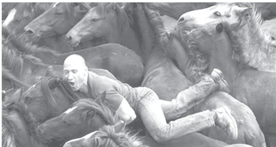
A man jumps onto wild horses during the 400-year-old horse festival called 'Rapa das Bestas' or 'Shearing of the Beasts', in Sabucedo, Spain, on 6 July, 2008.