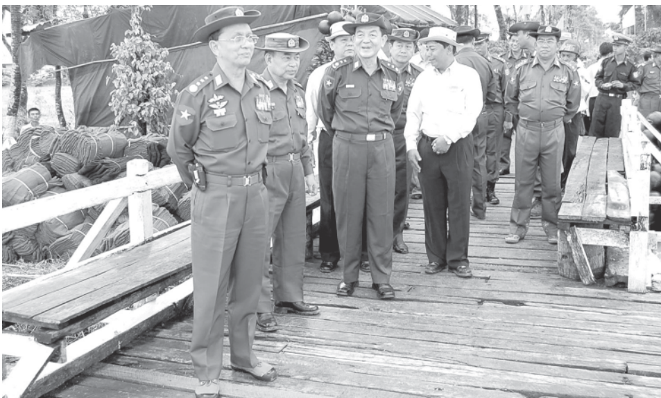
Prime Minister General Thein Sein observes demonstration of fishing boats in Toe River in Bogale Township.