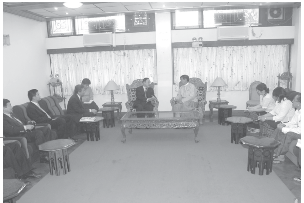
Deputy Minister U Kyaw Thu meets Minister Dr Mun Patanotai of Thailand.