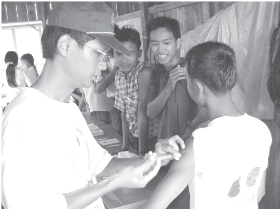
USDA members of Group (2) provide health care to local people.

and Sagaing, Yangon and Ayeyawady divisions, in Pyinsalu, Labutta Township; Group (3) consisting of young members from Kachin State and Magway, Yangon and Ayeyawady divisions, in Hsincheya village, Labutta Township; Group (4) consisting of young members from Mon and Shan (North) states and Bago (East) and Ayeyawady divisions, in Saluseik village, Labutta Township; Group (5) consisting of young