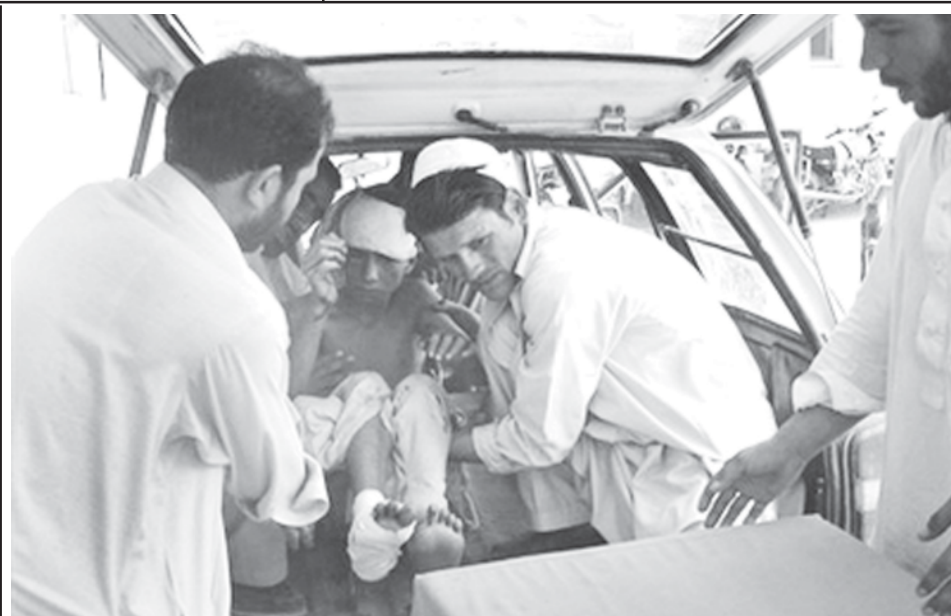
Afghan hospital workers carry a boy who was allegedly injured in US-led air strikes. An Afghan district governor has accused the US-led coalition of killing nearly two dozen civilians in an air strike on a wedding party. The coalition insisted it only killed militants.