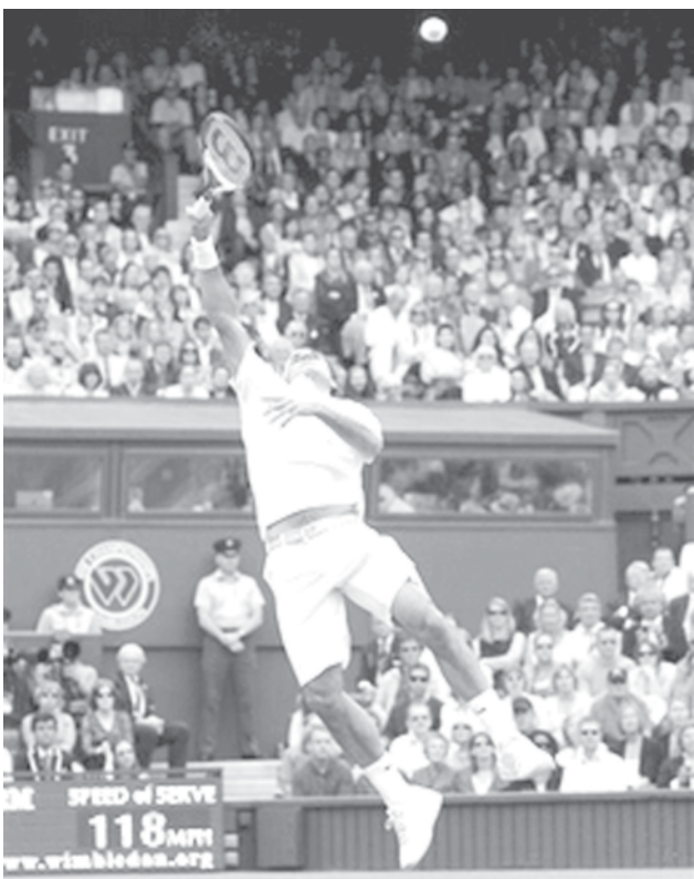
Switzerland's Roger Federer in action against Spain's Rafael Nadal during the men's singles final on the Centre Court at Wimbledon, on 6 July, 2008.