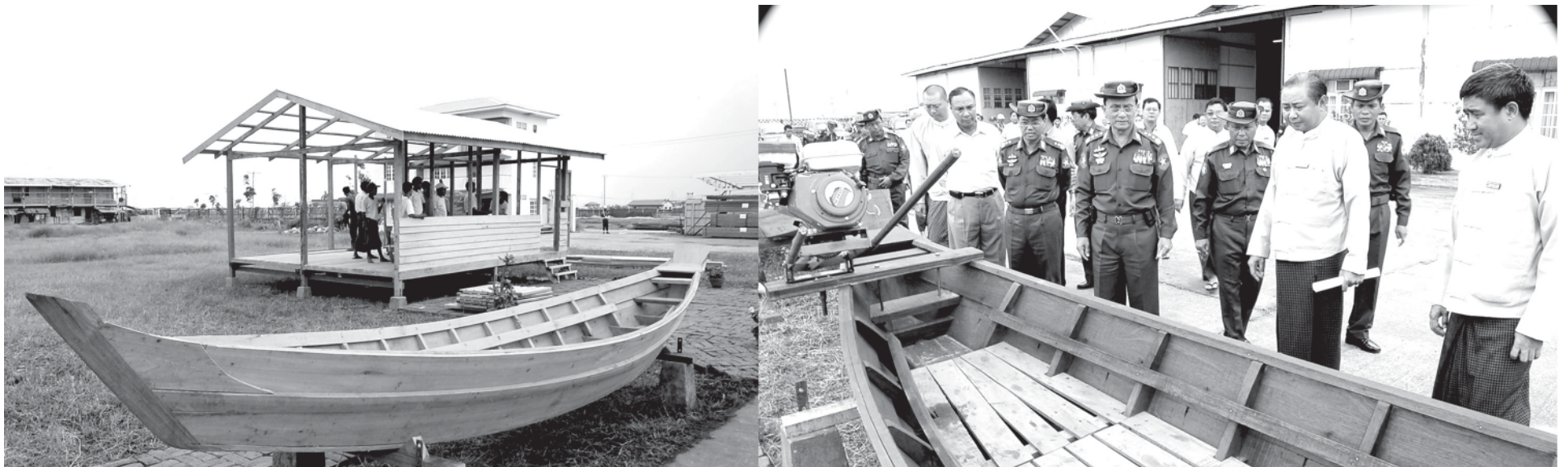
Prime Minister General Thein Sein inspects building of houses and fishing boats for storm-hit regions.

YANGON, 7 July—Chairman of the National Disaster Preparedness Central Committee Prime Minister General Thein Sein, accompanied by Maj-Gen Ko Ko of the Ministry of Defence, Chairman of Ayeyawady Division Peace and Development Council Commander of South-West Command Brig-Gen Kyaw Swe, ministers, deputy ministers, the Director-General of the Government Office and departmental heads, this morning left Patheingyi by helicopter and arrived in Mawlamyinegyun at 7.50 am.