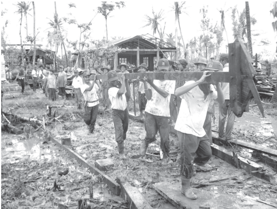
USDA members of Group (6) are engaged in sanitation tasks in Setsan Village monastery.

We reporters have made trips to the interior parts of the storm-hit areas to cover news. So, we have learnt a lot about the conditions caused by the storm 'Nargis' and brilliant performances being carried out by the government, the people and the Tatmadaw.