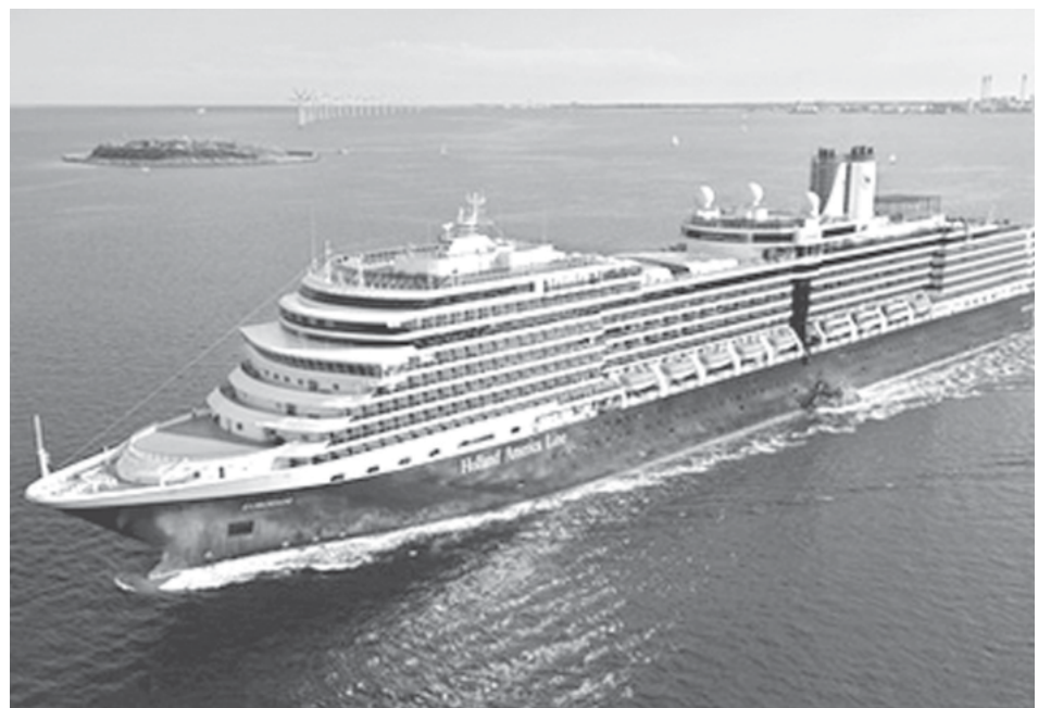
In this photo released by Holland America Line, the new ms Eurodam departs Copenhagen, Denmark, on 5 July, 2008, on its maiden European voyage. — INTERNET