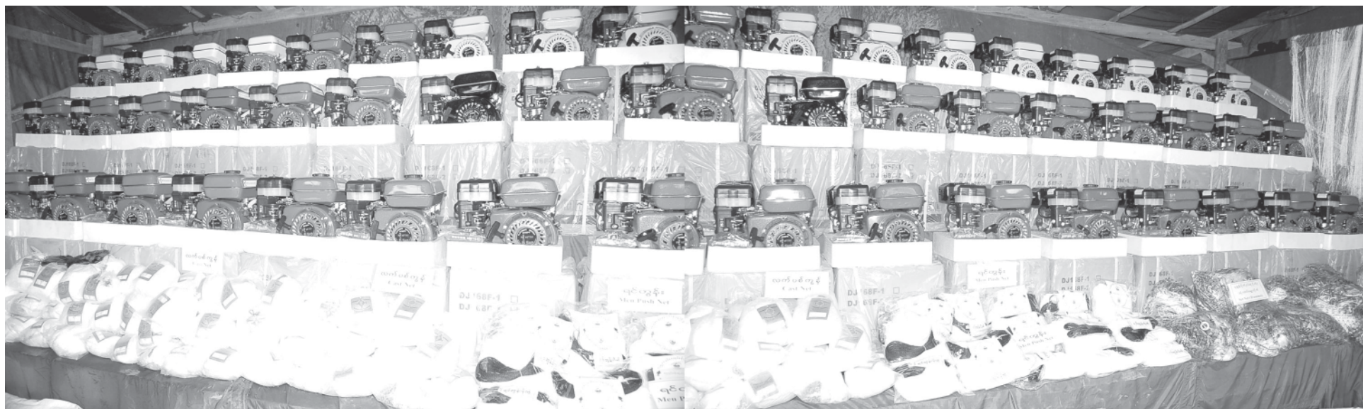
Photo shows fishing nets and fishing boat engines for storm victims in Mawlamyinegyun Township.