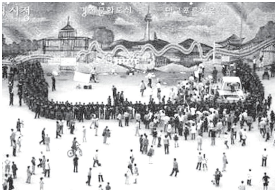
Riot police officers block protesters during a rally demanding the full-scale renegotiation of the US beef import deal, in front of Seoul City Hall on 6 July, 2008.