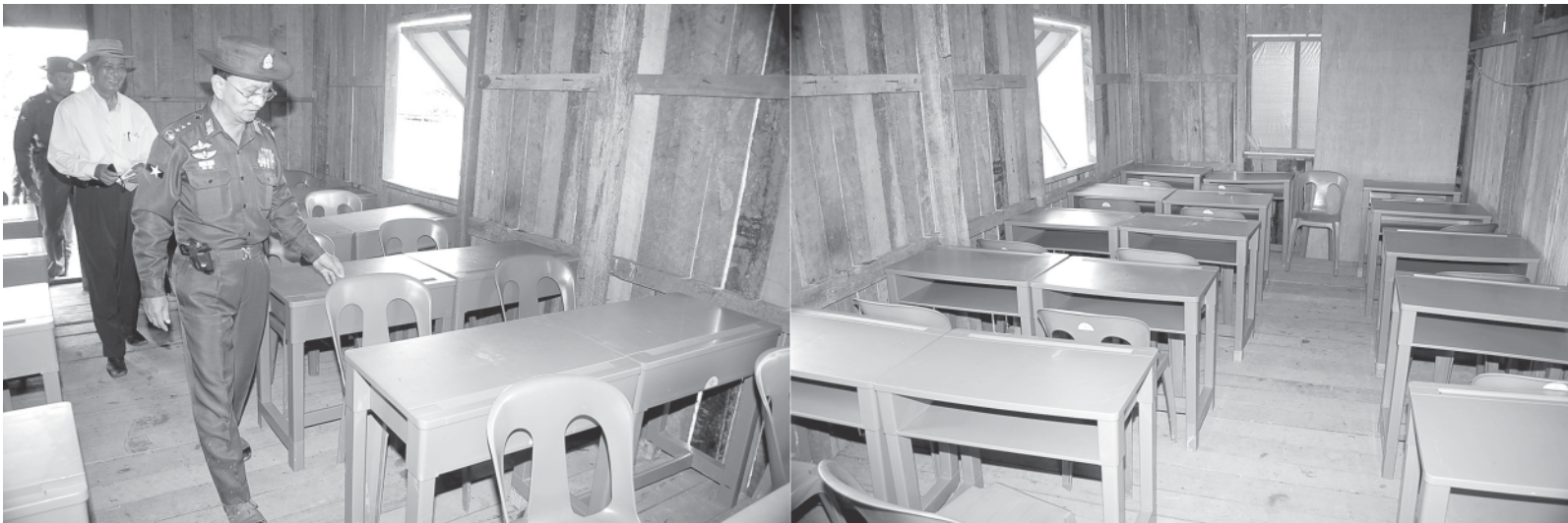
Prime Minister General Thein Sein inspects temporary classroom of the high school in Pyinsalu.