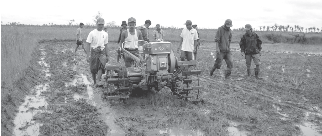
USDA members volunteer to plough field in Hlinephone Village.