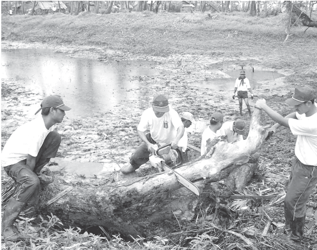
USDA members of Group (3) removing fallen trees.