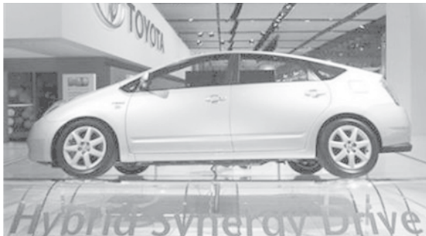
A Prius with the new Hybrid engine is seen at the fair stand of Japanese car manufacturer Toyota at the International Car Show (IAA) in Frankfurt recently.

The panels, supplied by Kyocera Corp would be able to power part of the air-conditioning on high-end versions of the gasoline-electric Prius, the source said. “It’s more of a symbolic gesture,” said the source, who asked not to be identified. “It’s very difficult to power much