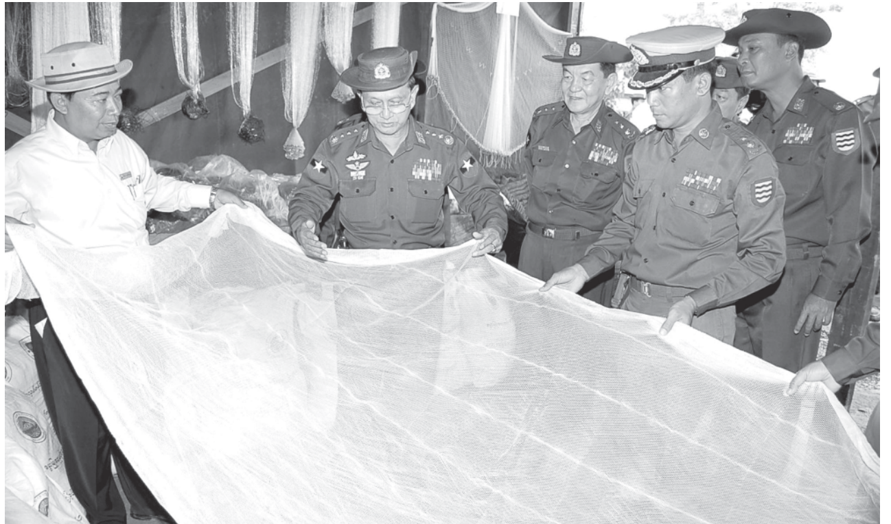
Prime Minister General Thein Sein inspects various kinds of fishing nets displayed near Tonehle creek in Mawlamyinegyun Township.—MNA

The Prime Minister and party looked into fishing boats, engines, fishing nets and related accessories to be handed over,