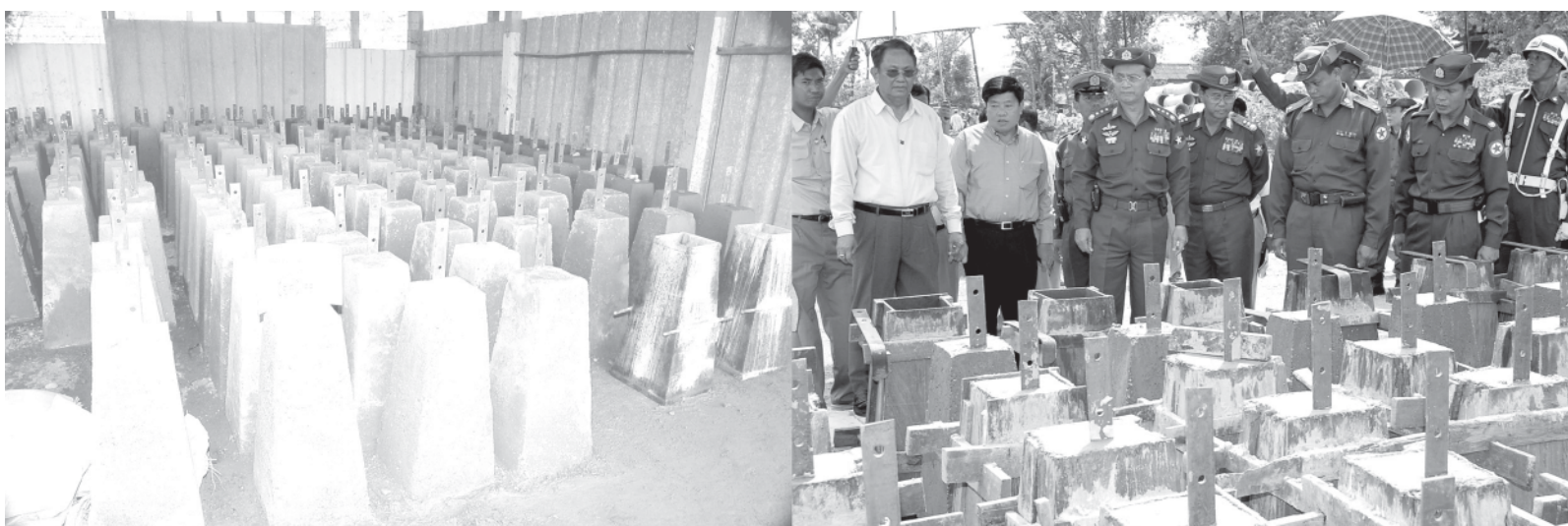
Prime Minister General Thein Sein inspects production of post shoes for construction of houses in the storm-hit areas.—MNA