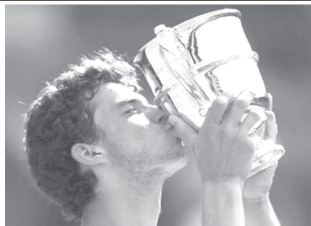
Grigor Dimitrov of Bulgaria kisses his trophy after defeating Henri Kontinen of Finland in their boys' singles final match at the Wimbledon tennis championships in London on 6 July, 2008.

Ronaldo, who signed a five-year contract with United last year, won a Premier League and Champions League double last season, scoring 42 goals, and was named England's Footballer of the Year for a second season in a row. — MNA/Reuters