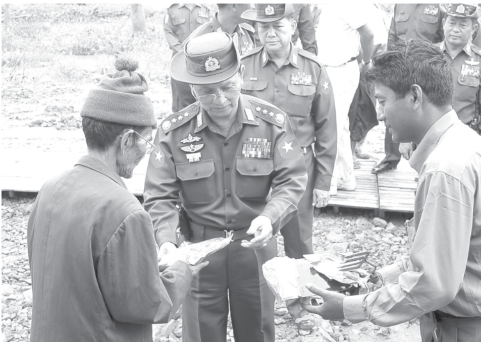
Prime Minister General Thein Sein presents vegetable seeds and farm implements to a farmer in Pyinsalu. (News reported).—MNA

The Prime Minister and party left the factory in the afternoon.—MNA