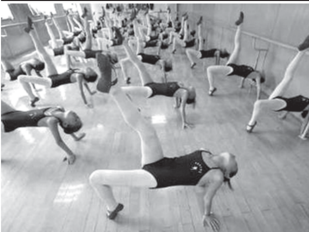
Children practise ballet at an activity centre in Hefei, Anhui Province on 6 July, 2008. About 200 students, mostly between the ages of 5 and 14, learn ballet at the school, local media reported.

Forecast for Mandalay and neighbouring area for 8-7-2008: Isolated rain. Degree of certainty is (80%).