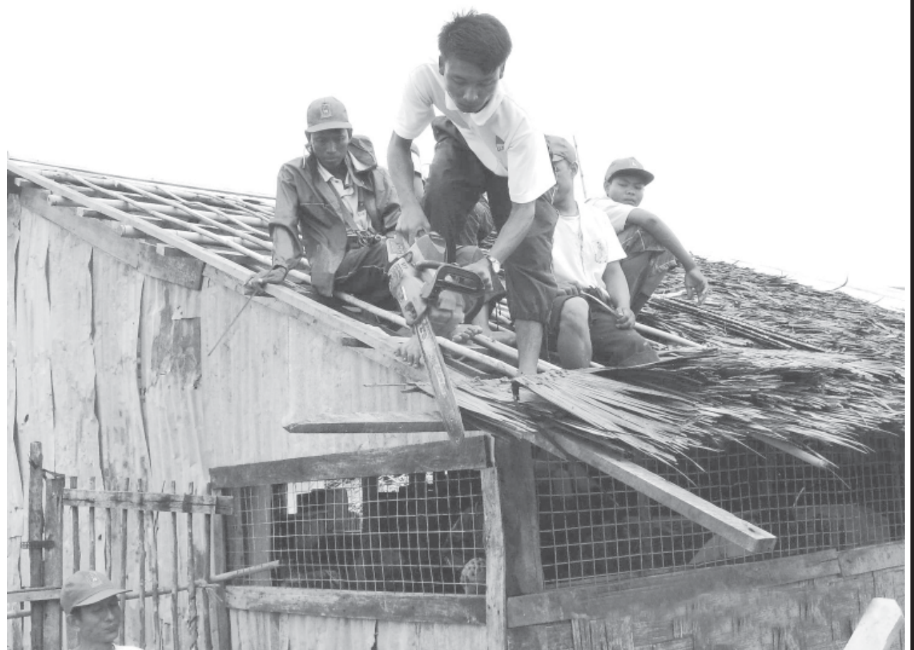
USDA members of Group (5) reconstructing a ravaged house.