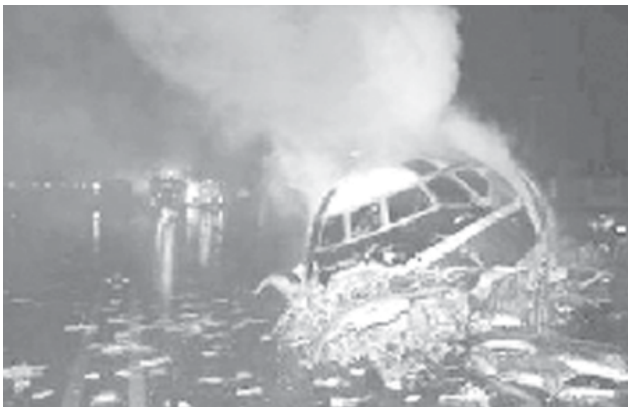
A police officer stands next to the wreckage of a DC-9 plane at the crash site on the outskirts of Saltillo, northern Mexican state of Coahuila on 6 July, 2008.