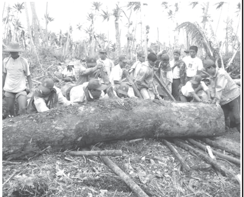
USDA members of Group (4) removing a fallen tree in Saluseik Village.

The performances include teaching students in Hlinephone village, donation of clothes for the victims of Begon village, removing the fallen trees, sanitation tasks in Phoneygigon village, building of make-shift schools, providing health care, dredging of the lakes around the villages, carrying relief supplies, reconstruction