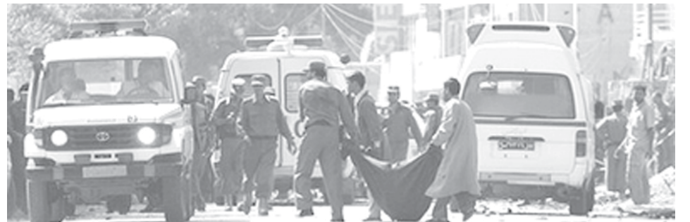
Afghan policemen and health workers carry a dead body at the site of a suicide attack in Kabul, Afghanistan on 7 July, 2008.