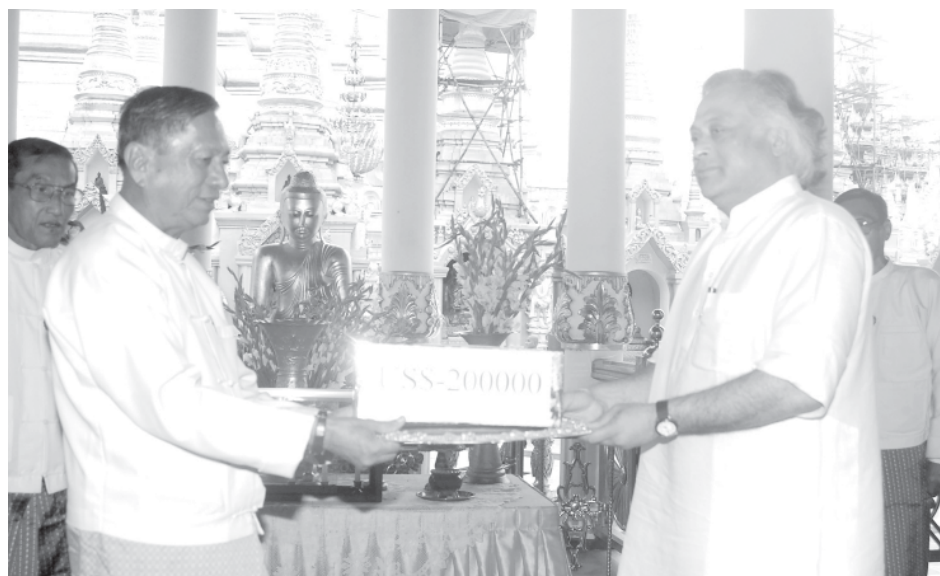
Minister Brig-Gen Thura Myint Maung accepts US $ 200,000 presented by Mr Shri Jairam Ramesh.