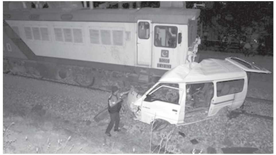
A Turkish police officer inspects the site of the railway accident area in Gaziantep Province recently. Ten people were killed in Turkey when a freight train rammed into a minibus passing a level crossing despite warnings to stop, revising down an earlier toll of 11 dead.