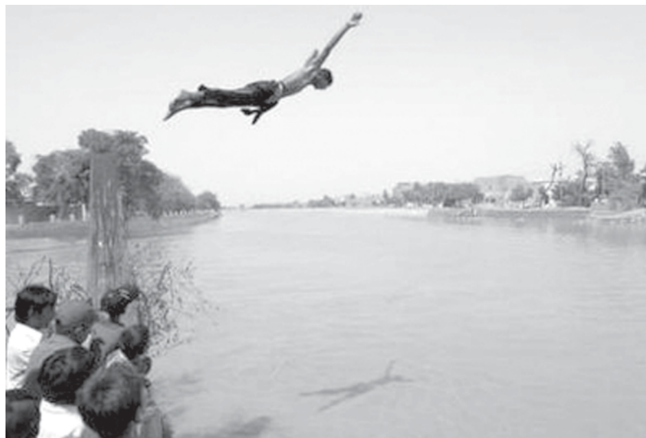
A boy jumps into a canal to cool himself during a hot day in Larkana, Pakistan on 23 June, 2008. Temperatures have soared to more than 49 degrees Celsius (113 degrees Fahrenheit) in some parts of the country since on 8 June, the meteorological department said.