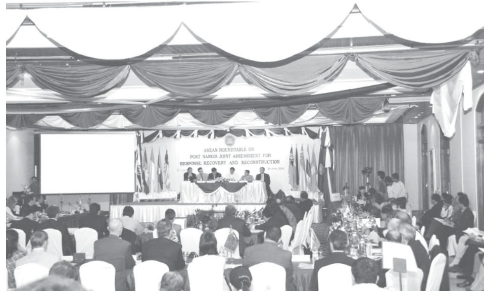
ASEAN Roundtable on Post Nargis Joint Assessment for Response, Recovery and Reconstruction in progress.

Those present took part in the discussions.