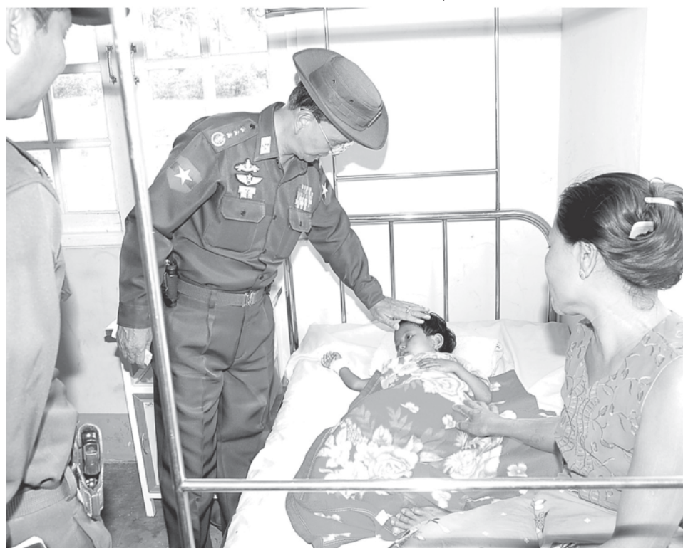
Prime Minister General Thein Sein comforts a patient receiving treatment in a hospital in the town of Ahmar. (News reported)—MNA

Now, companies concerned are building 16' x 20' houses with post shoes, roofed with CI sheets, floored with timber and covered with timber and bamboo mats for homeless victims. Well-wishers Htoo Trading Co is building 116 units in Kyeinchaunggyi village in Bogale Township; Diamond Mercury Co, 108 units with the donations of Ngwe Hsin Co in Setsan