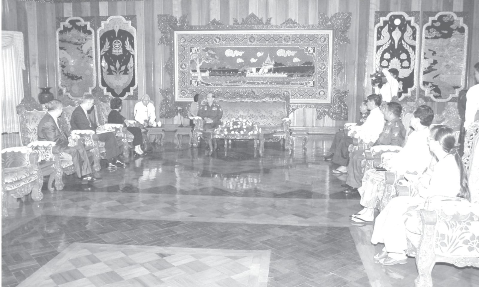
Prime Minister General Thein Sein receives UN Under Secretary General and UNESCAP Executive Secretary Ms Noeleen Heyzer in Yangon.