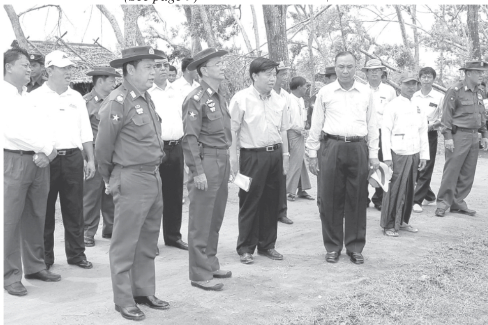
Prime Minister General Thein Sein inspects houses for storm-victims in Pyapon Township on 23 June.