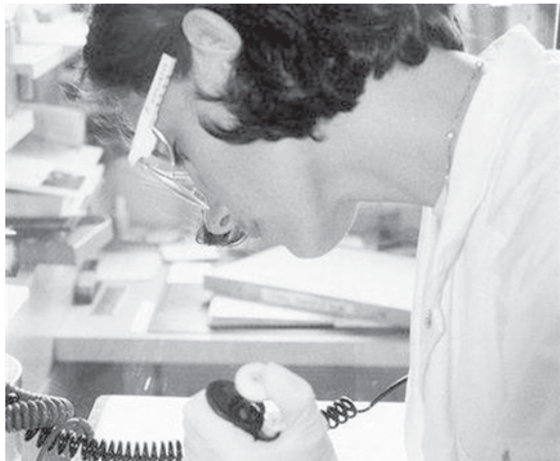
A journalist takes a photo of a ship at the new ‘International Maritime Museum Hamburg’ on 23 June, 2008 in Hamburg, Germany. The museum will be opened on Wednesday.