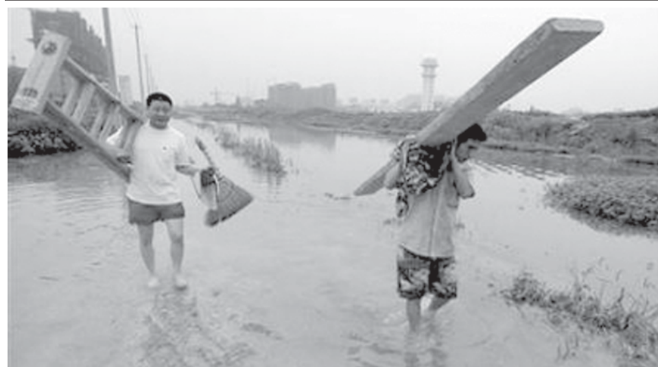
Local residents, carrying their belongings, walk on a flooded road on the outskirts of Hefei, Anhui Province on 23 June, 2008.