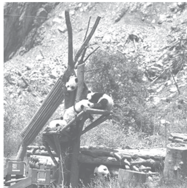
One-year-old panda babies rest at China Conservative and Research Center for the Giant Panda while landslide triggered by the May 12 earthquake is seen on a nearby mountain in Wolong of Abo, China’s southwest Sichuan province recently.