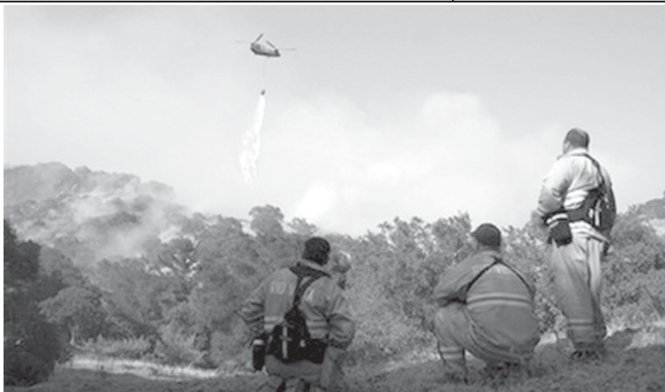
Firefighters from Rio Vista, Calif, overlook a helicopter water drop at a wildfire in Green Valley Calif, on 22 June, 2008. The fire has consumed more than 3500 acres in Napa and Solano county.