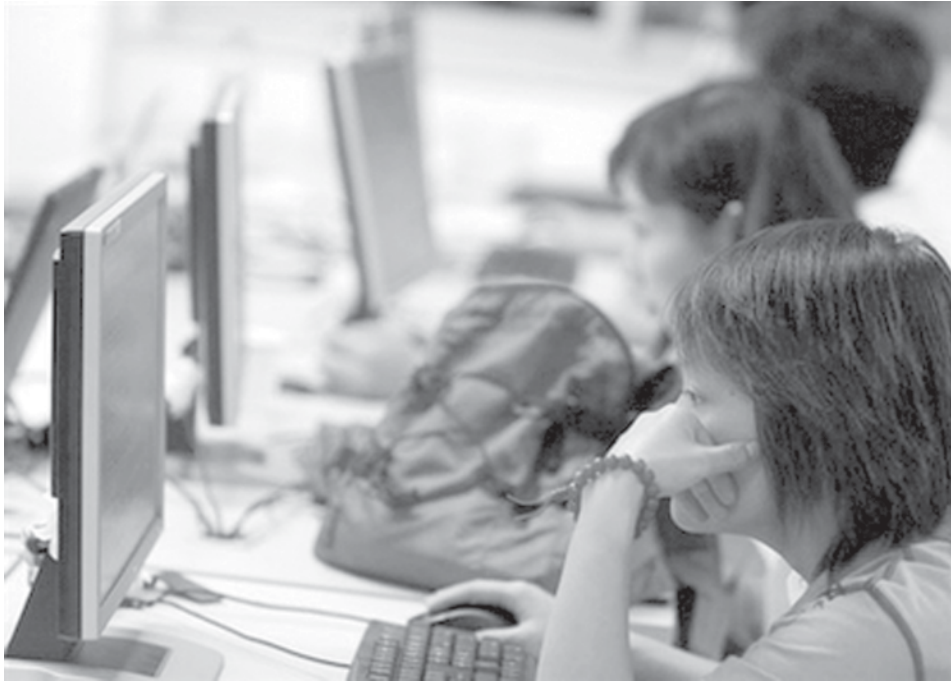
A file photo shows People surf the Internet in Beijing in 2007. Internet users should soon be able to use new domain names such as love, paris or bank if one of the world wide web's biggest shakeups is approved this week as expected by the web regulator ICANN.—INTERNET