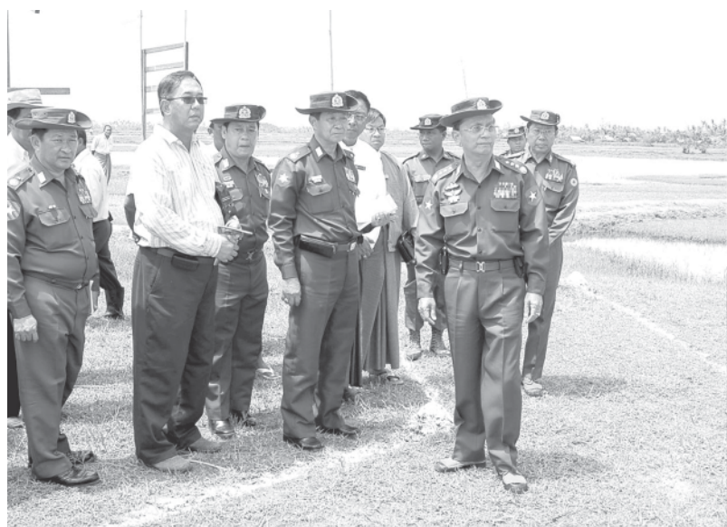
Prime Minister General Thein Sein inspects houses for storm survivors in Kyondah Village, Dedaye Township.

Companies concerned are building 16' x 20' houses with post shoes, roofed with CI sheets, floored with timber and covered with timber and bamboo mats for homeless victims.