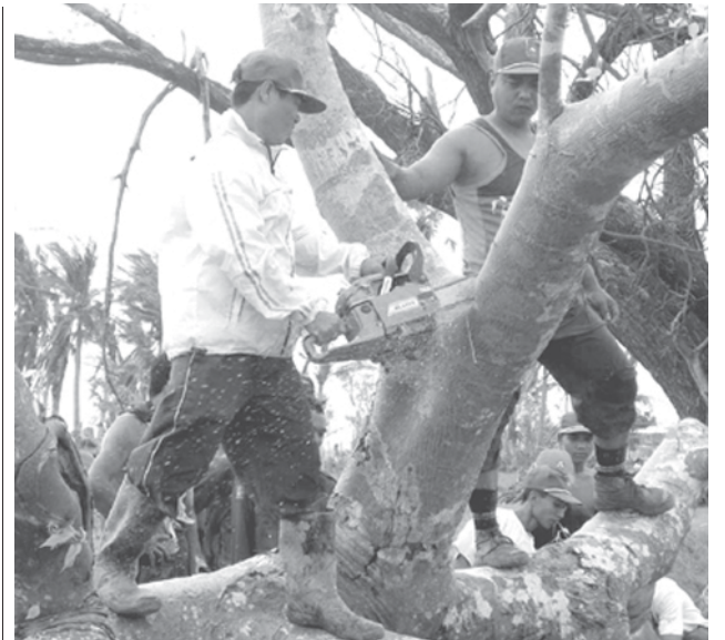
Members of USDA clearing downed trees in Hsincheya Village in Labutta Township.