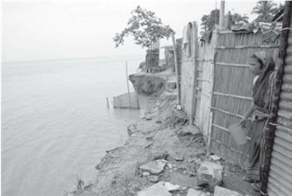
A woman looks at the River Padma from her house under threat from erosion of the river in Shariatpur, India on 23 June, 2008.