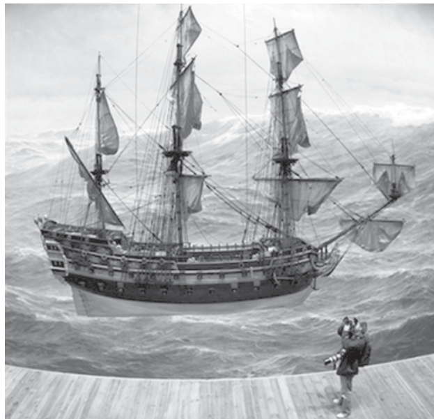
A Novartis researcher in an undated image. A highly effective leukemia pill may reduce complications and boost the effectiveness of a treatment for the most common type of stroke, an international team of researchers said on 22 June 2008.