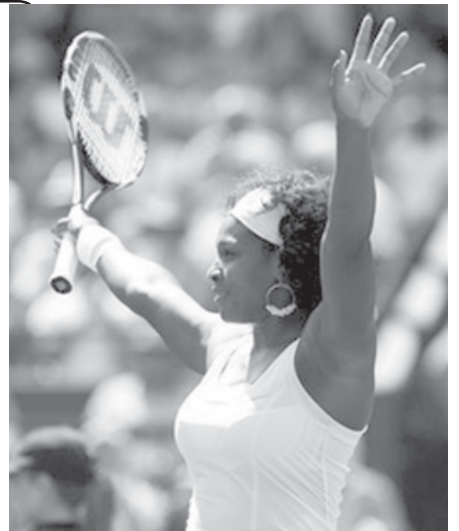
Serena Williams of the US celebrates her win against Kaia Kanepi of Estonia at the Wimbledon tennis championships in London on 23 June, 2008.

But he later added: "It's true someone who could replace the current coach is clearly Didier Deschamps. —MNA/Reuters