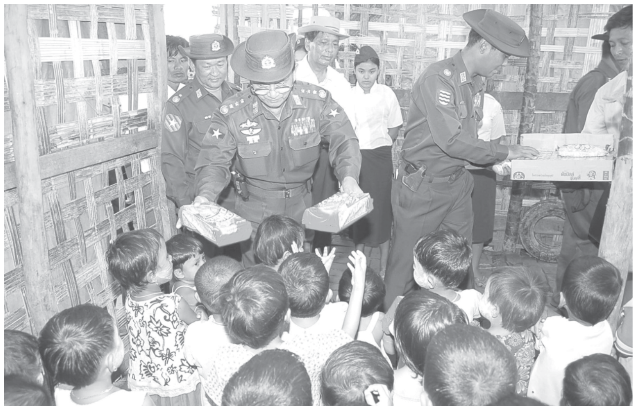
Prime Minister General Thein Sein distributes food to school children at a pre-primary school in Poelaung Village in Labutta Township on 23 June.—MNA