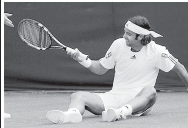
Fernando Gonzalez of Chile gets helped back to his feet during his first round singles match against Robby Ginepri of the US at Wimbledon, on 23 June, 2008.

After taking the third set with a single break of serve he swept through the fourth in style against his flagging opponent to set up an eye-catching second round with former world number one Marat Safin.