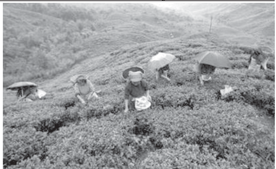
Labourers pluck tea leaves in a tea plantation at Shipaidura village, about 40 km (25 miles) north of the northeastern hill resort of Darjeeling, on 23 June, 2008.

Moreover, he added that Hamas "doesn't accept Arab forces" to prevent friction with Israel, but "welcomes Arab forces helping the Palestinian people in their liberation". A few days ago, an Israeli newspaper reported that the Egyptian-brokered ceasefire may include the deployment of multinational Arab forces in Gaza in its final stages.—MNA/Xinhua