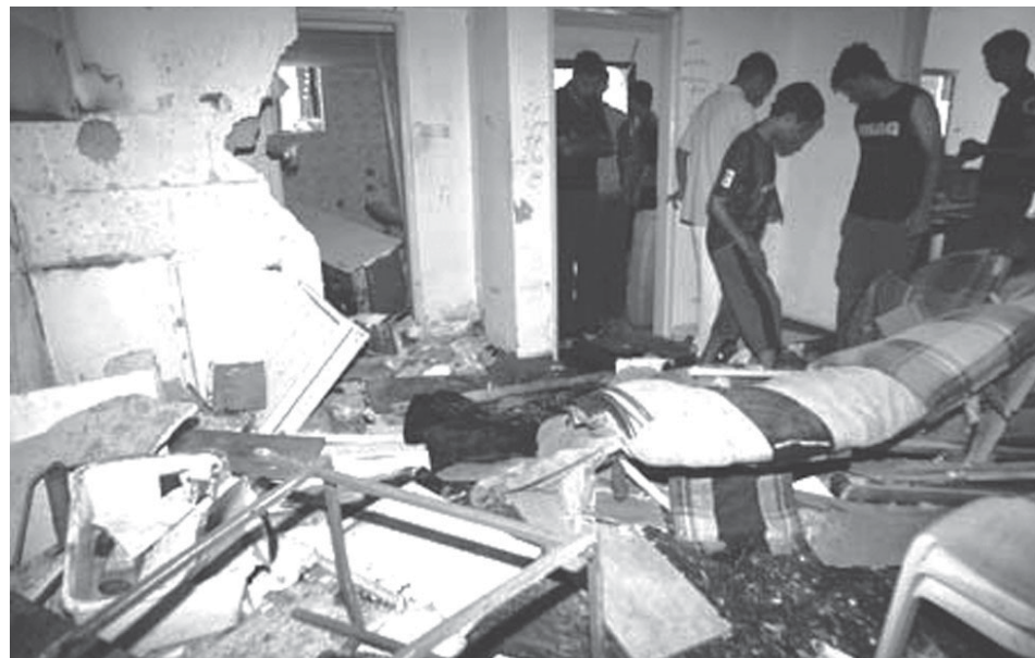
Palestinians observe the damage in a house after an Israeli military operation in the West Bank city of Nablus on 24 June, 2008.—INTERNET

The killings, which were confirmed by the Israeli army, could test the fragile ceasefire that took effect last Thursday between Israel and militants in the Hamas-controlled Gaza Strip.—Internet