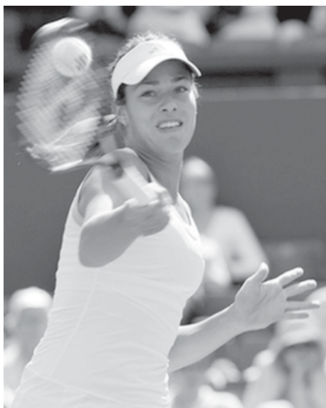
Ana Ivanovic of Serbia in action during her first round match against Rossana De los rios of Paraguay on Center Court at Wimbledon, on 23 June, 2008.