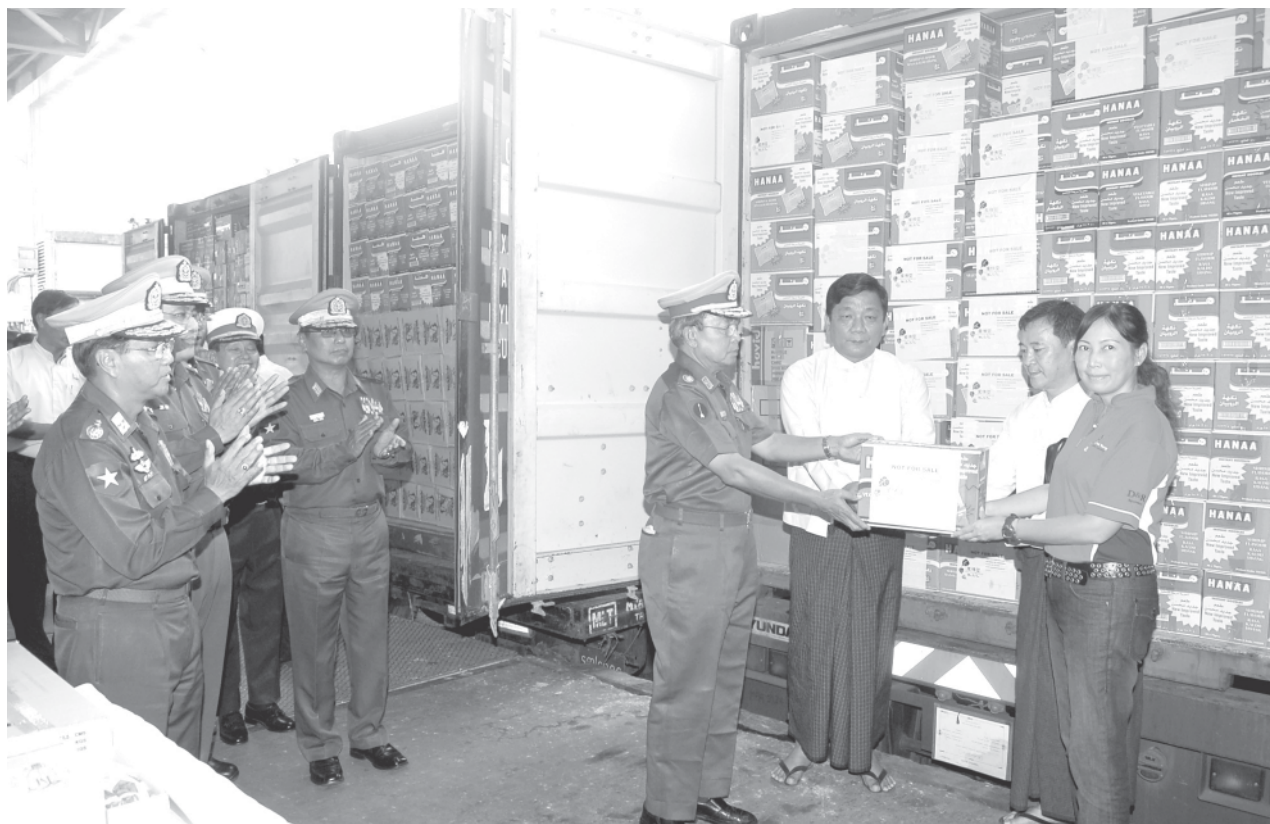
Man Fut Tong Welfare Society and JBS Company of Singapore donate relief aids in the presence of Lt-Gen Myint Swe of the Ministry of Defence.

YANGON, 24 June—A ceremony to donate relief supplies to the storm victims was held at the building of Myanma Port Authority in Bo Aung Kyaw container yard this afternoon.