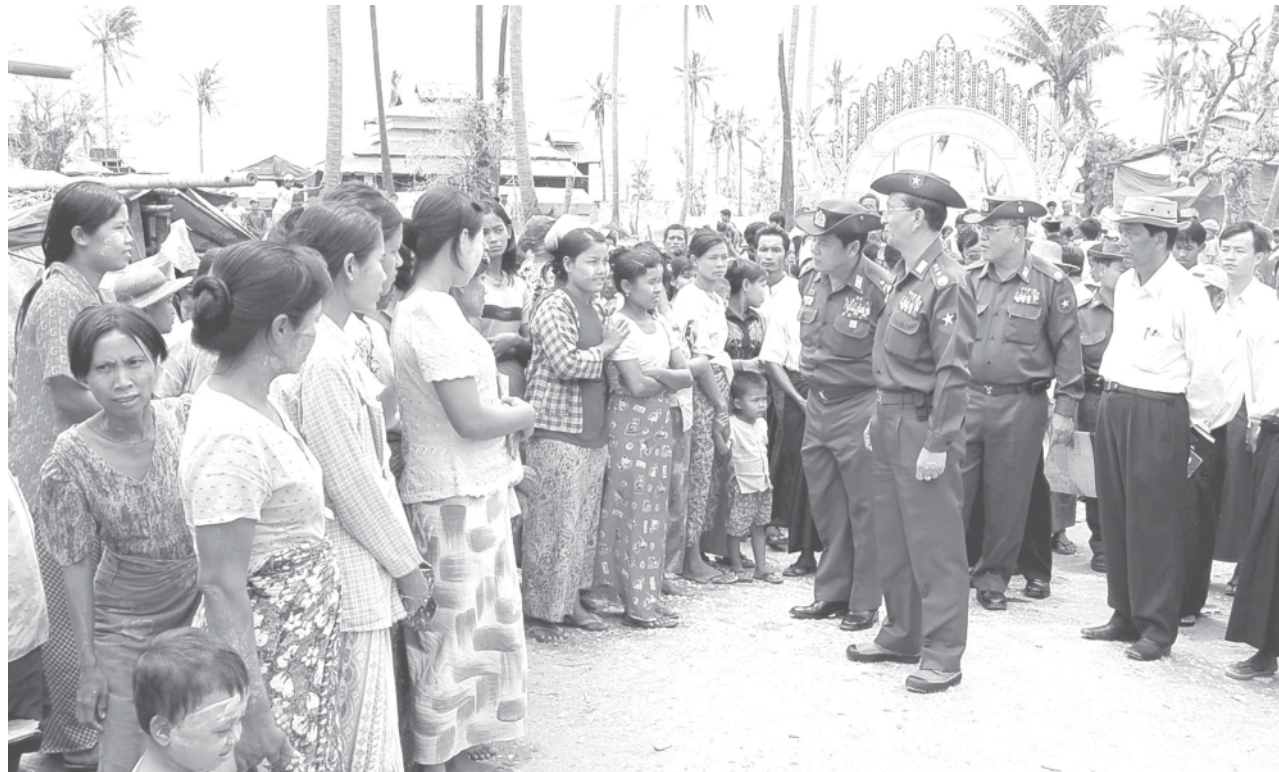
Prime Minister General Thein Sein greets residents in Poelaung Village in Labutta Township as he inspects rehabilitation works in the village. (News reported)—MNA

On arrival at Kyondah village, the Prime Minister had a cordial meeting with service personnel, members of USDA,