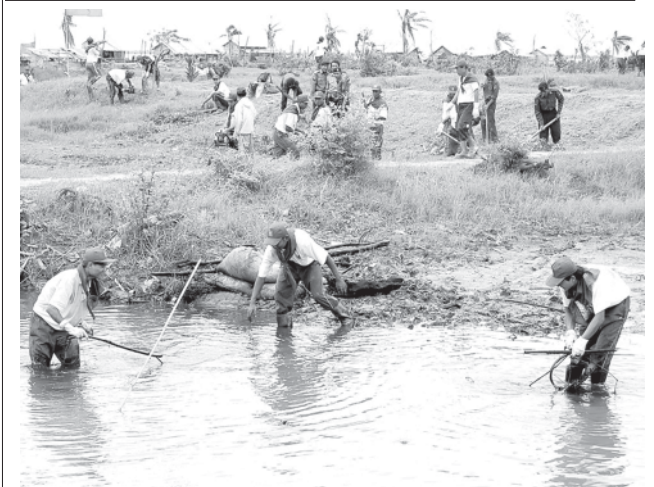
USDA members and Tatmadawmen take part in reconstruction work in Kyeinchaungyi Village in Bogale Township.