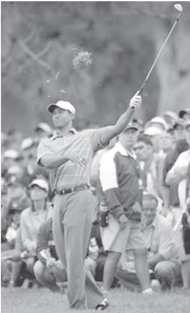
Tiger Woods watches his shot from the rough on the first hole during the first round of the 108th U. Open golf tournament at Torrey Pines in San Diego on 12 June, 2008.—INTERNET