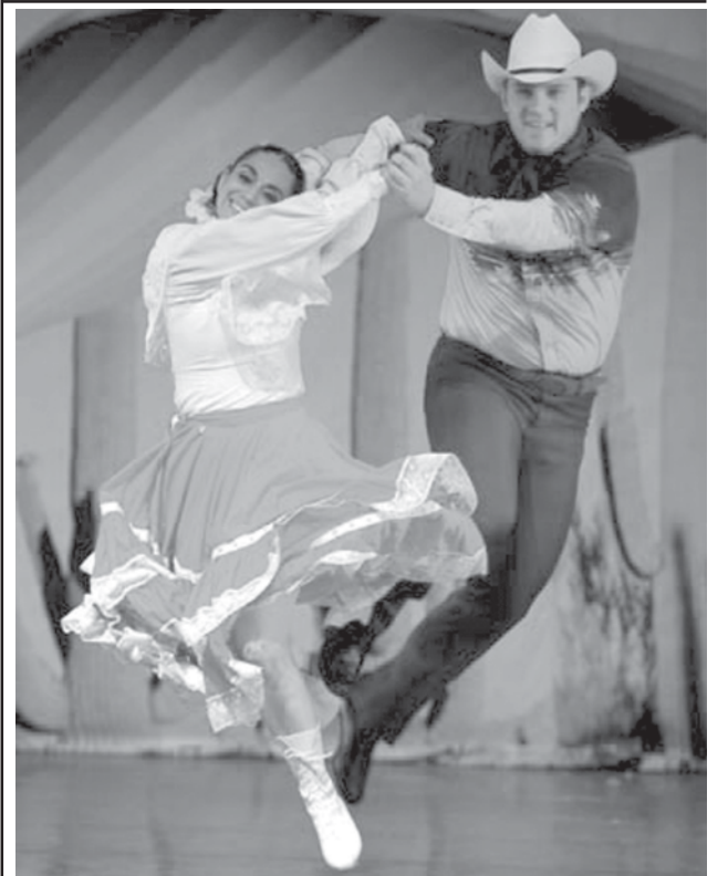
Mexican dancers perform at the first China Xinjiang International Folk Dance Festival in Urumqi, capital of northwest China's Xinjiang Uygur Autonomous Region, on 11 June, 2008. A special performance for Mexican dancing was held on Wednesday evening.