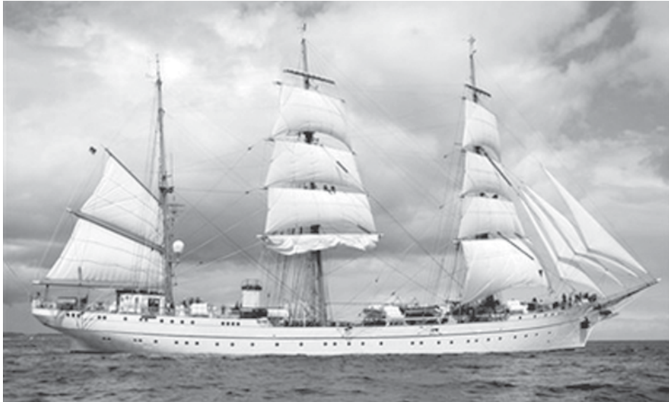
The Gorch Fock sails on the Baltic Sea off the German coast on 12 June, 2008. The sailing school ship of the German Navy celebrates its 50th anniversary of going into operation this year.