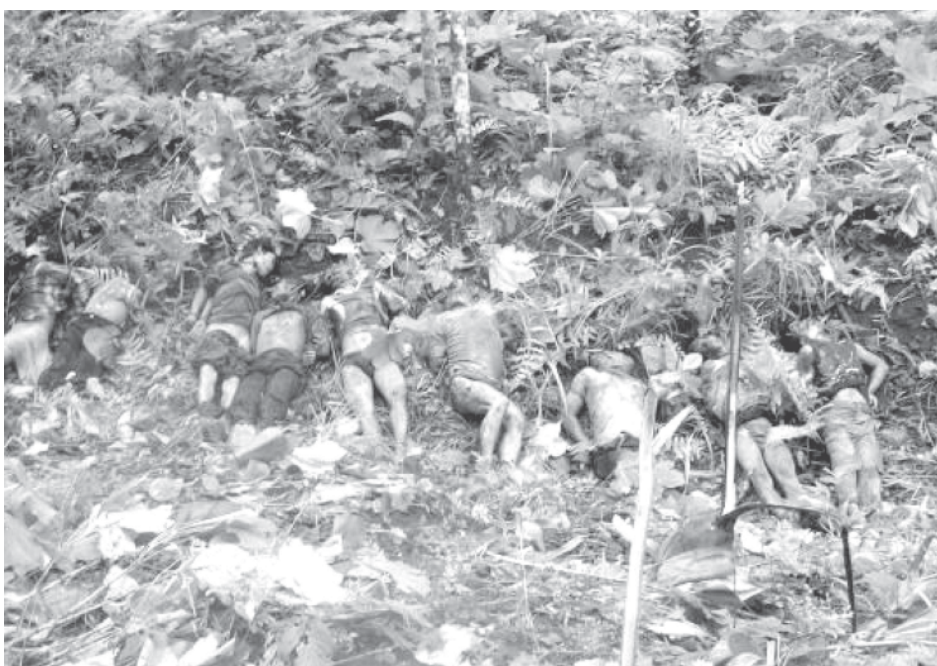
Nine bodies ferociously killed by SSA-S insurgent group.