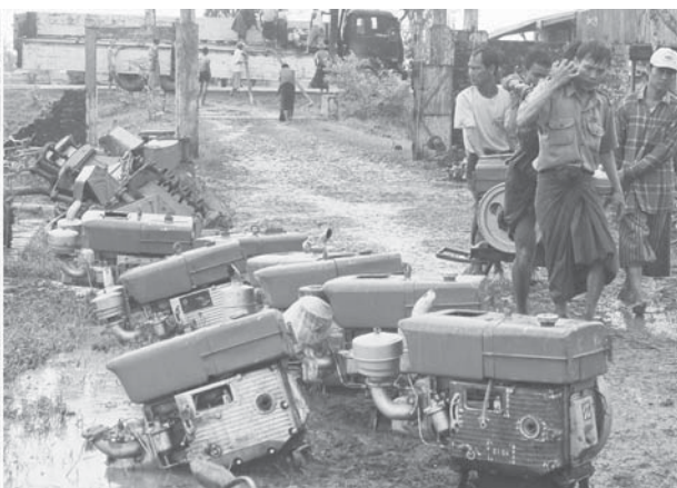
Farming equipment to be used in storm-hit villages of Dedaye Township.

the State in implementing the development plans to link the northern and the southern regions of the country as well as the eastern and the western parts of the nation.