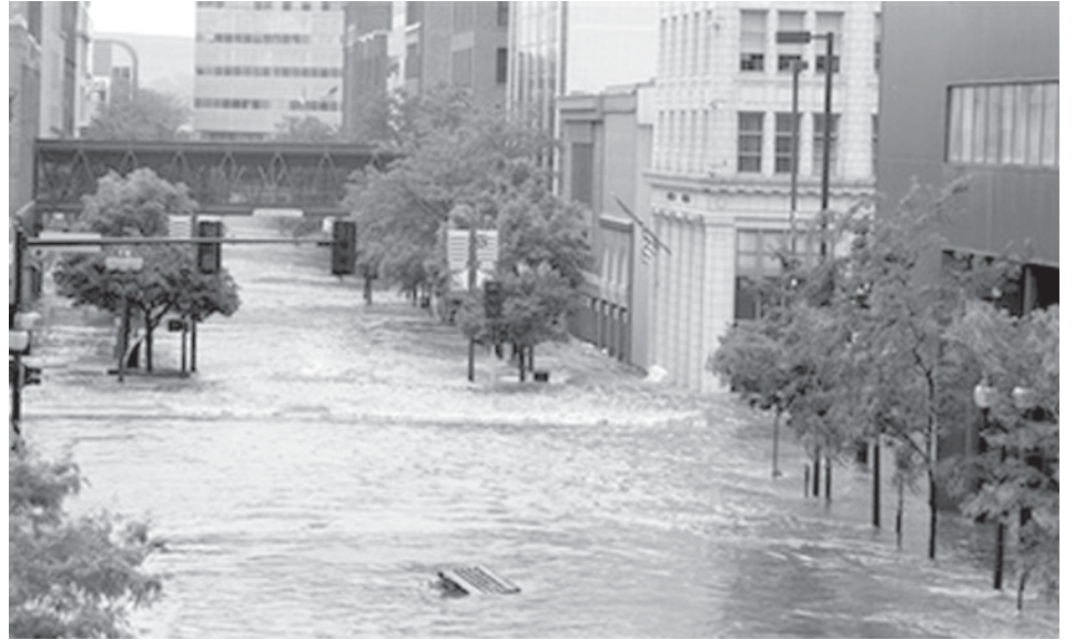
A wooden pallet floats down a flooded street on 12 June, 2008, in downtown Cedar Rapids, Iowa. Officials estimated that 100 blocks in Cedar Rapids were under water forcing the evacuation of nearly 4,000 homes and leaving cars underwater on downtown streets.