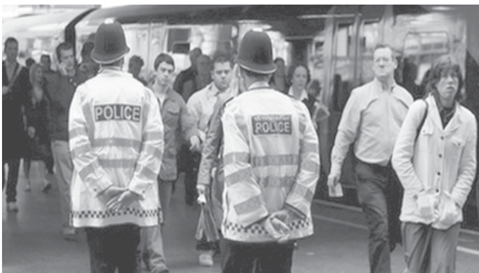
A file photo shows Police officers on patrol in London’s Waterloo Station. The government has said that a civil servant who mislaid high-level intelligence documents on Al-Qaeda and Iraq, triggering a frantic police search, was in “clear breach” of security rules.