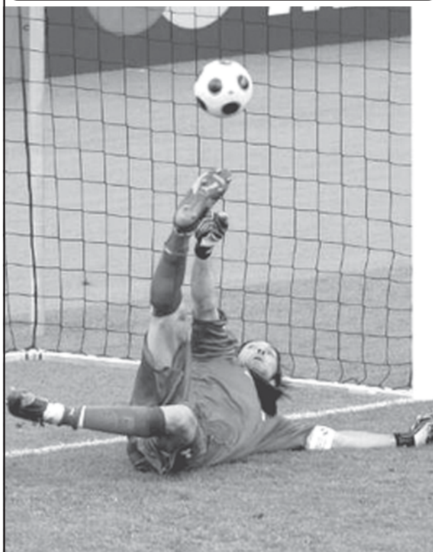
Italy’s goalkeeper Gianluigi Buffon saves a penalty from Romania’s Adrian Mutu during their Group C Euro 2008 soccer match at the Letzigrund Stadium in Zurich, on 13 June, 2008.

Italy 1 - 1 Romania Holland 4 - 1 France