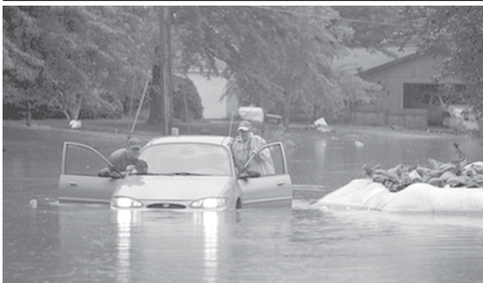
A woman, right, gets help from a man after her car stalled in a flooded street on 12 June, 2008, in Iowa City, Iowa. Thousands of people had evacuated their homes in Cedar Rapids and Iowa City and Cedar Rapids by Thursday as thunderstorms brought more heavy rain to flood-ravaged Iowa.