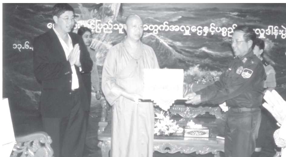
certificate of honour to the donor.

Minister for Social Welfare, Relief and Resettlement Maj-Gen MaungMaungSwe accepted the donations and presented