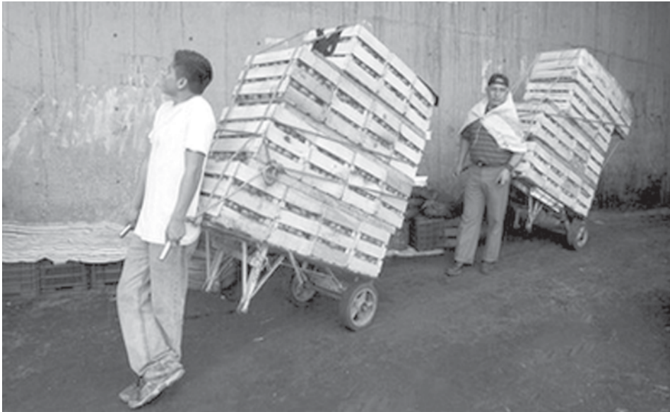
Workers stand with crates of tomatoes at the Central de Abastos market in Mexico City, on 12 June, 2008. Export-quality tomatoes labeled 'Ready to Eat' in English flooded Mexico City markets on Thursday after a salmonella scare in the US stopped them from crossing the border.