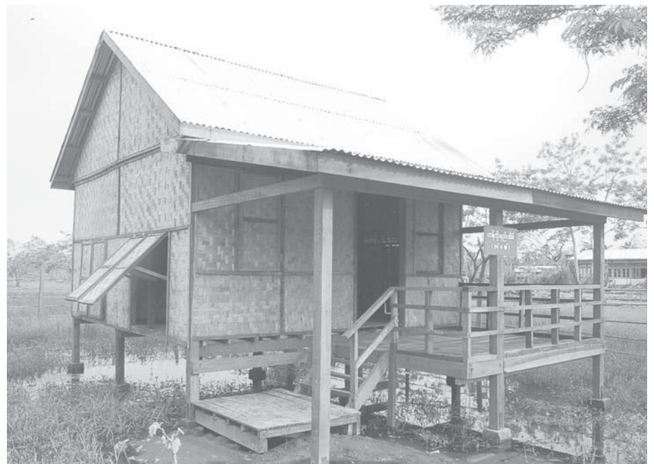
A low-cost house for storm victims in villages of Dedaye Township.

He added, "Companies of national entrepreneurs including