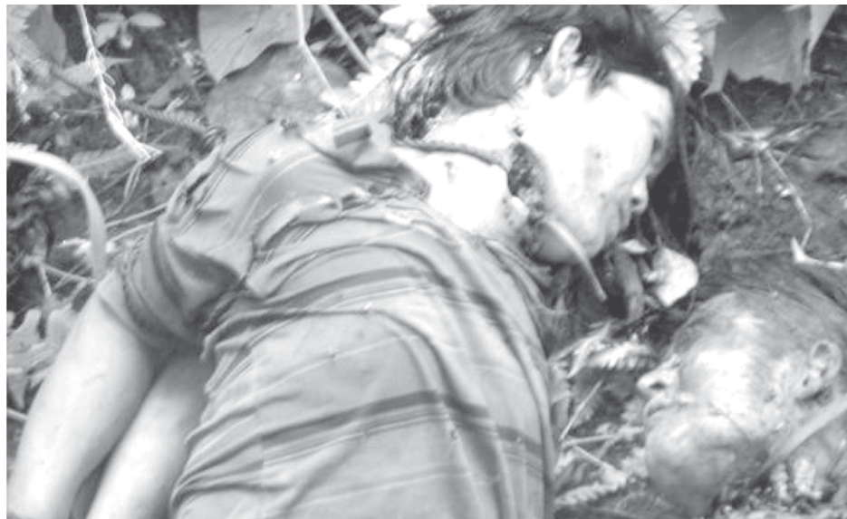
A wood cutter murdered by SSA-S insurgent group.