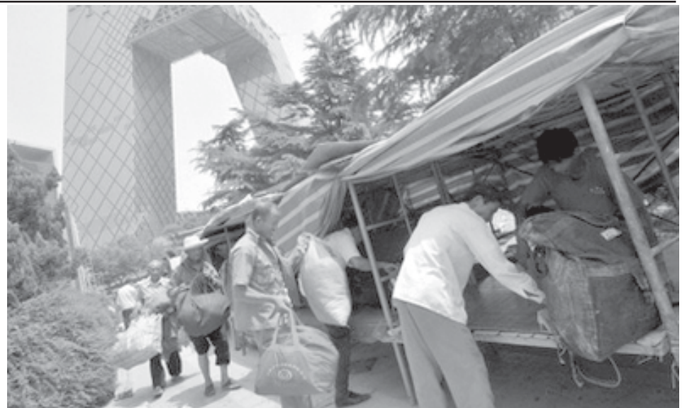
Chinese workers move into a makeshift tent near the ongoing construction of the China Central Television tower in Beijing on 11 June.