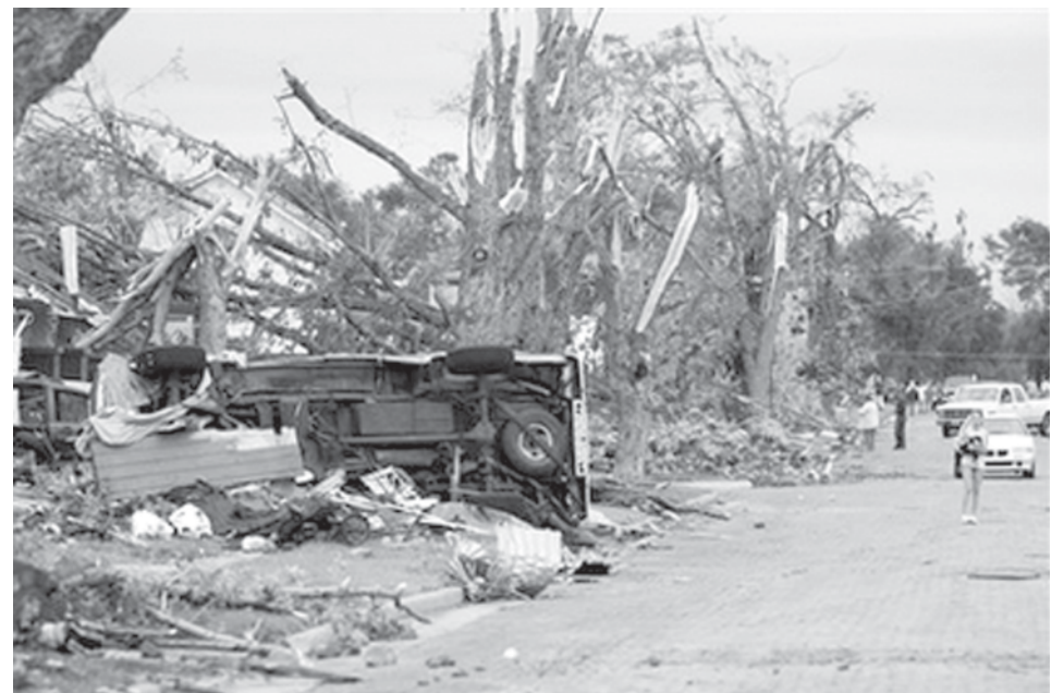
Residents look over tornado damage in Chapman, Kan, on 12 June, 2008, after the violent storm cut a six-block path through the small Kansas town on Wednesday.

The survivors, all Chilean nationals, suffered only minor injuries as the pilot had reduced the impact by crashing the plane into treetops.