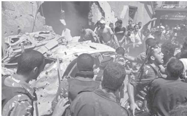
Palestinian police officers at the site where an explosion destroyed a building in the town of Beit Lahiya, northern Gaza Strip, on 12 June, 2008.

The Israeli military said nearly 50 rockets and mortar rounds were fired from Gaza following the explosion, which Hamas blamed on the Jewish state