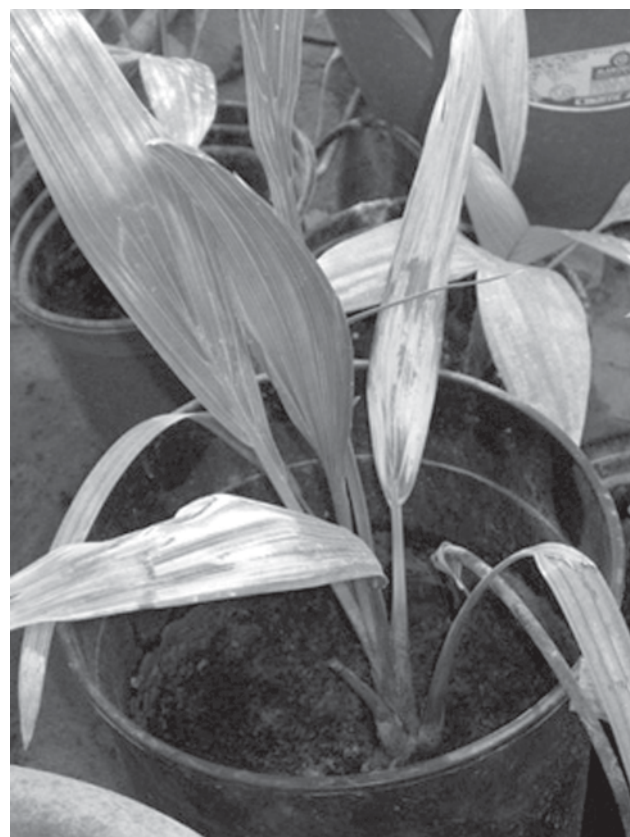
A date palm grown from a 2,000-year-old seed is seen in this undated handout photograph, made available in London on 12 June, 2008. Israeli researchers who grew a sapling from a date seed found at the ancient fortress Masada said on Thursday the seed was about 2,000 years old and may help restore a species of biblical trees.

IFC's investment included a 20-million-US-dollar equity investment and 30 million US dollars long-term loan. Morgan Stanley made the other 50