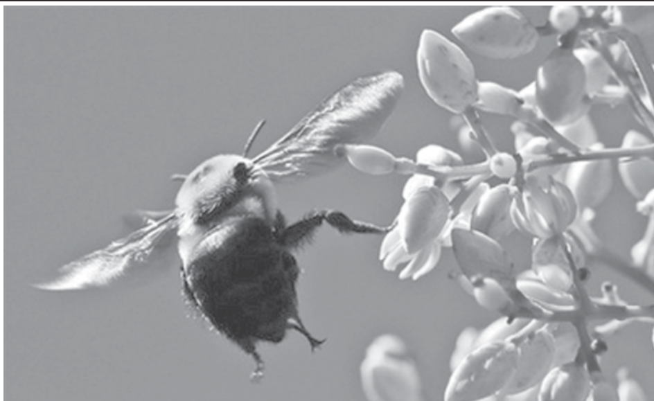
One of nature's helicopters a large bee hovers around the flowers on 12 June, 2008 in Washington.