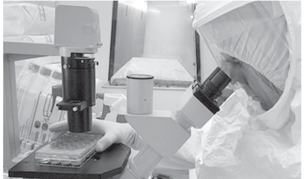
A file photo shows biologist examines cells infected with the chikungunya virus at a Marseille laboratory. EU health expert have warned that Europe could face an increase in outbreaks of diseases carried by insects and rodents — such as chikungunya fever — as the climate on the continent becomes hotter and wetter.