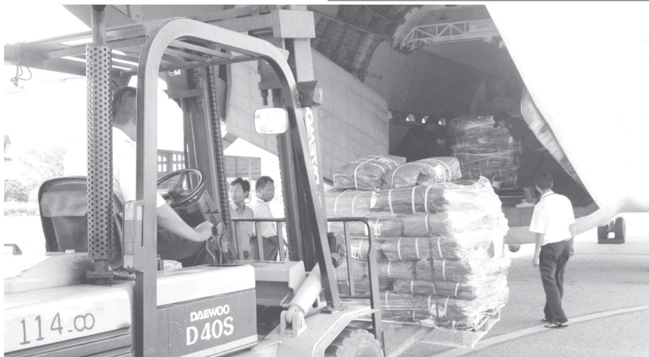
Relief aids from WFP based in Thailand arrive at Yangon International Airport.