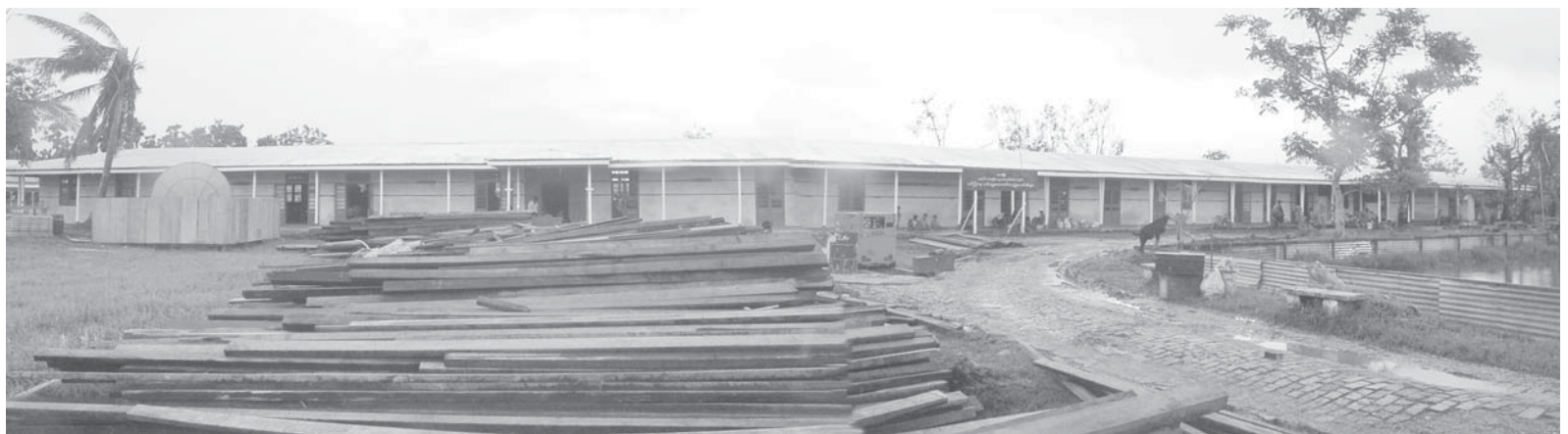
The photo shows the already-repaired No 1 Basic Education High School in Dedaye.

Translation: TTA Kyemon: 13-6-2008 *****