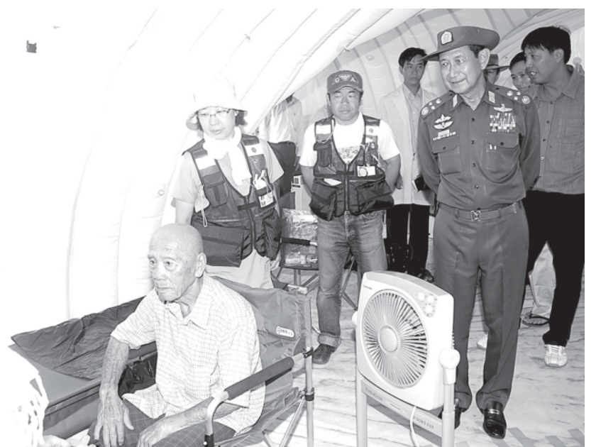
Vice-Senior General Maung Aye views providing medical care to storm survivors by Japanese relief team in Labutta Township.