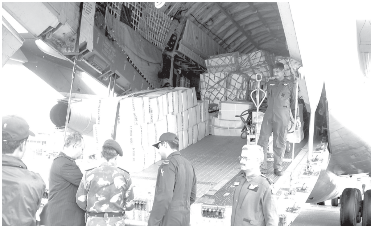
Relief aids from India arrive at Yangon International Airport.