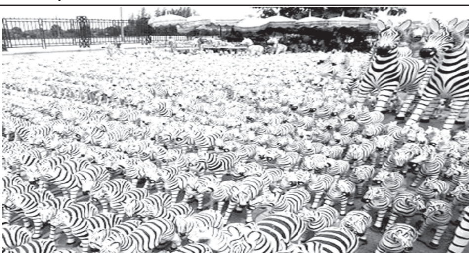
Hundreds of zebra statues are placed at a shrine in Bangkok on 4 June, 2008. Many Thais believe that the zebra is the favourite animal of the deity that resides in the shrine.

The United States has denied torturing terrorism suspects, but a Justice Department report last month cited FBI agents as warning that some CIA questioning techniques were "borderline torture".