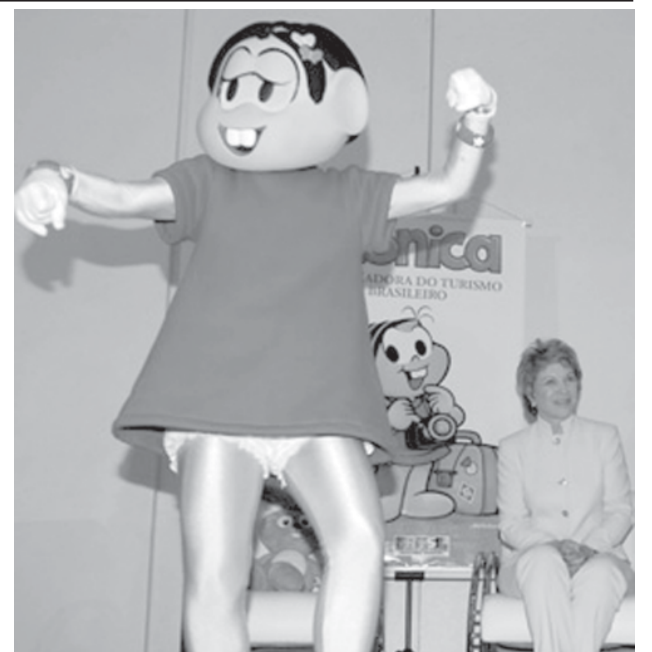
Brazilian Minister of Tourism Marta Suplicy enjoys the dancing of famous local cartoon character Monica in Brasilia, capital of Brazil, on 3 June, 2008. Brazilian Tourism Ministry decided on Tuesday to nominate the popular cartoon figure Monica family as the representative of the country's tourism.