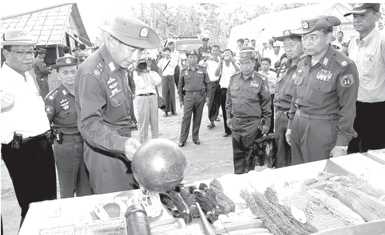
Vice-Senior General Maung Aye inspects fishing equipment to be distributed to fishermen at the 3rd-mile relief camp in Ngapudaw Township.