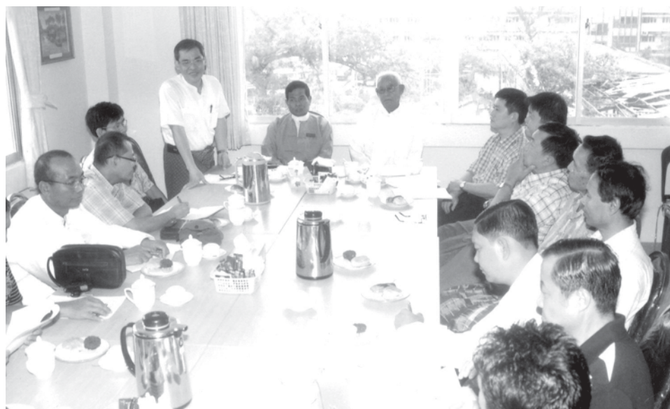
Meeting No 4/07-08 of Myanmar Gold Entrepreneurs Association in progress.

division gold entrepreneurs donated K 12.5 million to storm victims through Mandalay City Development Committee; gold entrepreneurs in Magway Division foodstuff, relief supplies and cash worth K 1 million and gold entrepreneurs in Taunggyi Township K 1.5 million to storm victims. — MNA