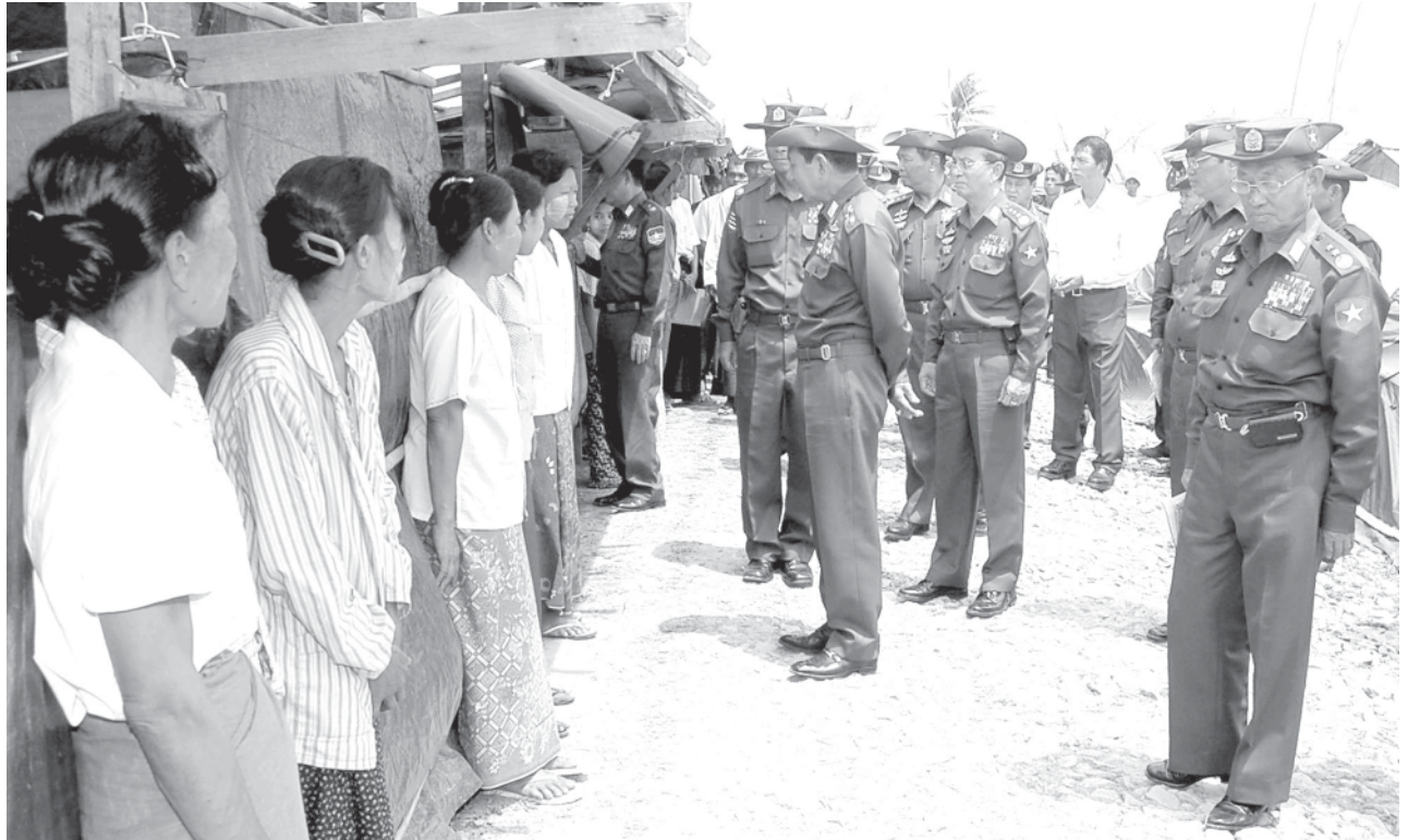
Vice-Senior General Maung Aye consoles storm victims in Pyinsalu.

Next, Vice-Senior General Maung Aye and party left Labutta for Patheingyi by helicopter. — MNA