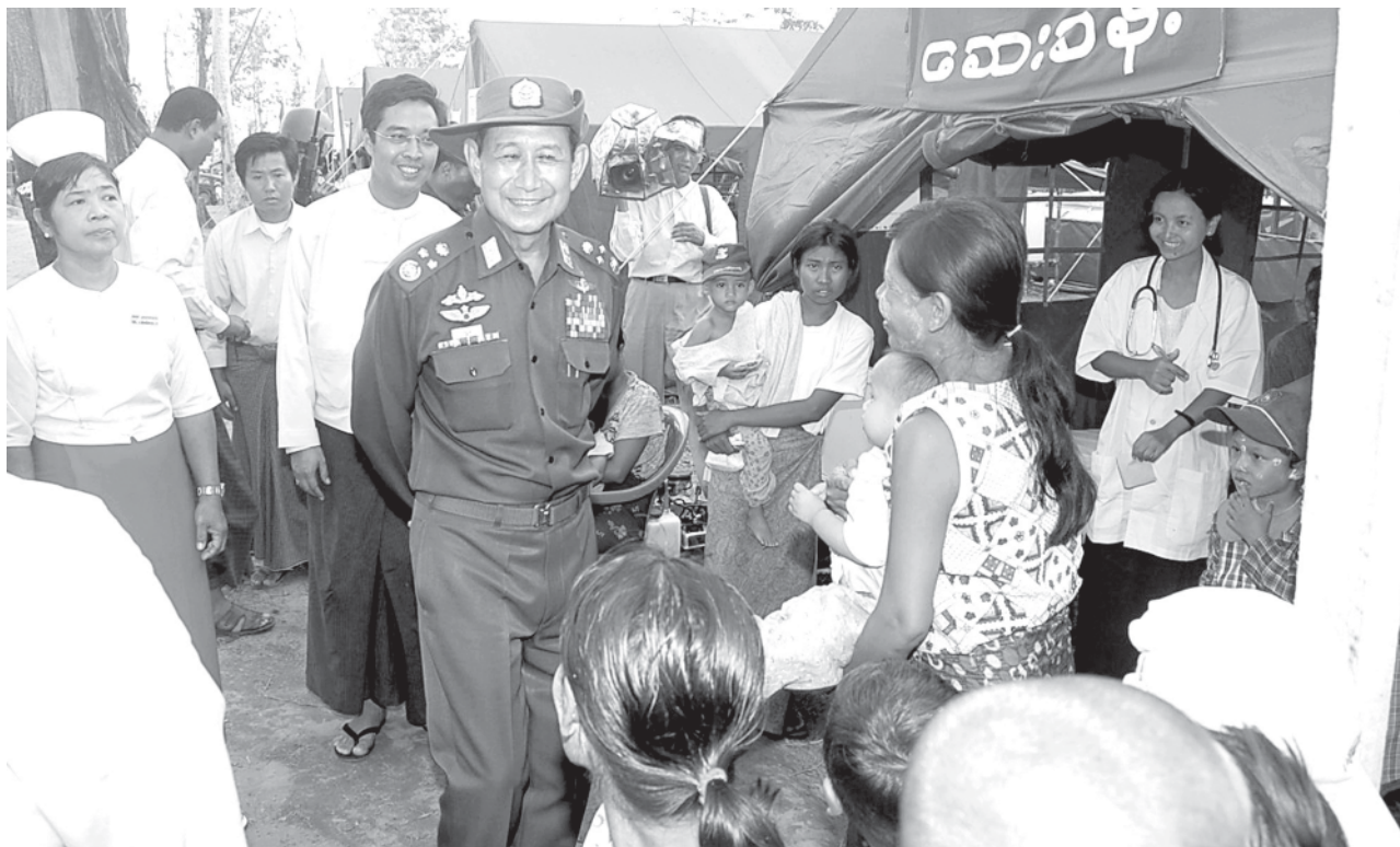
Vice-Senior General Maung Aye comforts storm victims at the 3rd mile relief camp in Labutta.

At the hall of the local station, Commodore