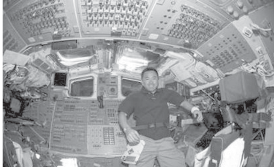
Japan Aerospace Exploration Agency (JAXA) astronaut Akihiko Hoshide, poses for a photo on the aft flight deck of Space Shuttle Discovery during flight day two activities in this photo released by NASA on 3 June, 2008.