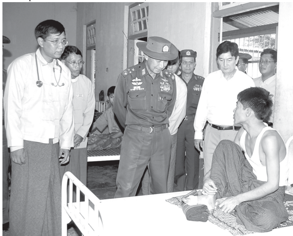
Vice-Senior General Maung Aye comforts a storm victim receiving treatment at People's Hospital in Labutta.