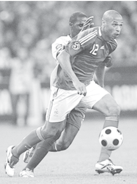
French forward Thierry Henry (R) vies with Colombian defender Cristian Zapata during their friendly football match France vs. Colombia ahead of the Euro 2008 tournament at the Stade de France in Saint-Denis, outside Paris. France won 1-0.

BEIJING, 4 June — When Ana Ivanovic hits an especially good shot, she celebrates with a combination leg-kick fist-pump, and she's doing it a lot at the French Open.