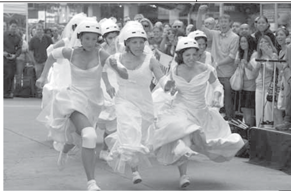
Contestants compete in the WE tv network’s “Bridezilla” contest in New York’s Times Square on 3 June, 2008. The cable channel gave away a 25,000-US dollar prize to kick off the fifth season of their “Bridezillas” series. —XINHUA