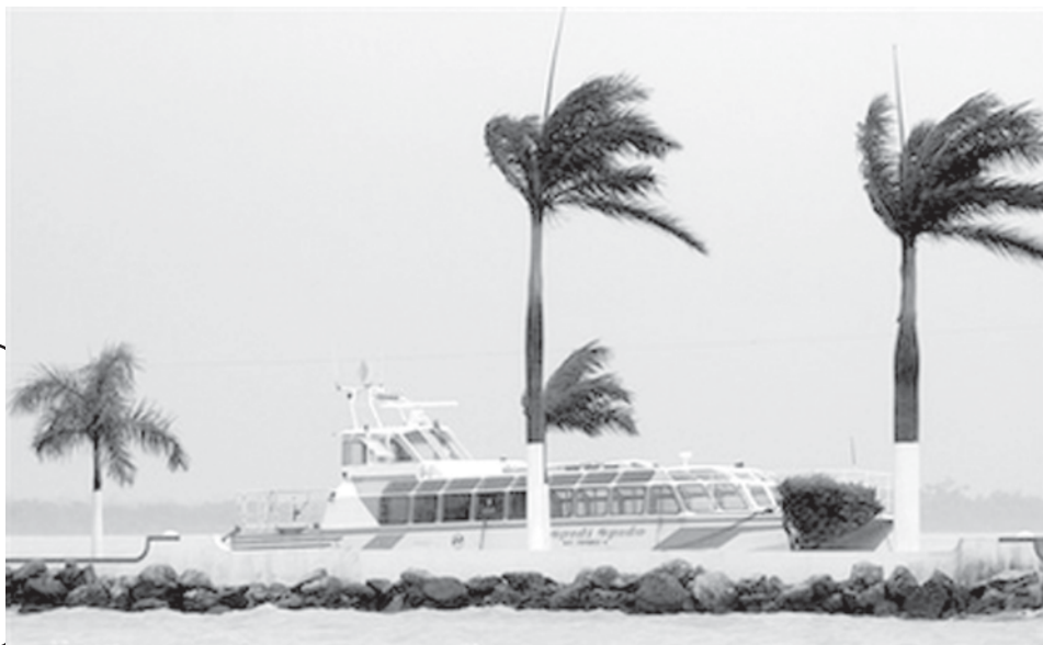
Strong winds of the tropical storm Arthur hit the Chetumal Bay, Quintana Roo, on 1 June, 2008.

LONDON, 4 June — British forensic scientists have developed a method that could be used to track fingerprints even after the print itself has been removed, the science news website of AlphaGalileo reported on Monday. The method of taking fingerprints from a crime scene, developed by forensic scientists at the Forensic Research Center at the University of Leicester and the Northamptonshire Police's scientific support unit, enables scientists to "visualize fingerprints" even after the print itself has been removed, the report said. The scientists conducted a study into the way fingerprints can corrode metal surfaces. The technique can enhance a fingerprint that has been deposited on a small calibre metal cartridge case before it is fired. MNA/Xinhua