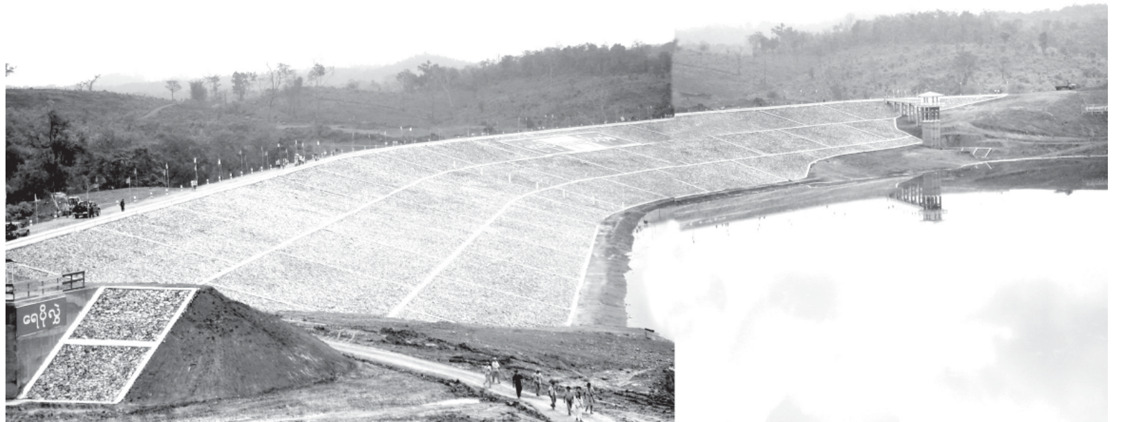
A view of Moneyin dam in Namtu Township.