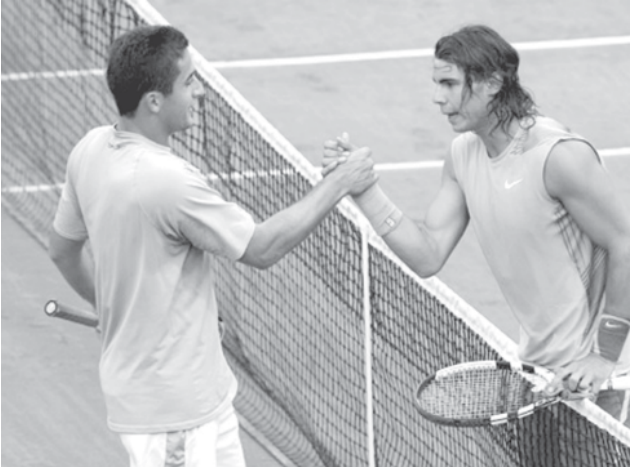
Spain's Nicolas Almagro (L) greets compatriot Rafael Nadal after their quarter-final match at the French Open tennis tournament at Roland Garros in Paris on 3 June, 2008. Nadal won 6-1, 6-1, 6-1.

BEIJING, 3 June — Jose Mourinho has been appointed coach of Inter Milan for the next three years, the Italian champion said Monday.