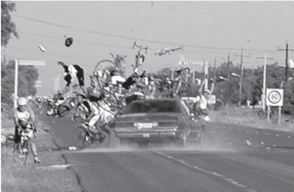
A car collides into cyclists participating in a race in Mexico's northern border city of Matamoros, recently. At least one person was killed and 14 injured when a driver slammed into a bicycle race.