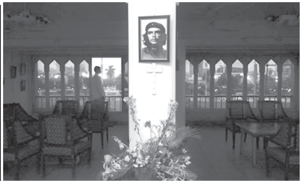
An Egyptian man watches photos at the photo exhibition of Ernesto Che Guevara held at Gallery Toot in Doqqi of Cairo, capital of Egypt, on 2 June, 2008. This exhibition was sponsored by the Embassy of Cuba with an aim of marking Guevara's 80th birthday, which falls on 14 June this year.