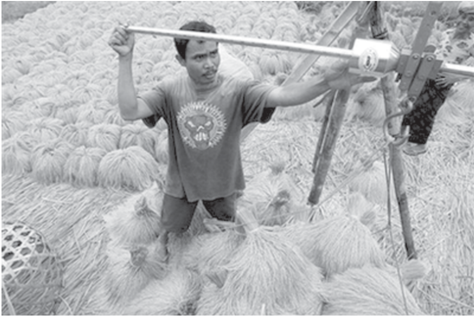
A Balinese farmer weighs rice during a harvest in Jati Luwih, Bali, Indonesia on Tuesday, 3 June, 2008. Indonesian government recently revised its 2008 budget, increasing the amount it will spend on food subsidies by 2.7 trillion rupiah, or about US$290 million. Total government spending on fuel, electricity and food subsidies this year will total US$20 billion.

barriers. He added that once the agricultural issues of the Doha Round talks are solved, it will encourage agricultural investments and expansion of new projects to improve the productive quality of the agricultural sector. The WTO negotiations are meant to lower trade barriers around the world and allow free trade among different countries. Representatives from the bloc's 21 members attended the meeting. MNA/Xinhua