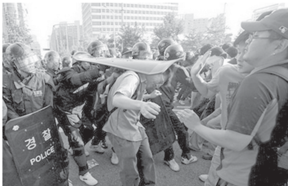
South Korean protesters clash with riot police as they protest against US beef imports recently. President Lee Myung-Bak has announced that South Korea will not accept imports of US beef from cattle more than 30 months old as he negotiates his biggest test yet since taking office 100 days ago.

"It was serious neglect of that, in spite of our warning," he told CNBC TV 18, adding that other former members of the Taleban who had given up arms were unfairly hunted down within Afghan territory.