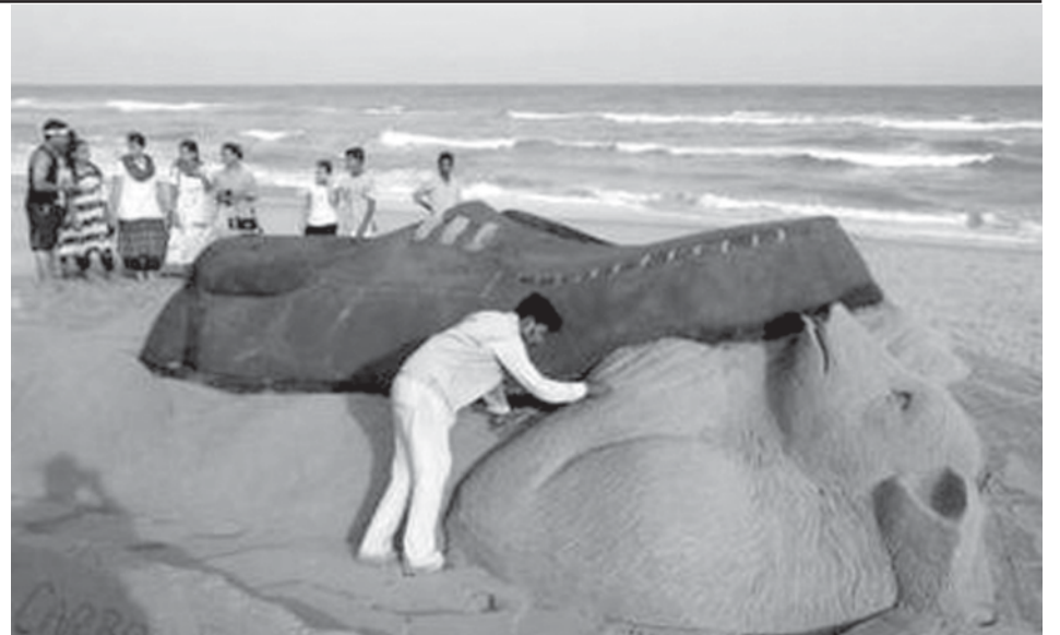
India’s sand artist Sudarshan Patnaik adds the final touches to a sand sculpture of “a polar bear being crushed by a shoe” ahead of World Environment Day on the Puri beach in the eastern state of Orissa on 3 June, 2008. The event was organized by PETA to illustrate the environmental harm caused by the leather industry, a Press release of the PETA said. —INTERNET

Patients given standard therapy alone lived on average 14 months. —MNA/Reuters