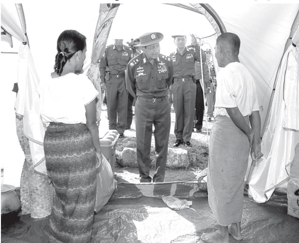
Vice-Senior General Maung Aye consoles storm victims in Ottwin relief camp in Ottwin and Phonetawpyae villages. —MNA

After hearing the reports, the Prime Minister gave necessary instructions on tasks to be carried out and fulfillment of the strength of staff to run operational functions and the meeting ended in the evening. —MNA