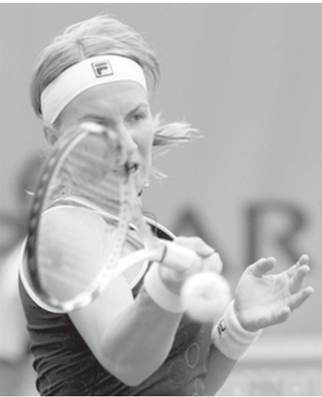
Russia's Svetlana Kuznetsova returns the ball to Belarus' Victoria Azarenka during their fourth round match of the French Open tennis tournament, on 3 June, 2008 at the Roland Garros stadium in Paris.

"At times there is a lot of pain but then the situation doesn't seem so serious. The thing that we need to know is whether or not the bone has been injured."—MNA/Reuters