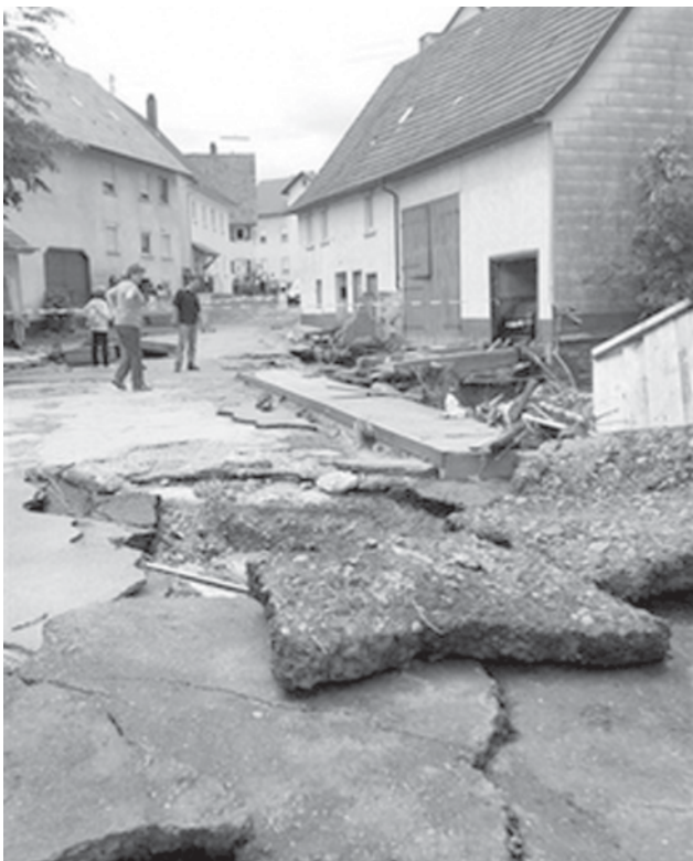
View of the damaged main street in Jungingen, southern Germany, following a thunder storm, on 3 June, 2008. Heavy rainfall hit the village and the surrounding area, three people were killed during the thunder storm.

Flooding caused by heavy rains also frequently cuts off a stretch of the airport highway, leading to massive traffic jams and flight delays.