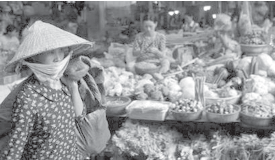
A woman walks past a vegetable stall at a market in Hanoi on 2 June, 2008. Vietnam's annual inflation accelerated to 25.2 percent in May from 21.4 percent in April, its seventh consecutive double-digit reading and one of the highest in Asia.