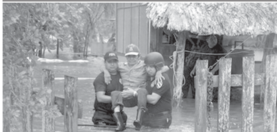
Police officials carry a man from a flooded home after Tropical Storm Arthur passed nearby in Pucte, Mexico, on 2 June, 2008. Tropical Storm Arthur weakened to a tropical depression after soaking the Yucatan Peninsula over the weekend.