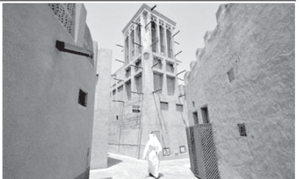
A traditional wind tower is seen on top of a building, in the old quarter of Dubai’s Bastakiya, on 15 May, 2008.