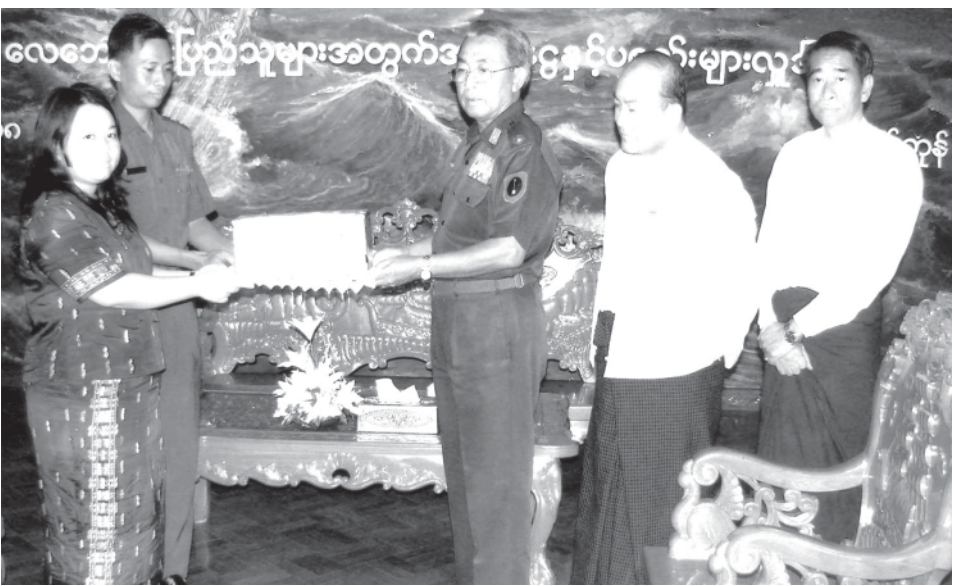
Deputy Minister Brig-Gen Kyaw Myint accepts slippers worth K 17.5 million donated by a wellwisher. — MNA

works to be done for regenerating of farming in storm-hit areas and programmes for boosting of rice production in other regions in order to save rice production decline in storm-affected areas. MNA