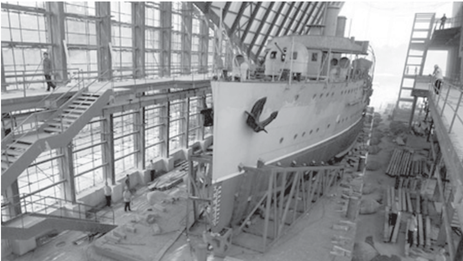
Workers vamp the inner of the Zhongshan Warship Museum with the historical cruiser “Zhongshan”, salvaged out of the Yangtze River on 28 January, 1997, well placed on its preset berth, as its relocation project passed formal appraisal, at Jinkou Town, Wuhan, capital of central China’s Hubei Province, on 26 May, 2008.