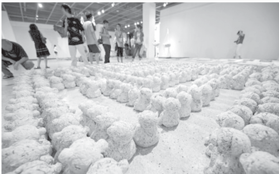
Visitors look at the a sculpted work named as Labyrinth and Enticement, among 45 pieces of sculptures by graduate and postgraduate students of China Academy of Art at their schooling conclusion year of 2008 on an exhibition at Hangzhou, east China's Zhejiang Province, on 27 May, 2008.

While rare polished diamonds achieved all-time highs per carat at sales in Geneva late last year, a much-hyped 72.22 carat "D" flawless white diamond failed to sell at a Sotheby's Hong Kong auction in April, suggesting demand for top stones may be waning due to a weakening world economy.—Internet