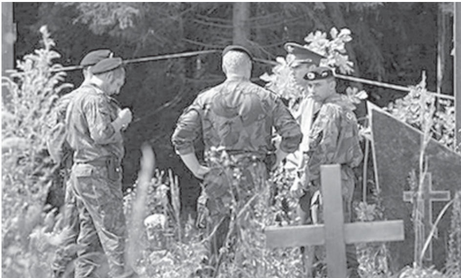
Russian policemen guard the area where a Russian An-12 cargo plane crashed in 2007, four kilometres from Domodedovo airport, outside Moscow. A cargo plane crashed as it prepared to land in the city of Chelyabinsk in the Urals region of Russia on Monday, killing all nine people aboard, a spokeswoman for the emergency situations ministry said.