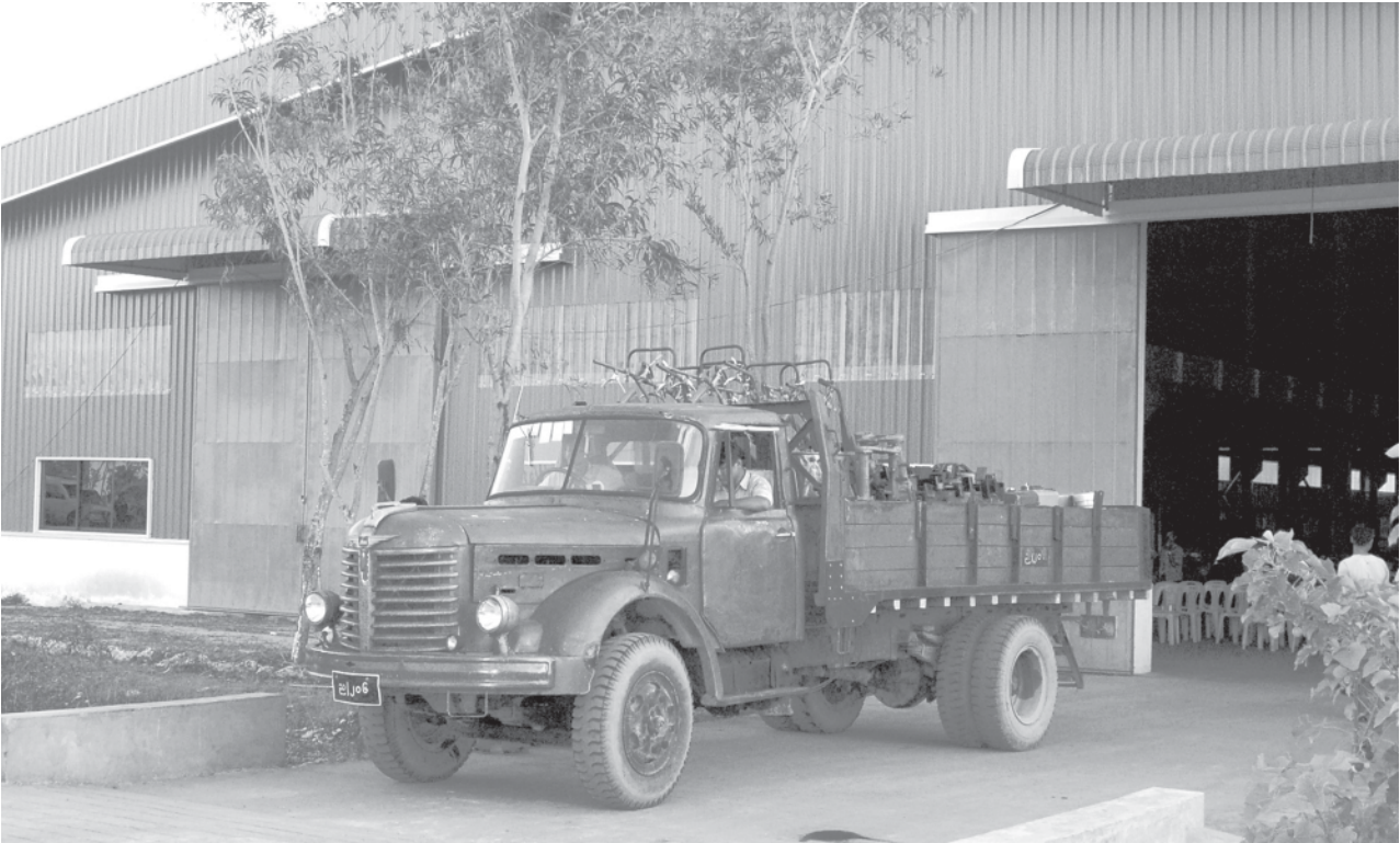
A truck is loaded with power-tillers to be sent to Ayeyawady Division. —MNA

The roof-damaged schools are also being renovated village-wise. The repair tasks have to be completed before the school season. MNA