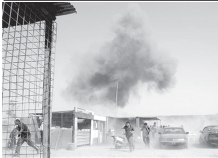
Iraqi men flee the site of a roadside bomb after it exploded, in Baghdad, Iraq, on 26 May, 2008.