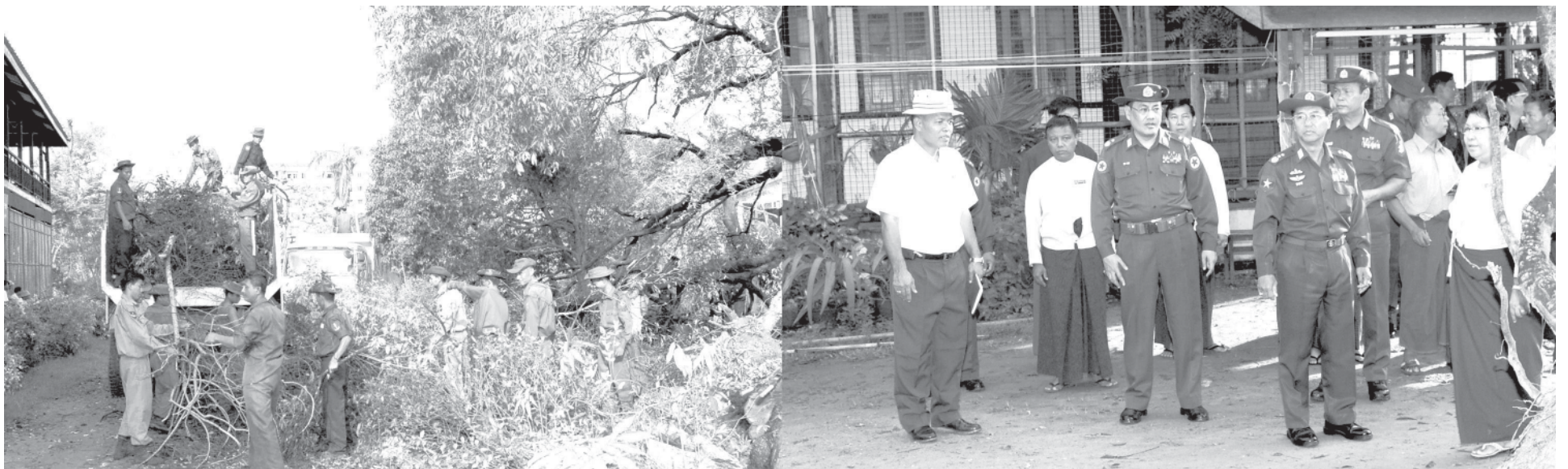
Lt-Gen Myint Swe inspects removal of fallen trees in the compound of No. 1 BEHS in Kamayut Township. — MNA

Later, Lt-Gen Myint Swe inspected clearing of debris and reconstruction of buildings in Thingangyun Township and left necessary instructions. — MNA