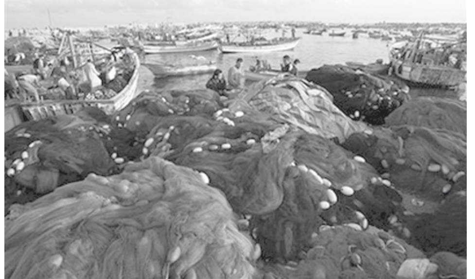
Palestinian fishermen take fish out of their nets at sunrise to Gaza City, on 26 May, 2008. Israeli Prime Minister Ehud Olmert told lawmakers Monday that Israel would not agree to open a key Gaza crossing explicitly rejecting a chief condition Hamas militants have set for any truce with Israel.—INTERNET

The 3Rs, along with biodiversity and climate change, was one of the three major themes discussed at the three-day ministerial meeting.—MNA/Xinhua