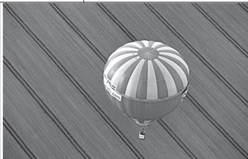
A balloon flies over a field near Hungary's biggest lake, the Balaton during the fifth hot air balloon race of five nations, Austria, Great Britain, Hungary, Poland and Slovakia around Lake Balaton.