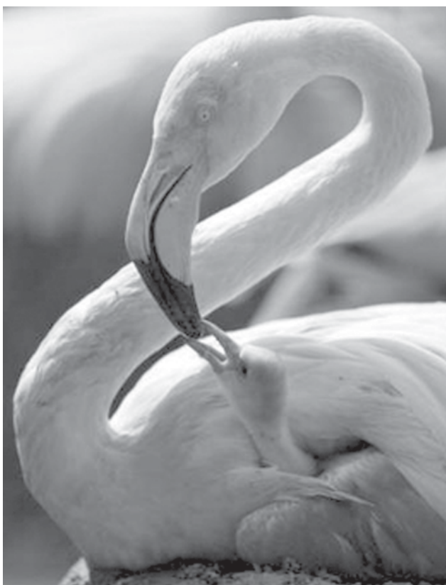
A newly born baby flamingo reaches up for its mother at the Oji zoo in Kobe, western Japan on 25 May, 2008.

Officials from the Mississippi Emergency Management Agency, the Copiah County Sheriff's Department and the Crystal Springs police are all at the scene of the wreck, it added.—Internet