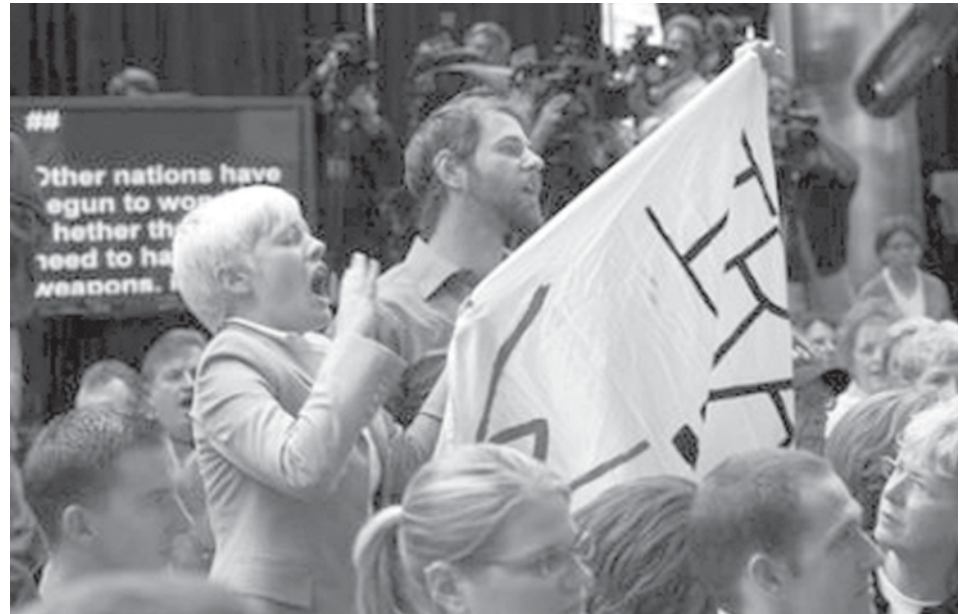
Anti-Iraq war protesters wave a banner and shout as Republican presidential candidate and Senator John McCain delivers a foreign policy speech in Denver, Colorado, on 27 May, 2008.

Since childhood obesity correlates closely with obesity in adults, the commission and other stakeholders should make fighting it their priority, said the report.—Internet