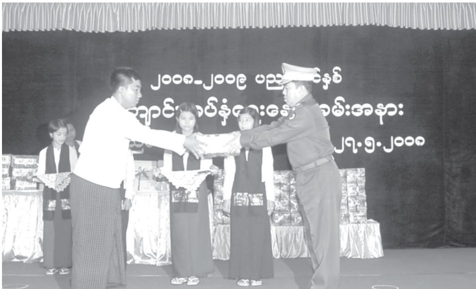
Commander Maj-Gen Wai Lwin presents stipend for students in Nay Pyi Taw Pyinmana District.

kindergarten in three townships to the respective township education officers. Deputy Minister for Education U Myo Nyunt accepted cash donations from the wellwishers and donors. Next, the commander and party inspected measures taken for school enrollment for 2008-09 academic year. MNA