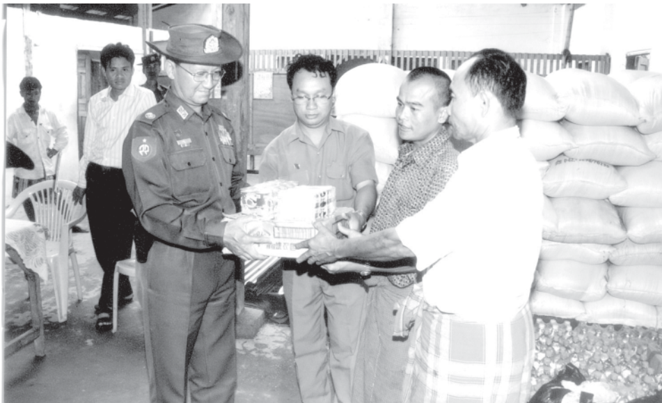
Minister Brig-Gen Thura Aye Myint presents relief supplies to storm survivors in Yekyaw Village in Kawhmu Township.

At Kyaikhtaw BEHS, the minister held a meeting with responsible persons from the company, local authorities, officials of the station hospital and school heads of one BEHS and seven BEPSs, and they