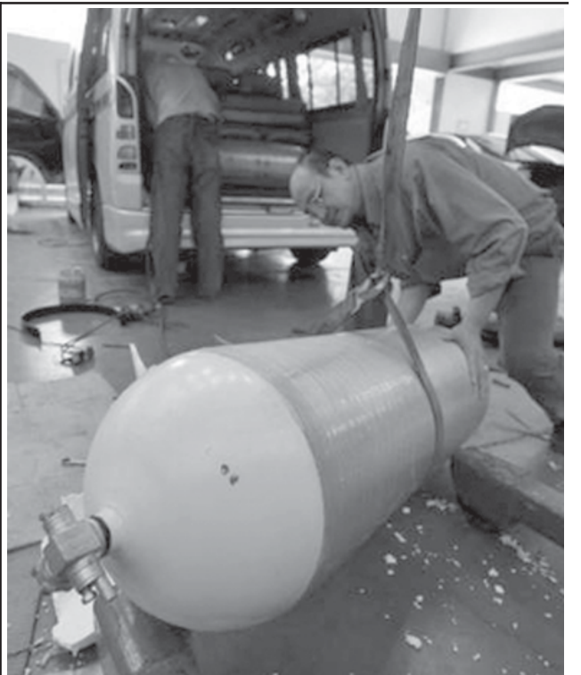
A mechanic installs a bottle of compressed natural gas into a vehicle at a garage in Bangkok on 27 May, 2008.

in Hanzhong immediately after the tremor and ordered residents in neighboring counties to be evacuated from dilapidated houses or buildings with cracks.