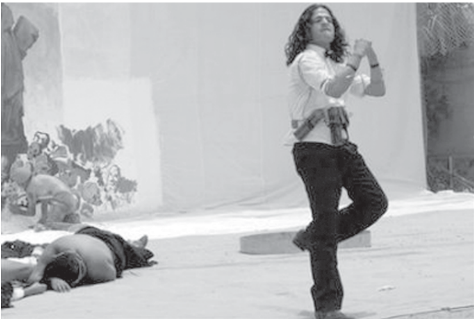
A student plays the role of a suicide bomber during an outdoor pantomime play in Baghdad, on 25 May, 2008. Fine arts students from Baghdad University took part in a play about the security situation in Iraq before an audience in Baghdad.