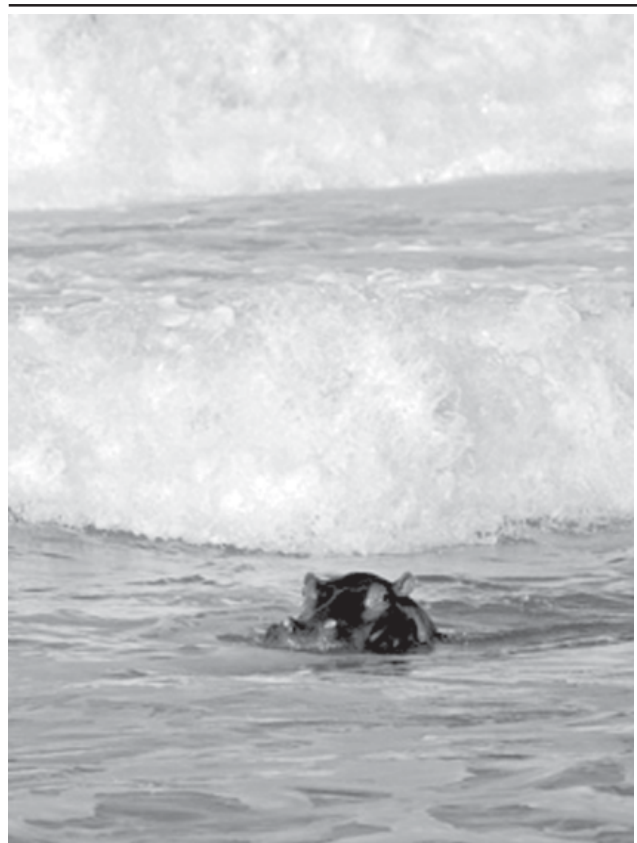
A hippo swims in the surf at Thompsons Bay, about 50 km (31 miles) from Durban, 27 May, 2008. It is thought that the lone young male hippo has wandered from its habitat in Richards Bay.