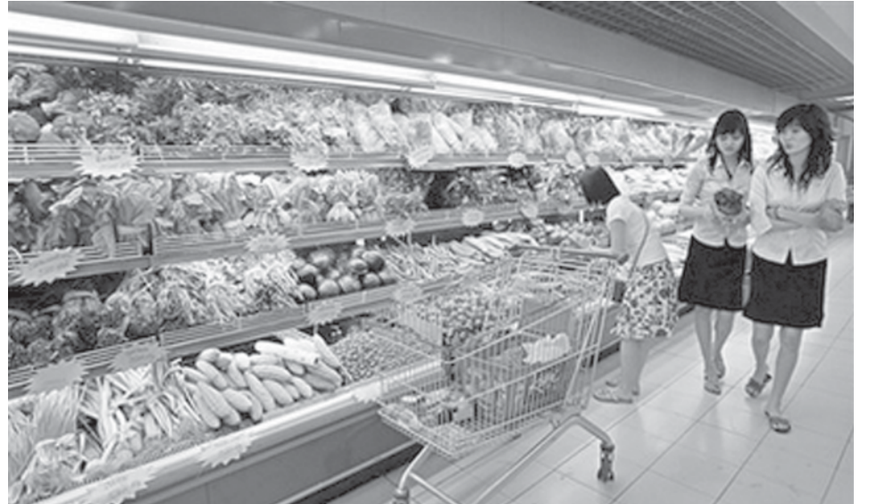
Shoppers pick up vegetables in a supermarket in Hanoi, Vietnam, on 27 May, 2008. Rising food and construction costs drove Vietnam’s inflation rate to 25 percent in May, the highest rate in more than a decade.—INTERNET

Ferdi Tanoni, who leads a working group on the offshore exploration in the West Timor Sea, urged the government to order Inpex Masela to begin exploiting the gas deposits for immediate benefits.—Internet