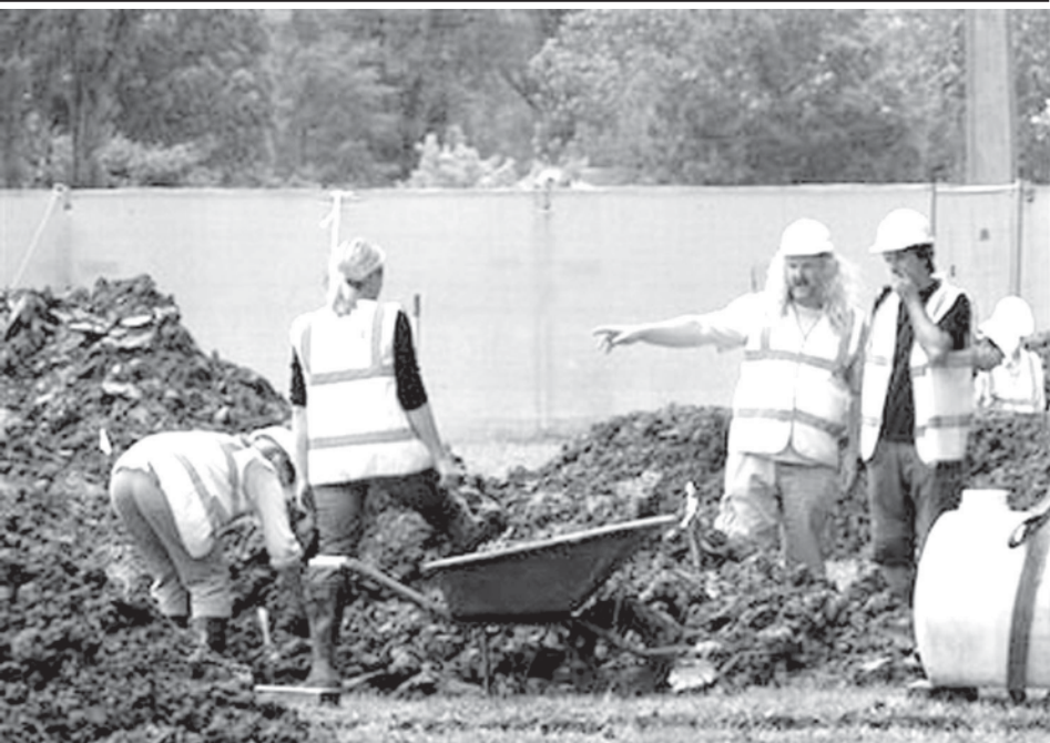
A team of Australian archaeologists are seen working in an excavation site in Fromelle, northern France, Wednesday, May 28, 2008, the scene of a World War I battlefield.