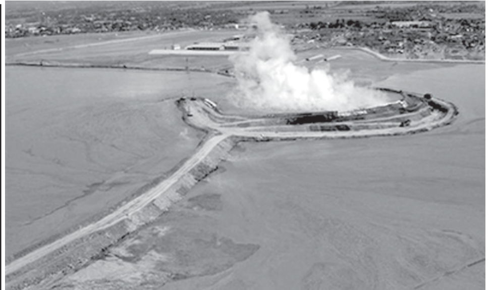
Gas flows from the crater surrounded by hot mud in Porong, Sidoarjo district. An Indonesian "mud volcano" that has oozed sludge for two years is collapsing under its own weight, worsening an environmental disaster that has displaced thousands, a study said on 28 May 2008.