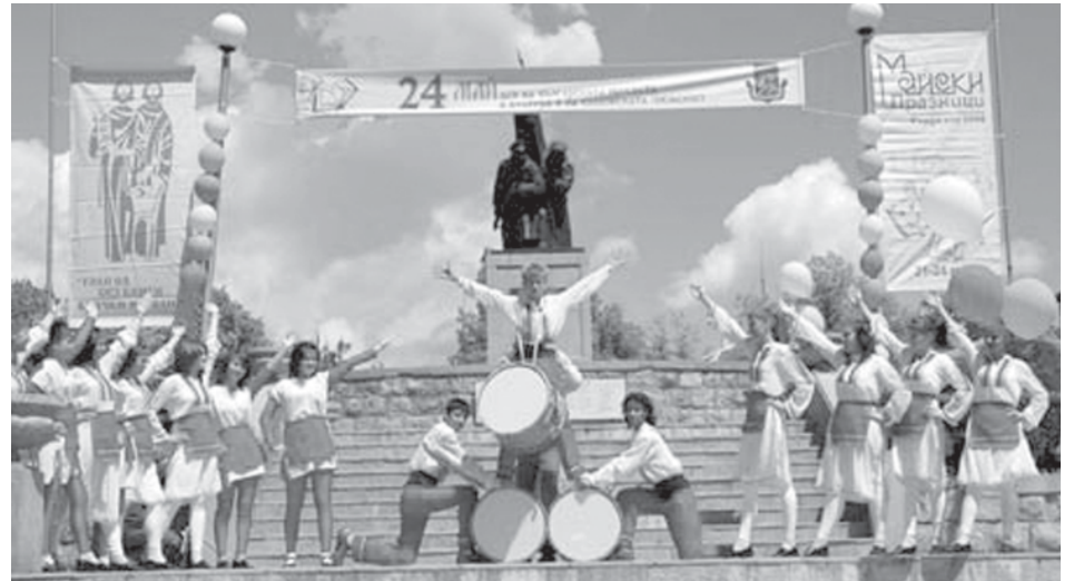
Bulgarian students dance during a celebration to mark the Day of Bulgarian Education, Culture and Slavic Letters in Kurdzhali, Bulgaria, on 25 May, 2008.

Farmers burn mock-ups of US import beef during a rally against South Korea-US FTA talks and US beef imports near the National Assembly in Seoul, on 22 May, 2008.