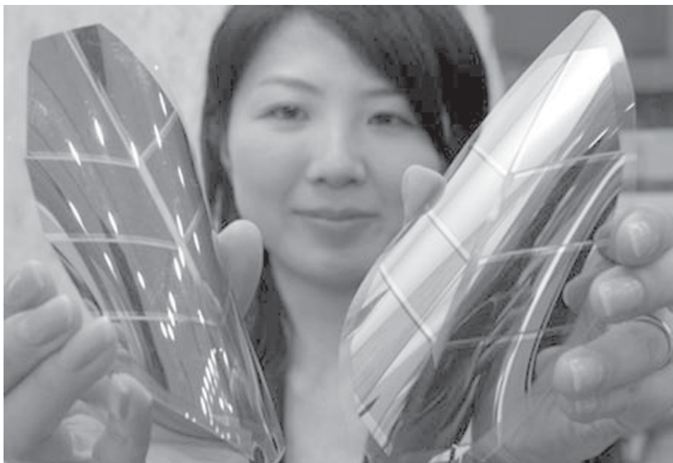
A woman displays a prototype leaf-shaped green coloured flexible organic solar cell modules, jointly developed by Japan's Advanced Industrial Science and Technology (AIST), Tokki Corporation and Mitsubishi Corporation, at the Environment Fair in Kobe, western Japan on 25 May, 2008 during the G8 Environment Ministers Meeting.