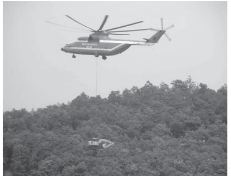
A Mig-26 helicopter swings an excavator to the barrier lake in Tangjiashan, Beichuan County, southwest China's Sichuan Province, on 26 May, 2008.