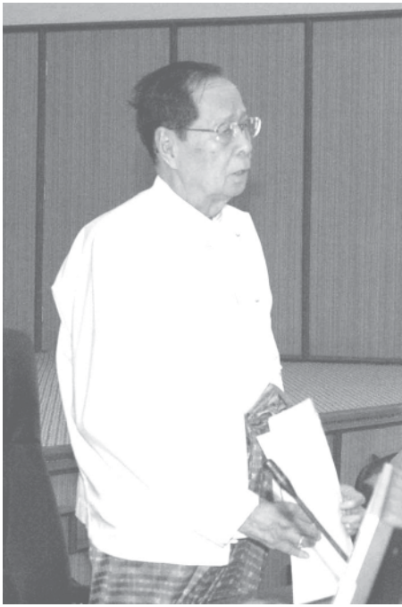
Chief Justice U Aung Toe addresses the meeting of Commission for holding Referendum (10/2008). MNA

NAY PYI TAW, 26 May—The meeting (10/2008) of Commission for Holding Referendum for approval of draft constitution of the Republic of the Union of Myanmar was held at the meeting hall of the Commission for Holding Referendum at Building No 22 here this morning.