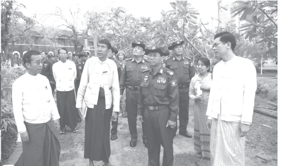
Lt-Gen Myint Swe of Ministry of Defence inspects repairing of roof of No. 1 BEHS in Lanmadaw Township.—MNA

YANGON, 26 May — Lt-Gen Myint Swe of the Ministry of Defence yesterday inspected clearing of fallen trees and reconstruction of buildings ravaged by the storm.