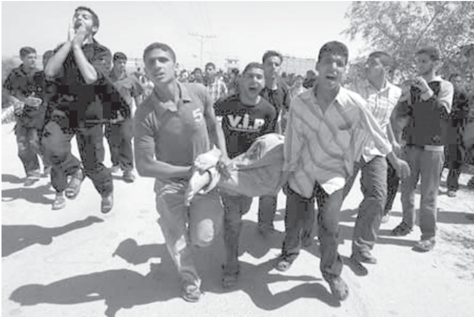
Palestinian supporters of Hamas evacuate a boy wounded by Israeli fire during a demonstration near Karni crossing in eastern Gaza city, on 22 May, 2008.