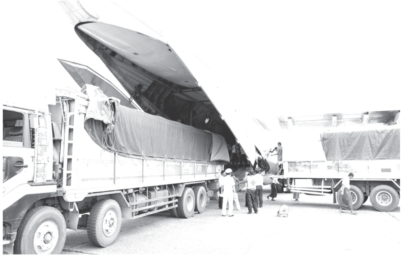
Relief supplies of IFRC based in Malaysia arrive Yangon International Airport.