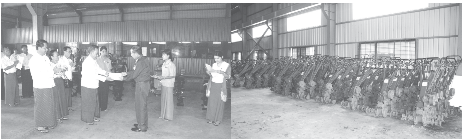
Minister for Social Welfare, Relief and Resettlement Maj-Gen Maung Maung Swe accepts power tillers donated by USDA.—MNA

CEC member of the Union Solidarity and Development Association Deputy Minister for Religious Affairs Brig-Gen Thura Aung Ko accepted the donation.—MNA