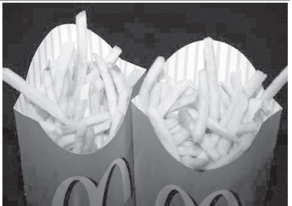
A large order of McDonald's french fries are shown on 22 May, 2008. McDonald's has switched to cooking oils free of trans fats in all of its restaurants in the United States and Canada, Chief Executive Jim Skinner said on Thursday.—XINHUA

New Prime Minister Silvio Berlusconi has made the crisis a top priority and passed a decree this week allowing new landfill sites and making them military zones, to dissuade protests. —MNA/Reuters