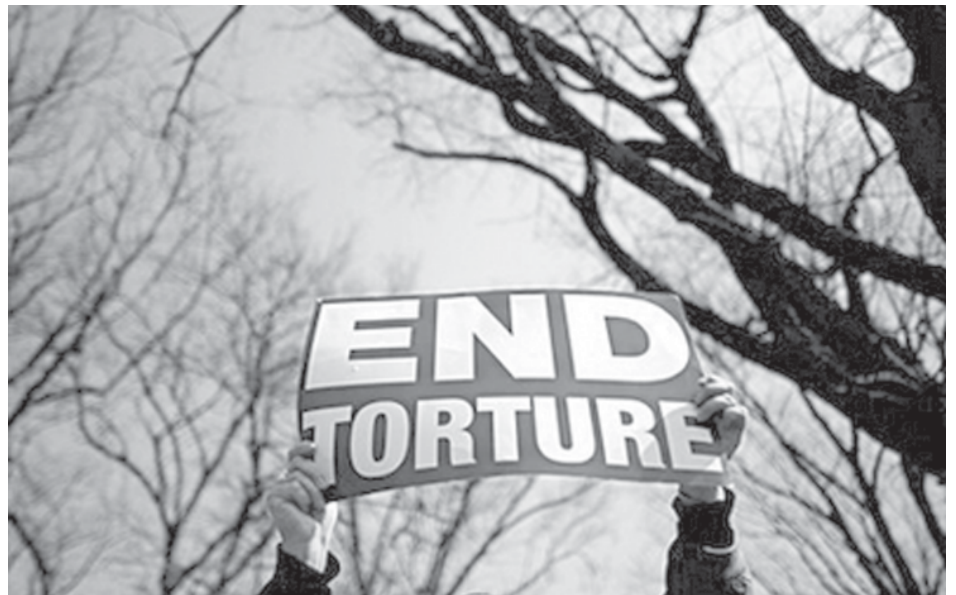
A protester attends a rally to "demand Congressional action to stop torture" on Capitol Hill, in March 2008 in Washington, DC. Former US president Jimmy Carter on Sunday called on the next leader of the United States to publicly vow that his country would never again torture prisoners.