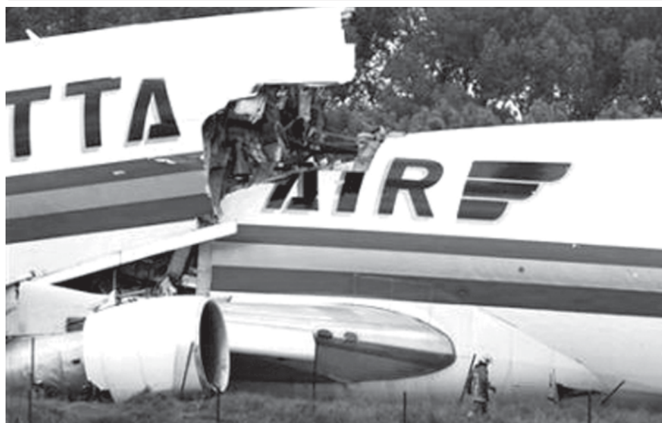
A view of a cargo plane of the American company Kalitta Air which slid off the runway at the Brussels Zaventem airport on 25 May, 2008. The plane broke in two on Sunday but there were no casualties, Zaventem police said.

Parliament Speaker and opposition leader Nabih Berri announced at the parliamentary headquarters that “Michel Suleiman got 118 votes and I declare him president of Lebanon”. — MNA/Xinhua