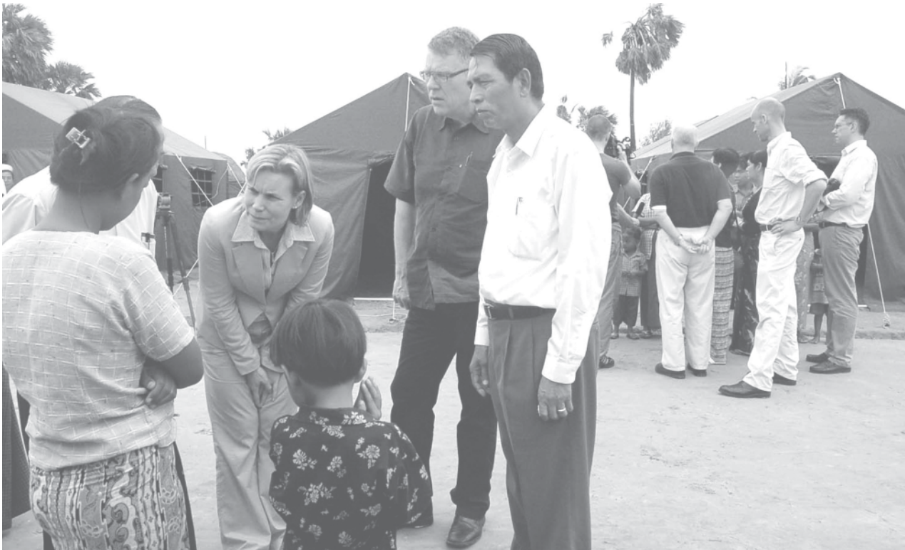
Minister U Soe Tha and Ms Gunilla Carlsson, Minister for International Development and Cooperation of Sweden, console victims at a relief camp in Dedaye. (News on page 16)