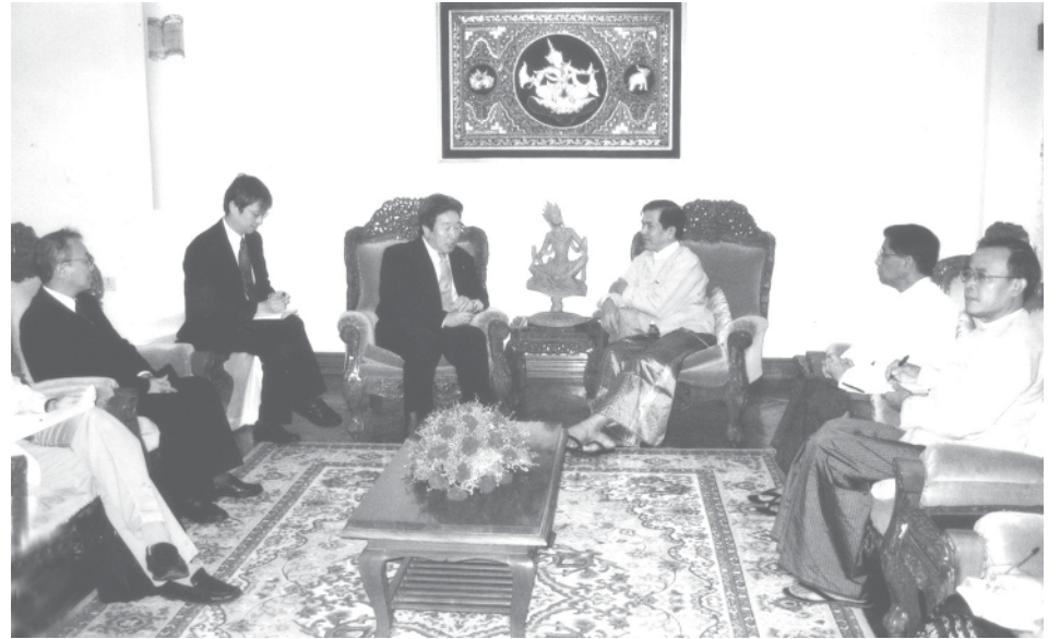
Minister U Nyan Win meeting with Mr Osamo Uno, Japanese Parliamentary Secretary for Foreign Affairs and party. —FOREIGN AFFAIRS