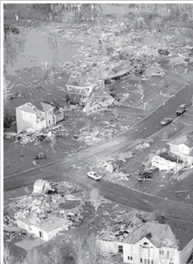
A path of destruction is seen after a severe storm swept through Hugo, Minn on 25 May 2008. —XINHUA

Meanwhile, a man was killed and a woman injured when lightning hit their house at the same time in the same district. —Xinhua