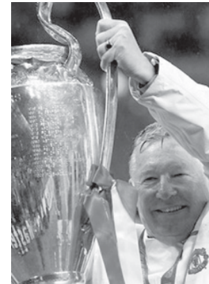
Sir Alex Ferguson

here when I'm 70. No, never. I can assure you of that," Ferguson said.