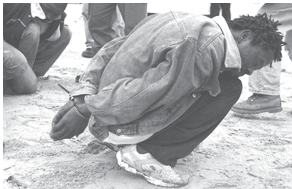
A handcuffed man kneels after the police arrested him in Cape Town. The death toll from two weeks of anti-immigrant violence in South Africa rose to 50 as concerns mounted for an estimated 35,000 people who have been displaced by the backlash.—INTERNET

By keeping on its grip on Gaza Strip, Hamas “boosts the Israeli pretexts to keep Rafah crossing closed,” Abed Rabbo said, stressing that all the pretexts must be removed to lift the siege on Gaza Strip. — MNA/Xinhua