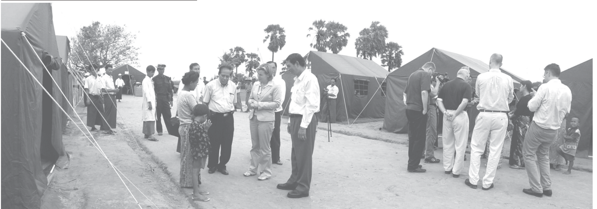
Minister U Soe Tha and Ms Gunilla Carlsson, Minister for International Development and Cooperation of Sweden, chat with storm victims at a relief camp in Dedaye.—MNA

They also inspected storm-hit Kungyangon and Twante Townships by helicopter and came back to Yangon.—MNA