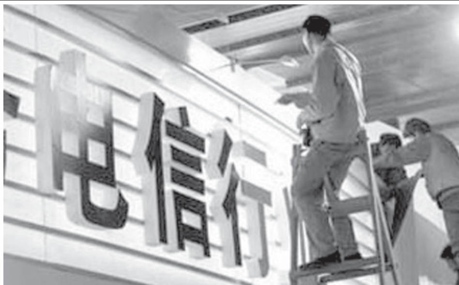
China Saturday announced plans to push forward the reshuffle of its telecommunications industry which will split its smaller mobile operator and give its mobile business to two fixed-line operators.