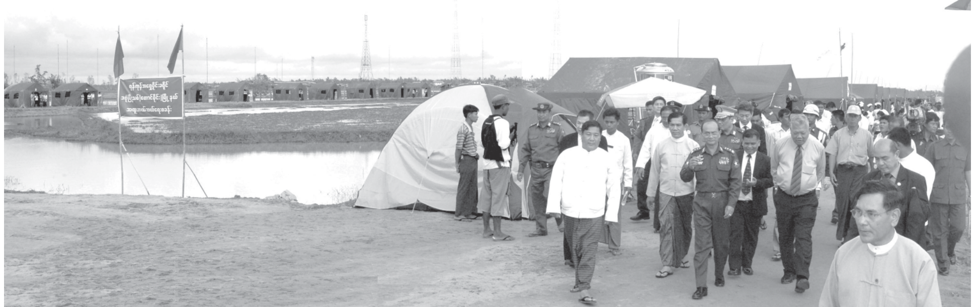
Prime Minister General Thein Sein and Mr Samak Sundaravej, Prime Minister of Thailand, visit a relief camp in Dagon Myothit (South).—MNA

Emergence of the State Constitution is the duty of all citizens of Myanmar Naing-Ngan.