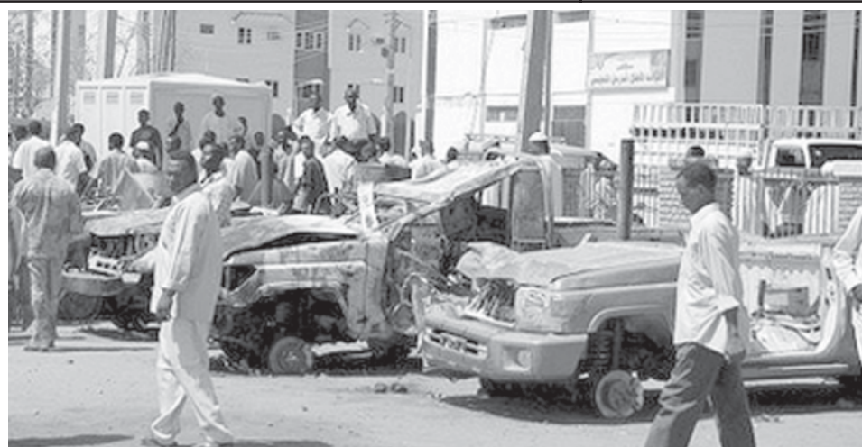
Sudanese men walk past wrecked vehicles at the site of fierce fighting between Darfuri rebels and Sudanese government forces in Khartoum's twin city of Omdurman. Sudan pressed its hunt for a Darfur rebel leader on Tuesday during attack on Khartoum left nearly 100 soldiers dead and brought the conflict to the government's doorstep for the first time.