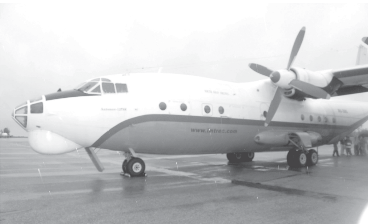
AN-12 aircraft carrying medicines donated by UNICEF at Yangon International Airport.

Minister Maj-Gen Maung Maung Swe discussed relief and resettlement tasks being implemented for the victims and future tasks, and left for Patheingyi by helicopter. — MNA