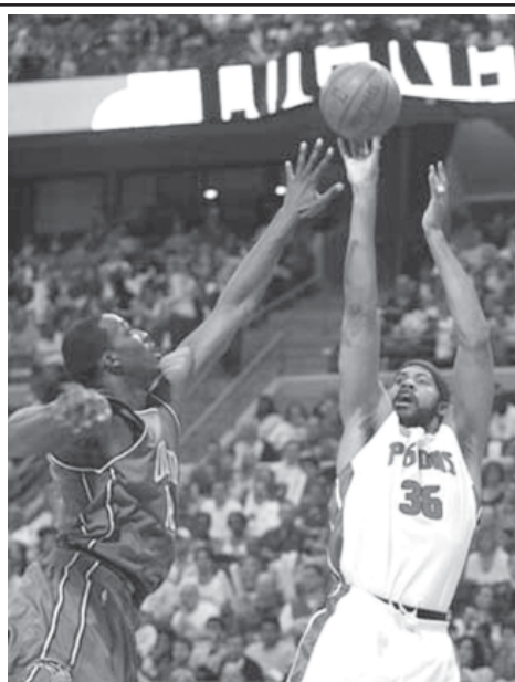
Detroit Pistons' Rasheed Wallace (R) shoots over Orlando Magic's Dwight Howard in the second quarter during Game 5 of their NBA Eastern Conference basketball series in Auburn Hills, Michigan on 13 May, 2008.