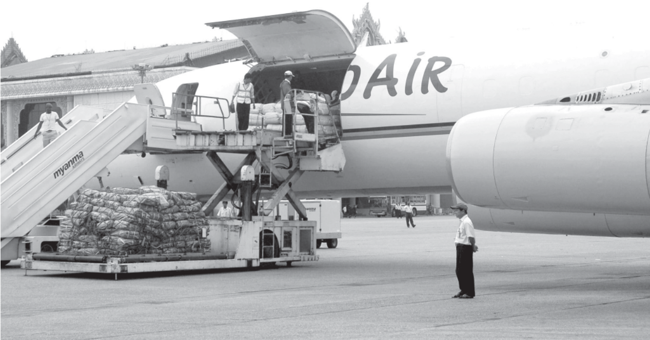
Relief supplies donated by Swiss-based Doctors Without Borders arrive at Yangon International Airport.

The relief aid from abroad has been sent to the storm-hit areas by helicopter, by vehicle and by watercraft.