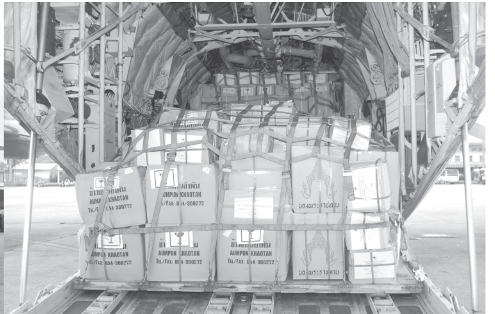
Relief items donated by Thai Prince Maha Vajiralongkorn seen at Yangon International Airport.