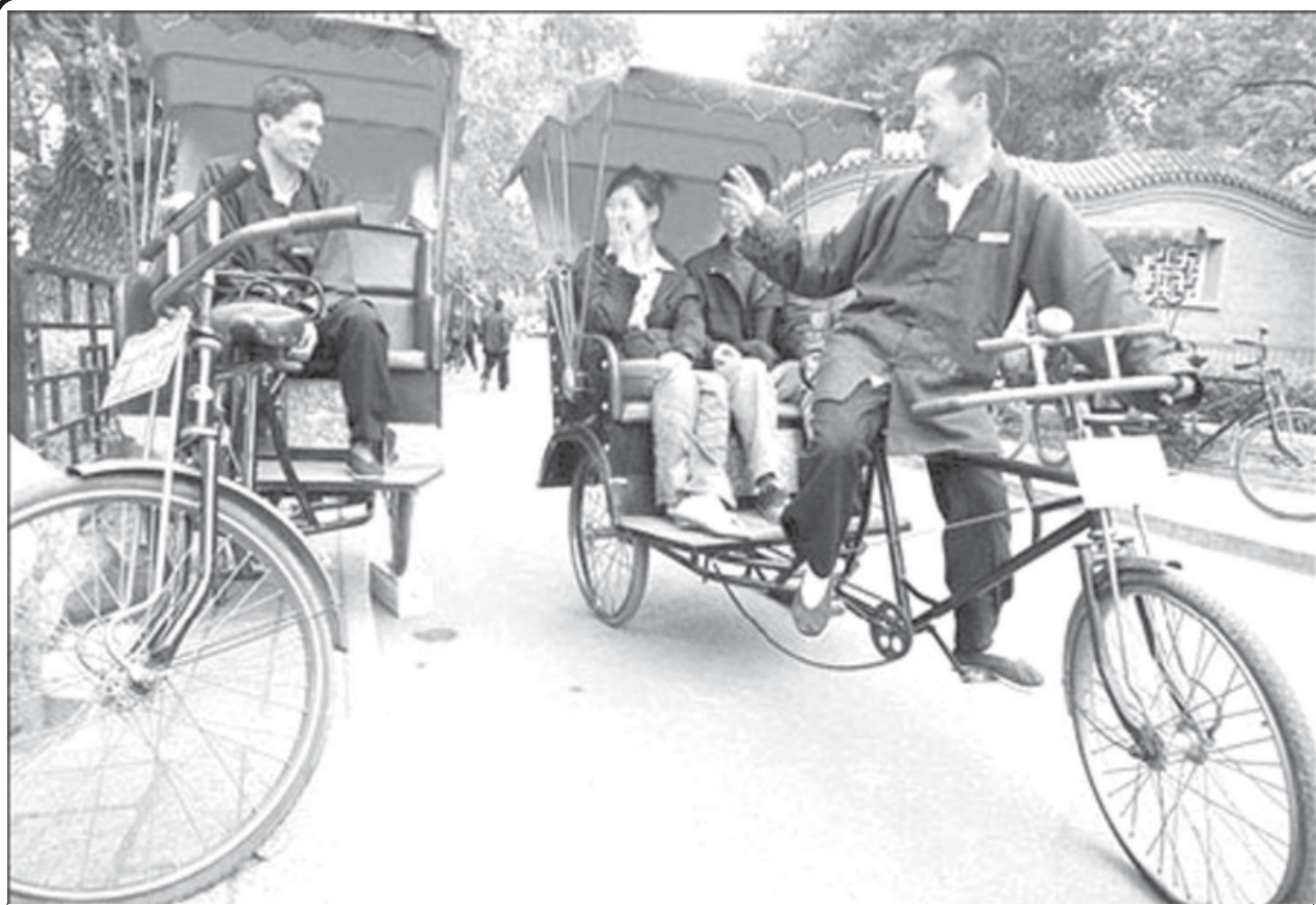
One of Beijing's new team of official pedicab drivers waves to a colleague, as he takes his passengers on a hutong tour near Shichahai Lake on Monday.