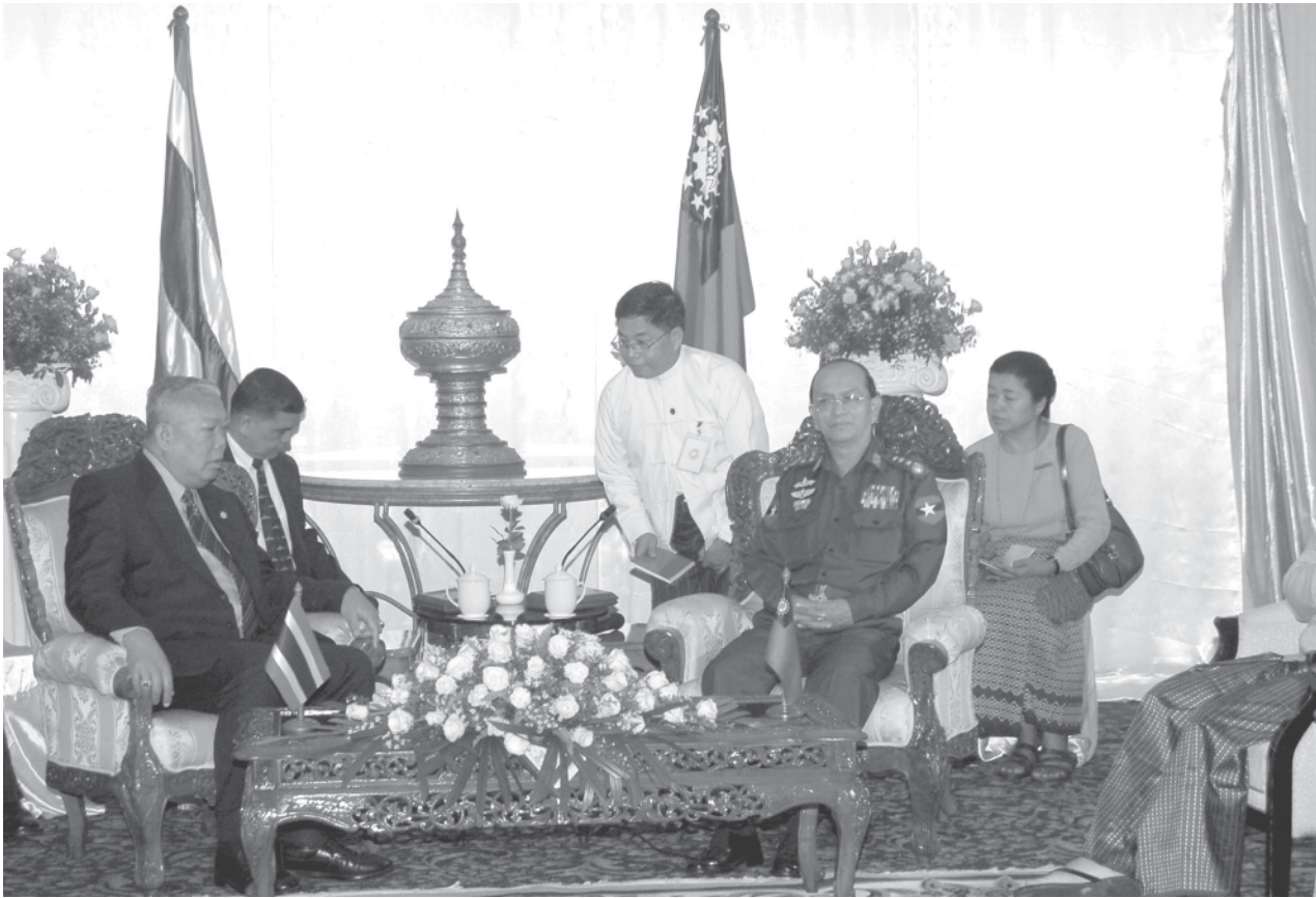
Prime Minister General Thein Sein meets Thai Prime Minister Mr Samak Sundaravej at Sedona Hotel.—MNA