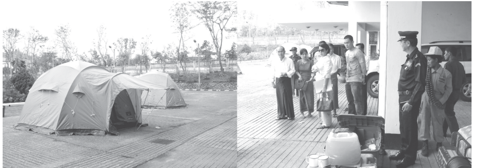
Officials of Fire Services Department view demonstration for setting up of tents.—MNA

Division. One shelter box holds ten people and includes blankets, mosquito nets, stove and instant foods.—MNA