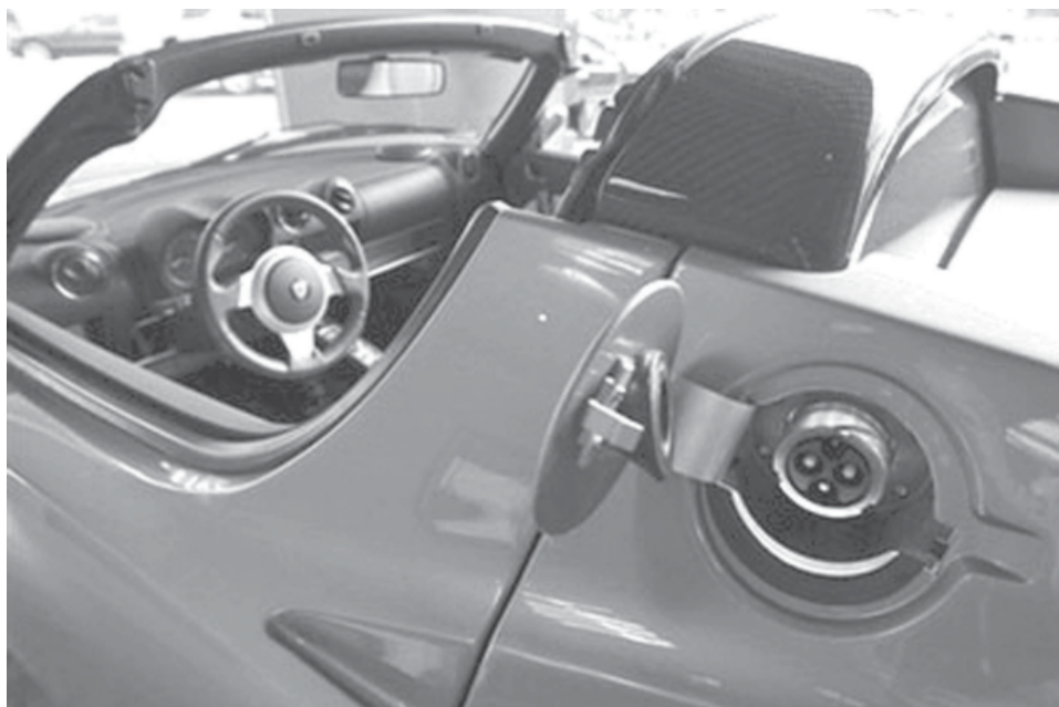
The Tesla Roadster electric car sits in a showroom in Los Angeles.

Dutch woman Tirza Mol rows her gondola, the Netherlands' only one, through the canals of central Amsterdam, on 9 May, 2008, where it is raising eyebrows as fine weather sees the Dutch take to the water. Mol spent four months observing master gondola builders in Venice before returning to the Netherlands to make her own boat.