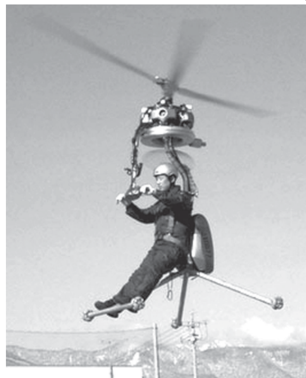
World's smallest one-man helicopter, GEN H-4, is seen here flying in the city of Matsumoto, Nagano prefecture, central Japan. It will soon take flight in the birthplace of Leonardo da Vinci, who is credited with having first thought of a vertical-flight machine, according to its developer.