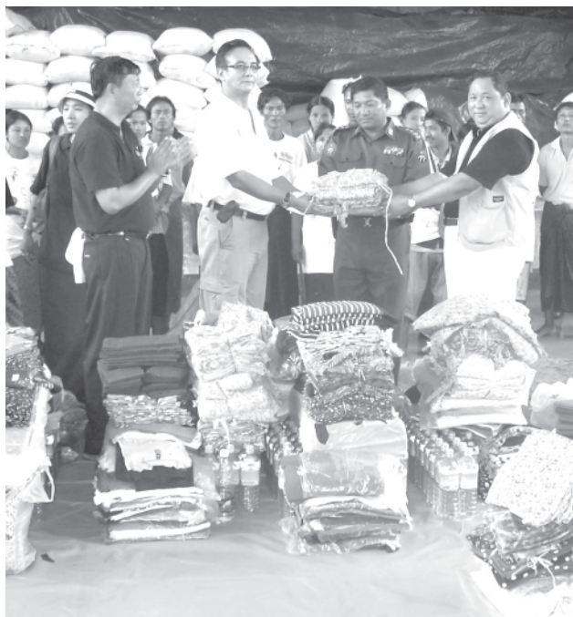
Officials of IBTC & Group of Co Ltd distribute relief aids to storm survivors in Kawhmu, Kungyangon and Letkhokkon.—MNA