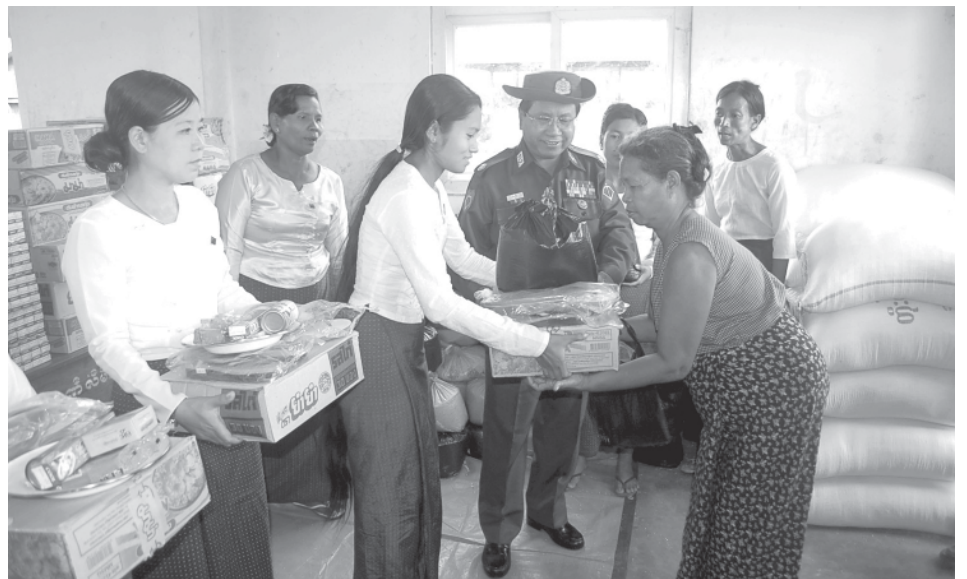
wishers to each household by hand.

Next, the minister presented supplies including rice, dry noodle and tinned fish donated by the State and well-