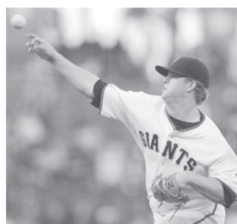
San Francisco Giants' Matt Cain works against the Houston Astros during the first inning of a baseball game on 13 May, 2008, in San Francisco.