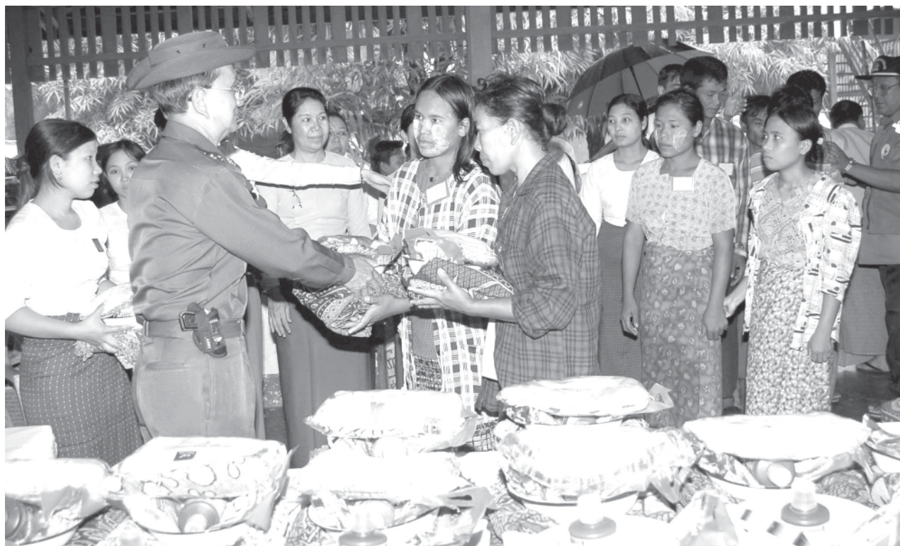
Prime Minister General Thein Sein presents relief aids donated by MAAF to storm victims at relief camp.