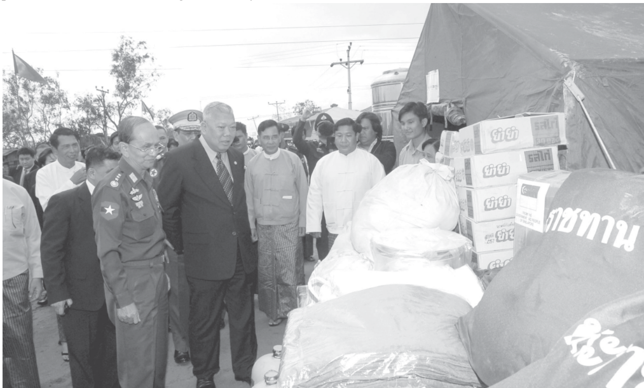
Prime Minister General Thein Sein and Thai Prime Minister Mr Samak Sundaravej visit a relief camp in Dagon Myothit (South).—MNA

After that, the Thai Prime Minister greeted the children watching a video in the camp. And then, the Thai Prime Minister asked the victims about the situation of accommodation and distribution of relief. Finally, the Thai Prime Minister said goodbye to Prime Minister General Thein Sein and left Dagon Myothit (South) for Yangon International Airport to return home.