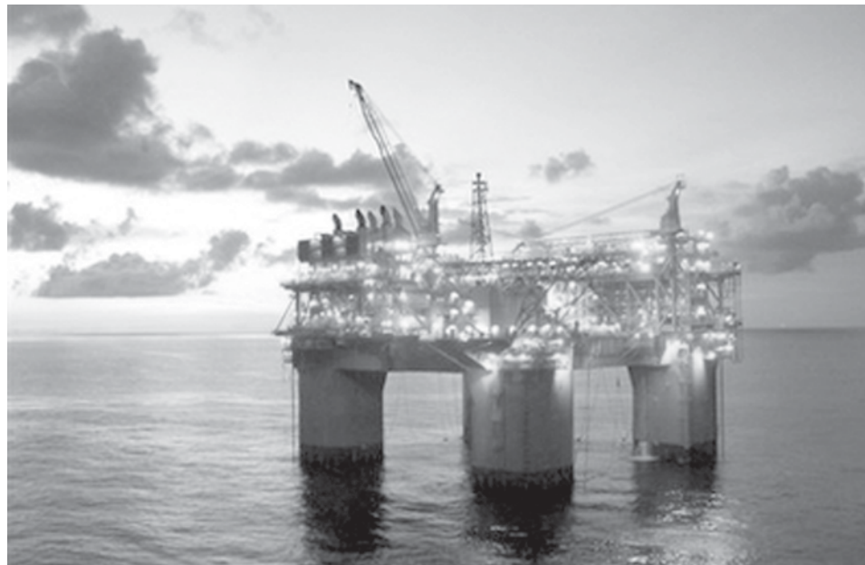
File photo shows BHP Billiton's Atlantis petroleum asset in the Gulf of Mexico as shares in the mining giant hit an all time high amid gossip that a Chinese entity was seeking a stake in the firm.