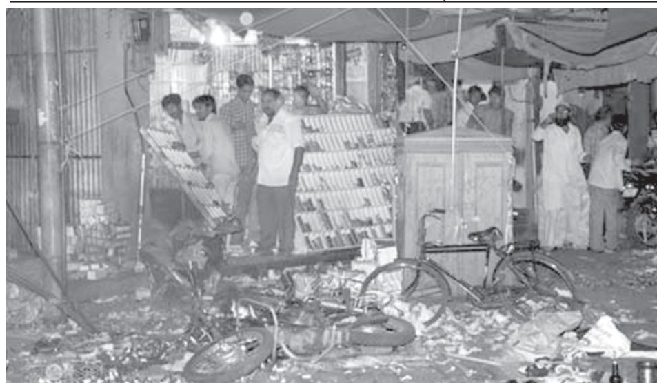
A deserted market is seen after a bomb blast in Choti Choupad in the western Indian city of Jaipur on 13 May, 2008. More than 60 people were feared killed in bomb blasts in Jaipur on Tuesday, state television said, citing Chief Minister Vasundhara Raje.

The state-run Xinhua news agency reported the