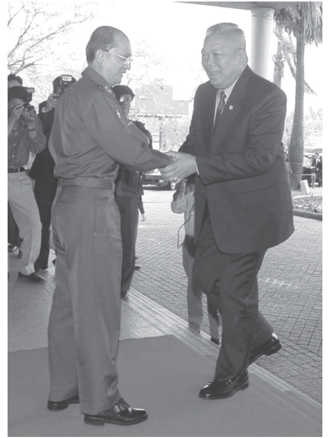
Prime Minister General Thein Sein greets Thai Prime Minister Mr Samak Sundaravej at Sedona Hotel.—MNA