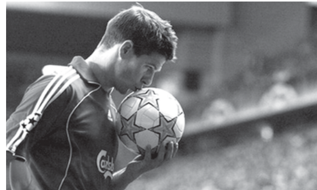
Steven Gerrard (seen here on April 22) admits Liverpool will only challenge for the Premier League title next season if Rafa Benitez spends big money. Gerrard is desperate to make up for another disappointing domestic campaign after Benitez's side slipped out of the title race by Christmas and finished nine points behind champions Manchester United.