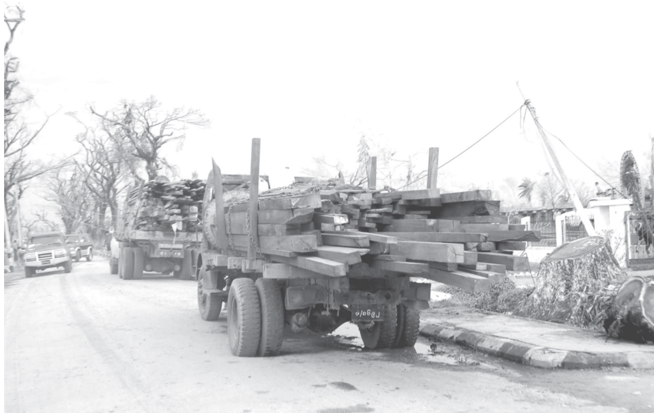
Trucks loaded with timber for reconstruction of buildings arrive in Pyapon.