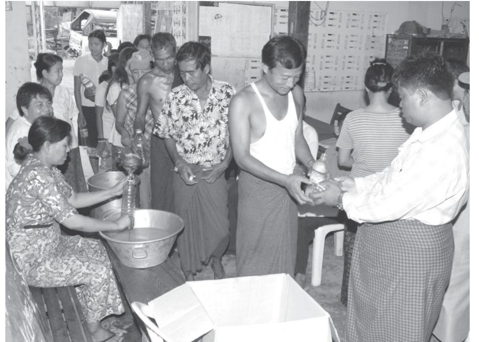
Local authorities distribute relief aids to storm victims in Thakayta Township.