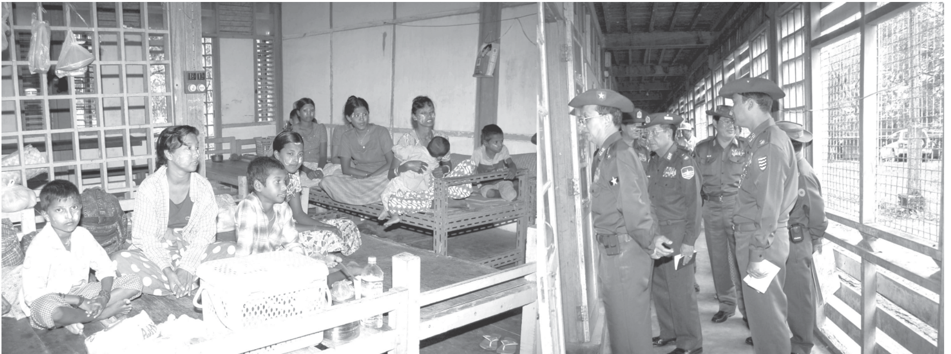
Prime Minister General Thein Sein greets storm victims at a relief camp in Pathein.—MNA

Storm victims from Labutta, Ngaputaw townships accommodated at Pathein University, Koethein Gymnasium, BEHS-3 with food, health care services provided