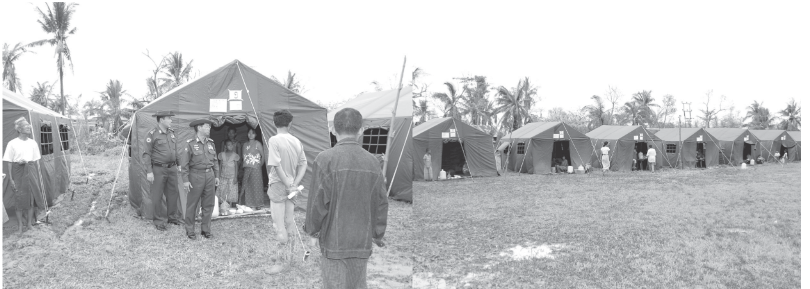
Lt-Gen Myint Swe of the Ministry of Defence inspects living condition of households in storm-affected areas.—MNA

dagalankara (PhD) of Tipitaka Maha Gandayon Monastery in Ward 9 of Mayangon Township in conjunction and open Bawdipuza Mingala Beikman. In addition, he attended the ceremony to honour the monks who passed the Tipitakadhara Selection Examination at the same venue. — MNA