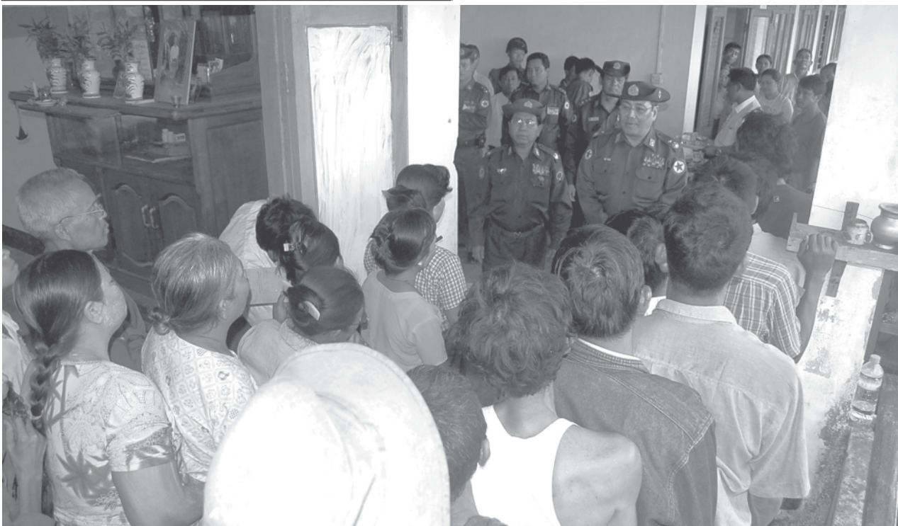
Commander Maj-Gen Hla Htay Win and Minister Brig-Gen Kyaw Hsan comfort storm victims in Hlinethaya Township.—MNA

The commander and the minister cordially greeted the victims after providing foodstuff, purified drinking water, candles and personal goods to them at the camp. — MNA