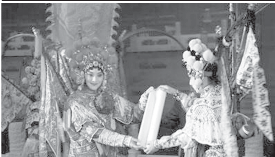
Artists perform Beijing Opera at the opening ceremony of the “Meet in Beijing 2008-Cultural Events” which kicked off on 12 May, 2008.