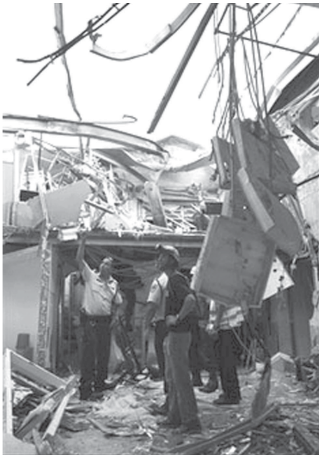
Israeli firefighters and police examine the damage at the site where a rocket fired by Palestinian militants from the Gaza Strip landed at a shopping mall in the town of Ashkelon, southern Israel, Wednesday, May 14, 2008.