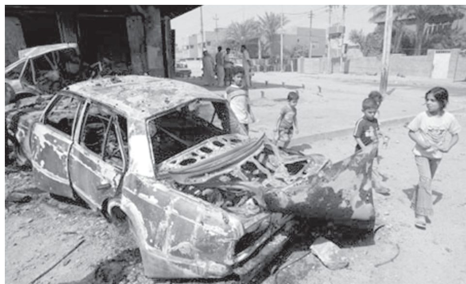
Children look at destroyed vehicles after clashes in Baghdad's Sadr City on 13 May, 2008, which police said killed 11 people and wounded 20 others.