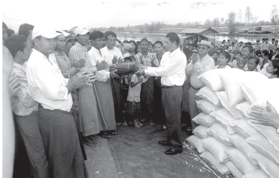
Minister U Soe Tha presents relief aids to storm victims in Tamangyi Village in Twantay Township.