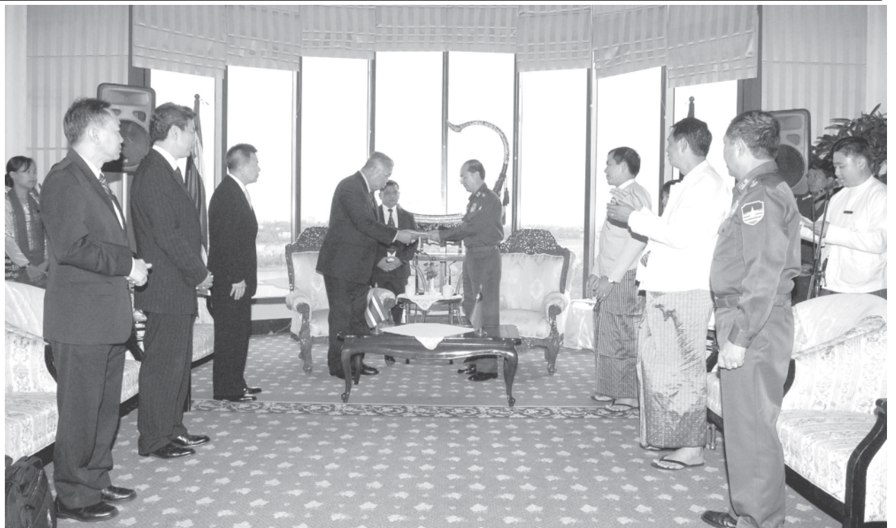
Prime Minister General Thein Sein accepts cash and kind from Thai Prime Minister Mr Samak Sundaravej donated by the Government of Thailand and Thai people.