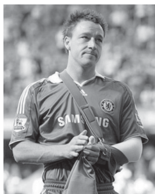
Chelsea manager Avram Grant believes John Terry, seen here on 11 May, 2008, and Didier Drogba will play through the pain barrier to face Manchester United in next week's Champions League final.

LONDON, 14 May — Chelsea manager Avram Grant said on Tuesday that striker Didier Drogba and captain John Terry should be fit for the Champions League final against Manchester United in Moscow on May 21.