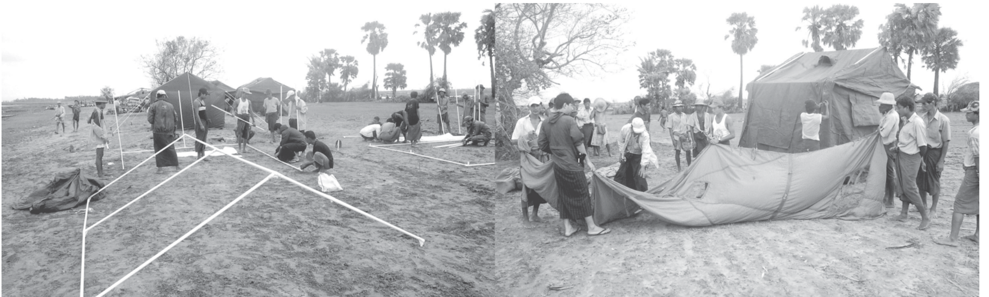
Tents being set up for storm victims in Dedaye.