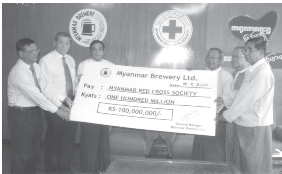
Myanmar Brewery Ltd donates K 100 million to storm victims through Myanmar Red Cross Society.—MNA

In the evening, polling station officers and members inspected ballot boxes, counting of ballot papers. Polling station officers packed votes-in-favor, votes-against and cancelled votes into separate bundles and presented them to the ward and village-tract sub-commissions.—MNA