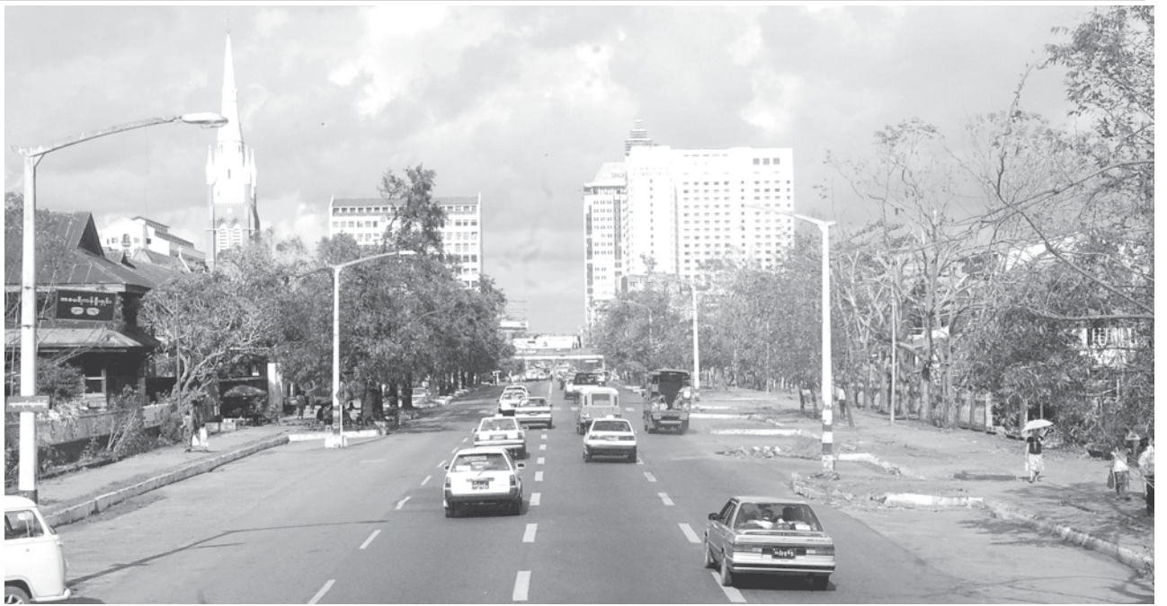
Buses and cars running along a road in downtown Yangon on 12 May, 2008.—MNA