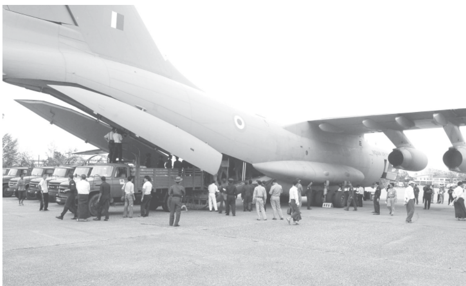
Instant foods donated by India arrive at Yangon International Airport.