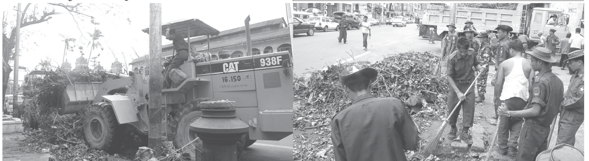
Tatmadawmen remove branches of fallen trees on Anawrahta Road in Yangon.