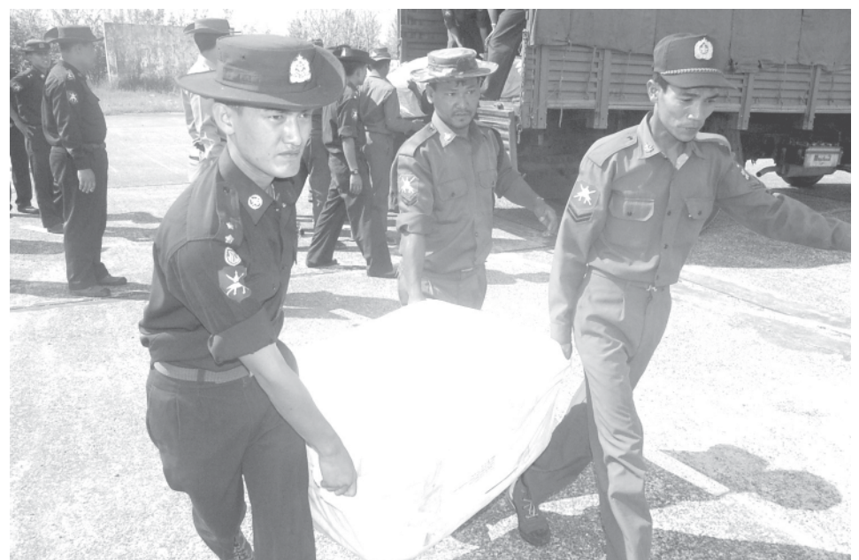
Tatmadawmen unloading relief aids from trucks. — MNA

MMPA members have participated in the rehabilitation task in the storm-hit areas. Those wishing to take part in the tasks and to receive aids may contact MMPA No 16, Wingaba Road in Bahan Township Ph: 727831. — MNA