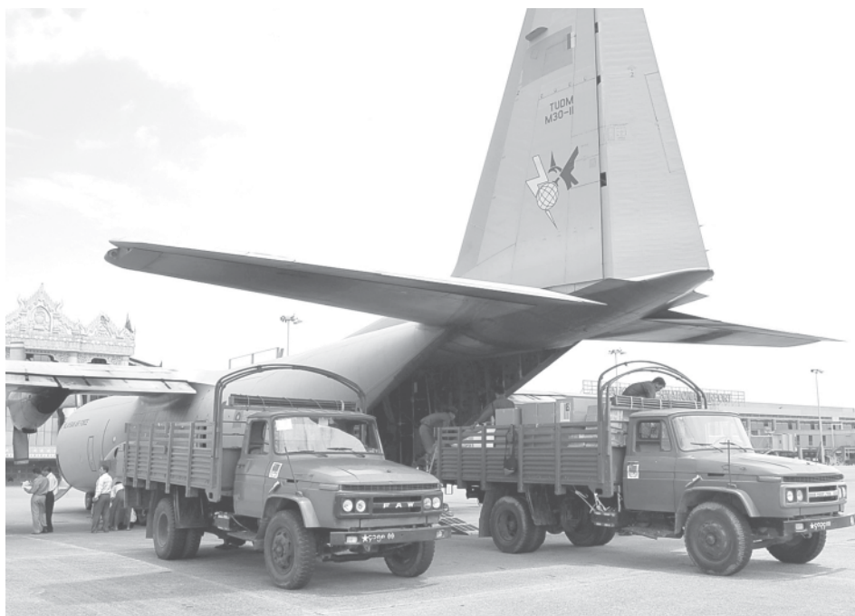
Relief items donated by India arrive at Yangon International Airport.—MNA

communication links in Yangon and Ayeyawady Divisions as soon as possible in cooperation with entrepreneurs; replace broken pylon with new ones; and apply long-term in addition to short-term methods in the process. He attended to the needs.—MNA