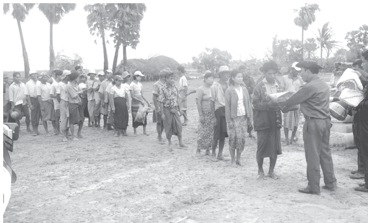
Minister Brig-Gen Lun Thi distributes relief aids to storm victims in Kyonda Village in Dedaye Township.