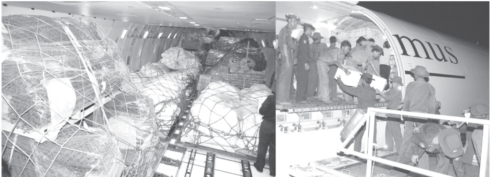
Construction materials donated by Cares in Dubai arrive at Yangon International Airport.