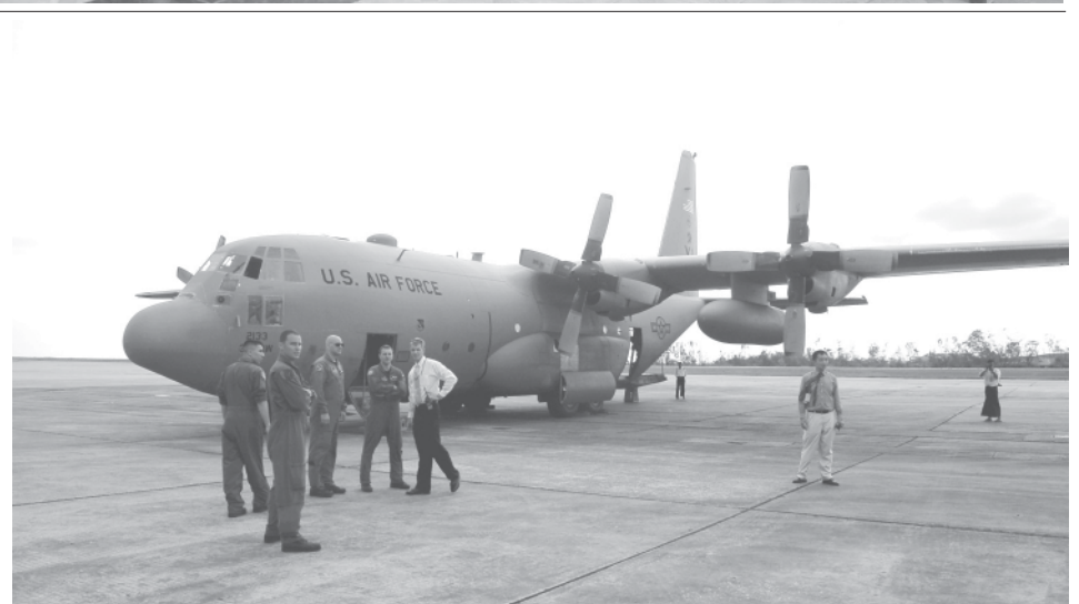
C 130 aircraft carrying relief aids from the US seen at Yangon International Airport. — MNA

Those wishing to donate robes to the monasteries may contact the control office of Yangon Division PDC, Ph 098600184; 098600185, and the office of Yangon Division PDC in Kyauktada Township, Ph 370510; 370509; 370506. — MNA