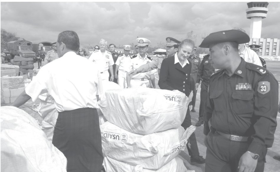
Representatives of US view relief aids at Yangon International Airport.