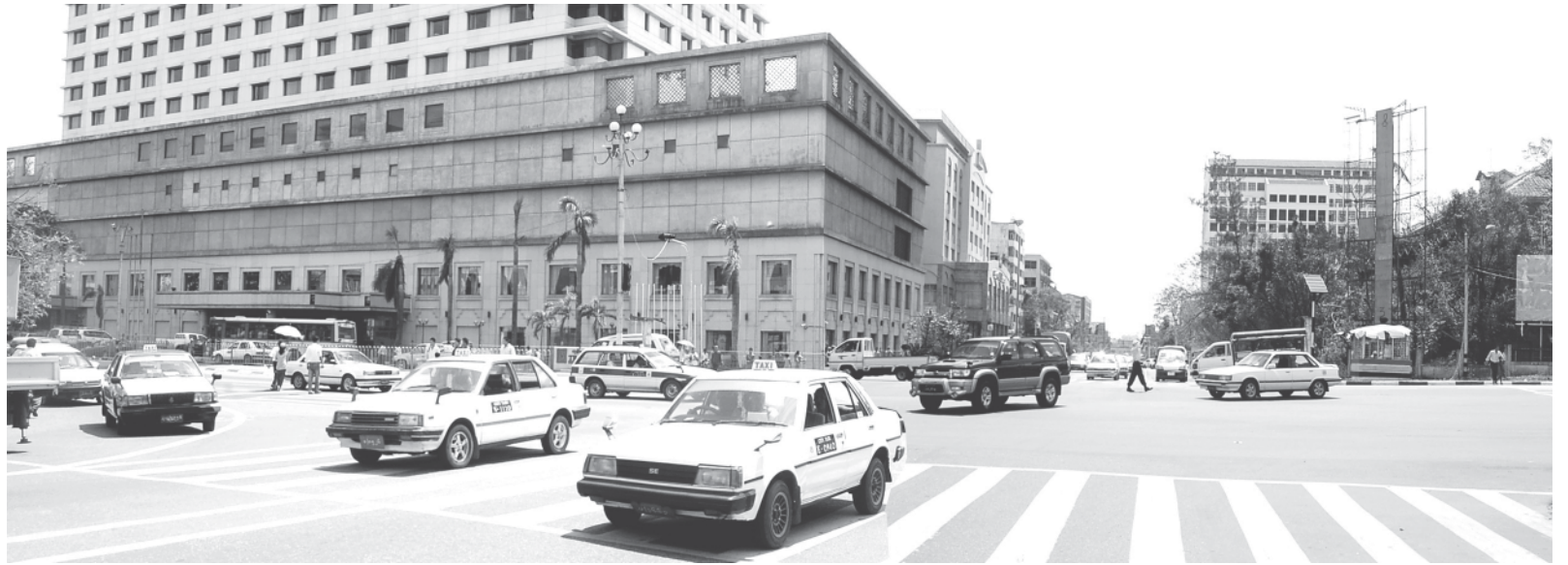
Flow of traffic returns to normal in downtown Yangon. — MNA

Local people of Shan State (East) have been continuously donating relief goods, which will be sent to the storm victims in time.—MNA