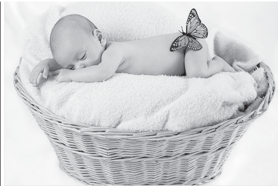
British researchers have found that babies who hear foreign speech in their first nine months of life find it easier to pick up languages in school or as adults, according to a local Press report on Sunday.—XINHUA