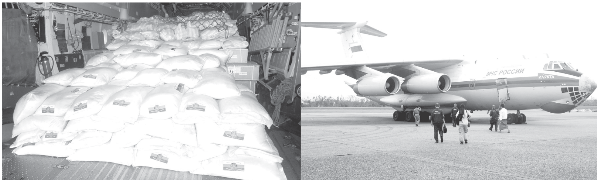
Relief supplies donated by Russian Federation arrive at Yangon International Airport.