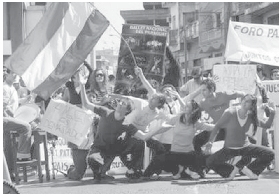
Members of Ballet Nacional of Paraguay, dance on a downtown street in protest over a four-month delay in the payment of their wages in Asuncion on 10 May, 2008.