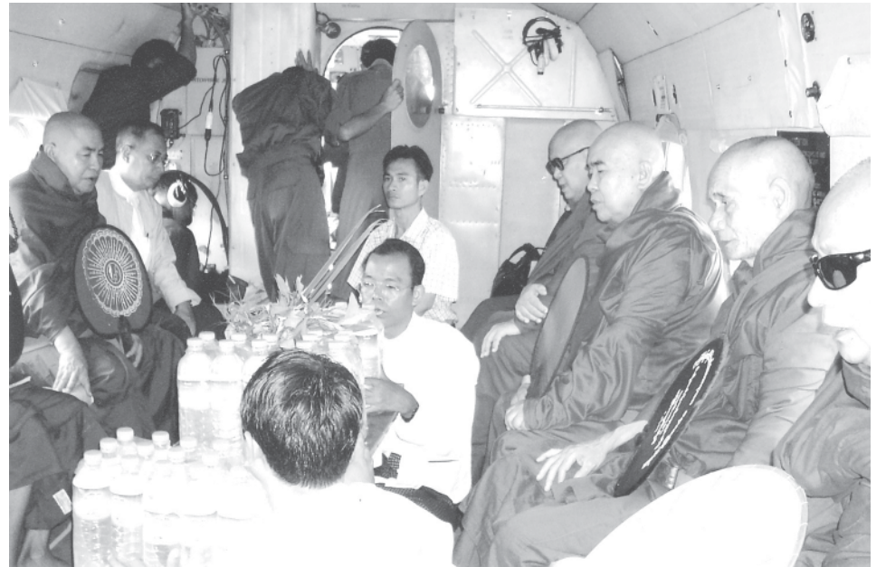
Sayadaws dispense metta and recite parittas for the dead and victims of the storm-hit regions.—MNA

Adjutant-General Maj-Gen Thura Myint Aung met Minister for Hotels and Tourism Maj-Gen Soe Naing who supervised the relief measures. He gave instructions on collecting damages and tolls, construction of fly-proof latrines and repair of schools and hospitals on priority basis.—MNA