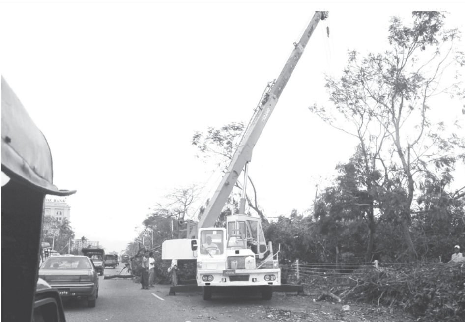
Fallen trees and debris being removed on Pyay Road.