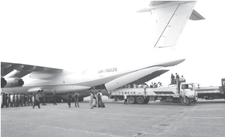
Relief aids donated by Doctors Without Borders based in Switzerland arrive at Yangon International Airport.