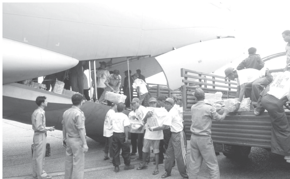
Relief items donated by India arrive at Yangon International Airport.