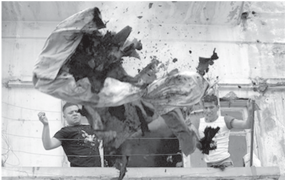
Two Lebanese men dispose of burning furniture while trying to beat out the fire at their apartment caused by heavy fighting over night in the city of Tripoli, Lebanon, on 11 May, 2008.

Chinese Government has attached great importance to the consolidation and development of the strategic partnership. China is willing to work together with Venezuela to expand bilateral cooperation in economy and trade, energy, agriculture, fight against poverty and infrastructure under the principle of mutual benefit, win-win and common prosperity, to benefit the Chinese and Venezuelan people, Hui added.—MNA/Xinhua