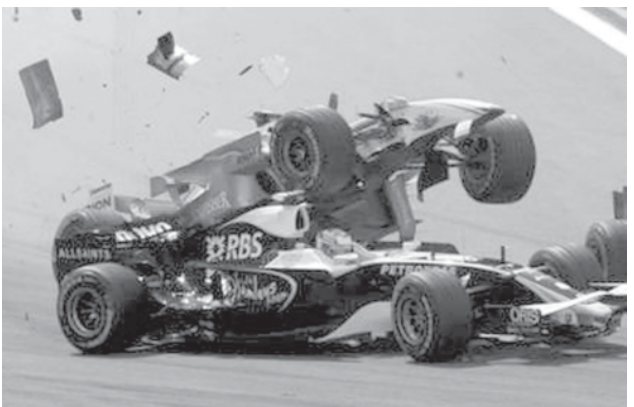
Force India's Formula One driver Giancarlo Fisichella (top) of Italy and Williams' Formula One driver Kazuki Nakajima of Japan crash at the start of the Turkish F1 Grand Prix at Istanbul Park on 11 May, 2008.

Mallorca striker Dani Guiza scored his 26th goal of the season to secure the islanders a stoppage-time win and spark a new round of protests from the discontented Barca fans. — MNA/Reuters