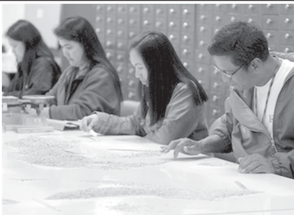
Lab researchers sort rice kernels for testing at the International Rice Research Institute (IRRI) in Los Banos, south of Manila on 2 May.