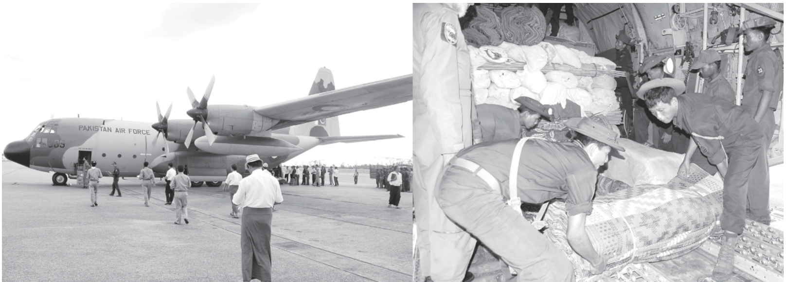
Relief aids from Pakistan arrive at Yangon International Airport.