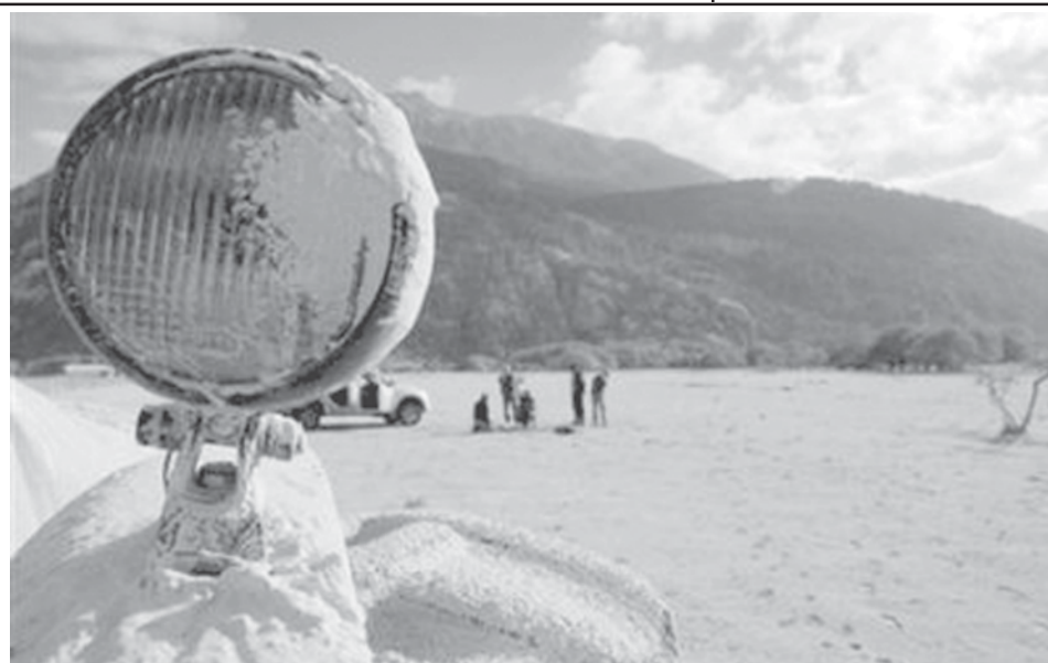
A tractor's light is covered with volcanic ash in Futaleufu, near the Chaiten volcano, located some 1,450 km (900 miles) south of Santiago, on 8 May, 2008.