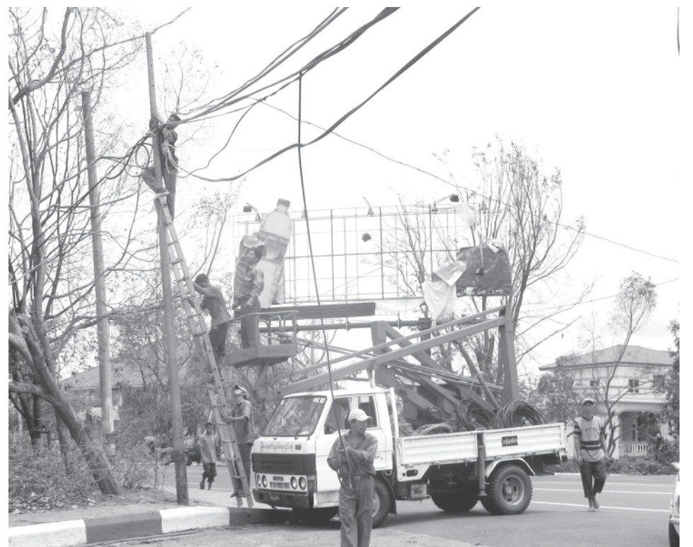
CPT employees repairing telephone lines in Yangon.—MNA

a total of 31,938 people died, 1,403 were injured and 29,770 went missing in all regions struck by the storm.—MNA