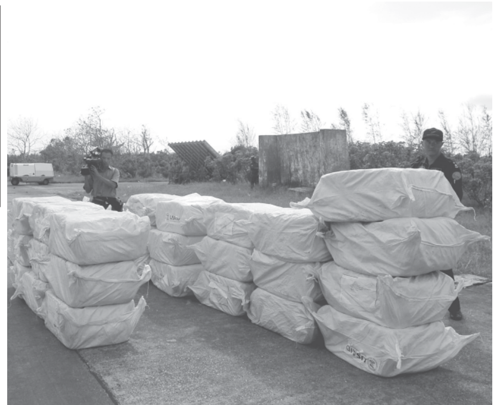
Relief aids seen at Yangon International Airport.