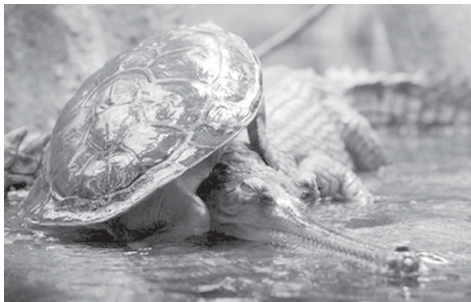
A turtle rests on a Indian gharial at the Prague zoo in April, 2008. The Prague zoo has launched a test programme to save the Indian crocodile-like gharial from the brink of extinction with a million-dollar pavilion for the animals to bask, and hopefully reproduce.