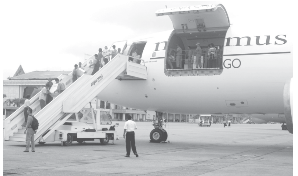
Relief aids donated by doctors and Red Cross in France arrive at Yangon International Airport.