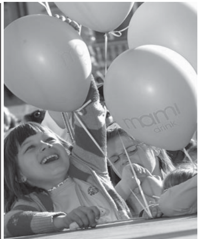
Children hold pink balloons bearing "Mami" while taking part in a celebration marking the Mother's Day in Bratislava, the Czech Republic, on 10 May, 2008.