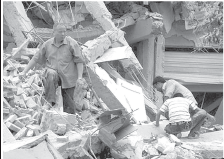
Rescuers search the rubble of a collapsed school in Dujiangyan after an earthquake measuring 7.8 rocked Sichuan province.

CHONGQING, 12 May—A massive earthquake struck central China on Monday, killing more than 8,500 people, trapping nearly 900 students under the rubble of their school and spilling ammonia from a chemical plant, state media reported.