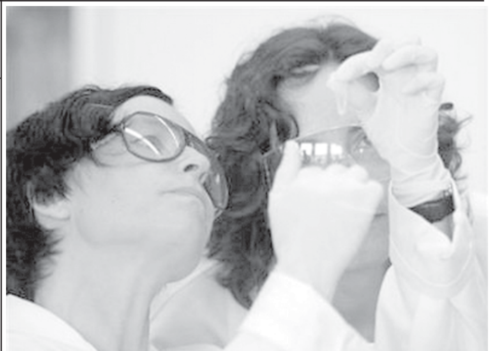
Laboratory researchers in a file photo. The US Food and Drug Administration approved on Friday the first generic versions of Requip (ropinirole hydrochloride) tablets for the treatment of moderate to severe Restless Legs Syndrome.