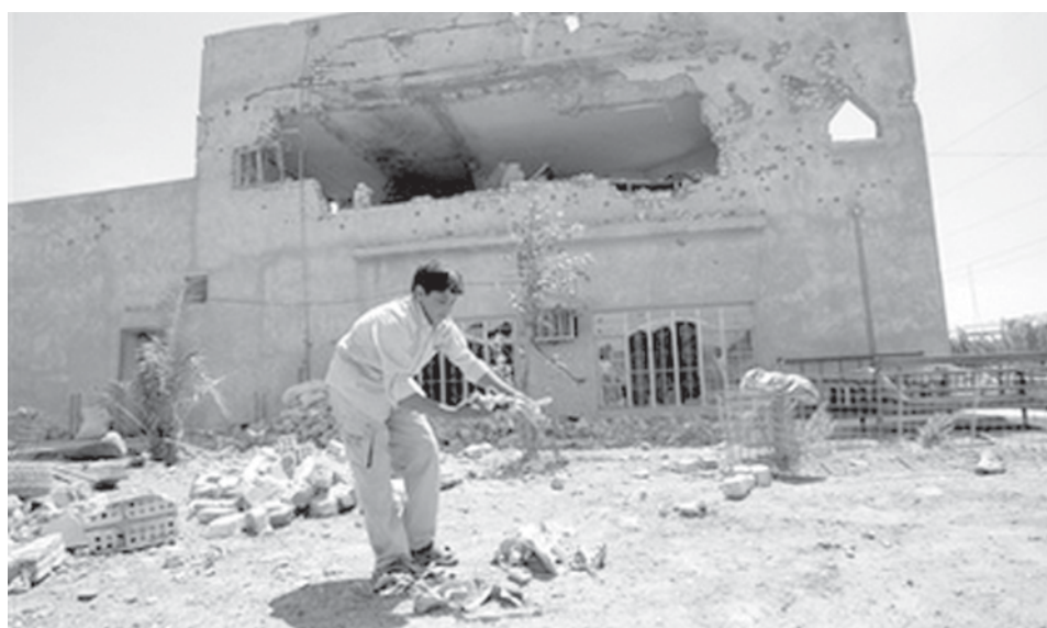
Iraqi boy collects pieces of shrapnel outside his home in southern Baghdad, Iraq, on 11 May, 2008. US troops fired at the house with a shoulder rocket launcher during an apparent search mission in the area.