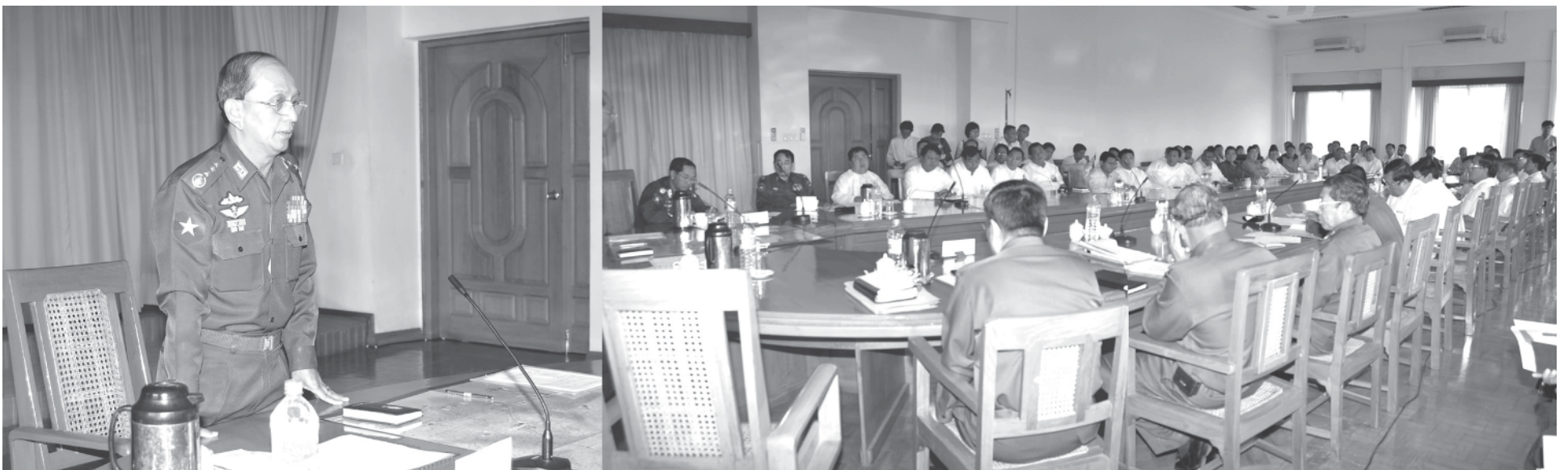
Prime Minister General Thein Sein delivers address at meeting on rehabilitation in storm-hit areas in Yangon and Ayeyawady Divisions.

NAY PYI TAW, 12 May – A meeting on rehabilitation in storm-hit areas in Yangon and Ayeyawady Divisions was held at the meeting hall of Yangon Command this morning, with an address by Chairman of National Disaster Preparedness Central Committee Prime Minister General Thein Sein.