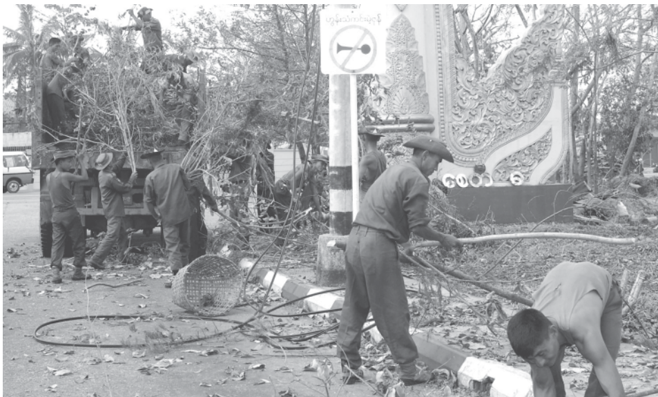
Tatmadawmen clear cables and fallen trees in Yangon.—MNA

YANGON, 11 May—Household goods are being sold to the pensioner storm-victims at reasonable price at Waizayanda Dhammayon in 8 th street of No 3 ward in South Okkalapa Township, at ward 24 Peace and Development Council in Thuwunna in Thingangyun Township, at Township Development Council in Dagon Myothit (North), at Township Internal Revenue Department in North Okkalapa Township.—MNA