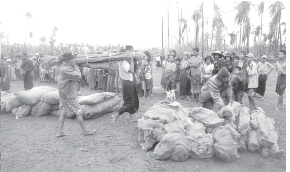
Volunteers unloading canvas from a helicopter in Kyondar Village in Dedaye Township.