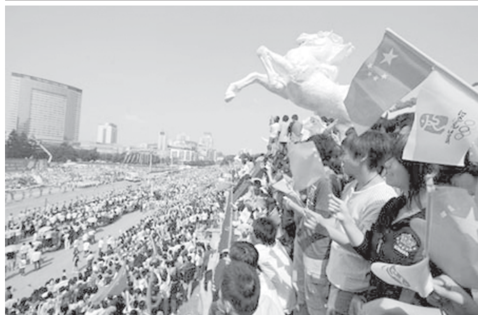
Cheering people watch the 2008 Beijing Olympic Games torch relay in Fuzhou, capital of southeast China's Fujian Province, on 11 May, 2008.