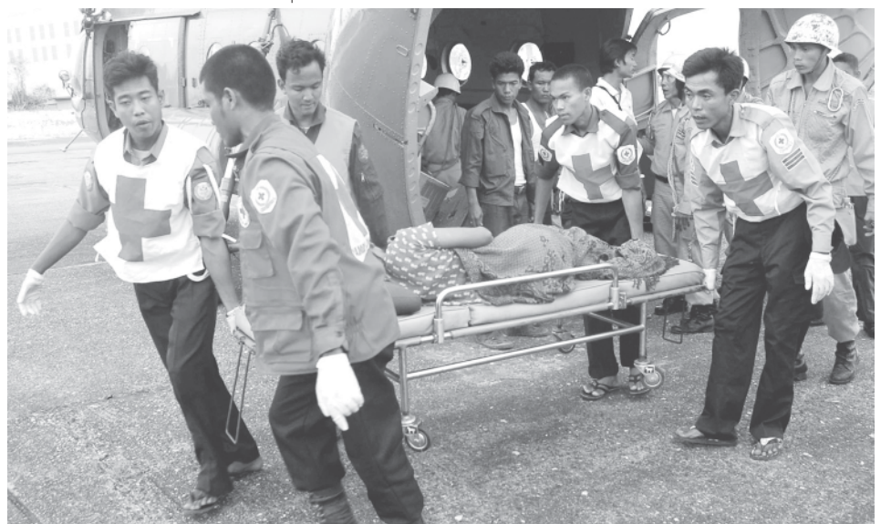
An emergency patient being conveyed to Yangon.