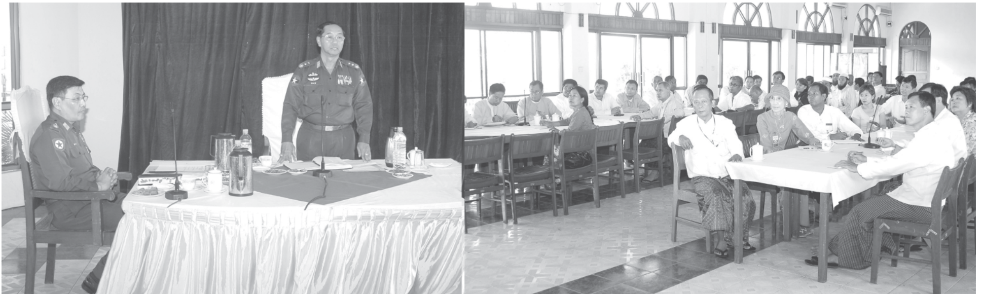
Lt-Gen Myint Swe meeting with donors at Yangon Command.