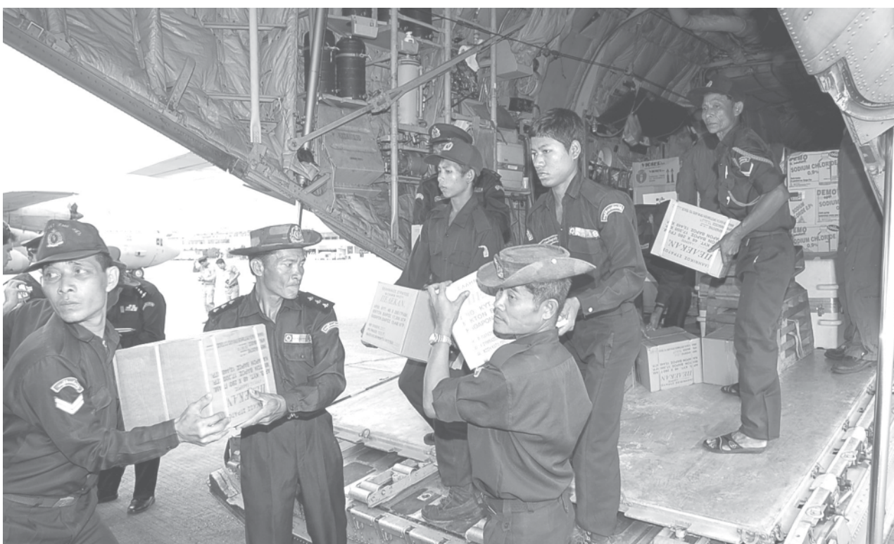
Members of Fire Brigade unloading relief aids donated by Greece from the flight.—MNA

Next, the minister attended the cash and kind donation ceremony of Air Bagan Ltd at the control office in the township. The officials of Air Bagan Ltd donated K 100million, 1000 bags of rice, 50 52-gallon tanks of palm oil, medicines and dry rations work K 100 million to the storm victims.—MNA