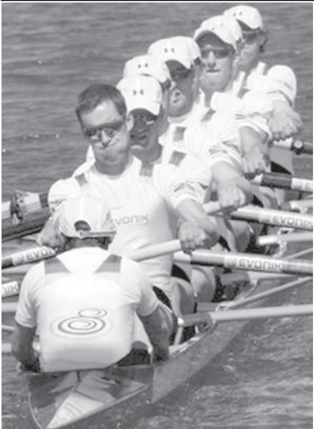
Germany's team row during the men's eight final of the Rowing World Cup in the Bavarian village Oberschleissheim north of Munich on 11 May, 2008.