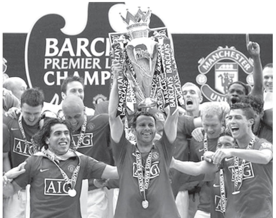
Manchester United's, Ryan Giggs, center, lifts the trophy as his team celebrate winning the English Premier League after their 2-0 win against Wigan in their English Premier League soccer match at The JJB Stadium, Wigan, England, on 11 May, 2008.