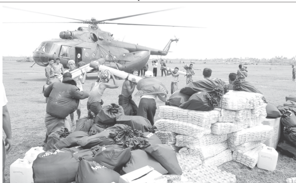
A helicopter transports supplies for storm victims in Dedaye Township.