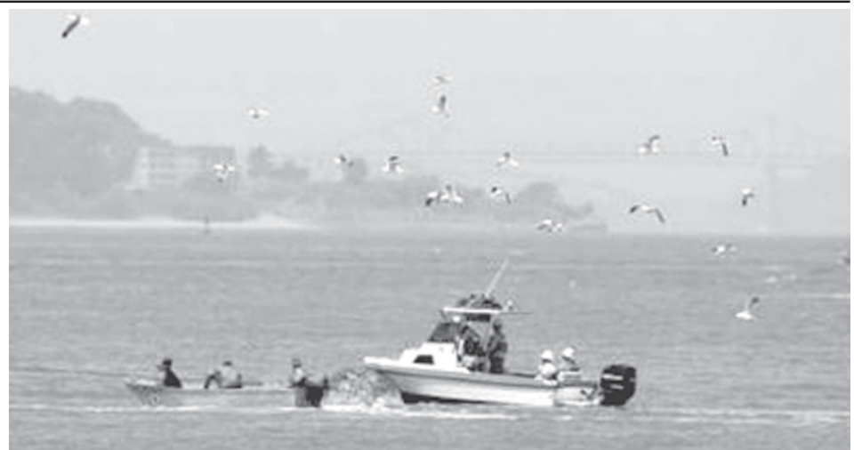
Seagulls follow two boats pulling a dead whale out to sea in San Francisco, California, on 9 May, 2008. Port officials hauled out the carcass of a young Gray Whale approximately 30 feet long that was lodged between pier pilings along San Francisco's waterfront.