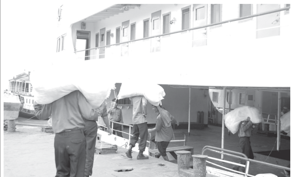
Workers loading a ship with relief supplies for victims in Ayeyawady Division.

YANGON, 11 May —Servicemen of Defence Services Martial Art and Sports Institute totaling 150 performed clearance of debris along the roads in Kyauktada Township with the use of heavy machinery and manpower this morning. They continue to clear the blocked streets in Pabedan Township tomorrow. MNA