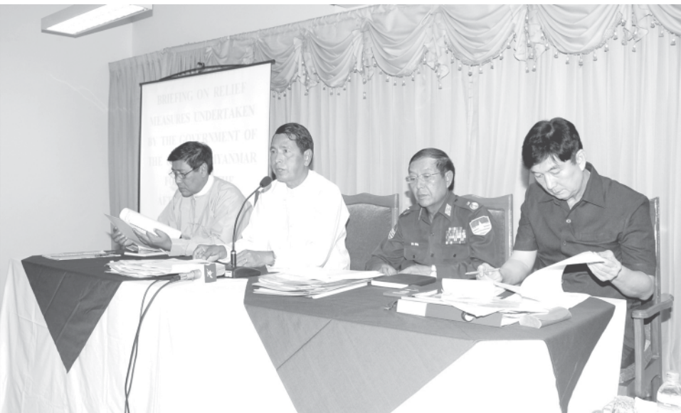
Minister U Soe Tha gives accounts of relief works in Yangon and Ayeyawady Divisions at news briefing. —MNA