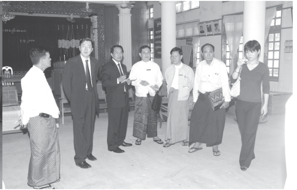
Diplomats observe casting of votes at a polling station in Mandalay.