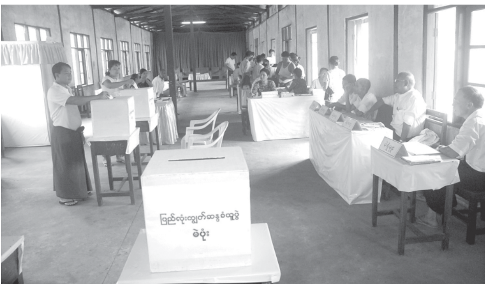
People cast votes at a polling station in Taikkyi Township.