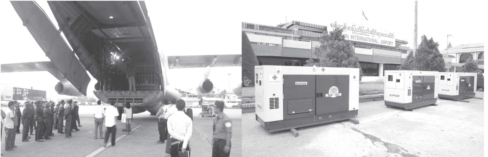
Relief items donated by ICRC arrive at Yangon International Airport.