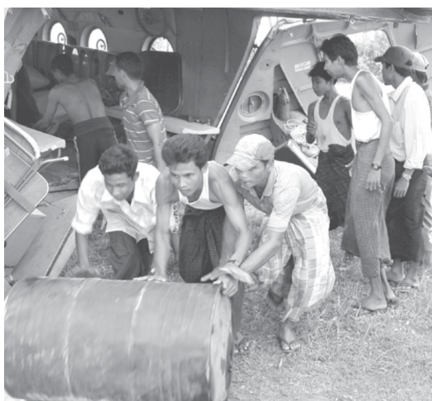
Volunteers unloading oil barrels from a helicopter.