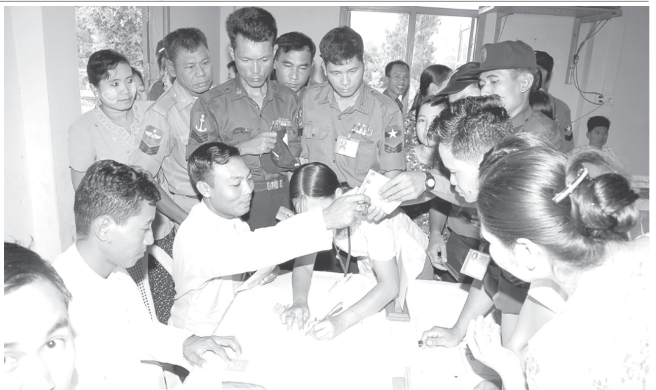
Polling station members issuing ballot papers at a polling station in Nay Pyi Taw Tatkon.