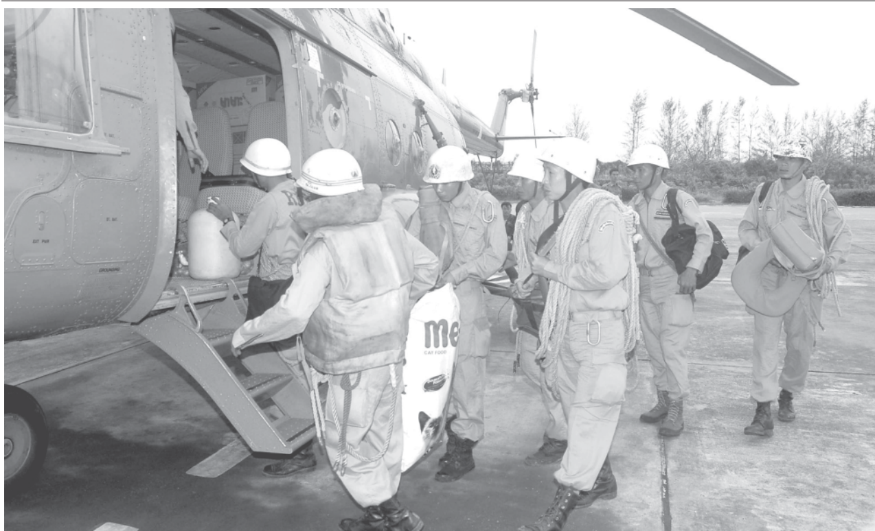
Members of Search and Rescue Team leave for storm-hit areas in Ayeyawady Division.—MNA