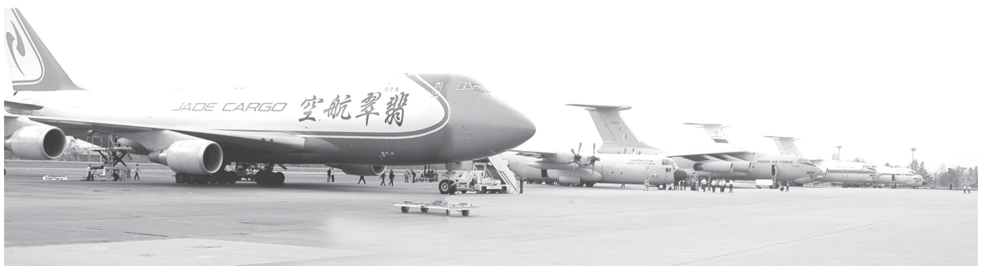
International emergency supplies arrive in Yangon daily.