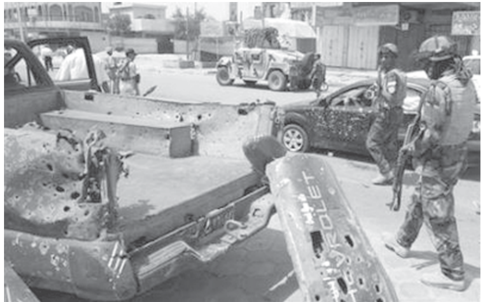
Iraqi soldiers secure the site of a roadside bomb attack that targeted their convoy which police said killed two civilians and wounded five others in central Basra, 550 km (342 miles) south of Baghdad, on 10 May, 2008.