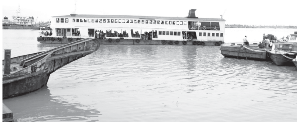
Yangon-Dalla daily ferry services resumes.—MNA