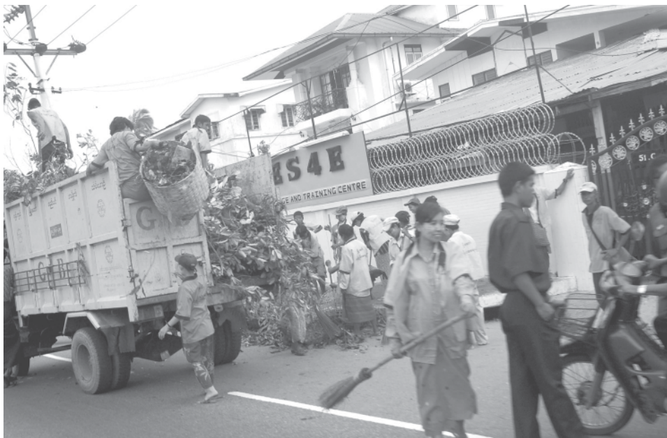
YCDC staff clearing debris on Kaba Aye Pagoda Road. MNA