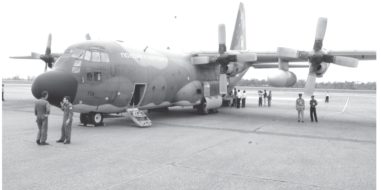
C-130 aircraft carrying medicines, blankets and tents donated by Greece at Yangon International Airport.—MNA

Relief supplies donated by wellwishers from abroad have been arriving continuously by air and by sea. The groups for accepting the relief aids are distributing them to the storm-hit areas by helicopter, by car and by boat without delay.—MNA