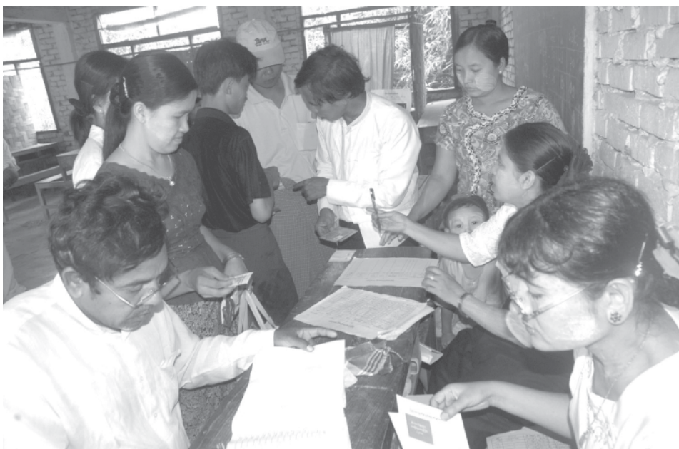
Polling station members issue ballot papers to eligible persons in a polling station in Htantabin Township.