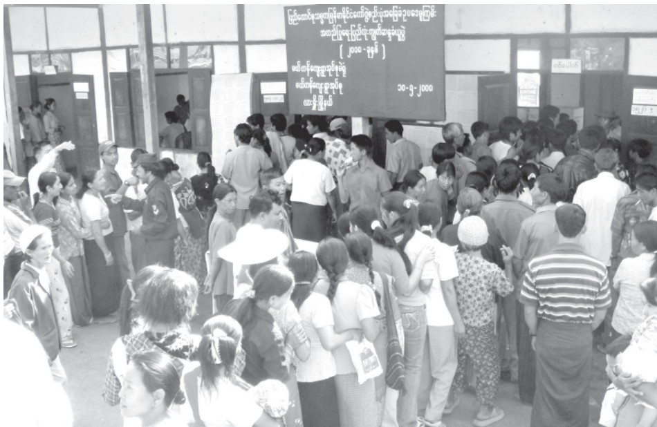
People casting votes at a polling station in Lashio.