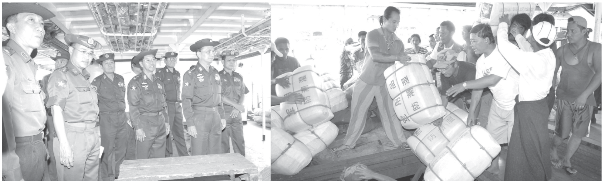
Prime Minister General Thein Sein inspects loading of relief aid for storm victims in Ngaputaw Township onto a vessel.—MNA

Emergence of the State Constitution is the duty of all citizens of Myanmar Naing-Ngan.