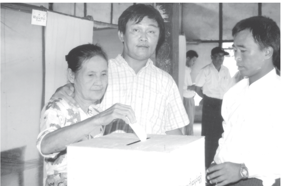
A woman casting vote at a polling station in Mawlamyine.