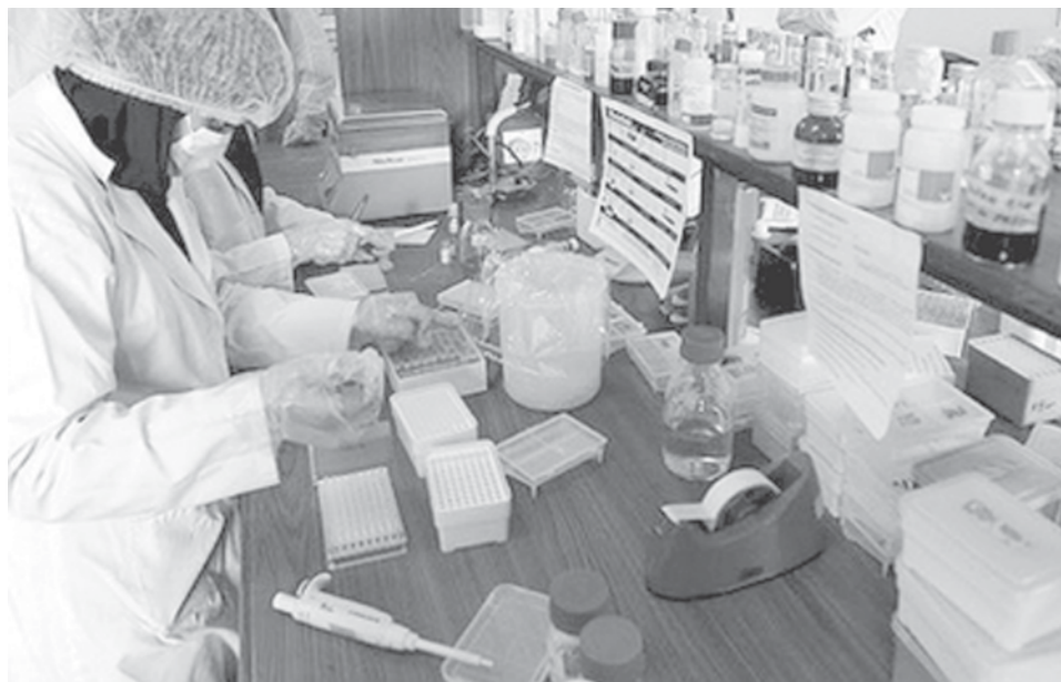
Researchers working at a lab. A Canadian high school student has won a national science competition for her new molecule that binds to flu viruses, which may eventually be used to diagnose or prevent flu infections.