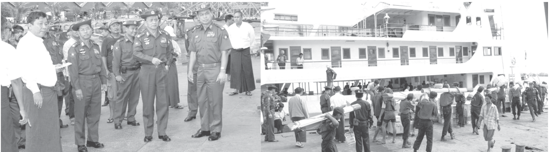
Prime Minister General Thein Sein inspects loading of relief items for storm victims in Ayeyawady Division onto a vessel.