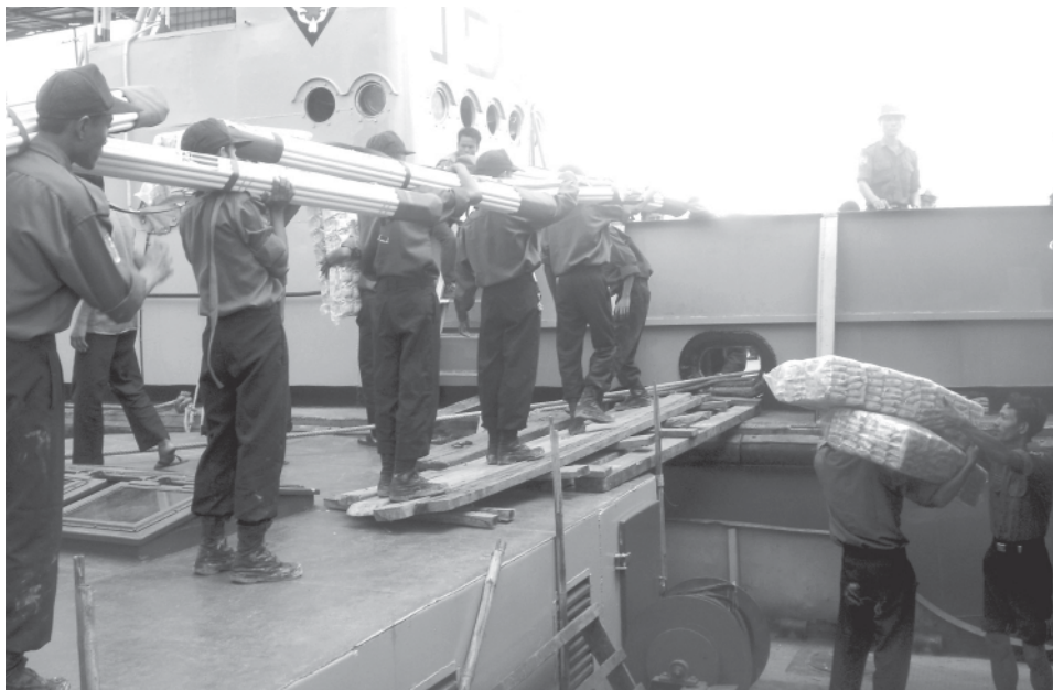
□Soldiers carry relief supplies onto a ship.