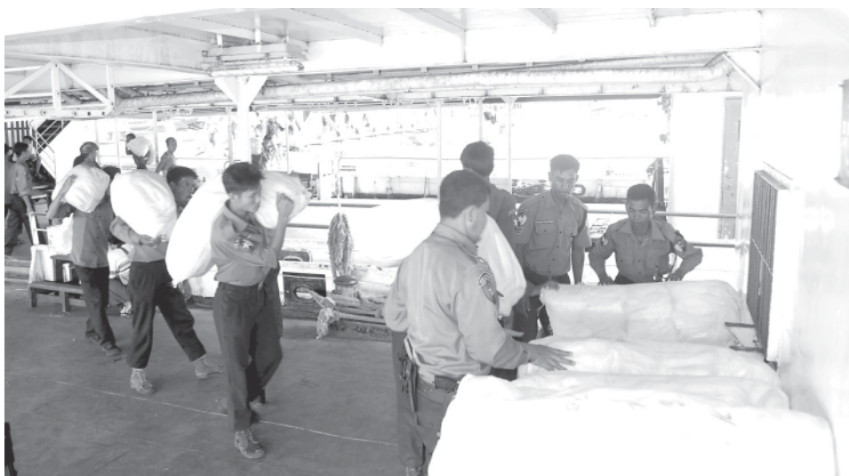
Volunteers carrying relief goods to be delivered to Ayeyawady Division.—MNA