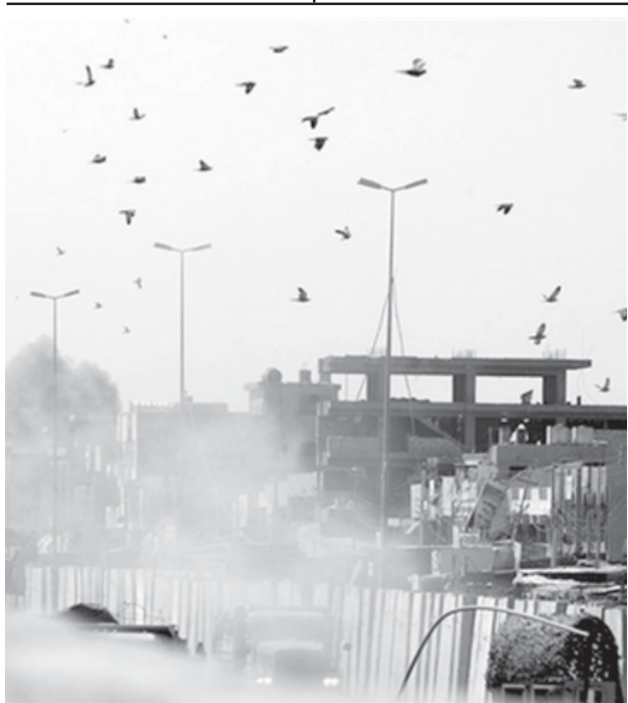
Birds fly off after an IED (Improvised Explosive Device) explodes in the Shiite enclave of Sadr City in Baghdad, Iraq, on 10 May, 2008.

Residents said the insurgents targeted government troops in Yaqbaraweyne, a small town west of the capital, and also fought with Ethiopian forces in Towfiq, north of the city. — MNA/Reuters