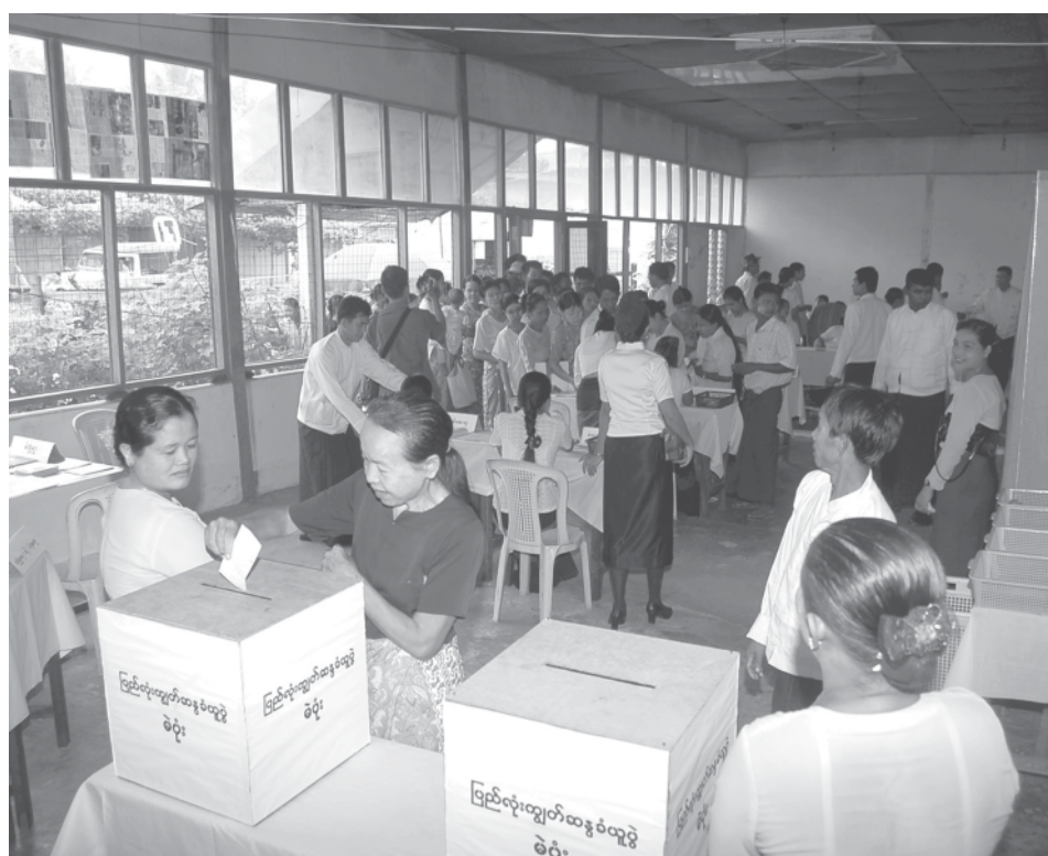
People cast votes at a polling station in Hpa-an.