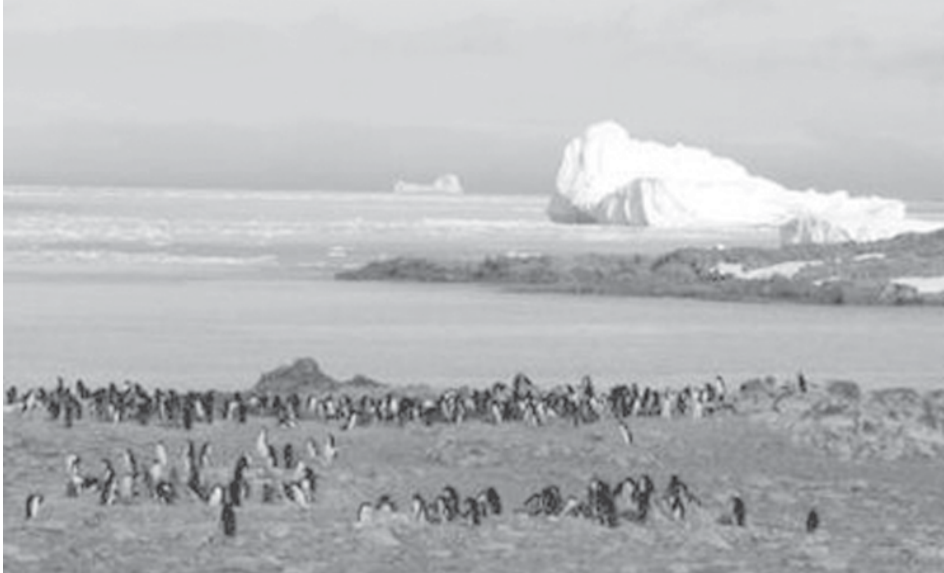
Adelie penguins in Antarctica are photographed in this 18 Jan, 2005 file photo. The pesticide DDT, banned decades ago in much of the world, still shows up in penguins in Antarctica, probably due to the chemical's accumulation in melting glaciers, a sea bird expert said on 9 May, 2008.