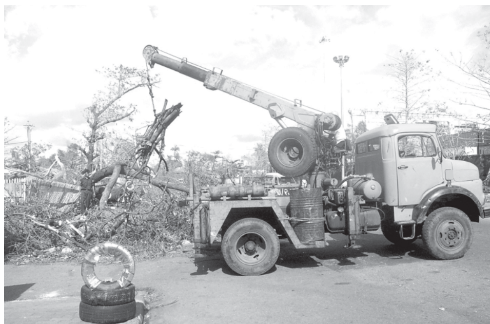
Volunteers removing fallen trees on a road in Botahtaung Township.

After hearing reports presented by local people, the minister attended to the needs and presented foodstuff, medicines and purified drinking water to officials. — MNA