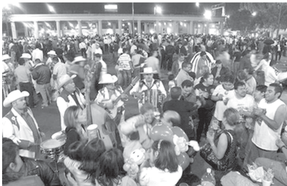
People gather at Plaza Garibaldi to celebrate Mother's Day in Mexico City, early Saturday, 10 May, 2008.