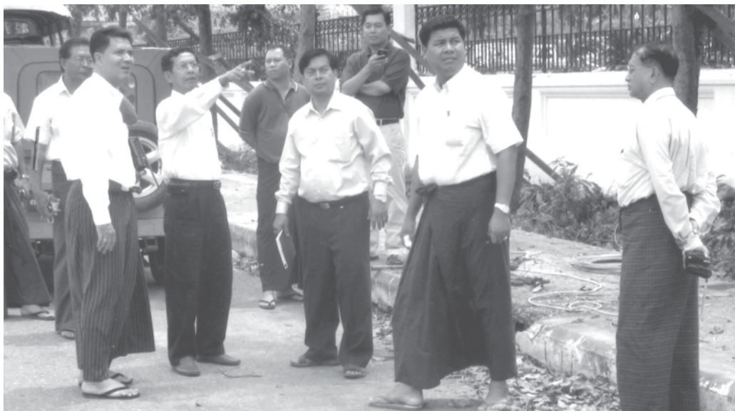
MPT staff repairing telephone services.