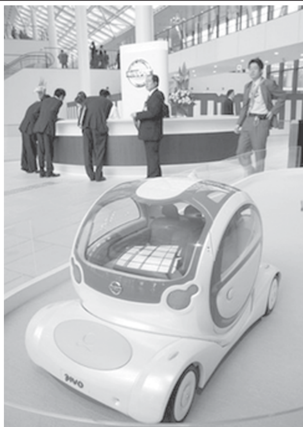
A model of Nissan Motor's concept electric vehicle "Pivo". Nissan and NEC Corp will join forces in the world's first mass production of lithiumion batteries for hybrid and electric vehicles, a newspaper said.