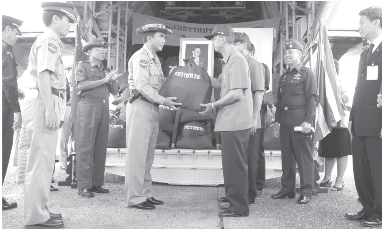
General Chalit Pukpasuk of Royal Thai Armed Forces hands over the donations to Commander-in-Chief (Air) Lt-Gen Myat Hein.

The donations include 25 tents and 2,000 of emergency bags weighing 13 tons. — MNA