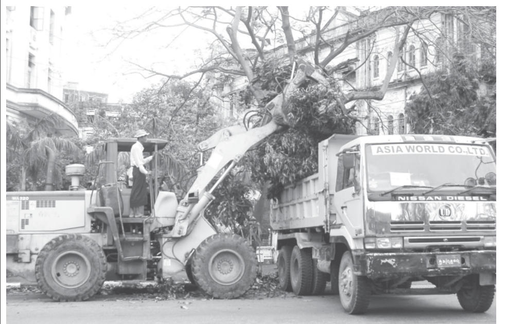
Servicemen of Defence Services Martial Art and Sports Institute take part in clearance of debris along the roads in Kyauktada Township.