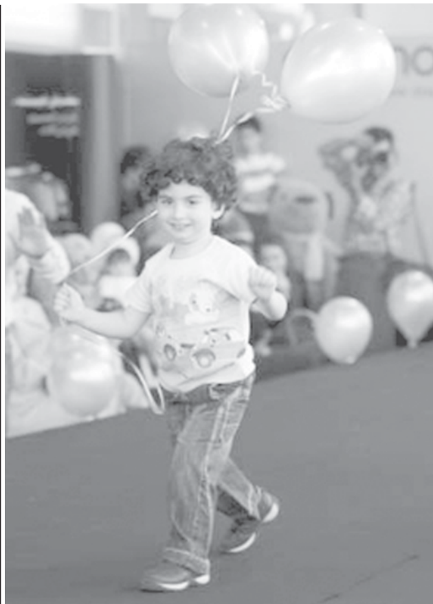
A child holding balloons displays a creation from BHS Kids Summer 2008 collection during a fund raiser fashion show for a local charity in Amman on 10 May, 2008.