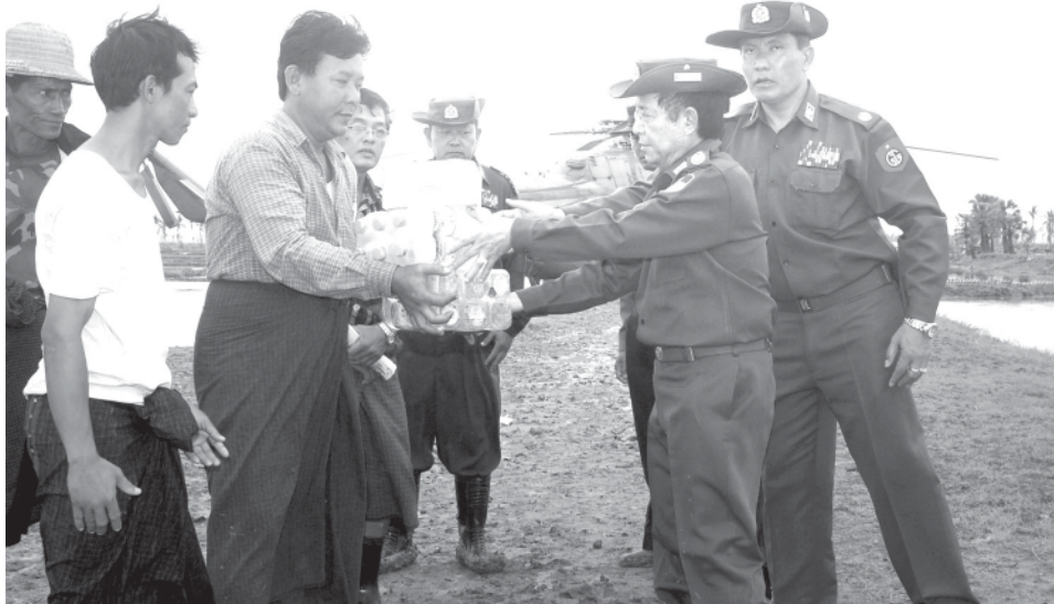
Minister Maj-Gen Maung Maung Swe presents relief aids to a victim in Bogale Township.