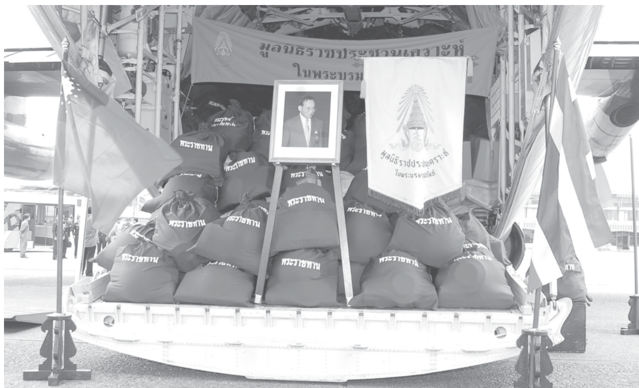
Emergency aid presented by King of Thailand for storm victims arrives in Yangon.—MNA