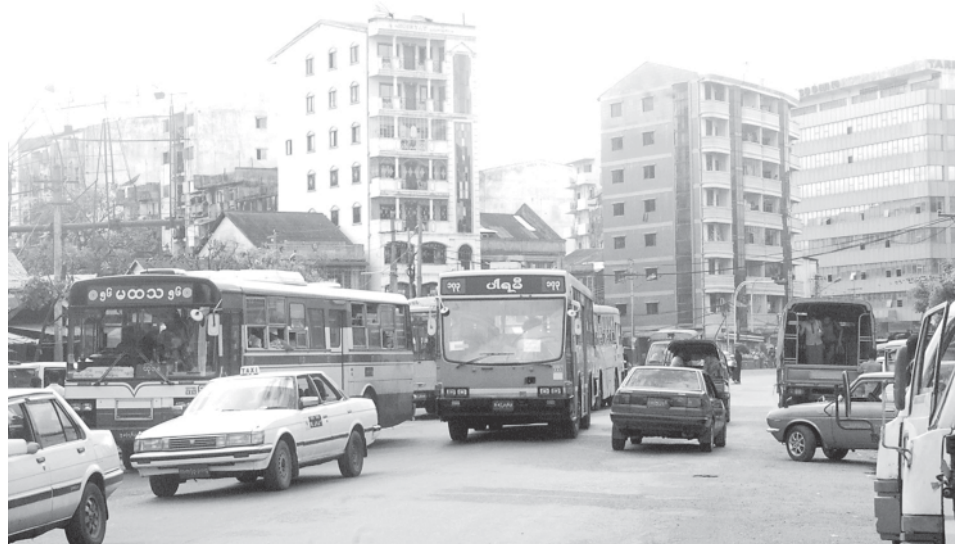
Buses and cars running along a road in Yangon.