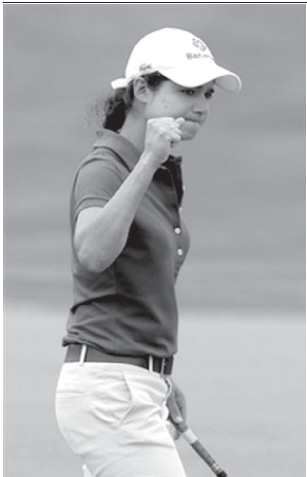
Lorena Ochoa, of Mexico, pumps her fist as she records a birdie on the 14th green during the first round of the Michelob Ultra Open LPGA golf tournament at the Kingsmill Resort in Williamsburg, Va, on 8 May, 2008. Ochoa finished the round with a 6-under par 65.

The result leaves Jaier Aguirre's Atletico three points short of third-placed Barcelona, who were hammered 1-1 at the Bernabeu by champions Real Madrid on Wednesday.—MNA/Reuters