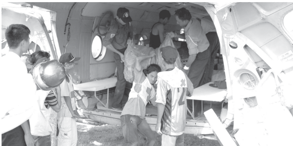
Aid workers loading up a helicopter with relief supplies.

We firmly believe that with the aid and goodwill of the entire national people the storm victims will be able to overcome the hardships and live a peaceful life soonest.