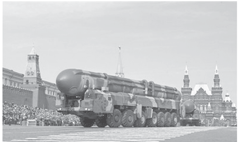
Russian truck-mounted Topol intercontinental ballistic missiles roll in the annual Victory Day parade at the Moscow Red Square, on 9 May, 2008. Kremlin in left background and State Historical Museum at right.