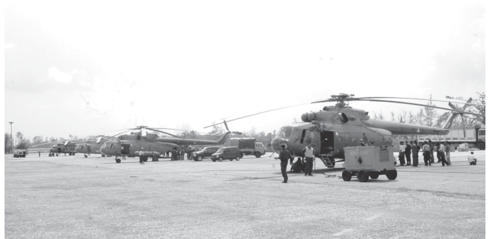
Helicopters carry relief aid, medicines and doctors to storm-hit areas in delta.