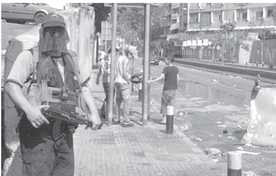
A masked Shiite gunmen stands guard during clashes in Beirut, Lebanon, on 9 May, 2008. Iranian- and Syrian-backed Shiite opposition gunmen seized control of several Beirut neighborhoods from Sunni foes loyal to the US-backed government on Friday. Eleven people have been killed and more than 20 wounded in three days of street battles, security officials said.