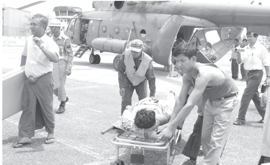
Patients being transported from Ayeyawady Division to Yangon.