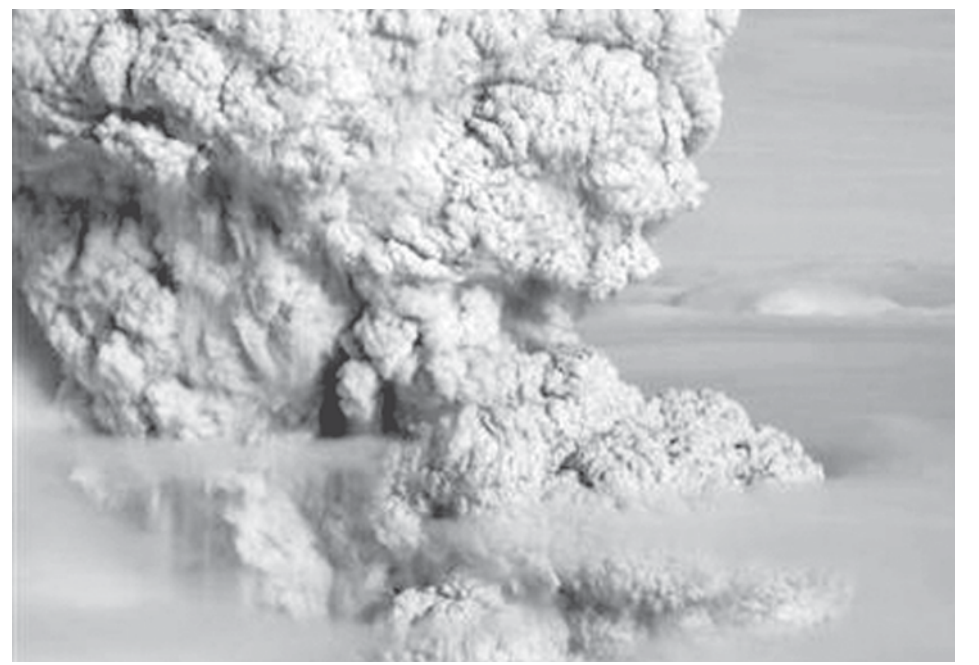
Smoke and ash rise for thousands of meters through a thick layer of clouds from the crater of the Chaiten volcano in southern Chile, on 7 May, 2008.

Less than 24 hours earlier about 600 people were forced to leave the