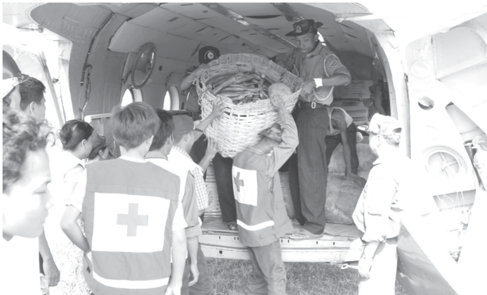
Members of Tatmadaw and social organizations loading relief aid onto a helicopter.—MNA

Shipyards. He inspected supply of electricity from Thakayta Power Station to Pazundaung, Botahtaung, Kyauktada, Tamway and Mingala Taungnyunt Townships through Thida 66 KV sub-power station of Pazundaung Township.—MNA