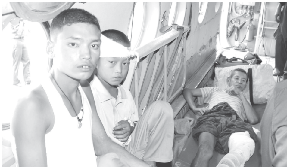
Emergency patients from storm-hit regions being helicoptered to Yangon.

NAY PYI TAW, 9 May —Servicemen of the Directorate of Medical Services went to Haingyikyun on 5 May, Pathein in Ayeyawady Division and Kungyangon in Yangon Division on 6 May and storm-torn townships and villages in Ayeyawady Division on 7 May and gave medical treatment to the storm victims. They also carried out packing medicines and sending relief supplies to the affected-areas in cooperation with the officials of Ministry of Health.