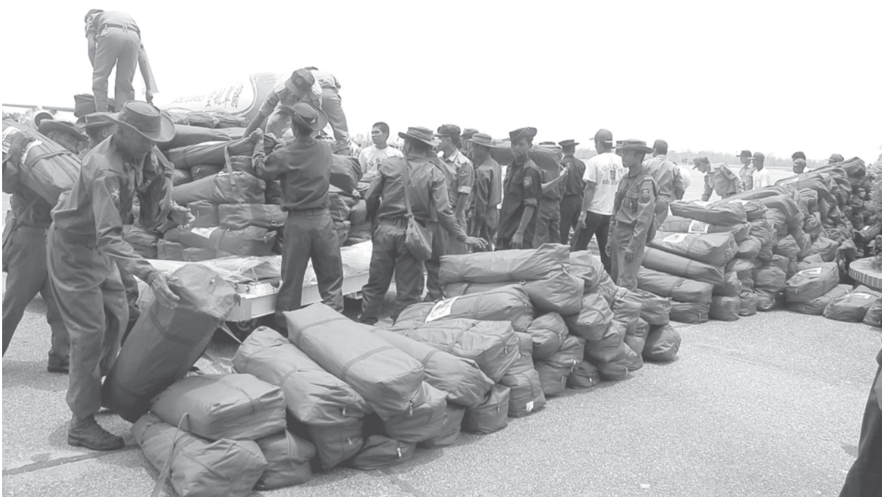
Relief aid from China arrives at Yangon International Airport. MNA