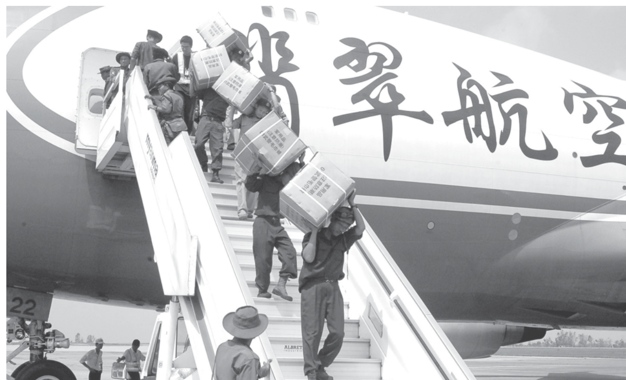
Relief supplies from the People's Republic of China arrive in Yangon.—MNA

YANGON, 9 May— Altogether 5.5 tons of construction materials and personal goods donated by Ukraine Republic, 40 tons of biscuits, emergency medical equipment and constructional materials donated by WFP and WHO, 20 tons of 100 packets of dried milk, 30 boxes of flour, 100 packages of soap, 100 packages of towels, 100 packages of toothpaste and brushes, tinned fish, 30 tents, 5 water purifying items and medicines donated by Republic of Korea, 3.2 tons of biscuits, blankets, dried noodles and chocolates donated by Singapore, 56 tons of tents, foods, water purifiers, medicines and blankets worth over US$ 500,000 by the People's Republic of China, 37 medical kits donated by Myanmar citizens in Singapore and 32 (See page 9)