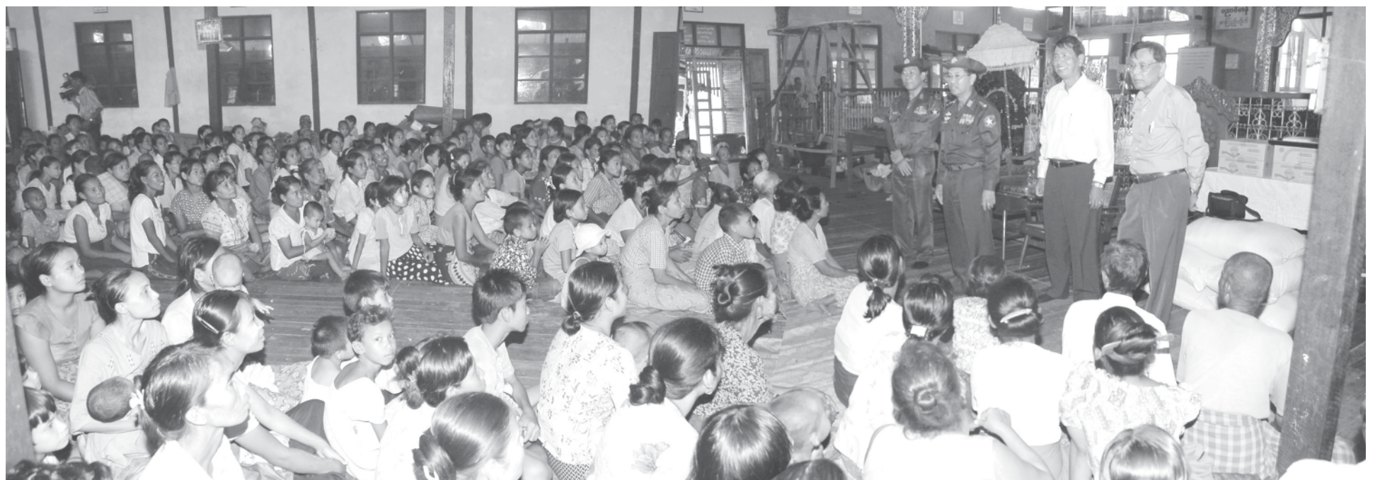
Lt-Gen Myint Swe comforts storm victims of Kawhmu Township.—MNA

Emergence of the State Constitution is the duty of all citizens of Myanmar Naing-Ngan.