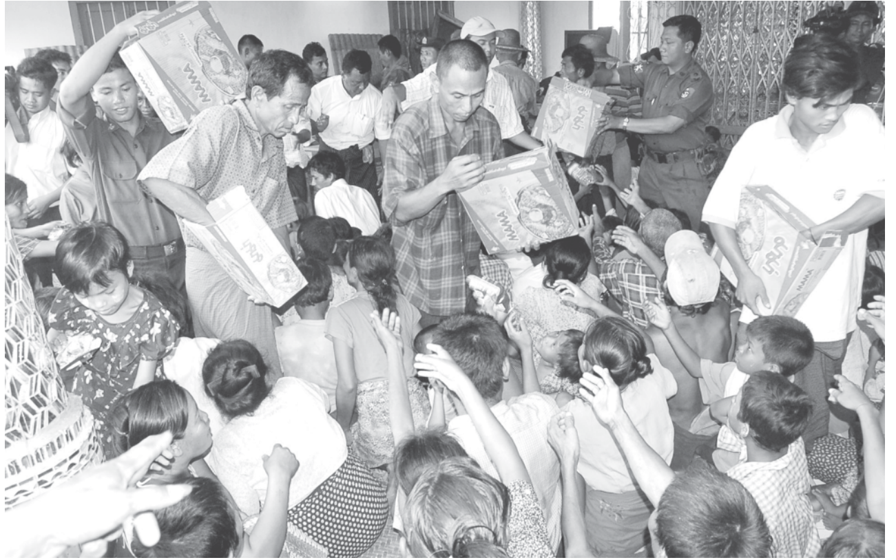
Relief items being delivered at the relief camp in Dedaye Township.—MNA

Later, the minister provided relief supplies to the victims at the relief camps.—MNA