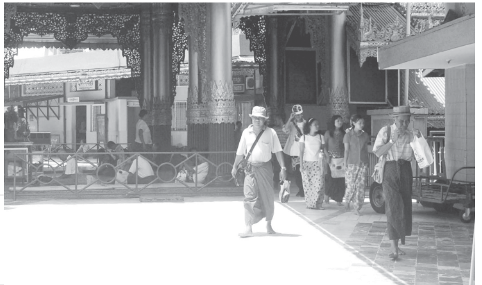
Pilgrims visit the Sule Pagoda.

Some of the pilgrims practiced meditation at the prayer halls and platforms of the pagoda.