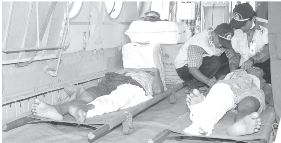
Patients from Ayeyawady Division being transported by air.

YANGON, 9 May — Traffic in 61 regions including downtown Yangon, Mingaladon, Indaing, Hmawby, Taikkyi and Bago returned to normal as altogether 8,475 Tatmadaw members cleared fallen trees, lamp-posts and debris that blocked the roads and streets of those regions. And continued efforts were being made to clear the remaining blocked roads and streets. MNA