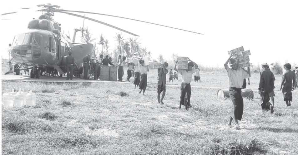
Volunteers unloading relief supplies for storm-hit villages in Labutta Township.