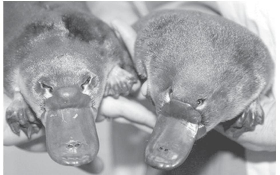
The world's first platypus twin puggles born in captivity are shown at Taronga Zoo in Sydney in 2003. The task of laying bare the platypus genome of 2.2 billion base pairs spread across 18,500 genes has taken several years, but will do far more than satisfy the curiosity of just biologists, say the researchers recently.