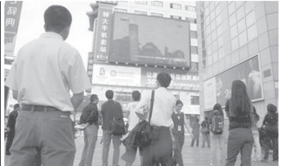
Shoppers and residents watch the live coverage of the Olympic torch ascent to Mount Everest shown on a huge television screen in Beijing on 8 May, 2008.