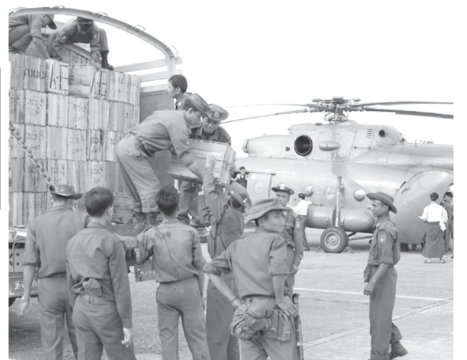
Relief aid for storm-hit regions in Ayeyawady Division being loaded onto a truck.