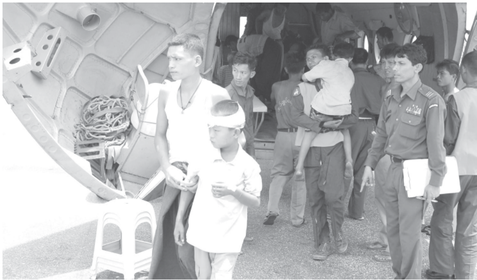
Emergency patients from storm-hit regions arrive in Yangon by helicopter.