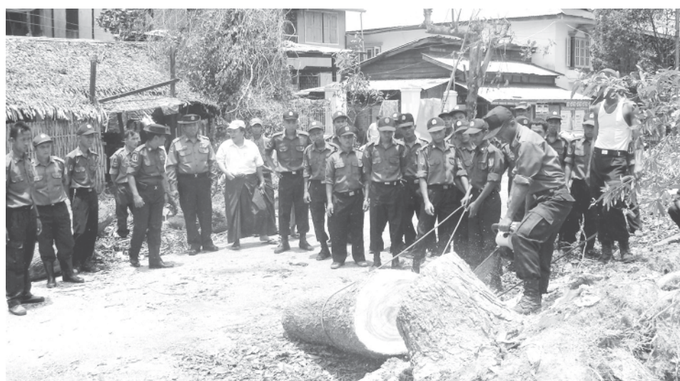
Members of Myanmar Police Force clearing downed trees on a road.—MNA