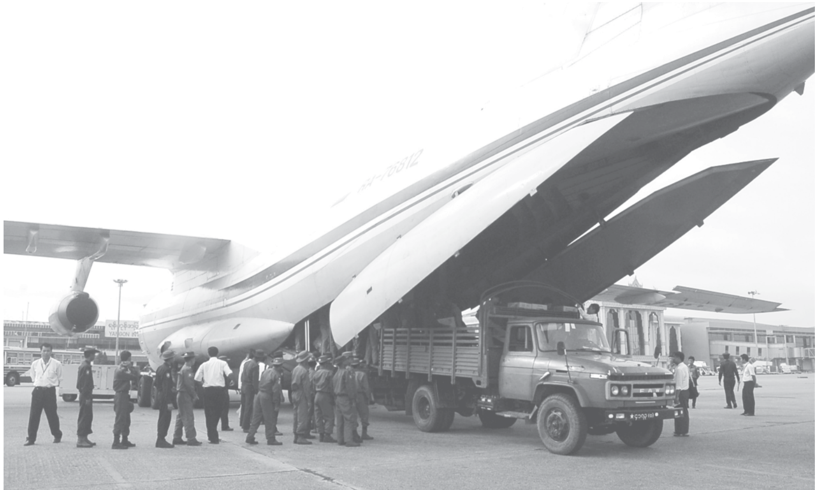
Emergency aid and construction materials from WFP and WHO arrive at Yangon International Airport.

Altogether 200 packages of canned food by PG Airline, 22.49 tons of blankets, dried noodles, biscuits, medicines, clothes and tents donated by Indonesia, 18 tons of biscuit donated by WFP and 1.8 tons of 500 blankets, 1000 beds and 130 six-capacity tents arrived at Yangon International Airport by air this afternoon. The accepting teams received the donations and sent them to the storm-hit areas by car, boat and helicopter as soon as possible. — MNA