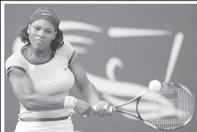
Serena Williams of the US returns a backhand to Agnieszka Radwanska of Poland during their German Open tennis match in Berlin. Williams won 6-3, 6-1.