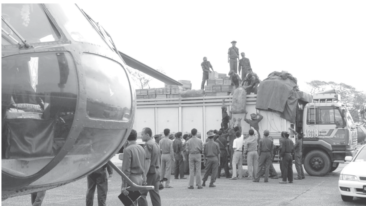
Members of Tatmadaw and social organizations carrying airlifted emergency aid for victims in Ayeyawady Division.