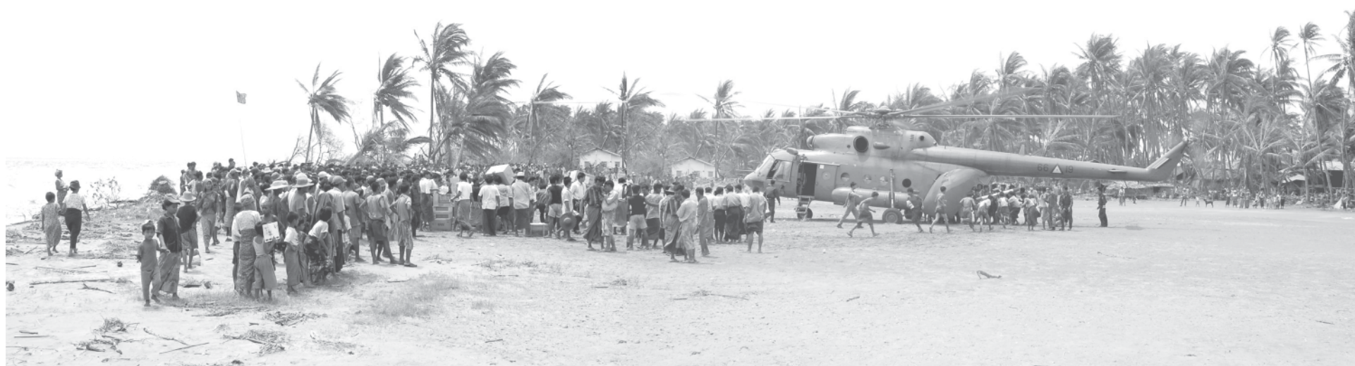
Emergency aid arrive at villages in Kyaiklat Township.— MNA