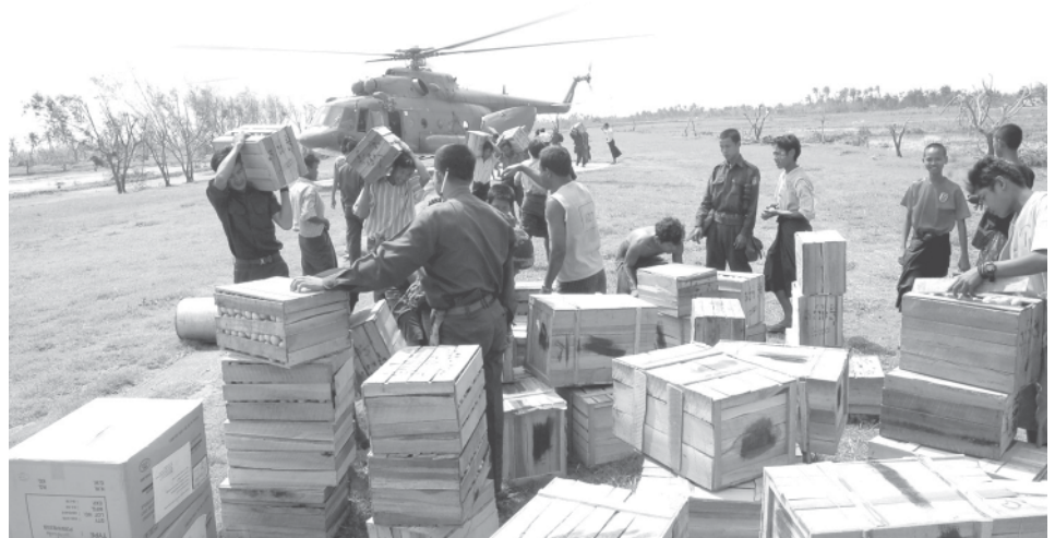
Relief supplies being unloaded from a helicopter.