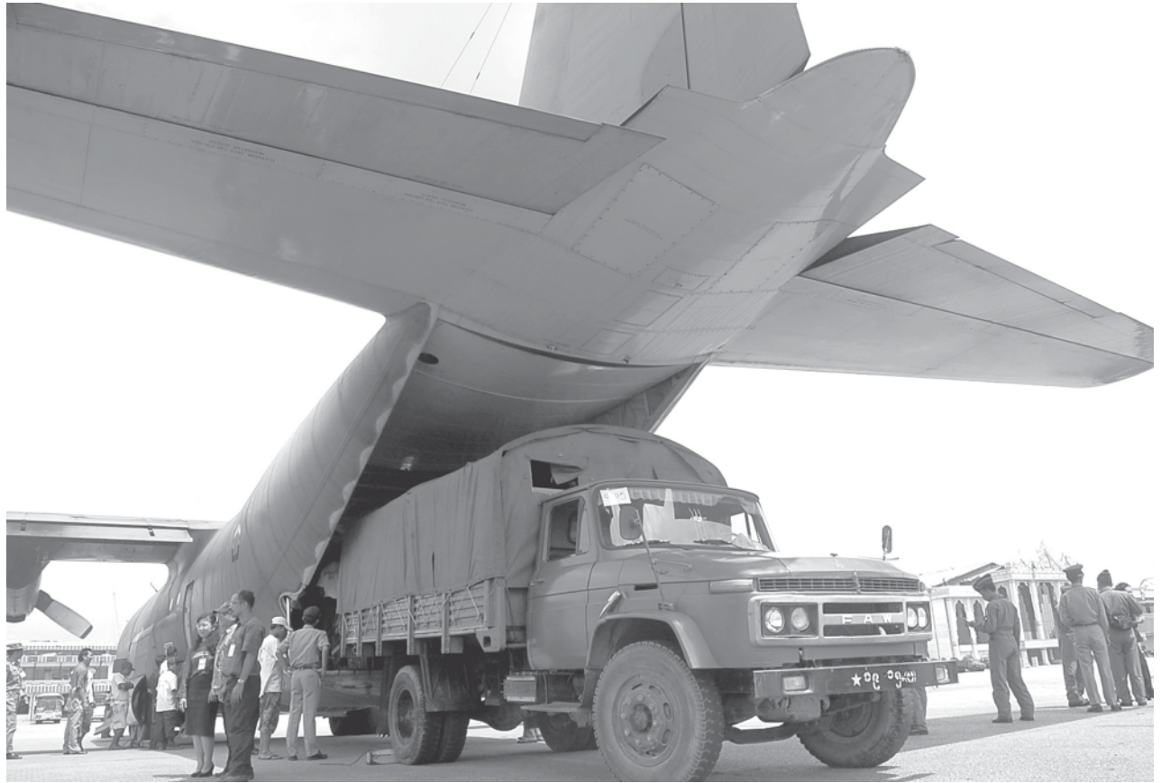
Indonesian aid arrives Yangon on board two C-130 aircrafts.