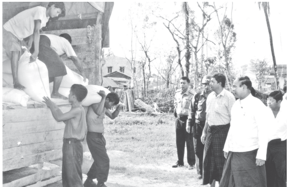
Mayor Brig-Gen Aung Thein Lin supervises transporting of food for victims in Twantay Township.