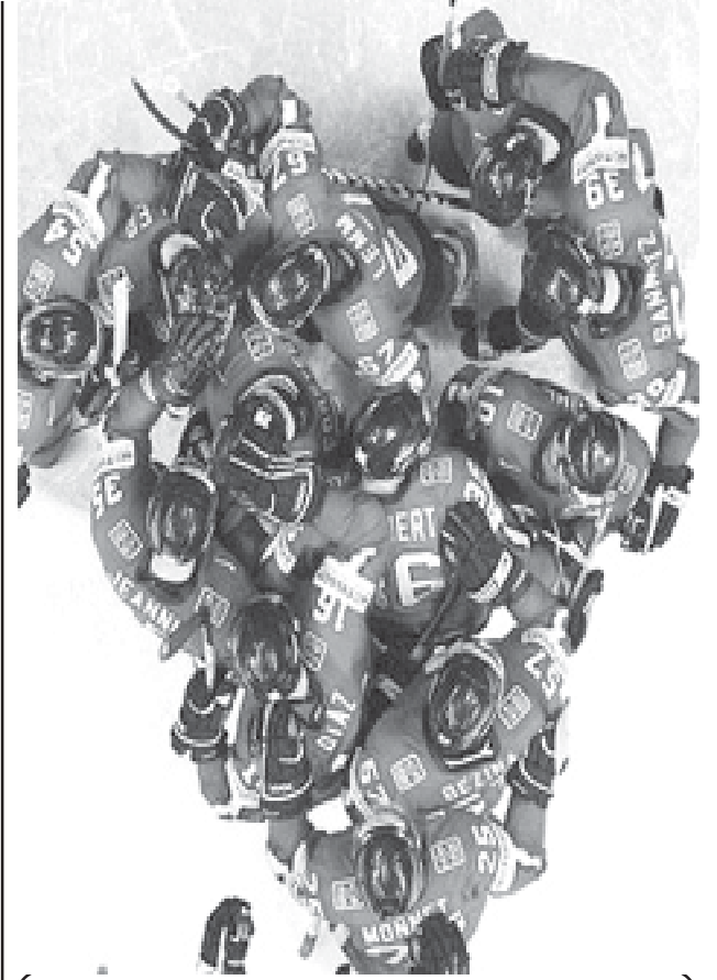
Huddle from above: The Swiss team celebrate their upset win over Sweden during the preliminary round at the 2008 IIHF World Championships in Quebec City, Canada.