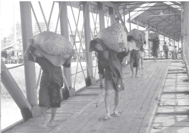
Relief supplies for storm victims being loaded onto ships.—MNA