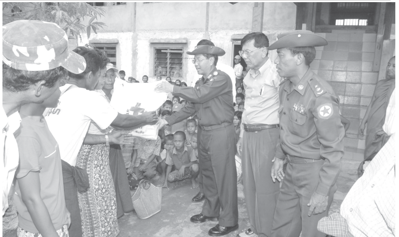
Lt-Gen Myint Swe presents relief aid to storm victims in Twantay Township.

At Latkhokkon Model Village of Kungyangon Township, they comforted the storm victims at the relief camp of Latkhokkon BEHS and presented relief supplies to them. Later, Lt-Gen Myint Swe and party arrived back in Yangon. — MNA