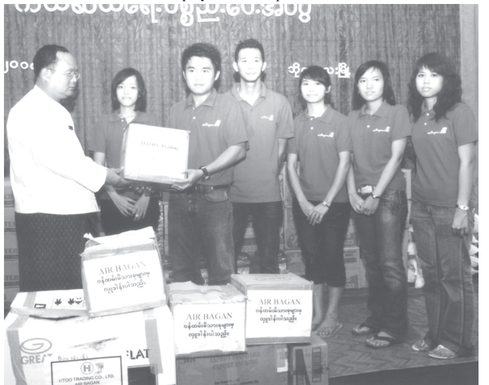
Htoo Trading Co Ltd and Air Bagan provide relief supplies for the cyclone 'Nargis' victims in Bogale Township.