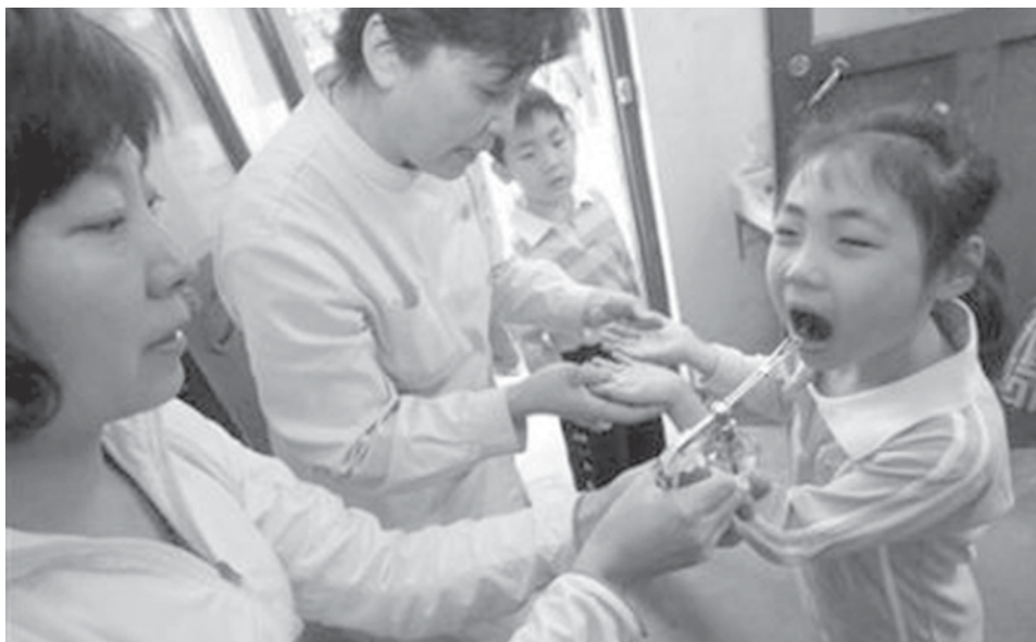
A child has her mouth disinfected in prevention against a kind of intestinal virus, identified as enterovirus 71 or EV71, at a kindergarten in Tianjin municipality, on 7 May, 2008.