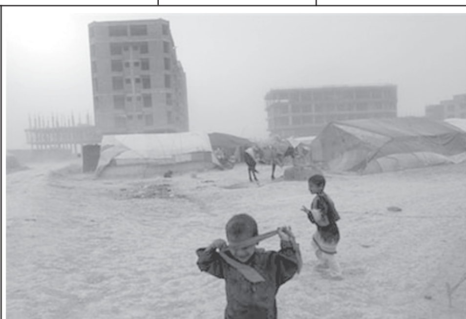
Afghan refugee children cover their face outside their makeshift house during a sand storm in Kabul, Afghanistan, on 8 May, 2008.