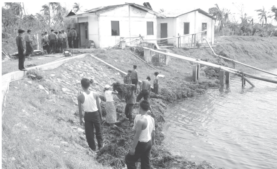
Tatmadaw members carrying out relief activities in Kyauktan Township.