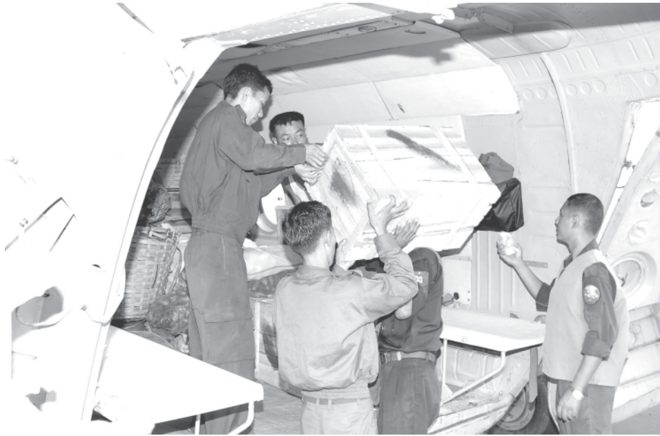
Relief aid being loaded onto a helicopter for victims in Ayeyawady Division.