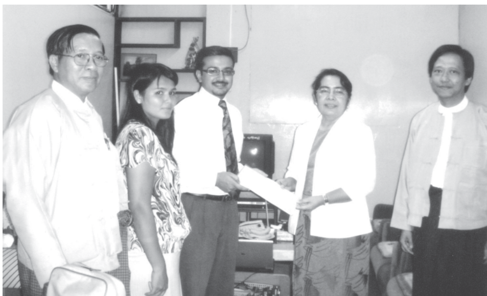
Responsible persons of Dr Reddy's Lab present medicines for the people in storm-hit areas.