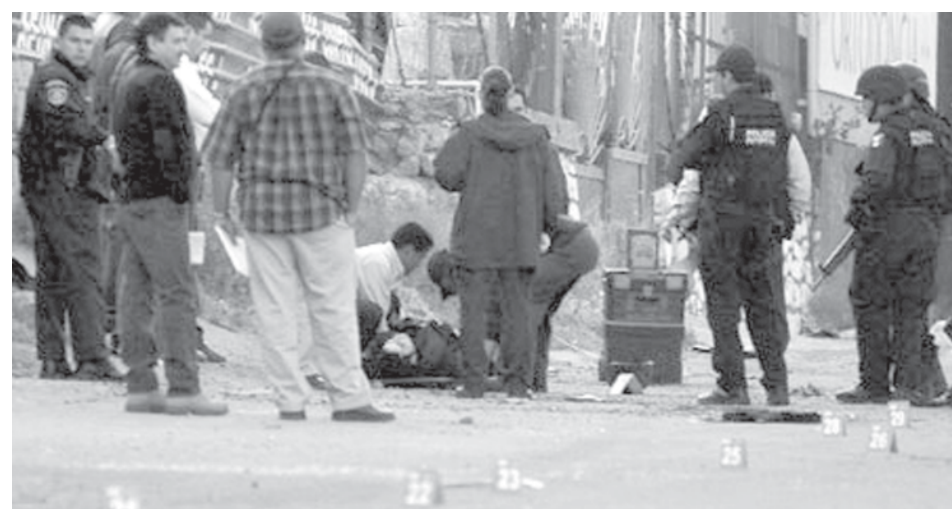
Forensic officers and policemen work in the area where fifteen men were killed in a gun battle in Tijuana, on 26 April, 2008. —XINHUA

One accident happened in the Montt port as three security guards went fishing at night despite the local fishing ban. Their fishing boat capsized in a storm, killing the three. — MNA/Xinhua