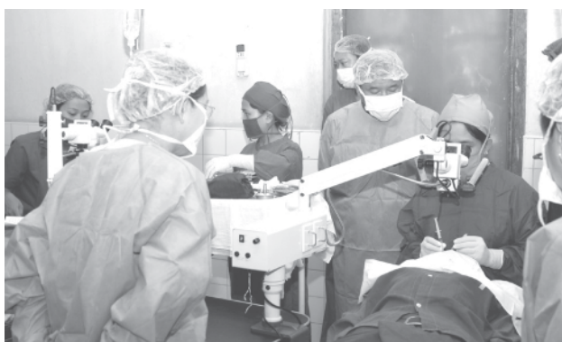
Specialists give medical treatment to a person with eye complainant.