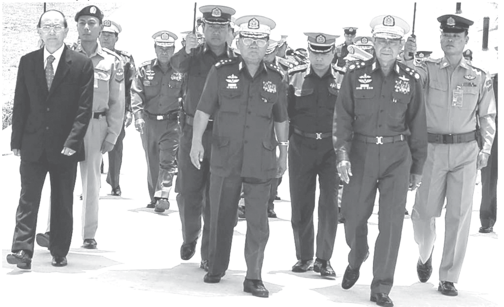
Senior General Than Shwe sees off Prime Minister General Thein Sein at Nay Pyi Taw Airport.—MNA

struction Brig-Gen Myint Thein, Deputy Minister for Home Affairs Brig-Gen Phone Shwe, Director-General of the Government Office Col Thant Shin and heads of departments.—MNA