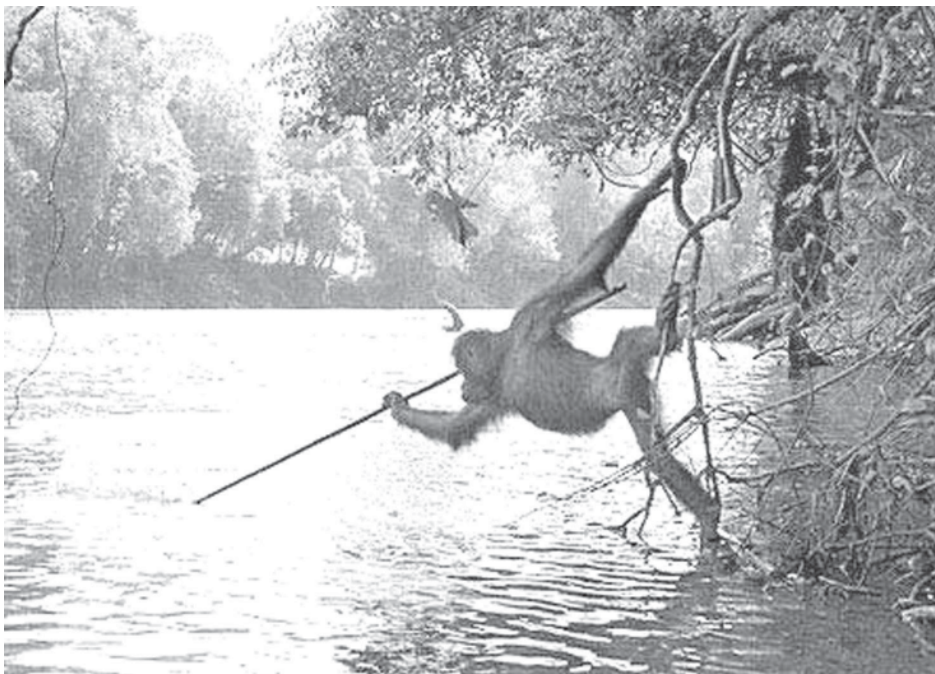
An orangutan clings precariously to overhanging branches in a desperate bid to spear a passing fish. It is the first time one has been seen using a tool to hunt. The image taken in Borneo on the island of Kaja is part of a series taken for a new book, The Thinkers Of The Jungle , which also includes the first photograph of an orangutan swimming.