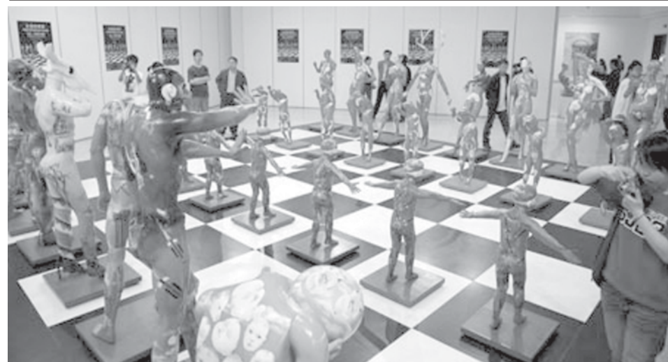
Visitors view the exhibits at an exhibition in the Hubei Museum of Art in Wuhan, capital of central China's Hubei Province, on 25 April, 2008.