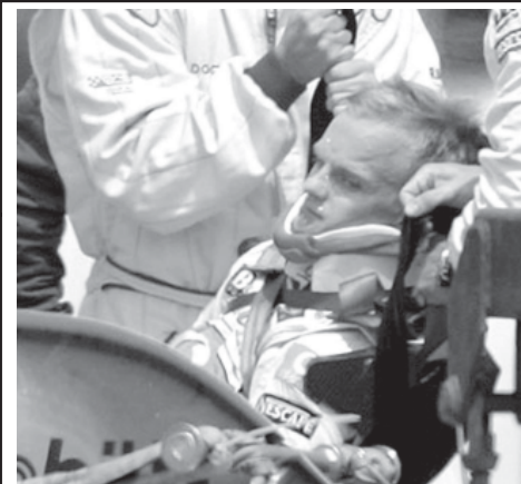
Finnish McLaren-Mercedes Formula One driver Heikki Kovalainen is taken out of his car after he crashed during the Spanish Grand Prix at the Circuit de Catalunya in Montmelo, near Barcelona, Sunday.