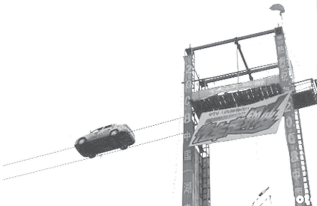
Liu Suozhu, a 48-year-old man from central China's Henan Province, drives an unmodified car along two steel wires 45 meter above the Miluo River in Hunan Province on 27 April, 2008. He drove the car 230 meters down the wire, setting a new national record.