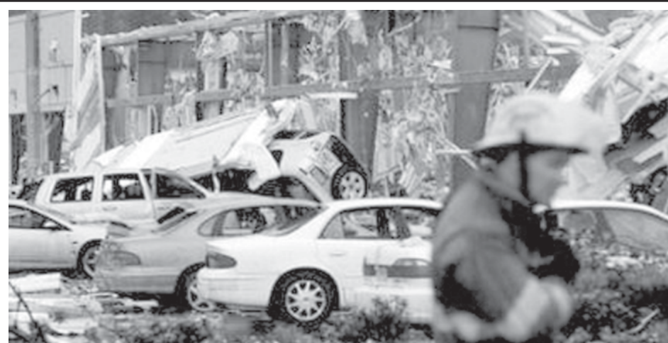
A firefighter is seen outside a strip mall that was destroyed after a tornado hit Suffolk, Virginia on 28 April, 2008.