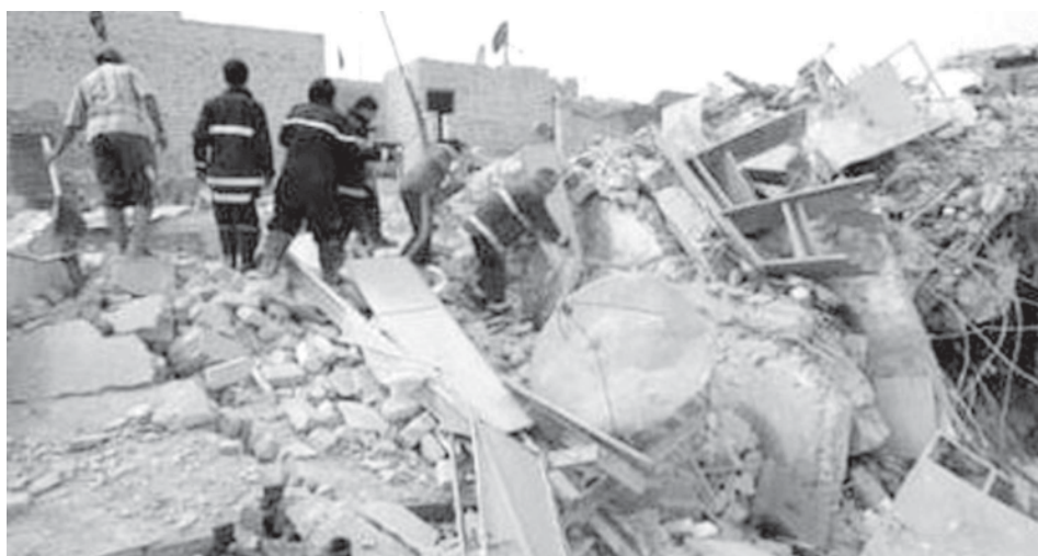
Firemen and residents search for victims trapped from the rubble of destroyed houses after an air strike in Baghdad's Sadr City April 29, 2008.