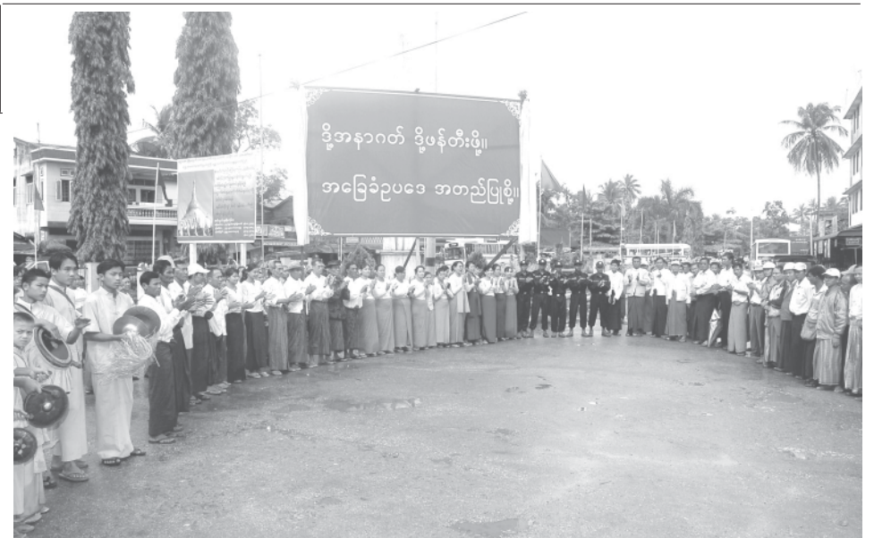
Ceremony to erect a billboard to hail Referendum in Twantay, Yangon South District in progress.—MNA

"Let's approve constitution to shape our future by ourselves; Democracy cannot be achieved by anarchism or violence, but by Constitution;" were set up by departmental officials, townselders and member of social organizations in the five townships.—MNA