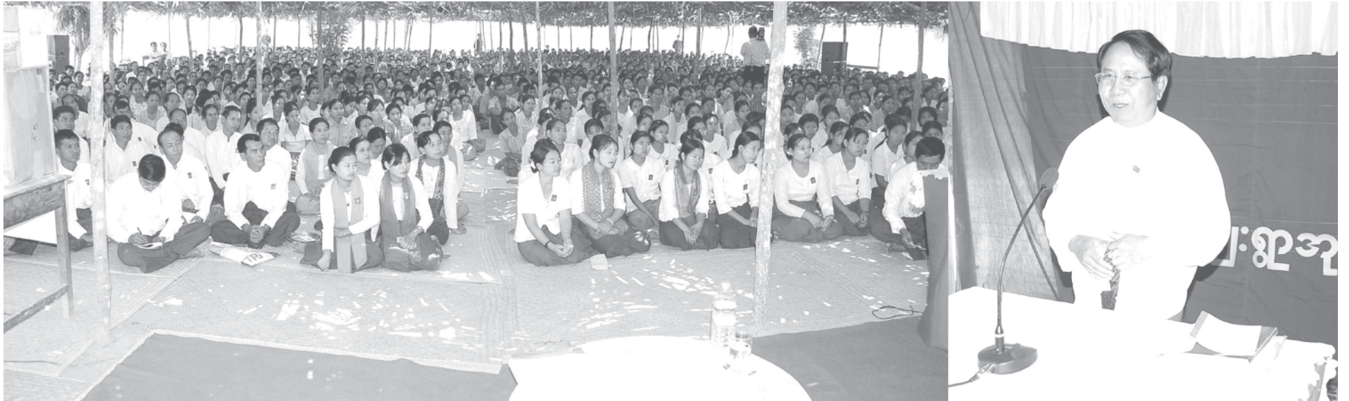
Minister Brig-Gen Kyaw Hsan meets with residents in Gangaw Township.

NAY PYI TAW, 29 April — Secretariat Member of Union Solidarity and Development Association Minister for Information Brig-Gen Kyaw Hsan met with residents from 12 villages in Htilin Township at the village of Hteintaing on 23 April and donated cash and kind to