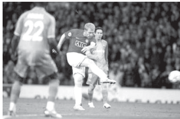
Manchester United's Paul Scholes scores against Barcelona during their Champions League semi-final second leg soccer match at Old Trafford in Manchester, northern England, April 29, 2008.

Barcelona kept battling until the final whistle but United were heroic in defence and limited the Spanish side to few, if any, clear-cut openings.