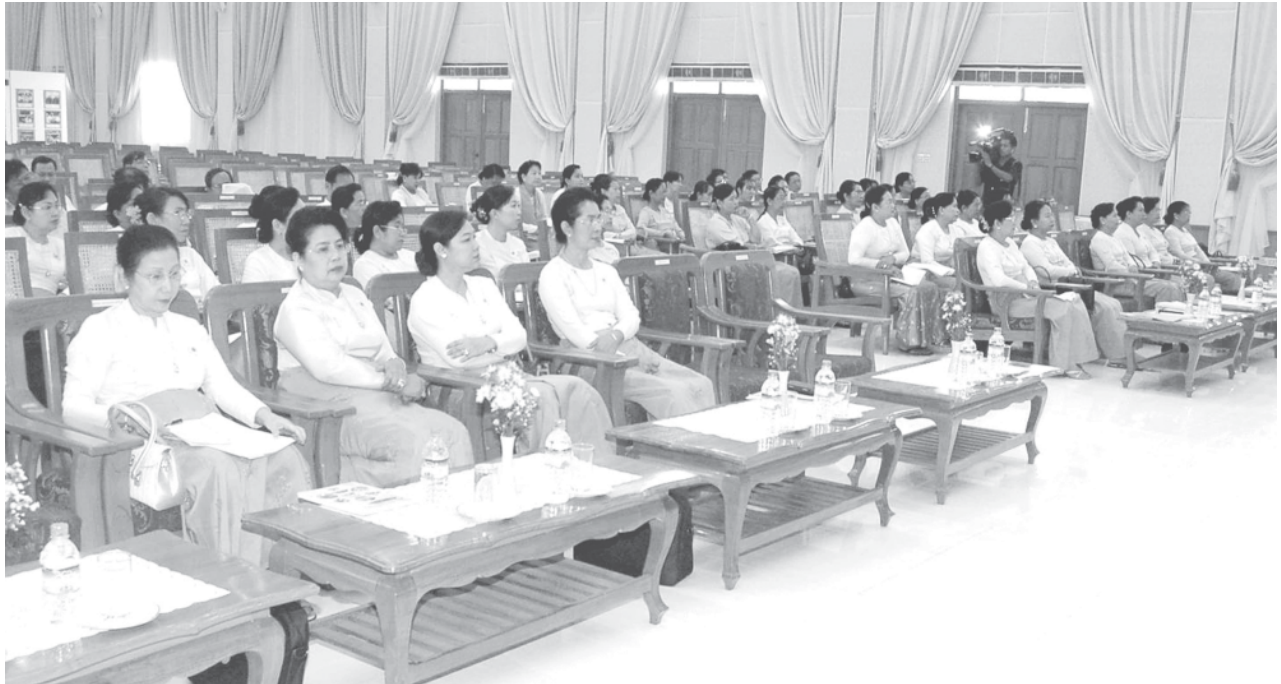
Second day session of 18 th Annual General Meeting of Myanmar Maternal and Child Welfare Association in progress.