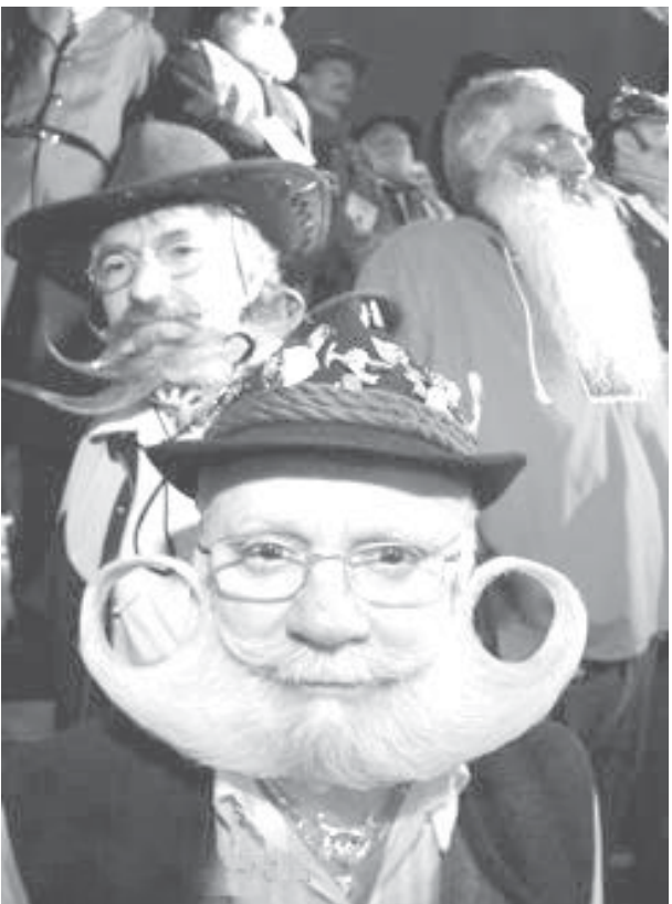
It's that time of the year again, when the manliest of all athletes — those who wear their secondary sex characteristics loud and proud, sometimes even in the shape of Dutch windmills or elaborate cuckoo clocks — get together to compete at the International German Beard Competition. Held this year in Pullman City — a theme park, deep in the heart of the southern German state of Bavaria — the competition is likely to be a real bonanza for hairy men who like to brush, curl and wax their facial hair in front of each other.