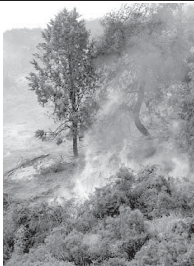
A patch of brush flares up as firefighters work to contain a wildfire near Sierra Madre, California on 27 April, 2008.