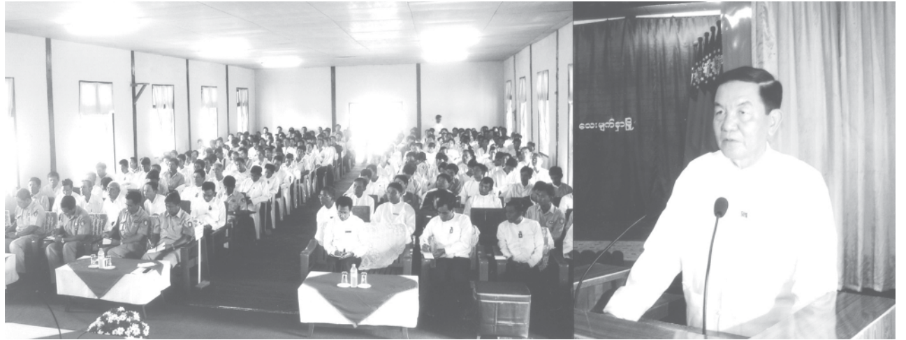
Minister Col Thein Nyunt meeting with members of USDA and social organizations and townselders in Laymyathna Township.

NAY PYI TAW, 29 April—A 4,200-foot-long and 12-foot-wide new gravel road was opened in Ngathaing Chaung Township in Hinthada District yesterday.