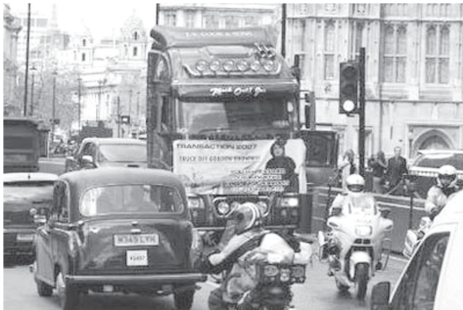
A truck bearing an anti-government slogan arrives outside Parliament in London on 29 April, 2008. Haulage contractors from the group Transaction 2007 attempted to block Park Lane during a demonstration to highlight the ever increasing fuel charges they feel are being levied on them by the British Government.—INTERNET

A burning vehicle hit during clashes in Baghdad’s Sadr City. Fierce clashes between Shiite militiamen and US and Iraqi forces in east Baghdad have killed at least 38 people, the American military said, amid new political efforts to end the bloodletting.—INTERNET