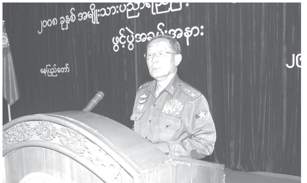
Secretary-1 Lt-Gen Thiha Thura Tin Aung Myint Oo addresses at the opening ceremony of seminar on promotion of national education 2008.

10,000 faculty members at 156 higher institutions and the number of university students has increased up to nearly 530,000. There were 79 teaching programmes and 38 research programmes in the past. Now there are 214 teaching programmes and 2,900 research programmes. He said departments of human resource development conducted diploma courses and the universities also con-