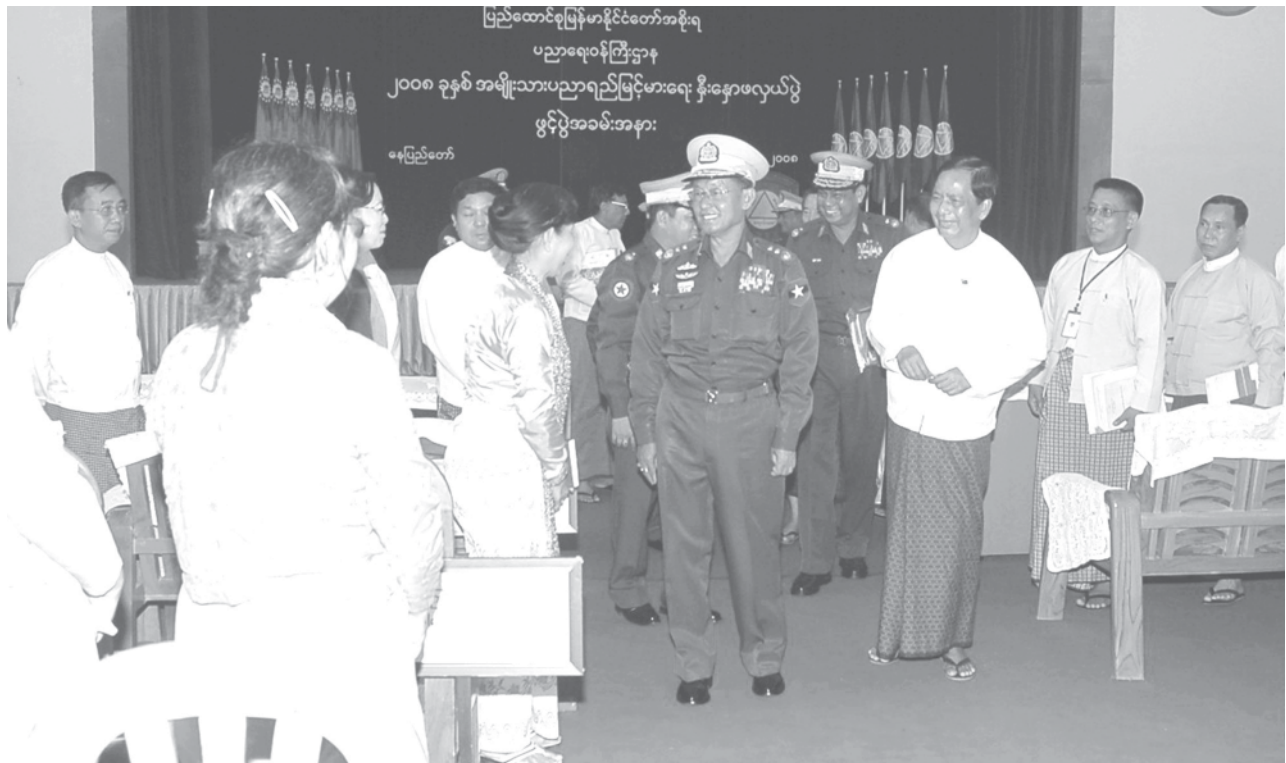
Secretary-1 Lt-Gen Thiha Thura Tin Aung Myint Oo greets attendees and teachers at the opening ceremony of seminar on promotion of national education 2008.