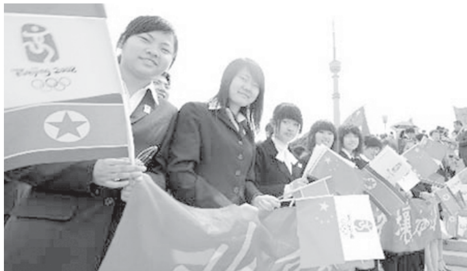
Overseas Chinese students cheer for the Olympic torch relay in Pyongyang, capital of the Democratic People's Republic of Korea on 28 April, 2008. Pyongyang is the 18th leg of the 2008 Beijing Olympic Games torch relay.