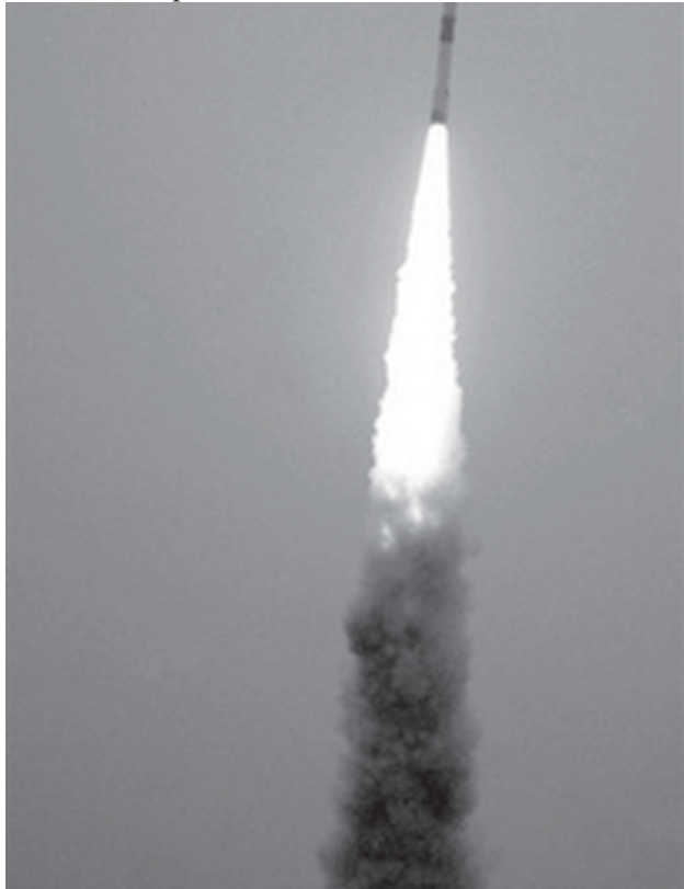
India's Polar Satellite Launch Vehicle (PSLV) C-9 blasts off from the Satish Dhawan Space Centre at Sriharikota, around 80 kilometres (50 miles) north of Chennai, India, on 28 April, 2008.

Setting a world record, India's Polar rocket Monday successfully placed ten satellites, including the country's remote sensing satellite, into orbit in a single mission according to a news report. —INTERNET