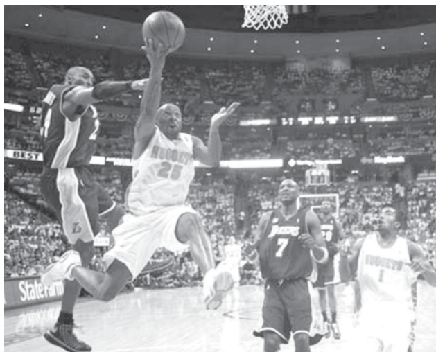
Denver Nuggets Anthony Carter (2nd L) goes up to shoot past Los Angeles Lakers Kobe Bryant (L) and Lamar Odom (2nd R) as the Nuggets J.R. Smith looks on during the first half of Game 4 of their NBA basketball playoff series in Denver, Colorado, on 28 April, 2008.