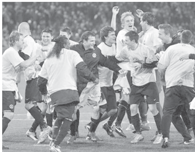
Borussia Dortmund's team celebrates after their 3-0 win against second division club FC Carl Zeiss Jena in Dortmund, Germany. Dortmund goes into next month's German Cup final.