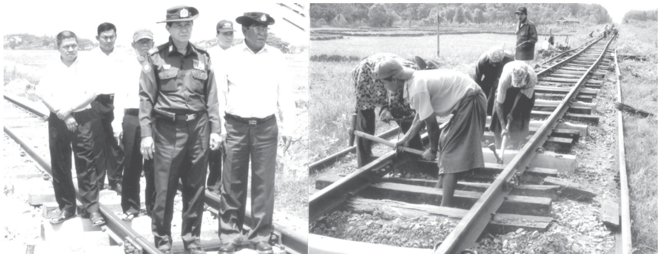
Minister Maj-Gen Aung Min inspects laying rail tracks between Mawlamyine and Ye.—RAILWAYS

On arrival at Concrete Sleeper Factory (Mottama) on 17 March, the minister gave instructions on requirements for the test-run of the factory and oversaw forging shops and workshops in the factory.—MNA