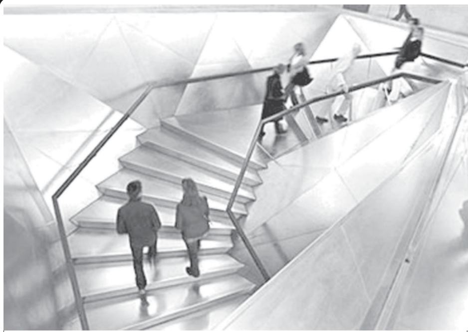
Caixaforum centre : Visitors climb the stairs at the new Caixaforum cultural centre in central Madrid designed by Swiss architects Herzog & De Meuron.