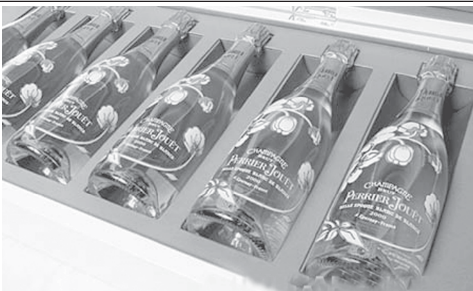
The image shows a limited edition 12-bottle box sets of Perrier-Jouet champagne that will be priced at 50,000 euros, according to French drink firm Pernod-Ricard. The world’s most expensive champagne goes on sale on Thursday targeting a “super-rich” global elite.