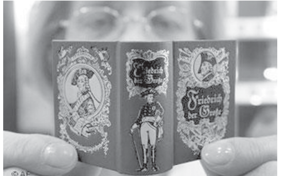
A visitor reads a miniature book about “Friedrich the Great” presented by the Leipzig Miniature Book publishing house at the Book Fair in the eastern German city of Leipzig.