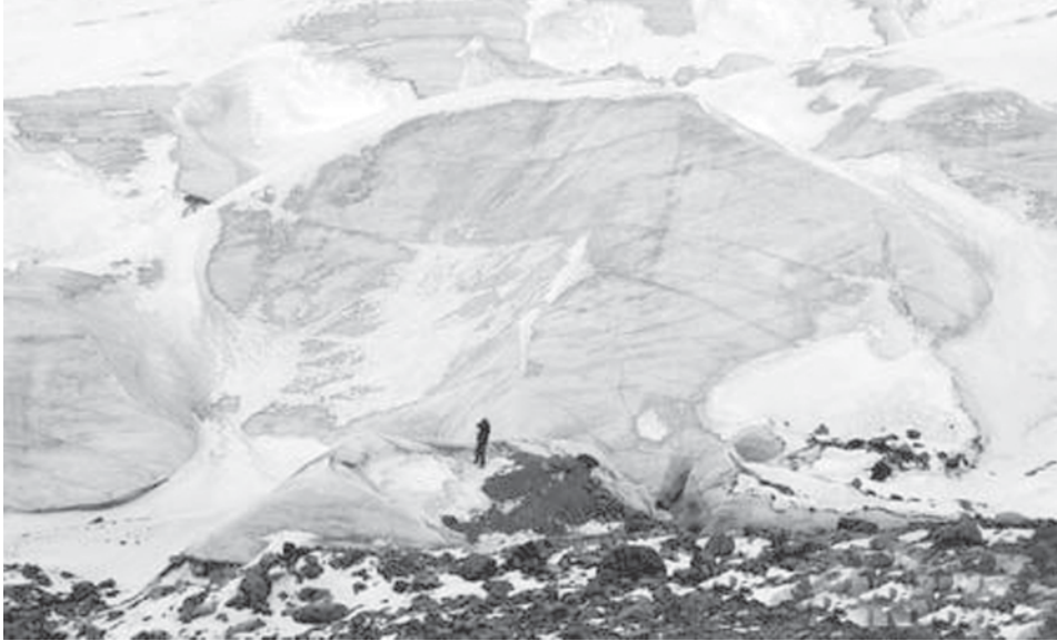
Photo taken on March 17, 2008 shows a part of the Qiyi glacier in the Qilian Mountains in northwest China's Gansu Province. The Qiyi glacier, 116 kilometers from Jiayuguan City, is the nearest one to a city compared with other glaciers in Asia.