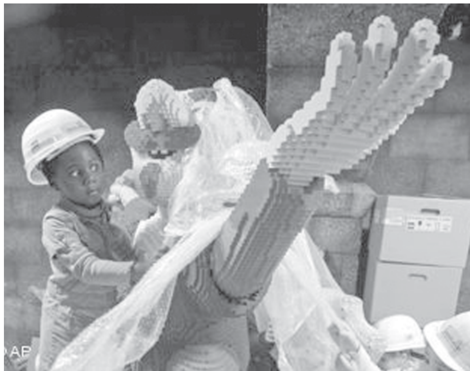
Plenty of kids were on hand to unpack the first Lego creations that arrived at the new Legoland Discovery Centre in the western German city of Duisburg on 17 March. The 3,500-square-metre (37,673-square-foot) centre is slated to open to the public at the end of April at a total cost of about 10 million euros ($15.7 million).