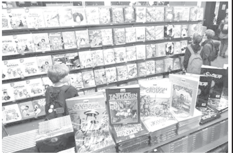
Young visitors browse hard cover cartoon books at the annual Paris book fair on 14 March, 2008. Israel is the guest of honour of the Paris book fair.