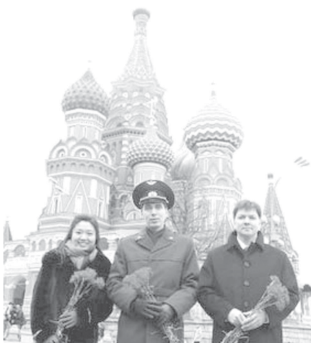
South Korean astronaut Yi So-yeon and Russian cosmonauts Sergey Volkov and Oleg Kononenko pose for a picture in Red Square of Moscow’s Kremlin, on 19 March, 2008. Yi will serve as a payload specialist with two Russian cosmonauts for a seven or eight day mission to the International Space Station, South Korea’s Science Ministry said.