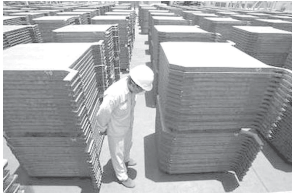
A worker checks piles of copper plates at PT Smelting in Gresik, Indonesia's East Java Province, on 19 March, 2008. PT Smelting, Indonesia's only copper smelter, said on Wednesday its copper cathode output was set to drop 6 percent this year due to plans to shut down its smelter for routine maintenance for 25 days in May.