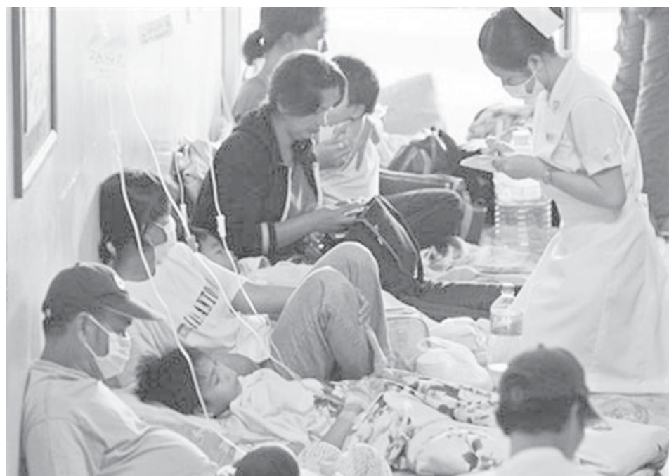
A second outbreak of typhoid has left about 150 people hospitalised in the central Philippines on 19 March 2008.