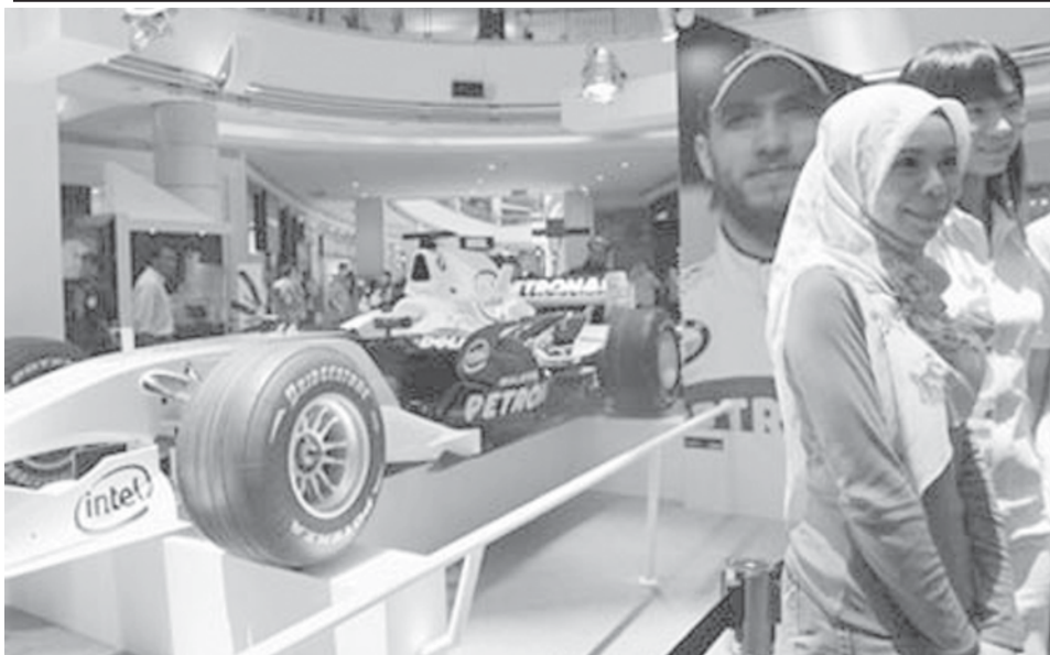
Malaysia is preparing to introduce Formula One night racing from next year following its debut in Singapore in September. —INTERNET