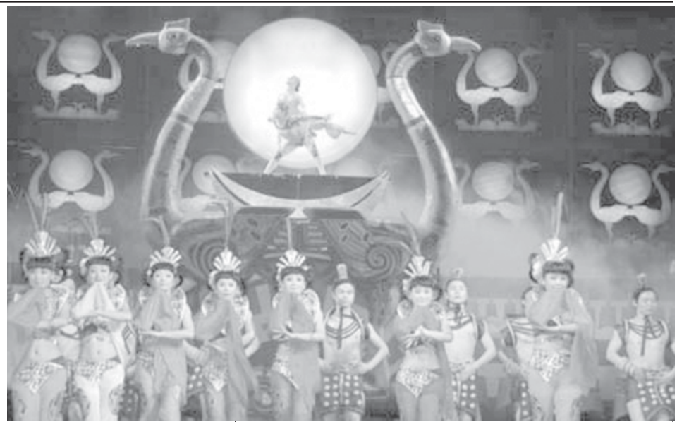
Dancers perform Chu Shui Ba Shan, an original drama displays a panorama of ancient people at the Three Gorges area of China, during a public show in Yichang City, central China's Hubei Province, on 17 March, 2008.