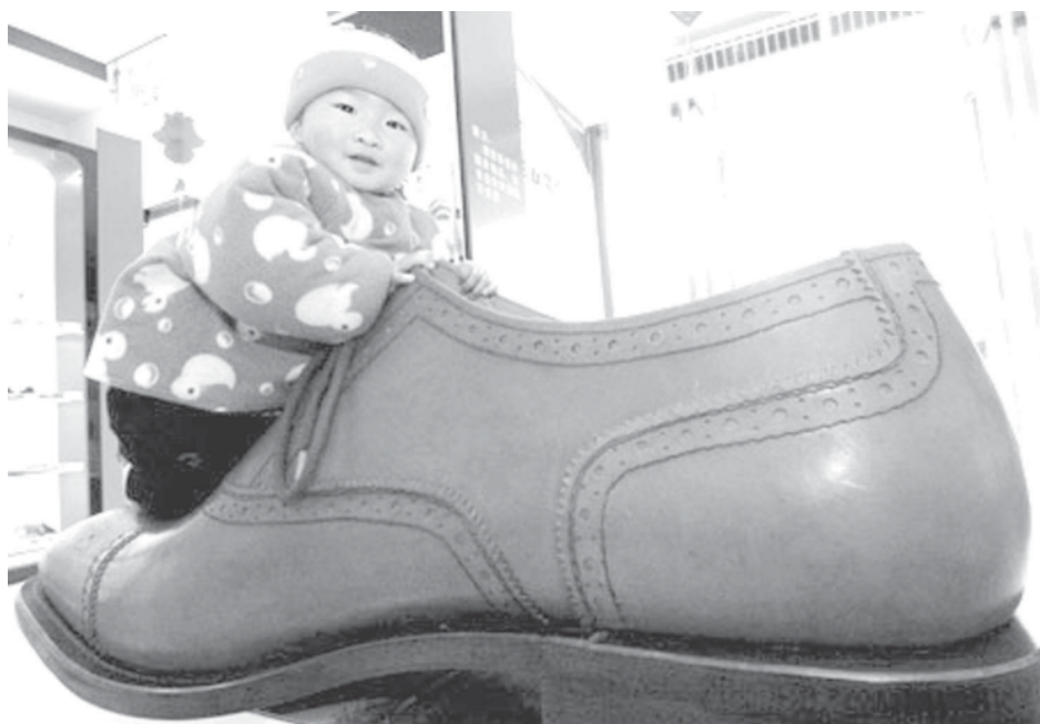
A child lies on a huge shoe at a store in Chuzhou City, east China’s Anhui Province, on 19 March, 2008. The 130-centimeter-long and 48-centimeter-high leather shoe attracted many citizens.