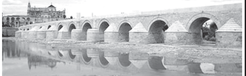
View of the Roman bridge over the Guadalquivir river in Cordoba, southern Spain on 18 March, 2008. The 331-meter bridge was built by the Romans in the first century AD and remodeled last year. Records show Spain is experiencing one of its driest springs since records began 60 years ago according to rainfall figures published by the Environment Ministry on Tuesday.—