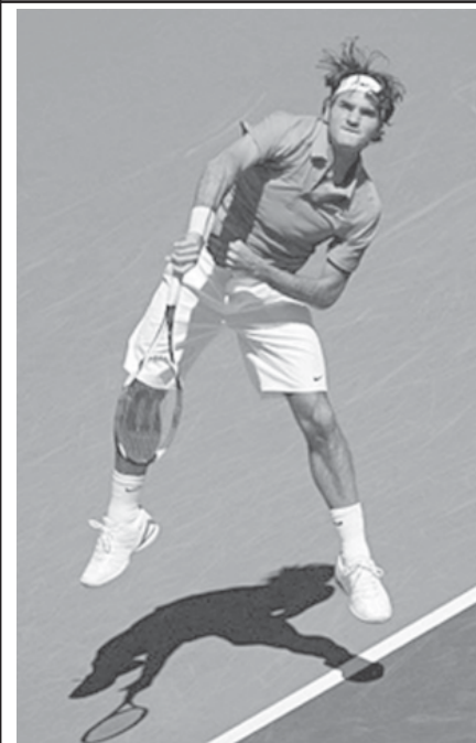
World number one Roger Federer of Switzerland serves to Nicolas Mahut of France during a fourth round match at the Pacific Life Open at the Indian Wells Tennis Garden in Indian Wells, California. Federer won 6-1, 6-1.