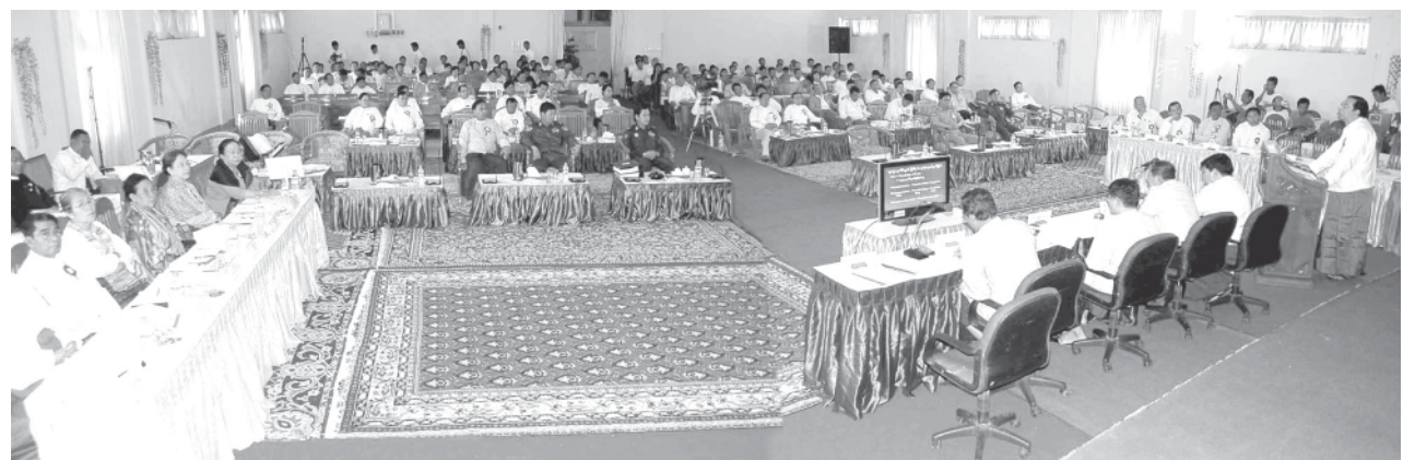
Workshop on promotion of transport services supporting economic progress being held in Nay Pyi Taw. — MNA

The second day session of the workshop ended with concluding remarks by Minister Maj-Gen Thein Swe. — MNA