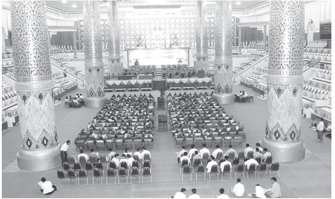
The 2nd Meeting of Sixth State Central Working Committee of the Sangha in progress. — MNA

Also present at the meetings were Deputy Minister Brig-Gen Thura Aung Ko, Adviser U Arnt Maung, departmental heads and officials. — MNA