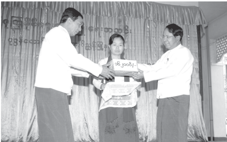
Minister Brig-Gen Kyaw Hsan presents cash assistance to secretary of Pazundaung Township USDA.

YANGON, 19 March — Secretariat Member of Union Solidarity and Development Association Minister for Information Brig-Gen Kyaw Hsan met secretaries, executives, organizers and members of Pazundaung Township and Mingala Taungnyunt Township USDAs today.