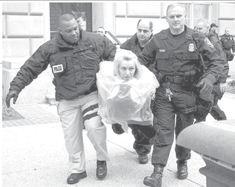
Police arrest an anti-war protester outside of the Internal Revenue Building in Washington DC on 19 March, 2008. Protesters on Wednesday launched sit-ins and marches across the United States as they marked five years of war in Iraq, demanding an immediate withdrawal of US soldiers.