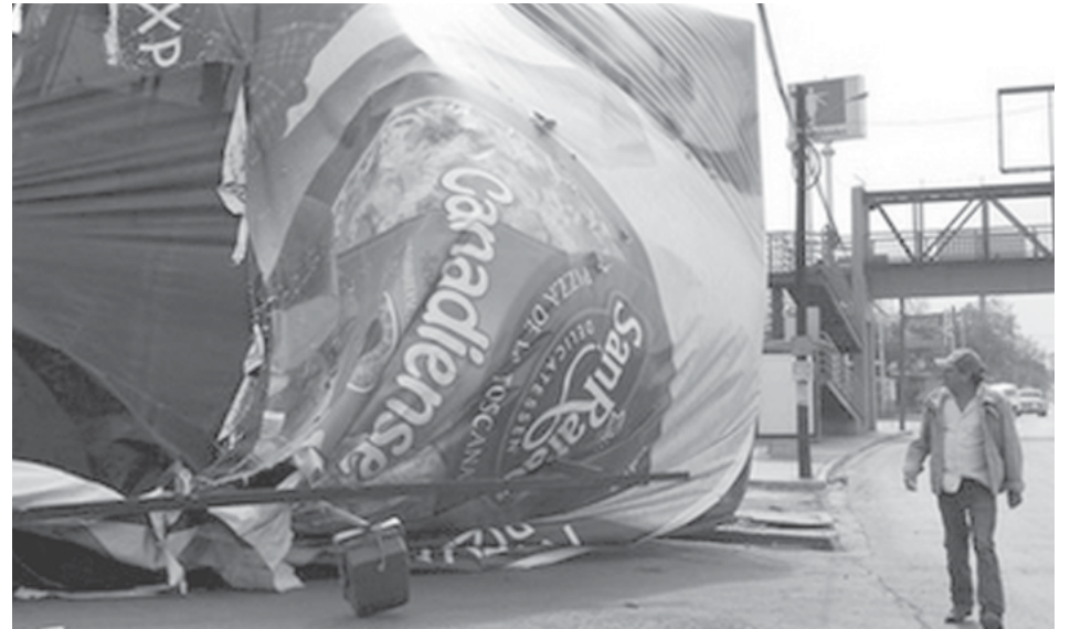
A man walks past a fallen billboard after a wind storm in Monterrey, Mexico on 18 March, 2008. At least one person was confirmed killed after strong winds knocked down a wall.