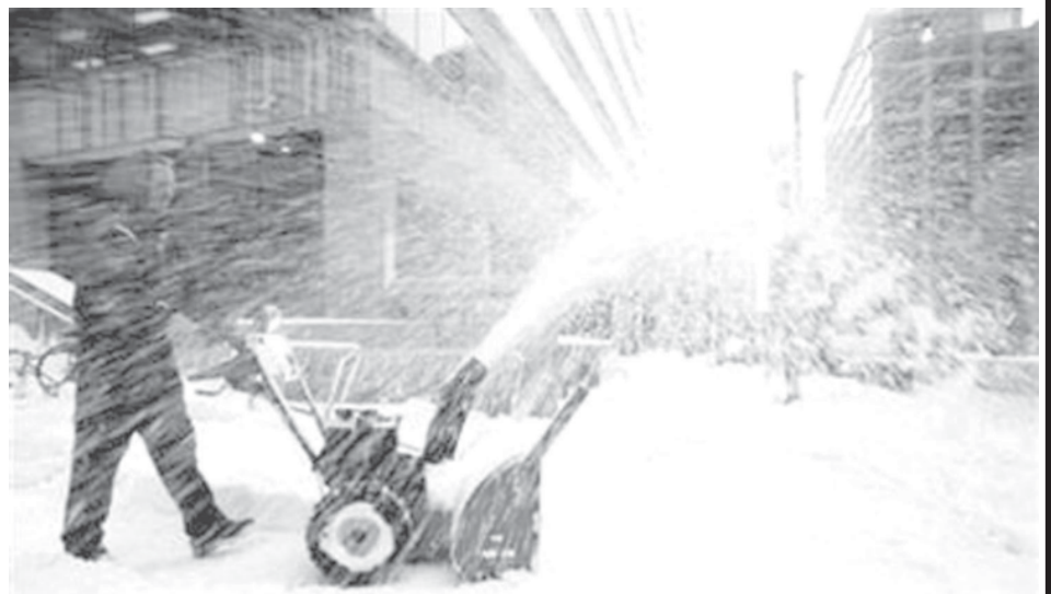
A worker clears snow in downtown Toronto, on 1 February, 2008. Although Canada is one of the snowiest countries in the world, a series of violent ‘snow rage’ incidents reveal that even the locals have their limits.