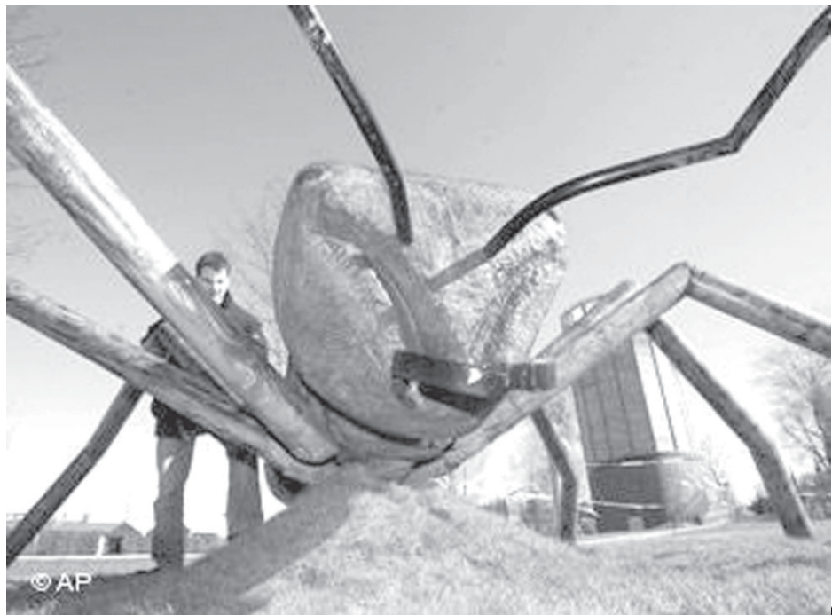
No, this is not the scene from “Honey I Shrunk the Kids”. Luckily it’s not a flesh and blood ant either. This wooden sculpture, dwarfing the person standing beside it, dominates the installation at a park in Schleswig, northern Germany. People were out in force to see the ant and its cousins as the north of Germany enjoyed some chilly but bright weather on 19 March, 2008.