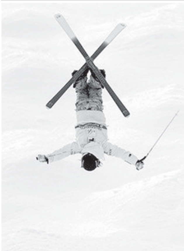
Japan's Aiko Uemura competes in the women's freestyle Moguls race during the FIS Ski World Cup Grand Finals at Chiesa Valmalenco.

He stayed in Tokyo for five years, despite Lima's frequent requests that he be extradited to face a range of charges, including murder and kidnapping, relating to his 10-year rule. —MNA/Reuters