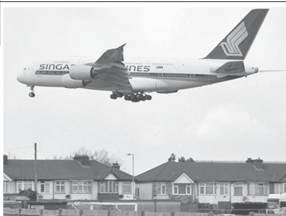
A Singapore Airlines Airbus A380 flies over homes close to London's Heathrow Airport. The A380, the world's largest aircraft, touched down at Heathrow Airport on 18 March, 2008, completing the plane's first-ever commercial flight to Europe. INTERNET