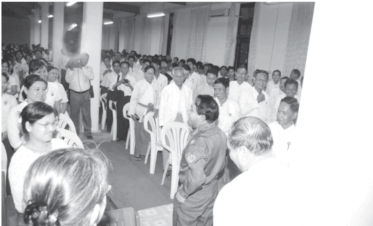
Minister Brig-Gen Kyaw Hsan meeting with employees of News and Periodicals Enterprise.

YANGON, 19 March — Minister for Information Brig-Gen Kyaw Hsan met departmental staff of News and Periodicals Enterprise at the meeting hall of the Central Printing Press of Printing and Publishing Enterprise on Theinbyu Road here at 5.30 pm today.