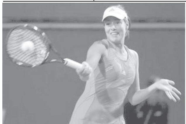
Serbia's Ana Ivanovic returns a shot against Italy's Francesca Schiavone during their match at the Pacific Life Open tennis tournament in Indian Wells, California on 18 March, 2008.

However, the PSG striker netted the winner when he latched onto a Sylvain Armand cross from the left in the 67th minute. The win is a morale boost for PSG, who are 17th in Ligue 1, ahead of a tricky trip to leaders Olympique Lyon on Sunday.